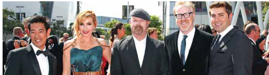
In this file photo (from left to right) Grant Imahara, Kari Byron, Jamie Hyneman, Adam Savage and Tory Belleci attend the 2011 Primetime Creative Arts Emmy Awards at Nokia Theatre on September 10, 2011 in Los Angeles, California.

He also co-hosted the 2016 Netflix series "White Rabbit Project". "Heartbroken and in shock tonight. We were just talking on the phone. This isn't real," Imahara's White Rabbit Project co-host Kari Byron tweeted. Grant said in 2018 that he was working with Disney to create autonomous robot stunt doubles.—AFP