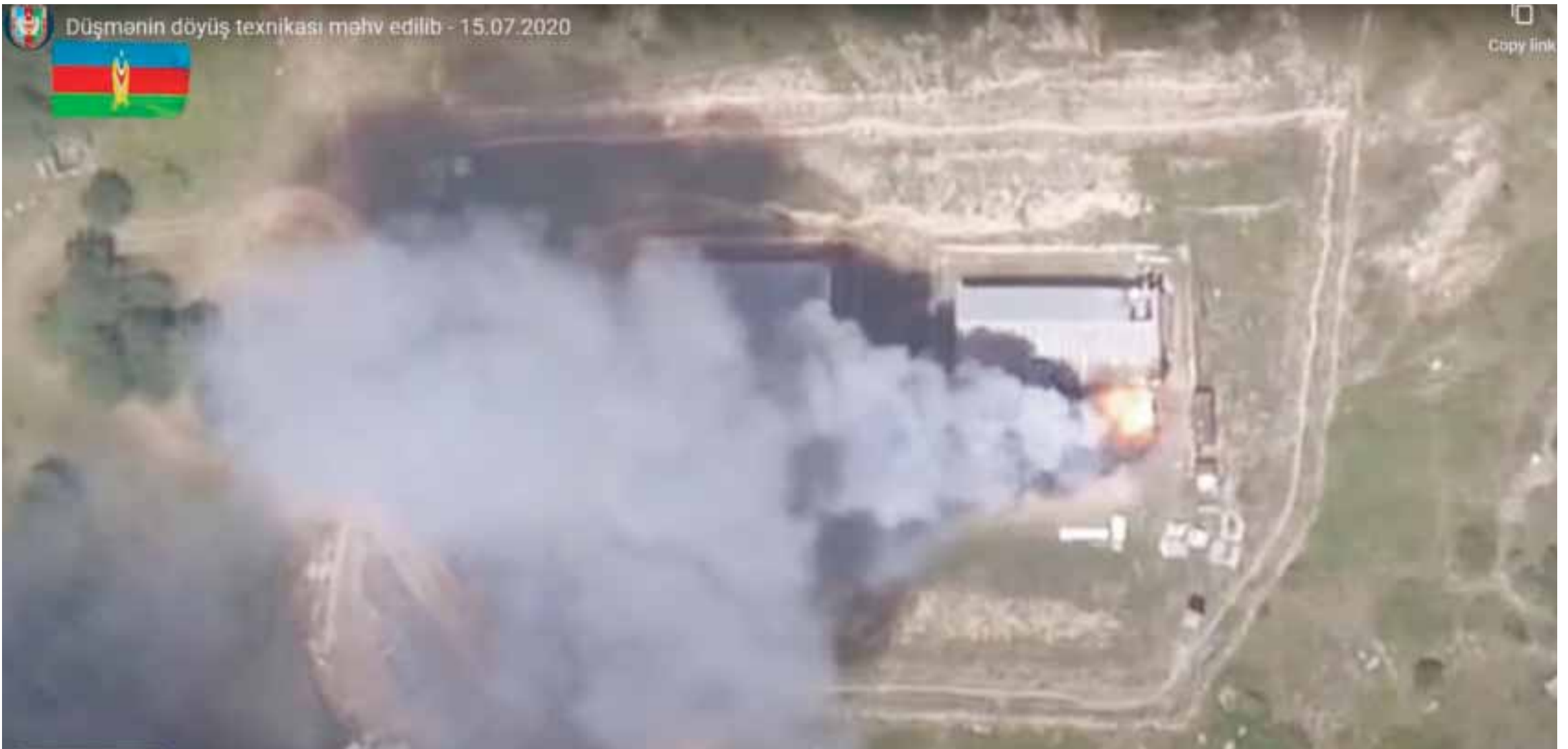
An image grab taken from a video uploaded on YouTube by the Azerbaijani Defense Ministry, allegedly shows smoke billowing from what they said was destroyed Armenia's military equipment on the Azerbaijani-Armenian border.