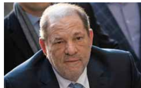
In this file photo taken on February 24, 2020 Harvey Weinstein arrives at the Manhattan Criminal Court in New York City.