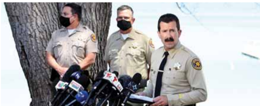
Ventura County Sheriff Bill Ayub speaks during a press conference held for missing actress Naya Rivera on July 13, 2020 in Piru, California.