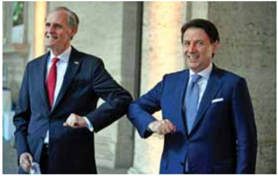
Italian Prime Minister Giuseppe Conte (right) meets French ambassador to Italy Christian Masset prior to a handover ceremony of the piece of art attributed to street artist Banksy.

Instagram account a drawing showing a lit candle setting fire to the American flag above a picture of a black man, in homage to George Floyd, the US man whose death in police custody ignited protests across the country. Banksy has also posted a drawing of people pulling down a statue, a reference to attacks on monuments or statues of historical figures linked to slavery or colonisation.—AFP