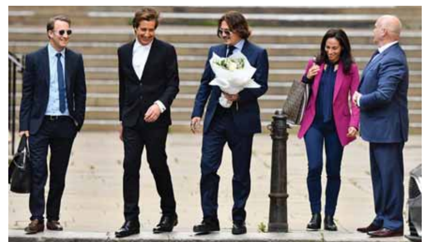
US actor Johnny Depp (center) carries a bunch of flowers given to him by a fan, as he takes leave of a member of his legal team outside court.

and also as Heard's during the couple's relationship, told the court she had "never noticed" injuries to the actress. "I noticed nothing but her beautiful skin," she said of a particular occasion in May 2016 when Heard claimed she had been left visibly bruised by Depp. The actor launched legal action after The Sun ran a story calling him a "wife-beater". It came after he had already publicly denied domestic violence, and Depp claims it has led to "significant reputational damage" to his career and personally. The High Court trial is due to last three weeks.—AFP