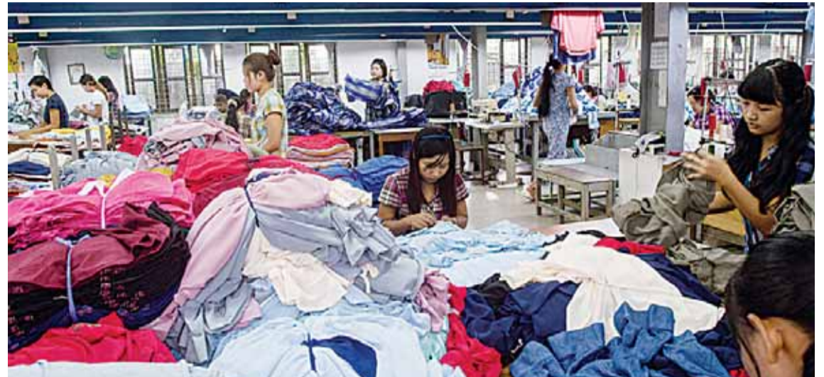
YANGON: In this file photo, workers work at a garment factory in Yangon. From factory floors in India to the warehouses of Cambodia, garment workers for global brands say the collapse in demand triggered by coronavirus is being used as a cover to break their unions.

The big names "must make it clear that they will end