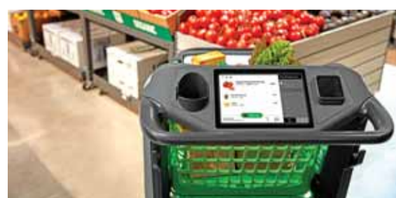
This undated and unlocated handout photo released by Amazon shows an Amazon Dash Cart. Amazon on Tuesday, introduced a smart grocery cart that will let shoppers skip checkout queues.

Each cart uses computer vision software and sensor data to identify what is put inside, showing a running total along with item descriptions and prices on a display, according to Amazon. Using a Dash cart requires a smartphone loaded with the Amazon application, which syncs by scanning a QR code and then charges the purchase to the credit card on file, the US based company explained.