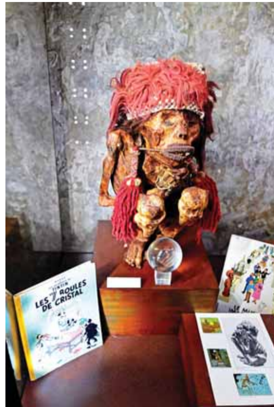
A photo shows an Inca mummy at the Pairi Daiza animal park in Brugelette, Belgium.