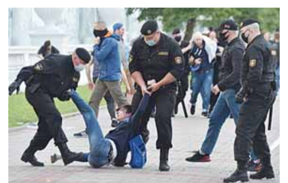
MINSK: Plainclothed Belarus' security service agents and riot police officers detain a participant of a gathering of opposition supporters in Minsk.

from his former workplace, the Belarusian subsidiary of Russian state bank Gazprombank. Babaryko is incarcerated in the prison of the KGB security service.