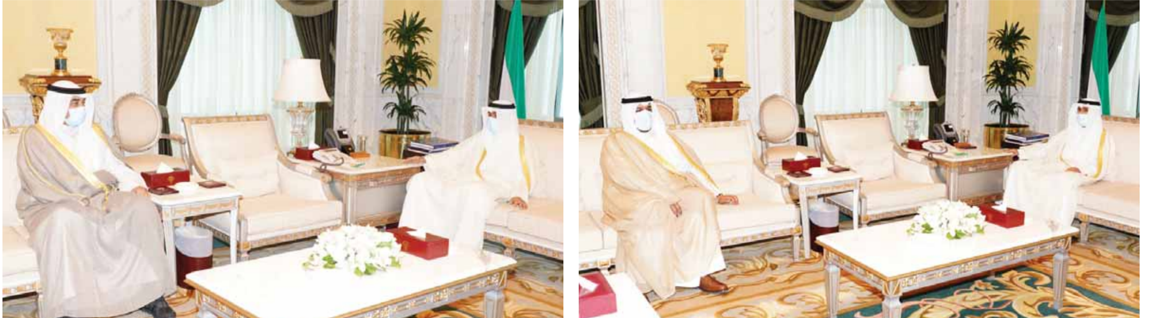
KUWAIT: His Highness the Crown Prince Sheikh Nawaf Al-Ahmad Al-Jaber Al-Sabah received Tuesday at Seif Palace His Highness the Prime Minister Sheikh Sabah Al-Khaled Al-Hamad Al-Sabah (left), as well as Deputy Prime Minister and Minister of Defense Sheikh Ahmad Mansour Al-Ahmad Al-Sabah.