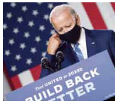
Behind in the polls, Trump unloads on Biden at press event