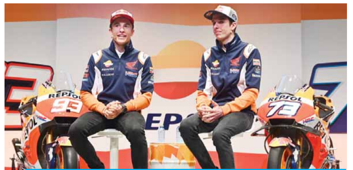
MADRID: File photo taken on February 27, 2020 Repsol Honda Team's Spanish MotoGP driver Marc Marquez and his brother teammate Alex (R) attend the presentation of the new Repsol Honda team in Madrid. Motorcycling is often a family affair, and yet before Alex Marquez joined Marc at Honda for this season two brothers had never raced together for the same team in MotoGP.

relationship between team-mates: partners in the garage and rivals on the track.