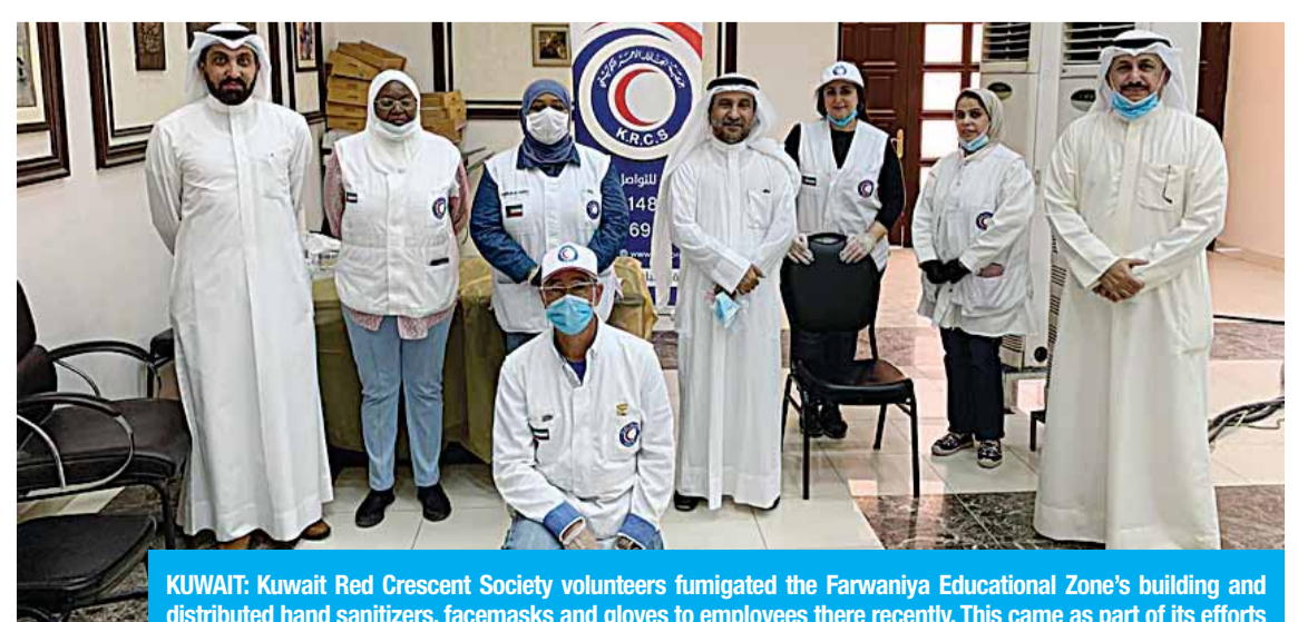
KUWAIT: Kuwait Red Crescent Society volunteers fumigated the Farwaniya Educational Zone's building and distributed hand sanitizers, facemasks and gloves to employees there recently. This came as part of its efforts to assist state departments in fighting the spread of the novel coronavirus (COVID-19) in Kuwait.