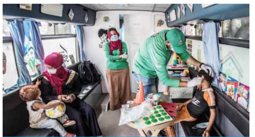
CAIRO: Homeless children are cared for inside a mobile unit run by Egyptian authorities in the capital's Abbasiya district on June 22, 2020.