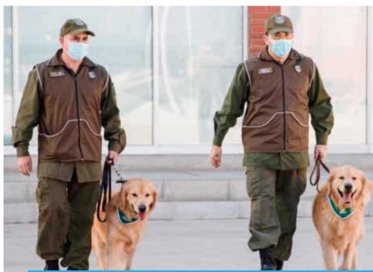
SANTIAGO: Members of the Chilean Police Canine Training team walk two Golden Retriever dogs before the beginning of their training session aimed to detect people infected with coronavirus COVID-19.