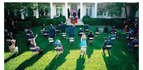
WASHINGTON: Members of the media, seated at a distance from one another, gesture toward the US President Donald Trump as he walks away from the podium after delivering a press conference in the Rose Garden of the White House.