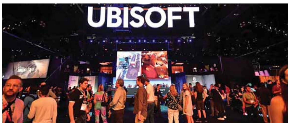
Gaming fans play Ubisoft games at the 2019 Electronic Entertainment Expo, also known as E3, opening in Los Angeles, California on June 11, 2019.