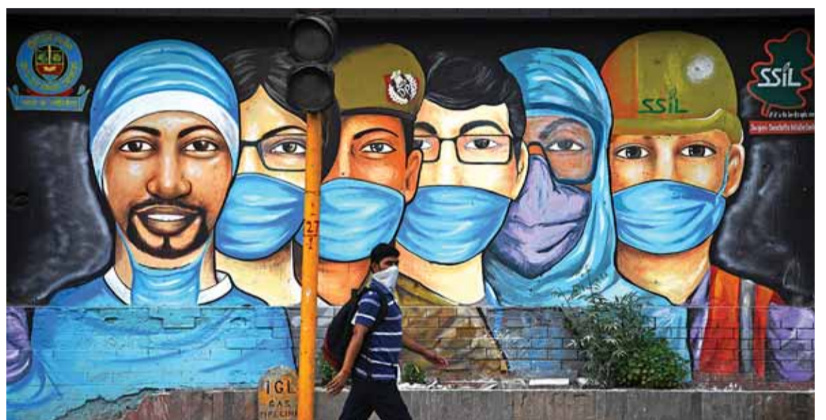
A man walks past a mural of frontline workers after the government eased a nationwide lockdown imposed as a preventive measure against the COVID-19 coronavirus in New Delhi on Tuesday. — AFP

Coronavirus cases are soaring in dozens of US states, particularly across the nation's south and west. Colorado has suffered over 37,000 confirmed cases, including 1,727 deaths, according to a Johns Hopkins University tally. Last week, the state experienced its highest number of new infections since early May.—AFP