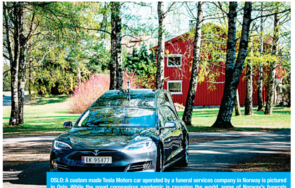
OSLO: A custom made Tesla Motors car operated by a funeral services company in Norway is pictured in Oslo. While the novel coronavirus pandemic is ravaging the world, some of Norway's funerals homes ironically have found themselves without work and have turned to the state for aid.