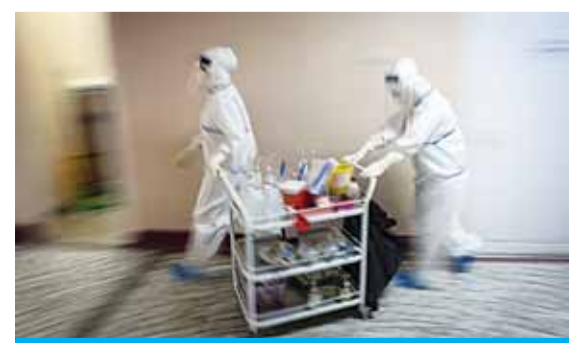
BELGRADE: Medical workers bring medications to patients suffering from coronavirus disease (COVID-19) inside the Institute for Orthopaedic Surgery ‘Banjica’, recently transformed to a COVID hospital.

FETO is present in around 160 countries, with thousands of schools, businesses, NGOs and media houses. Their modus operandi is the same all around the world. As they aim to infiltrate and enlarge their global economic and political influence, they constitute a direct security threat for any country where they operate.