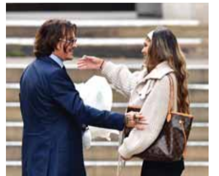
A fan is embraced by US actor Johnny Depp (left) after she gave him a bunch of flowers as he leaves court after the sixth day of his libel trial against News Group Newspapers (NGN), at the High Court in London.