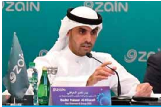
Bader Nasser Al-Kharafi, Zain Vice-Chairman and Group CEO

For the first six months of 2020 (H1), Zain Group generated consolidated revenue of KD 787 million ($2.6 billion), a decrease of 3 percent Y-o-Y. EBITDA for the period reached KD 336 million ($1.1 billion), down 5 percent Y-o-Y, reflecting an EBITDA margin of 43 percent. Net income amounted to KD 84 million ($273 million), down 14 percent Y-o-Y, reflecting earnings per share of 19 fils ($0.06). (See Page 9)