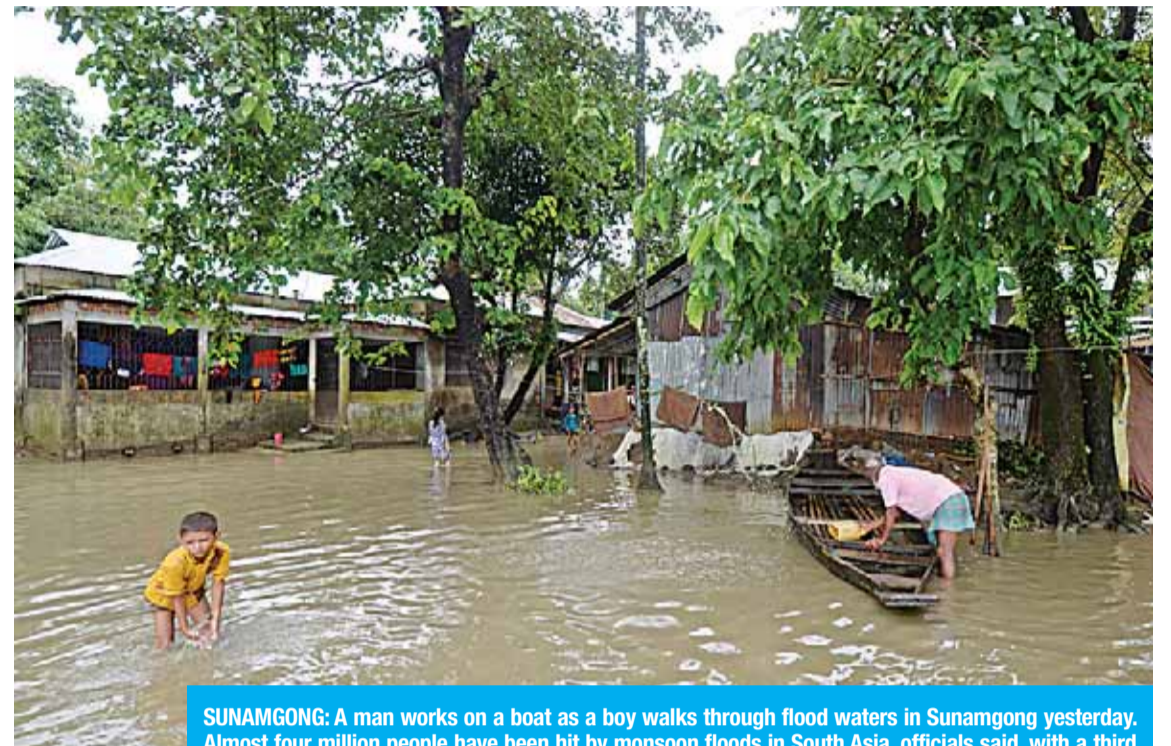
SUNAMGONG: A man works on a boat as a boy walks through flood waters in Sunamgong yesterday. Almost four million people have been hit by monsoon floods in South Asia, officials said, with a third of Bangladesh already underwater from some of the heaviest rains in a decade.