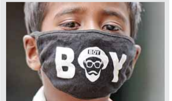
MEDAK: A boy wearing a facemask as a preventive measure against the spread of the COVID-19 coronavirus, looks on near a paddy field in Medak district of Telangana state yesterday.

HONG KONG: Millions of people faced new coronavirus restrictions yesterday as infections surge, but in one sign of hope, an American firm said it would soon start final-stage human trials for a possible vaccine. Countries around the world re-imposed lockdowns and curbs to contain new outbreaks, as global cases surged past 13.2 million with more than 576,000 deaths.