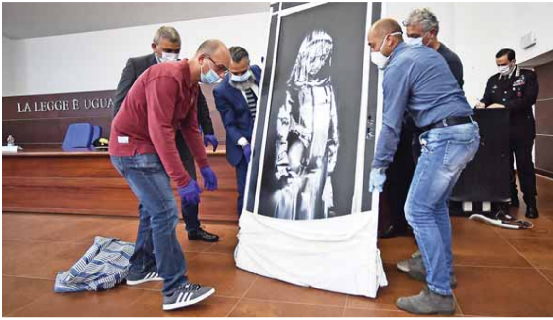
In this file photo Men unveil a piece of art attributed to Banksy.