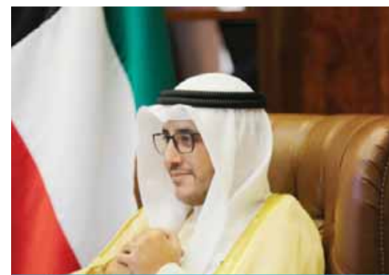
Kuwaiti Foreign Minister Sheikh Dr Ahmad Nasser Al-Mohammad Al-Sabah.

Sheikh Dr Ahmad Nasser also thanked the European Union for continuing its support to