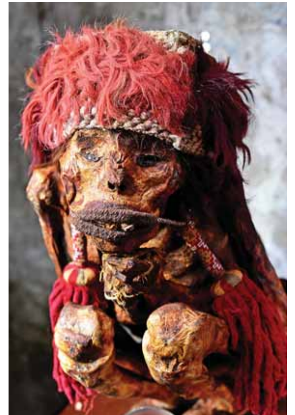
A photo shows an Inca mummy at the Pairi Daiza animal park in Brugelette, Belgium.