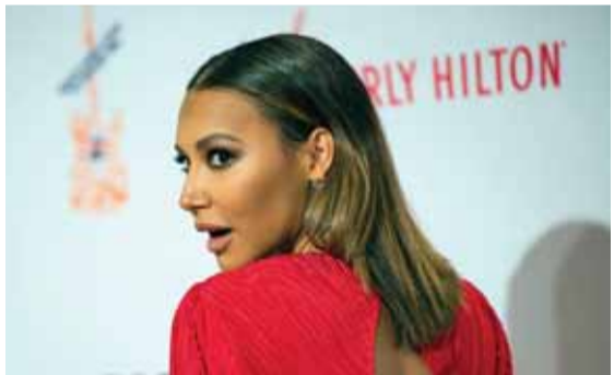
In this file photo taken on April 16, 2016 actress Naya Rivera attends the 23rd Annual Race To Erase MS Gala in Beverly Hills California.