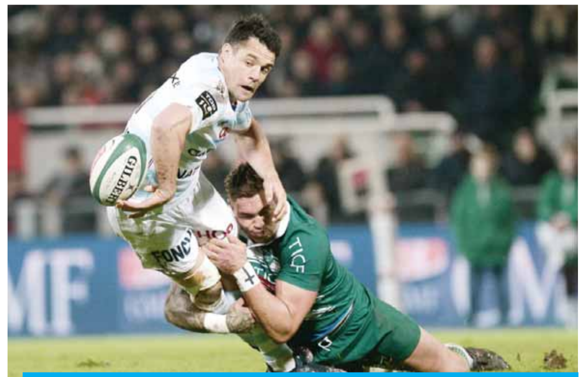
PAU: File photograph taken on February 24, 2018, Racing 92's New Zealander fly-half Dan Carter (L) passes the ball during the French Top 14 rugby union match between Pau and Racing 92 at The Hameau Stadium in Pau, southwestern France. In early July 2020 it was announced that from 2021 the salary cap, will gradually drop to 9,94 million euros in the following years due to the financial impact of the coronavirus pandemic.

"The scientific community's recommendations have to be fact-based, science-based recommendations, but politicians have to make the decisions," he said. "Scientists give advice, but decision-making is not by scientists." — Reuters