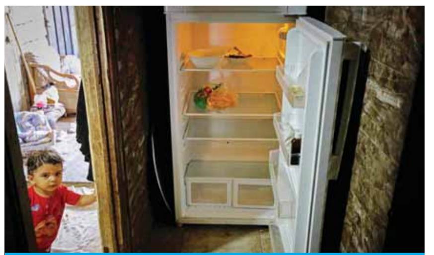
TRIPOLI: In this photo taken on June 17, 2020, a Lebanese child stands next to an empty refrigerator in their apartment in this port city north of the capital Beirut.