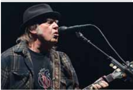
In this file photo Neil Young performs on stage for his first time in Quebec City during 2018 Festival d'Ete.

Neil Young is suing Donald Trump's re-election campaign to try to stop the US president playing his songs at campaign rallies, according to a lawsuit posted on the rocker's website. The 74-year-old claims a breach of copyright for the use of "Rockin' In The Free World" and "Devil's Sidewalk," at several Trump events including a recent rally in Tulsa, Oklahoma. "(The) plaintiff in good conscience cannot allow his music to be used as a 'theme song' for a divisive, un-American campaign of ignorance and hate," reads the draft filing.