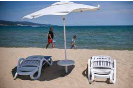
File photo shows tourists walking near empty sunbeds and umbrella in front of an hotel at the beach in Sunny Beach, Bulgaria’s biggest Black Sea resort.

“We need at least 100 charter flights a day,” says Plamen Kopchev, head of the hotel owners’ association in Bulgaria’s mammoth Black Sea resort of Sunny Beach, laid waste by the coronavirus pandemic. But the trouble is, only a fraction of those flights have been arriving, a disaster for a resort Kopchev explains “is made for mass tourism”—a model that some Bulgarians have long been questioning and which now lies in tatters. Bulgaria is the poorest country in the European Union and will be dealt a body blow by the virtual collapse of its tourism sector, which accounts for 12 percent of annual economic output.