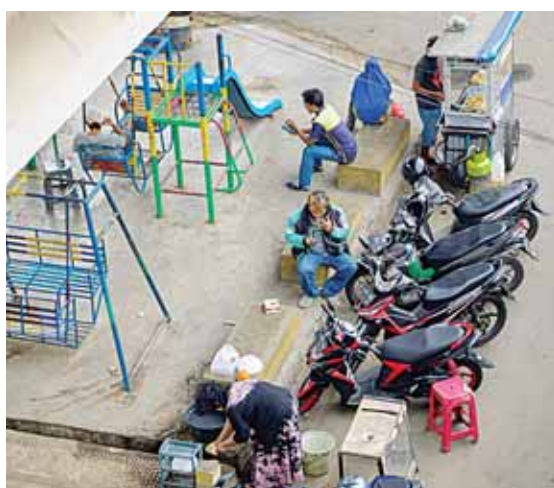
JAKARTA: Motorcycle taxi drivers take a rest during a lunch break in Jakarta yesterday. Indonesia's economy contracted in the second quarter for the first time in more than two decades as it was slammed by coronavirus restrictions, with warnings that the recovery could be among the weakest in Southeast Asia. —AFP

The announcement comes a week after rival Nissan warned of a massive $6.4 billion net loss for the current fiscal year as it reels from the pandemic. Last week, US auto giant General Motors also reported a loss hit by the pandemic but at a smaller-than-expected scale thanks to strong pricing for some newer auto models. —AFP