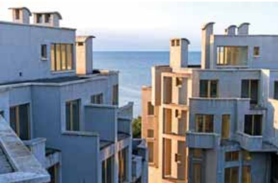
The abandoned Costa Del Croco complex, by the coast in the Black Sea town of Tsarevo, southeastern Bulgaria.

New construction work on a small beach bordering Alepu marsh, a protected area south of Burgas, prompted Vateva to organize a series of protests this summer under the motto “Sea without concrete”. She is an optimist when it comes to the prospects for improving the country’s treasured coast. “It’s not too late yet,” Vateva says. “The important thing is to... repair the damage that’s already been done and make so that no new outrageous things happen,” she adds. Whether that can be made to fit with Bulgaria’s ambition to revive its tourism sector remains to be seen. — AFP