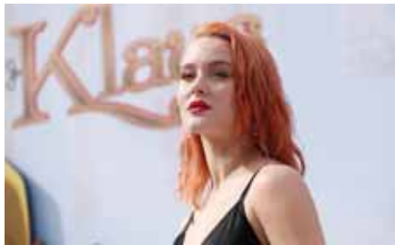
Swedish singer Zara Larsson

"particularly informed". "Huawei is a privately owned company in China that is now launching a good mobile phone, more than that I'm not thinking about or commenting," she told the magazine.