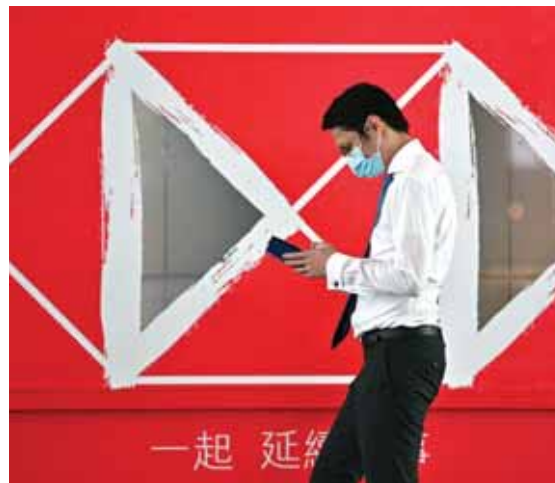
HONG KONG: A man walks past an HSBC advert outside a branch of the bank in Hong Kong. International banks in Hong Kong are caught in the crossfire of competing laws enacted by the United States and China. — AFP

Beijing's security law targets secession, subversion, terrorism and colluding with foreign forces. The law has chilled political freedoms in Hong Kong, which was promised certain liberties and autonomy until 2047 under Britain's handover deal with China. The legislation bypassed Hong Kong's legislature, its wording kept secret until the moment it became law. —AFP