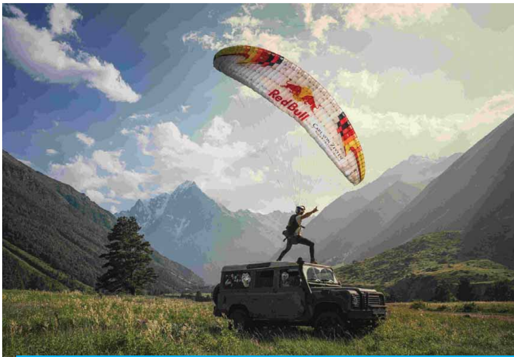
CAUCASUS: Egor Posokhin, professional aerobatic paragliding athlete, performs at Chegem Valley in Caucasus, Russia.