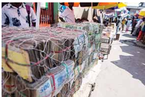
KINSHASA: In this file photo, batches of Congolese francs are seen at a market in the commune of Gombe, in the Lukunga district of Kinshasa, Democratic Republic of the Congo. After a few months of stability around 1,600 to 1,620 Congolese francs to the dollar, the Congolese franc has resumed its plunge against the US dollar since mid-July, causing the foreign exchange market to overheat.

The economy is more than 85 percent dollarized, but most salaries are paid in Congolese