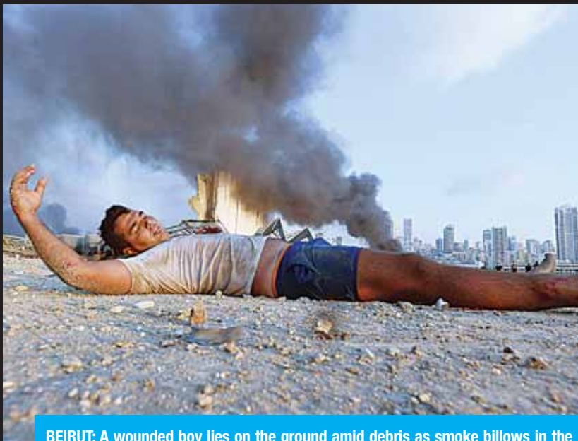
BEIRUT: A wounded boy lies on the ground amid debris as smoke billows in the background at the scene of a massive explosion that hit the port of Beirut in the heart of the Lebanese capital on August 4, 2020.