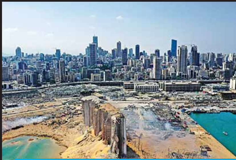
BEIRUT: An aerial view shows the massive damage done to Beirut port's grain silos (center) and the area around it a day after a mega-blast tore through the harbor in the heart of the Lebanese capital with the force of an earthquake, killing more than 100 people and injuring over 4,000.

Syrian and Egyptian crew had arrived at the port on Tuesday on board a ship carrying cargo from Ukraine, and many were planning to head back home on Tuesday. "From the day we set sail six months ago, we had been looking forward to this day of homecoming," said one Syrian seafarer. Another Egyptian crew member said he was planning to go back home on Wednesday after months at sea. "But I will not be able to," he told AFP. "I don't know what to do." —AFP