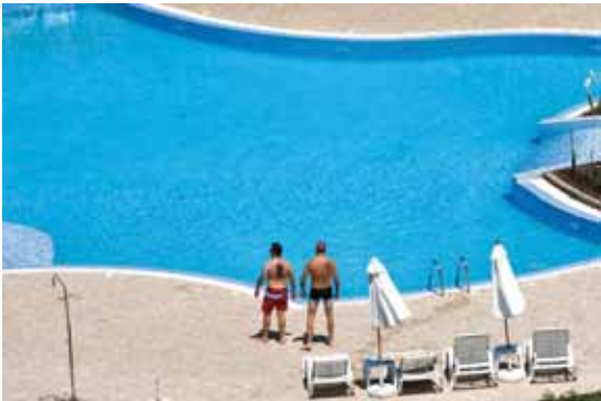
Tourists staying next to an empty pool in Sunny Beach, Bulgaria’s biggest Black Sea resort.