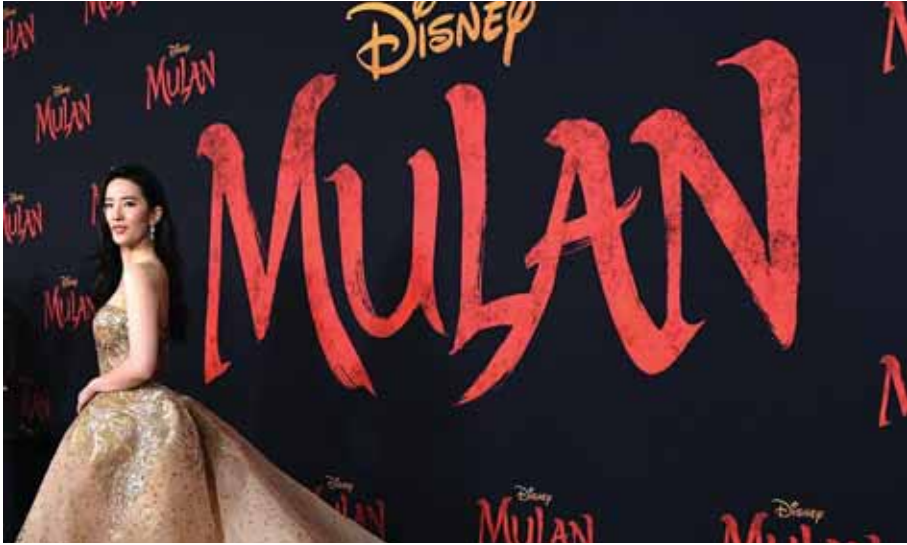
In this file photo US-Chinese actress Yifei Liu attends the world premiere of Disney's "Mulan" at the Dolby Theatre in Hollywood.

Disney's much-delayed blockbuster "Mulan" will skip the big screen and premiere on streaming platform Disney+ next month, it was announced Tuesday, as coronavirus keeps theaters shut across much of the United States. The unprecedented decision-described by CEO Bob Chapek as a "one-off" for a Disney blockbuster-is the latest major blow for movie theater chains already reeling from the pandemic. "Mulan," a mega-budget live action remake of the tale of a legendary Chinese warrior, will be available from September 4 in homes to Disney+ subscribers for an additional $29.99. "We see this as an opportunity to bring this incredible film to a broad audience currently unable to go to movie theaters, while also further enhancing the value and attractiveness of a Disney+ subscription," Chapek told an earnings call.