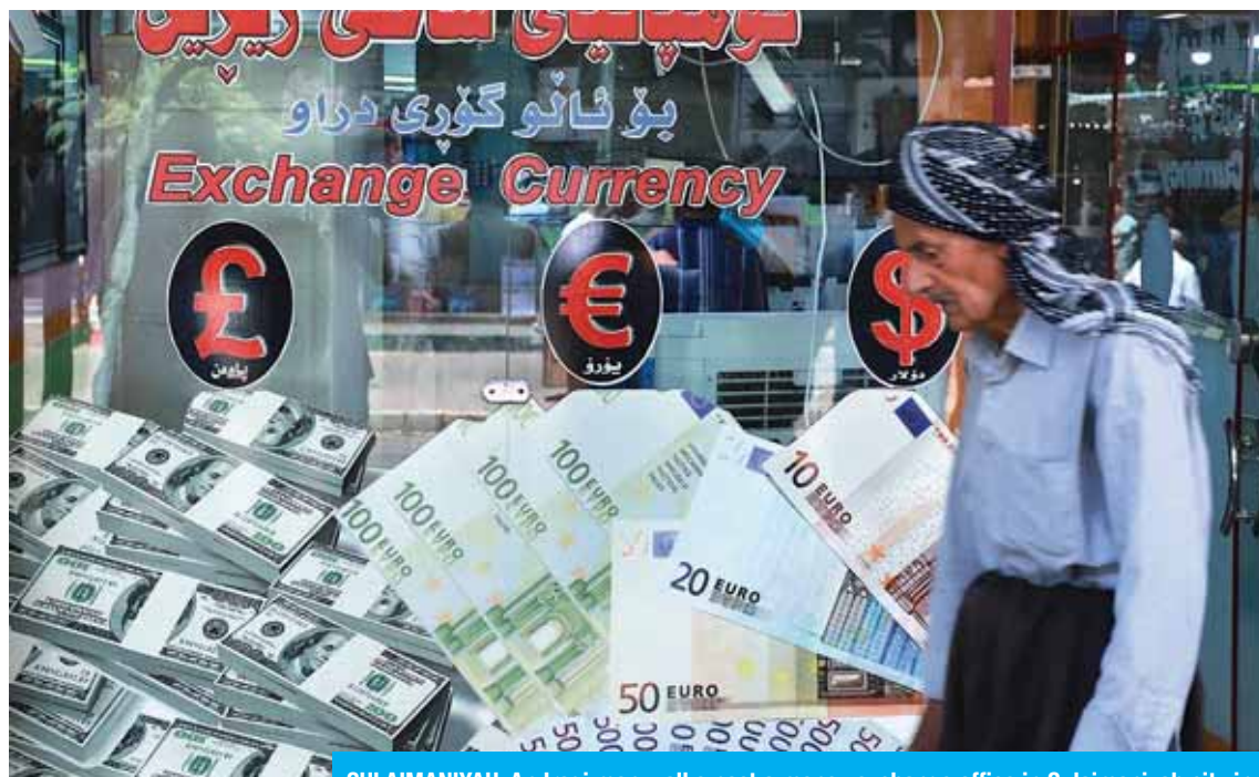
SULAMANIYAH: An Iraqi man walks past a money exchange office in Sulaimaniyah city in the Kurdish autonomous region of northern Iraq, on Tuesday.

Two of the most holy sites for Shiites, Karbala and Najaf, are both in southern Iraq. Millions of Shiite pilgrims, the majority from Iran, visit every year. They bring Iranian rials to spend and trade. In past years, the visitors brought in up to five billion dollars—crucial in a country where almost all tourism is to religious sites. It also provided hundreds of thousands of jobs and accounted for around 2.5 percent of GDP,