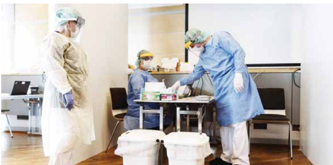
VANTAA, Finland: Medical personnel wait for passengers at the corona virus testing point of the Helsinki-Vantaa airport in Vantaa, Finland. Finland has now 7,466 confirmed cases with the COVID-19, with 329 fatalities.