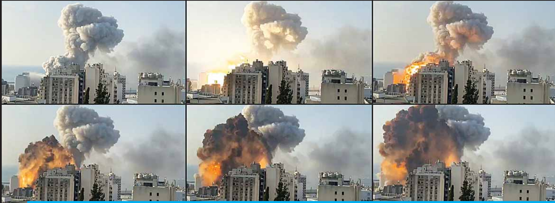
This combination of pictures shows a fireball exploding while smoke is billowing at the port of the Lebanese capital Beirut. Two huge explosions rocked the Lebanese capital Beirut, killing over 100 and wounding dozens of people.

BEIRUT: An entire port engulfed in fire, ships ablaze at sea and crumbling buildings; the site of the massive blast in Beirut's harbor area resembled a post-nuclear landscape. Soldiers cordoned off the area, littered with glass and debris from the explosion which officials said was the result of fire catching in a warehouse where hundreds of tons of ammonium nitrate were stored.