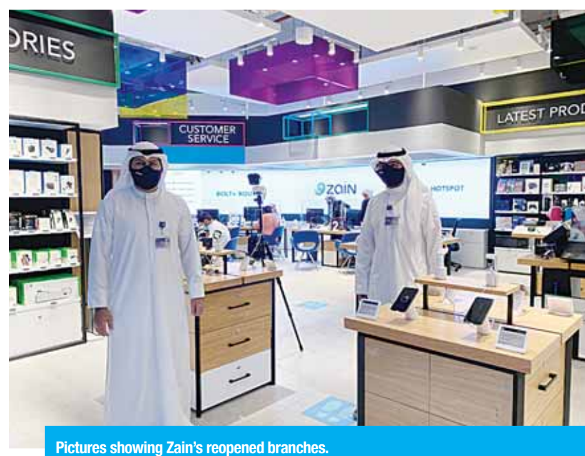
Pictures showing Zain's reopened branches.

Al Salam Cooperative Society, Mubarak Al Abdullah Cooperative Society, Al-Jabriya branch, and Aswaq Al-Qurain branch.