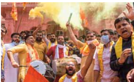
AMRITSAR: Workers of Bharatiya Janata Yuva Morcha, the youth wing of the Bharatiya Janata Party (BJP), burn crackers as they celebrate the groundbreaking ceremony of the Ram Temple in Ayodhya, at the Ram Tirath Temple in Amritsar yesterday.

UNICEF, UNESCO, WFP, World Bank, Save the Children, Education Cannot Wait, Global Partnership for Education, Education Outcomes Fund, Education Commission, Asian Development Bank, African Development Bank.