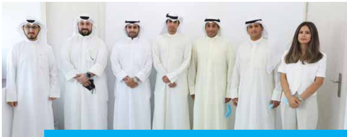
KUWAIT: Members of the Board of Directors of the Kuwait E-Sports Club.

The club's spokesperson emphasized that all of this is in line with the general policy of the state and its plan to focus on youth and sports. This is also in accordance with the club's articles of association and the rules and regulations that govern its activi-