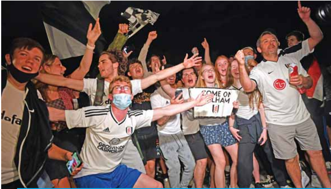
LONDON: Fulham supporters gather outside their team's Craven Cottage football stadium to celebrate the club's promotion to the English Premier League, in west London, following their Championship play-off victory over Brentford.

That seems unlikely, but putting out Juventus might not be. The Old Lady have just won their