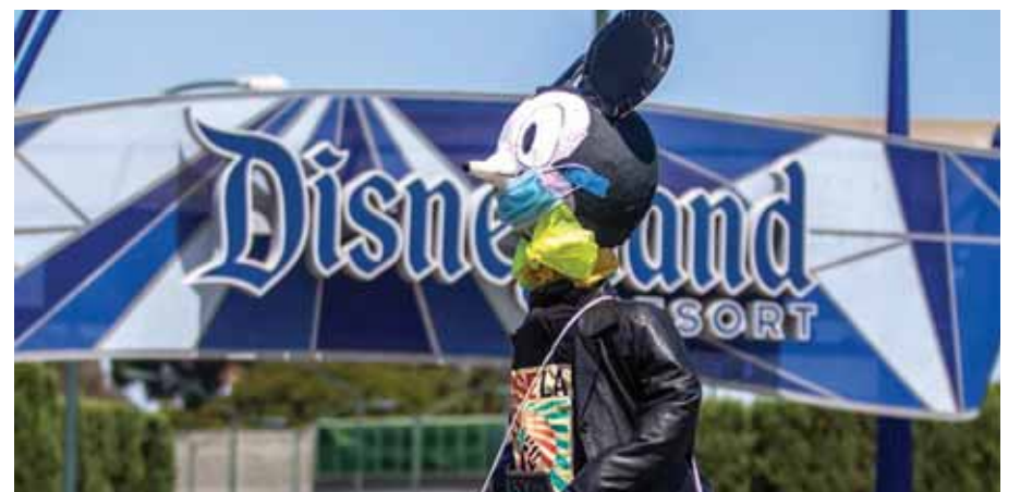
In this file photo a make shift Mickey Mouse on top of a car circles around Disneyland Resort calling for higher safety standards before its reopening, amid the coronavirus pandemic in Anaheim, California.