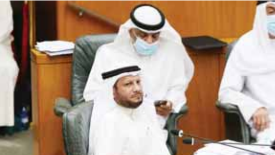
KUWAIT: Finance Minister Barrak Al-Sheetan is seen during his grilling at the National Assembly on Tuesday.