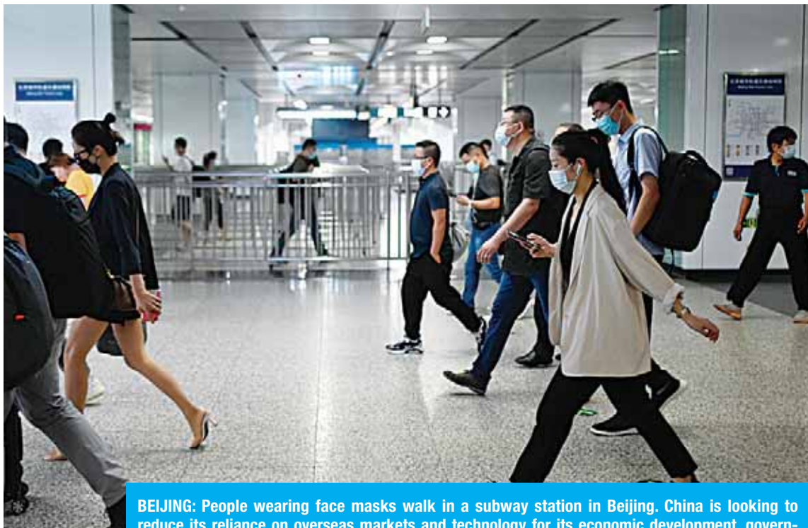
BEIJING: People wearing face masks walk in a subway station in Beijing. China is looking to reduce its reliance on overseas markets and technology for its economic development, government advisers said yesterday. —AFP

The archipelago, home to nearly 270 million people, eased movement restrictions in a bid to prevent economic collapse but coronavirus infections are mounting, with cases topping 115,000 and more than 5,300 deaths. The true scale of the public health crisis is widely believed to be much bigger in Indonesia, which has one of the world's lowest testing rates. Boosting annual growth above five percent had been a key priority for President Joko Widodo in his second term, which kicked off late last year. But his government's handling of the health crisis has been widely criticized. —AFP