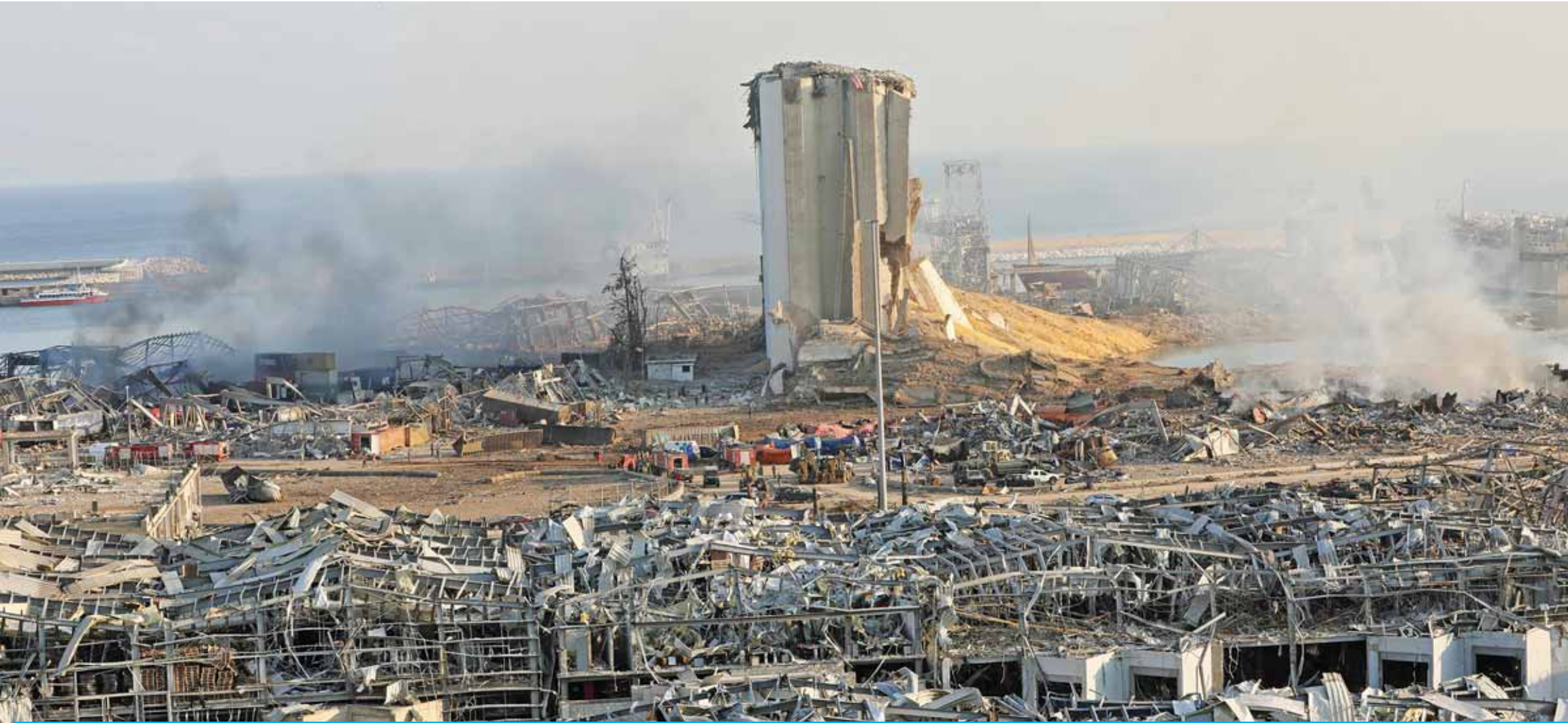
BEIRUT: A destroyed silo is seen yesterday amid the rubble and debris following Tuesday's blast at the port of Lebanon's capital. (See Page 6)

Deputy Amir sends medical supplies • Kuwait reaffirms solidarity with Lebanon