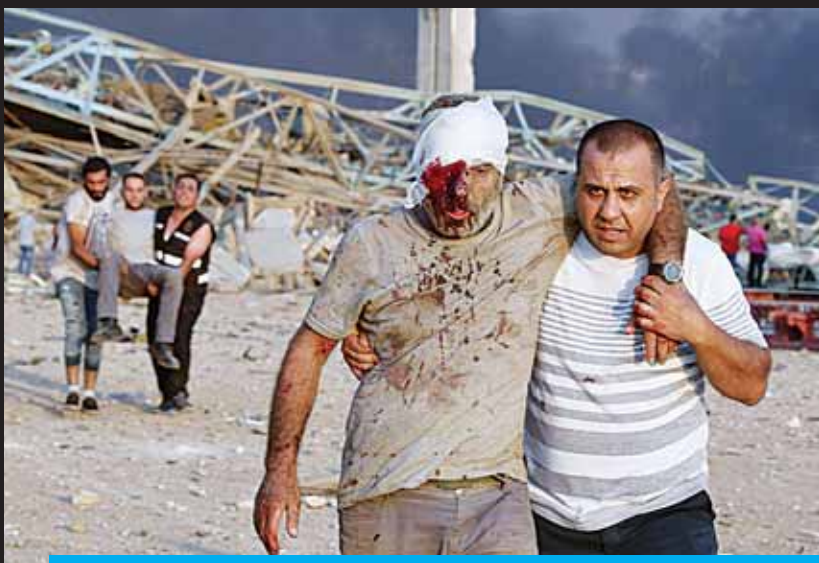
BEIRUT: Wounded men are evacuated following an explosion at the port of the Lebanese capital Beirut, on August 4, 2020.