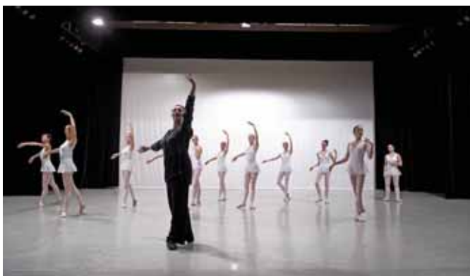
In this file photos dancers rehearse at the Opera Ballet School in Nanterre, a Paris suburb.

The "little rats" were able to restart classes in June after France's two-month lockdown, but 20 of the multinational group were unable to return-blocked in homes from Canada to Australia by travel bans or quarantines. The school's dormitories have also reopened, with just one student per room rather than the usual three. Dance studios are regularly aired out, barres are