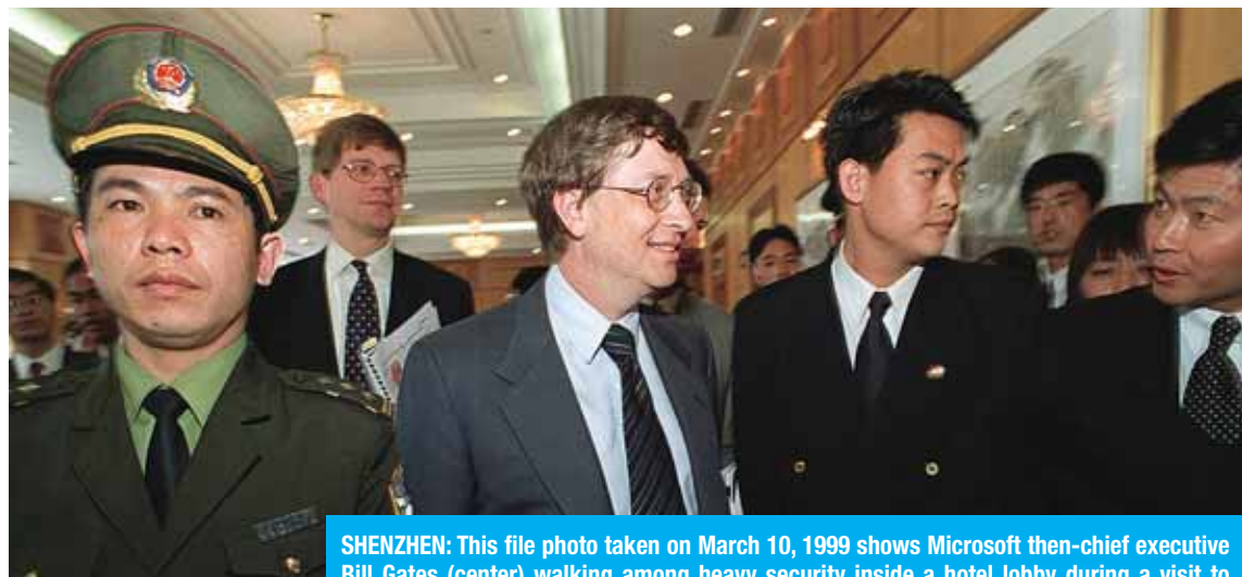
SHENZHEN: This file photo taken on March 10, 1999 shows Microsoft then-chief executive Bill Gates (center) walking among heavy security inside a hotel lobby during a visit to Shenzhen.

According to the International Monetary Fund, Iran's GDP is expected to shrink six percent in 2020, after contracting 7.6 percent last year. In Iraq, meanwhile, tougher times loom as well. The economy is expected to contract almost 10 percent this year. But with few apparent alternatives, dozens of Iraqis keep coming to the money traders in the hope that times will change, the rial will rise, and they can cash in.