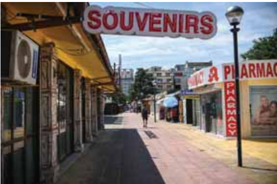
File photo shows an empty street with closed stores in Sunny Beach, Bulgaria’s biggest Black Sea resort.

Even the long queues at the Kulata border crossing and the Greek requirement for a recent negative coronavirus test have not deterred Bulgarians from heading south. “It’s a pity but our whole Black Sea coast is dotted with bigger or smaller villas, hotels and all kinds of buildings, many still under construction, others abandoned,” environmental activist Kremena Vateva, 38, told AFP. In theory, construction is banned within 100 meters (110 yards) of the seashore outside urban areas but Vateva points to various loopholes that need closing in the legislation.