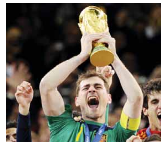
JOHANNESBURG: File photo taken on July 11, 2010 Spain's goalkeeper Iker Casillas celebrates with the trophy following the 2010 World Cup football final between the Netherlands and Spain on July 11, 2010 at Soccer City stadium in Soweto, suburban Johannesburg. — AFP

Former Italy captain Gianluigi Buffon, who played against Casillas on numerous occasions and is also seen as one of his country's finest ever goalkeepers, echoed Ramos and Del Bosque's praise. "They say competition makes us better than others but not perfect faced with ourselves. Maybe this futile pursuit of perfection is what made us who we are. #Gracias Iker, without you, everything would have been less meaningful," Buffon tweeted. — AFP