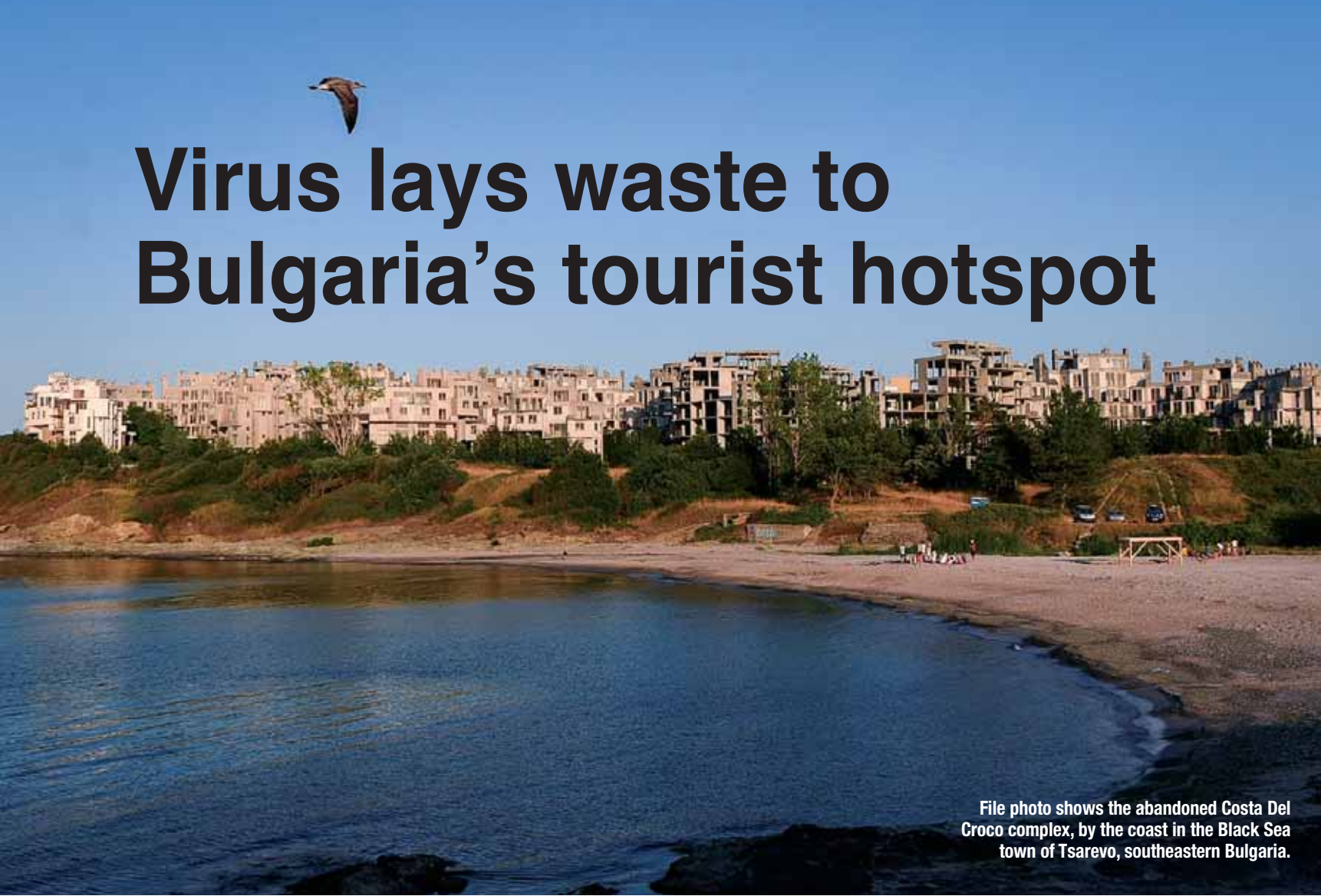
File photo shows the abandoned Costa Del Croco complex, by the coast in the Black Sea town of Tsarevo, southeastern Bulgaria.

“We need at least 100 charter flights a day,” says Plamen Kopchev, head of the hotel owners’ association in Bulgaria’s mammoth Black Sea resort of Sunny Beach, laid waste by the coronavirus pandemic. But the trouble is, only a fraction of those flights have been arriving, a disaster for a resort Kopchev explains “is made for mass tourism”—a model that some Bulgarians have long been questioning and which now lies in tatters. Bulgaria is the poorest country in the European Union and will be dealt a body blow by the virtual collapse of its tourism sector, which accounts for 12 percent of annual economic output.