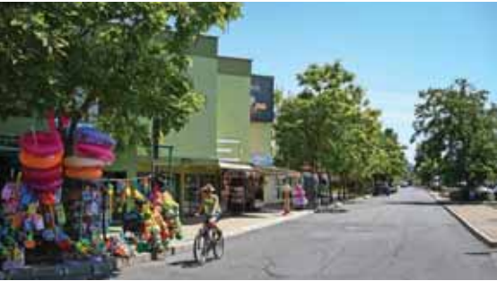
File photo shows a girl riding a bike in an empty street in Sunny Beach, Bulgaria’s biggest Black Sea resort.