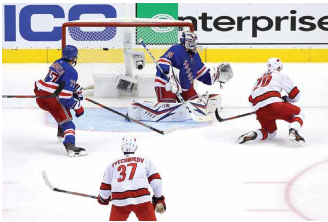
TORONTO: Sebastian Aho #20 of the Carolina Hurricanes scores a goal on Igor Shesterkin #31 of the New York Rangers during the third period in Game Three of the Eastern Conference Qualification Round prior to the 2020 NHL Stanley Cup Playoffs at Scotiabank Arena in Toronto, Ontario, Canada.

Sean Monahan collected one goal and two assists, and Calgary used a dominating second period to claim a convincing win over Winnipeg and move to the verge of advancing in the Stanley Cup playoffs. Mikael Backlund, Johnny Gaudreau and Elias Lindholm each netted one goal and one assist for the Flames, who lead the best-of-five Western Conference qualifying round series 2-1. Calgary goalie Cam Talbot stopped 34 shots. The Flames, who also got goals from Matthew Tkachuk and Milan Lucic plus two assists from Andrew Mangiapane, will look to eliminate the Jets on Thursday. Andrew Copp and Nikolaj Ehlers scored for Winnipeg.