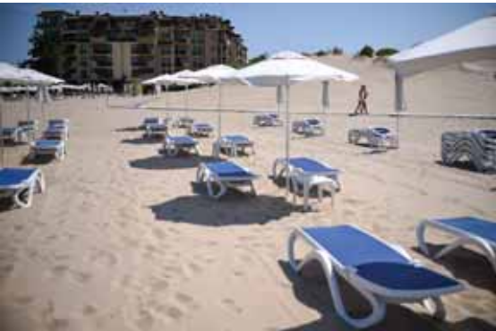
Tourists walking near empty sunbeds and umbrellas at the beach, in Sunny Beach, Bulgaria’s biggest Black Sea resort.