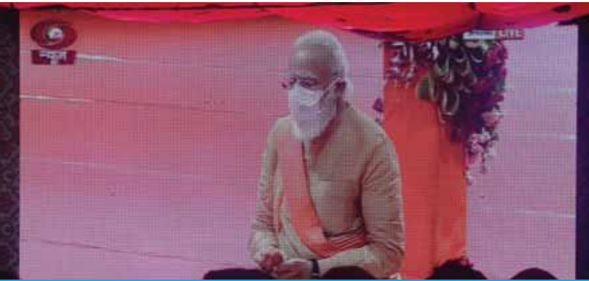
NEW DELHI: People watch a live telecast on screen from Ayodhya of Indian Prime Minister Narendra Modi taking part in a Hindu religious ritual during a ground-breaking ceremony of the Ram Temple yesterday.