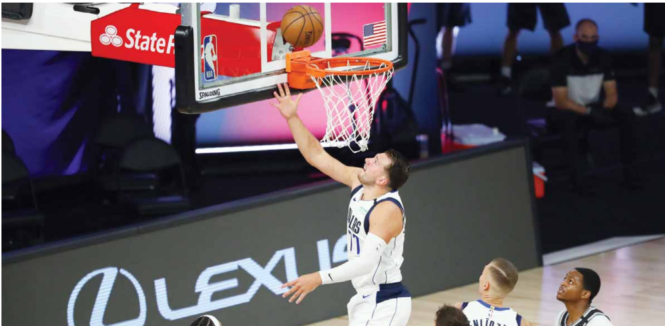
LAKE BUENA VISTA: Luka Doncic #77 of the Dallas Mavericks shoots against the Sacramento Kings in the second half of a NBA basketball game at HP Field House at ESPN Wide World Of Sports Complex in Lake Buena Vista, Florida.