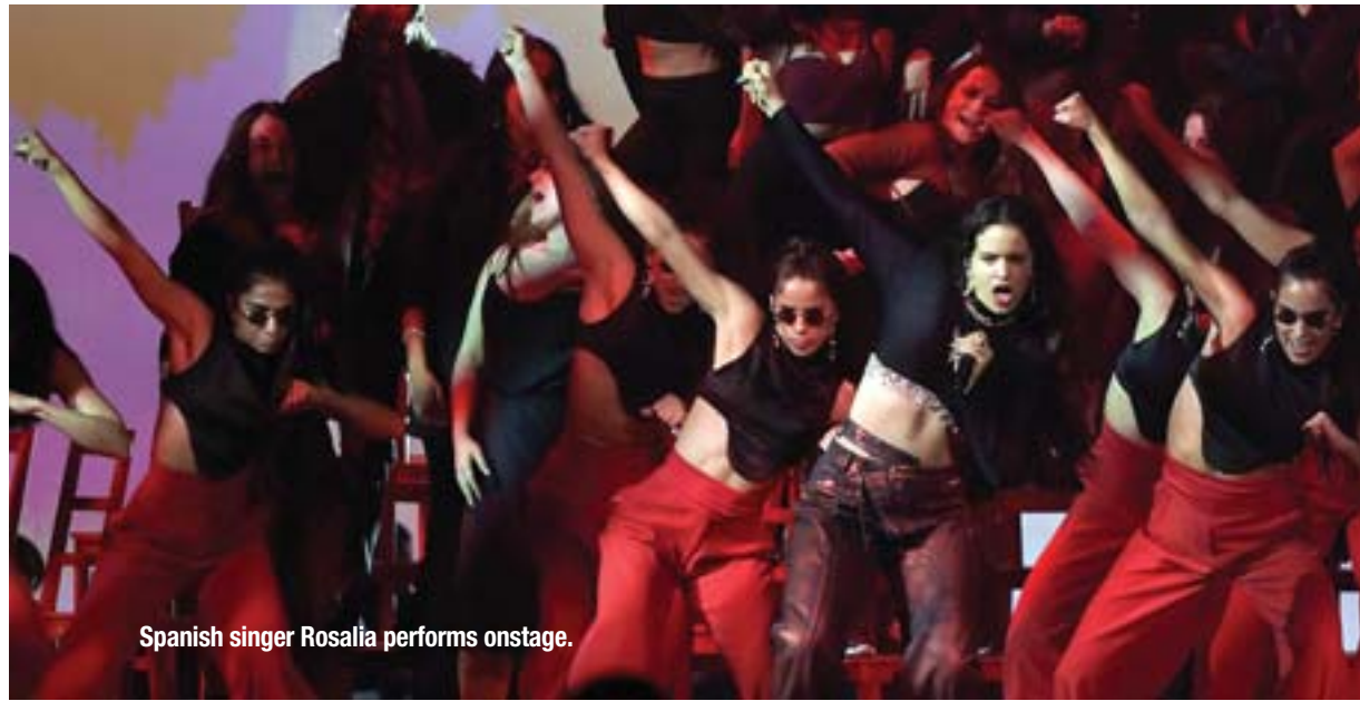
Spanish singer Rosalia performs onstage.