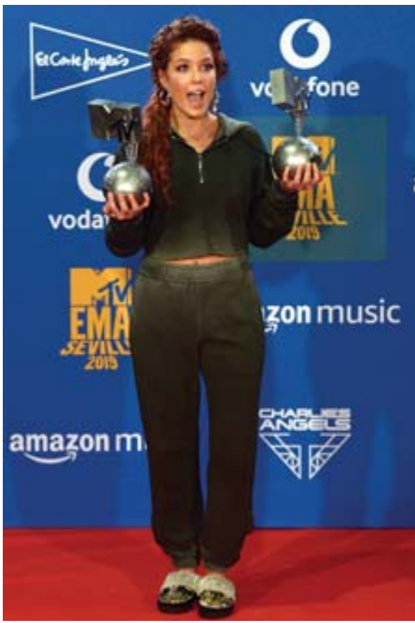
US singer Halsey