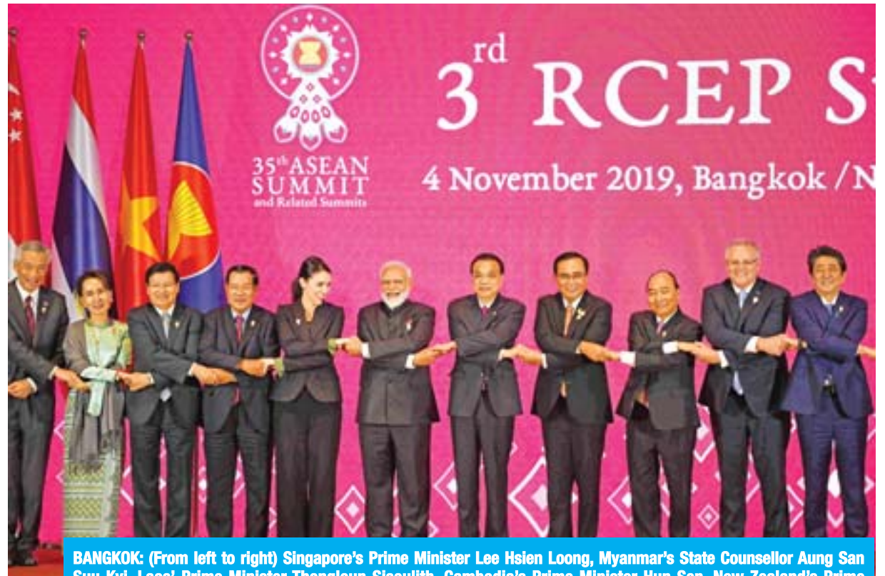
BANGKOK: (From left to right) Singapore's Prime Minister Lee Hsien Loong, Myanmar's State Counsellor Aung San Suu Kyi, Laos' Prime Minister Thongloun Sisoulith, Cambodia's Prime Minister Hun Sen, New Zealand's Prime Minister Jacinda Ardern, India's Prime Minister Narendra Modi, China's Premier Li Keqiang, Thailand's Prime Minister Prayut Chan-O-cha, Vietnam's Prime Minister Nguyen Xuan Phuc, Australia's Prime Minister Scott Morrison and Japan's Prime Minister Shinzo Abe pose for a group photo during the 3rd Regional Comprehensive Economic Partnership (RCEP) Summit yesterday.

In another development, South Korean President Moon Jae-in and Japanese Prime Minister Shinzo Abe yesterday held their first talks for more than a year on the sidelines of a regional summit in Thailand, Moon's office said, with the neighbors' relationship in dire straits. Ties between Seoul and Tokyo—both of them US allies facing the twin challenges of nuclear-armed North Korea and an increasingly assertive China—are at rock-bottom over a dispute related to Japan's use of forced labour during World War II, with