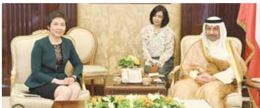
KUWAIT: His Highness the Prime Minister Sheikh Jaber Al-Mubarak Al-Hamad Al-Sabah meets with Secretary General of the International Civil Aviation Organization (ICAO) Dr Fang Liu.