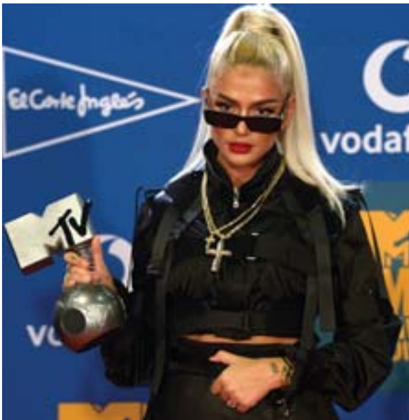
Swiss artist Loredana