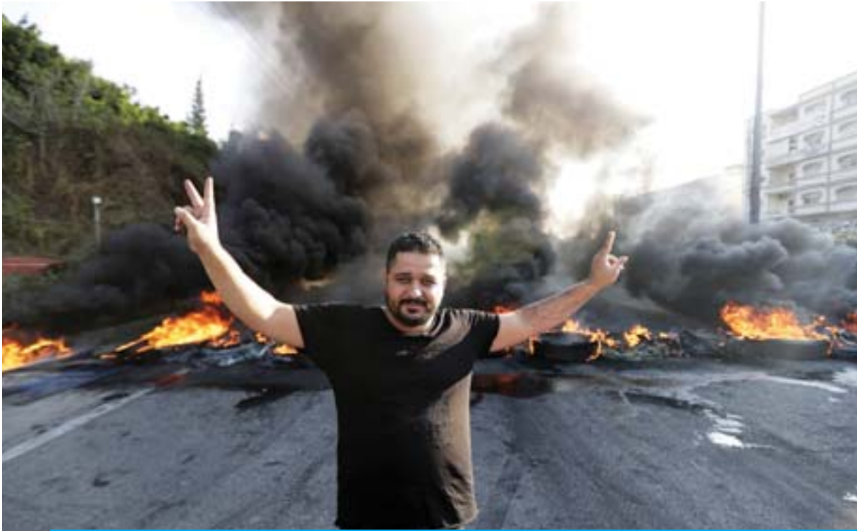
BYBLOS, Lebanon: A Lebanese protester flashes the victory sign as he stands in front of burning tyres blocking a highway in this northern port city during ongoing anti-government demonstrations yesterday.