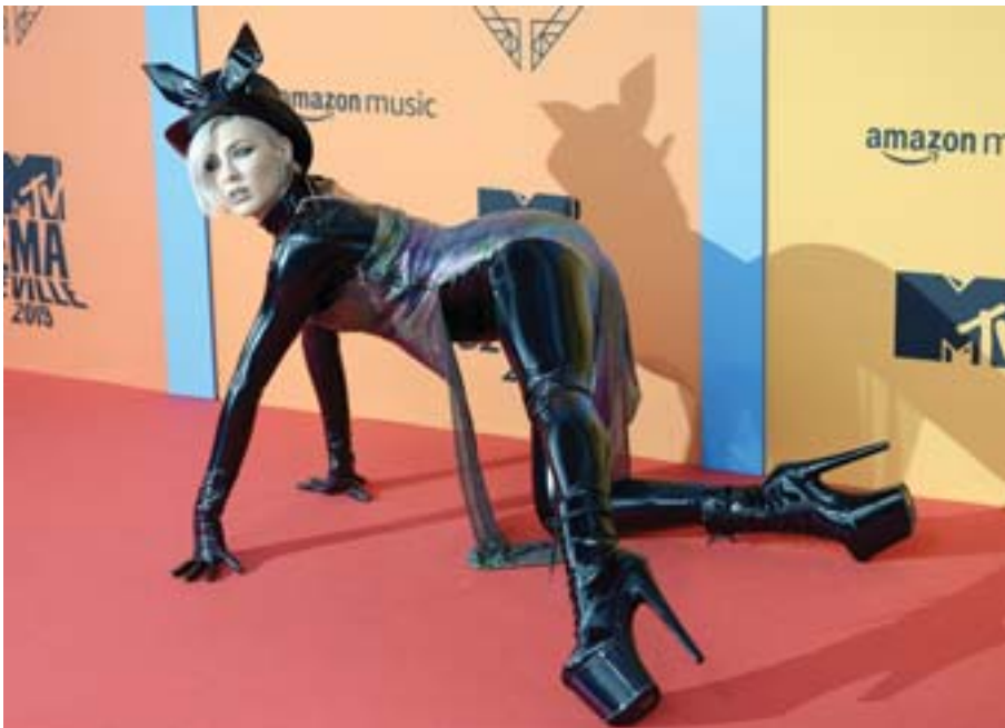
Ukrainian singer Maruv