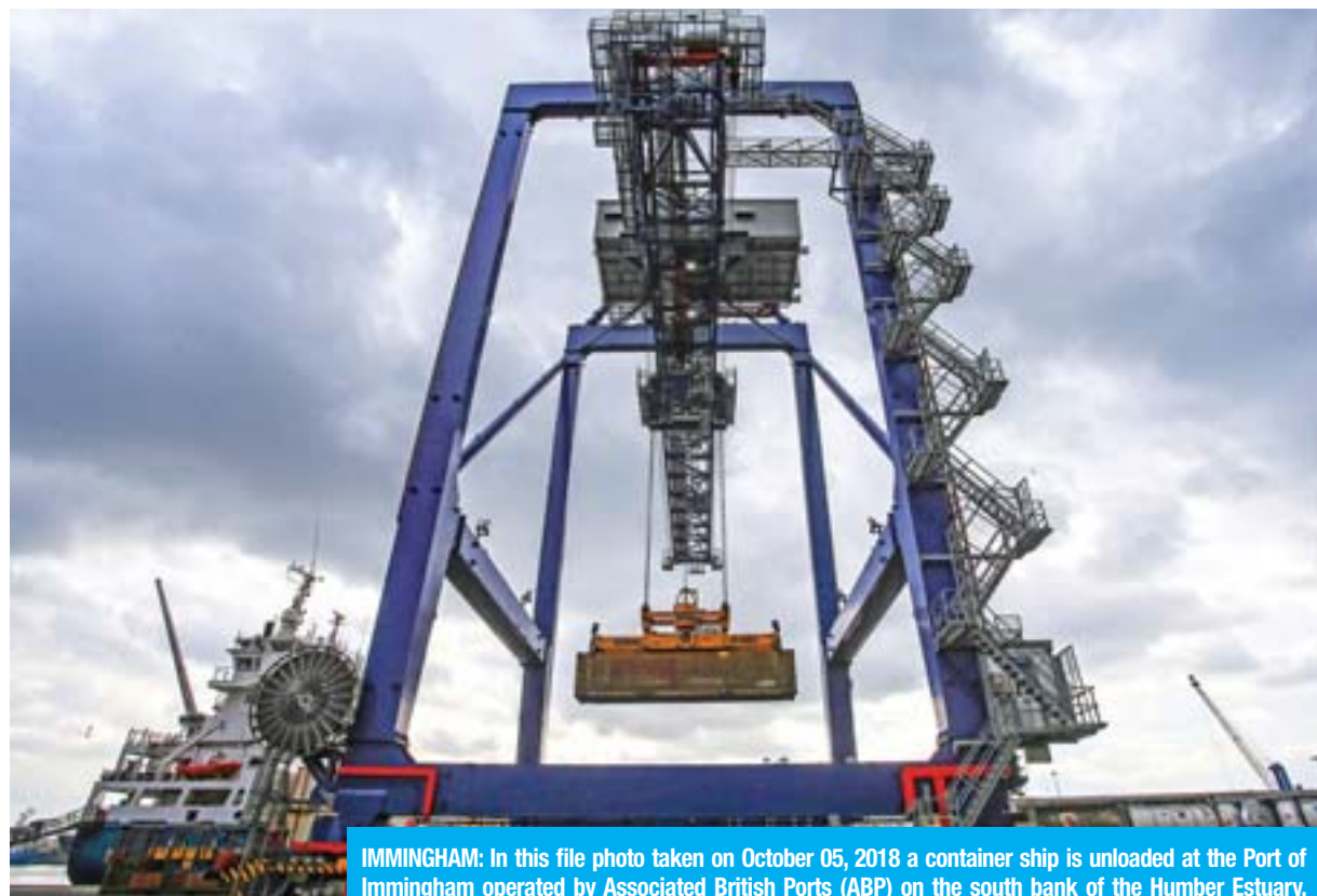
IMMINGHAM: In this file photo taken on October 05, 2018 a container ship is unloaded at the Port of Immingham operated by Associated British Ports (ABP) on the south bank of the Humber Estuary, eastern England. - AFP

If Labor repeats its 2017 election promise of 48.6 billion pounds ($62.85 billion) of extra spending on services, coupled with its new 10-year 250 billion-pound infrastructure plan, public spending would hit 43.3% of GDP, significantly above the 1970s average, the Resolution Foundation said. However, that would still be smaller than government spending in Germany and France which stood at just over 44% and 56% of GDP respectively in 2017, according to figures from the Organization for Economic Co-operation Development. — Reuters