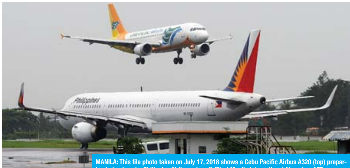
MANILA: This file photo taken on July 17, 2018 shows a Cebu Pacific Airbus A320 (top) preparing to land past a Philippine Airlines aircraft (R) at Manila International Airport.