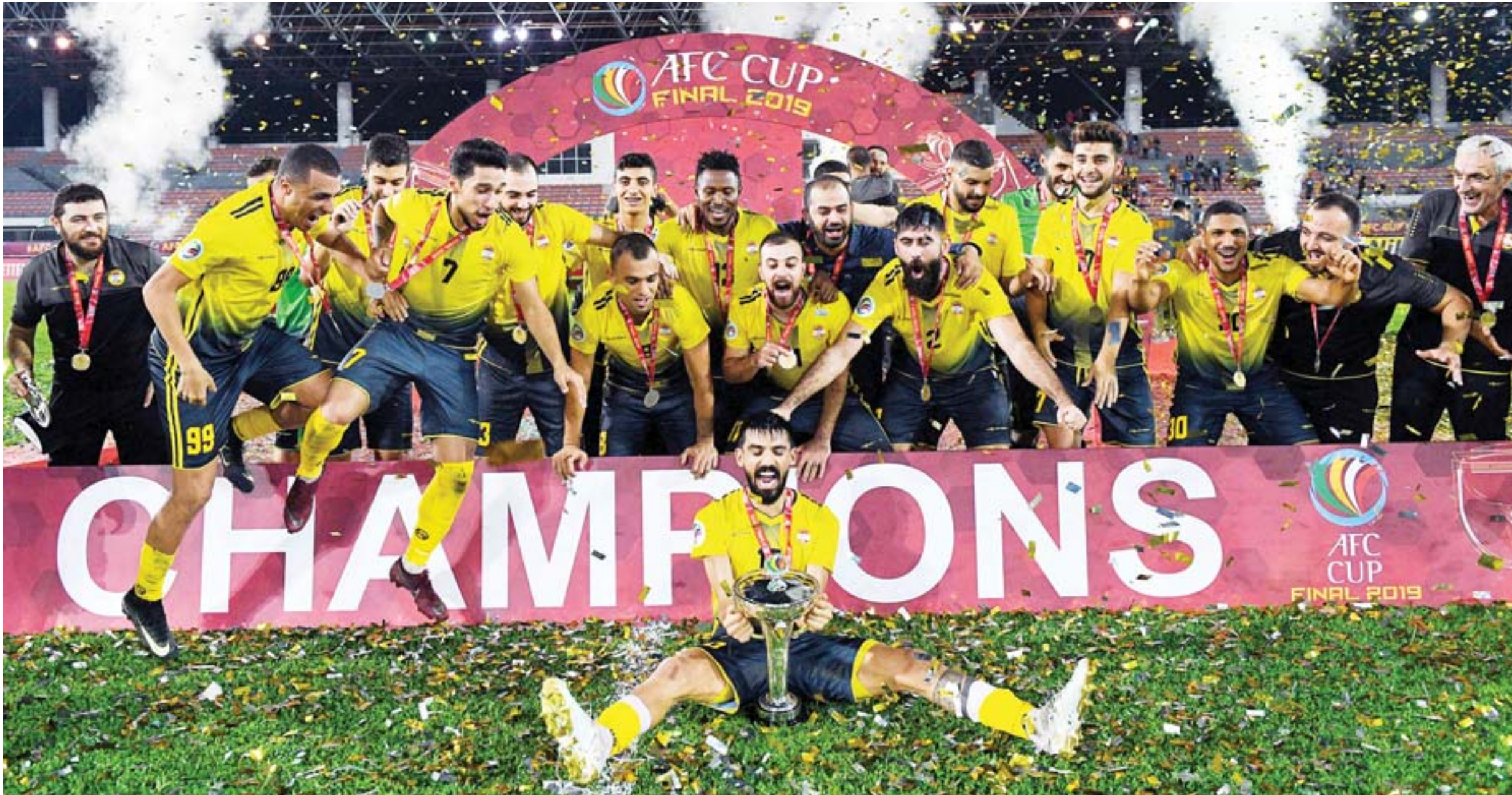
KUALA LUMPUR: Al Ahed's players and coaching staff celebrate with the trophy after winning the 2019 AFC Cup Final between North Korea's April 25 Sports Club and Lebanon's Al Ahed FC at Kuala Lumpur Stadium in Kuala Lumpur yesterday.