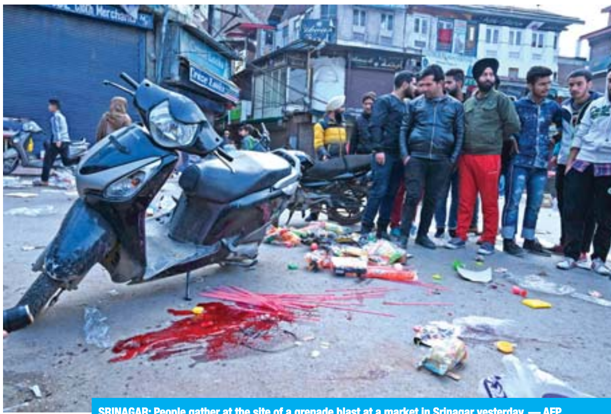
SRINAGAR: People gather at the site of a grenade blast at a market in Srinagar yesterday.

Tensions have soured further in recent days amid clashes along the border in Afghanistan's eastern province of Kunar. Both sides have accused each other's troops of cross-border shelling. The Pakistani foreign ministry has said six Pakistani troops were wounded October 27 and 28 in "unprovoked mortar and heavy weapon firing" by Afghan soldiers. Pakistani consular services remain open in Herat, Jalalabad and Mazar-i-Sharif, according to the embassy spokesman, who recommended that applicants travel to Jalalabad if they needed a visa urgently.