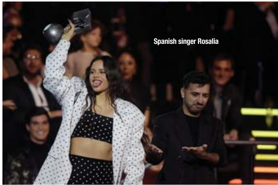
Spanish singer Rosalia