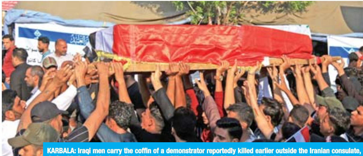
KARBALA: Iraqi men carry the coffin of a demonstrator reportedly killed earlier outside the Iranian consulate, during his funeral in the Shiite shrine city of Karbala, south of Iraq's capital Baghdad yesterday.