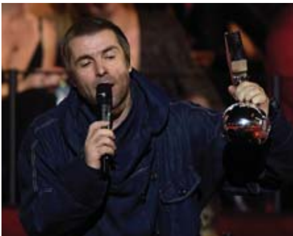
British singer Liam Gallagher