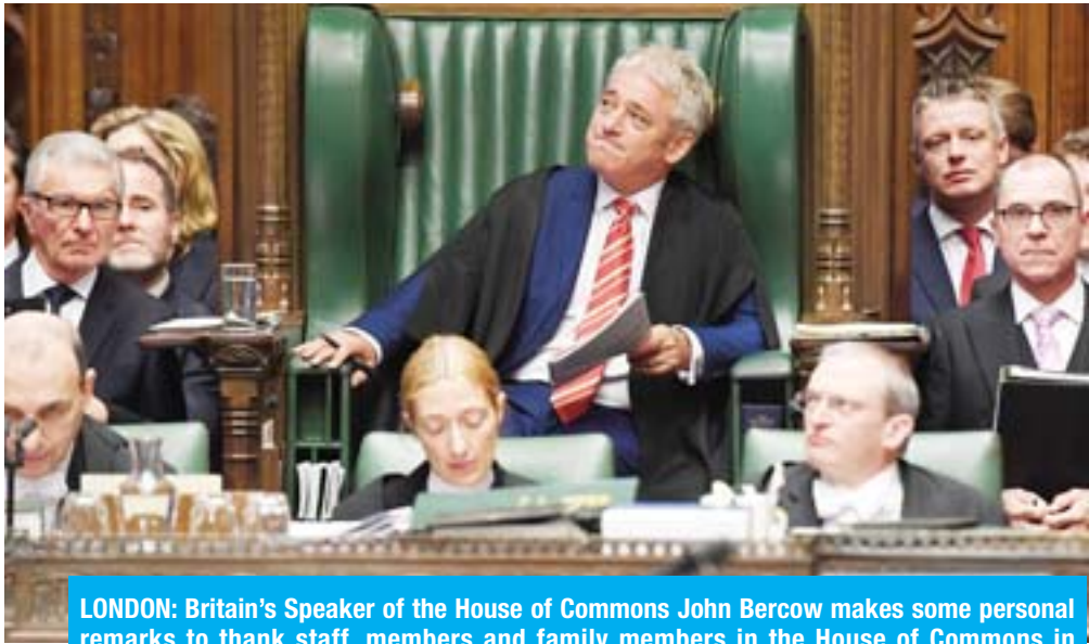
LONDON: Britain's Speaker of the House of Commons John Bercow makes some personal remarks to thank staff, members and family members in the House of Commons in London ahead of his retirement on October 31.

Former Speaker John Bercow was accused of breaking convention and favoring those who wanted to stop the government's exit plans. But he was feted by others who saw him as empowering them to challenge and scrutinize the executive. "The Speaker who succeeds John Bercow, whoever they are, is