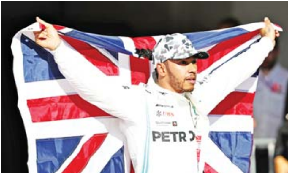
AUSTIN: Formula One World Drivers Champion Lewis Hamilton of Great Britain and Mercedes GP celebrates in parc ferme during the F1 Grand Prix of USA at Circuit of The Americas in Austin, Texas.

“I keep saying to Lewis, you are 34 years young, not 34-years-old, and as long as you feel fit you can keep going for as long as you want and you can. “This championship means the world to him, but I think it also feels like they are all the same. This feels like it did in 2007, the first opportunity he had to win.”