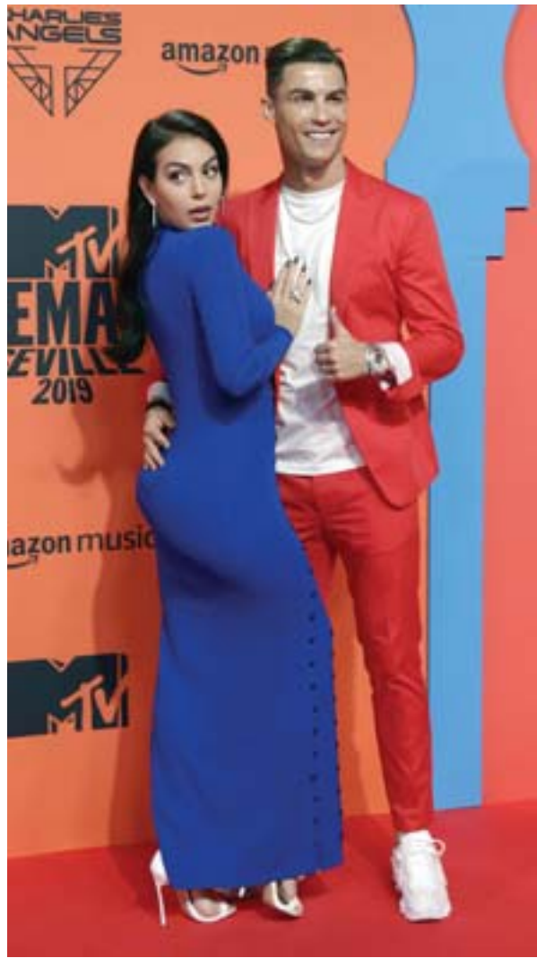
Juventus' Portuguese forward Cristiano Ronaldo, right, and his wife Georgina Rodriguez