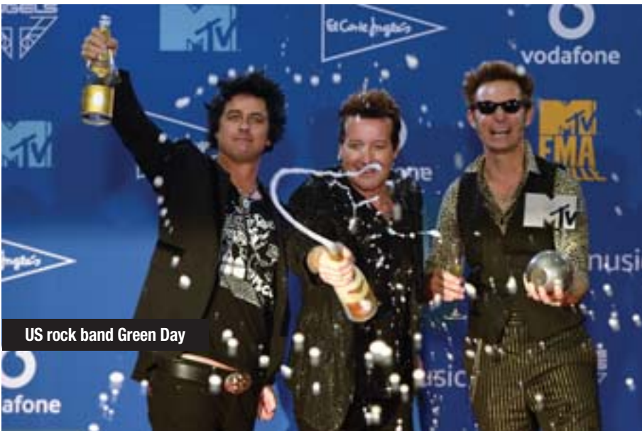
US rock band Green Day