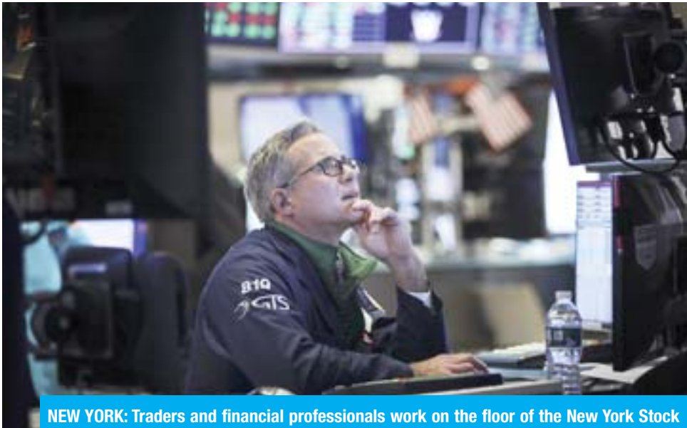
NEW YORK: Traders and financial professionals work on the floor of the New York Stock Exchange (NYSE) at the closing bell.