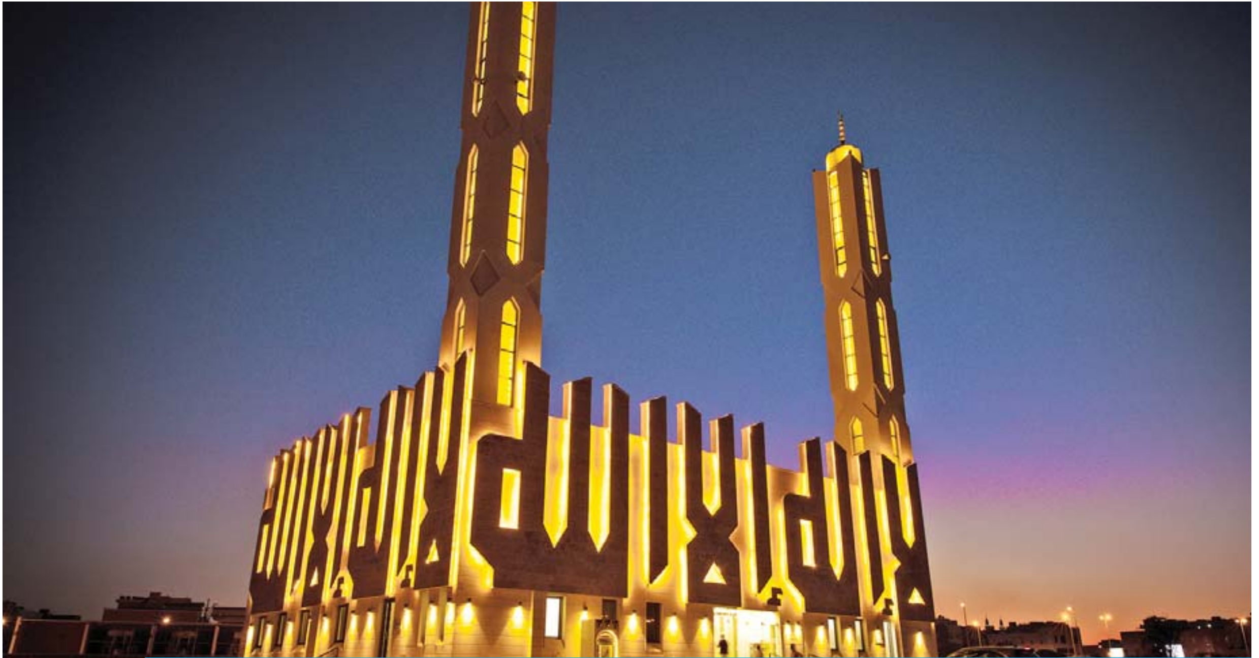
KUWAIT: The beautiful design of Essa Yousef Al-Othman mosque in Funaitees.