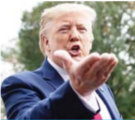
WASHINGTON: US President Donald Trump speaks to the press before departing the White House.

"What they said is he's an Obama person, he was involved with Brennan, Susan Rice - which means Obama. But he was like a big, a big anti-Trump person, hated Trump," the president told reporters, adding that he didn't know if the reports were true or not. He also dismissed other officials who defied the White House by testifying about the Ukraine episode as "never Trumpers." "So, you know, it's a whole scam. It's an