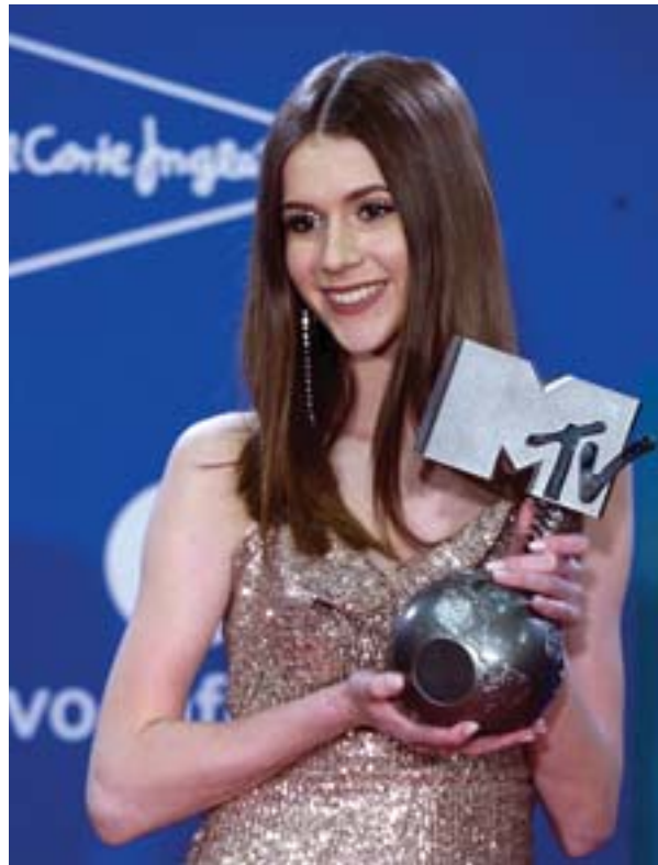
Polish singer Roksana Węgiel