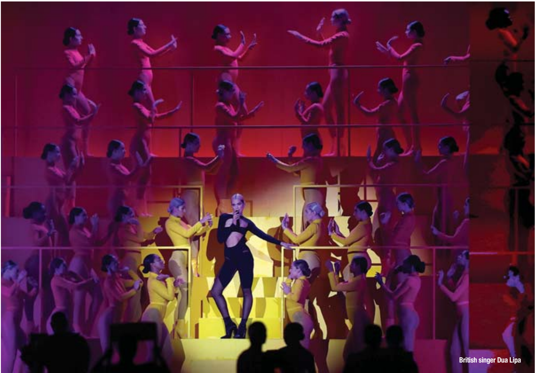
British singer Dua Lipa