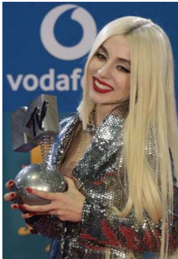
US singer Ava Max