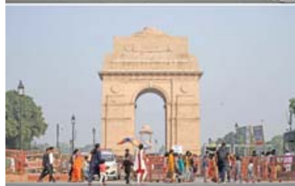
NEW DELHI: This combination of images shows tourists visiting the India Gate under heavy smog conditions (top) in New Delhi on November 3, 2019 and tourists visiting India Gate yesterday - the day after skies cleared.