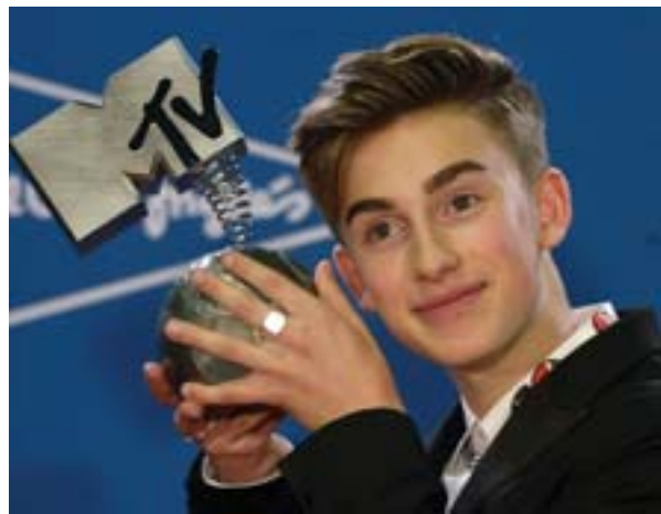
Canadian actor Johnny Orlando