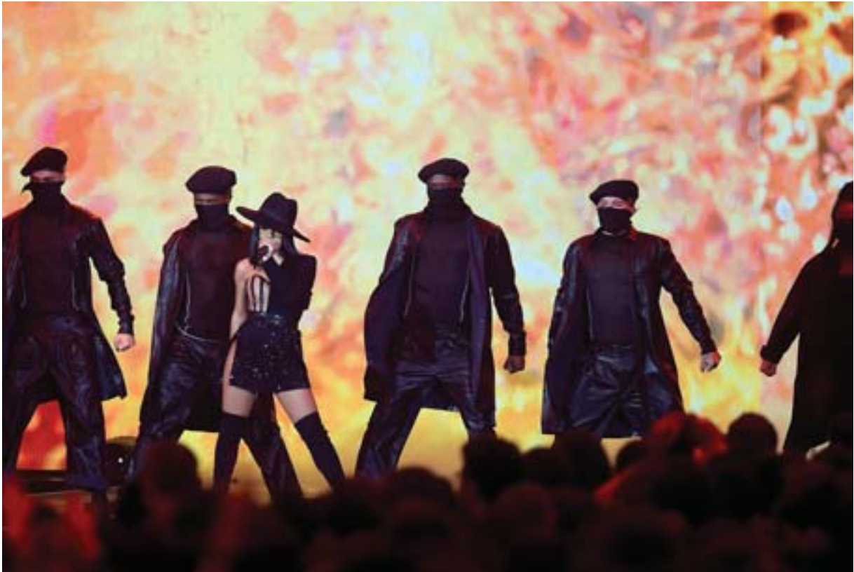
US singer and host Becky G performs onstage.