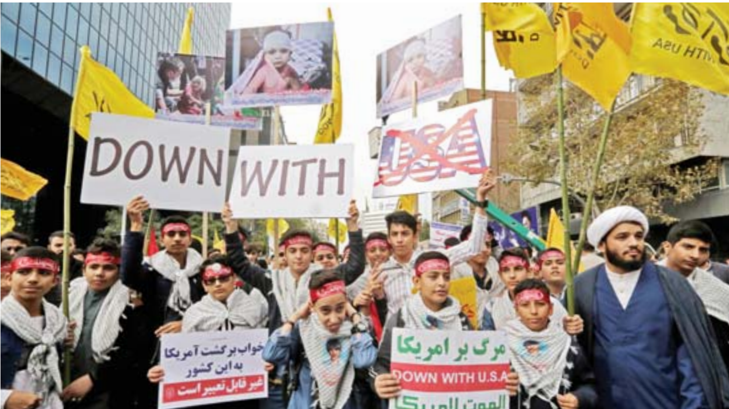
TEHRAN: Iranian protesters hold anti-US placards during a rally outside the former US embassy in the Iranian capital to mark the 40th anniversary of the Iran hostage crisis.

That compares with the level of 450 gm two months ago when it abandoned a number of commitments made under the landmark 2015 nuclear deal. Salehi said Iranian engineers “have successfully built a proto-