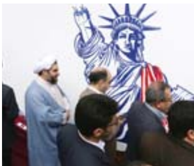
US and Iran: From allies to enemies