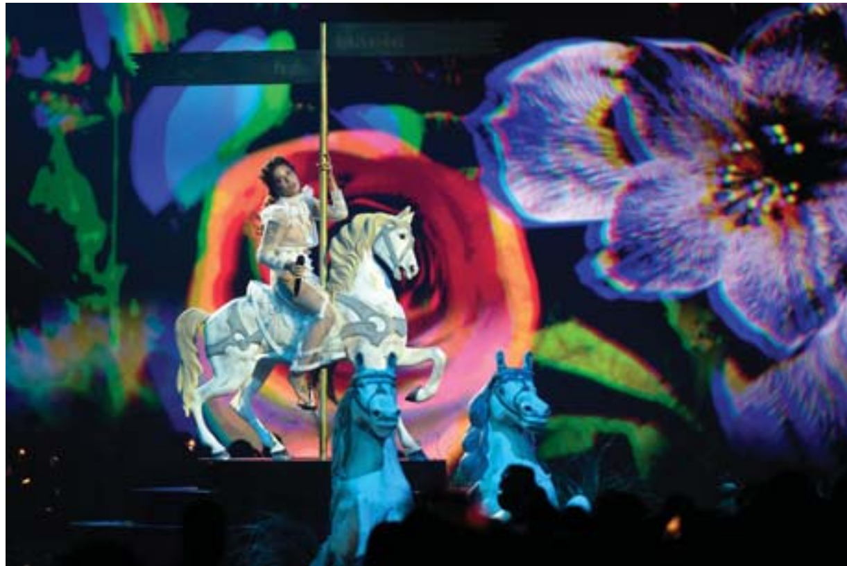
US singer Halsey performs onstage.