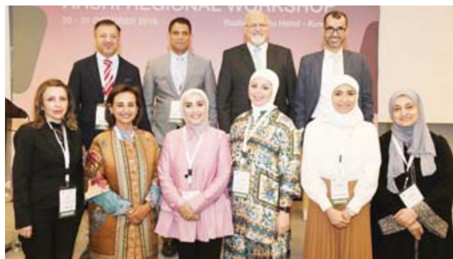
KUWAIT: Participants at the workshop pose for a group photo.