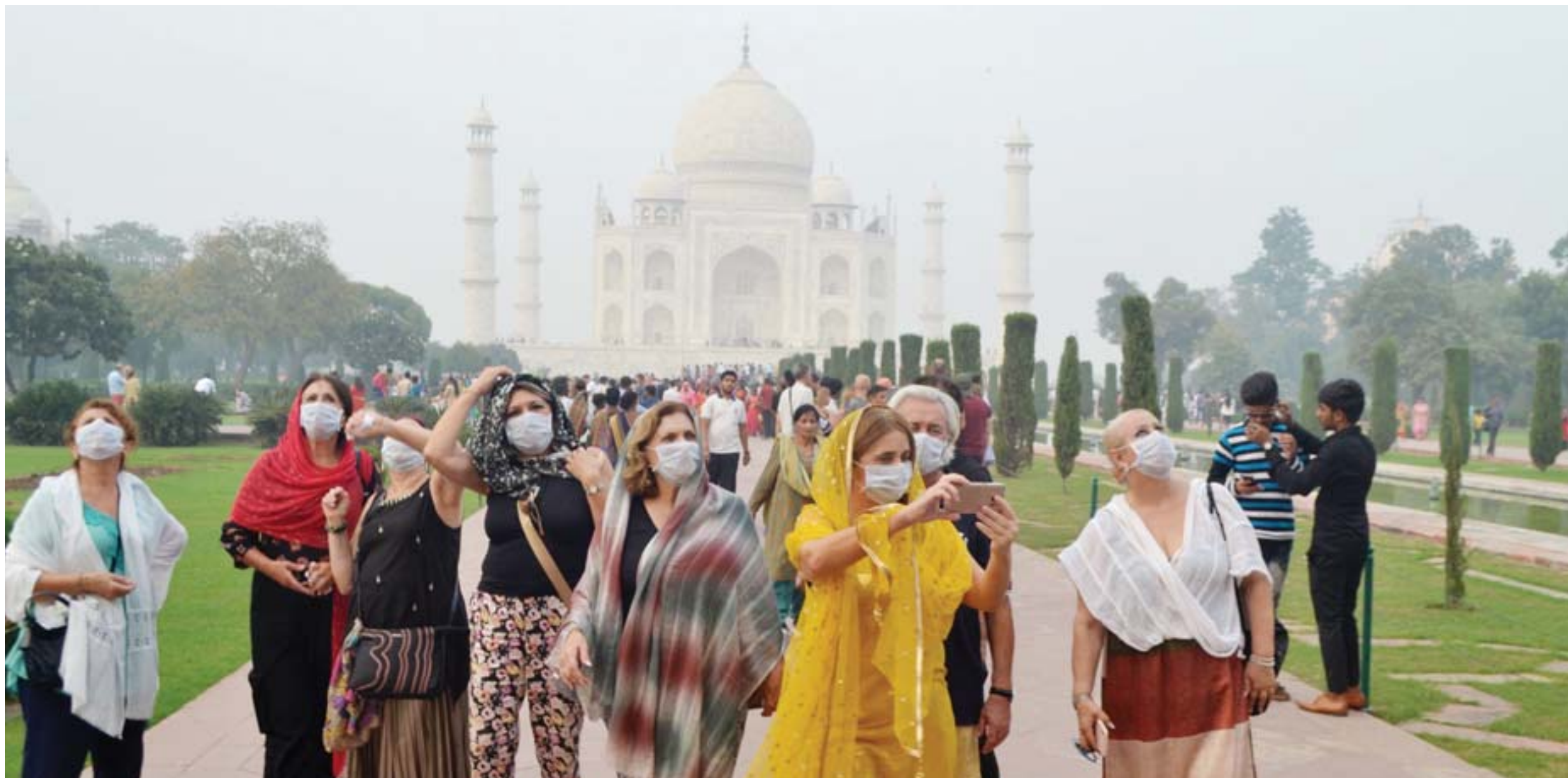
AGRA: Foreign tourists wearing face masks visit the Taj Mahal under heavy smog conditions yesterday.