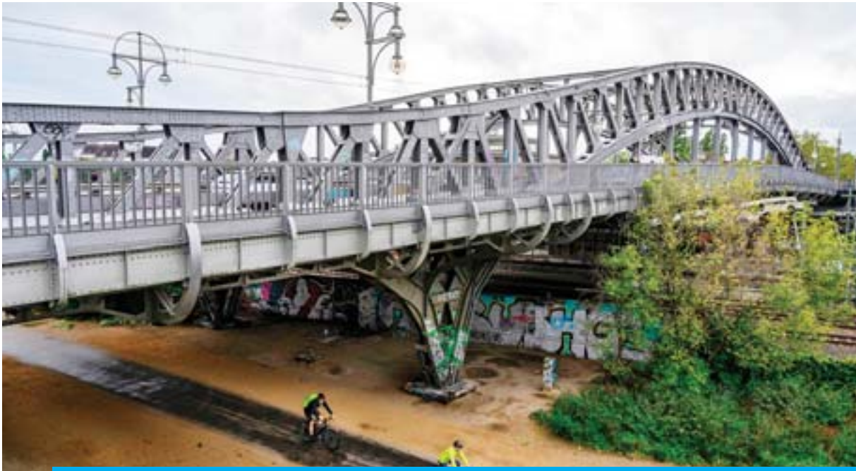
BERLIN: Photo shows the Boesebrücke (Boese bridge) which used to straddle the border between east and west Berlin. The Bornholmer Strasse border crossing, leading to the Boesebrücke, played the historic role of being the first border crossing to be opened during the fall of the Berlin Wall.

Like every Thursday night back then, Angela Merkel was relaxing in an East Berlin sauna on the night of November 9, 1989 as the Berlin Wall fell, dreaming of tasting oysters in the West. The future chancellor of