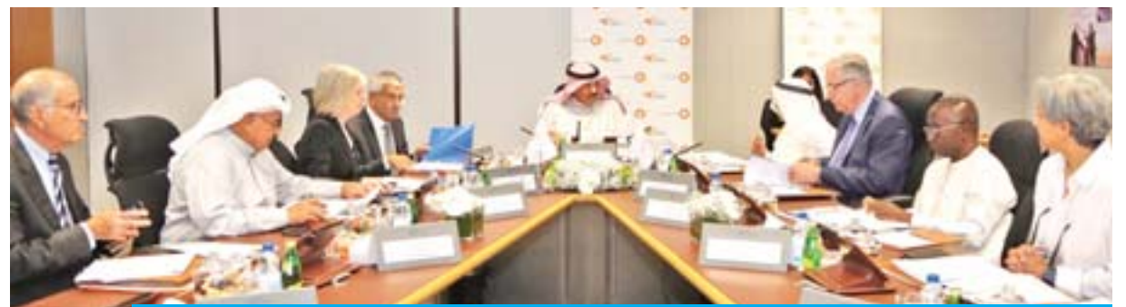
KUWAIT: Sheikh Sabah Al-Khaled Al-Hamad Al-Sabah chairs Al-Sumait Prize Board of Trustees meeting.