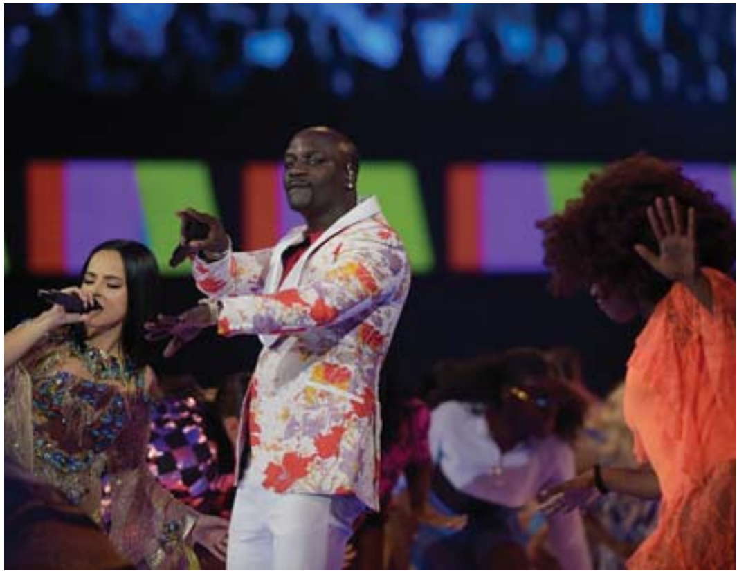
US singer Akon