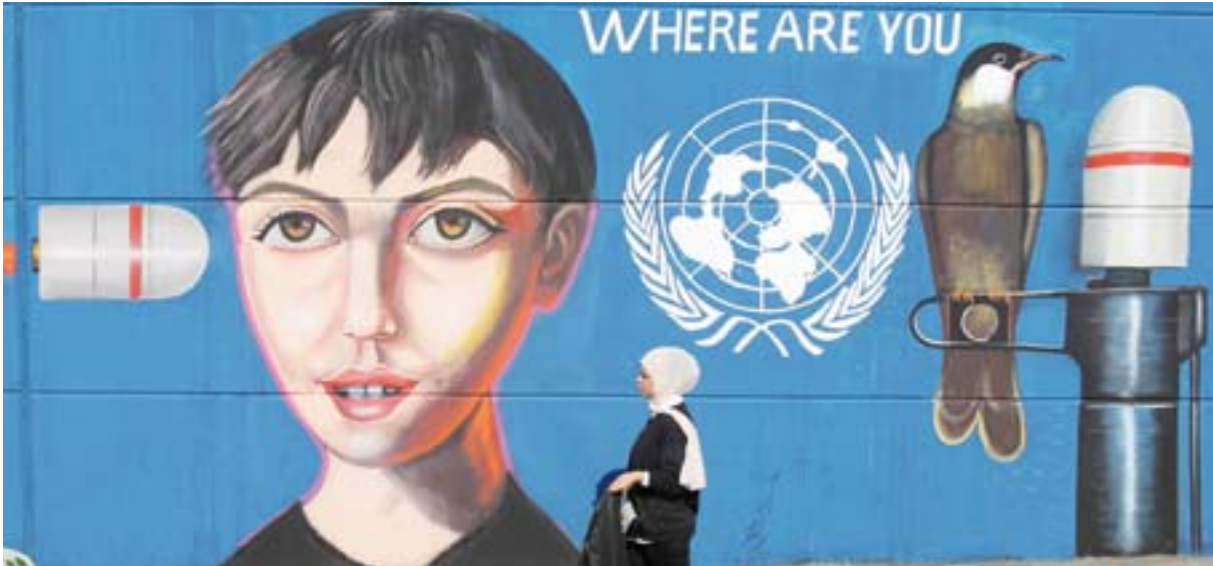
BAGHDAD: An Iraqi woman walks along a wall painted with a mural during an anti-government demonstration in Tahrir Square yesterday.