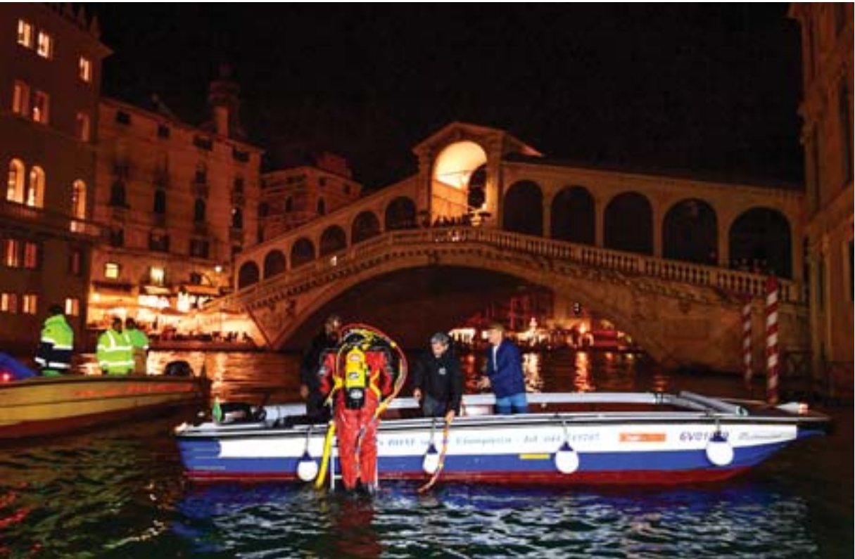
Men of the Venice Gondolieri association prepare equipment before diving in the water of Canal Grande, close to the Rialto bridge to collect waste of the canals of Venice.