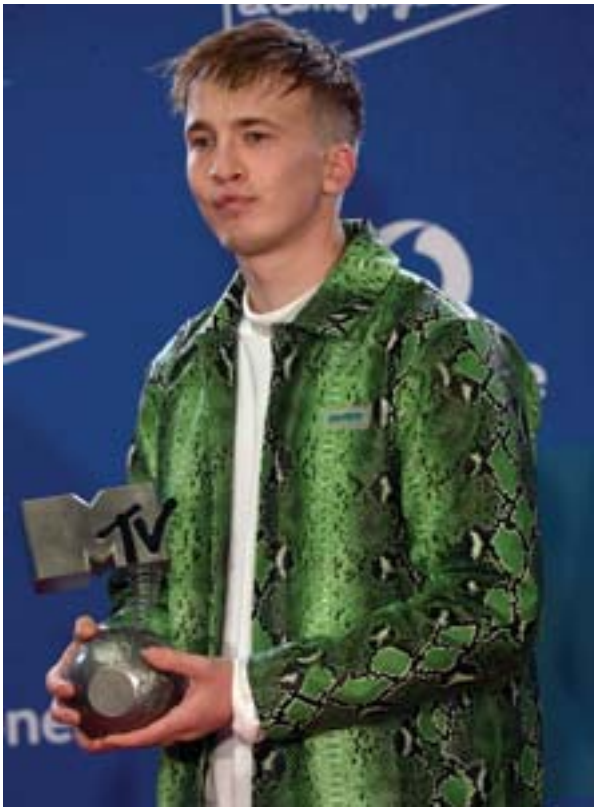
Dutch artist Snelle