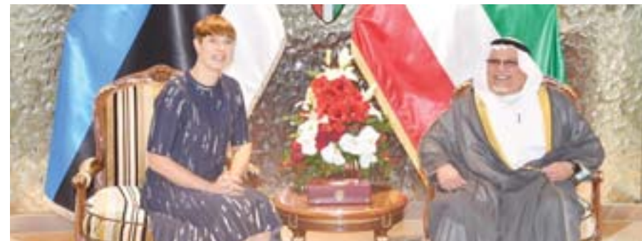
KUWAIT: Estonian President Kersti Kaljulaid is welcomed by Minister of Amiri Diwan affairs Sheikh Ali Jarrah Al-Sabah upon her arrival at the Amiri Terminal yesterday.