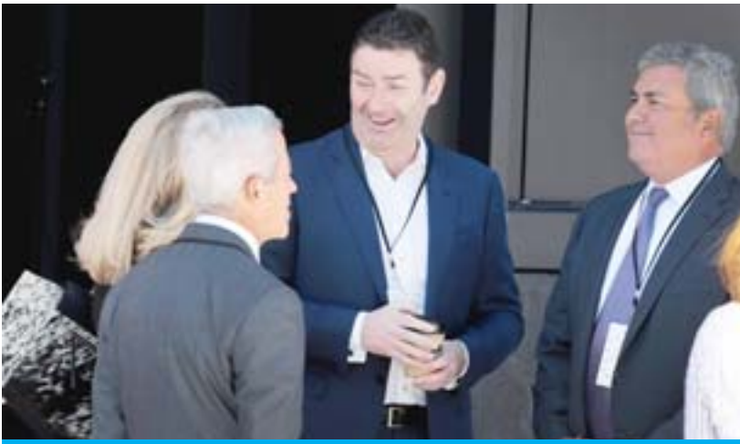
CHICAGO: In this file photo taken on June 4, 2018 McDonald's CEO Steve Easterbrook (C) chats with guests at the unveiling of the company's new corporate headquarters.