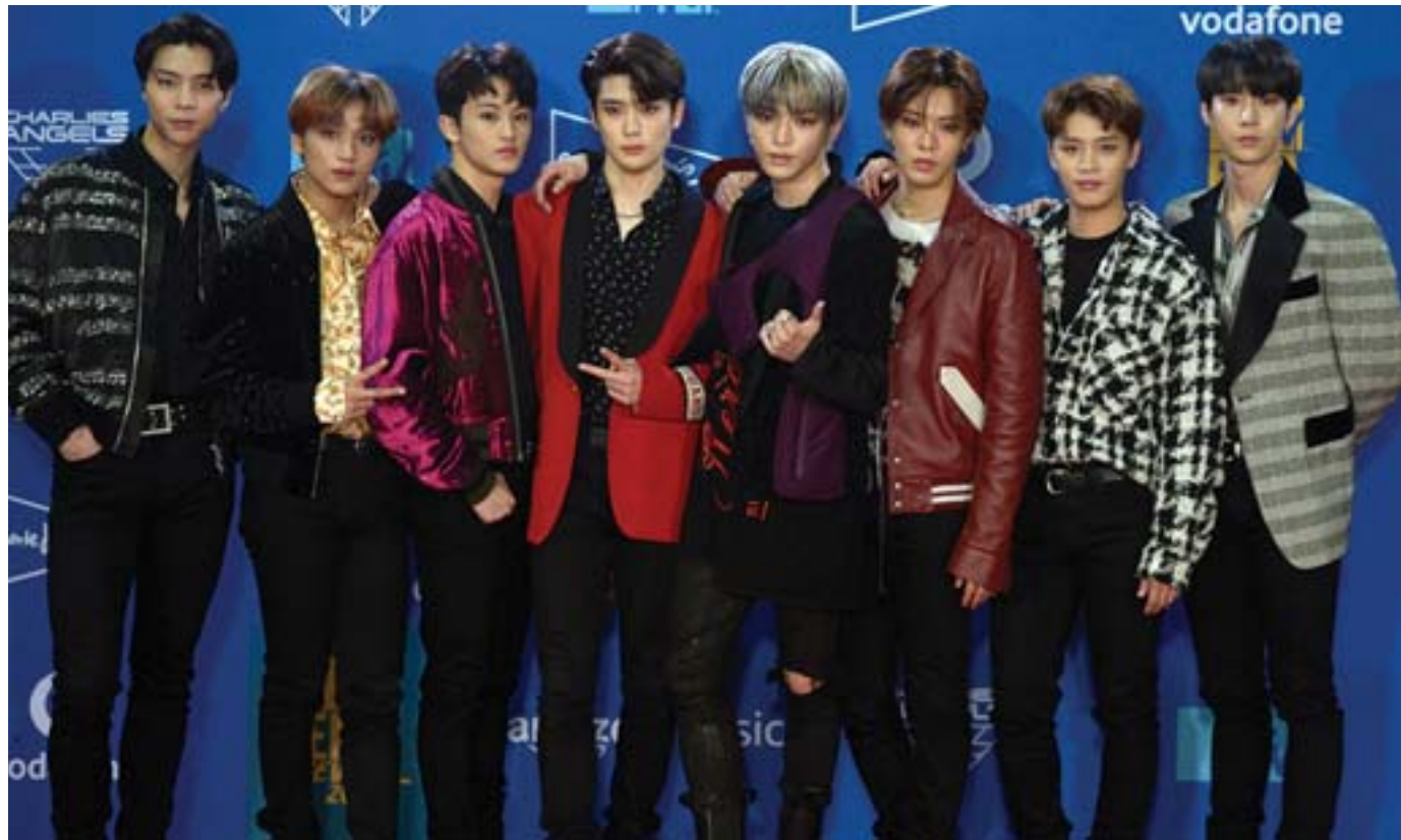
South Korean boy group NCT 127