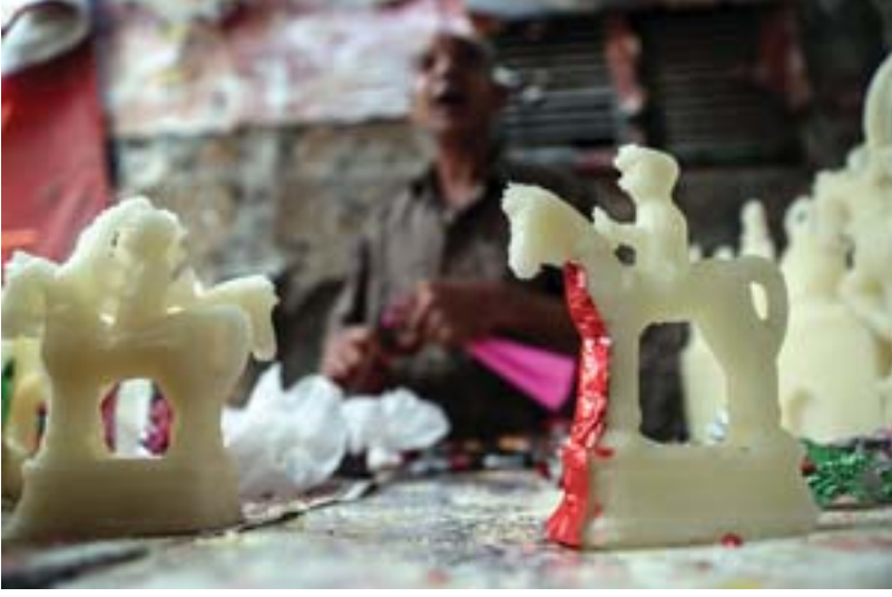
Egyptian confectioners prepare sweets at a candy factory in the capital Cairo ahead of celebrations of the Muslim Prophet Mohammed's birthday, known as 'Al Mawlid Al Nabawi.'