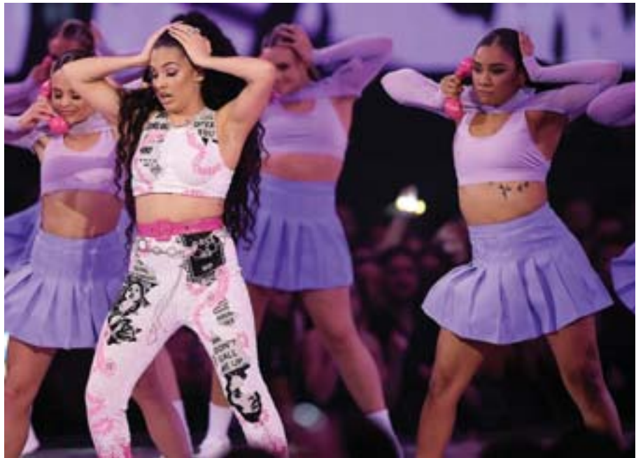
US singer Mabel