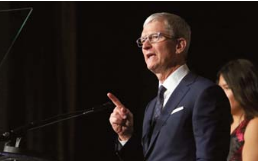
LOS ANGELES: Tim Cook speaks onstage at the GLSEN Respect Awards Los Angeles at the Beverly Wilshire Four Seasons Hotel.

construction until the houses are built and start to generate revenue. Apple and state officials hope to provide bridge financing during construction at rates below those from commercial lenders. Apple said the funding could take two years to deploy but that it hopes to recycle the funding for future projects over five years. "This unparalleled financial commitment to affordable housing, and the innovative strategies at the heart of this initiative, are proof that Apple is serious about solving this issue," California Governor Gavin Newsom said in a statement. The $2 billion in funding will be deployable across California, while the remaining $500 million will go toward efforts specific to Apple's home region in Northern California, where fast-growing tech companies have drawn protests from residents who blame them for rising housing costs. — Reuters