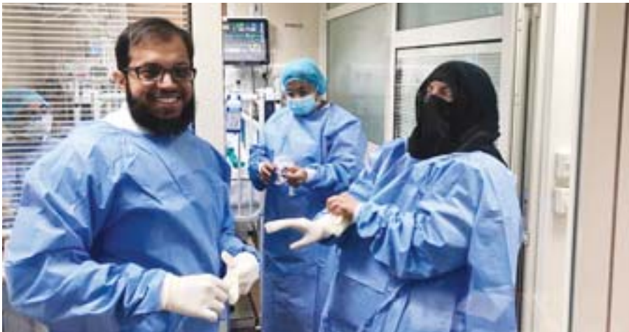
KUWAIT: (Left) Doctors prepare to inject a patient suffering from spinal muscular atrophy with Zolgensma, the world's most expensive drug (right).