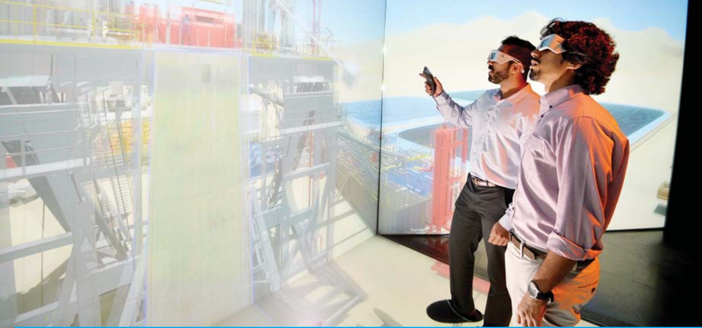
DHAHRAN: A handout picture provided by Saudi Aramco, dated December 2, 2015, shows two visitors at Aramco's Upstream Learning Development Center (UPDC).