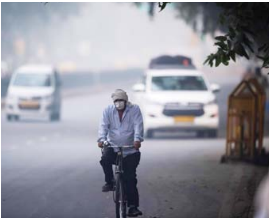
NEW DELHI: A man wearing protective face mask rides a bicycle along a street in smoggy conditions in New Delhi yesterday. — AFP

other. Kejriwal, who likened Delhi to a "gas chamber" on Friday, said the city had done its part to curb pollution and that the burning of wheat stubble residue on farms outside the capital had to be stopped. India's supreme court too stepped-in, slamming the authorities for failing to curb pollution and asked them to tighten rules against violators. But national environment minister Prakash Javadekar accused Kejriwal of politicizing the issue, while an MP from Prime Minister Narendra Modi's ruling Bharatiya Janata Party (BJP) violated the odd-even car rule as a "symbolic protest" by driving a car that was barred under the scheme. Experts warned that both state and national governments needed to go beyond short-term remedies. Stop-gap solutions "can't be a substitute for addressing the major long-term chronic sources of air pollution", Daniel Cass, from global non-profit Vital Strategies, told AFP. Changing agricultural practices, switching electricity generation sources and accelerating the conversion of home heating from charcoal to natural gas were also key measures in the pollution fight, Cass said. Siddharth Singh, a climate policy expert, said the traffic restrictions are "ineffective". "If air pollution was solely due to the vehicular traffic, then this would be a solution. Right now it cannot be a solution because motorized private transport has a very small share in the whole pie," Singh said. — AFP