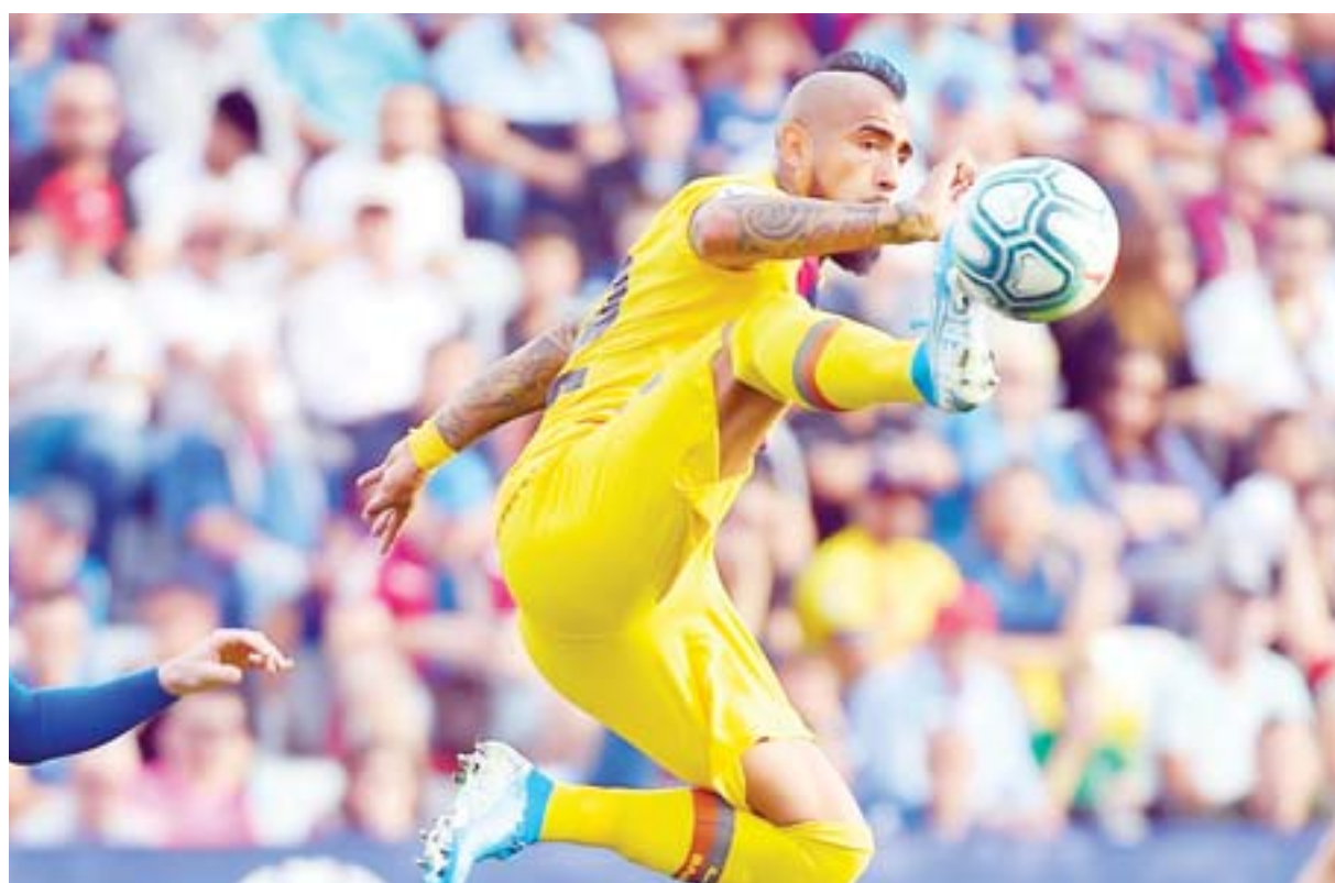
VALENCIA: Barcelona’s Chilean midfielder Arturo Vidal controls the ball during the Spanish League football match between Levante UD and FC Barcelona at the Ciutat de Valencia stadium in Valencia.