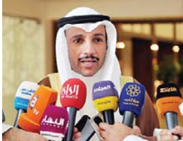
KUWAIT: National Assembly Speaker Marzouq Al-Ghanem speaks at a press conference yesterday.

The initial reaction to the bill has been negative, especially from bedoon activists and their Kuwaiti supporters, with some alleging the bill is an election campaign gimmick by Ghanem.