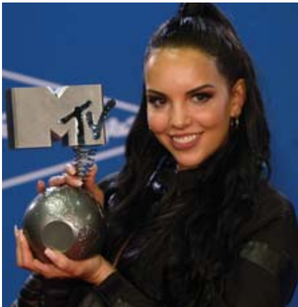
German artist Juju