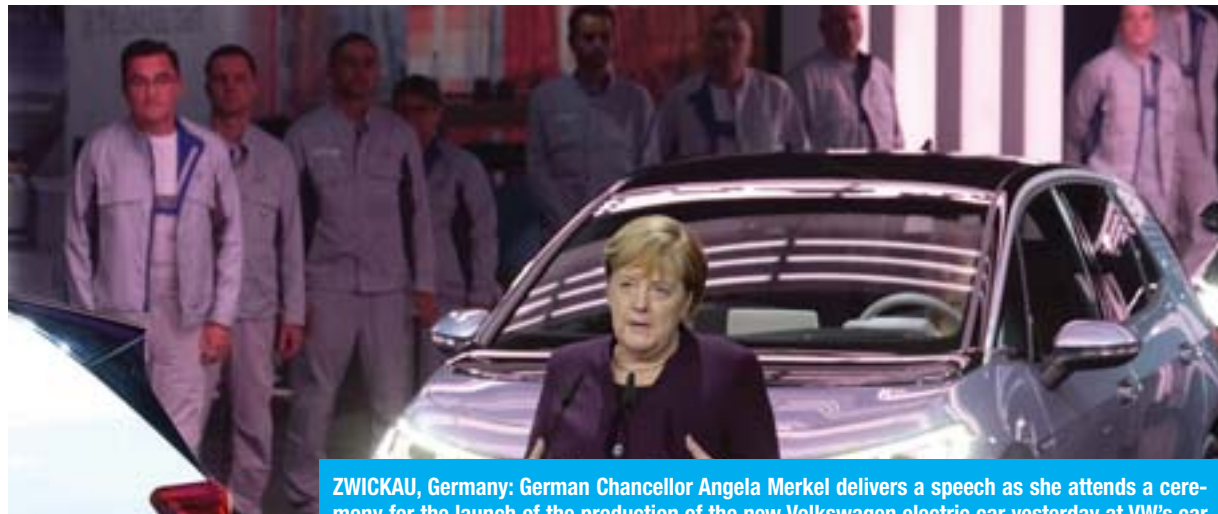
ZWICKAU, Germany: German Chancellor Angela Merkel delivers a speech as she attends a ceremony for the launch of the production of the new Volkswagen electric car yesterday at VW's car factory. — AFP

The streak stands in contrast to the situation faced by the Boeing's 737 MAX airliner, a direct rival, which has been grounded since March following two crashes that killed a total of 346 people. However Airbus has hit some turbulence of its own, with Canadian and European air safety regulators saying the A220 model should no longer use full power at high altitudes. During one Swiss flight in July parts of an A220 engine fell over France, and following incidents in September and October the airline halted all flights with the aircraft until they could be inspected. — AFP