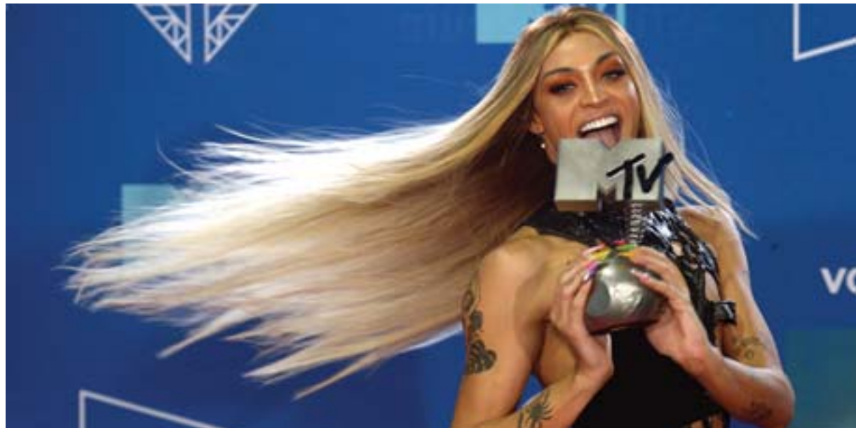
Brazilian artist Pablo Vittar poses with the Best Brazilian Music award during the MTV Europe Music Awards at the FIBES Conference and Exhibition Centre of Seville.