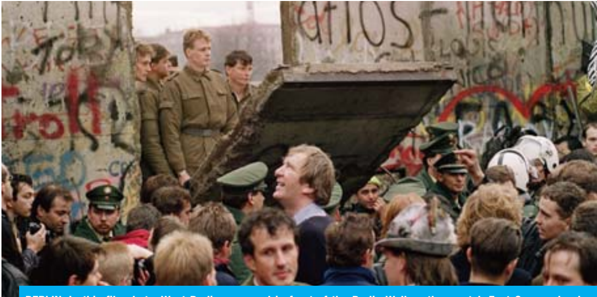
BERLIN: In this file photo, West Berliners crowd in front of the Berlin Wall as they watch East German border guards demolishing a section of the wall in order to open a new crossing point between East and West Berlin, near the Potsdamer Square in Berlin.

Against this backdrop, Guenter Schabowski is entrusted on the evening of November 9, 1989 with the mission of announcing live on television the measures