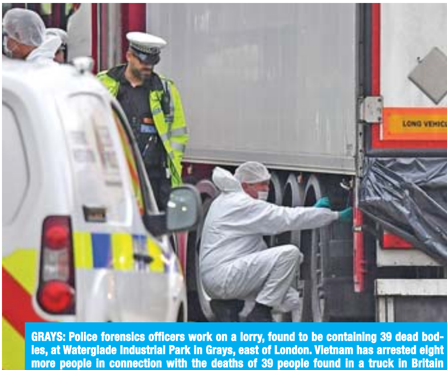
GRAYS: Police forensic officers work on a lorry, found to be containing 39 dead bodies, at Waterglade Industrial Park in Grays, east of London. Vietnam has arrested eight more people in connection with the deaths of 39 people found in a truck in Britain who are believed to be Vietnamese.

The 25-year-old Northern Irish driver of the refrigerated truck found on October 23 has been charged with