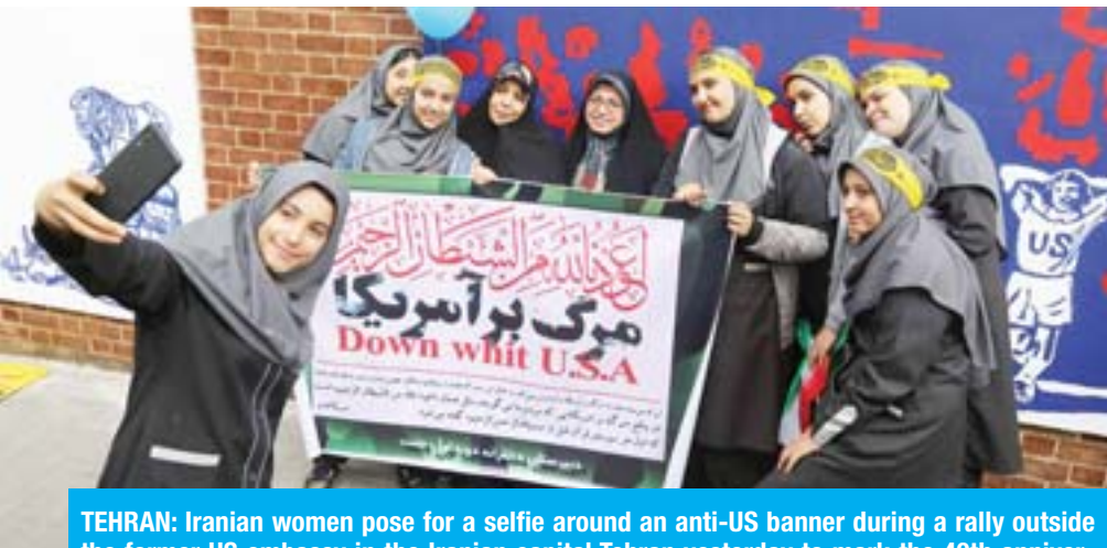
TEHRAN: Iranian women pose for a selfie around an anti-US banner during a rally outside the former US embassy in the Iranian capital Tehran yesterday to mark the 40th anniversary of the Iran hostage crisis.

Washington pulls out of the nuclear pact in May 2018 under President Donald Trump, and reinstates sanctions. In May 2019, Iran begins to disengage from its commitments under the deal, such as limiting enriched uranium and heavy water stocks. Trump announces new measures against Iran's steel and mining sectors. Tensions soar when Iran's Revolutionary Guard says in June that it shot down a US drone because it was in Iranian airspace, which Washington denies. Trump approves a retaliatory strike, but cancels it at the last minute. In July, Iran says it has enriched uranium to 4.5 percent, breaching the 2015 accord's enrichment cap.