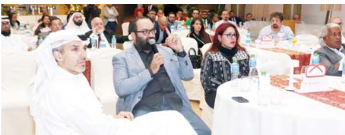
A general view of the audience.