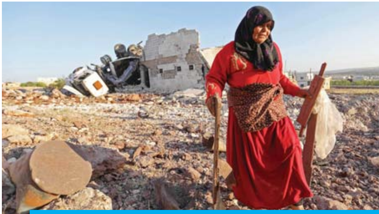
KAFRANBEL, Syria: A woman salvages items from a building that was destroyed during airstrikes by Russia in this town in Idlib province yesterday.

Abiy has won praise for his reformist agenda since taking office in April last year. Ethiopia is home to over 100 million people, the second most populous country on the continent after Nigeria, and its economy is the fastest growing in the region. However, it is also one of the poorest, and the World Bank estimates average earnings of $783 per year. —AFP