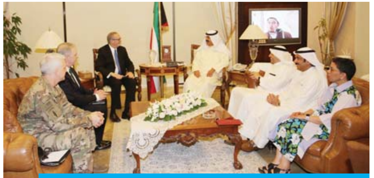
KUWAIT: Kuwaiti Deputy Foreign Minister Khaled Al-Jarallah meets with US Ambassador to Kuwait Lawrence Silverman.