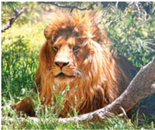
A lion rests in an enclosure at the sanctuary in Jerash, some 50 kilometers north of the Jordanian capital.