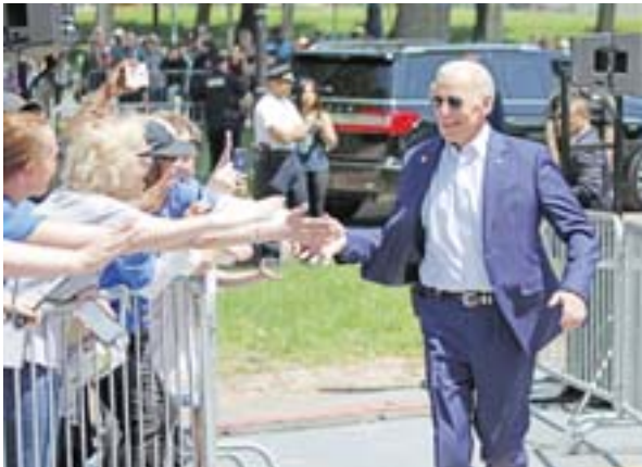
PHILADELPHIA: Former US vice president Joe Biden arrives for the kick-off of his presidential election campaign in on May 18, 2019.