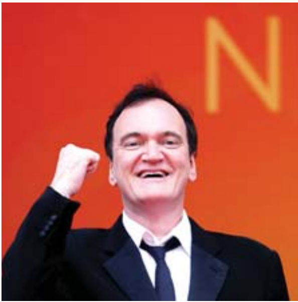
US film director Quentin Tarantino poses as he arrives for the screening of the film “The Wild Goose Lake (Nan Fang Che Zhan De Ju Hui)” at the 72nd edition of the Cannes Film Festival in Cannes, southern France.