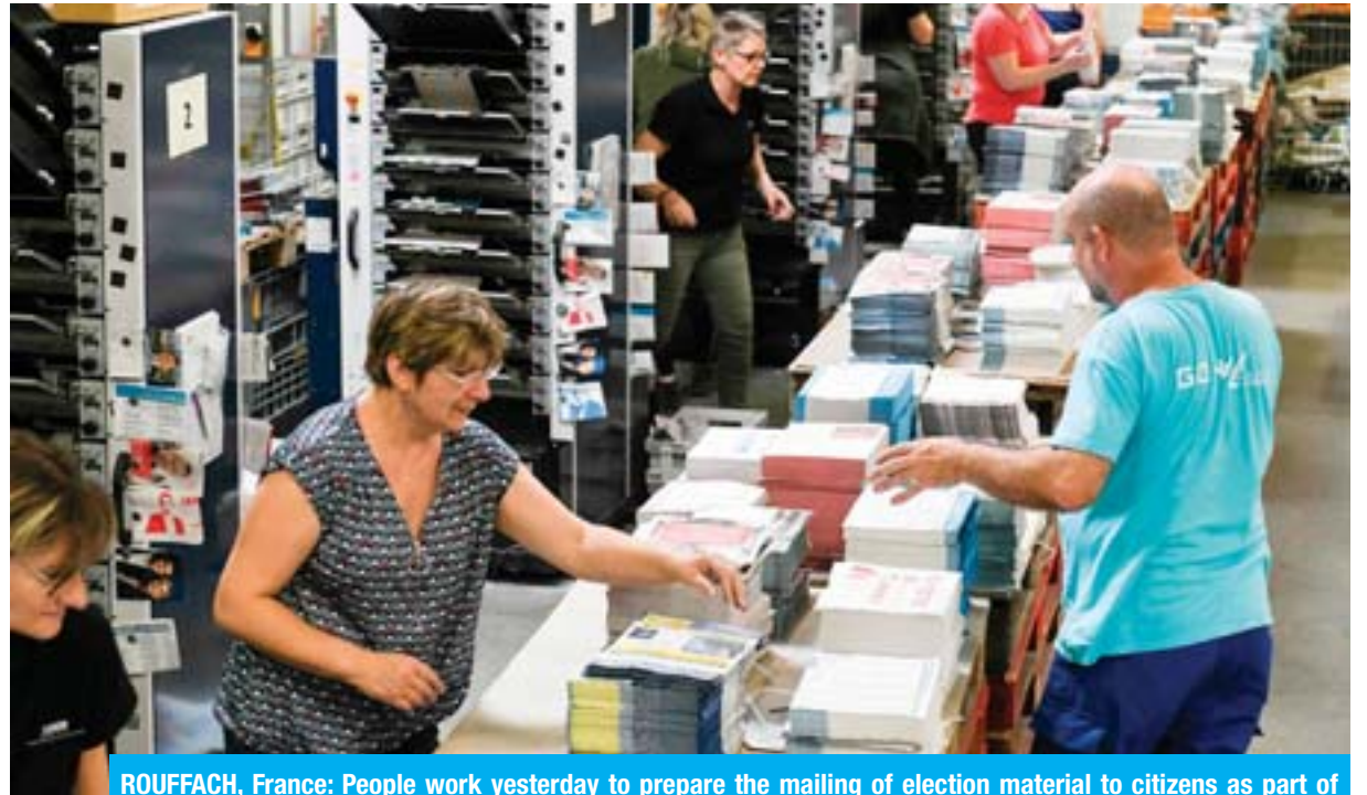
ROUFFACH, France: People work yesterday to prepare the mailing of election material to citizens as part of the upcoming European parliament elections.

No big personalities have emerged among the candidates to lead the European Commission, the top job in Brussels and one that will be assigned by Europe's national leaders. For now, only Britain is on the verge of quitting the union altogether, but eurosceptic and europhobic parties of various flavors are mounting a challenge. Polling at the start of the campaign period pointed to around 173 members being elected from these groups in the 751-member Strasbourg and Brussels assembly. And the main centre-right and centre-left groupings that have dominated pan-European