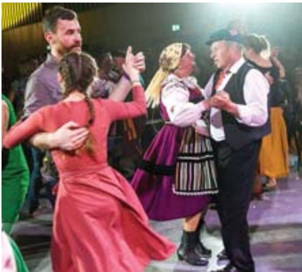
Polish couples dressed in traditional costumes and others dance the country's mazurka folk dance in Warsaw.