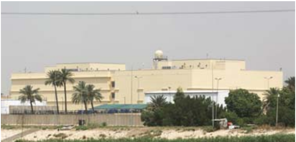
BAGHDAD: The US embassy compound is pictured in Baghdad's Green Zone yesterday in the Iraqi capital. A Katyusha rocket crashed into Baghdad's Green Zone which houses government offices and embassies including the US mission, Iraqi security services said in a statement.

The Iraq military said the Katyusha rocket fell in the middle of the Green Zone, near the Monument of the Unknown Soldier. The monument lies in open ground about half a kilometer north of the sprawling, riverside US Embassy compound. The blast was heard