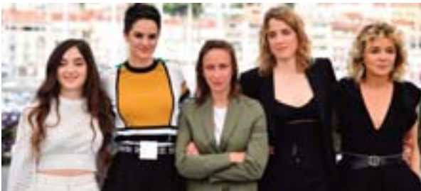
(From left) French actress Luana Bajrami, French actress Noemie Merlant, French director Celine Sciamma, French actress Adele Haenel and Italian actress and film director Valeria Golino pose during a photocall for the film ‘Portrait Of A Lady On Fire (Portrait de la Jeune Fille en Feu)’.