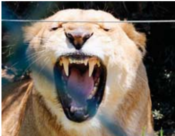
A lioness rests in an enclosure.