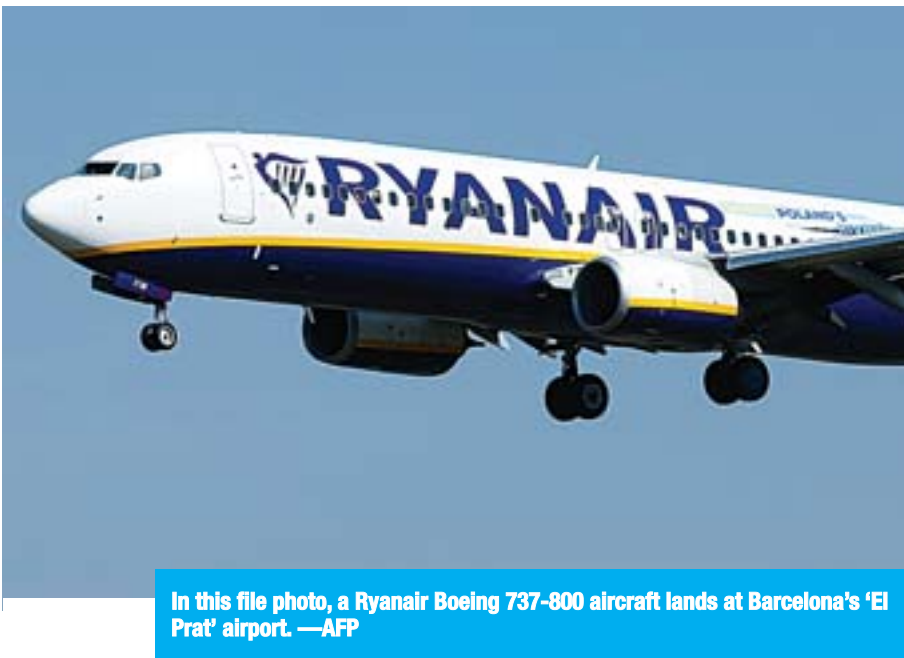
In this file photo, a Ryanair Boeing 737-800 aircraft lands at Barcelona's 'El Prat' airport.

Ryanair's recent performance has been hit also by pan-European strikes last year that forced it to cancel flights, affecting thousands of passengers, and