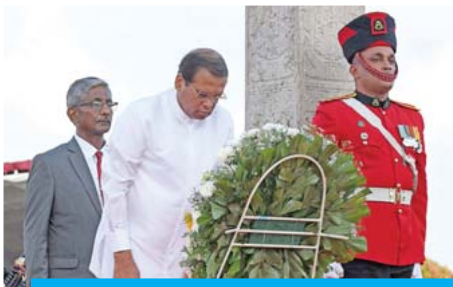
COLOMBO: Sri Lankan President Maithripala Sirisena lays a wreath for fallen soldiers during National War Heroes Day on Sunday.

Sirisena's allies say he did the best he could in a volatile situation, citing measures like temporarily shutting down social media and deploying the army to stem vio-