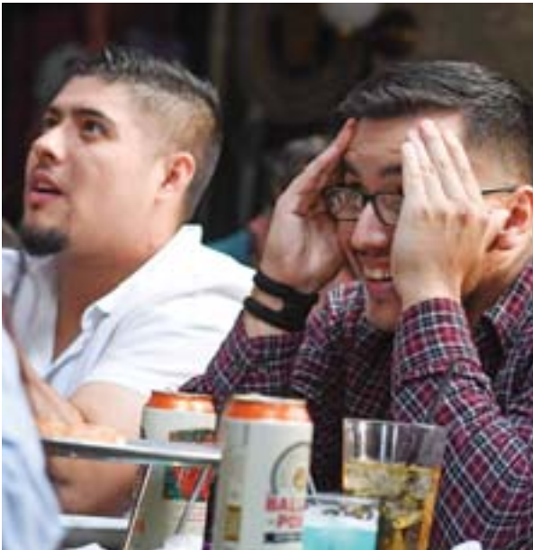
Fans react as they watch HBO's "Game of Thrones" series finale.