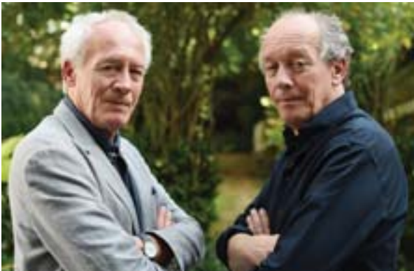
Directors Jean-Pierre and Luc Dardenne.