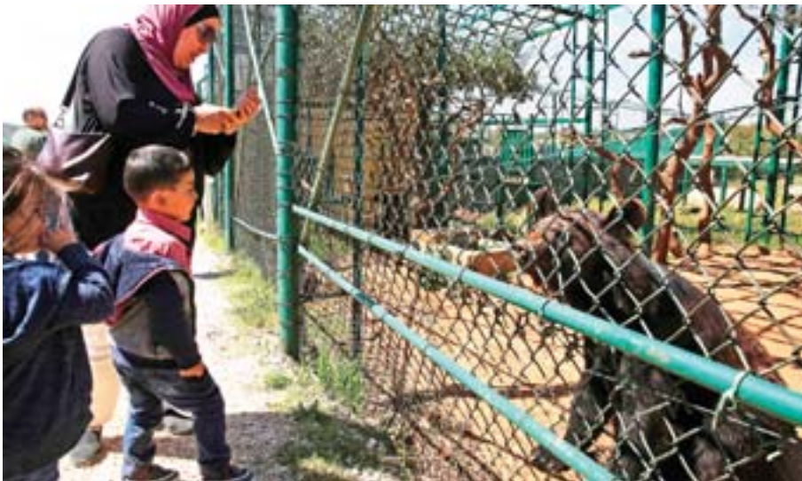
People watch a bear in an enclosure, at the sanctuary in Jerash, some 50 kilometers north of the Jordanian capital.