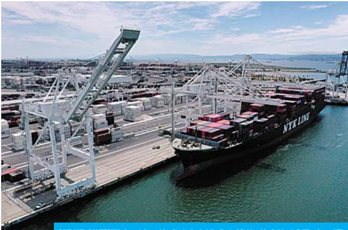
OAKLAND, CALIFORNIA: A container ship sits docked at the Port of Oakland in Oakland, California.

At the time, 6 percent of respondents said they were moving or had moved production out of China as a result of the tariffs, and 4 percent said they were