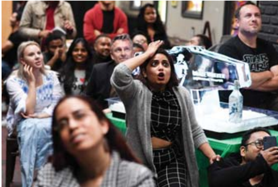
Fans react as they watch HBO's "Game of Thrones" series finale at a viewing party at Brennan's bar in Marina del Rey, California.