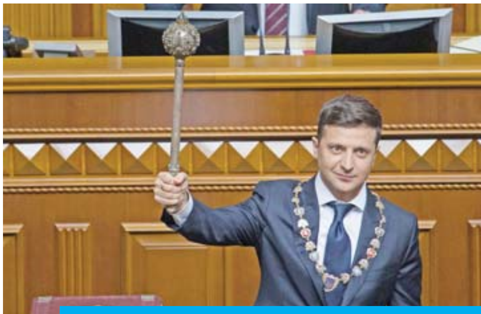
Kiev: Ukraine's President Volodymyr Zelensky holds the Bulava, the Ukrainian symbol of power, during his inauguration ceremony at the parliament yesterday.

Despite his everyman image, critics accuse Zelensky of having too close a relationship with a powerful businessman, Ihor Kolomoisky, whose TV channel broadcasts his comedy shows. Zelensky has rejected those accusations. Zelensky also said he wanted to replace the head of the state security service, the general prosecutor and the defense minis-