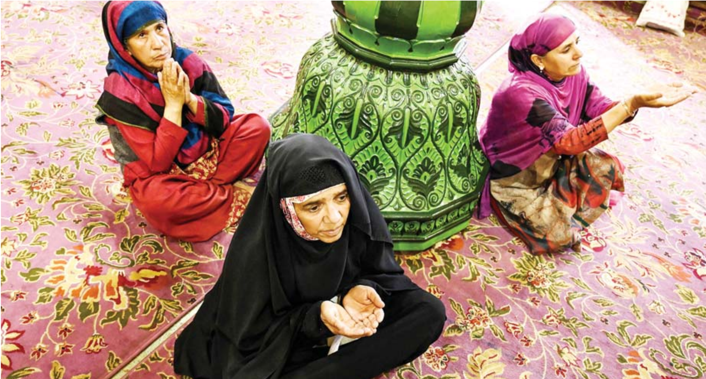
KASHMIR: Kashmiri Muslims gesture as they pray at the Sheikh Abdul Qadir Geelani Shrine during the holy month of Ramadan in Srinagar yesterday. Muslims around the world abstain from eating, drinking and conducting sexual relations from sunrise to sunset during Ramadan, the holiest month in the Islamic calendar.