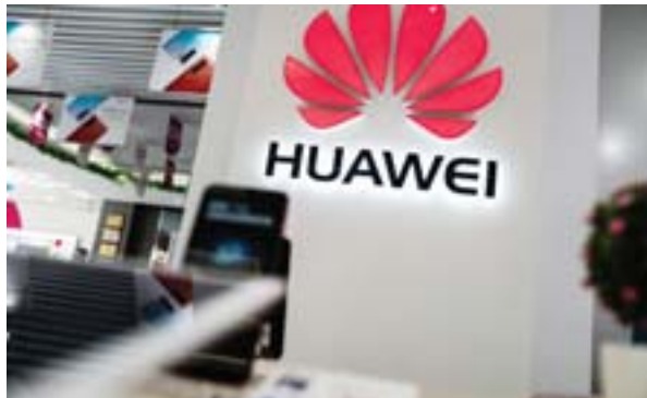
BEIJING: A Huawei logo is displayed at a retail store in Beijing. US internet giant Google said it was beginning to cut ties with China's Huawei, which Washington considers a national security threat.

software ecosystem,” Huawei, which aspires to leapfrog Samsung to be the world's biggest smartphone maker, said. “As one of Android's key global partners, we have worked closely with their open-source