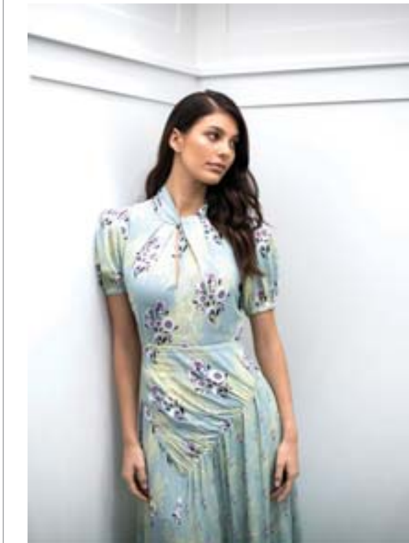
US model and actress Camila Morrone poses during a photo session for the film "Mickey and the Bear" during the 72nd edition of the Cannes Film Festival in Cannes, southern France.