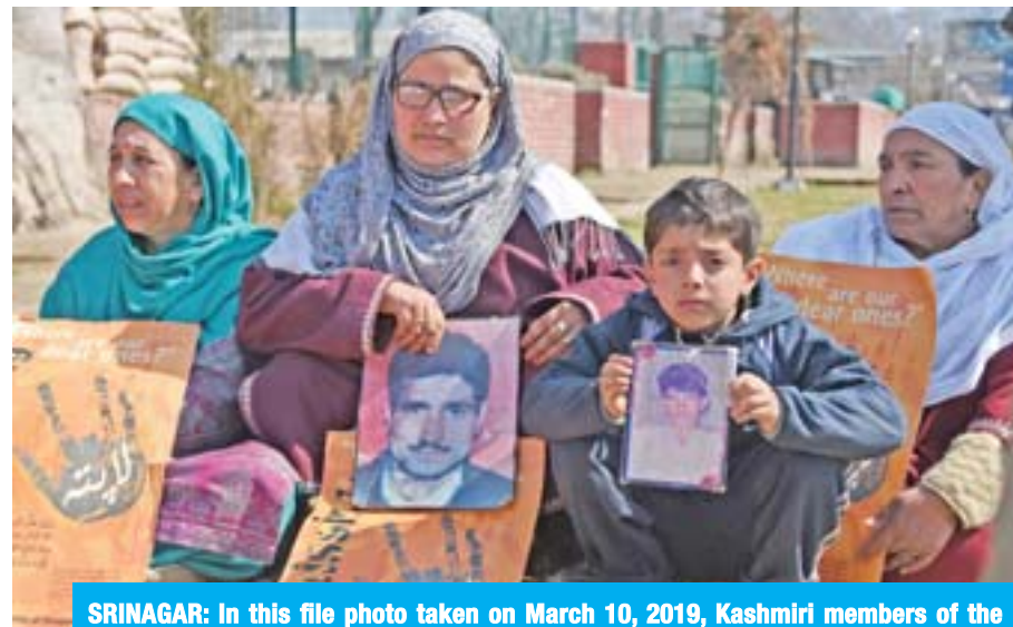
SRINAGAR: In this file photo taken on March 10, 2019, Kashmiri members of the Association of Parents of the Disappeared (APDP) take part in a protest demanding information on their missing loved ones.