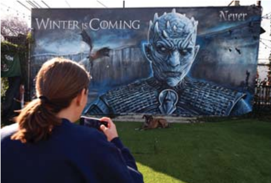
A woman takes a photo of her dog in front of a "Game of Thrones" mural outside Brennan's bar before a viewing party for HBO's "Game of Thrones" series finale in Marina del Rey, California.