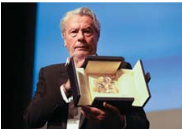
French actor Alain Delon poses with the Honorary Palme d'Or he was awarded during the 72nd edition of the Cannes Film Festival in Cannes, southern France, on May 19, 2019.

Longoria told reporters at another red carpet party in the southern French city on Sunday that she "understood how it could upset some people." But Cannes' festival organizers defended their choice, saying Delon was "not perfect" but was being recognized for his acting career. Some fellow actors have also come to Delon's defense. "What Alain Delon says is his own busi-