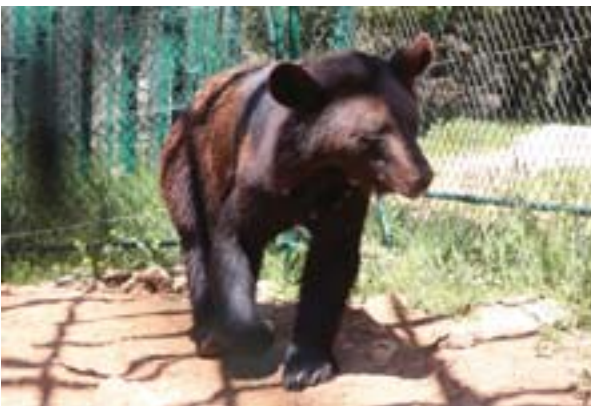
A black bear walks around an enclosure.