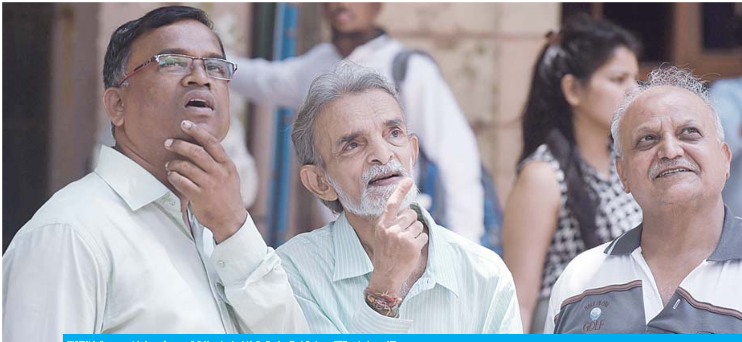
MUMBAI: Indian men watch share prices on a digital broadcast outside the Bombay Stock Exchange (BSE) yesterday.