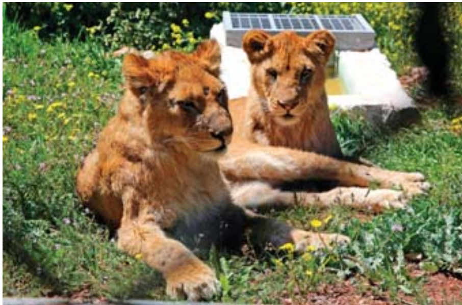
Lionesses rest in an enclosure.