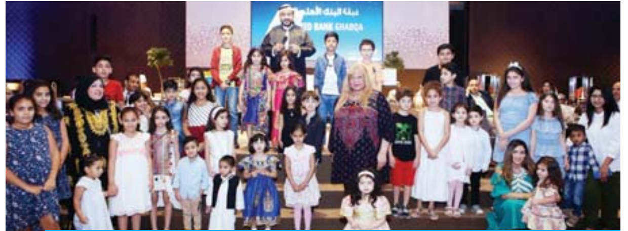
AUB employees' children at the ghabqa.