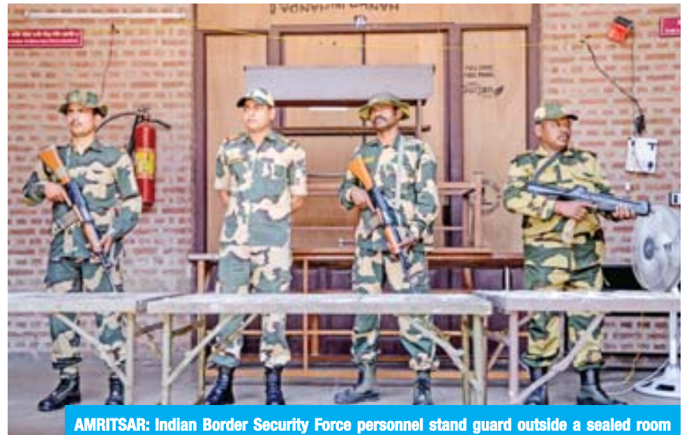
AMRITSAR: Indian Border Security Force personnel stand guard outside a sealed room where electronic voting machines (EVM) are kept after the 7th and final phase of the India's general election at Khalsa College yesterday.