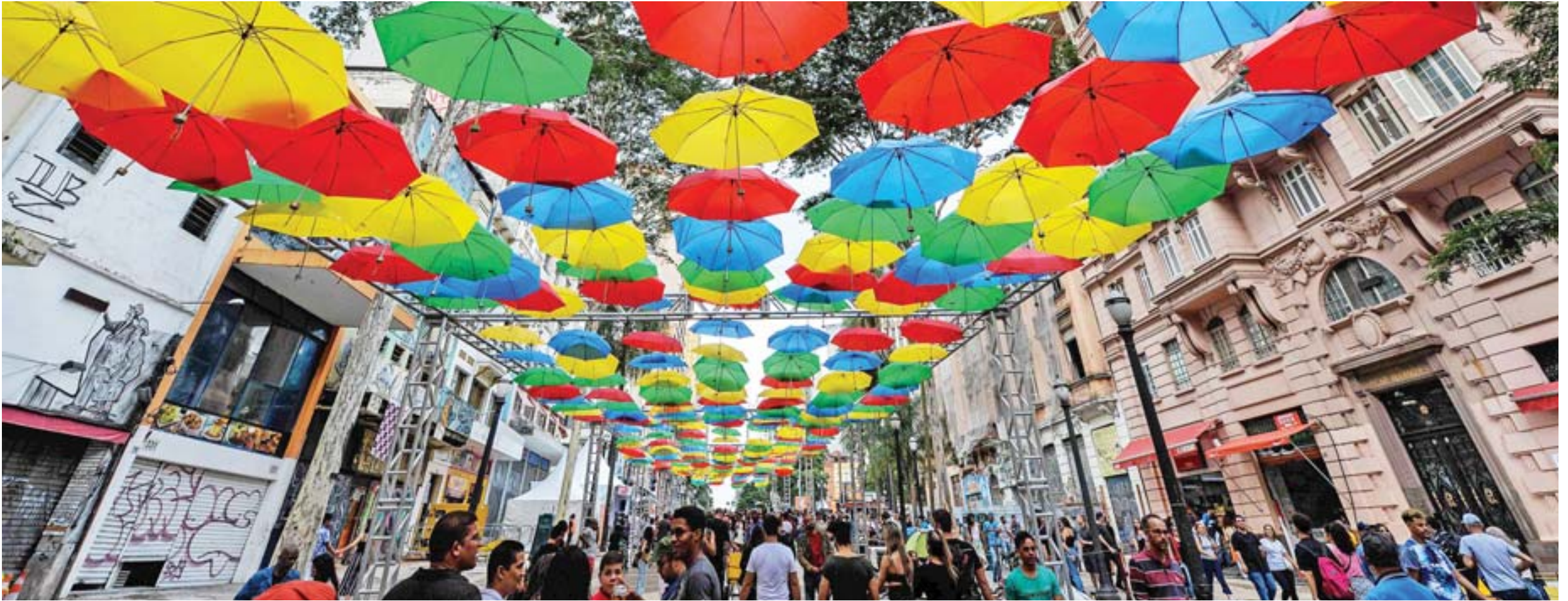
Umbrellas' art installation are displayed during the annual 'Virada Cultural' event, in Sao Paulo, Brazil. The Virada Cultural festival offers 24 hours of uninterrupted attractions in stages around the city, such as music, dance, theatre, exhibitions of art and history and other forms of expression.