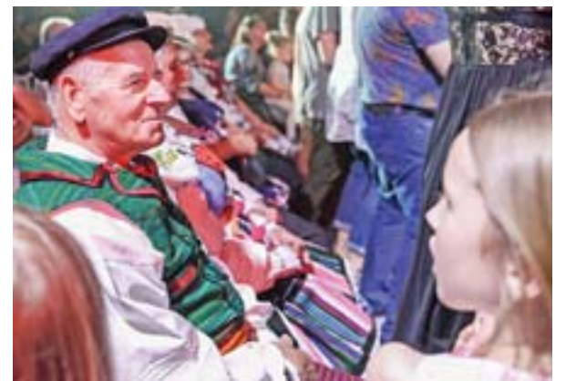
A young girl watches a couple dressed in traditional costume during the Mazurkas of the World festival.

Similarly, a couple of decades later, Polish insurgents who lost the struggle against the army of the Russian tsar fled to France, taking the mazurka. In France, the dance became fashionable, changing and evolving as it was adapted to local tastes. Meanwhile, back in the Polish