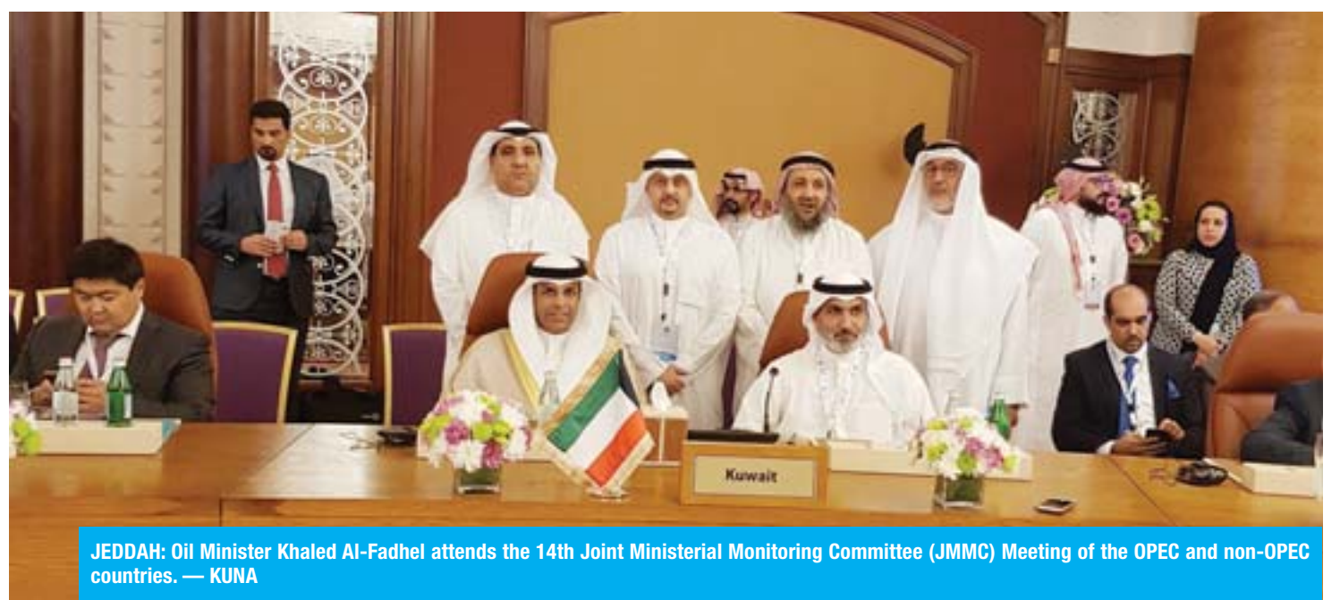
JEDDAH: Oil Minister Khaled Al-Fadhel attends the 14th Joint Ministerial Monitoring Committee (JMMC) Meeting of the OPEC and non-OPEC countries.