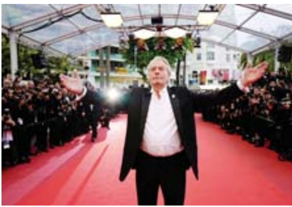
French actor Alain Delon waves as he arrives to be awarded with an Honorary Palme d'Or at the 72nd edition of the Cannes Film Festival in Cannes, southern France.