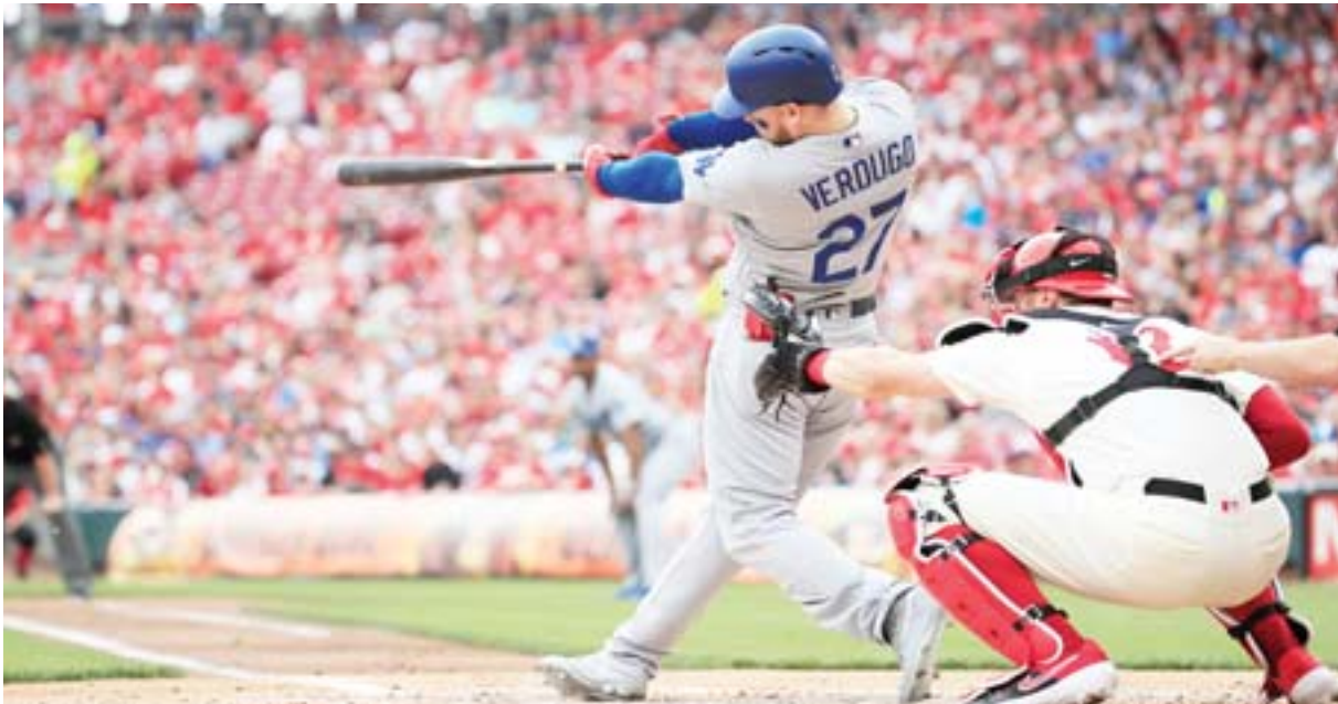
CINCINNATI: Alex Verdugo #27 of the Los Angeles Dodgers hits a RBI double in the second inning against the Cincinnati Reds at Great American Ball Park in Cincinnati, Ohio.

Danny Duffy allowed one run over six innings to win his third consecutive start, and Hunter Dozier had a two-run double as Kansas City snapped a four-game losing streak with a victory over Los Angeles in Anaheim, Calif. Nicky Lopez and Adalberto Mondesi both went 2-for-5 with a run scored for the Royals, who won for just the second time in their last eight games. Duffy (3-1) allowed five hits and three walks while striking out five. Scott Barlow,