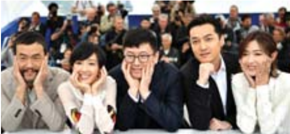
(From left) Chinese actor Liao Fan, Chinese actress Gwei Lun Mei, Chinese director Diao Yinan, Chinese actor and singer Hu Ge and Chinese actress Wan Qian pose during a photocall for the film “The Wild Goose Lake (Nan Fang Che Zhan De Ju Hui)”.