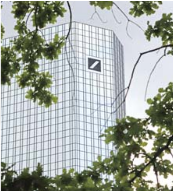
The headquarters of German bank Deutsche Bank in Frankfurt am Main, western Germany.

enhanced our controls in recent years and take compliance with the anti-money-laundering laws very seriously,” the Deutsche spokesman said. While the lender has boosted its compliance staff to around 3,000 people spread around the world, its per-formance in pursuing financial crime has failed to satisfy some authorities. Last year, German market watchdog Bafin took the unprecedented step of naming audit firm KPMG as an independent supervisor of Deutsche’s progress on squeezing out money-laundering and other illicit activi-ties. That role has been extended to cover so-called “cor-respondent banking” after Deutsche was drawn into a massive money-laundering scandal around Denmark’s Danske Bank.