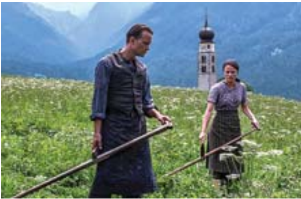
A still from the movie A hidden life for American master Terrence Malick.

Sibyl French director Justine Triet depicts a burnt-out psychotherapist who becomes inspired by working with a distressed young actress played by Adele Exarchopoulos, star of the Cannes-winning 2013 lesbian drama “Blue is the Warmest Color”.