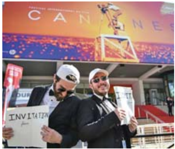
Outside the Palais de Festival, there are always dozens of fans looking for tickets.