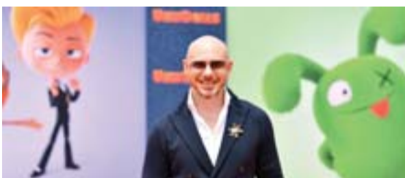
Pitbull attends STX Films World Premiere of "UglyDolls".

An animated film about misfit toys seems an unlikely fit for a smooth reggaeton rapper, but Pitbull is front and center in "UglyDolls" and he loves the message it sends. The film, which opens Friday in North America, tells the story of toys who have been discarded for not being "perfect"—and the resolve of one doll, Moxy (singer Kelly Clarkson), to be loved by a child someday. "Perfection doesn't exist and what I want for young people, for kids, is for them to appreciate what it is to be different, that it's something good," Pitbull, who plays UglyDog in the film, told AFP in an interview.