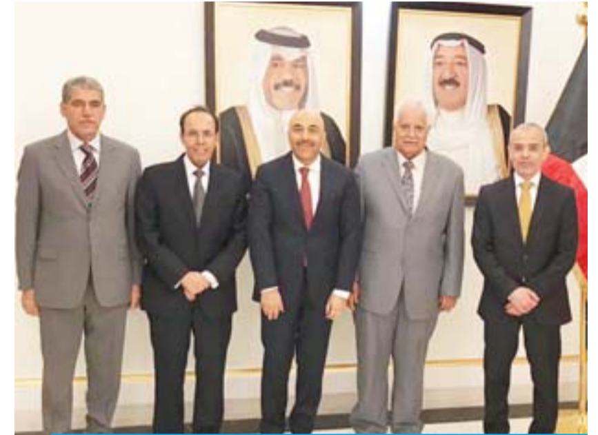
PARIS: Members of the Kuwaiti academic evaluation body pose for a group picture with Kuwait's ambassador.

PARIS: A Kuwaiti state academic evaluation body is visiting France to determine the appropriate higher education establishments and programs intended for Kuwaiti scholarships in the upcoming fiscal year. The national academic evaluation and education quality control body is currently conducting its final assessment for France and other