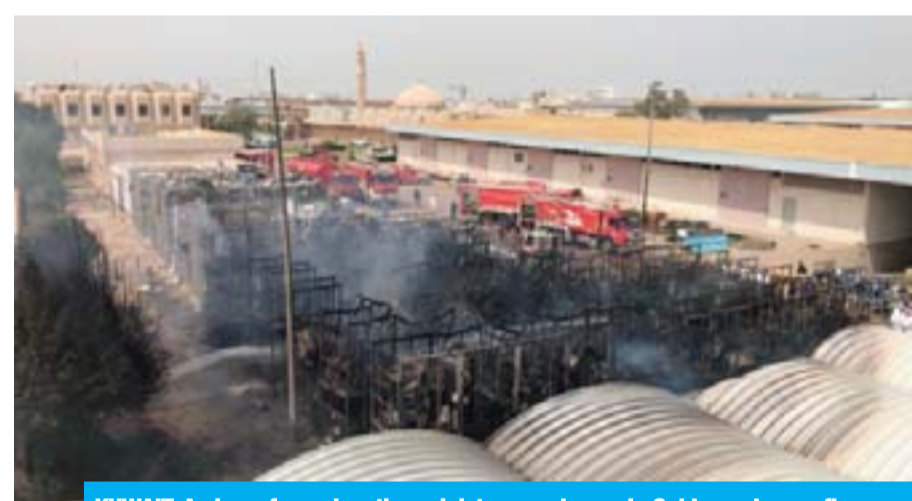
KUWAIT: A view of an education ministry warehouse in Subhan where a fire was reported.