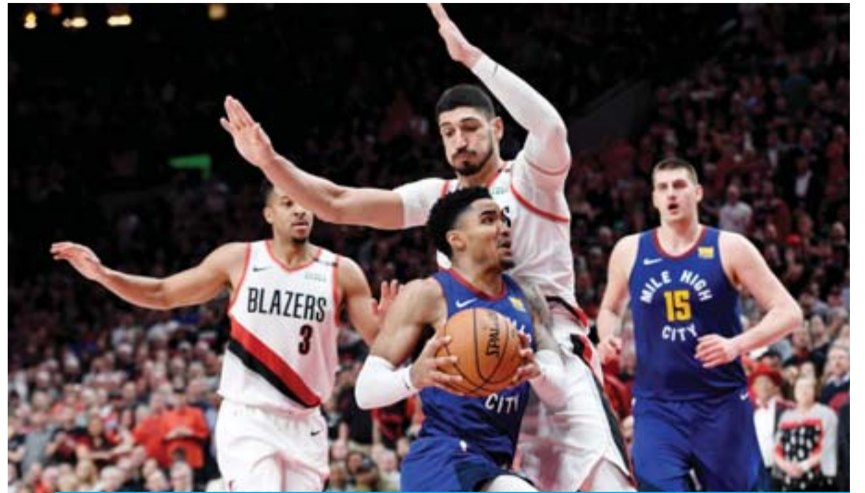
PORTLAND: Jamal Murray #27 of the Denver Nuggets drives to the basket on Enes Kanter #00 of the Portland Trail Blazers during the second overtime of game three of the Western Conference Semifinals at Moda Center in Portland, Oregon.

They connected on 11 of 18 from the field with Milwaukee guard George Hill draining a pair of three-pointers in a 12-0 scoring run. Boston scored 31 points in the period, but Milwaukee held the Celtics without a