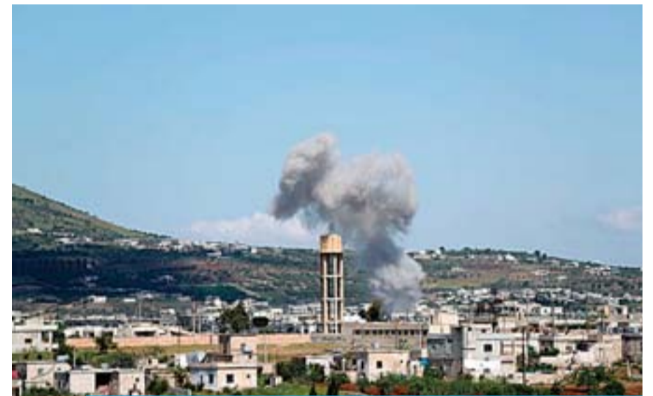
BASAMIS, Syria: Smoke billows following bombardment by regime forces on this village in Idlib province yesterday.

Trump's tone came in stark contrast to that of his top advisors, in particular