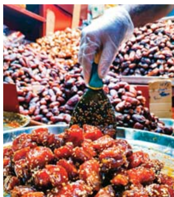
KUWAIT: The dates market at Kuwait's old traditional Souq Al-Mubarakiya gets busy as the holy month of Ramadan approaches. The fruit, which has many tasty varieties throughout the Gulf region, is a crucial opener for the break of fast at sunset, following in the example of the Prophet Muhammad (PBUH).