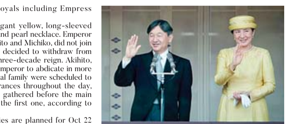
TOKYO: Japan's Emperor Naruhito and Empress Masako make their first public appearance after ascending to the throne at the Imperial Palace yesterday.