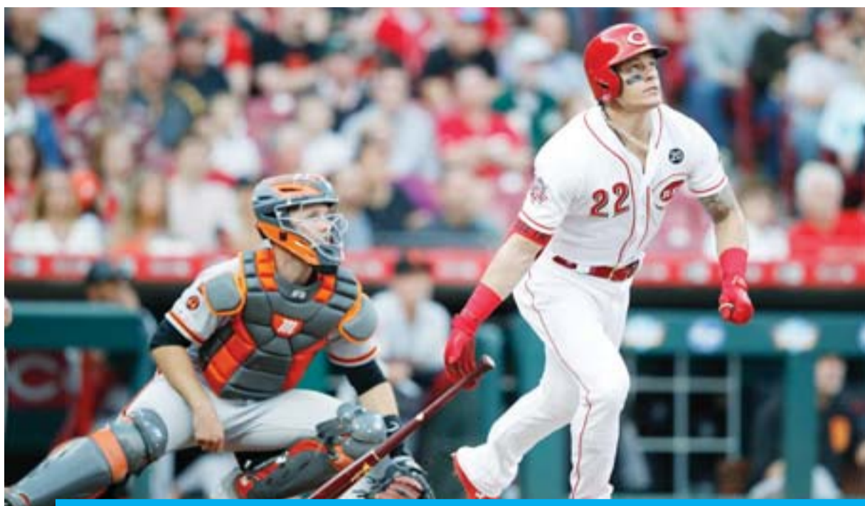
CINCINNATI: Derek Dietrich #22 of the Cincinnati Reds hits a three-run home run in the first inning against the San Francisco Giants at Great American Ball Park in Cincinnati, Ohio.

Tyler Glasnow pitched seven innings, Mike Zunino hit a three-run homer, and visiting Tampa Bay beat Baltimore in the opener of a three-game series. Glasnow, the American League Pitcher of the Month for April, improved to 6-0 while allowing three hits and striking out eight without a walk. The 25-year-old lowered his AL-leading ERA to 1.47 as the Rays topped the Orioles. Glasnow matched his longest outing of the season. All five Baltimore hits were singles, and the Orioles didn't get a runner to second base. Tommy Pham had three hits and drove in two runs for the Rays, and Brandon Lowe, Avisail Garcia and Willy Adames each