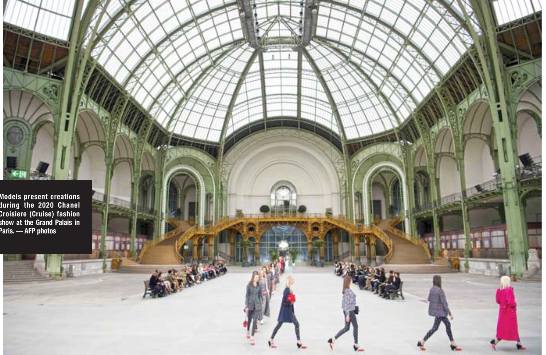
Models present creations during the 2020 Chanel Croisiere (Cruise) fashion show at the Grand Palais in Paris.