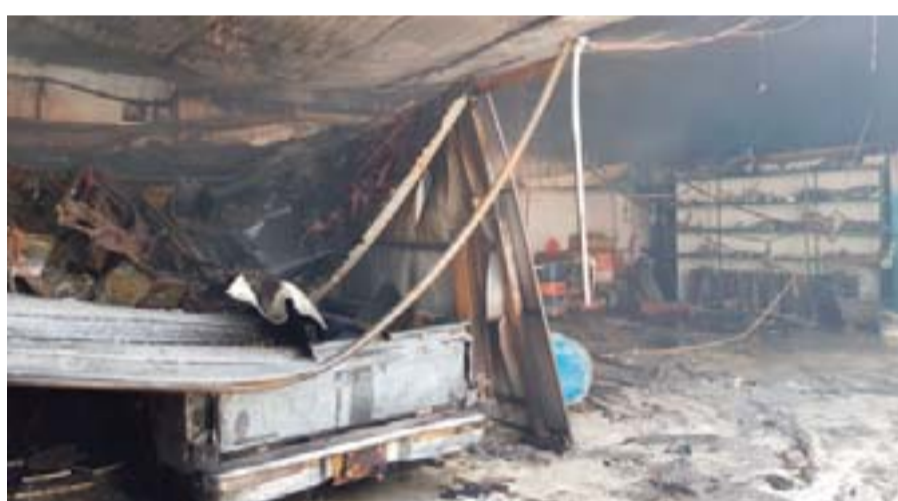
Heavy damage inside a Fahaheel garage left by a fire.