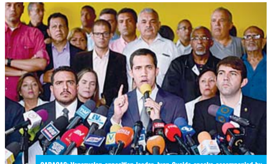
CARACAS: Venezuelan opposition leader Juan Guaido speaks accompanied by lawmakers of the parliament during a press conference at the New Time Party headquarters in Los Palos Grandes neighborhood on Friday.