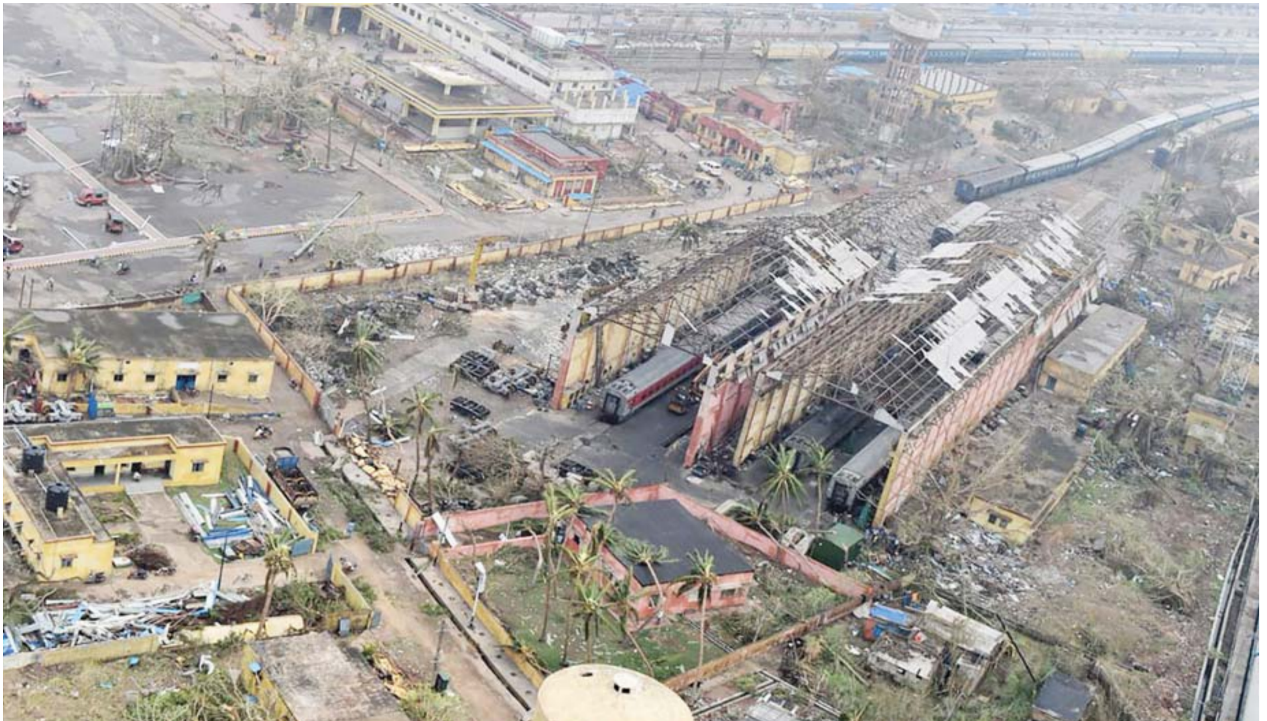
PURI, India: This aerial handout photograph released yesterday shows storm damage near the railway station in this city in India's eastern Odisha state.