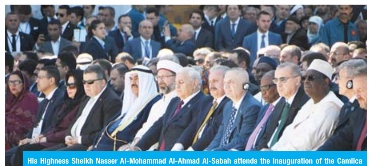
His Highness Sheikh Nasser Al-Mohammad Al-Ahmad Al-Sabah attends the inauguration of the Camlica Mosque in Istanbul.

Highness the Amir. Erdogan, in turn, to His Highness the Amir's representative.