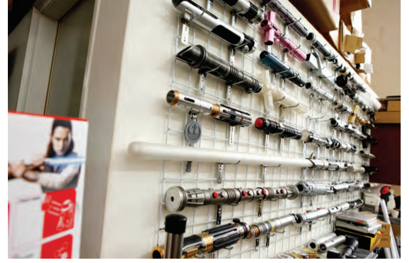
Replica Star Wars lightsabers at Makoto Tsai's workshop in New Taipei City.