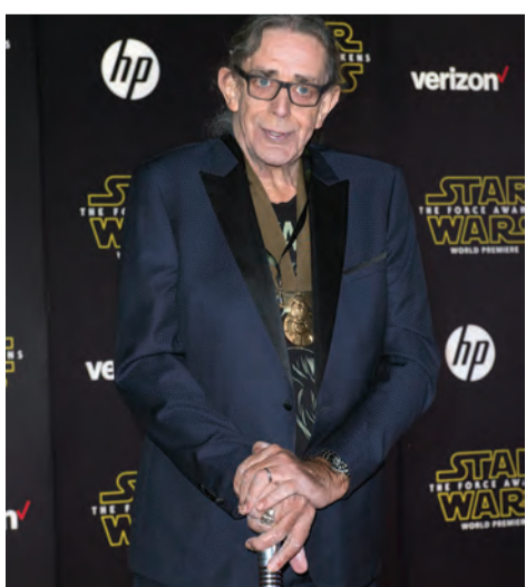
In this file photo actor Peter Mayhew attends the World Premiere of “Star Wars: The Force Awakens”, in Hollywood, California.