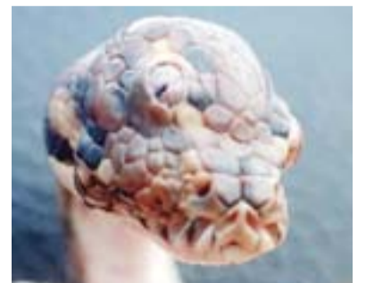
DARWIN: This handout picture taken on March 27, 2019 shows a three-eyed snake after a ranger found it on the Arnhem highway near the town of Humpty Doo.

SYDNEY: A three-eyed snake found slithering down a road in the northern Australian town of Humpty Doo has sparked amusement in a country already accustomed to unusual wildlife. Rangers dubbed the unusual serpent "Monty Python" after finding it on a highway in late March. X-rays showed all three of its eyes were functioning and the extra socket likely developed naturally while the snake was an embryo, the Northern Territory Parks and Wildlife Commission said in a Facebook post,