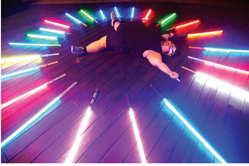
Makoto Tsai posing for photographs with lightsabers during an event to promote the upcoming unofficial Star Wars Day in Taipei.