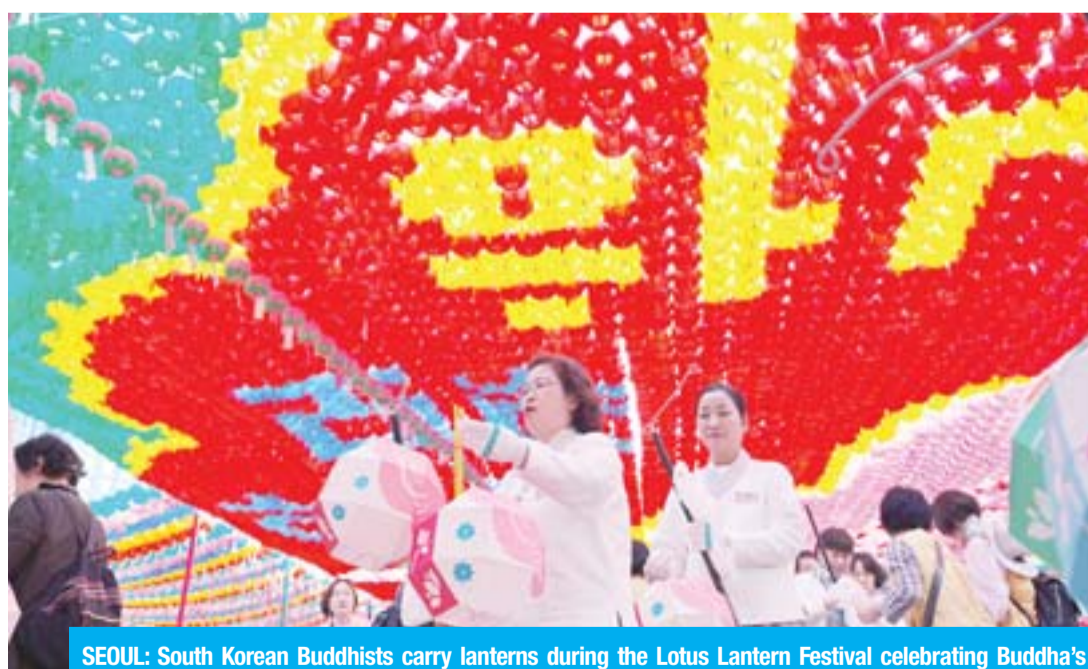
SEOUL: South Korean Buddhists carry lanterns during the Lotus Lantern Festival celebrating Buddha's upcoming birthday at Jogyesa Temple yesterday.

The latest firing comes just a day after South Korean Foreign Minister Kang Kyung-wha said Pyongyang should show "visible, concrete and substantial" denuclearization action if it wants sanctions relief. That issue was also at the center of the February talks in Hanoi, where North Korea