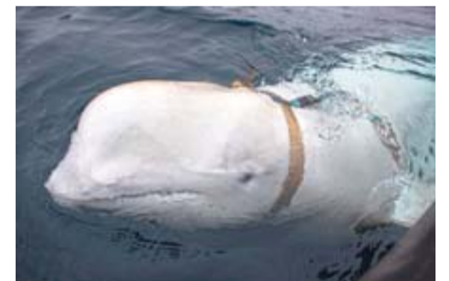
This handout picture released by Norwegian Directorate of Fisheries (Sea Surveillance Service) shows a white whale wearing a harness, which was discovered by fishermen off the coast of northern Norway.