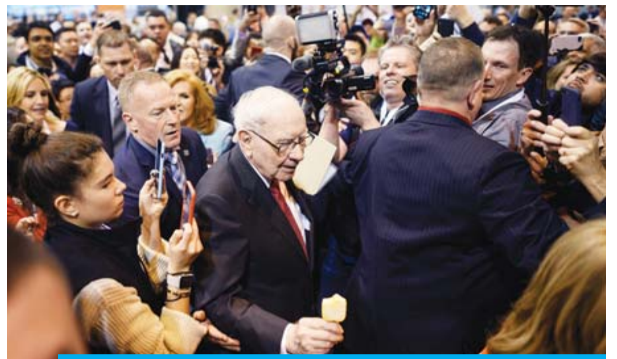
Warren Buffett (C), CEO of Berkshire Hathaway, is surrounded by press and fans as he arrives at the 2019 annual shareholders meeting in Omaha, Nebraska yesterday.