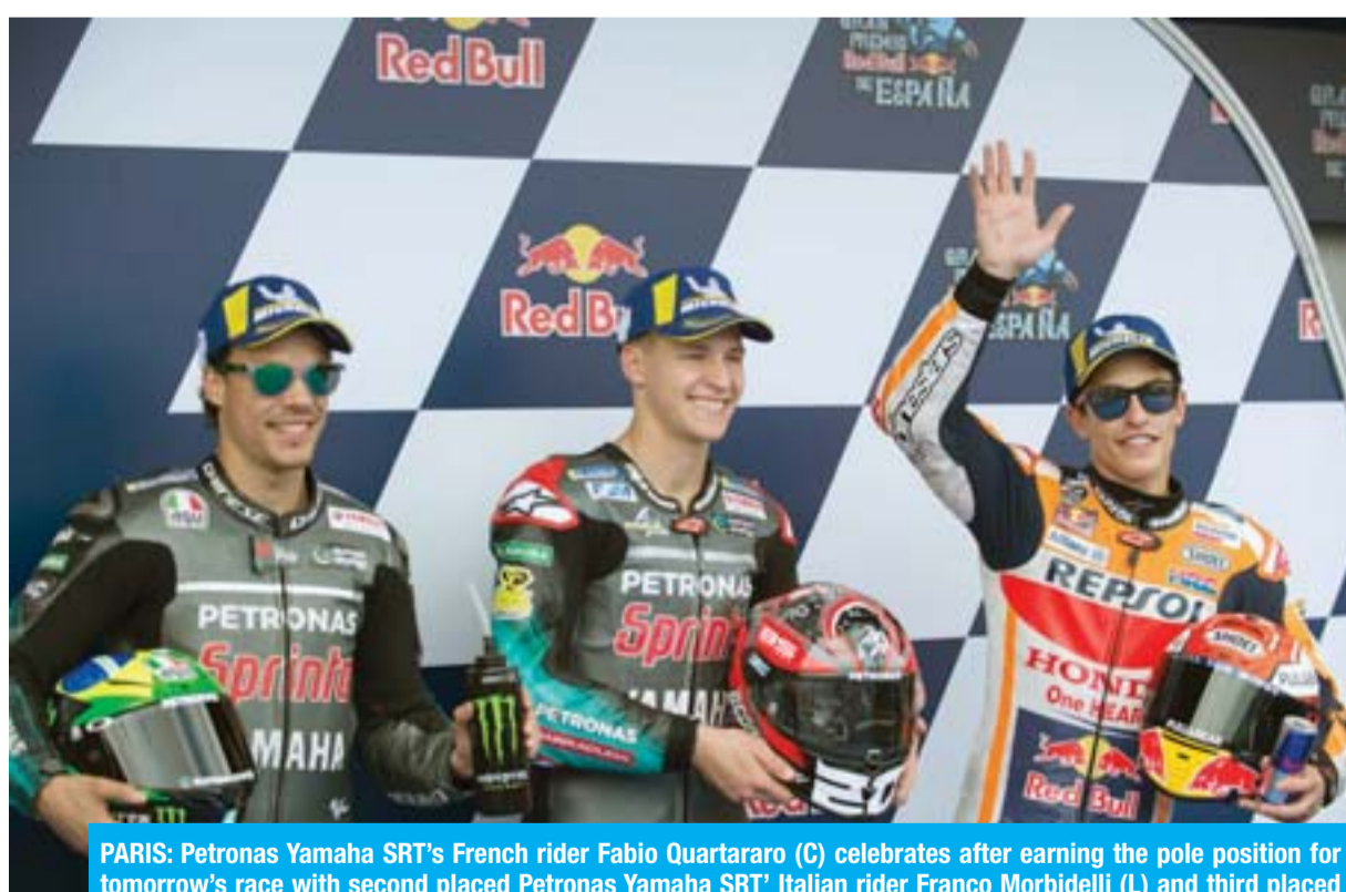
PARIS: Petronas Yamaha SRT's French rider Fabio Quartararo (C) celebrates after earning the pole position for tomorrow's race with second placed Petronas Yamaha SRT Italian rider Franco Morbidelli (L) and third placed Repsol Honda Team's Spanish rider Marc Marquez during the MotoGP qualifying session of the Spanish Grand Prix at the Jerez - Angel Nieto circuit in Jerez de la Frontera yesterday.

But a wayward tee shot on the par-three 12th produced his first blemish when he failed to get up and down and it precipitated a run of four consecutive bogeys as his lead evaporated to the groans of the huge home galleries tracking his every move.