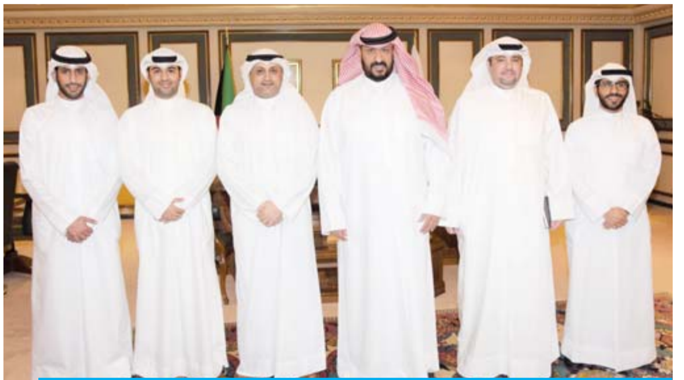
Capital Governor in between the Baitak team

KFH voluntary team will be present at different places to meet the public directly and distribute Ramadan presents and confectionaries (Qerqe'an) at different places. KFH will organize several visits to health centers, hospitals and nursing homes to congratulate patients on the Holy month of Ramadan while distributing gifts.