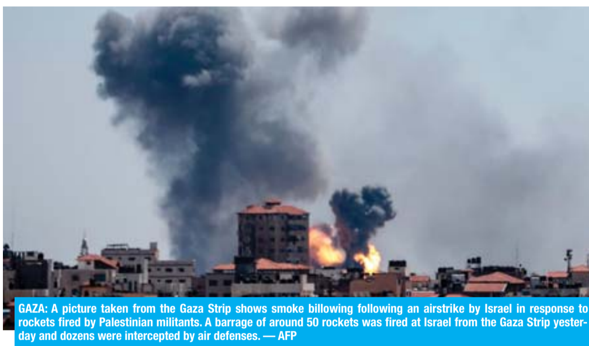
GAZA: A picture taken from the Gaza Strip shows smoke billowing following an airstrike by Israel in response to rockets fired by Palestinian militants. A barrage of around 50 rockets was fired at Israel from the Gaza Strip yesterday and dozens were intercepted by air defenses.

GAZA: Gaza militants fired dozens of rockets into Israel yesterday, drawing a wave of Israeli air strikes that killed one Palestinian gunman, as hostilities flared across the border for a second day. The escalation began on Friday, when two Israeli soldiers were wounded by Gaza gunfire near the border. A retaliatory Israeli air strike killed two militants from the Islamist Hamas group that governs Gaza. Two other Palestinians protesting near the frontier were also killed by Israeli forces. Yesterday, Israel hit Gaza with air strikes and tank fire after Palestinian militants fired about 150 rockets toward Israeli cities and villages.