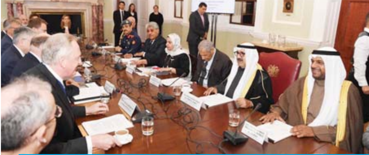
LONDON: Kuwait's First Deputy Prime Minister and Defense Minister Sheikh Nasser Sabah Al-Ahmad Al-Sabah meets with Lord Mayor of London Peter K Estlin.