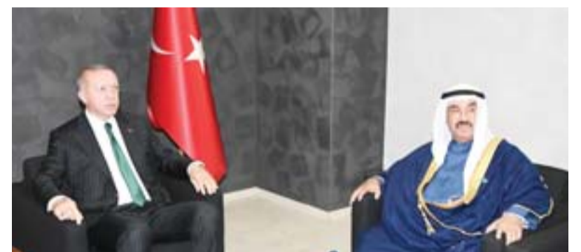
ISTANBUL: His Highness Sheikh Nasser Al-Mohammad Al-Ahmad Al-Sabah meets with Turkish President Recep Tayyip Erdogan.

ISTANBUL: The Representative of His Highness the Amir, His Highness Sheikh Nasser Al-Mohammad Al-Ahmad Al-Sabah, visited Camlica Mosque to take part in its inauguration on Friday. Upon his arrival at the mosque in Istanbul, the representative of His Highness the Amir Sheikh Sabah Al-Ahmad Al-Jaber Al-Sabah performed Friday prayers alongside worshippers. Following the ceremony, Turkish President Recep Tayyip Erdogan delivered a speech on the occasion. Later yesterday, His Highness Sheikh Nasser Al-Mohammad met Turkish President Erdogan, as he conveyed to him the greetings and best wishes of His