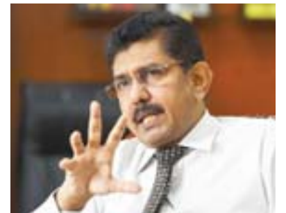
Puzzle of piecing together victims at Sri Lanka morgue