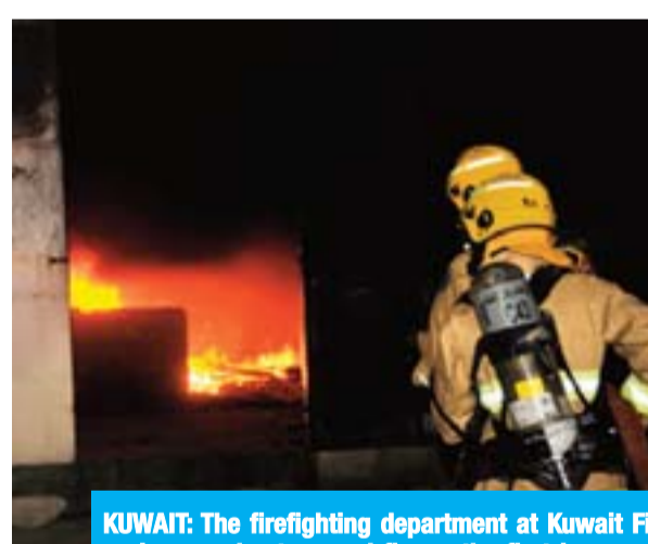
KUWAIT: The firefighting department at Kuwait Fire Service Directorate organized a mock exercise. The scenario was about several fires - the first in a multi-storey building, the second in a tanker with highly-combustible material, the third in a bakery and the fourth in a car involved in a collision. Capital fire center dealt with the incidents.