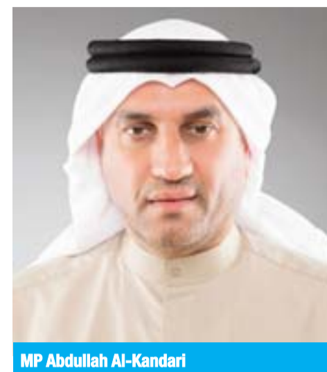
MP Abdullah Al-Kandari

An Egyptian man was arrested for insulting a policeman on duty at a hotel check-point, said security sources, noting that the suspect allegedly shouted threats at the policeman. Further investigations are still in progress.