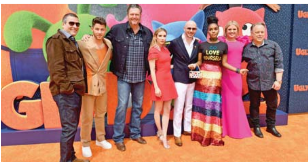
(Second from left) Nick Jonas, Blake Shelton, Emma Roberts, Pitbull, Janelle Monae, Kelly Clarkson, and Kelly Asbury attend STX Films World Premiere of "UglyDolls" at Regal Cinemas LA Live in Los Angeles, California.

"You're going to go to school, you're going to grab your nose and go 'honk, honk' and you're going to tell them that you're a clown—and they won't tease you anymore," he recalled her saying. "And I've applied that advice throughout my whole life: as soon as somebody says something about me, I say 'That's true,' and that's the end of it." — AFP