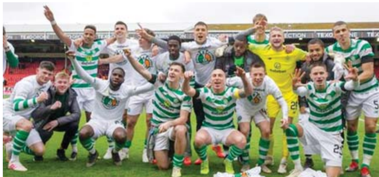
ABERDEEN: Celtic players celebrate after the final whistle of their Scottish Premiership soccer match against Aberdeen at Pittodrie Stadium, Aberdeen, Scotland, yesterday.

Gerrard's first season at Ibrox has seen steady if unspectacular progress. Rangers will finish second for the first time since the club went into liquidation in 2012 and the Gers will hope to be in a better position to