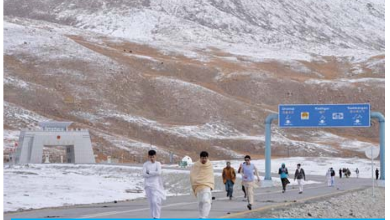
TASHKURGAN, China: Tourists leave the Pakistan-China Khunjerab Pass, the world's highest paved border crossing at 4,600 meters above sea level. China has freed dozens of Uighur women from internment camps on condition they prove their 'adaptability to Chinese society.'

US officials have said China has made criminal many aspects of religious practice and culture in Xinjiang, including punishment for teaching Muslim texts to children and bans on parents giving their children Uighur names. Academics and journalists have documented grid-style police checkpoints across Xinjiang and mass DNA collection, and human rights advocates have decried martial law-type conditions there. — Reuters