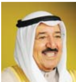
His Highness the Amir Sheikh Sabah Al-Ahmad Al-Jaber Al-Sabah

KUWAIT: His Highness the Amir Sheikh Sabah Al-Ahmad Al-Jaber Al-Sabah congratulated the Kuwaiti citizens and residents on the advent of the Holy Month of Ramadan the Amiri Diwan said yesterday. His Highness the Amir, along with His Highness the Crown Prince Sheikh Nawaf Al-Ahmad Al-Jaber Al-Sabah and Al-Sabah family will hold a reception for Ramadan well-wishers from the army, National Guard (KNG), Fire Service Directorate (KFSD) and diplomats on the first two days of the Holy Month at Bayan Palace, the Amiri Diwan added. The Amiri Diwan noted that His Highness the Amir expressed his regret for not receiving citizen and resident well-wishers this year. The Amiri Diwan extended wishes of prosperity for the leadership and people of Kuwait, wishing many happy returns of this joyous occasion. — KUNA