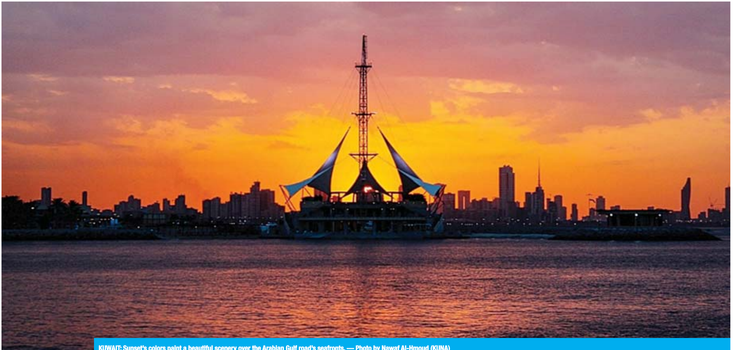
KUWAIT: Sunset's colors paint a beautiful scenery over the Arabian Gulf road's seafronts.