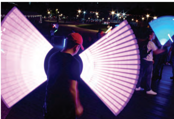
Fans using model lightsabers during an event to promote the upcoming unofficial Star Wars Day in Taipei.