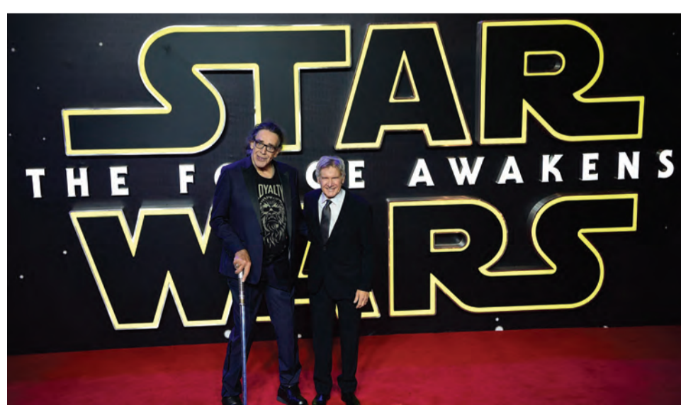
In this file photo taken on December 16, 2015, British actor Peter Mayhew (left) and US actor Harrison Ford attend the opening of the European Premiere of “Star Wars: The Force Awakens” in central London.

“In George's office, he had a sofa,” he said, referring to “Star Wars” creator George Lucas. “So I sat down on the sofa waiting for him to come in through the door. He and (producer) Gary Kurtz walked in. “I did the natural thing, I stood up,” he added. “Basically, that was the interview. He turned to Gary and said, ‘I think we've found him.’” Chewbacca communicated in roars and growls, but Mayhew did not provide the vocals—those signature noises came from a sound engineer.