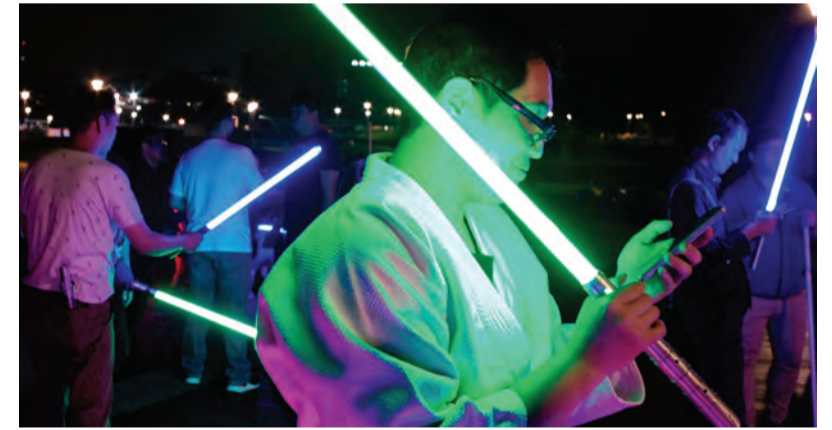
Fans using model lightsabers during an event.