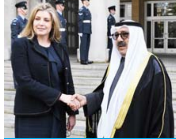
Kuwait's First Deputy Prime Minister and Defense Minister Sheikh Nasser Sabah Al-Ahmad Al-Sabah meets with British Secretary of Defense Penny Mordaunt.