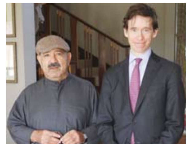
First Deputy Prime Minister and Defense Minister Sheikh Nasser Sabah Al-Ahmad Al-Sabah meets with Britain's Secretary of State for International Development Rory Stewart.

Furthermore, Sheikh Nasser Sabah Al-Ahmad visited the Tower of London to see the Crown Jewels. Sheikh Nasser examined the Crown Jewels which constituted an important part of Britain's history spanning over 800 years, and included regalia and vestments worn by British kings and queens at their coronations. The Crown Jewels are masterpieces which reflected the cul-