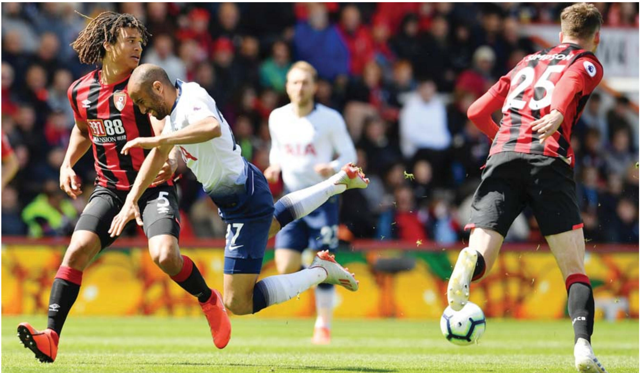
BOURNEMOUTH: Bournemouth's Dutch defender Nathan Ake (L) and Bournemouth's English defender Jack Simpson (R) vie with Tottenham Hotspur's Brazilian midfielder Lucas Moura during the English Premier League football match between Bournemouth and Tottenham Hotspur at the Vitality Stadium in Bournemouth yesterday.

Fulham's Elliott becomes Premier League's youngest player