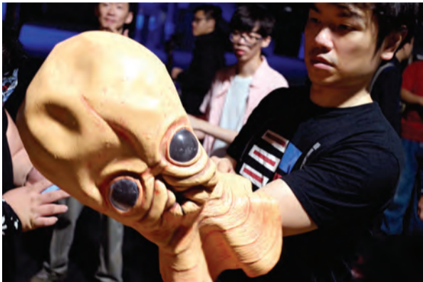
A fan holding a mask during an event to promote the upcoming unofficial Star Wars Day in Taipei.