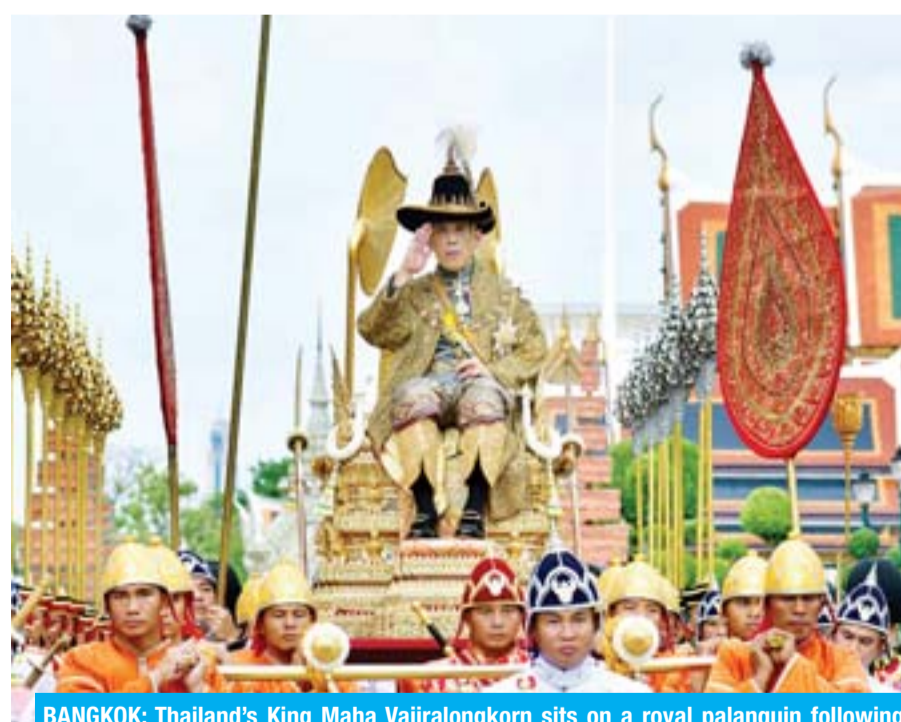
BANGKOK: Thailand's King Maha Vajiralongkorn sits on a royal palanquin following his coronation ceremony at the Grand Palace in Bangkok.