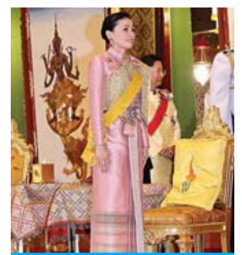
Thailand's Queen Suthida pictured during King Maha Vajiralongkorn's coronation in Bangkok.

In November 2013, Suthida entered the royal army before becoming part of the monarch's prestigious security detail less than a year later. She was promoted to the rank of general in December 2016 two months after the death of revered former King Bhumibol Adulyadej as Vajiralongkorn