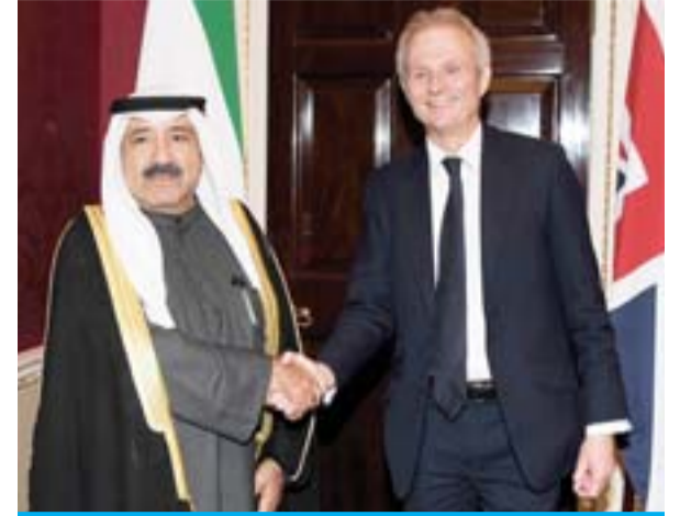
Kuwait's First Deputy Prime Minister and Defense Minister Sheikh Nasser Sabah Al-Ahmad Al-Sabah meets with British Minister of Cabinet Office David Lidington.