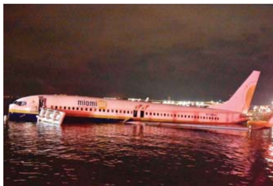
FLORIDA: This image released by the US Navy shows a Boeing 737 aircraft carrying 136 passengers and seven crew members after it skid into the St Johns River during landing.