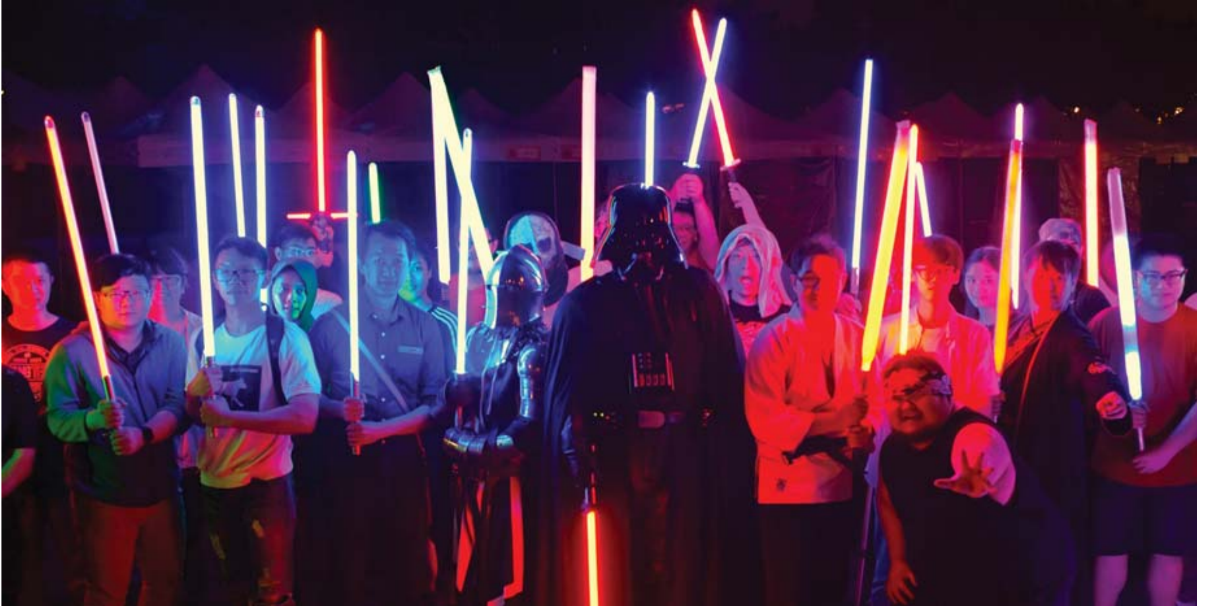
This picture shows fans posing for photographs with model lightsabers during an event to promote the upcoming unofficial Star Wars Day in Taipei.