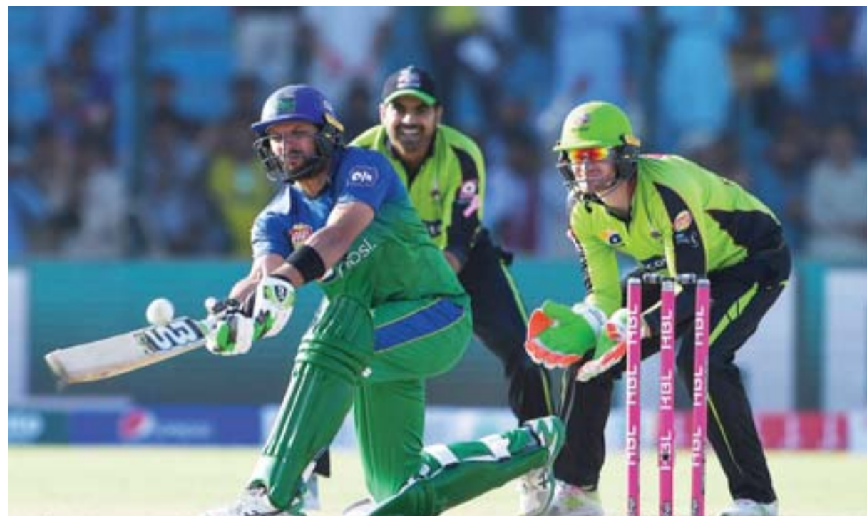
KARACHI: File photo shows, Pakistani cricketer of Multan Sultans Shahid Afridi (L) plays a shot during the third match between the Lahore Qalandars and Multan Sultans of the last eight matches of the Twenty20 Pakistan Super League (PSL).

Afridi described another team mate, Waqar Younis, as a mediocre captain and terrible coach. He said Imran Khan, a former captain and now prime minister of Pakistan, had an "abrasive style leadership". "By the