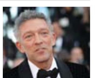
In this file photo French actor Vincent Cassel poses as he arrives for the screening of the film "Girls of the Sun (Les Filles du Soleil)" at the 71st edition of the Cannes Film Festival in Cannes, southern France.

Cassel's breakthrough role came in 1995 with "La Haine," a searing portrayal of life in Paris's racially polarized suburbs. A series of big-screen roles followed in France, and then Cassel crossed over to Hollywood with featured parts in heist capers "Ocean's Twelve" and "Ocean's Thirteen." He starred alongside Oscar winner Natalie Portman in the dark psychodrama "Black Swan." In 2009, Cassel won the Cesar-France's Oscars-for best actor for his portrayal of legendary French gangster Jacques Mesrine in a two-part film.