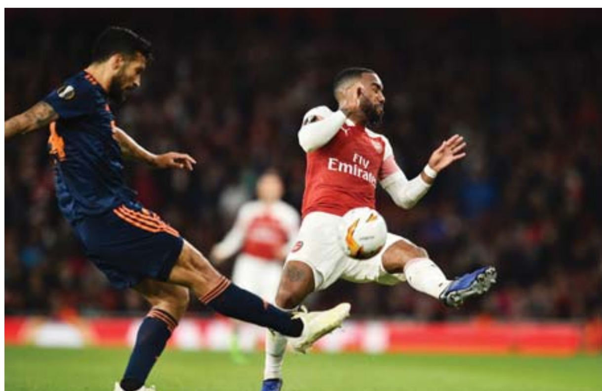
LONDON: File photo shows Arsenal's French striker Alexandre Lacazette (R) attempts to block a clearance from Valencia's Argentinian defender Ezequiel Garay (L) during the UEFA Europa League semi final, first leg, football match between Arsenal and Valencia at the Emirates Stadium in London on May 2, 2019. — AFP

They are on 35 points, four clear of Cardiff, who are in the third and final relegation spot. "We've shown a reaction to that slump in form, and hopefully we can continue that at the Emirates today," said striker Glenn Murray. — AFP