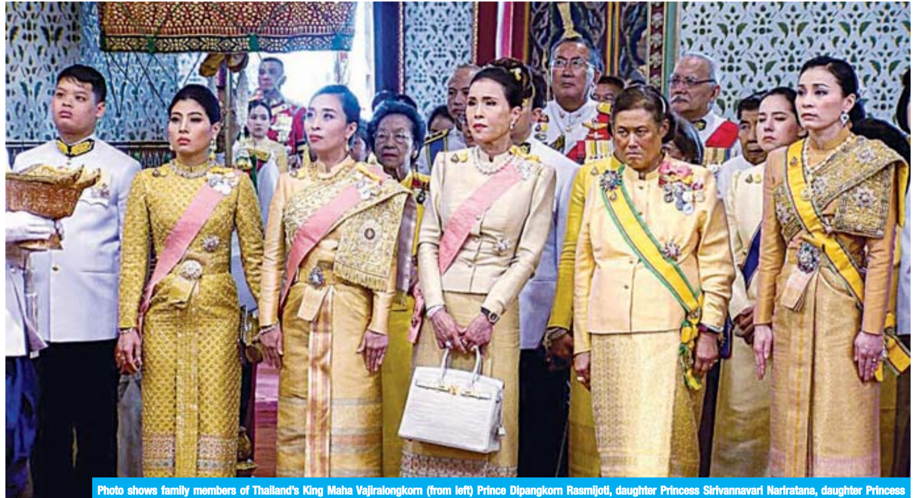
Photo shows family members of Thailand's King Maha Vajiralongkorn (from left) Prince Dipangkorn Rasmijoti, daughter Princess Sirivannavari Nariratana, daughter Princess Bajrakitiyabha Manidol, sister Princess Ubolratana, sister Princess Maha Chakri Sirindhorn attending the coronation of King Vajiralongkorn at the Grand Palace in Bangkok.

All articles appearing on this page are the personal opinion of the writers. Kuwait Times takes no responsibility for views expressed therein.