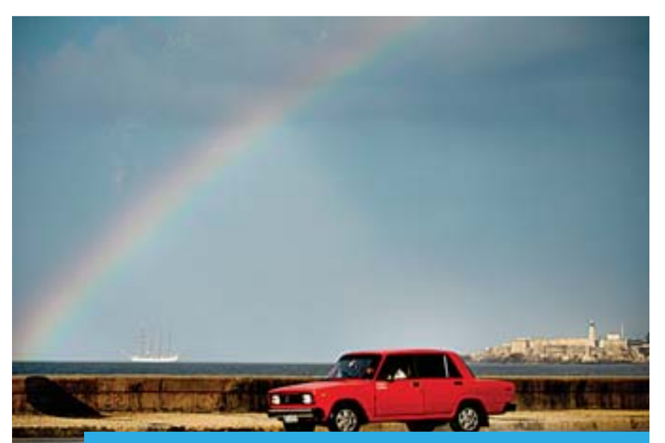
HAVANA: A man drives a Russian-made car along Havana's Malecon on April 24, 2019.