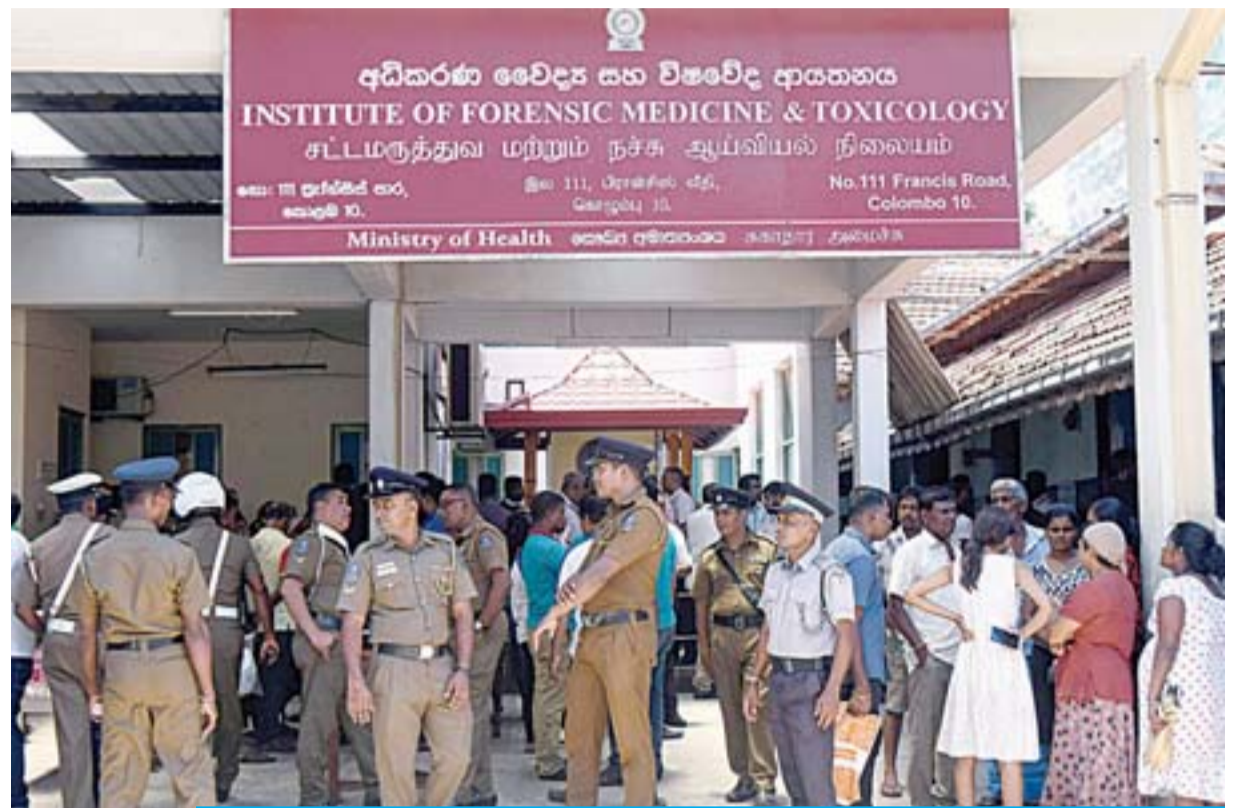
COLOMBO: In this photo taken April 22, 2019, relatives of bomb blast victims gather outside a morgue, waiting to identify loved ones missing or killed in the Easter Sunday bomb attacks on churches and hotels. —AFP

But in a confined space, a sudden rush of air causes considerable devastation. "What counts more than anything are the shock waves, they move faster than sound and at very high velocity, which actually could tear bodies apart," said Jasinghe. As forensic pathologists continue to puzzle over the fragments still lying in body bags, victims' relatives who had gathered outside the building in temporary marquees - where they had the distressing task of identifying their loved ones through photographs - have long since left and the tents taken down. —AFP