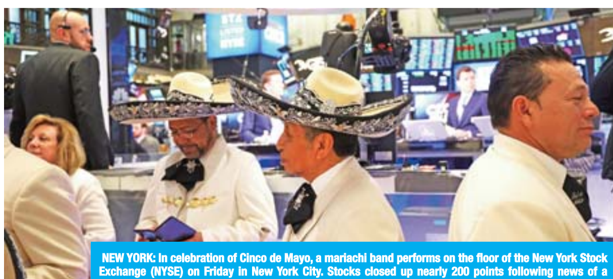
NEW YORK: In celebration of Cinco de Mayo, a mariachi band performs on the floor of the New York Stock Exchange (NYSE) on Friday in New York City. Stocks closed up nearly 200 points following news of a strong jobs report. — AFP

The UK Foreign Office said in a February travel advisory that EASA had "suspended Turkmenistan Airlines flights to and from the EU pending confirmation that it meets international air safety standards." — AFP