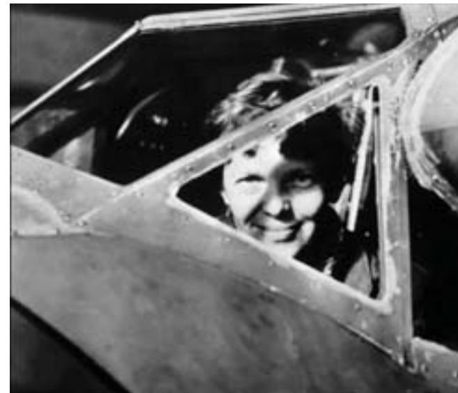
American female aviator Amelia Earhart looking through the cockpit window of her plane. — AFP

Earhart went missing while on a pioneering round-the-world flight with navigator Fred Noonan. Her disappearance is one of the most tantalizing mysteries in aviation lore, fascinating historians for decades and spawning books, movies and theories galore. The prevailing belief is that Earhart, 39, and Noonan, 44, ran out of fuel and ditched their twin-engine Lockheed Electra in the Pacific near remote Howland Island while on one of the final legs of their epic journey. One of the most popular theories is that Earhart and Noonan crash-landed on uninhabited Gardner Island, now known as Nikumaroro, part of the Republic of Kiribati, where she survived briefly as a castaway. —AFP