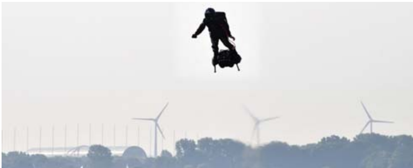
Franky Zapata (center) stands on his jet-powered “flyboard” as he takes off from Sangatte, northern France, attempting to fly across the 35-kilometre (22-mile) Channel crossing in 20 minutes yesterday.