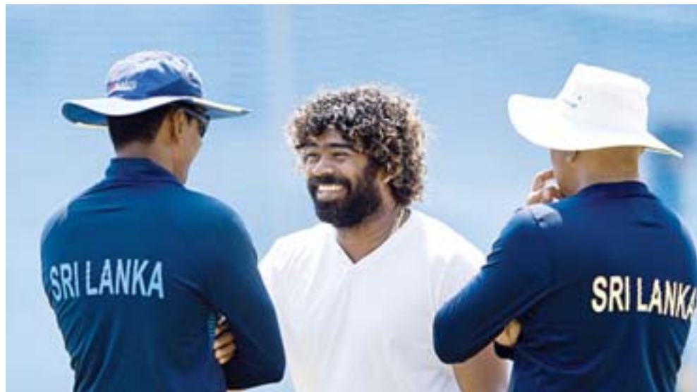
COLOMBO: Sri Lankan cricketer Lasith Malinga (C) attends a practice session at R Premadasa Stadium in Colombo yesterday, ahead of their first one day international (ODI) match of a three-match ODI series against Bangladesh.

"My captaincy was a last-minute call because our regular captain got injured the night before