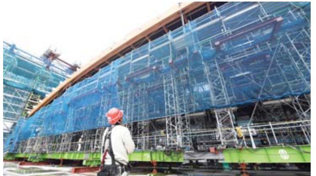
TOKYO: This file photo taken on November 7, 2018 shows a construction worker monitoring as the centre section of the timber roof is raised, at the Ariake Gymnastics Centre construction site ahead of the upcoming Tokyo 2020 Olympic Games. — AFP

They use a wind tunnel lab where researchers and engineers are studying the aerodynamics of professional cyclists' bicycle positions. Former champion Froome's celebrated descent of the Pyrenean Col du Peyresourde on the eighth stage of the 2016 Tour caused a sensation as the Briton went on to win his third Tour de France. According to studies at the Sart Tilman campus, it gave him a 'nine percent' advantage over a classic position. — AFP