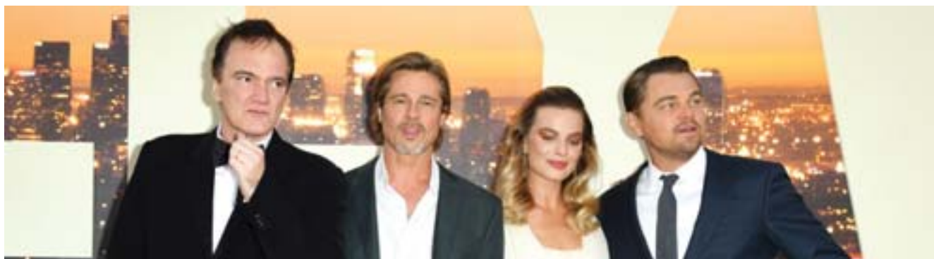
Director Quentin Tarantino, Brad Pitt, Margot Robbie and Leonardo DiCaprio attend the Sony Pictures' 'Once Upon A Time...In Hollywood' Los Angeles Premiere.

Even if he can buck the current "blockbuster or bust" trend, any boost Tarantino can offer Hollywood is likely to be short-lived. The "Pulp Fiction" director says he will retire from directing after his 10th movie. "Once Upon a Time" is number nine. Rumors he could sneak in an R-rated new "Star Trek" movie before he calls it quits have stirred hope among devotees. But if even Tarantino switches to franchise filmmaking, it could be a seminal moment in Hollywood's direction of travel. For now, Hollywood is just happy to see him making waves. "It's getting harder and harder to get original content to a big cinema," said Brad Pitt, the film's other marquee star, at Monday's premiere. "Thank god Tarantino's got one more left in him," he added.