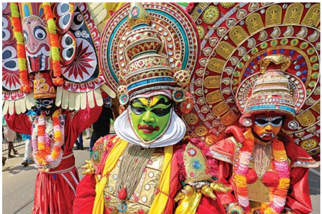
Swap Kerala's kathakali dance shows for a more authentic theatrical experience in Kannur

To track down the elusive snow leopard, you'll need to trek high into the Himalaya, far from the maddening crowds. Accessible from Leh, Hemis National Park in Ladakh is said to be one of the easiest places to spot snow leopards, but the so-called 'ghost of the mountains' can also be seen on treks through Himachal Pradesh's Great Himalayan National Park and remote Namdapha National Park in Arunachal Pradesh. ( www.lonelyplanet.com )