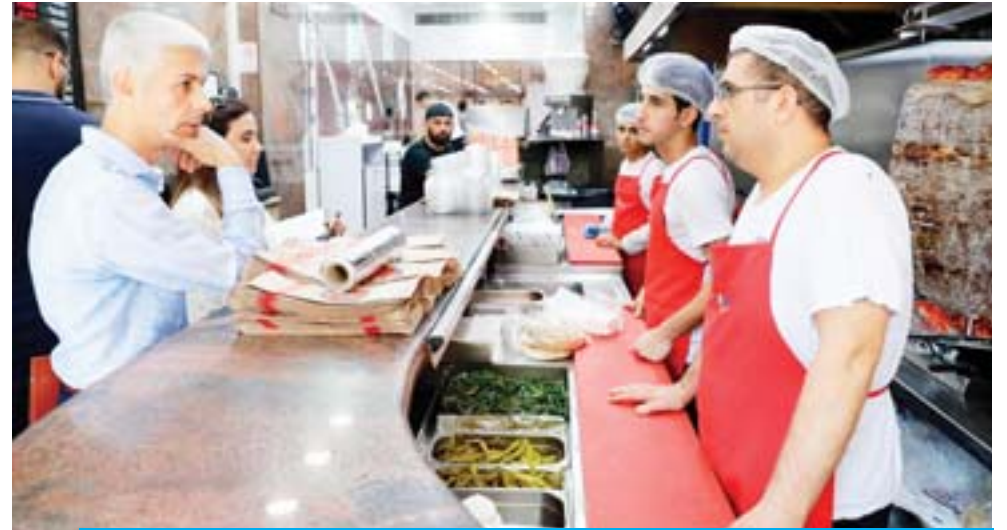
BEIRUT: Officials from the Ministry of Labor and the Social Security are pictured at a restaurant in Beirut as they inspect the work permits and legal papers of foreign employees.