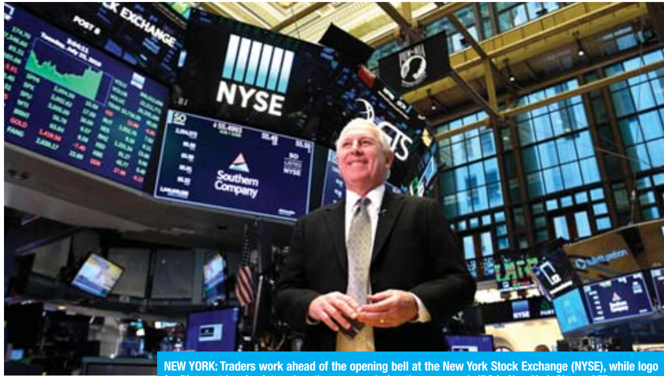
NEW YORK: Traders work ahead of the opening bell at the New York Stock Exchange (NYSE), while logo for Pinterest Inc. is pictured on the screens during the company's IPO in New York City.

For all the ECB focus, the day's real fireworks were already going off in Turkey. The country slashed its main interest rate to