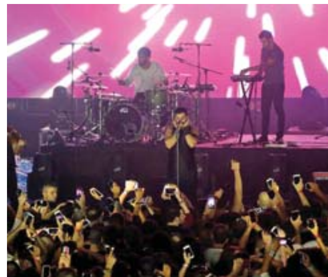
Lebanese alternative rock band Mashrou' Leila performs during the Ehdniyat International Festival in Ehdn, Lebanon, August 12, 2017.