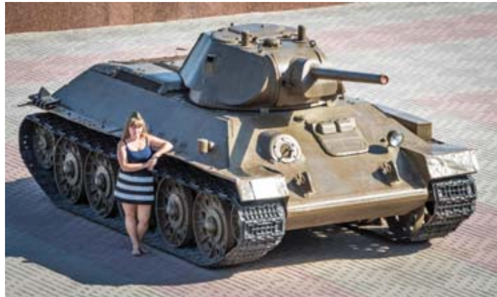
A woman poses next to a tank at the museum-panorama "The Battle of Stalingrad" in Volgograd.