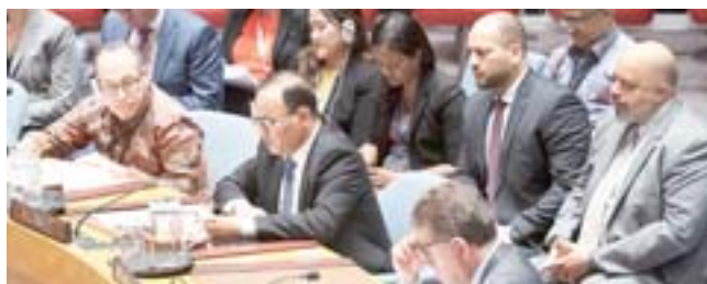
NEW YORK: Ambassador Mansour Al-Otaibi speaks during a UN security Council meeting tackling potential sources of conflict in West Africa and Sahel region.

Meanwhile, Kuwait commended recent positive steps taken by Congo's President Felix Tshisekedi, including tours of Kenya, Angola, Uganda, Rwanda, Burundi, Tanzania, Gabon and Guinea to promote regional cooperation. Addressing a UN Security Council session on Congo, Otaibi appreciated the efforts of the Congolese leader to maintain regional security and stability and to provide