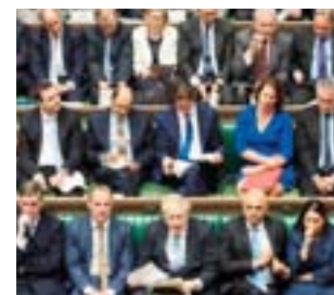
UK PM brings Brexit gang back together