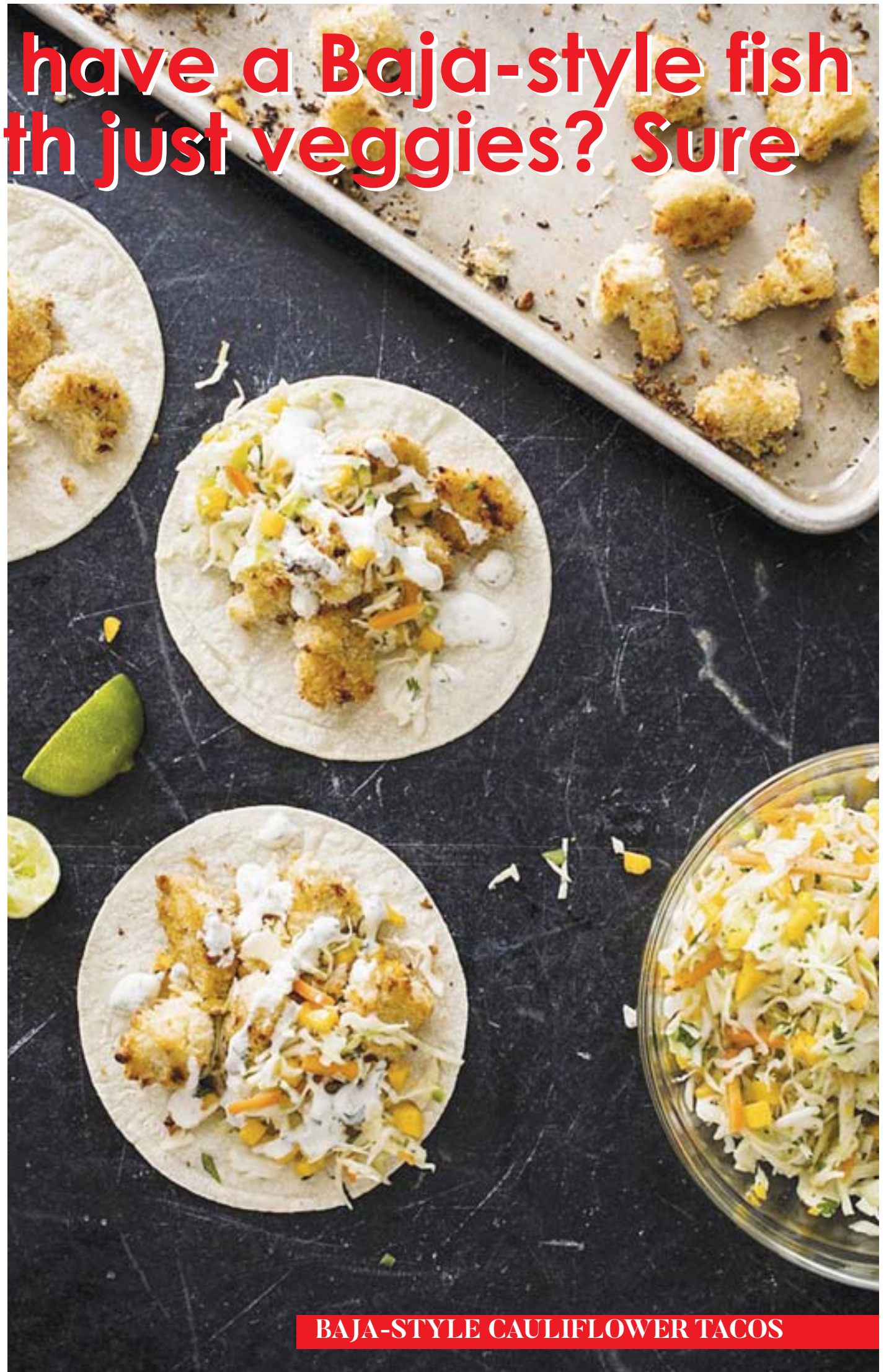
BAJA-STYLE CAULIFLOWER TACOS