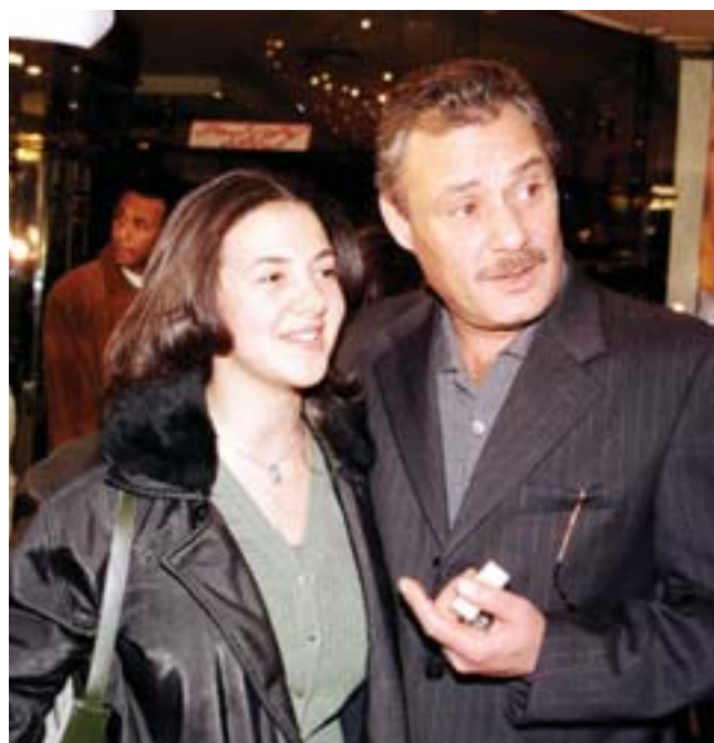
A file photo taken on February 20, 2002, shows Egyptian film star Farouk Al-Fishawy posing with new actress Donya Samir Ghanem at the premiere of 'Haramiah Fi KG2'.