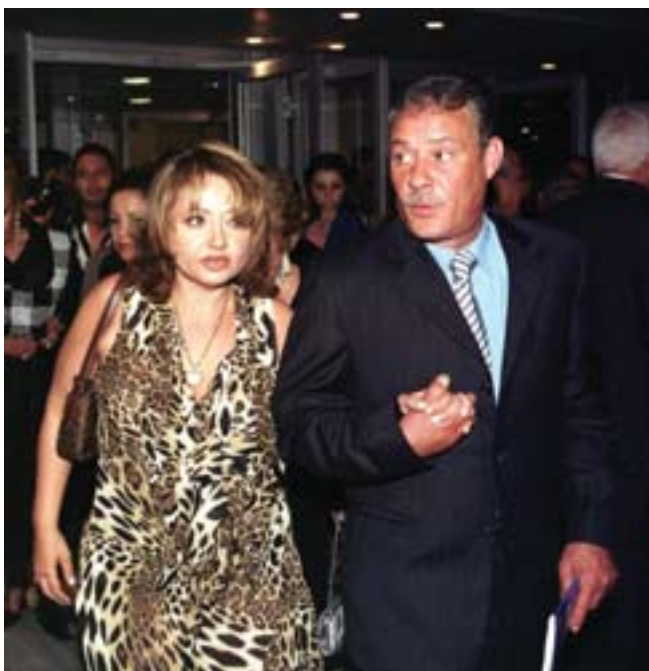
In this file photo taken on September 03, 2003 Egyptian film stars Leila Elwi and Farouk Al-Fishawy arriving at the 19th Alexandria International Film Festival in Alexandria.