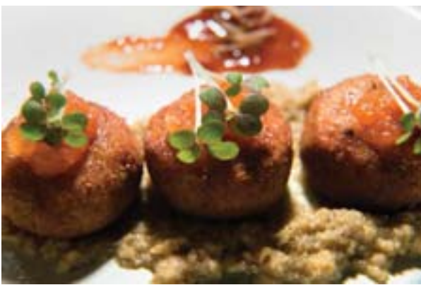
A dish of Wild mushroom and herb croquets with Mopani Humus at Gourmet Grubb.