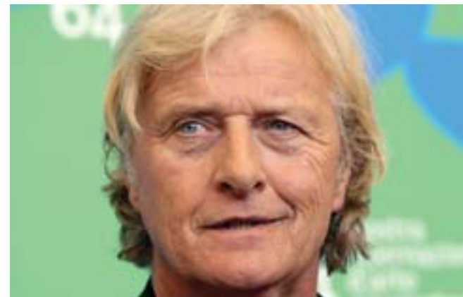
This file photo taken on September 01, 2007 shows Dutch Rutger Hauer posing during a photocall at Venice.

Set in a dystopian Los Angeles of 2019 and directed by Ridley Scott, Blade Runner catapulted the tall, blonde Dutch actor with piercing blue eyes to international stardom. His last haunting monologue in the movie as the genetically engineered replicant Roy Batty could perhaps stand as his own obituary: "I've seen things you people wouldn't believe... all those moments will be lost in time, like tears in rain. Time to die." "Half of Roy is me," said Hauer, who went on to play a number of memorable menacing bad guys who sent shivers down audiences' spines.