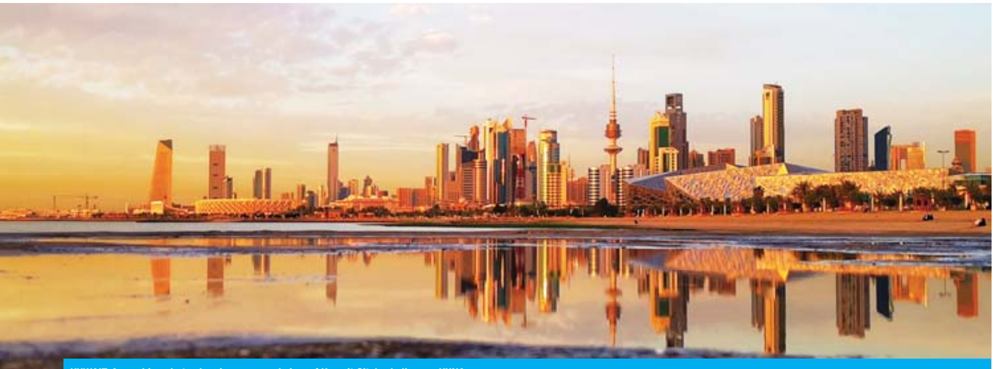
KUWAIT: An archive photo showing a general view of Kuwait City's skyline.