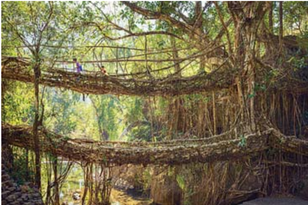
The living root bridges of Meghalaya have become a poster child for the sense of mysticism surrounding India's remote Northeast

There are dozens of ways to go off the beaten track in Gujarat, depending on what lights your travel fire. History buffs can trace the footsteps of Mahatma Gandhi from his birthplace at Porbandar to the Sabarmati Ashram in Ahmedabad and the end of the empire-defying Salt March at Dandi. For spiritual sustenance, trade Varanasi for temple-tastic Palitana, where the spires of 863 Jain temples create a porcupine skyline in the Shatrunjaya Hills, or find Islamic India without the Agra crush at Champaner-Pavagadh, one-time capital of the Gujarati sultans.