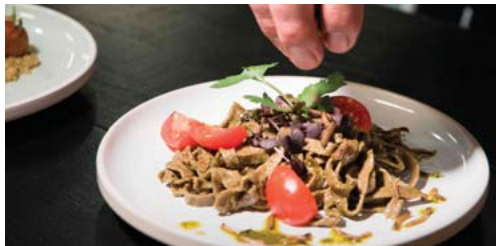
A dish of Basil Pesto Tagliatelle, made with ground Black Soldier Fly larvae, and garnished with Mealworms, at Gourmet Grubb.