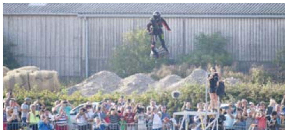
Franky Zapata stands on his jet-powered ‘flyboard’ as he takes off from Sangatte.

Zapata had hoped to make the 35-kilometre (22-mile) crossing in 20 minutes, keeping