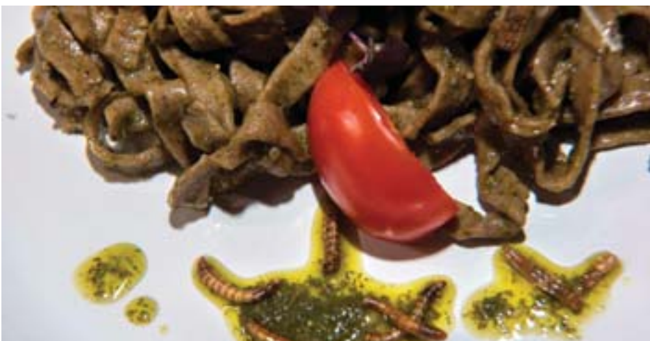
A dish of Basil Pesto Tagliatelle, made with ground Black Soldier Fly larvae, and garnished with Mealworms, at Gourmet Grubb.

dishes, to introduce to South Africans," Barnard said. The restaurant serves mopane worm polenta fries, and black fly larvae chickpea croquettes paired with a mopane hummus and topped off with a sprinkle of dried mealworms. For dessert, it offers a deep-fried dark chocolate black fly larvae ice cream. "I chose these dishes for introducing insects to people because they're already familiar with them—everyone knows polenta fries and croquettes," he said. One customer told AFP: "It's delicious, it's flavorful and spicy, it's everything you want in food." — AFP