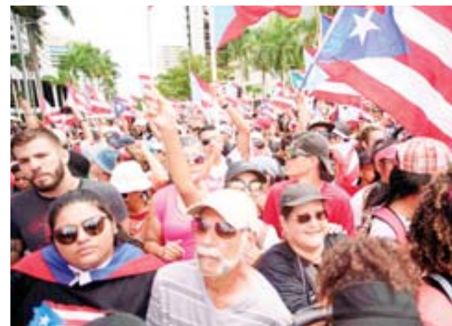
SAN JUAN: People march in San Juan after the resignation of Puerto Rico Governor Ricardo Rossello.

He later tweeted his delight at Rossello's resignation, saying the country had "discovered that what unites us is the heart". Playwright Lin-Manuel Miranda, creator of the hit musical "Hamilton" and whose family are from Puerto Rico, also praised the protesters on Twitter. Other local celebrities, including pop star Ricky Martin and trap musician Benito Martinez ("Bad Bunny"), have also been leading support for the protests.