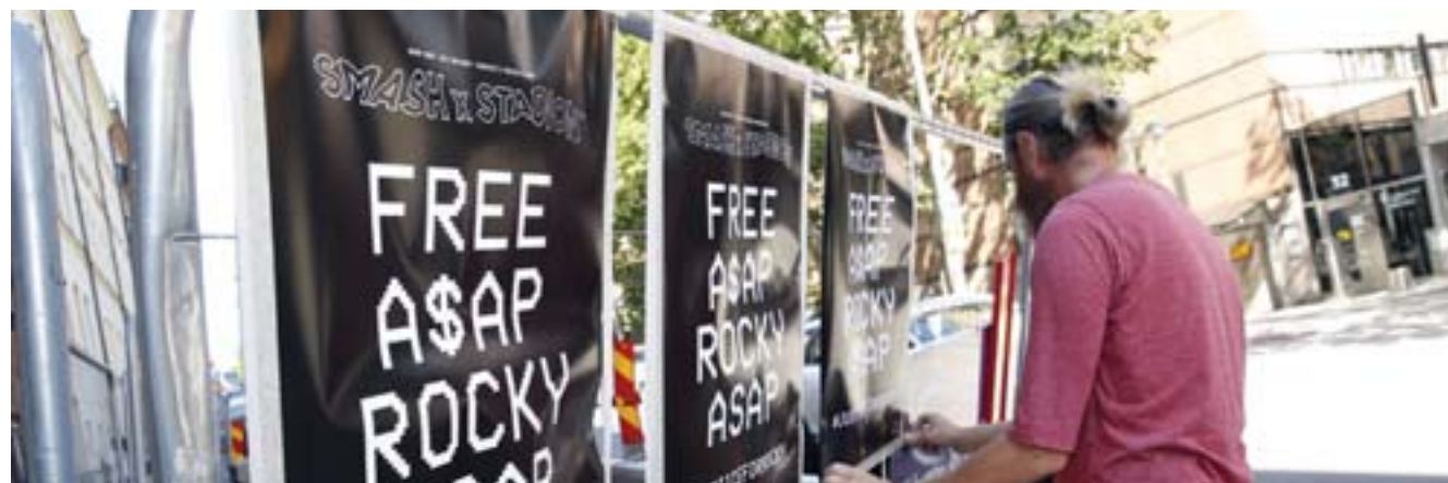
A man displays posters reading 'Free ASAP Rocky ASAP' outside the Kronoberg custody in Stockholm yesterday. — AFP

Lofven's press secretary Toni Eriksson confirmed that the call had taken place and told AFP that "the Prime Minister was careful to point out that the Swedish justice system is completely independent". Mayers was born in New York and had a breakthrough in 2011 with the release of the mixtape "Live. Love. A$AP". He followed that up in 2013 with the debut album "Long. Live. A$AP". — AFP