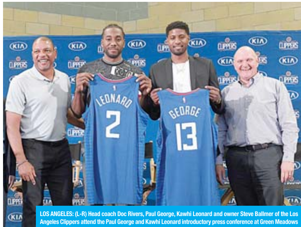
LOS ANGELES: (L-R) Head coach Doc Rivers, Paul George, Kawhi Leonard and owner Steve Ballmer of the Los Angeles Clippers attend the Paul George and Kawhi Leonard introductory press conference at Green Meadows Recreation Center.

George hopes that with both players being among the NBA's top defenders, the Clippers will alter dynamics to bring more attention to two-way work than simply scoring skills. "What me and Kawhi can do is inspire the next