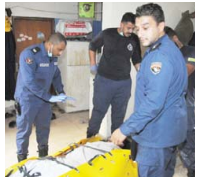
KUWAIT: Firemen and paramedics help an overweight patient to hospital.