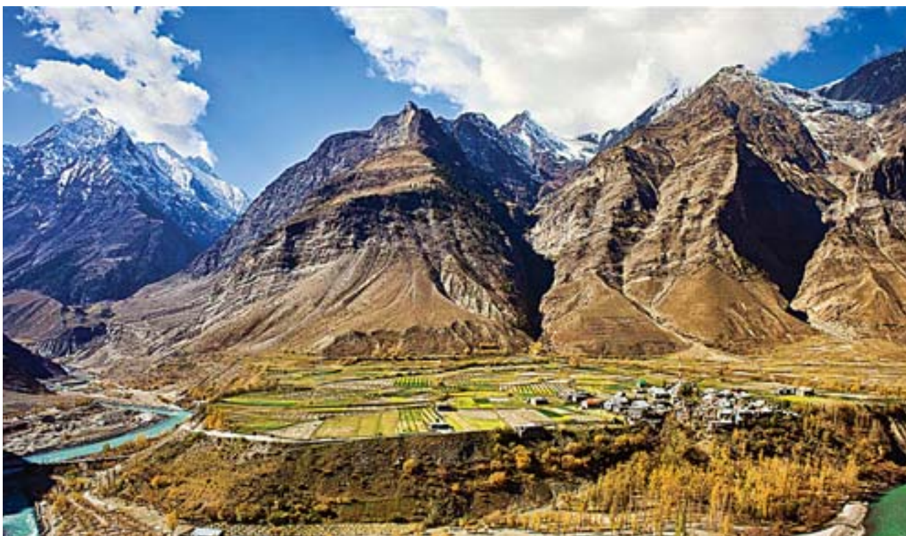
A small village sits in the shadow of hulking mountains of India's Lahaul valley in the Himalayas

A little boy peers through the window of the Ooty (Udagamandalam) train as it crosses a bridge on the Nilgiris Mountain Railway