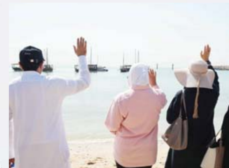
The families bid farewell to their sons.