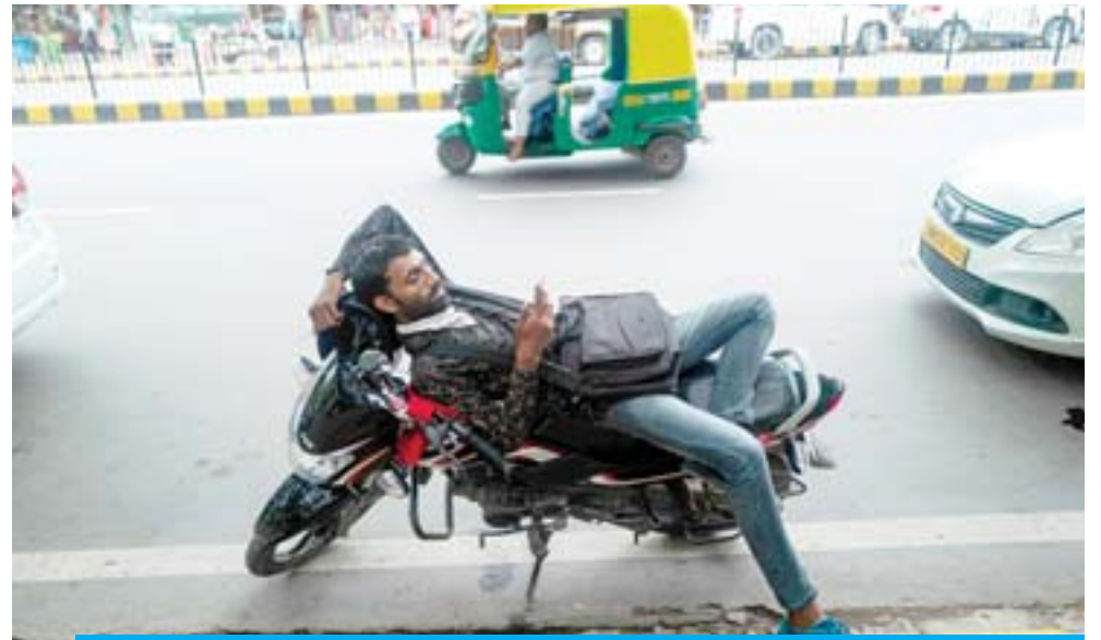
NEW DELHI: A man uses a mobile phone leaning on a motorbike along a street in New Delhi yesterday.

In May, San Francisco officials banned the use of facial recognition technology by city personnel in a sign of the growing backlash. India’s home ministry recently called for a tender for facial recognition systems to modernize the police force and its information gathering and criminal identification processes. The Bengaluru airport system, described as “your face is your boarding pass”, offers the “highest degree of safety and security while ensuring stringent standards of privacy,” a spokeswoman for the airport said.