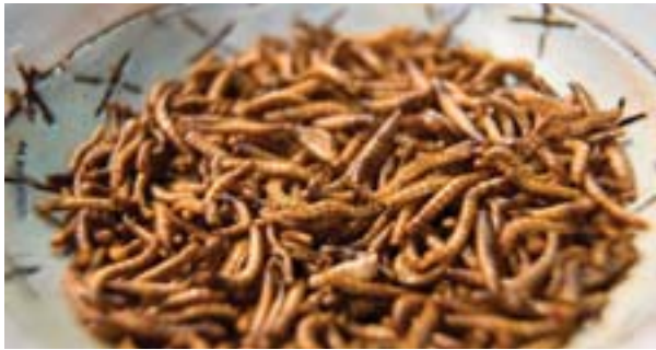
A dish of Meal worms, an ingredient and garnish at Gourmet Grubb.