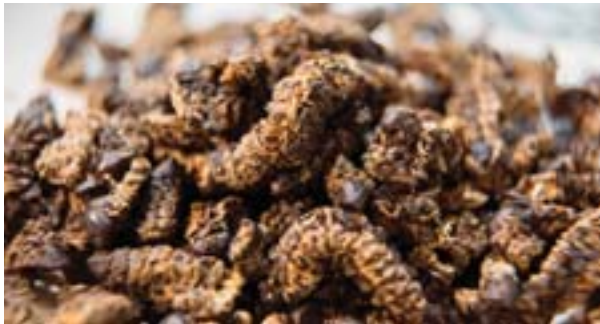
A dish of Mopani worms, imported from Zimbabwe, an ingredient at Gourmet Grubb.