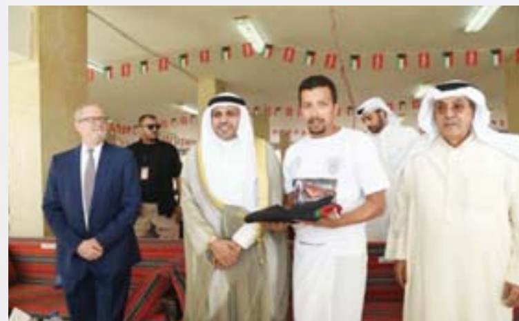
Minister of Information Mohammad Al-Jabri handed the Kuwaiti flag to a sailor.