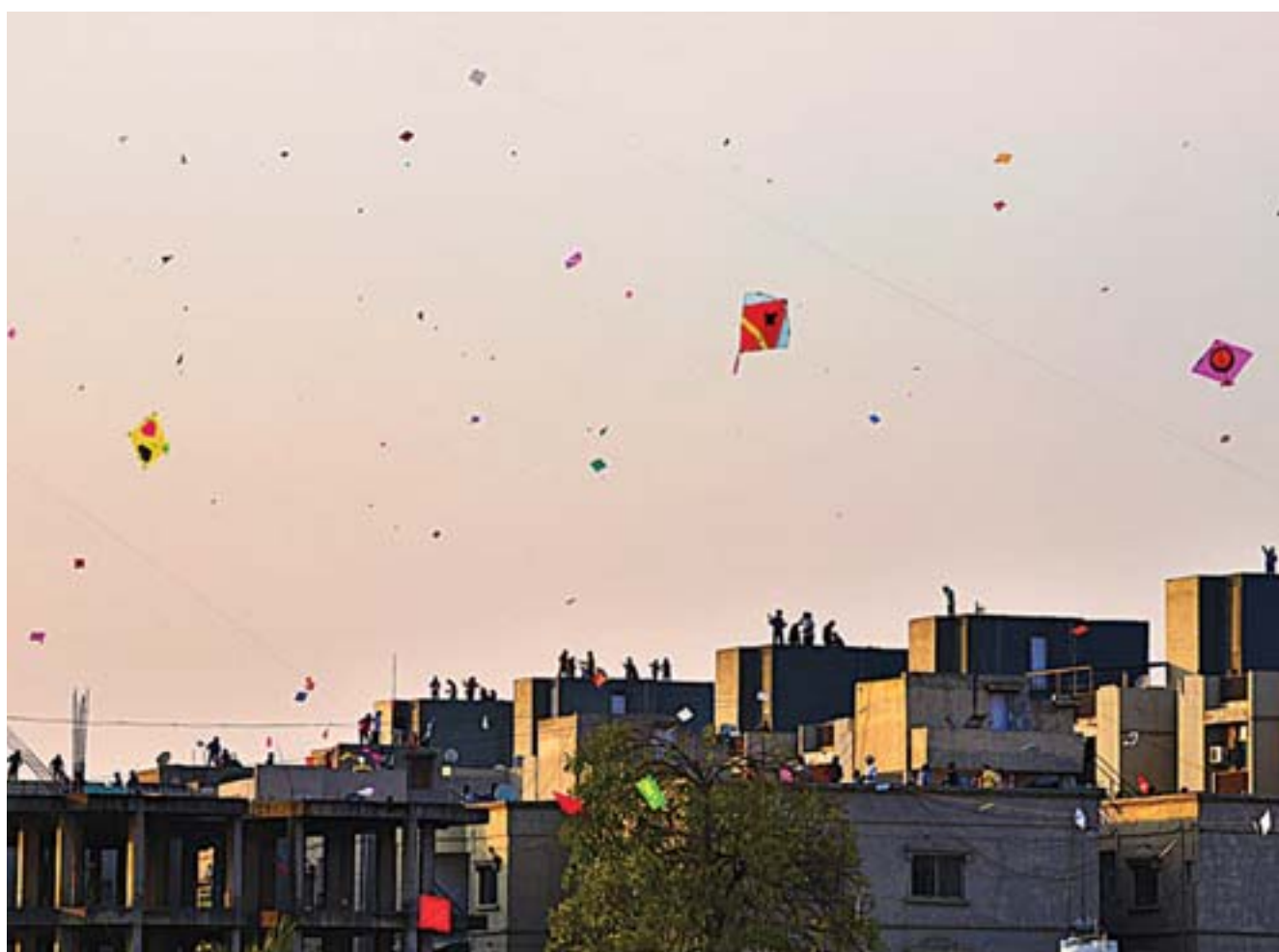
Colorful kites fly above the rooftops of Ahmedabad during the annual International Kite Festival

India's northern plains are painted in a kaleidoscope of colors by rainbow saris and busy bazaars - and, it must be said, by backpacks. Swap the crammed sights of India's Golden Triangle for the dry badlands of Gujarat, where the color comes from lavishly embroidered tribal costumes and fighting kites that fill the sky over every town and village. Reds and yellows flare against the muted tones of the landscape in every corner of the state, from the historic capital, Ahmedabad, to the backwater villages of the Rann of Kachchh and the beaches sprinkled along India's longest stretch of coastline.