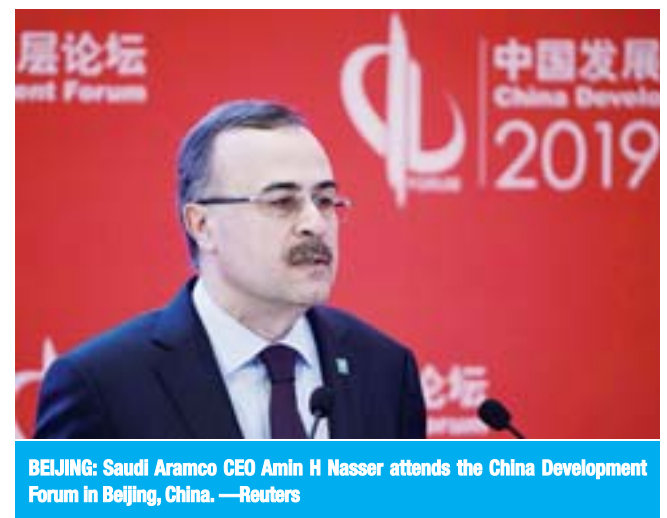
BEIJING: Saudi Aramco CEO Amin H Nasser attends the China Development Forum in Beijing, China.

In that time, Aramco has announced at least $50 billion worth of investments in Saudi Arabia, Asia and the United States. It aims to almost triple its chemicals production to 34 million metric tons per year by 2030 and raise its global refining capacity to 8-10 million barrels per day (bpd) from more than 5 million bpd. In March last year, Aramco finalized a deal to buy a $7 billion