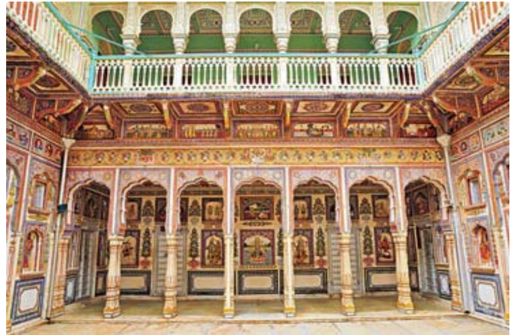
Nawalgarh is famous for the striking frescoes on the walls of its havelis

Many travelers rate Kerala as their favorite place in all of India, but drifting from Kochi to Kovalam to the backwaters