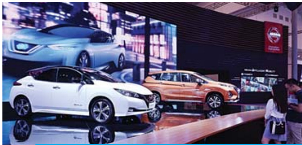
TANGERANG: Visitors take a look at the Nissan display at the Gaikindo Indonesia International Auto Show (GIIAS) in Tangerang, Banten province.