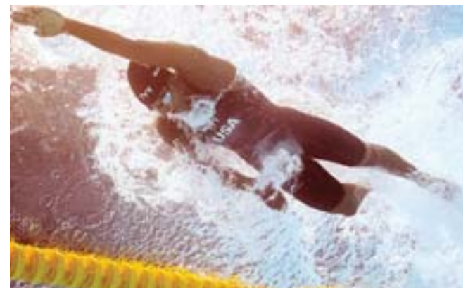
GWANGJU: USA’s Simone Manuel competes in the semi-final of the women’s 100m freestyle event during the swimming competition at the 2019 World Championships at Nambu University Municipal Aquatics Center.

King was booted out of the women’s 200m breaststroke after winning her heat after the American was adjudged to have failed to touch with both hands at a turn, prompting an appeal from the United States. The 22-year-old, along with several top swimmers