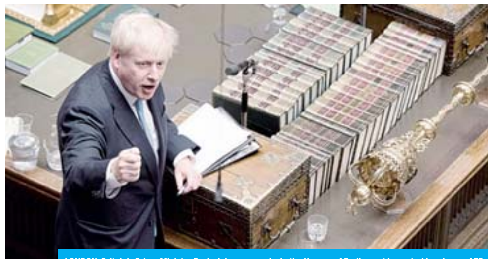
LONDON: Britain's Prime Minister Boris Johnson speaks in the Houses of Parliament in central London.

Johnson's solution for the frontier revolves around proposals that have been rejected as either