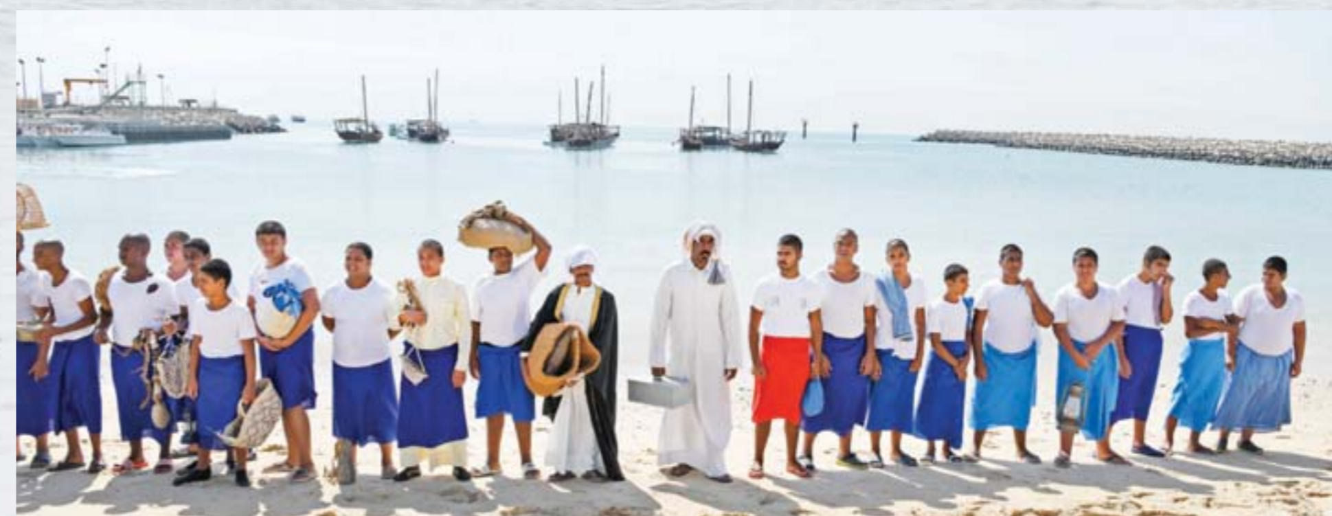
The young Kuwaiti sailors leaving for a week's voyage.