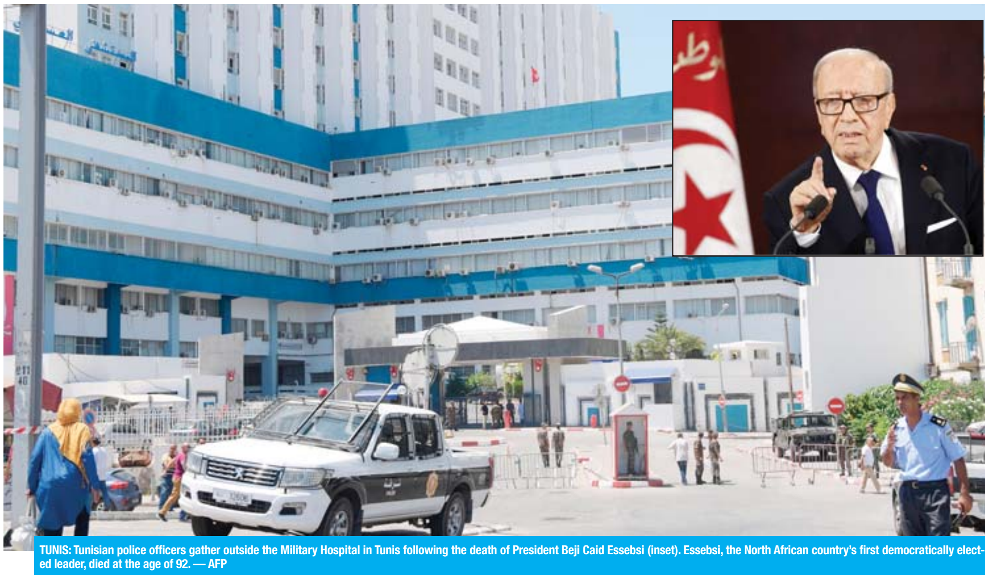
TUNIS: Tunisian police officers gather outside the Military Hospital in Tunis following the death of President Beji Caid Essebsi (inset). Essebsi, the North African country's first democratically elected leader, died at the age of 92.