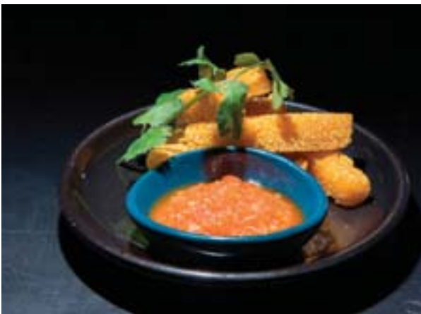
A dish of Mopani Polenta Fries with smoked tomato chutney at Gourmet Grubb.