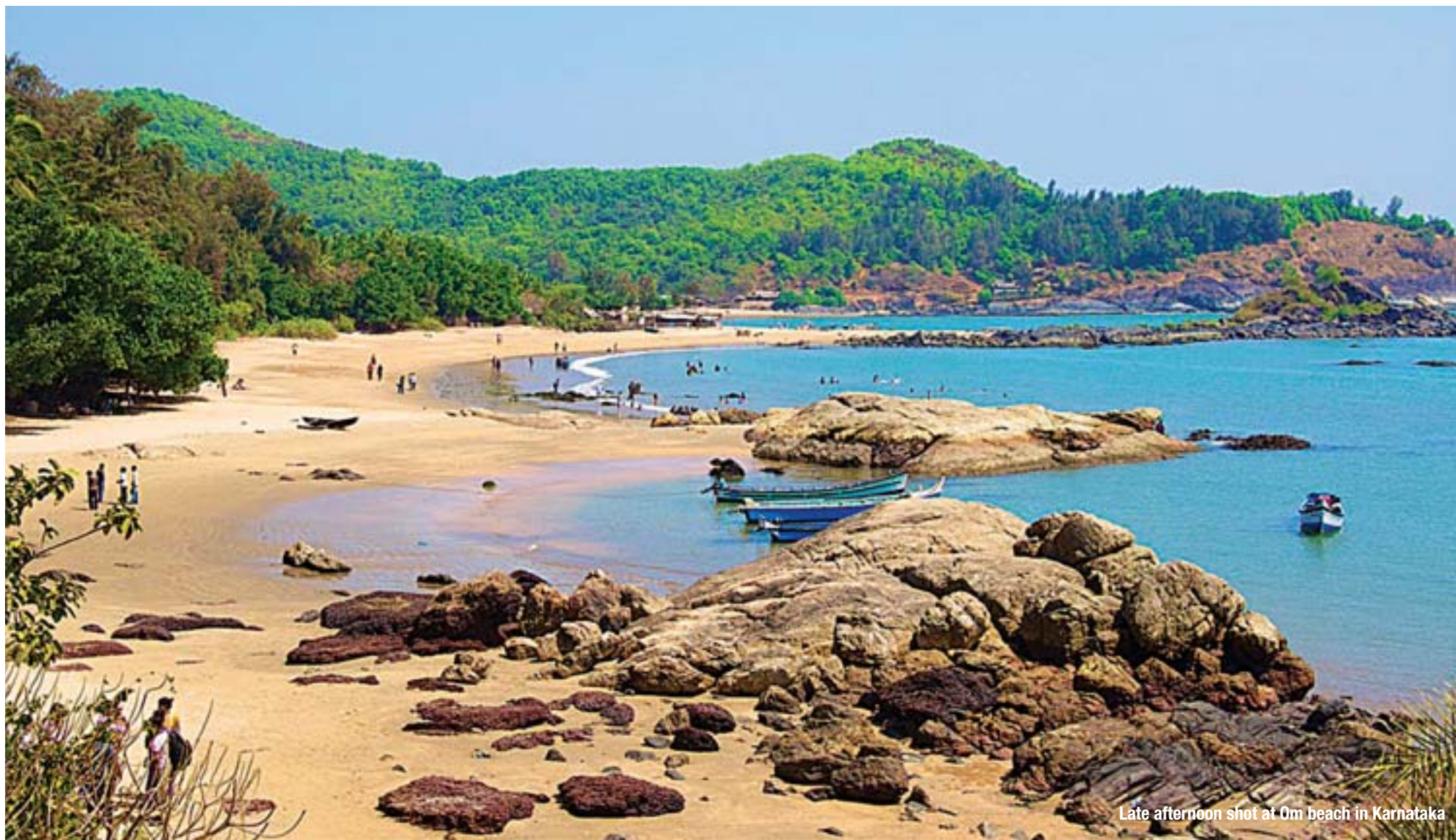
Late afternoon shot at Om beach in Karnataka

test your courage against the stretch of road from Killar to Kishtwar, often described (with only slight exaggeration) as the world's most dangerous highway. At points, the road is a barely-visible score scratched into a mountain wall, balanced above a thousand-foot drop. Only daredevils need apply.