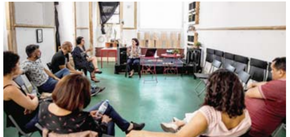
LISBON: Brazilians attend a meeting at the 'Brazil house' association - created by Brazilians living in Portugal.

Increasing numbers of students have also chosen to study in Portugal. From just over 11,000 in 2017, the figure shot up to around 18,000 last year. Portugal's deputy minister for higher education told AFP that Brazilians were attracted by "a country that is culturally close (with) a reputation for quality of life and security."