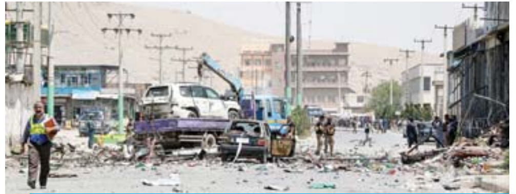
KABUL: Afghan security personnel remove a damage vehicle at the site, following a suicide bombing in Kabul yesterday.