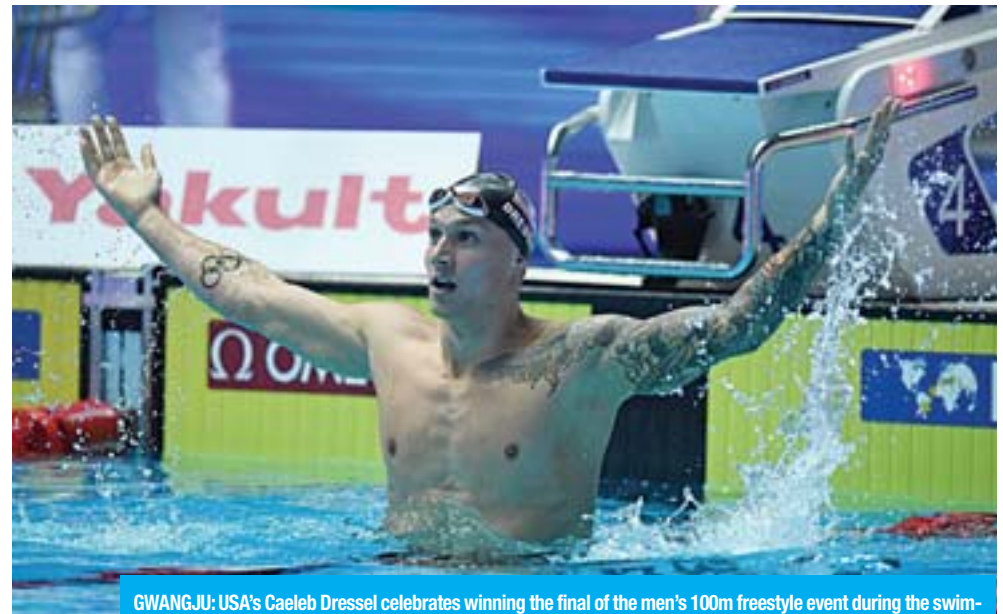
GWANGJU: USA’s Caeleb Dressel celebrates winning the final of the men’s 100m freestyle event during the swimming competition at the 2019 World Championships at Nambu University Municipal Aquatics Center.

American great Katie Ledecky returned to the pool after pulling out of her 1,500m title defense and the 200m free heats earlier in the week, producing a strong second leg in the women’s 4x200m free. But the Aussies clung on, as Emma McKeon anchored the green and gold to a third relay title of the week in a world-