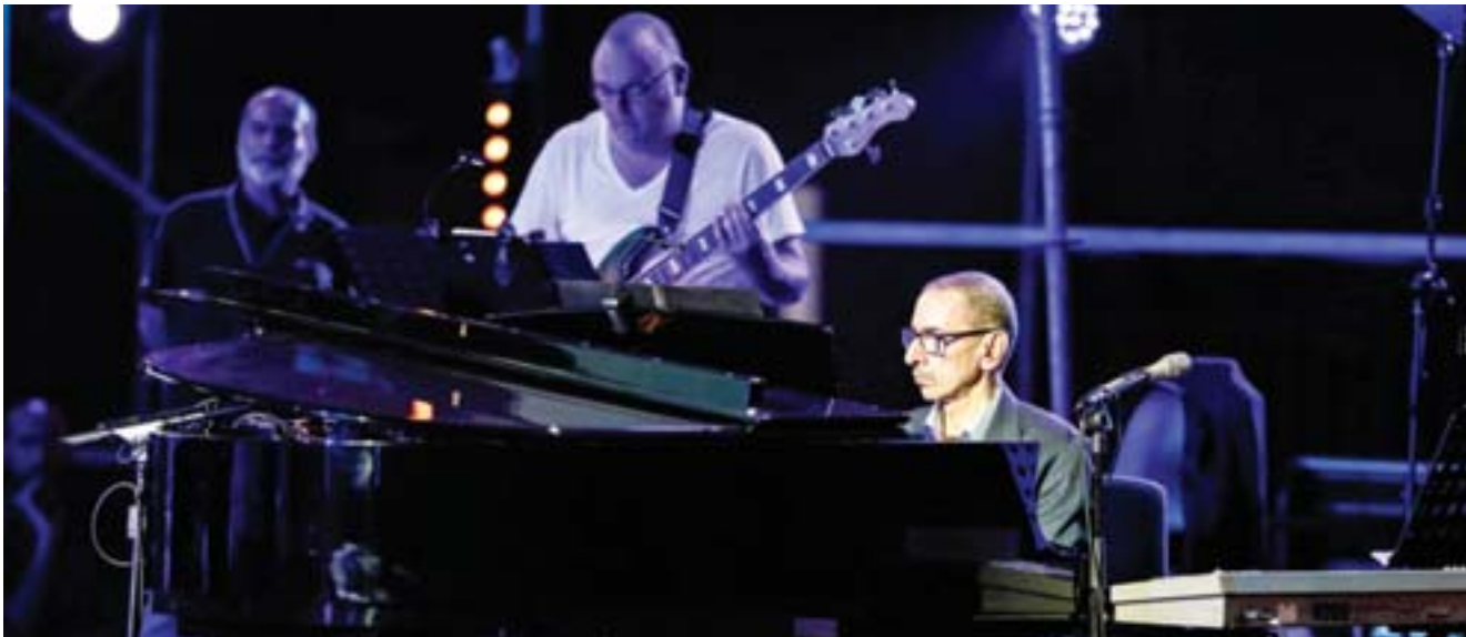
Lebanese pianist, composer and playwright Ziad Rahbani performs during the Beirut Holidays 2019 Festival at the waterfront in the Lebanese capital.