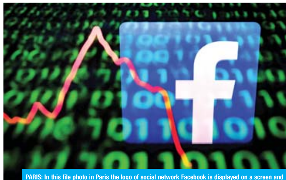
PARIS: In this file photo in Paris the logo of social network Facebook is displayed on a screen and reflected on a tablet.

G7 ministers "agreed that projects such as Libra may affect monetary sovereignty and the functioning of the international monetary system," France, the current G7 chair, said in a statement. It said projects like Libra with a