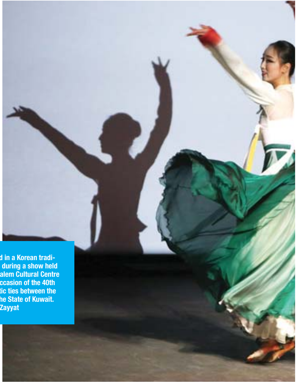
KUWAIT: Models dressed in a Korean traditional 'Hanbok' perform during a show held at Sheikh Abdullah Al-Salem Cultural Centre on Wednesday, on the occasion of the 40th Anniversary of diplomatic ties between the Republic of Korea and the State of Kuwait.