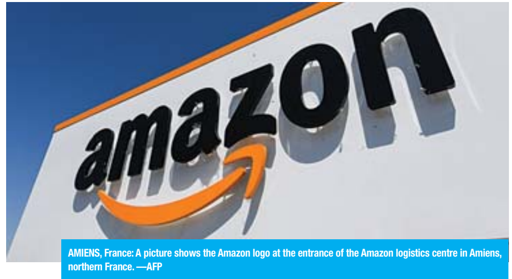
AMIENS, France: A picture shows the Amazon logo at the entrance of the Amazon logistics centre in Amiens, northern France.

Tech firms and their backers deny monopolistic conduct and argue the fast-evolving digital economy has robust competition and has led to lower prices and more choice for consumers. "US technology companies make the United States a global leader in innovation, power the economy, and deliver transformative benefits to people