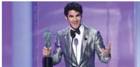
Darren Criss, winner of Outstanding Performance by a Male Actor in a Miniseries or Television Movie for 'The Assassination of Gianni Versace'.