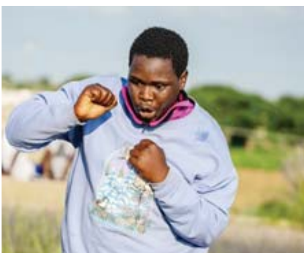
A man shadow boxes during a morning workout session.