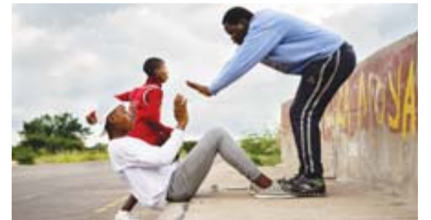
Youths go through their morning exercise routine near the township of Emakhandeni, outside the Zimbabwean city of Bulawayo.