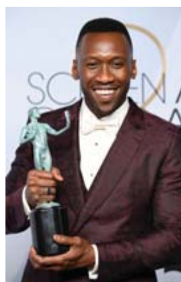
Outstanding Performance by a Male Actor in a Supporting Role for "Green Book" winner Mahershala Ali.