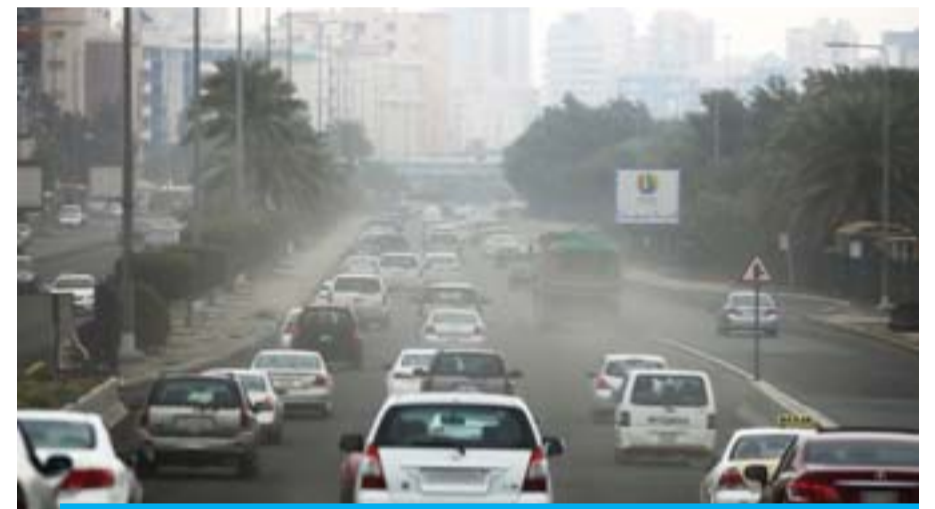
KUWAIT: A truck and cars are seen on a road in this file photo. Image used for illustrative purposes only.

Meanwhile, the administrative court yesterday annulled interior ministry decision 1293/2017 and clauses 29 and 27 added to article 207 of the traffic code pertaining impounding vehicles for two months for not wearing seatbelts and using mobile phones while driving. The court also ordered compensating KD 500 to the citizen who had filed the case.