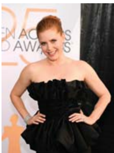
Amy Adams walks the red carpet.