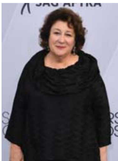
Actress Margo Martindale