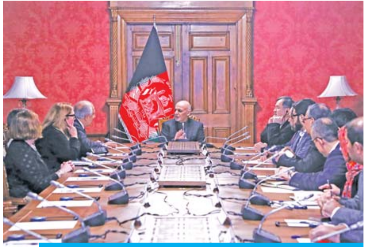
KABUL: In this handout photograph taken and released by the Afghan Presidential Palace on January 27, 2019, Afghan president Ashraf Ghani (C) talks with US special representative for Afghan Peace and reconciliation Zalmay Khalilzad (top L) during a cabinet meeting at the presidential palace. — AFP

He also confirmed there had been no progress on the issue of a ceasefire. Afghans have expressed tentative hopes about the talks tempered by fears of an American exit, with Afghan security forces taking staggering losses, the government facing election upheaval, and civilians paying a disproportionate price after nearly two decades of bloodshed. The Taleban and US officials have agreed to continue negotiations, though no date has been publicly announced. — AFP