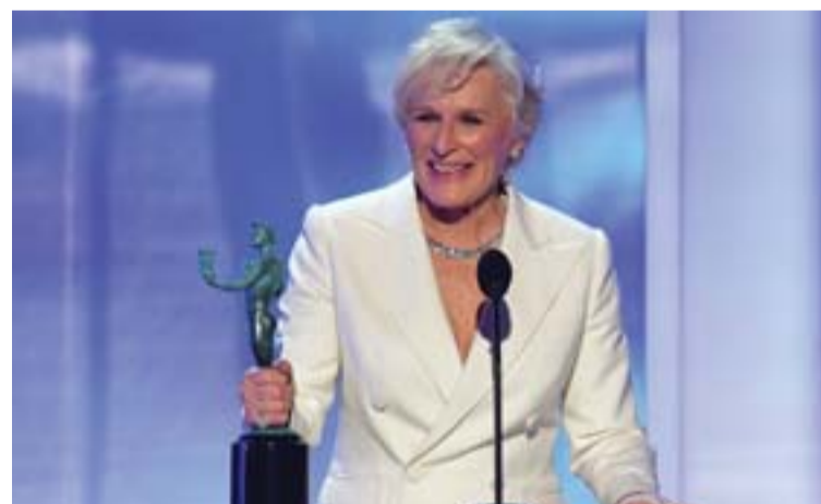
Actress Glenn Close accepts the award for Outstanding Performance by a Female Actor in a Leading Role for "The Wife".