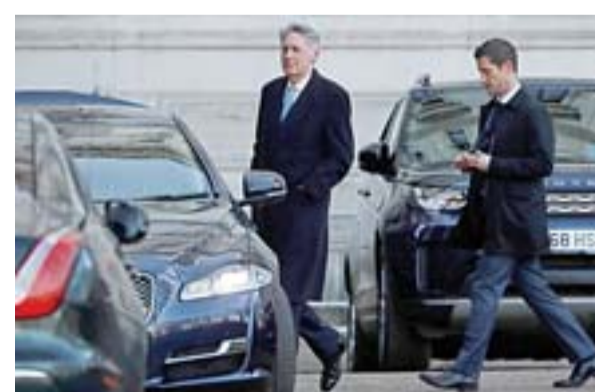
LONDON: Britain's Chancellor of the Exchequer Philip Hammond (center) arrives at the rear of Downing Street in central London yesterday.

"Nearly all larger firms are now preparing for Brexit, after some came late to the party-however the timing of no-deal