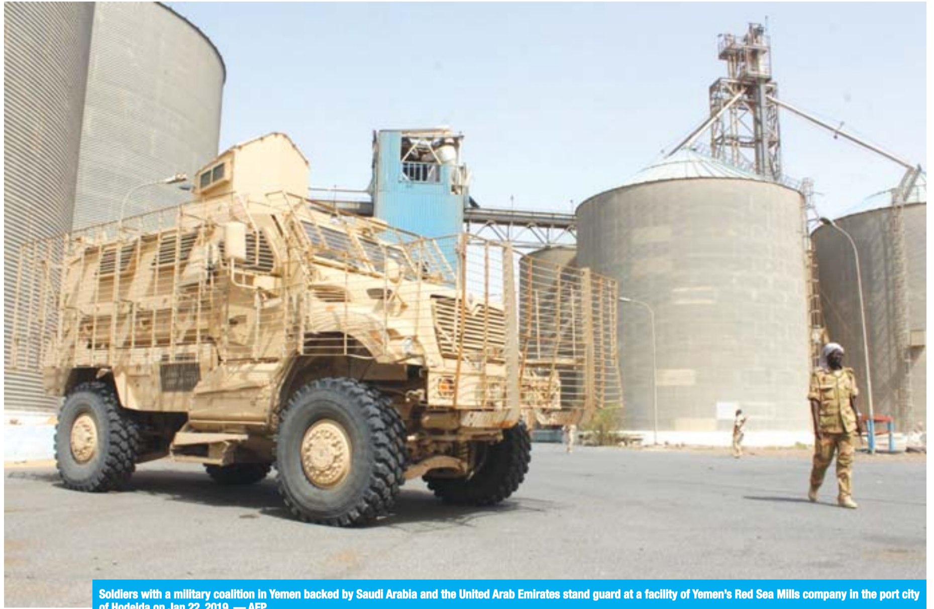
Soldiers with a military coalition in Yemen backed by Saudi Arabia and the United Arab Emirates stand guard at a facility of Yemen's Red Sea Mills company in the port city of Hodeida on Jan 22, 2019.