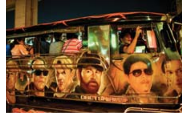
Custom artwork on the side of a jeepney as a driver's assistant (right) calls for passengers during rush hour in Manila.