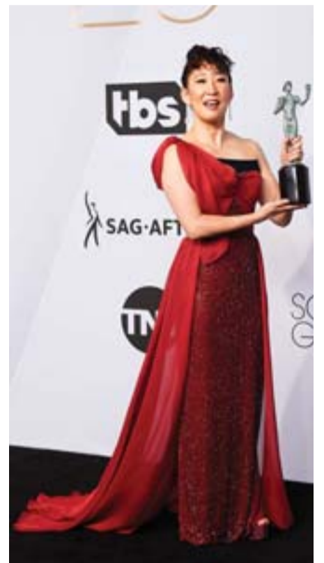
Sandra Oh, winner of Outstanding Performance by a Female Actor in a Drama Series for 'Killing Eve.'