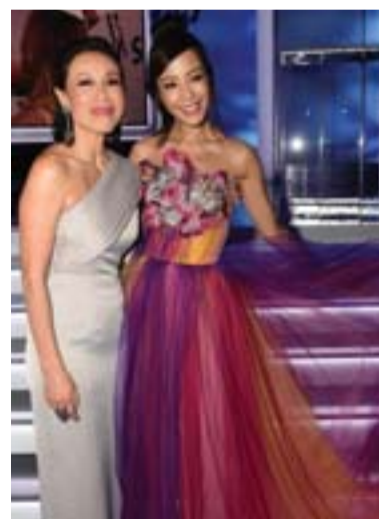
Actresses Tan Kheng Hua (left) and Fiona Xie.