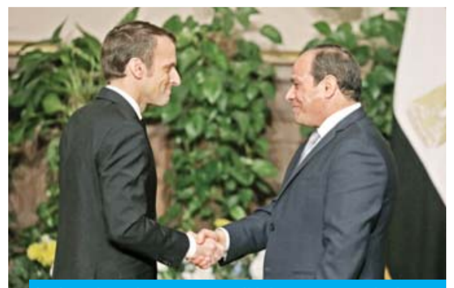
CAIRO: Egyptian President Abdel Fattah Al-Sisi (right) shakes hands with his French counterpart Emmanuel Macron after their joint press conference yesterday.