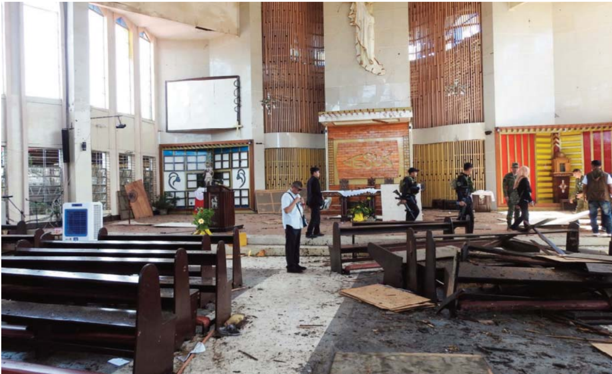
JOLO: Philippine soldiers walk past the damaged area of a catholic cathedral in Jolo town, sulu province, in southern island of Mindanao yesterday a day after two explosions tore through the cathedral.