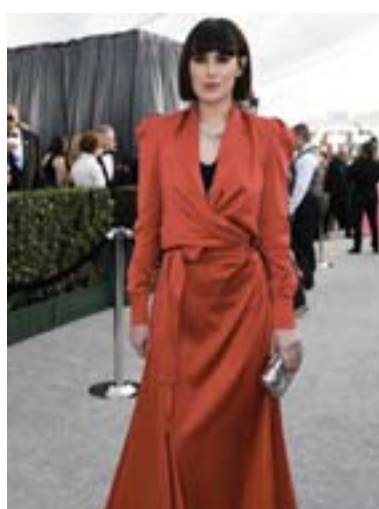
Actress Rumer Willis