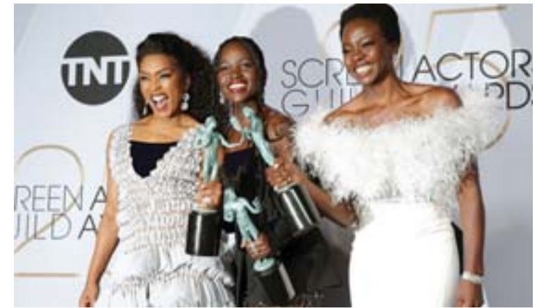
(From left) Angela Bassett, Lupita Nyong'o and Danai Gurira winners of Outstanding Performance by a Cast in a Motion Picture for "Black Panther" pose in the press room.