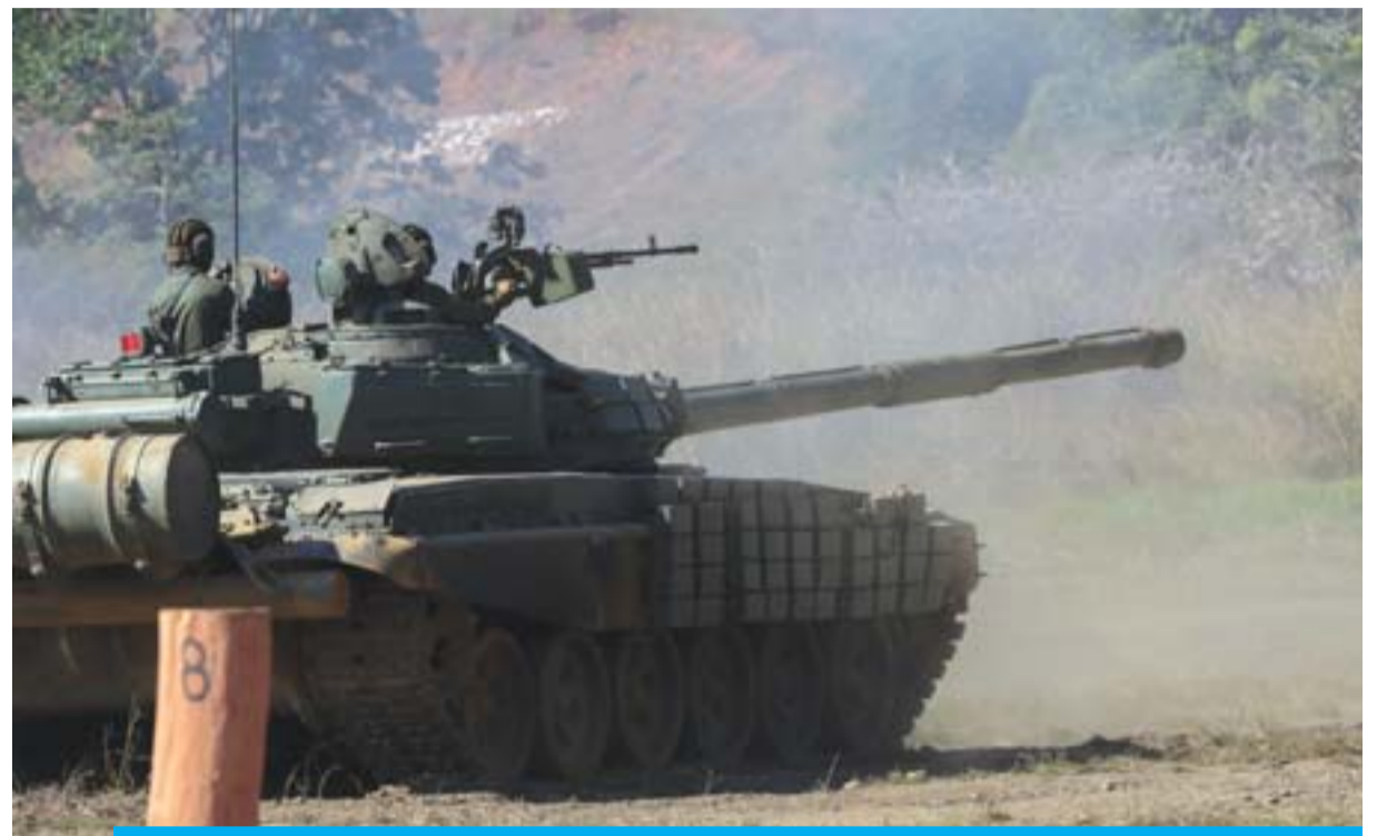
NAGUANAGUA: Handout picture released by the Venezuelan presidency showing a Russian-made T72 tank taking part in military exercises at Fort Paramacay in Naganagua, Carabobo State, Venezuela, on January 27, 2019.

The warning didn't address specific groups or individuals, but Bolton noted in a linked tweet that Cuba's "support and control over Maduro's security and paramilitary forces" was well known. Washington also accepted exiled opposition leader Carlos Vecchio as Venezuela's new charge d'affaires to the United States after he was tapped by Guaido. Pope Francis, winding up a trip to Panama, said he was praying that "a just and peaceful solution is