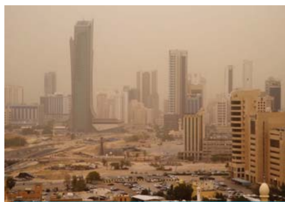
KUWAIT: A sudden dust storm blanketed Kuwait yesterday, accompanied with rains as the country was affected by active southeastern winds with speeds up to 60 kilometers per hour that dropped visibility to less than 1,000 meters in some areas.

sion, the apparatus said in a statement. Medlej affirmed Kuwait's interest in promoting cooperative relations between Kuwait and China, while the Chinese ambassador stressed continuing cooperation between both countries, according to the statement. — KUNA