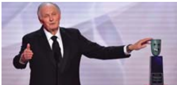
SAG Life Achievement Award for career achievement and humanitarian accomplishment recipient actor Alan Alda speaks onstage during the 25th Annual Screen Actors Guild Awards.