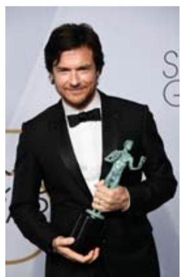
Jason Bateman, winner of Outstanding Performance by a Male Actor in a Drama Series for "Ozark".