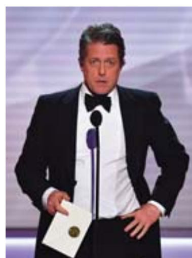
Actor Hugh Grant speaks onstage.