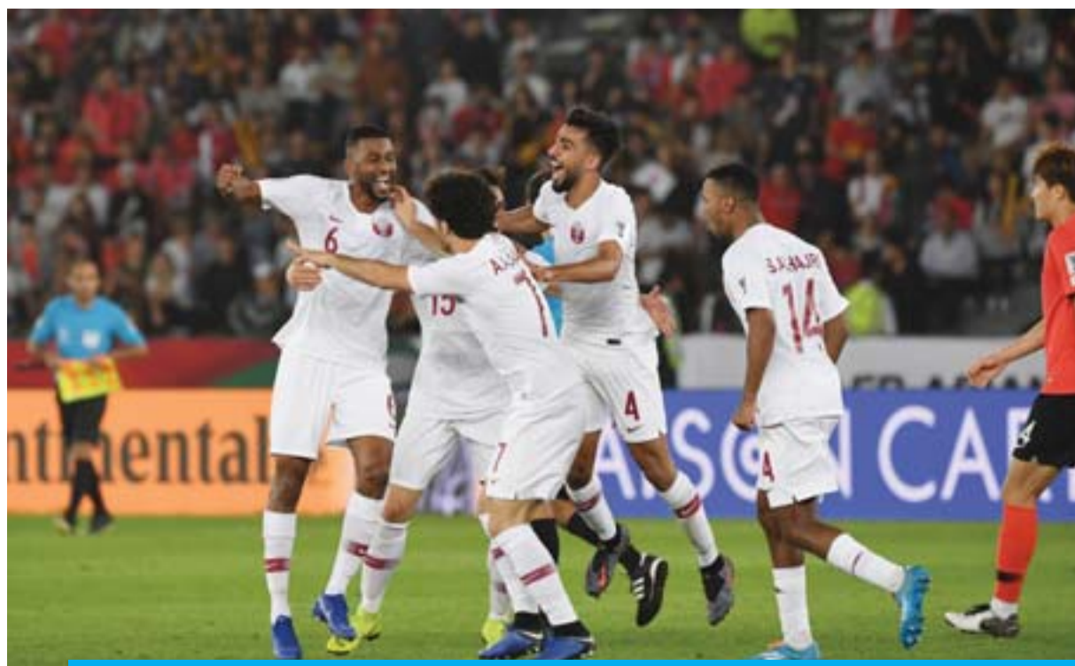
ABU DHABI: File photo shows Qatar's players celebrate their victory during the 2019 AFC Asian Cup quarter-final football match between South Korea and Qatar at Zayed Sports City in Abu Dhabi on January 25, 2019.