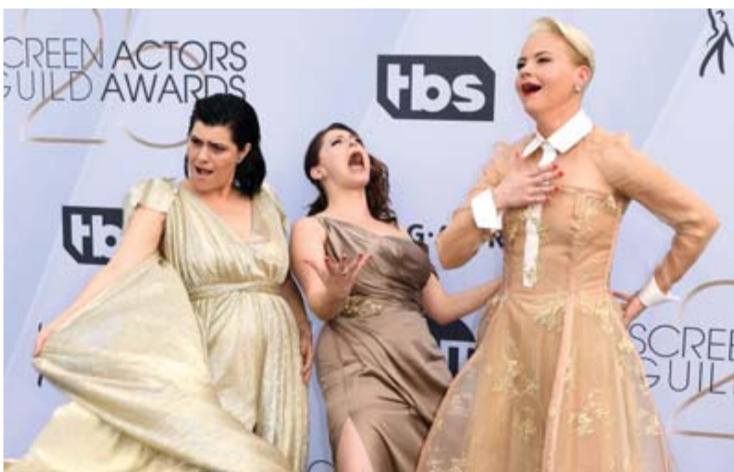
(From right) Actresses Kimmy Gatewood, Rachel Bloom and Rebekka Johnson.