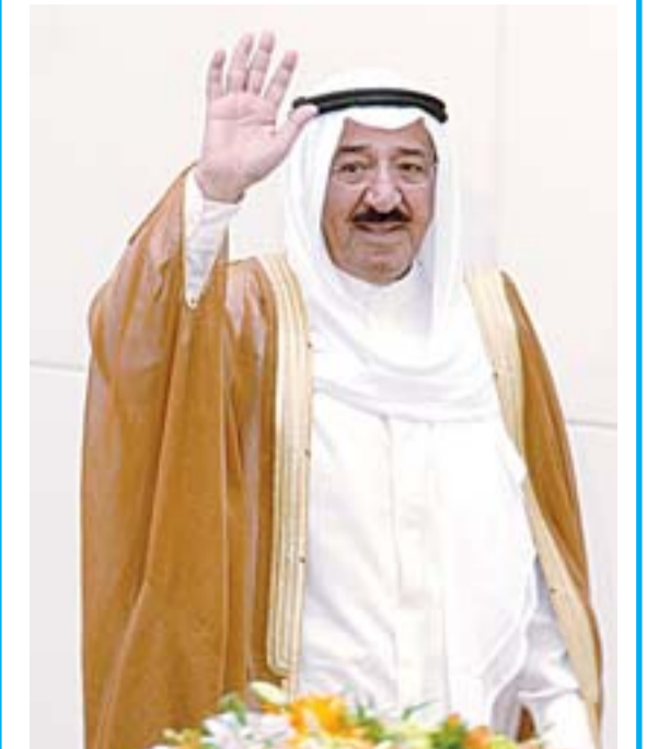
His Highness the Amir Sheikh Sabah Al-Ahmad Al-Jaber Al-Sabah

KUWAIT: Some 13 years after the ascendency of His Highness the Amir Sheikh Sabah Al-Ahmad Al-Jaber Al-Sabah, officials from across Kuwait's political spectrum made statements yesterday marking the joyous occasion. Kuwaitis from all walks of life share a "very special and transparent" relationship with His Highness the Amir, the Gulf state's top lawmaker Marzouq Al-Ghanem said in a statement. Celebrating the reign of His Highness the Amir conjures up the fact that his infinite wisdom makes him a strategic leader and a guarantor of security, Ghanem added. "We as Kuwaitis are cognizant of the herculean efforts His Highness the Amir is exerting to protect the country in a region rife with peril," Kuwait's chief lawmaker went on to say.