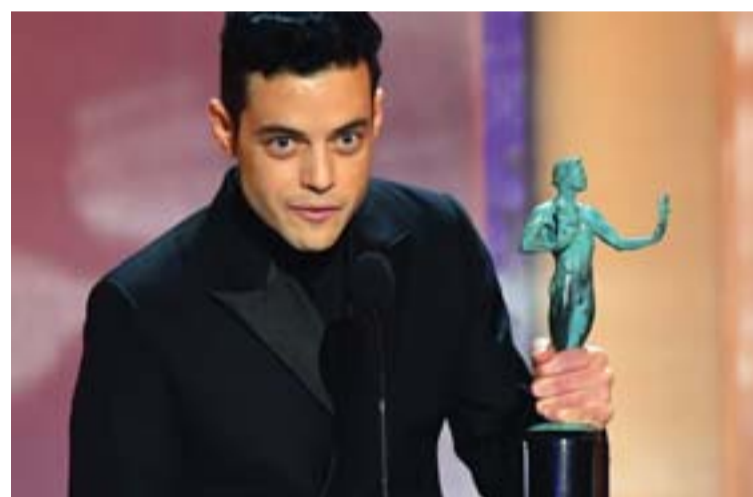
Rami Malek accepts the award for Outstanding Performance by a Male Actor in a Leading Role in "Bohemian Rhapsody".