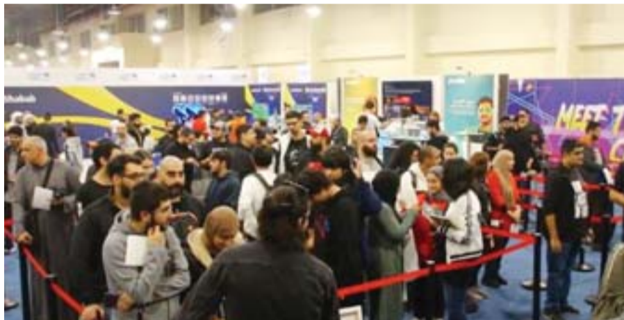
From the event.

KUWAIT: Zain, the leading digital service provider in Kuwait, announced its platinum sponsorship of the Electronic Gaming and Comics Festival 2019 (EG&COMFEST 2019) that was held from 24-26 January at Kuwait International Fair Ground in Mishref. The event, considered the biggest of its kind in Kuwait, witnessed huge crowds of gaming, comics, and pop culture fans.