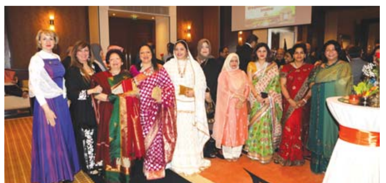
A group photo of guests at the event.