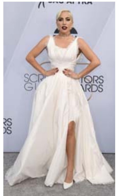
Outstanding Performance by a Female Actor in a Leading Role for "A Star is Born" nominee Lady Gaga arrives.