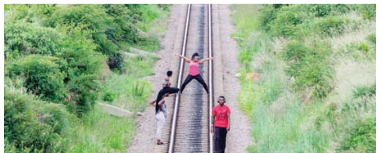
People go through their morning exercise routine along a railway track.