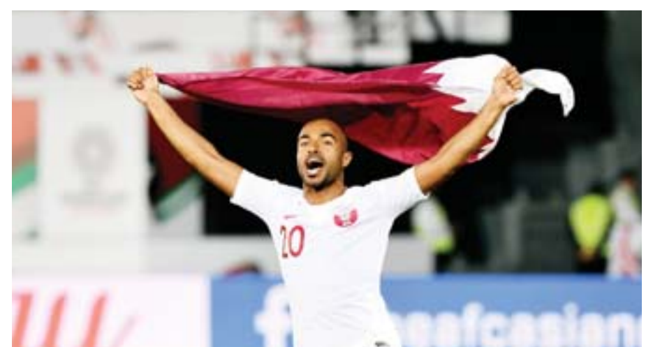
ABU DHABI: Qatar's midfielder Ali Yahya celebrates with the national flag after an Asian Cup quarterfinal match between South Korea and Qatar at Zayed Sports City on Jan 25, 2019.