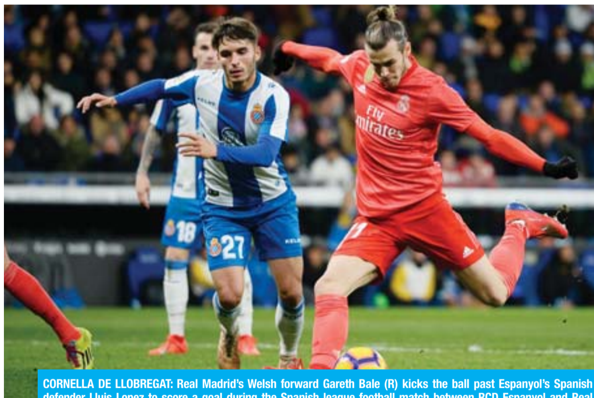
CORNELLA DE LLOBREGAT: Real Madrid's Welsh forward Gareth Bale (R) kicks the ball past Espanyol's Spanish defender Lluís Lopez to score a goal during the Spanish league football match between RCD Espanyol and Real Madrid CF at the RCDE Stadium in Cornellà de Llobregat on Sunday.

Madrid were reduced to 10 men later in the game when Raphael Varane was given a straight red card for