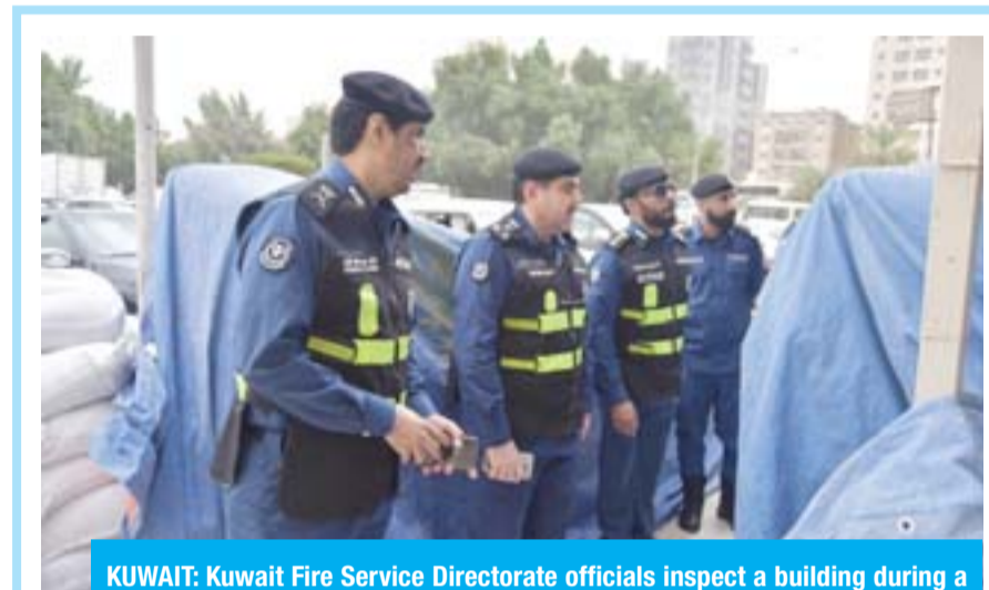
KUWAIT: Kuwait Fire Service Directorate officials inspect a building during a recent campaign in Jleeb Al-Shuyoukh.

Zain's support to this event came in line with its core objectives that aim at shouldering the advancement of the community as a whole on all levels, where the company reaffirms the principal of partnership through similar efforts with the aim of contributing to the further progress of national economy.