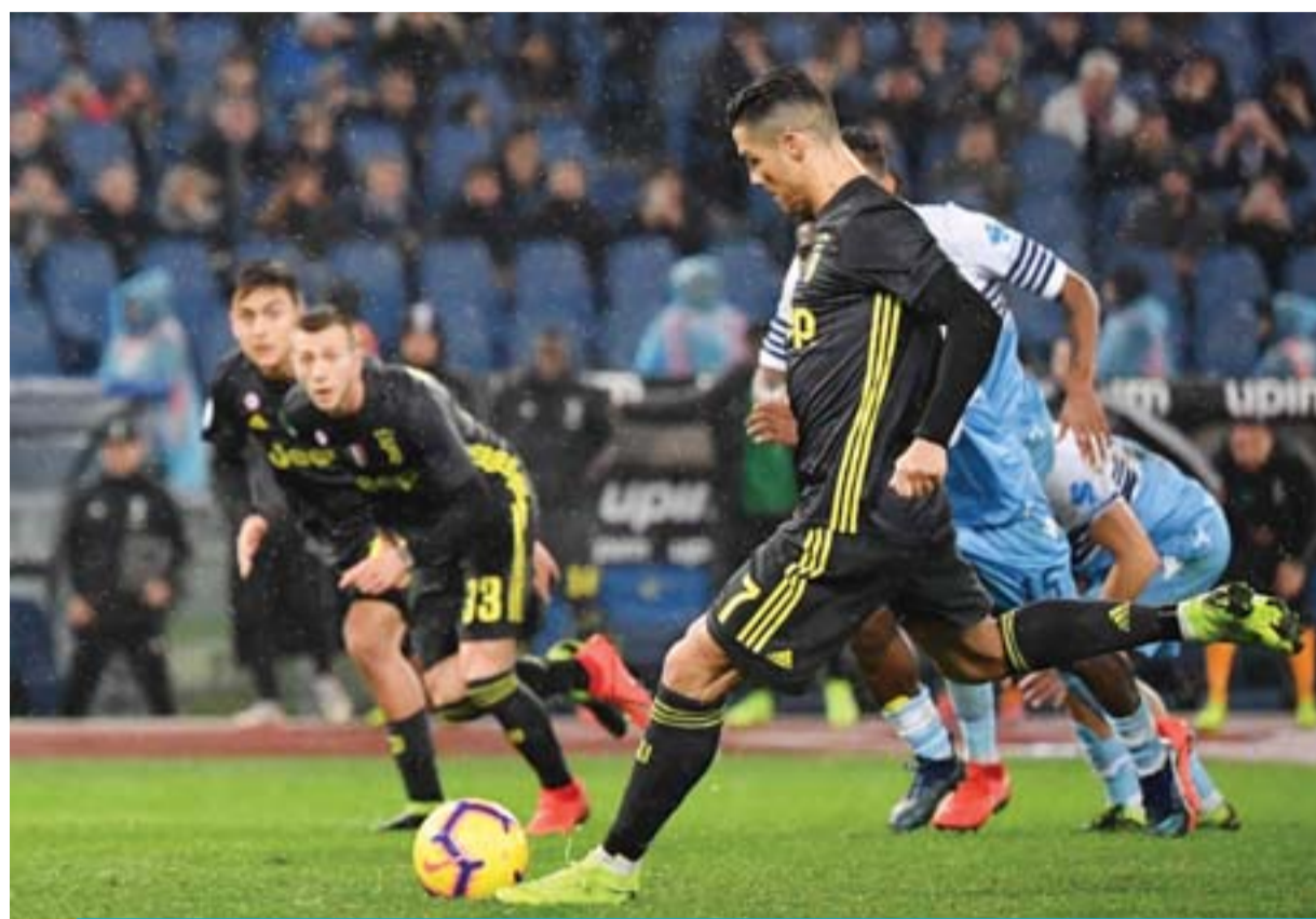
ROME: Juventus' Portuguese forward Cristiano Ronaldo shoots to score a penalty during the Italian Serie A football match Lazio Roma vs Juventus on Sunday at the Olympic stadium in Rome.

Di Francesco's men struggled after the break with former Roma defender Rafael Toloio nodding in Atalanta's second just before the hour off a Papu Gomez cross. Zapata missed a chance for a third ten minutes later sending a penalty kick over the bar.