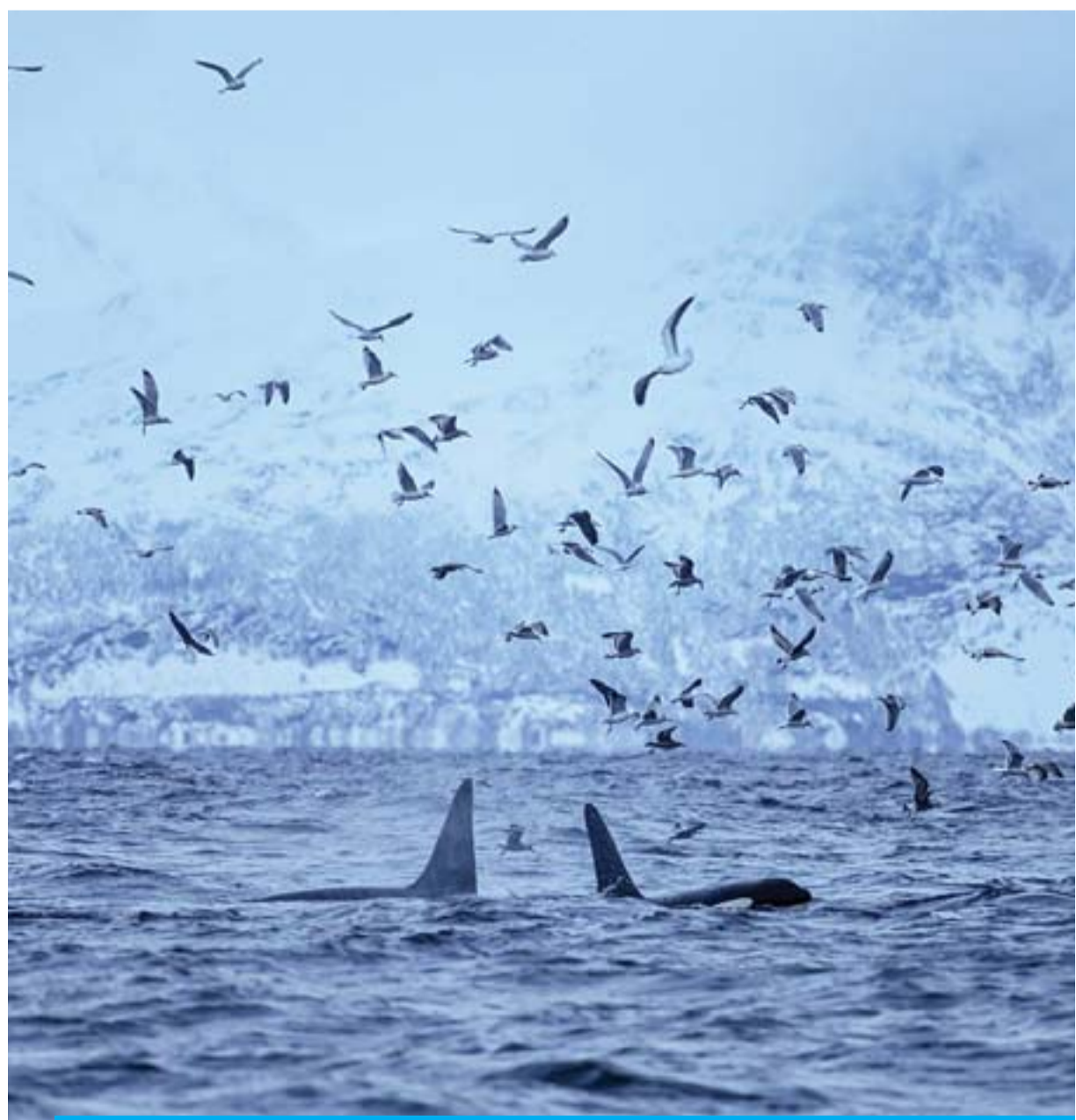
Orcas chase herrings on Jan 17, 2019 in the Reisafjorden fjord region near the Norwegian northern city of Tromsø on the Arctic Circle.

"My client received justice after she was taken advantage of and tricked into something that crimi-