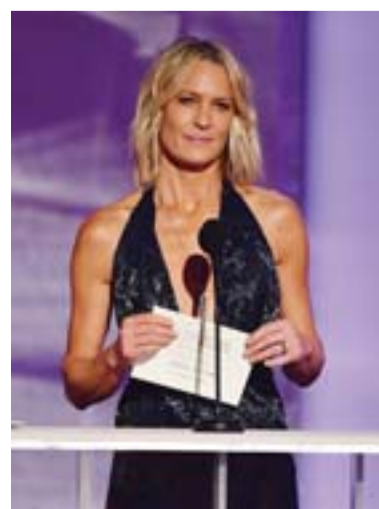
Actress Robin Wright speaks on stage.