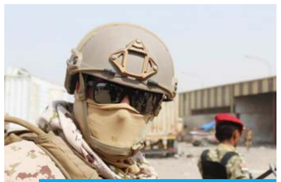
HODEIDA: Soldiers with a military coalition in Yemen backed by Saudi Arabia and the United Arab Emirates stand guard at a facility of Yemen's Red sea mills company in the port city of Hodeida.

The Hodeida agreement stipulates a full ceasefire, followed by the withdrawal and redeployment of rival forces from the city — two clauses that have yet to be fulfilled. Griffiths said yesterday another round of consultations was temporarily on hold pending progress on the current agreements. Earlier this month he had said that planned talks had been postponed until