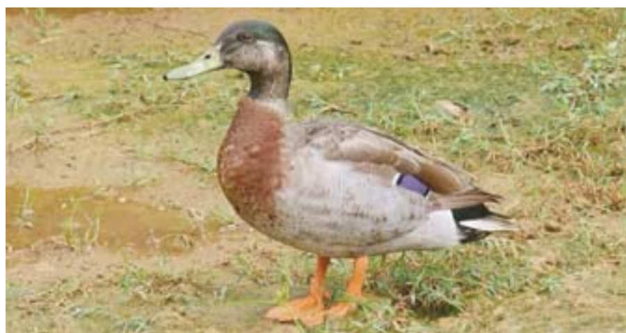
This handout photo taken in 2018 shows Trevor the duck on the Pacific island of Niue.