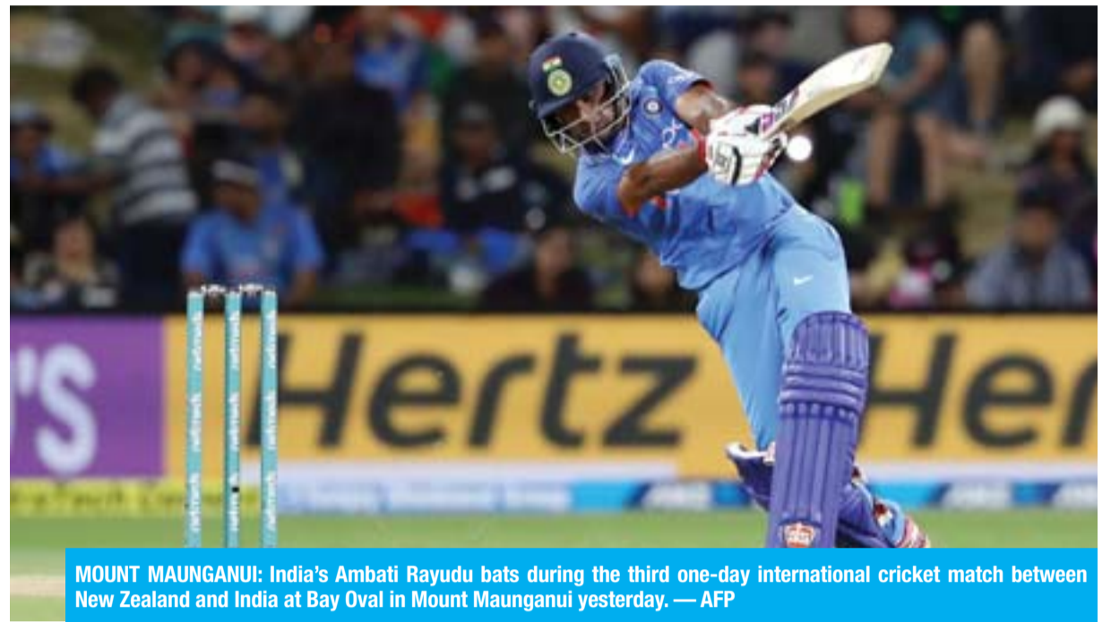
MOUNT MAUNGANUI: India's Ambati Rayudu bats during the third one-day international cricket match between New Zealand and India at Bay Oval in Mount Maunganui yesterday.

Ross Taylor (93) and Tom Latham (51) gave the innings credibility but proved no challenge for the visitors. Sharma's first wicket partnership of 39 ended when Shikhar Dhawan edged Trent Boult to the lone slip Taylor