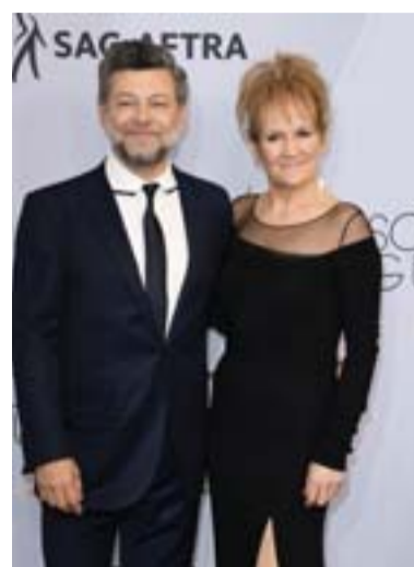
Actor Andy Serkis and his wife Lorraine Ashbourne.