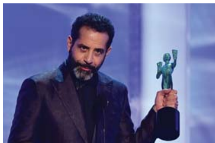
Tony Shalhoub accepts the award for outstanding Performance by a Male Actor in a Comedy Series for "The Marvelous Mrs. Maisel".

Groundbreaking superhero blockbuster "Black Panther" on Sunday won the top prize at the Screen Actors Guild Awards—a major boost to its campaign for Oscars glory next month. The film won for best ensemble cast, besting musical romance "A Star Is Born," Spike Lee's "BlacKkKlansman," Queen biopic "Bohemian Rhapsody" and rom-com "Crazy Rich Asians." Chadwick Boseman, who plays the title role in what was the top-grossing film in North America in 2018, explained the film's significance alongside his co-stars, nearly all of them black. "We all know what it's like to be told that there is not a place for you to be featured, yet you are young, gifted and black," Boseman told the audience at the Shrine Auditorium.