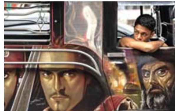
Custom artwork on the side of a jeepney as a driver's assistant waits for passengers during rush hour in Manila.

French fashion designer Christian Louboutin launched a jeepney-themed handbag collection last year, while Swedish furniture giant Ikea painted a jeepney in its signature blue and yellow to announce plans to open a Philippine store. But the vehicles, which were first made from leftover US jeeps after World War II, have been on