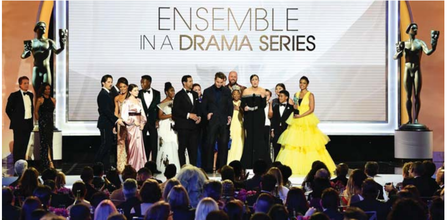
The cast of "This Is Us" accepts the award for Ensemble in a Drama Series onstage.