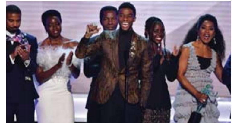
Chadwick Boseman (center), Michael B. Jordan (left), Danai Gurira (second left), Lupita Nyong'o (second right), Angela Bassett (right) and the cast of "Black Panther" accept the award for best Cast In A Motion.