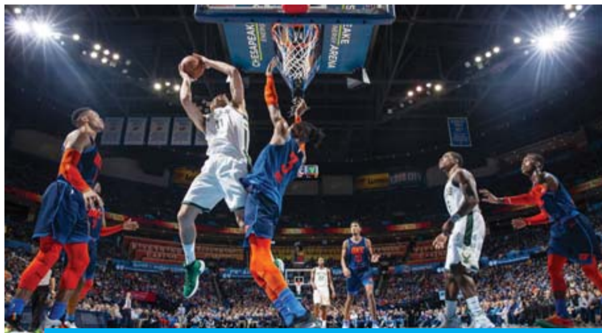
OKLAHOMA CITY: Brook Lopez #11 of the Milwaukee Bucks shoots the ball against the Oklahoma City Thunder on Sunday at Chesapeake Energy Arena in Oklahoma City, Oklahoma.

Ivica Zubac had 24 points and a career-high 16 rebounds and host Los Angeles avoided a season-long