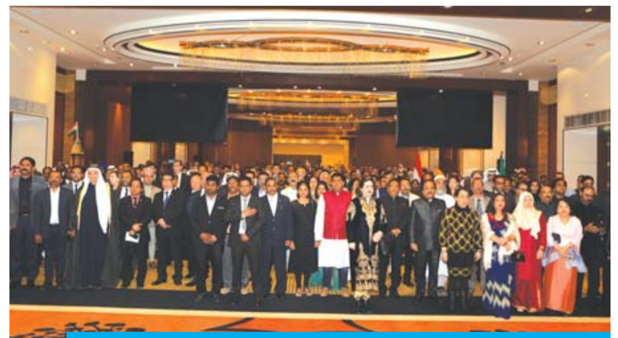
A general view of people in attendance.

ing with Indian workers and to overcome any impediments in this regard. — KUNA