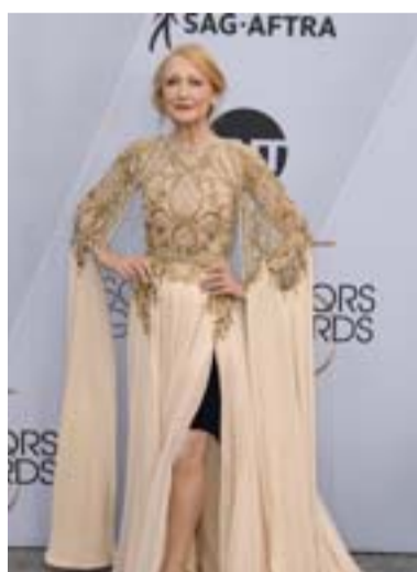
Actress Patricia Clarkson