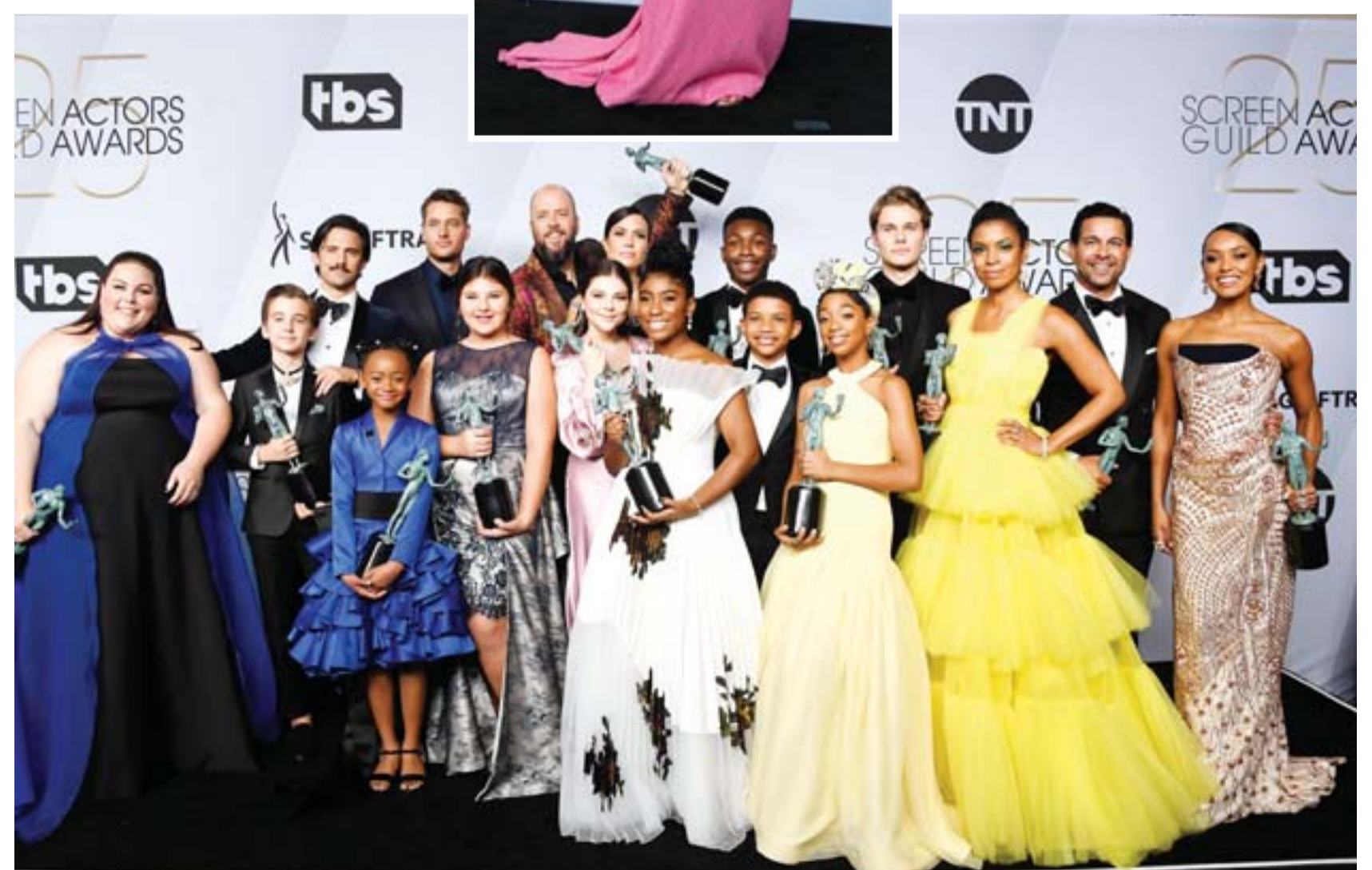
'This Is Us,' winners of Outstanding Performance by an Ensemble in a Drama Series.