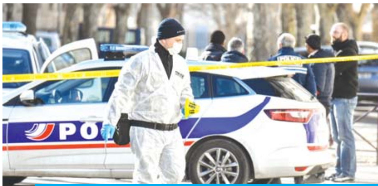
TARASCON: A forensic police officer searches for evidences yesterday outside the Courthouse of Tarascon.