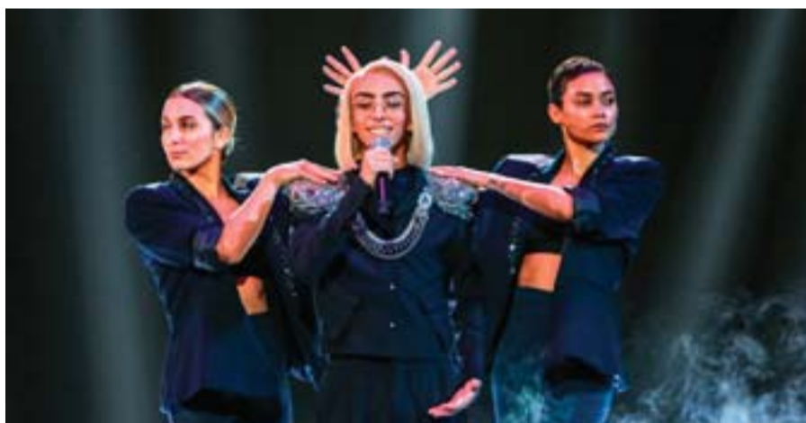
This handout shows French singer Bilal Hassani (center) performing on stage in Paris during Destination Eurovision France television's broadcast.

Heavily made up a la Kim Kardashian—albeit far less curvy—his success owes much to his big personality, flaunting what he calls his "fabulousness". Encouraging messages flooded in on Hassani's YouTube channel after he was picked for Eurovision on Saturday. "I wanted to thank you — even if you don't read this comment, it's thanks to you that I've managed to have confidence in myself," wrote one fan.