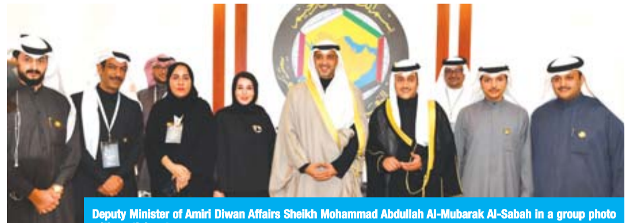
Deputy Minister of Amiri Diwan Affairs Sheikh Mohammad Abdullah Al-Mubarak Al-Sabah in a group photo with participants.