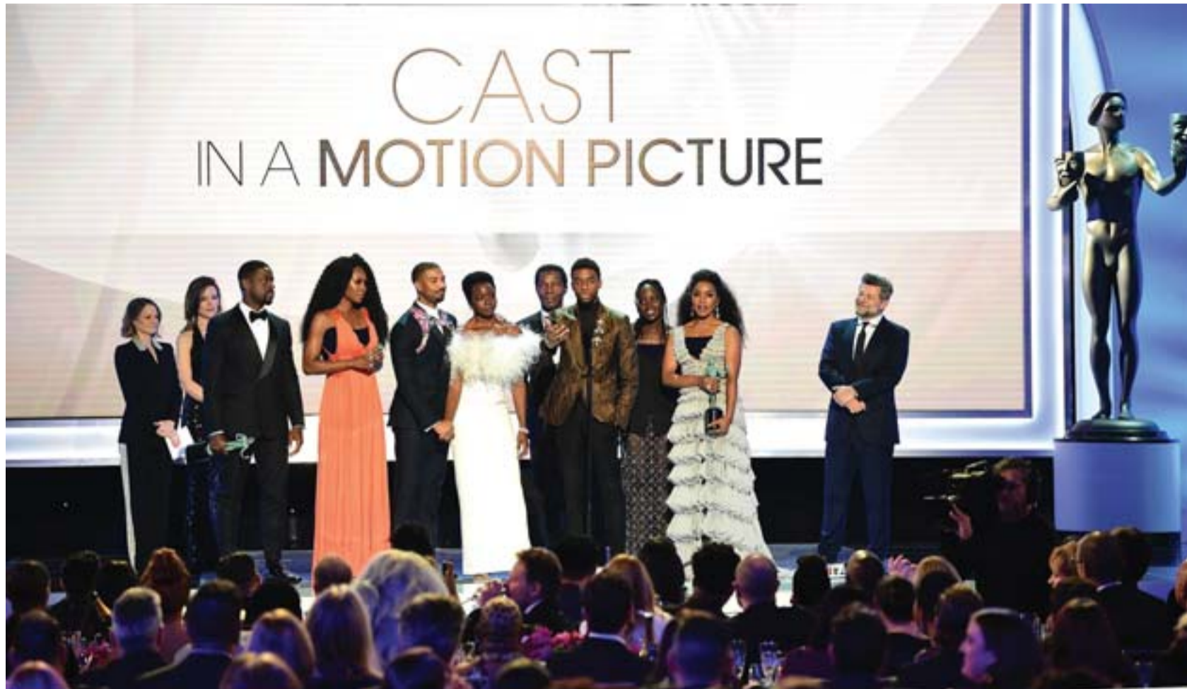
Chadwick Boseman and the cast of "Black Panther" accept the award for best Cast In A Motion Picture during the 25th Annual Screen Actors Guild Awards show at the Shrine Auditorium in Los Angeles.