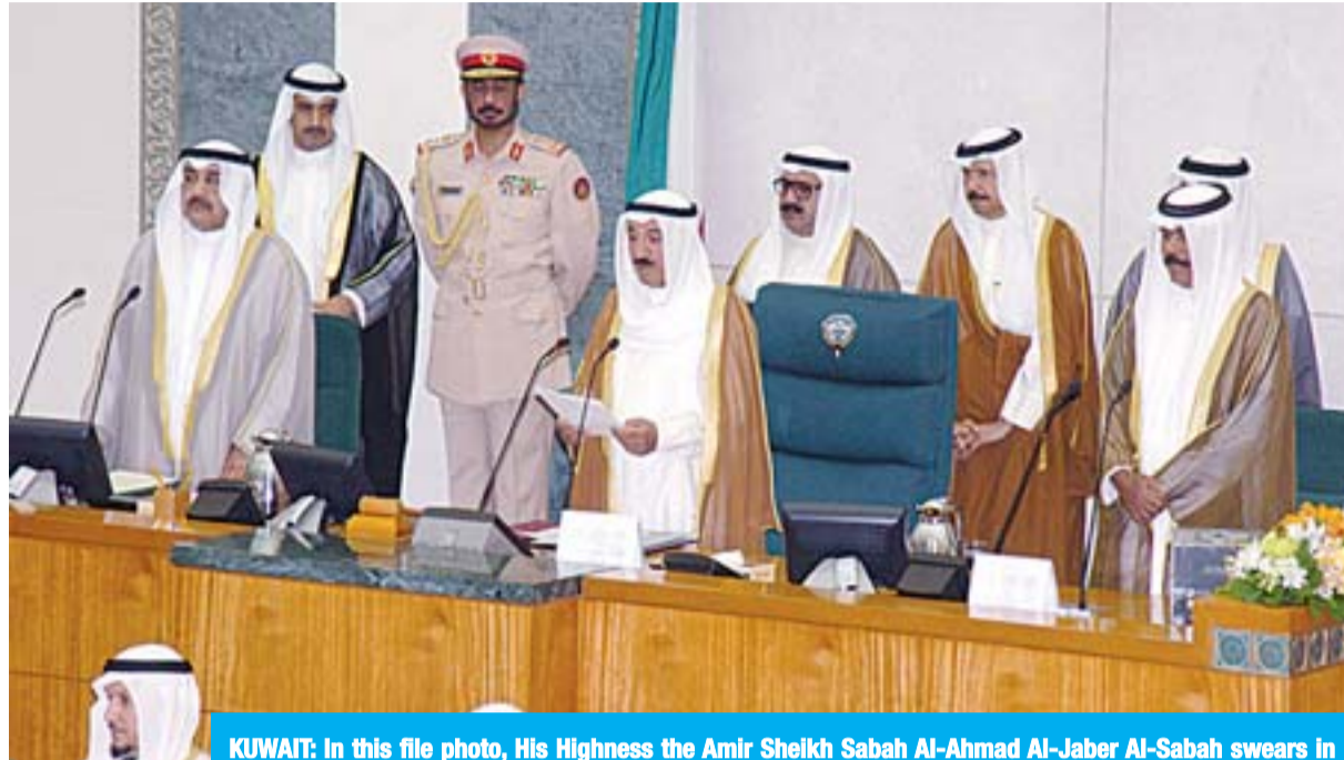
KUWAIT: In this file photo, His Highness the Amir Sheikh Sabah Al-Ahmad Al-Jaber Al-Sabah swears in as the 15th Amir and ruler of Kuwait at the National Assembly.

Throughout his tenure, the then minister assumed a balanced foreign policy that enabled Kuwait to overcome some difficult periods such as the Iraq-Iran War of 1980 and its repercussions on the internal and external security and stability of his country. He also forged a strong relationship with countries around the world, particularly the five permanent member nations