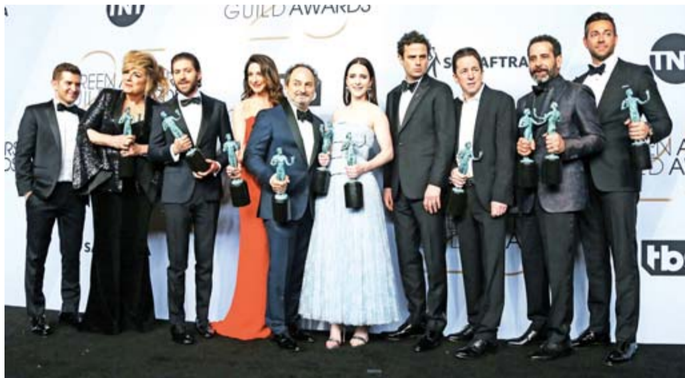
Ensemble in a Comedy Series winners the cast of "The Marvelous Mrs. Maisel".