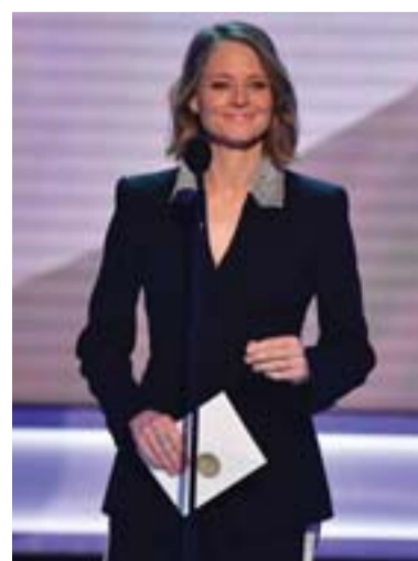
Actor Jodie Foster speaks on stage.