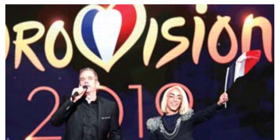
This handout picture released by France television shows French singer Bilal Hassani waving a French flag next to Canadian singer Garou (left) in Paris during Destination Eurovision France television's broadcast.

some videos are confessional, while others feature make-up tutorials or covers of songs by stars such as Ed Sheeran and Ariana Grande. His Eurovision entry, co-written with last year's French contenders Madame Monsieur, has already racked up nearly six million views online. In any case, Hassani is already looking beyond the competition in Tel Aviv: his debut album is due out this spring, under the French label Low Wood. — AFP