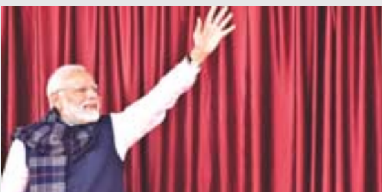
MEDININAGAR: In this file photo taken on January 05, 2019, Indian Prime Minister Narendra Modi waves to the crowd in Medininagar, during a campaign sweep through eastern Jharkhand state to inaugurate development projects. — AFP

The government is ready with relief measures for farmers, benefits for unemployed youth, higher tax exemptions for the middle class and small businesses, the officials said. — Reuters