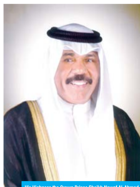
His Highness the Crown Prince Sheikh Nawaf Al-Ahmad Al-Jaber Al-Sabah