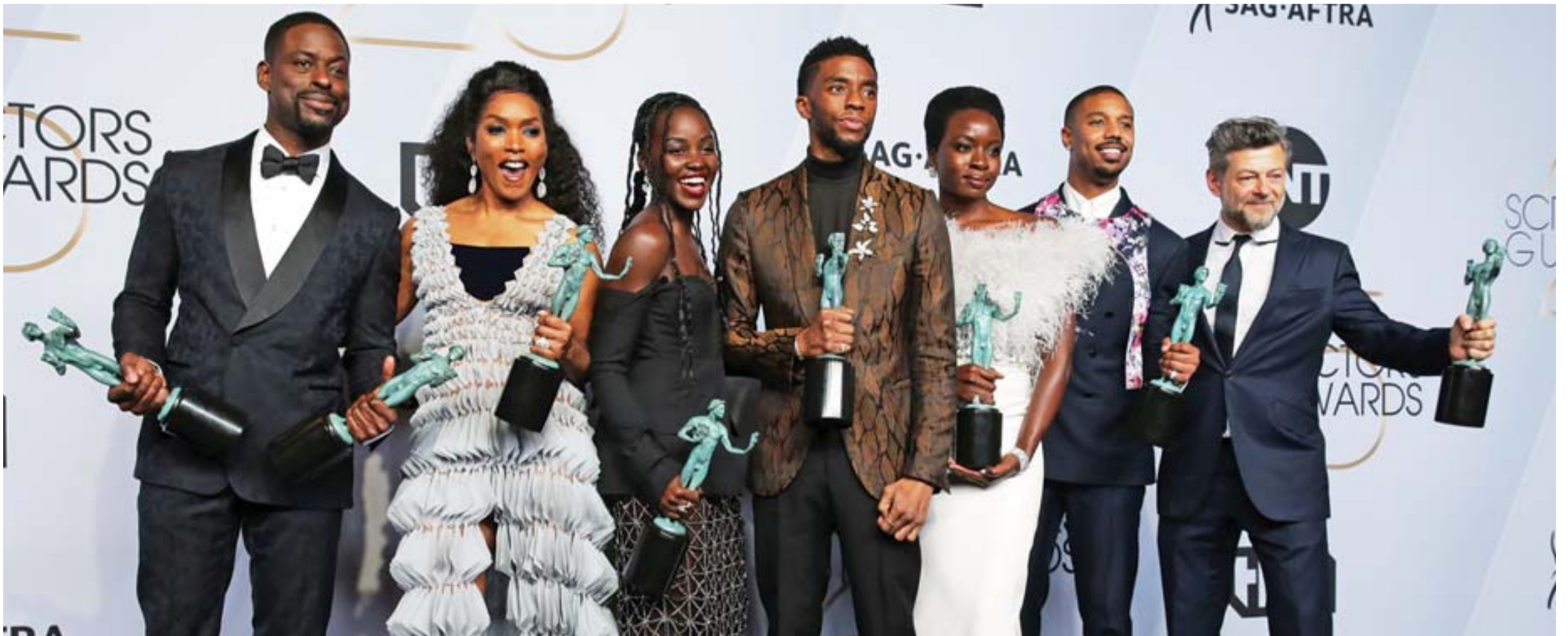
(From left) Sterling K Brown, winner of Outstanding Performance by a Cast in a Motion Picture for "Black Panther" and Outstanding Performance by an Ensemble in a Drama Series for "This Is Us;" Angela Bassett, Lupita Nyong'o, Chadwick Boseman, Danai Gurira, Michael B. Jordan, and Andy Serkis, winners of Outstanding Performance by a Cast in a Motion Picture for "Black Panther," pose in the press room at the 25th annual Screen Actors Guild Awards at The Shrine Auditorium in Los Angeles, California.