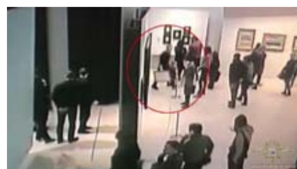
An image shows a man, stealing a famous painting by Arkhip Kuindzhi during an exhibition at the Tretyakov Gallery in Moscow. — AFP photos

The theft comes after a man slashed a painting by celebrated Russian artist Ilya Repin, depicting 16th-century Tsar Ivan the Terrible after he killed his son. Police arrested a 37-year-old who used a metal pole to break the glass covering the picture, damaging the work in three places. The gallery is currently hosting an exhibition with more than 120 Kuindzhi paintings that will run until February 17. On its website, the gallery calls Arkhip Kuindzhi, who died in 1910, "one of the most memorable figures in Russian painting of the second half of the 19th century." — AFP