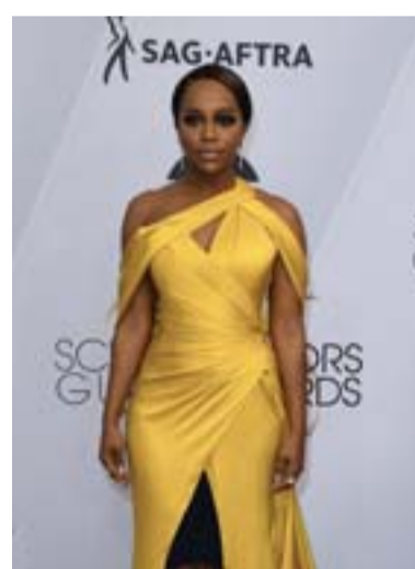
Actress Aja Naomi King