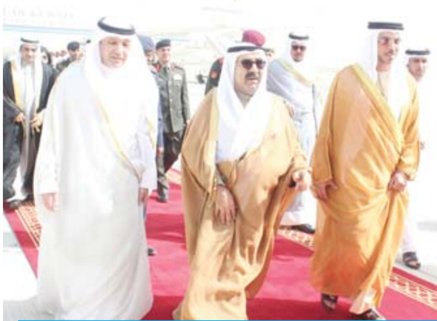
ABU DHABI: Kuwaiti First Deputy Prime Minister and Minister of Defense Sheikh Nasser Sabah Al-Ahmad Al-Sabah is welcomed upon his arrival to Abu Dhabi yesterday.