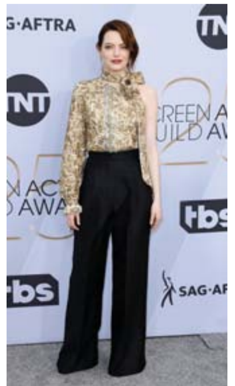
Outstanding Performance by a Female Actor in a Supporting Role for "The Favourite" and Outstanding Performance by a Female Actor in a Television Movie or Miniseries for "Maniac" nominee Emma Stone.