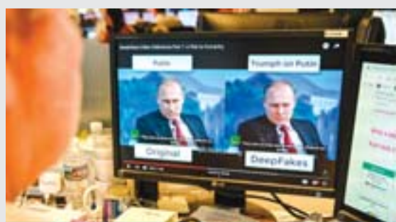
An AFP journalist views a video on Jan 25, 2019, manipulated with artificial intelligence to potentially deceive viewers at his newsdesk in Washington, DC.

While deepfakes have been evolving for several years, the topic came into focus with the creation last April of video appearing to show former president Barack Obama using a curse word to describe his successor Donald Trump - a coordinated stunt from filmmaker Jordan Peele and BuzzFeed. Also in 2018, a proliferation of "face swap" porn videos that used images of Emma Watson, Scarlett Johansson and other celebrities prompted bans on deepfakes by Reddit, Twitter and Pornhub, though it remained unclear if they could enforce the policies.