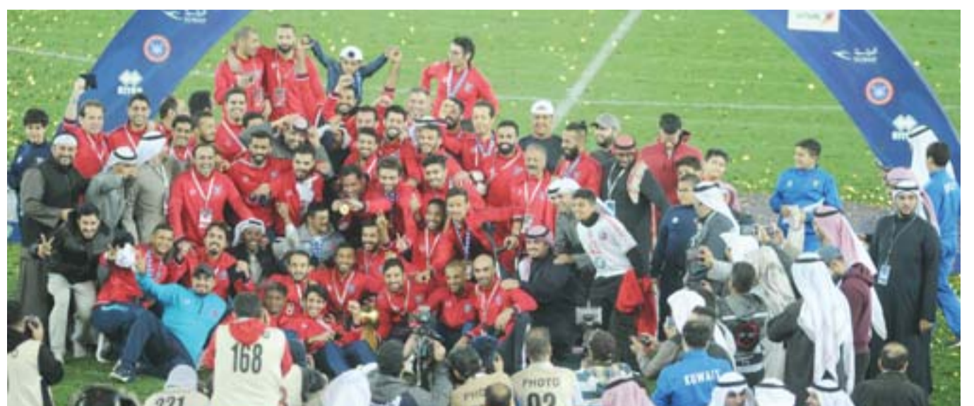
KUWAIT: Kuwait SC players celebrate their victory after winning His Highness the Crown Prince Football Cup in Kuwait yesterday.

KUWAIT: Kuwait SC won His Highness the Crown Prince Football Cup after beating rival Qadsia SC 1-0 yesterday. Faisal Zayed scored Kuwait's sole goal to give the club's seventh Crown Prince Football Cup title. His Highness the Crown Prince Sheikh Nawaf Al-Ahmad Al-Jaber Al-Sabah attended the final match. The first half witnessed moder-