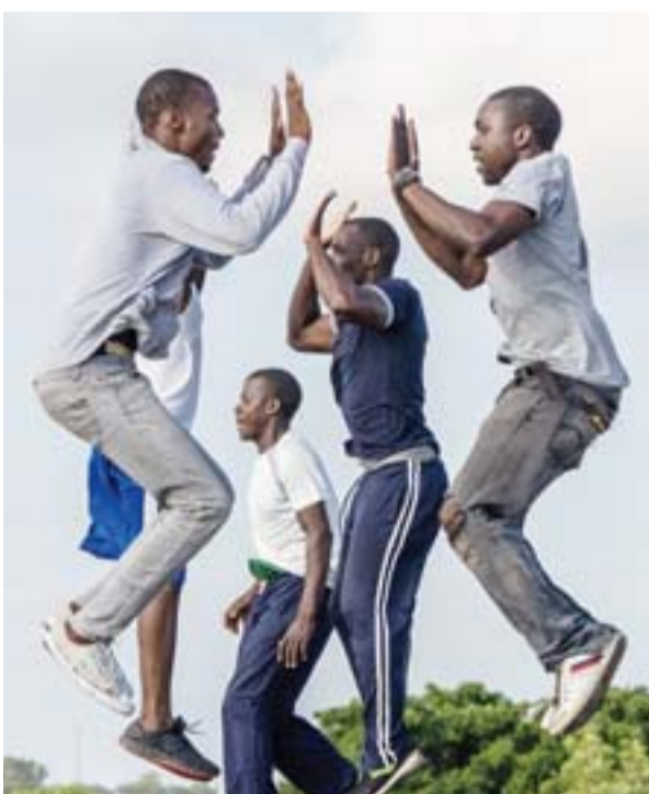
People work out on a bridge near the township of Emakhandeni, outside the Zimbabwean city of Bulawayo.