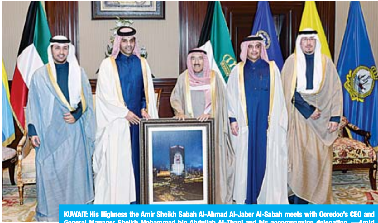
KUWAIT: His Highness the Amir Sheikh Sabah Al-Ahmad Al-Jaber Al-Sabah meets with Ooredoo's CEO and General Manager Sheikh Mohammad bin Abdullah Al-Thani and his accompanying delegation.

Amir receives Ooredoo chief; Crown Prince meets Kuwaiti figures