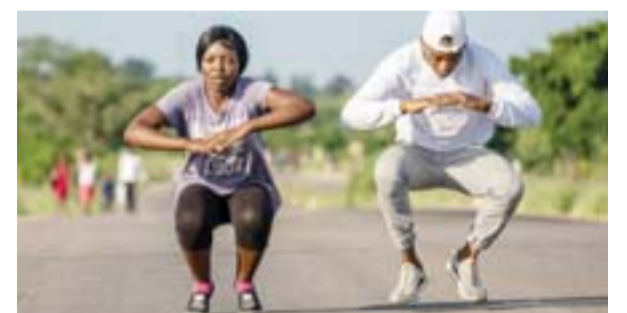
People go through their morning exercise routine.

As the morning progresses, traffic picks up and the small crowd clears off the road to allow cars, trucks and buses to hurtle past on their way to and from Bulawayo, Zimbabwe's second city. The session ends with a coordinated exercise when about eight pairs run towards each other from either side of the road. They jump in the air 10 times, clapping their partner's hand each time in a final burst of energy.