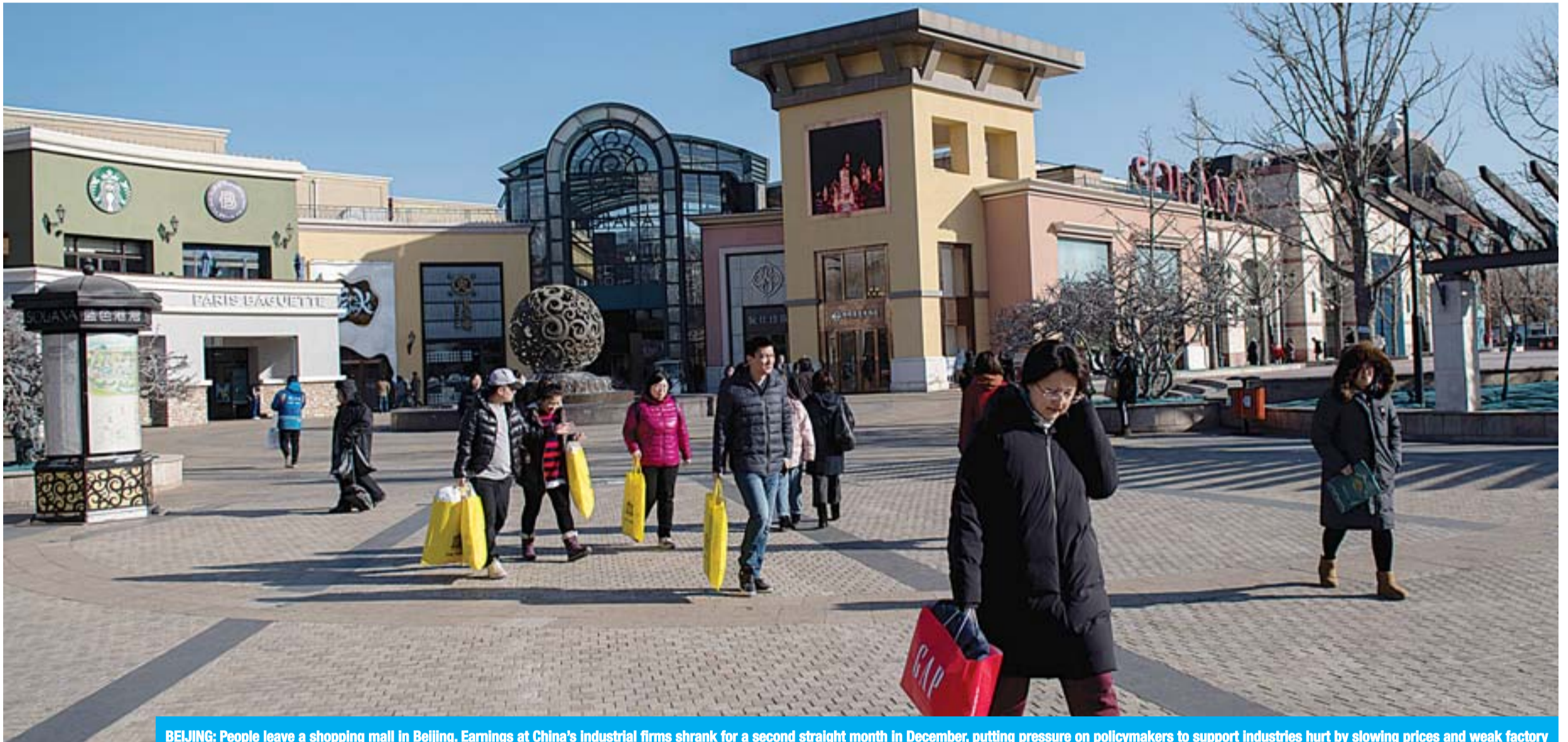
BEIJING: People leave a shopping mall in Beijing. Earnings at China's industrial firms shrank for a second straight month in December, putting pressure on policymakers to support industries hurt by slowing prices and weak factory activity amid a protracted Sino-US trade war.