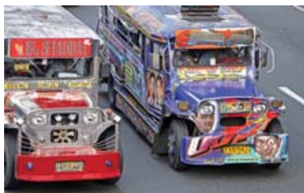
This picture shows jeepneys during rush hour in Manila.

The jeepney's successor is being billed as a big improvement. It has doors, individual seats, air-conditioning, and enough height to stand up. But it will be mass-produced and look just like a public bus. Skipping over