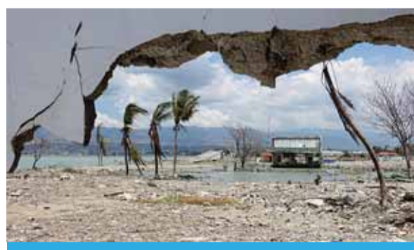
PALU: Ruins and damaged building are pictured nearly one year after an earthquake and tsunami at a beach in Palu, Central Sulawesi, Indonesia, September 26, 2019 in this photo.

Srinivasa Tummala, an oceanographer who heads the Indian Ocean Tsunami Warning and Mitigation System, says governments in Indonesia and the region need to do more to control coastal populations and prepare communities by holding regular tsunami drills, marking out evacuation routes, constructing shelters, and enforcing minimum building standards. "Realistically, there needs to be both stricter enforcement and building community resilience," Tummala said.