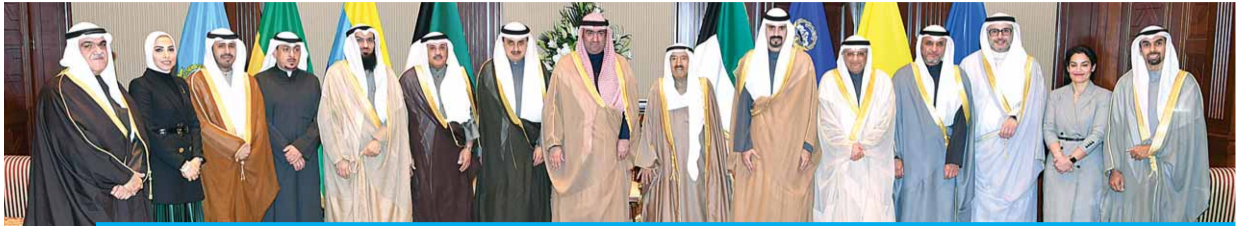
KUWAIT: His Highness the Amir Sheikh Sabah Al-Ahmad Al-Jaber Al-Sabah meets with Minister of Commerce and Industry Khaled Al-Roudhan, as well as officials from the Kuwaiti Capital Markets Authority, Boursa Kuwait, Kuwait Direct Investment Promotion Authority and Permanent Committee for Streamlining Business Environment and Enhancing Competitiveness in Kuwait.

Sheikh Sabah receives Boursa Kuwait, Capital Markets Authority officials