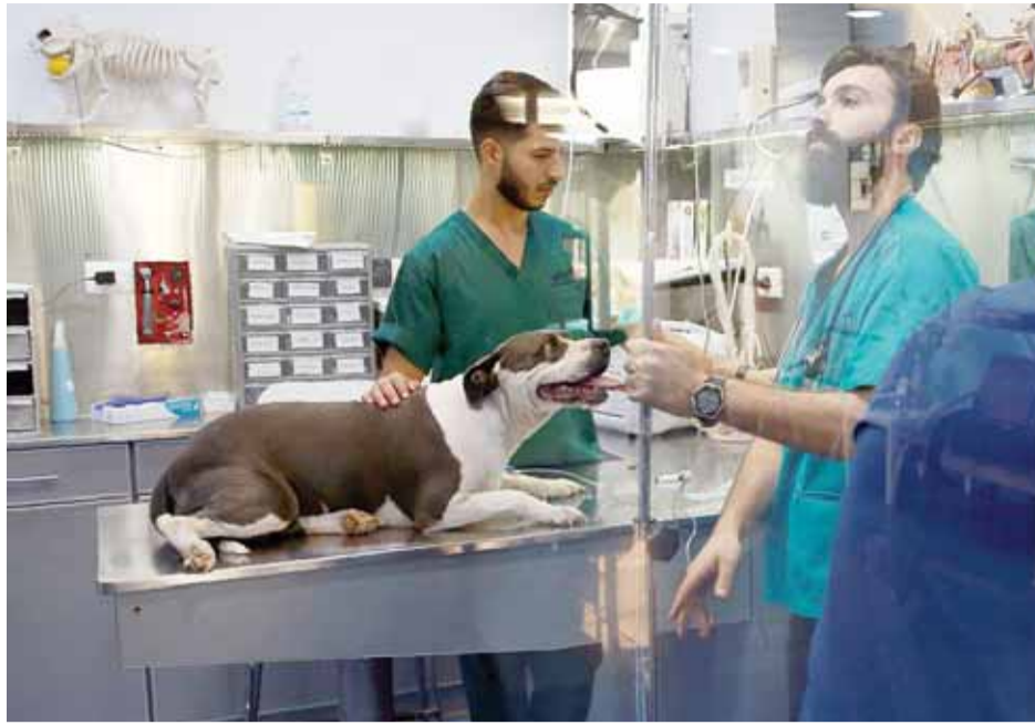
Members of the veterinary staff treat a female pitbull suffering from a herniated disk at "Pet Zone".