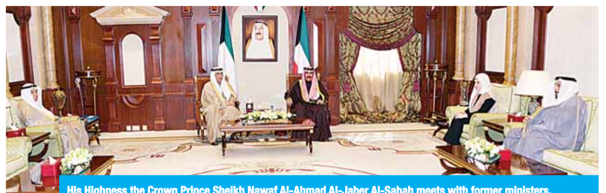
His Highness the Crown Prince Sheikh Nawaf Al-Ahmad Al-Jaber Al-Sabah meets with former ministers.