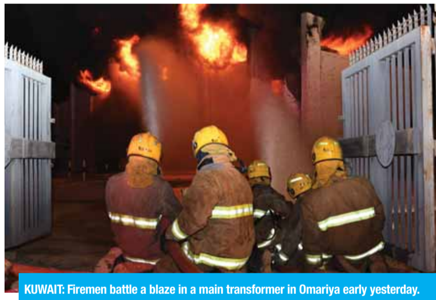
KUWAIT: Firemen battle a blaze in a main transformer in Omariya early yesterday.