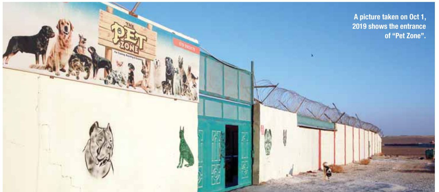
A picture taken on Oct 1, 2019 shows the entrance of "Pet Zone".