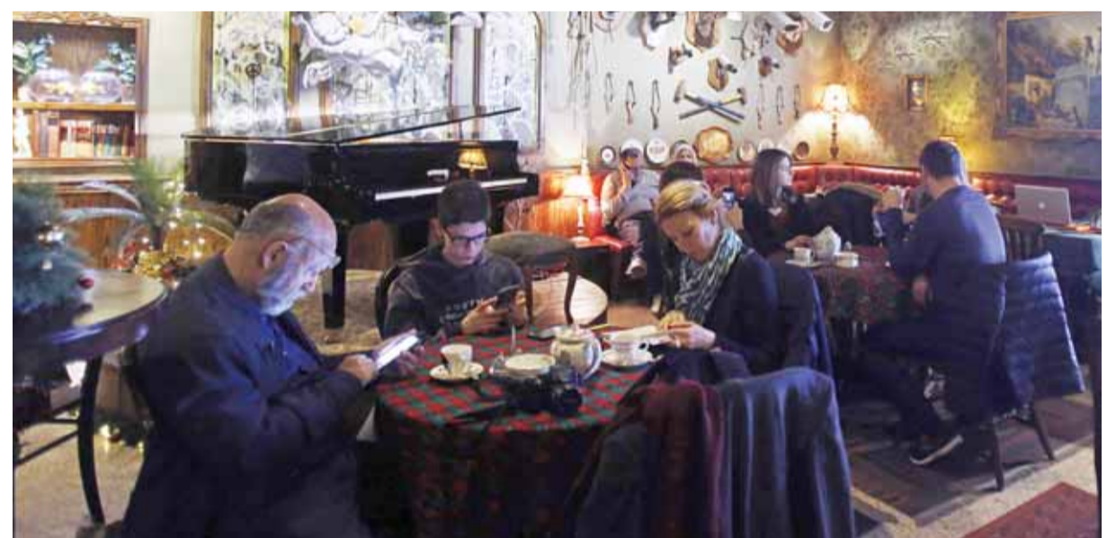
Guests eat in the dining hall of Banksy's Walled-Off hotel in Bethlehem.

Less than an hour after a group of Indian tourists arrive at Bethlehem's Church of the Nativity, they exit smiling, directly board their bus and head back to Jerusalem. The city where Christians believe Jesus was born is teeming with tourists - but the Christmas spirit is dampened by complaints that Israeli tour operators don't allow the city to truly benefit from the influx. While Bethlehem's 50-odd hotels are fully booked during the peak season around Christmas Day, December 25, they struggle to ensure occupancy rates throughout the year.