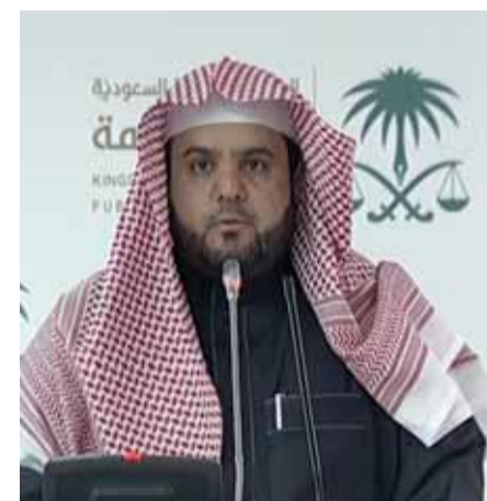
RIYADH: An image grab from a video released by the Saudi ministry of media yesterday shows Saudi deputy prosecutor Shalaan Al-Shalaan speaking in the capital.