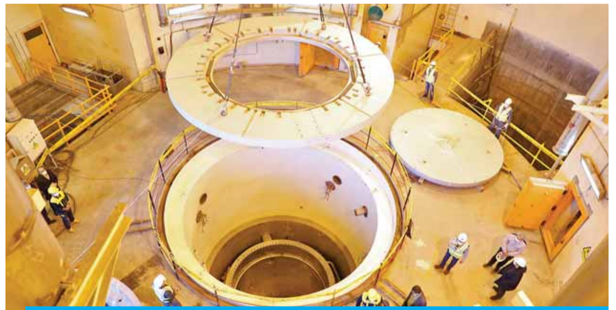
ARAK, Iran: A handout picture released yesterday shows the nuclear water reactor of Arak. — AFP

The Europeans have repeatedly said they are committed to saving the accord, but their efforts have so far borne little fruit. Tehran has already hit back four times with countermeasures in response to the US withdrawal. It stopped respecting the 300-kg limit the deal imposed on its stocks of enriched uranium and abandoned the cap on enriching uranium above 3.67 percent. Tehran started producing enriched uranium at its plant in Natanz using advanced centrifuges banned by the accord and testing new models. Uranium enrichment was also restarted at its underground Fordow facility in central Iran, which the deal banned. — AFP