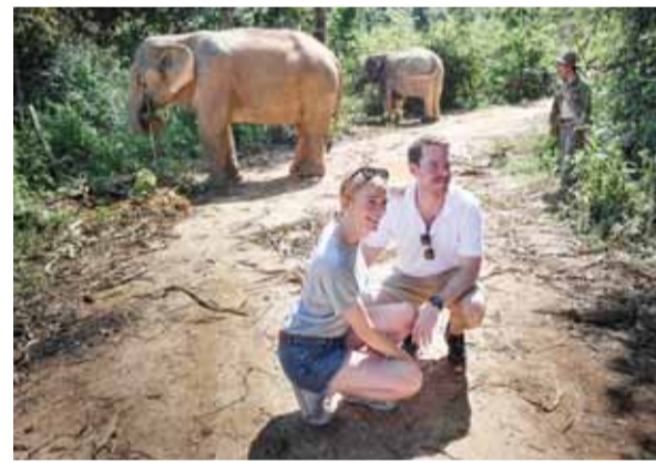
This photo taken on Nov 6, 2019 shows tourists taking pictures with elephants at the ChangChill elephant sanctuary in Chiang Mai.

Mae Taeng park in the northern city of Chiang Mai receives up to 5,000 visitors per day and charges an entrance fee of about $50. Many come to see Suda, who holds a brush in her trunk and paints Japanese-style landscapes for visitors who can later buy the prints for up to