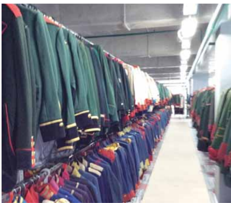
Costume store at Mosfilm Studios.