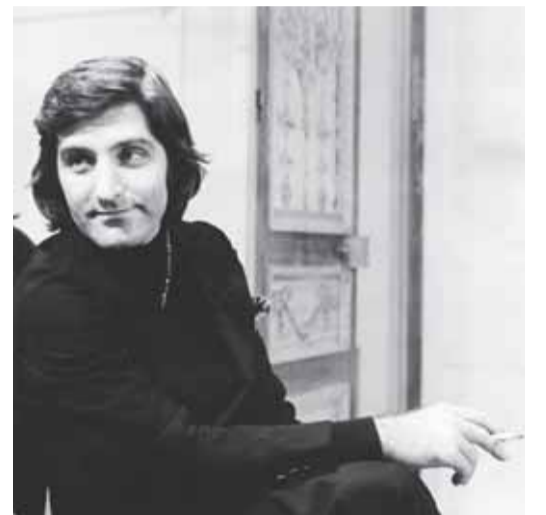
Ungaro smokes a cigarette in this undated photo.

started to distance himself from fashion in 2001, leaving the artistic direction of his ready-to-wear and accessories businesses to his main collaborator, Giambattista Valli. He continued designing collections for a few more years, but officially retired in 2004 stating the world of haute couture no longer matched "the expectations of today's women".