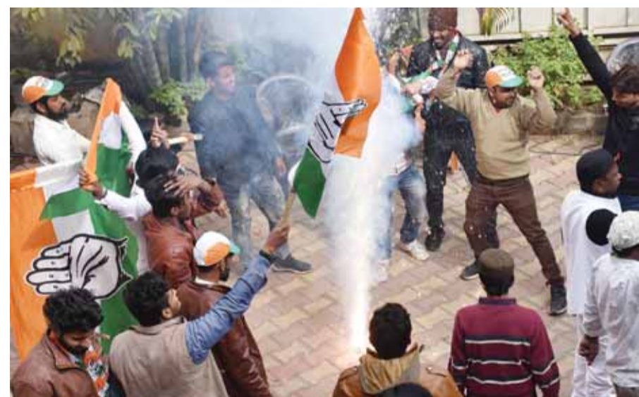
RANCHI, India: Congress-JMM alliance workers celebrate results projecting an assembly majority in Jharkhand state elections yesterday.