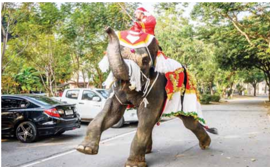
A mahout trains his elephant dressed in a Santa Claus costume before a gift presentation to schoolchildren during Christmas celebrations in Ayutthaya yesterday.