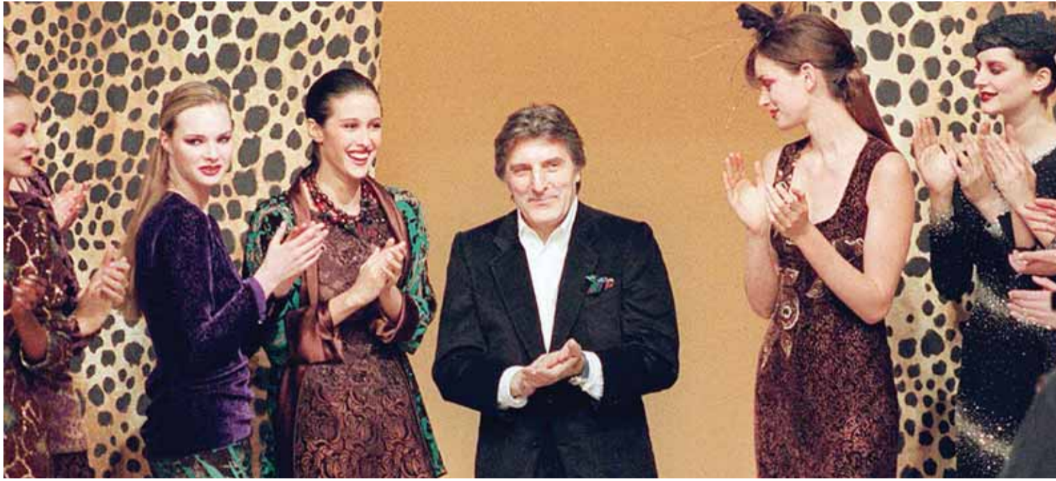
In this file photo taken on March 16, 1997, French designer Emanuel Ungaro is applauded by models at the end of his 1997/98 Fall/Winter ready-to-wear collection in Paris.