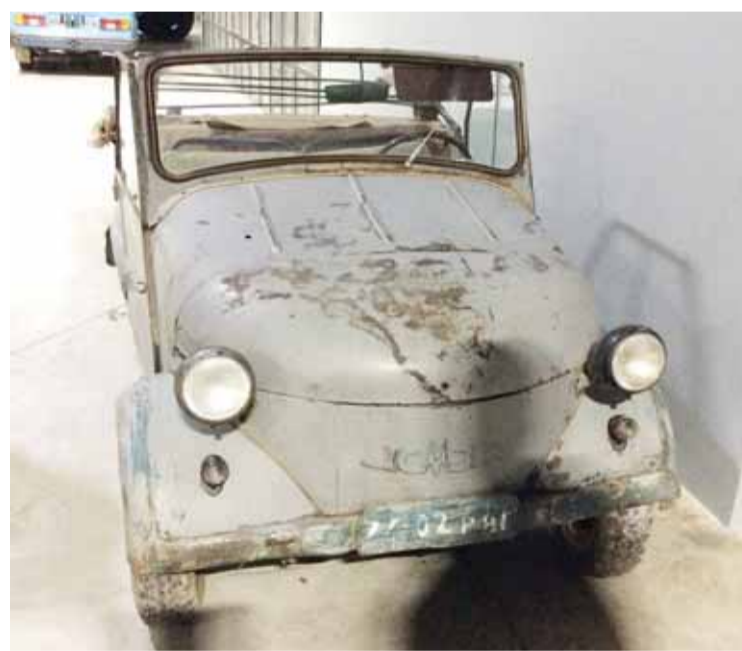
A Russian vehicle from the early 20th century.