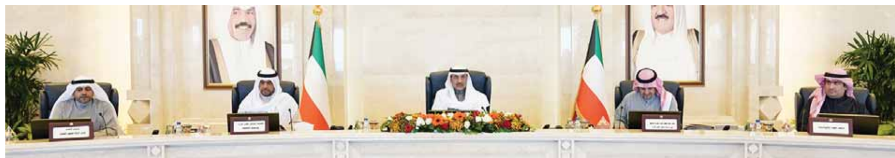
KUWAIT: His Highness the Prime Minister Sheikh Sabah Al-Khaled Al-Hamad Al-Sabah chairs the Cabinet's meeting yesterday.

Finance minister briefs Cabinet about contracts' hurdles