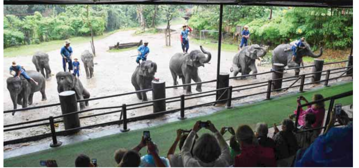
This photo taken on Nov 8, 2019 shows elephants being forced to perform for tourists at the commercial Maetaeng Elephant Park.

Separated from their mothers, jabbed with metal hooks, and sometimes deprived of food - many Thai elephants are tamed by force before being sold to lucrative tourism sites increasingly advertised as 'sanctuaries' to cruelly-conscious travellers. Balanced precariously on hind legs, two-year-old Ploy holds a ball in her trunk and flings it towards a hoop, one of many tricks she is learning in Ban Ta Klang, a traditional training village in the east.