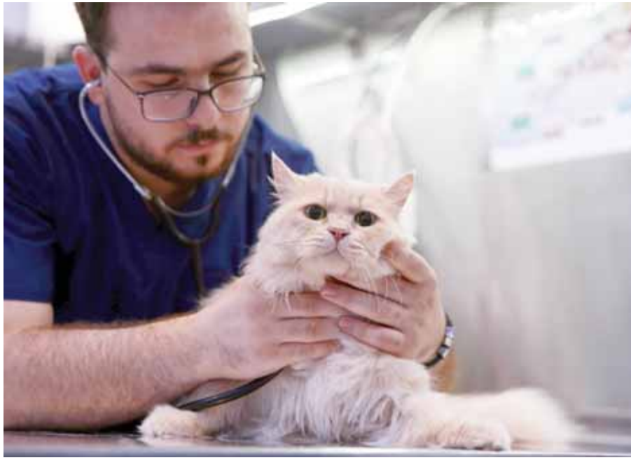
A member of the veterinary staff cares for a cat at "Pet Zone", a pet health center in the Jordanian capital Amman on Oct 1, 2019.