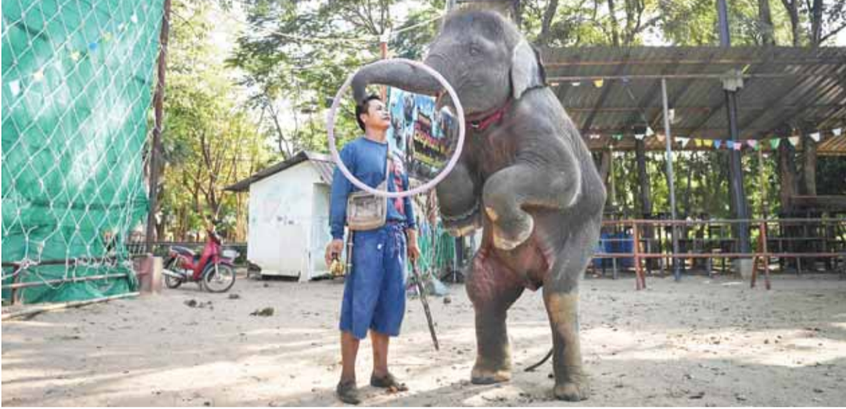
This photo taken on Nov 17, 2019 shows baby elephant Ploy training to perform tricks at the Ban Ta Klang elephant village in the northeastern Thai province of Surin.