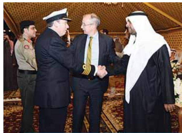
KUWAIT: Deputy Prime Minister and Minister of Defense Sheikh Ahmad Mansour Al-Ahmad Al-Sabah receives well-wishers.