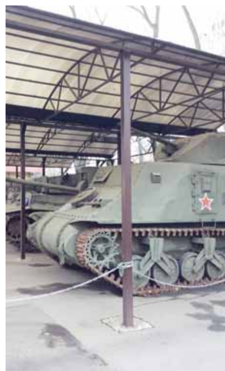
Armored vehicles at Mosfilm Studios.

Back in the Soviet era, Russian films were on equal ground compared to other global cinema studios, but the current situation is different considering the whole notion of supply and demand. Mosfilm had produced movies directed by Sergei Eisenstein, Andrei Tarkovsky, and even international directors like Japan's Akira Kurosawa.