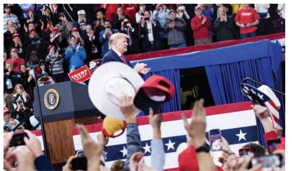
In this photo taken on Dec 10, 2019, US President Donald Trump leaves after speaking at a Keep America Great rally at the Giant Center in Hershey, Pennsylvania.

Democrats generally do better among young people than their Republican opponents, and music helps them break through to the 18-to-25 crowd, a key demographic if it can be mobilized to turn out and vote. The team of Pete Buttigieg, who at 37 is the youngest candidate in the field, created buzz with a campy video of campaign aides dancing to "High Hopes" by the group Panic! at the Disco. (An earlier version of "High Hopes," by Frank Sinatra, was the 1960 theme song of John F. Kennedy - the nation's youngest president.) The Buttigieg video - with aides dancing side-to-side, performing handrolls and claps - has since been imitated many times on social media and is now seen at the Indiana mayor's rallies. Sanders is quick to highlight supporters from the traditionally Democratic-leaning entertainment world as he works to again mobilize young voters, as he did in 2016. Having recently had his praises sung by Cardi B - the former striptease dancer turned rap star - the 78-year-old with unruly white hair was recently seen on Instagram, arm-in-arm with pop princess Ariana Grande, who has an impressive 168 million followers. — AFP