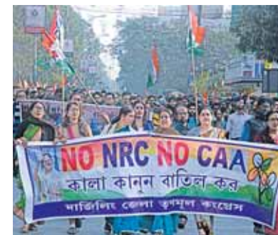
Indian states propose land rights amid citizenship fears