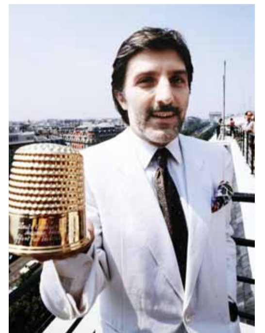
Ungaro poses in July 1981 after he was awarded with the De d'Or (Golden Thimble) in Paris.