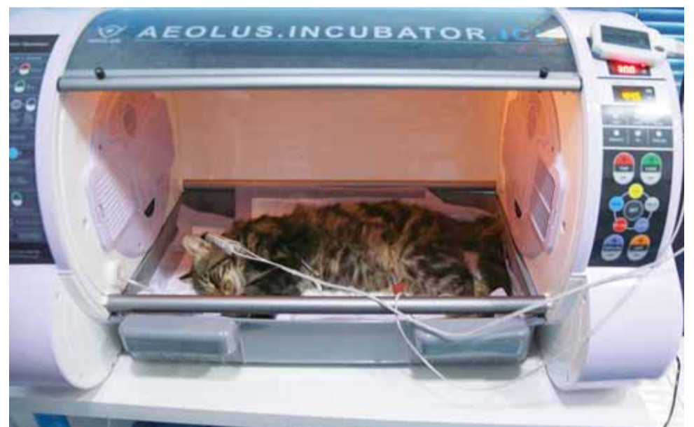
A picture taken on Oct 1, 2019 shows a cat recovering in an intensive care unit.

Despite taking a bite out of their wallets, Jordanians appear to prefer larger breeds, such as German shepherds, rottweilers and huskies. And the puppies don't come cheap, with prices for the bigger breeds starting from around $140 and soaring to as much as