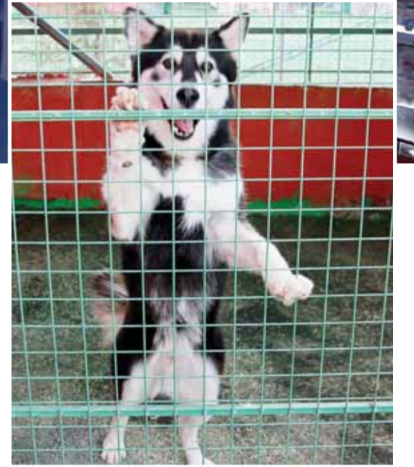
A picture taken on Oct 1, 2019 shows a husky in a kennel.