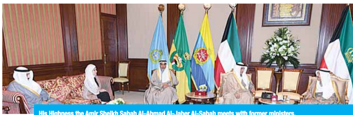
His Highness the Amir Sheikh Sabah Al-Ahmad Al-Jaber Al-Sabah meets with former ministers.