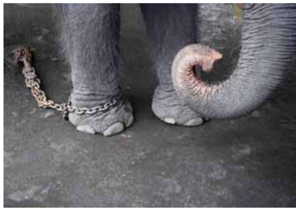
A chained elephant is seen at Maetaeng Elephant Park.

Elephants were phased out of the logging industry