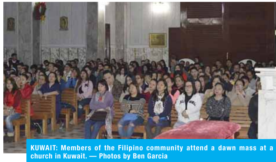
KUWAIT: Members of the Filipino community attend a dawn mass at a church in Kuwait.

Three churches celebrate 'Simbang Gabi' which ends today