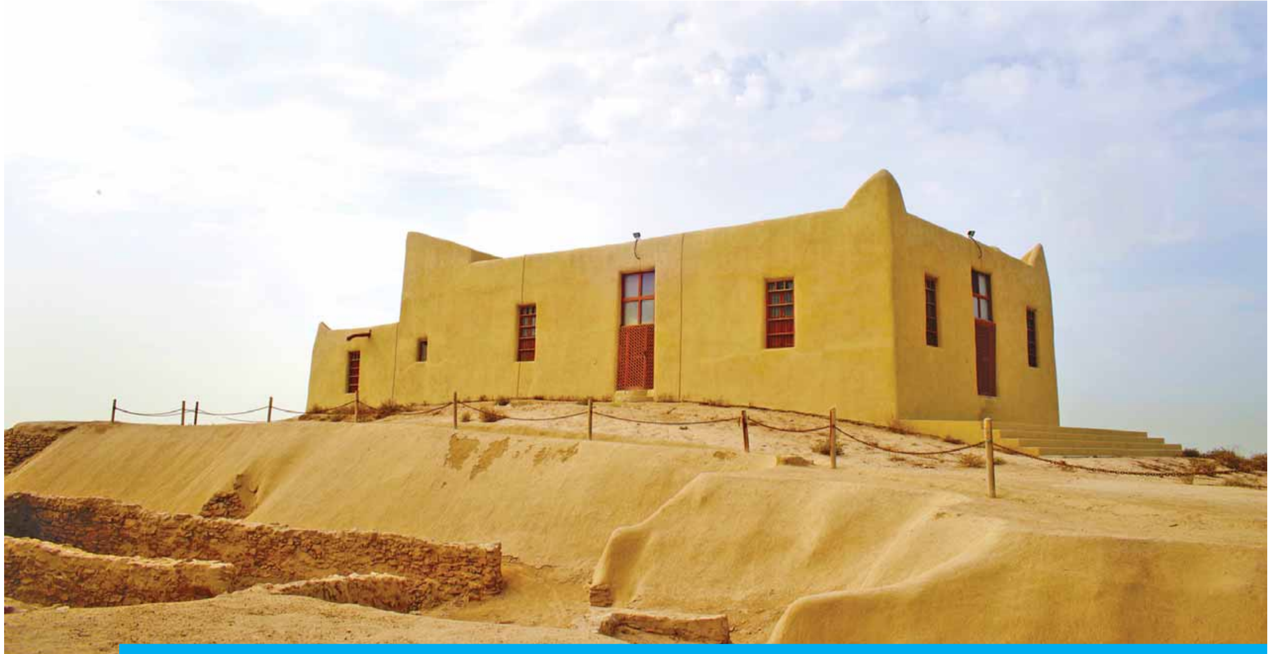
KUWAIT: The late Amir Sheikh Ahmad Al-Jaber Al-Sabah's rest house in Failaka Island.