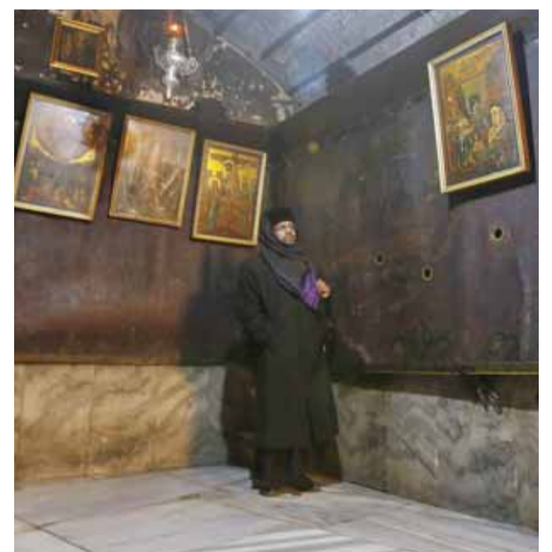
A Christian tourist prays inside the Grotto, believed to be the exact spot where Jesus Christ was born, at the Church of the Nativity.