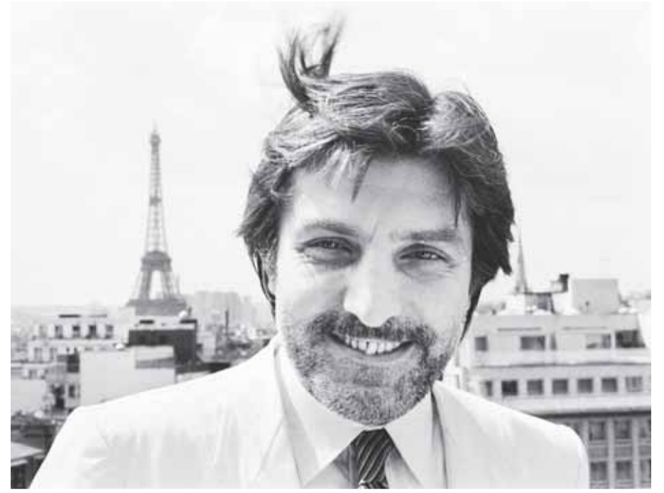
Ungaro poses on July 31, 1980 in Paris.