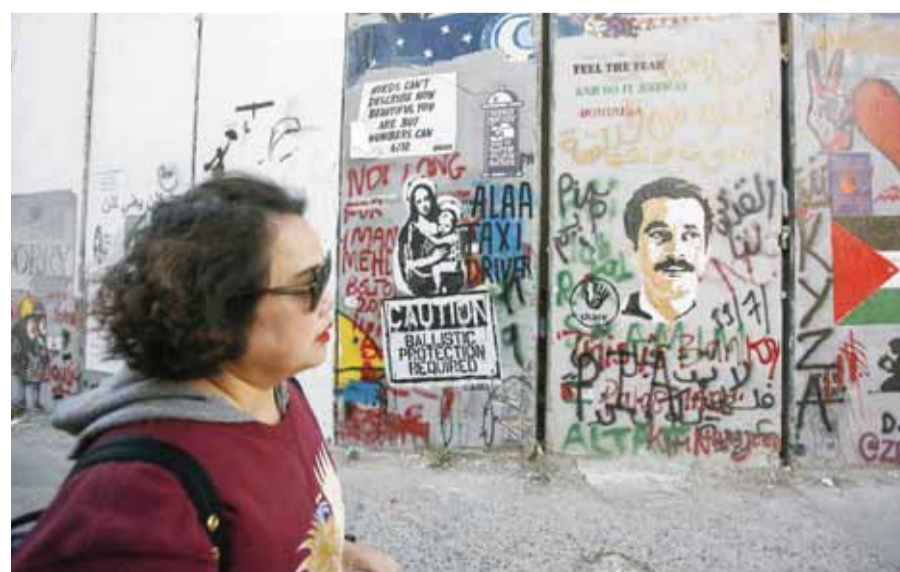
A tourist walks past illustrations by street artist Banksy displayed on Israel's controversial barrier in front of his Walled-Off hotel.