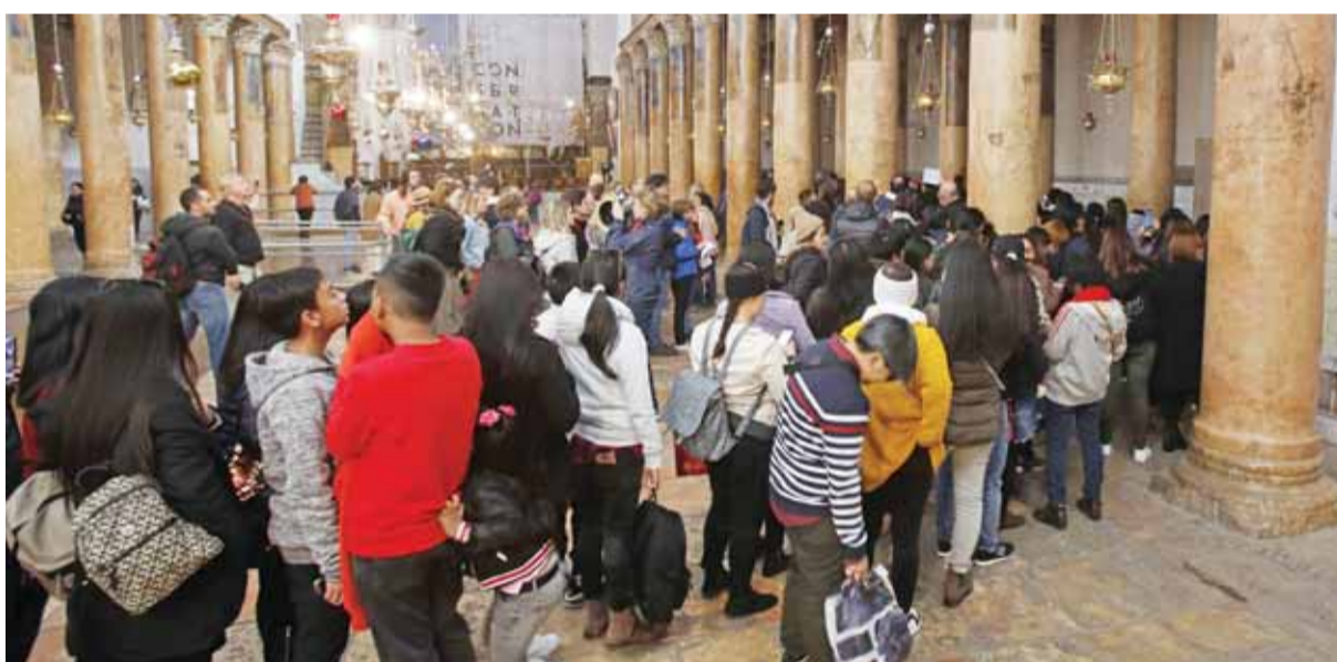
Christian tourists visit the Church of the Nativity in Bethlehem.