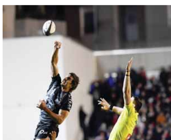
Toulon: Toulon's South African lock Eben Etzebeth (L) fights for the ball with Clermont's French lock Paul Jedrasiak (R) during the French Top 14 rugby union match between RC Toulonnais (RCT) and ASM Clermont Auvergne (ASMCA) at the Stade Mayol in Toulon, southern France.

The game kicked off with an announcement from controversial Toulon president Mourad Boudjellal that