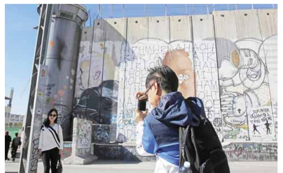
A tourist poses for a picture in front of Israel's controversial separation barrier.