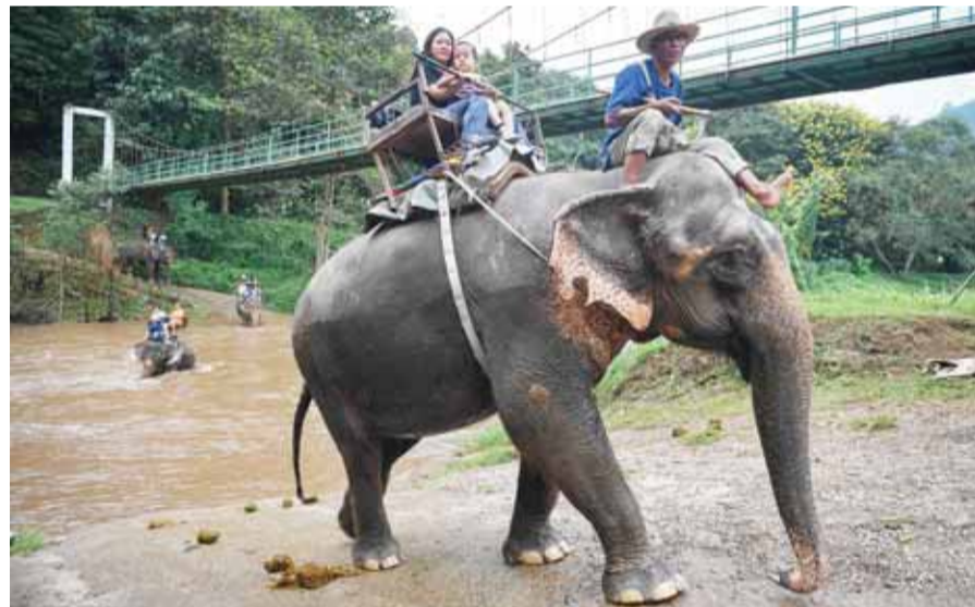
This photo taken on Nov 8, 2019 shows tourists riding elephants at the commercial Maetaeng Elephant Park in the northern Thai province of Chiang Mai.