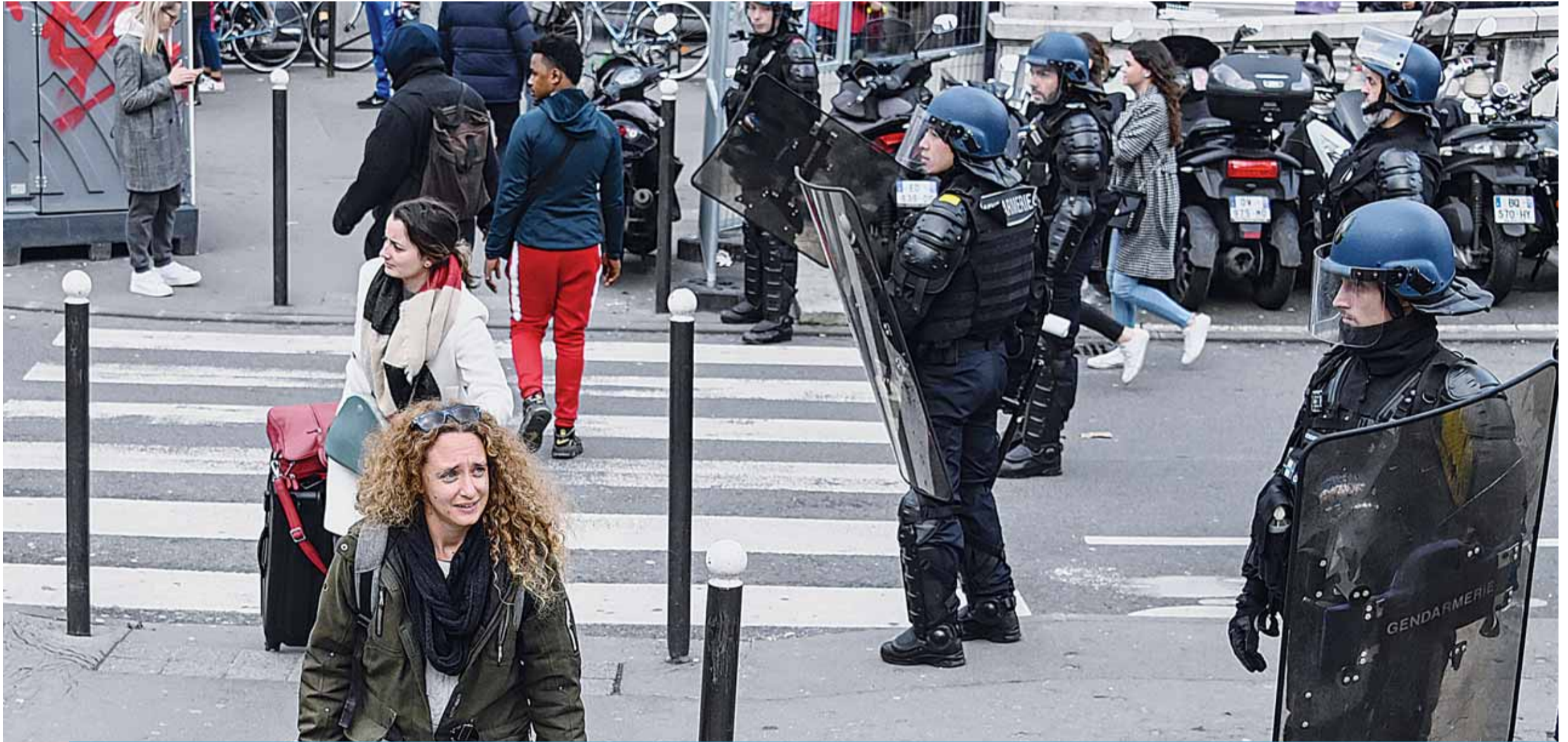
PARIS: Riot mobile gendarmes escort holiday goers as railway workers demonstrate yesterday outside the Gare de Lyon train station in Paris on the 19th day of a nationwide multi-sector strike against French government's pensions overhaul.