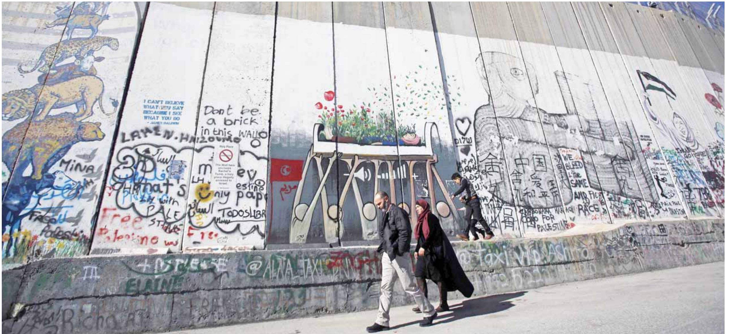
Palestinians walk along Israel's controversial barrier in the occupied West Bank town of Bethlehem on Dec 21, 2019.