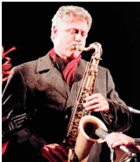
In this file photo taken on Nov 1, 1992, Democratic presidential candidate Bill Clinton plays the saxophone during a rally at the Garden State Race Track.

Senator Bernie Sanders, the feisty, self-declared democratic socialist who is the oldest candidate in the race, opens rallies to the militant tones of John Lennon's "Power to the People," an ode to protest and resistance from the 1970s. He also favors "Takin' It to the Streets." And the centrist Joe Biden, who embraces the nickname "Middle-Class Joe," regularly ends his rallies with gravely voiced