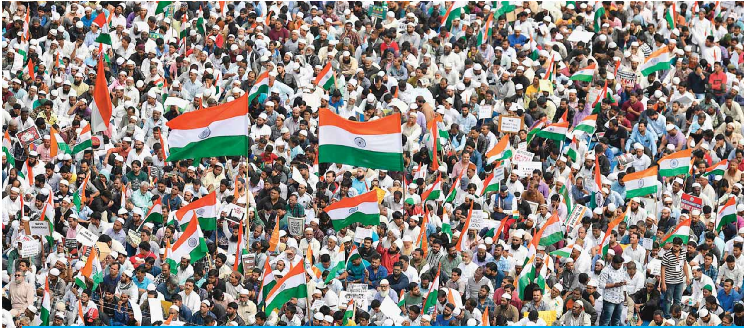
Demonstrators gather at the Qaddus Saheb Eidgah grounds to take part in a rally against India's new citizenship law in Bangalore yesterday.