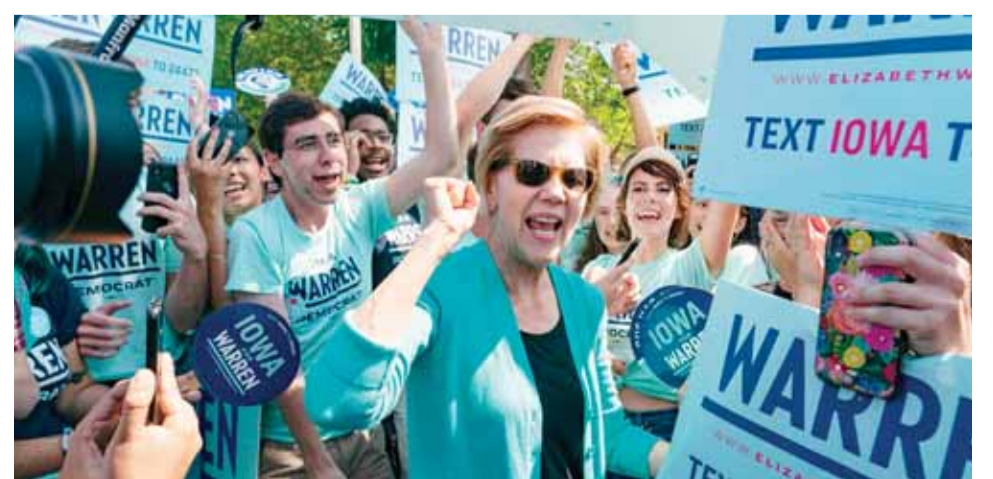
In this file photo taken on Aug 9, 2019, 2020 Democratic presidential hopeful Senator Elizabeth Warren greets supporters as she arrives at a rally outside the building where the Wing Ding Dinner will take place in Clear Lake, Iowa.