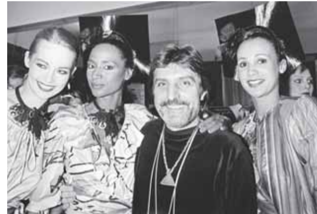
Ungaro poses on Oct 17, 1980 backstage with his models after his Spring-Summer Ready-to-Wear collection presentation in Paris.

started to distance himself from fashion in 2001, leaving the artistic direction of his ready-to-wear and accessories businesses to his main collaborator, Giambattista Valli. He continued designing collections for a few more years, but officially retired in 2004 stating the world of haute couture no longer matched "the expectations of today's women". — AFP