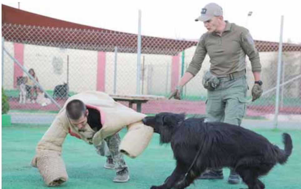
A handler (right) instructs a royal black German shepherd during attack training at "Pet Zone".