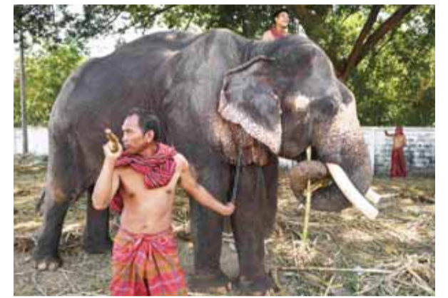
This photo taken on Nov 17, 2019 shows elephants and mahouts waiting to perform during the annual Surin Elephant Round-up festival in the northeastern Thai province of Surin.

Many do not permit rides or animal performances. Instead tourists are encouraged to feed, groom and care for elephants, gaining an unforgettable experience with one of nature's most majestic creatures. But charities warn that even seemingly benign options, like bathing them, could still be problematic. "Bathing with elephants...is often stressful