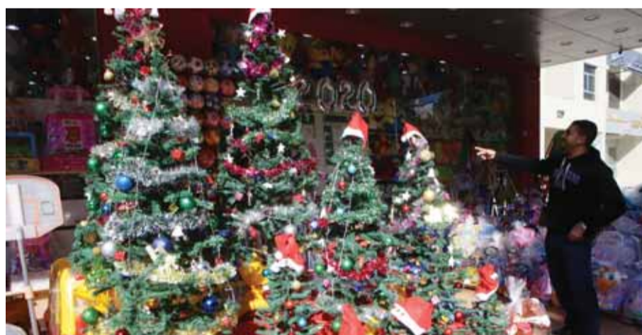
KUWAIT: Christmas trees displayed at a toy store in Kuwait.

Meanwhile, customers can find Christmas trees at toy stores in different colors. A toyshop in Rai has white, green and even gold Christmas trees, but only in one size. Other toyshops in Jabriya have a wide range of trees that customers can choose from.