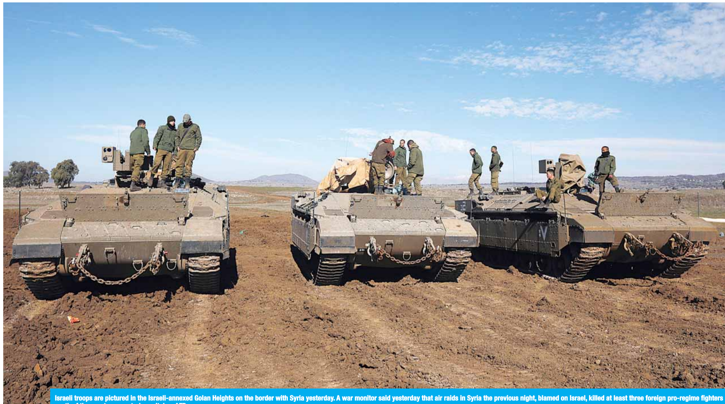
Israeli troops are pictured in the Israeli-annexed Golan Heights on the border with Syria yesterday. A war monitor said yesterday that air raids in Syria the previous night, blamed on Israel, killed at least three foreign pro-regime fighters south of the war-torn country's capital.