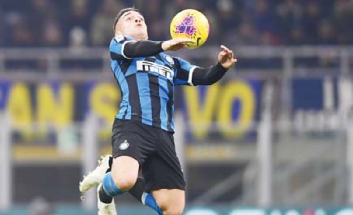
MILAN: Inter Milan’s Argentinian forward Lautaro Martinez chest controls the ball during the Italian Serie A football match Inter Milan vs AS Rome on December 6, 2019 at the San Siro stadium in Milan.

But Conte, who coached Juventus to three Serie A titles and Chelsea to the Premier League trophy, does not want to single out any one player. “When we talk too much about a single player or two I never like it,” said the 50-year-old. “Of course we have Lautaro and young lads who are growing. But I would like to talk about the whole team because getting hung up on just one is a lack of respect for all the others.” — AFP