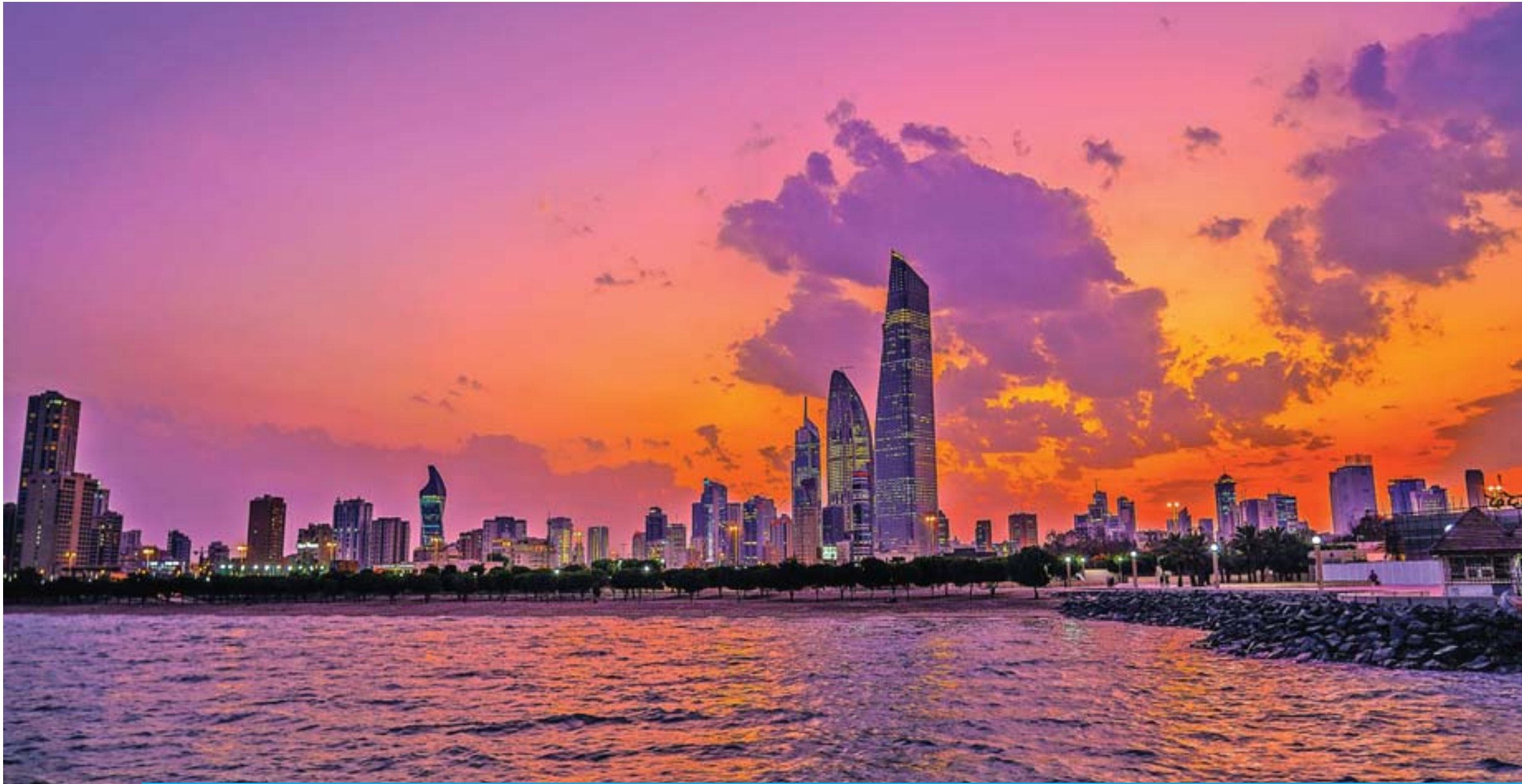
KUWAIT: Kuwait City during sunset.