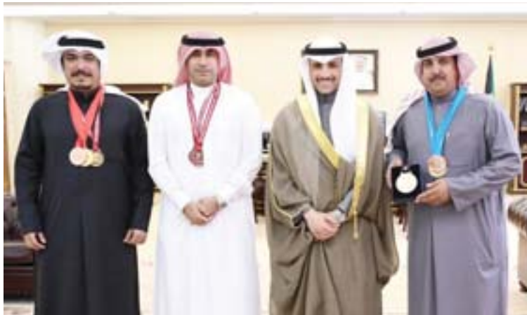
KUWAIT: National Assembly Speaker Marzouq Al-Ghanem meets with a trio of Kuwaiti shooters who qualified for the 2020 Tokyo Olympics.

KUWAIT: Kuwait's National Assembly Speaker lawmaker Marzouq Al-Ghanem met yesterday with a trio of his compatriot shooters, all of whom have recently secured their