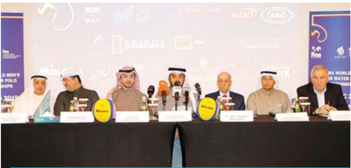
KUWAIT: Officials speak in a press conference ahead of the 20th FINA World Men's Junior Water Polo Championship in Kuwait.