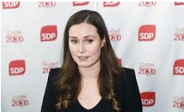
HELSINKI: Sanna Marin of Finland's Social Democrats is seen after she was elected to the post of prime minister on Sunday.

ter Juha Sipila in September. Green Party leader Maria Ohisalo, 34, will continue as interior minister, the Left Alliance's chairwoman Li Andersson, 32, as education minister and the Swedish People's Party's Anna-Maja Henriksson, 55, as justice minister. Rinne will remain the Social Democrats leader at least until he chairs the party's conference in June. Centre Party said it removed Antti Rinne over his handling of a two-week postal strike which spread to other industries. "We had to blow the whistle and calm down the worsening situation. I explain this with the chance to move ahead on important topics," Kulmuni said on social media yesterday. —Reuters