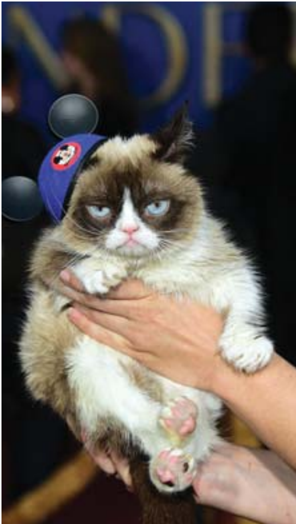
Grumpy the Cat poses on arrival for the World Premiere of Disney's 'Cinderella' in Hollywood, California.

In this file photo taken, Grumpy Cat attends the 'Cat Summer' video launch party at Bleecker Street Records in New York City. They have millions of followers on Instagram. They generate major profits for their owners. They are... pet influencers. Grumpy Cat, Lil Bub, Boo the Pomeranian and Doug the Pug are just some of the internet's star animals, who do everything from support worthy causes to promote major brands.