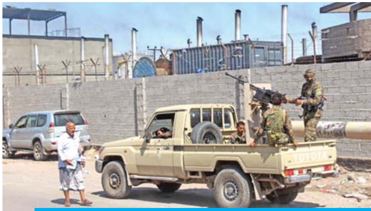
ADEN: A Yemeni man walks past a security point in Yemen's second city yesterday.