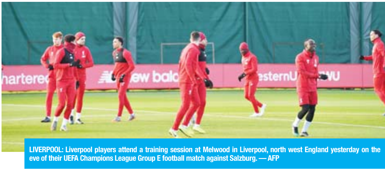
LIVERPOOL: Liverpool players attend a training session at Melwood in Liverpool, north west England yesterday on the eve of their UEFA Champions League Group E football match against Salzburg.

LONDON: Liverpool travel to Salzburg today needing to avoid defeat to the confident Austrian champions to guard against an embarrassing Champions League group stage exit for the holders. Jurgen Klopp’s men are used to getting through to the knockout stages the hard way. In each of the past two seasons they have needed home wins to secure a place in the last 16 before going on to make the final. However, the spectre of a free-scoring Salzburg, led by the Champions League’s top scorer in Erlin Braut Haaland spells trouble for an injury-hit Liverpool backline that has consistently leaked goals this season despite streaking clear at the top of the Premier League. The Reds’ recorded a first clean sheet in 14 games in Saturday’s 3-0 win at Bournemouth, but lost another centre-back as Dejan Lovren limped off in the first half. Should the Croatian miss the trip to Austria, Joe Gomez will be Klopp’s only fit partner for Virgil van Dijk in central defense. Van Dijk narrowly missed out to Lionel Messi in the battle for the Ballon d’Or last week in recognition of the transformative effect he has had on Liverpool’s fortunes over the past two years. But even the towering Dutchman has been incapable of stopping the steady flow of goals against in recent months. Injuries have meant there has been a constant rotation of Lovren, Gomez and Joel Matip alongside Van Dijk, while the attacking impetus offered by full-backs Andy Robertson and Trent Alexander-Arnold leaves space in