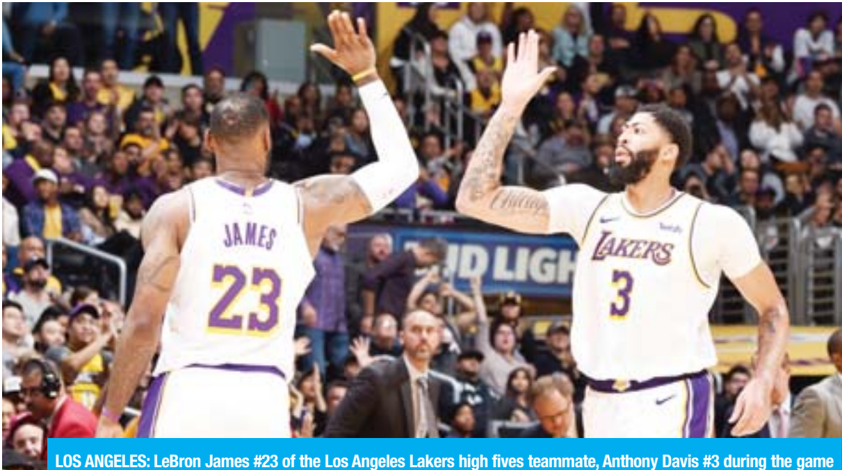
LOS ANGELES: LeBron James #23 of the Los Angeles Lakers high fives teammate, Anthony Davis #3 during the game against the Minnesota Timberwolves on December 8, 2019 at STAPLES Center in Los Angeles, California.

He made three more from beyond the arc in the extra session — including one to tie the game and one to give the Heat the lead for good as Miami