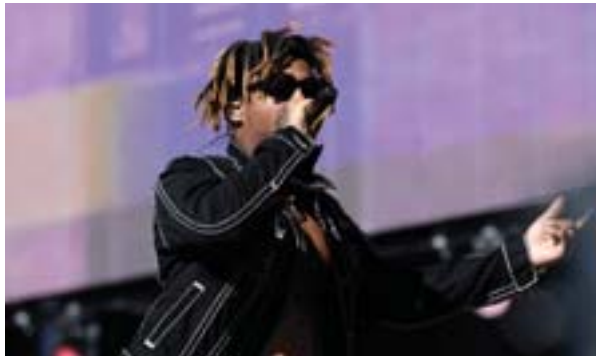
In this file photo, Juice WRLD performs onstage during the 2019 iHeartRadio Music Festival and Daytime Stage at the Las Vegas Festival Grounds in Las Vegas, Nevada. Chicago-born rapper Juice WRLD, one of a wave of young artists who made a name on streaming platforms before breaking out in the mainstream, died on Sunday at the age of 21.

In 2000, he was named a Living Legend by the US Library of Congress, and he has a star on the Hollywood Walk of Fame. Henson’s family said in a statement that Spinney managed to “perfectly convey the humor and heart in our father’s creations. Big Bird was childlike, without being childish. And Oscar the Grouch reflected universal feelings we all share, no matter our age.” “That he could do this work so brilliantly, responsibly and with such infectious love and joy is his gift to us all,” the statement said.