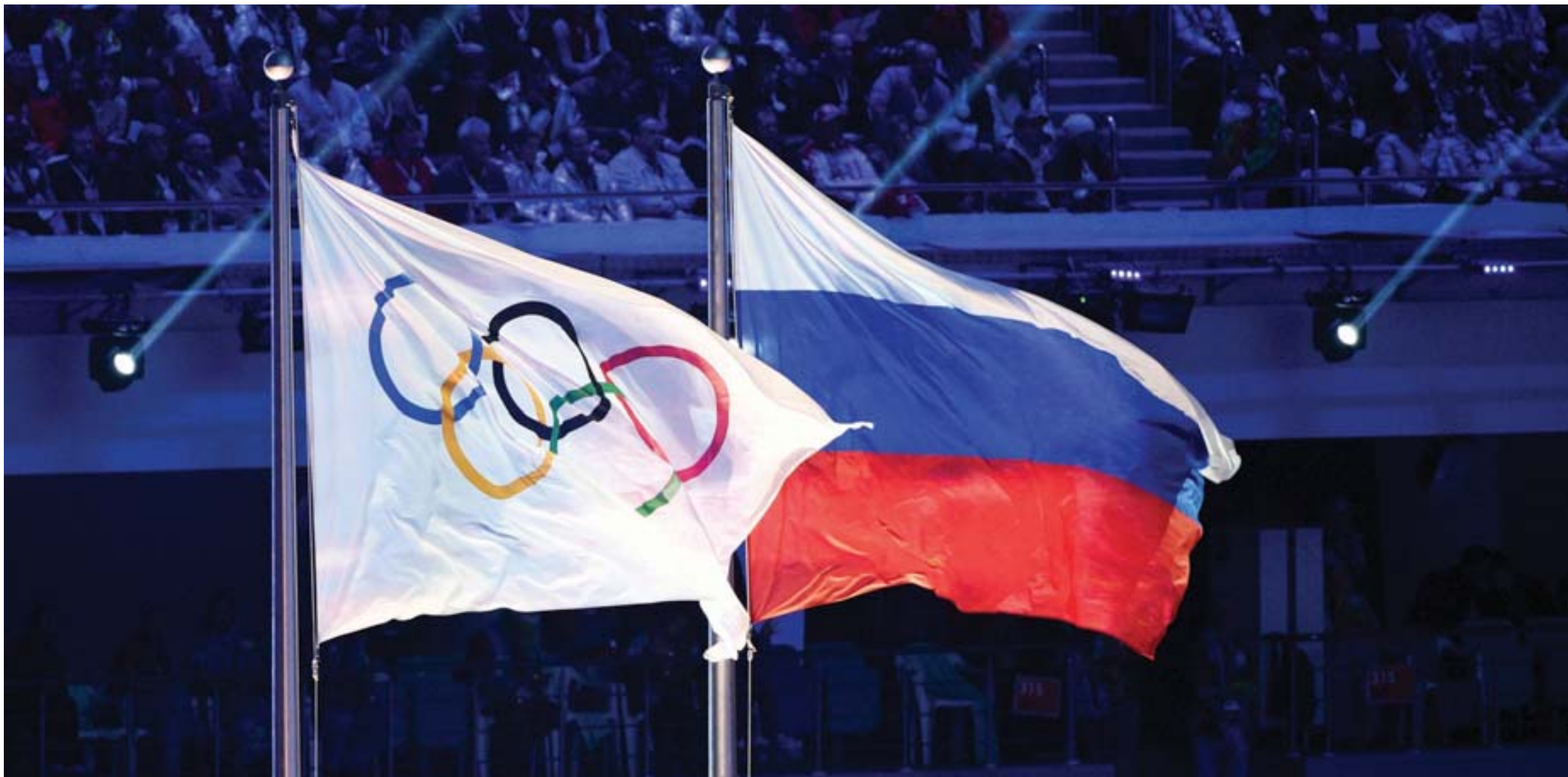
SOCHI: This file photo taken on February 23, 2014, shows the Olympic flag and the Russian flag flying during the Closing Ceremony of the Sochi Winter Olympics at the Fisht Olympic Stadium in Sochi.

Russia cannot compete at 2022 World Cup under own flag