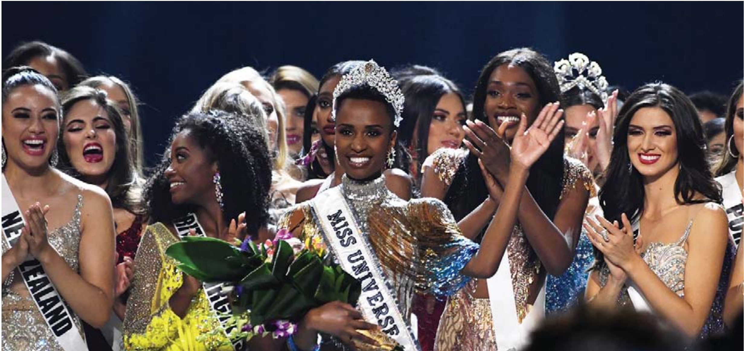
Newly crowned Miss Universe 2019 South Africa's Zozibini Tunzi waves from stage after the 2019 Miss Universe pageant.