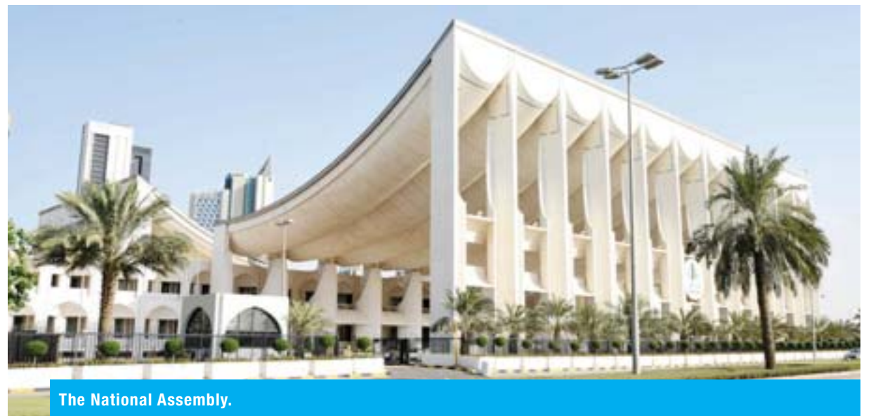
The National Assembly.

Education had set limits to fee hikes. "The services provided in these schools do not match the fees they collect," the sources remarked, pointing out that lawmakers had already drafted a number of recommendations to discuss during the session.