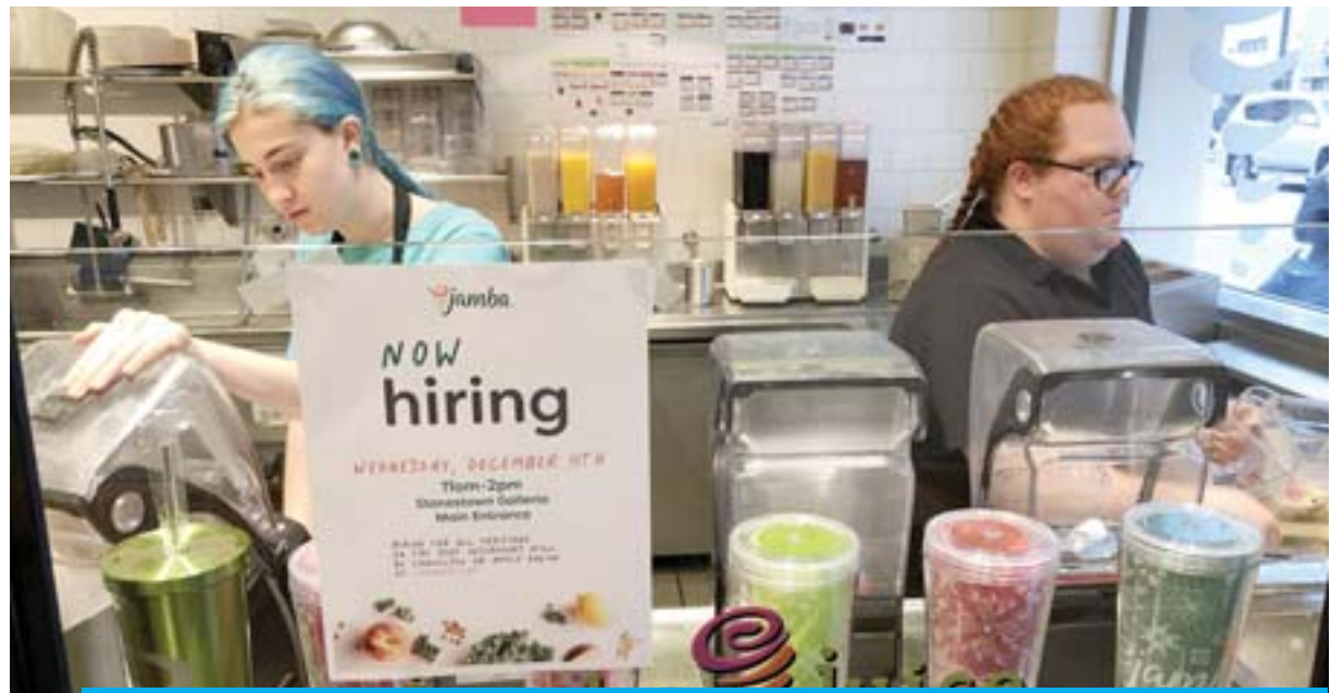
SAN FRANCISCO: A now hiring sign is posted at a Jamba Juice in San Francisco, California.

The Federal Reserve has flagged it as a possible risk to overall growth, and some of the presidential candidates running for office in 2020 have rolled out proposals to address it. One aim of Trump’s decision to impose tariffs on imports from China and elsewhere is to revive ailing areas of the country. Muro and Atkinson propose a concerted push involving federal research grants, tax breaks, and loosened regulations to encourage research into areas such as autonomous vehicles. They suggest focusing on around 10 inland