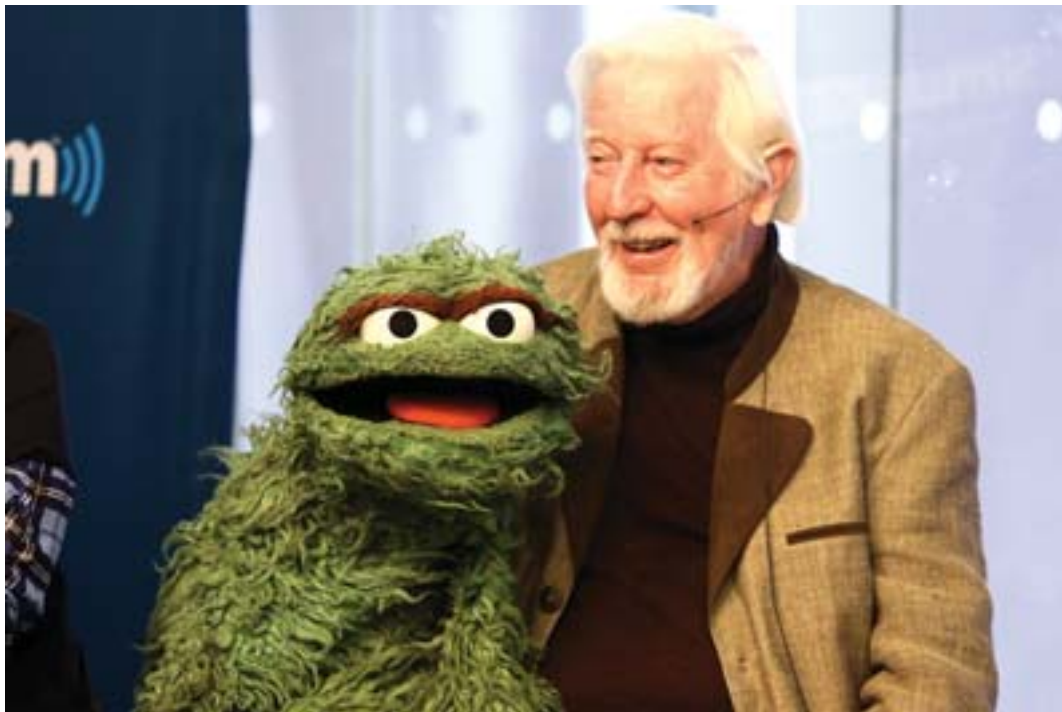
In this file photo taken, Caroll Spinney ‘Oscar and Big Bird’ attends SiriusXM’s Town Hall with original cast members from Sesame Street in New York City. Caroll Spinney, the big-hearted Muppeteer who play the Sesame Street character Big Bird for almost a half-century, died on December 8, 2019, Sesame Workshop announced. He was 85.