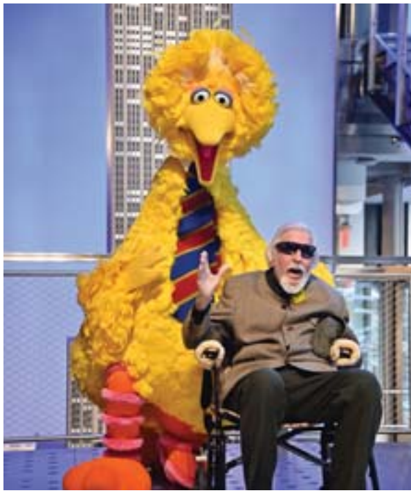
In this file photo, Sesame Street’s Big Bird and Puppeteer Caroll Spinney lights the Empire State Building in New York City.