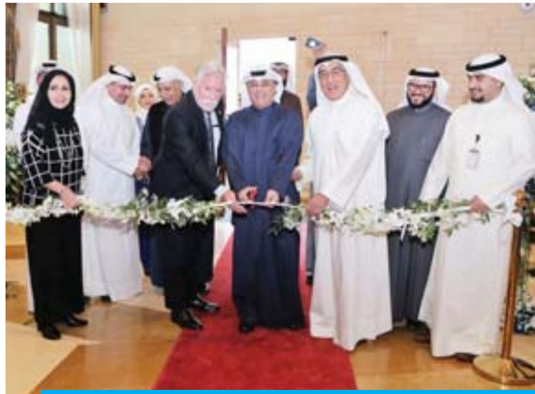
KUWAIT: Officials inaugurate the industries and construction exhibition.

"Under Kuwait's 2035 vision and in line with the ongoing urban movement in Kuwait, the