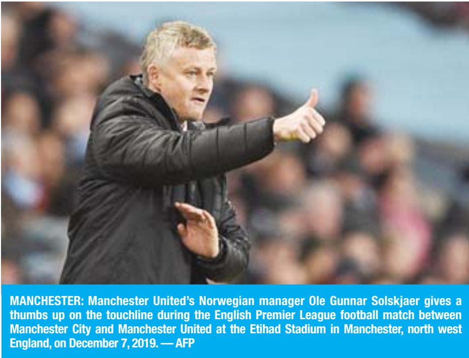
MANCHESTER: Manchester United’s Norwegian manager Ole Gunnar Solskjaer gives a thumbs up on the touchline during the English Premier League football match between Manchester City and Manchester United at the Etihad Stadium in Manchester, north west England, on December 7, 2019.

with Solskjaer’s vision slowly coming to fruition. Marcus Rashford has already matched his previous season’s best for goals with 13, Fred has enjoyed two of his best games since a £50 million move from Shakhtar Donetsk 18 months ago, Aaron Wan-Bissaka was outstanding in nullifying the threat of Raheem Sterling and Harry Maguire marshalled his defence resolutely under a late City bombardment. There is still much to do for Solskjaer to convince the doubters, not least catching Chelsea in fourth to secure a return to the Champions League next season, but this was undoubtedly his best week as permanent United boss. KLOPP RELISHES LIVERPOOL SHUTOUT Jurgen Klopp admitted Liverpool’s first clean sheet in 14 games was the talk of the dressing room after the leaders’ 3-0 win at Bournemouth. Klopp’s side made it 33 league games unbeaten as they maintained an eight-point lead over second-placed Leicester. Goals from Alex Oxlade-Chamberlain, Naby Keita and Mohamed Salah earned the victory, but it was Liverpool’s first shutout since September 28 that pleased Klopp the most. “I forgot actually how it feels, to be honest. It’s great, we should have that more often,” Klopp said. “For the boys, that was the most used word in the dressing room when I came in, ‘clean sheet, clean sheet, clean sheet’. Obviously everybody was desperate for that and now we have it, so let’s have it more often.”