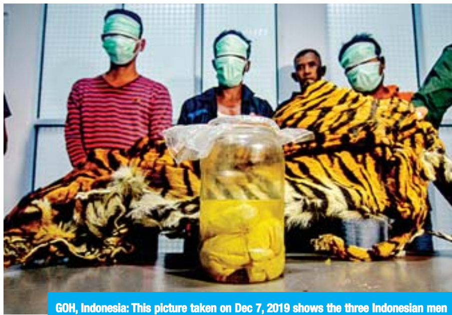
GOH, Indonesia: This picture taken on Dec 7, 2019 shows the three Indonesian men being paraded with a seized Sumatran tiger skin and four tiger fetus in a jar. —AFP

Poaching is responsible for almost 80 percent of Sumatran tiger deaths, according to TRAFFIC, a global wildlife trade monitoring network. Sumatran tigers are considered critically endangered by protection group the International Union for Conservation of Nature, with fewer than 400 believed to remain in the wild. —AFP