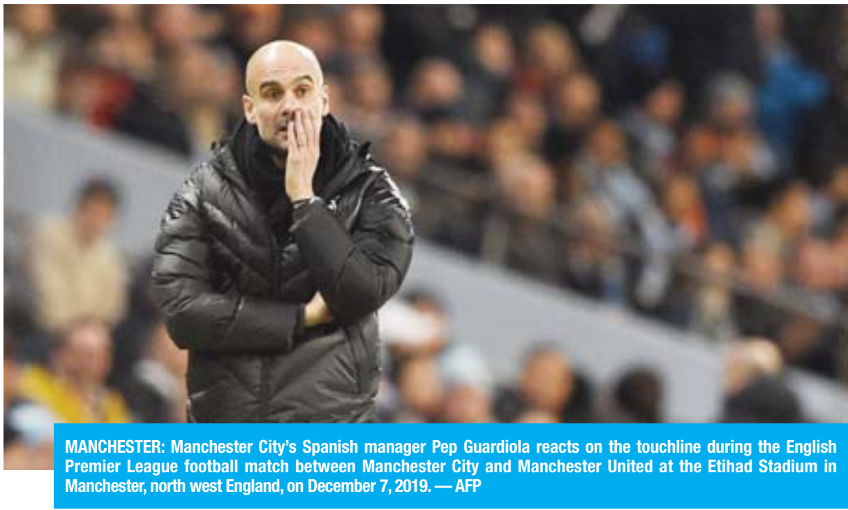
MANCHESTER: Manchester City’s Spanish manager Pep Guardiola reacts on the touchline during the English Premier League football match between Manchester City and Manchester United at the Etihad Stadium in Manchester, north west England, on December 7, 2019.

Leicester, Klopp is not getting carried away. “I don’t know if it’s so special because we don’t think about it,” he said of the unbeaten run. We get confronted with our winning streak always after the game, that’s the only moment. From that moment on, nobody thinks about it.” Klopp believes resting and rotating his players will