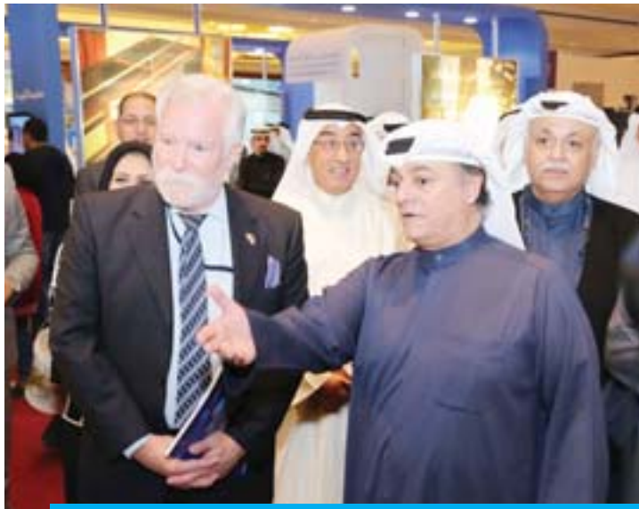
Officials tour the exhibition.