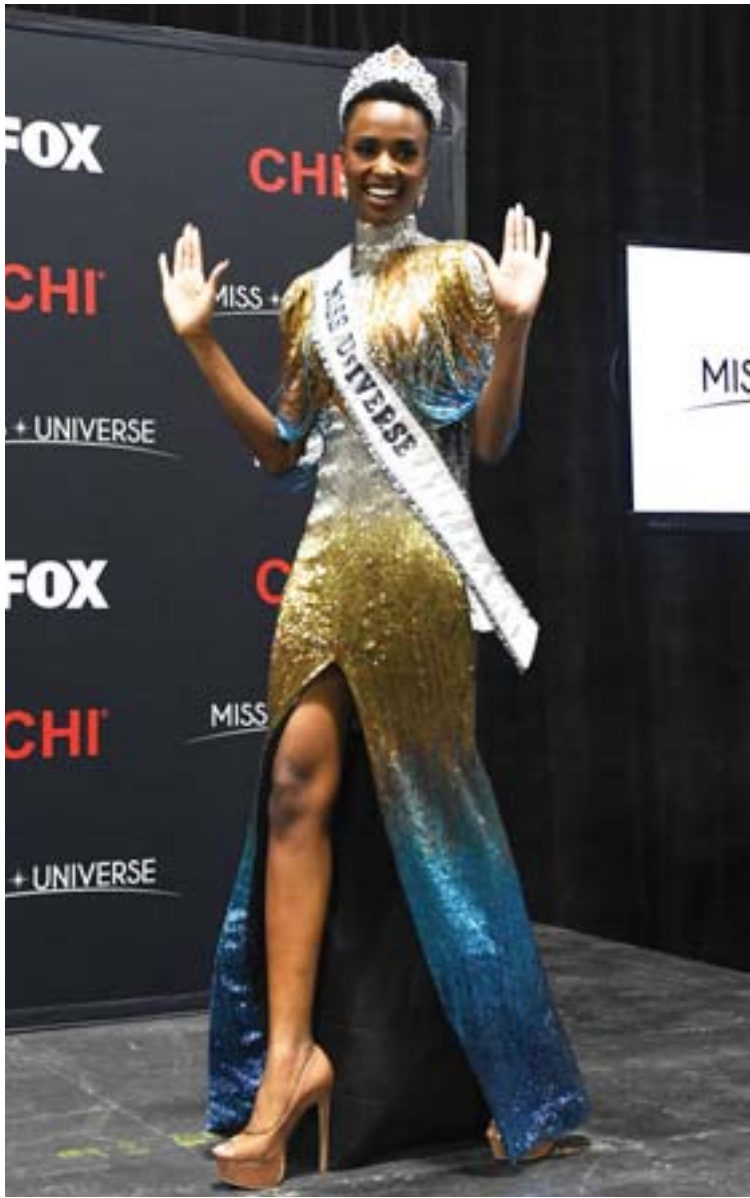
Newly crowned Miss Universe 2019 South Africa's Zozibini Tunzi arrives for a press conference after the 2019 Miss Universe pageant at the Tyler Perry Studios in Atlanta, Georgia on December 8, 2019.