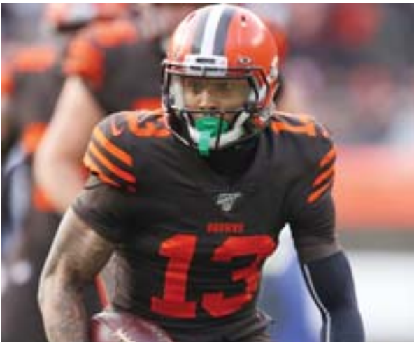
CLEVELAND: Odell Beckham #13 of the Cleveland Browns looks for yards after a first half catch while playing the Cincinnati Bengals at FirstEnergy Stadium on December 08, 2019 in Cleveland, Ohio.

Carl Soderberg had the game-tying goal and an assist, and Arizona rallied for a win in the shootout round against host Chicago. Christian Fischer and Conor Garland also scored during regulation for the Coyotes, who won for the third time in four games. Garland provided the decisive goal in the shootout round, which also featured a goal by Nick Schmaltz. Jonathan Toews, Alex DeBrincat and Dominik Kubalik each scored for the Blackhawks. Patrick Kane tallied the lone shootout goal for Chicago, who earned a point in the standings despite the late letdown. — Reuters