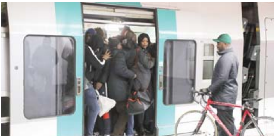
PARIS: Commuters board a train at Nation suburban train station in Paris, during a strike of Paris public transports operator RATP employees yesterday.

Fairer system for all? Over 800,000 people took to the streets when the strike was launched on December 5, many accusing Macron of trying to weaken France's generous social safety net. The president, Prime Minister Edouard Philippe and senior cabinet ministers met late Sunday to discuss the changes, which they argue will ensure a fairer and more sustainable system for all.