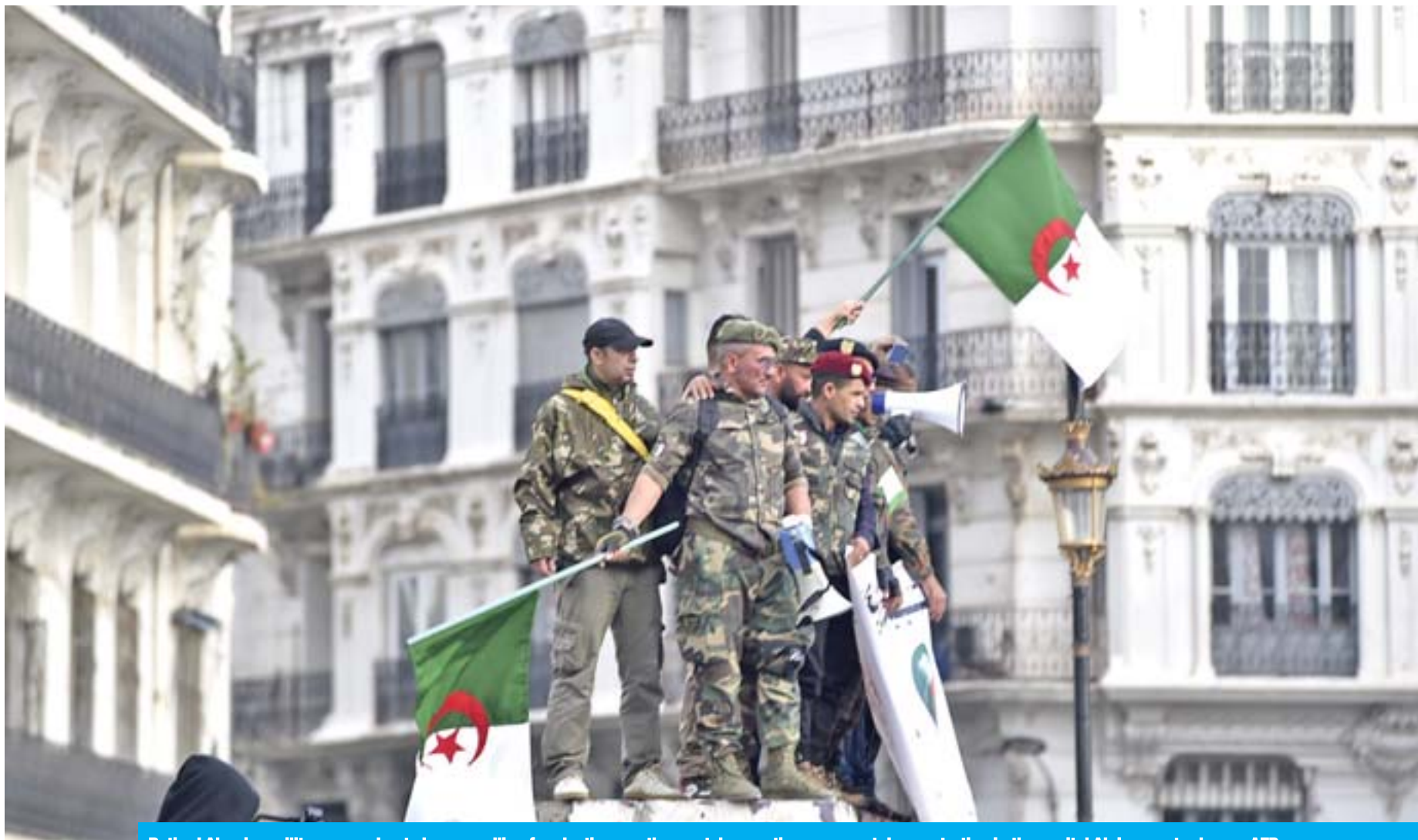
Retired Algerian military men shout slogans calling for elections as they watch an anti-government demonstration in the capital Algiers yesterday.

All articles appearing on this page are the personal opinion of the writers. Kuwait Times takes no responsibility for views expressed therein.