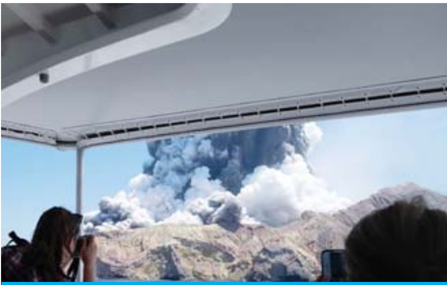
BAY OF PLENTY, New Zealand: This handout photograph shows the volcano on New Zealand's White Island spewing steam and ash moments after it erupted yesterday.

HONG KONG/LONDON: The Kuwaiti government's resignation and subsequent cabinet reshuffle point to political frictions that could delay new debt issuance and weigh on broader fiscal and economic reforms, Fitch Ratings said in a report issued yesterday. Kuwait has been the slowest reformer in the Gulf Cooperation Council in recent years, partly due to these frictions and partly due to its exceptionally large sovereign assets, which could finance decades' worth of fiscal deficits.