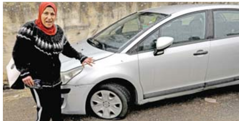
JERUSALEM: A Palestinian woman displays her vehicle's slashed tyre in the Palestinian neighborhood of Shuafat, neighboring the Israeli settlement of Ramat Shlomo, in Israel annexed east Jerusalem yesterday. — AFP

But although clashes in the south have largely subsided, the situation on the ground remains fragile, said Kendall. "This is a classic case of an agreement being easy to sign but near impossible to implement," she said. Other parts of the deal, including placing forces from both sides under the authority of the defense and interior ministries, have also not been fulfilled. — AFP