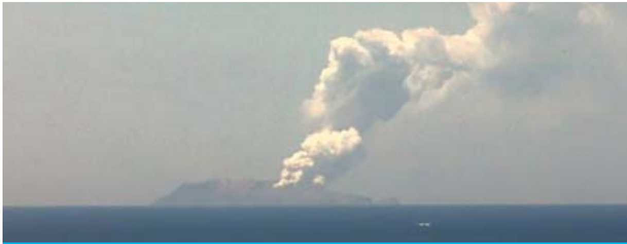
This handout image shows the volcano on New Zealand's White Island spewing steam and ash yesterday.

"Reform will remain slow unless the composition of the new government resolves underlying power struggles and enjoys broad support among MPs and different sections of society. Neither of these is likely, in our view, partly because there are no political parties in Kuwait and the government's support base of individual MPs shifts from issue to issue," Fitch said. "Kuwait's rating of 'AA/Stable' is underpinned by its exceptionally strong balance sheet, with sovereign net foreign assets of nearly 500 percent of GDP. Nevertheless, this buffer could be eroded by sustained low oil prices or an inability to address structural drains on public finances from a generous welfare state and large public sector."