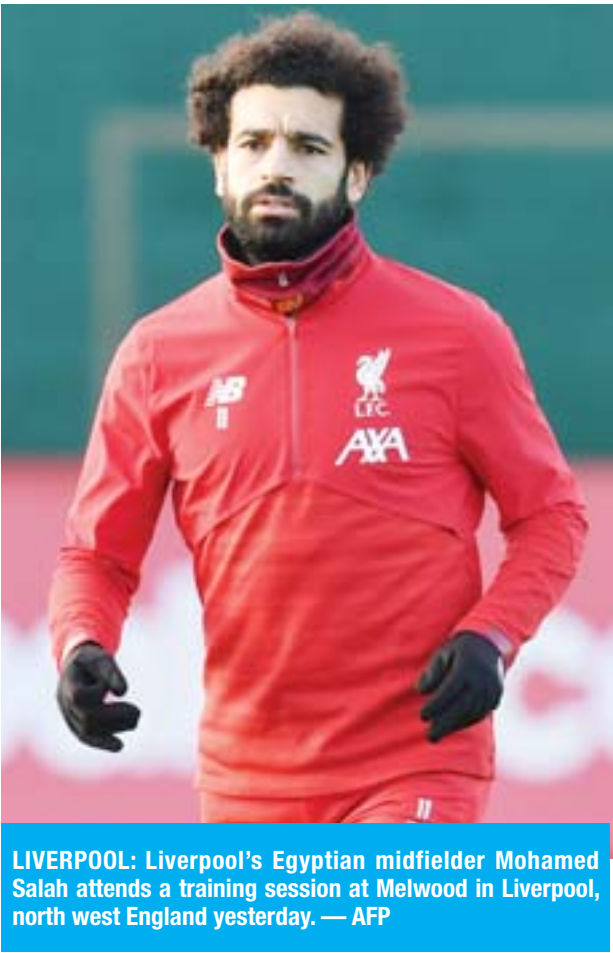
LIVERPOOL: Liverpool’s Egyptian midfielder Mohamed Salah attends a training session at Melwood in Liverpool, north west England yesterday.

The Algerian defender, who joined Gladbach from Rennes in August, scored both goals in a 2-1 win over Bayern Munich which ensured Borussia remained top of the table. After converting a corner with a perfectly placed header in the 60th minute to make the score 1-1, Bensebaini converted a penalty deep into second-half