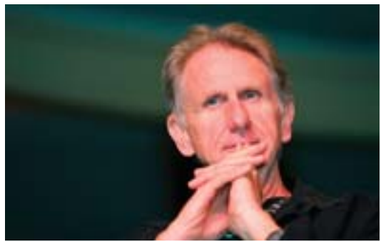
Actor Rene Auberjonois, who played the character Odo on the television series ‘Star Trek: Deep Space Nine,’ appears at the Star Trek convention at the Las Vegas Hilton in this file photo. Rene Auberjonois, the actor best known for his roles in ‘Star Trek: Deep Space Nine’ died on Sunday at his home in Los Angeles of metastatic lung cancer.