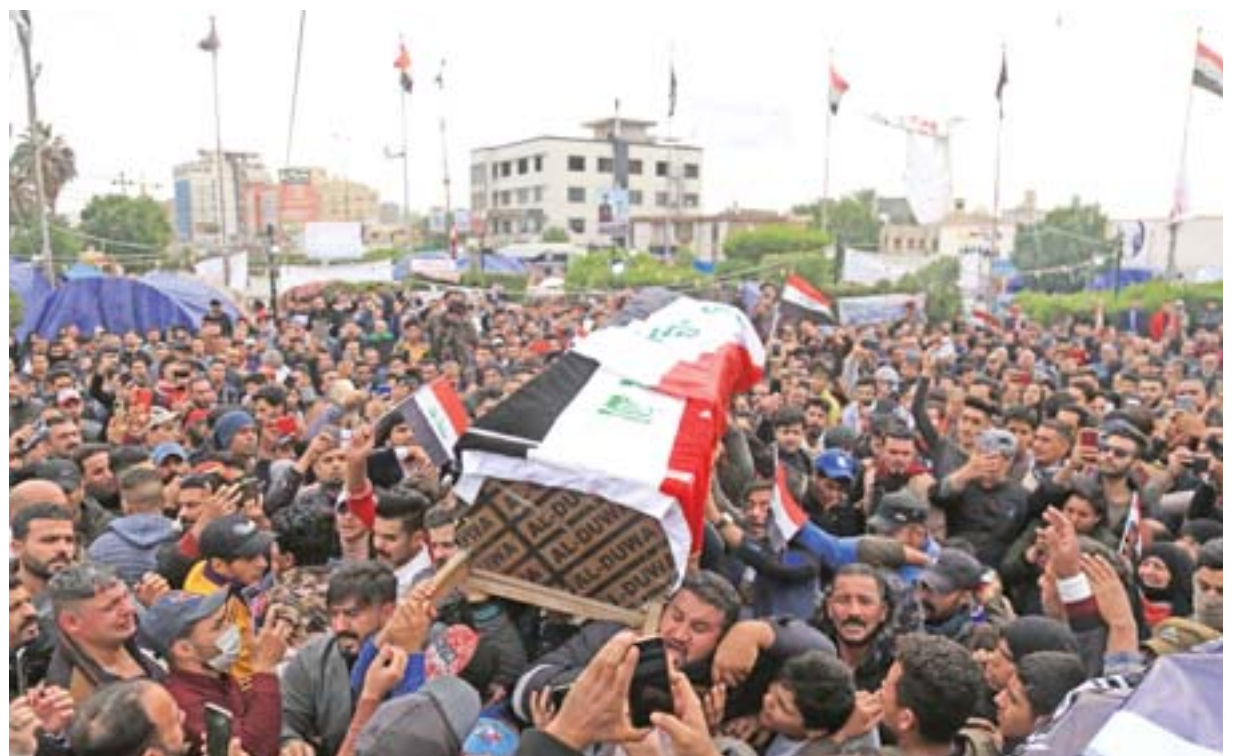
KARBALA: Iraqi mourners attend the funeral yesterday of a prominent civil society activist who was shot dead the previous night while returning home from anti-government protests.

The latest in the early hours of yesterday saw four rockets slam into an Iraqi base that hosts a small contingent of US forces next to Baghdad International Airport. Six Iraqi troops were wounded, according to the military.