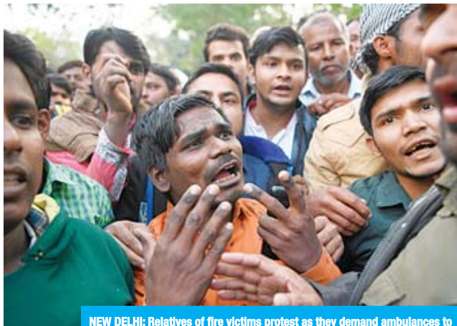
NEW DELHI: Relatives of fire victims protest as they demand ambulances to carry the bodies back to their hometown yesterday.

Delhi Chief Minister Arvind Kejriwal announced compensation of 1 million rupees ($13,933) for the families of those killed. Most workers complained of government apathy. "Politicians came to the site, made big announcements and left the scene, but