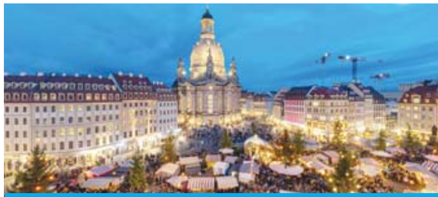
DRESDEN: The illuminated Frauenkirche (Church of Our Lady) can be seen at the Neumarkt square as visitors crowd at the traditional Christmas market in Dresden, eastern Germany.

“With disappointing consumption and industrial data but encouraging trade data, the economy will remain on a windy road between contraction, stagnation and meagre growth,” he added. In the near term, a second quarter of negative growth for 2019 appears less likely in October-December than many economists feared, after Germany narrowly escaped a technical recession – two successive quarters of shrinkage – in July-September. — AFP