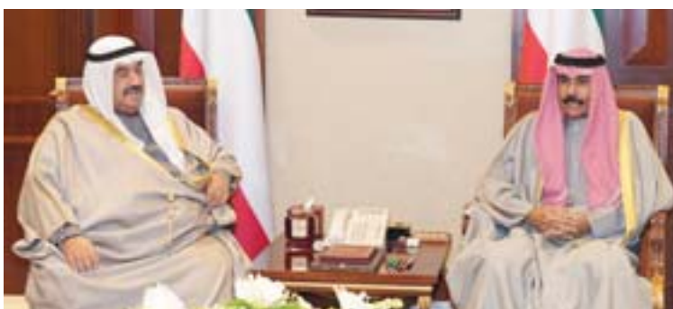
His Highness the Crown Prince Sheikh Nawaf Al-Ahmad Al-Jaber Al-Sabah meets with His Highness Sheikh Nasser Al-Mohammad Al-Ahmad Al-Sabah.

In the meantime, Minister of State for Youth Affairs Mohammad Al-Jabri congratulated Bahrain's national football team clinching the title of the 24th Arabian Gulf Cup in Qatar on Sunday night. "The Bahraini team have showed an impressive performance since the beginning of the championship on November 26 until they were able to secure this well-deserved victory," the minister said. Jabri commended the performance of the Saudi Arabian team wishing them good luck in coming championships. "Since its inception in 1970, the Arabian Gulf Cup has served as a sports platform cementing the fraternal relations among the countries of the Gulf region," he said. The minister praised Qatar's "impressive organization" of the 24th edition of the championship. —KUNA