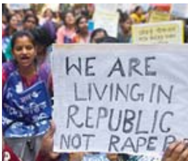
Rape victim's relatives to get guns and guards