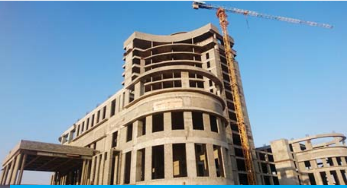
AL-AHSA, Saudi Arabia: A half built Qatari-funded hotel site in this eastern Saudi city is seen on Nov 29, 2019 after construction was abruptly halted in 2017.

But the real bellwether will be the level of Qatari representation at the Gulf Cooperation Council summit in Riyadh on Tuesday. The Saudi king has personally invited Qatar's amir, but it remains unclear whether he will attend. Two sources familiar with the negotiations, including an Arab diplomat, told AFP that hardliners in Abu Dhabi - Riyadh's principal ally - are opposed to a restoration of ties. This has raised the prospect of a