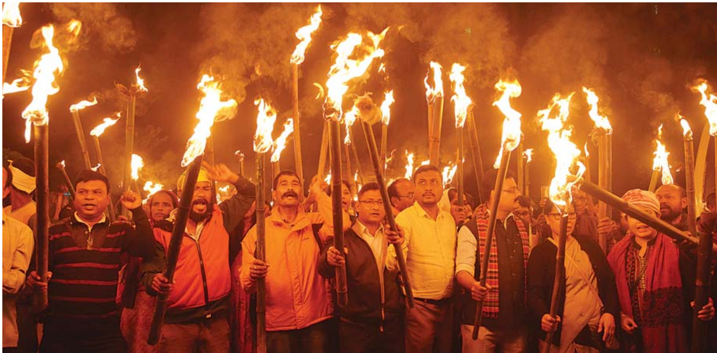
GUWAHATI, India: Krishak Mukti Sangram Samiti (KMSS) activists take part in a torchlight procession to protest against the government's Citizenship Amendment Bill yesterday.