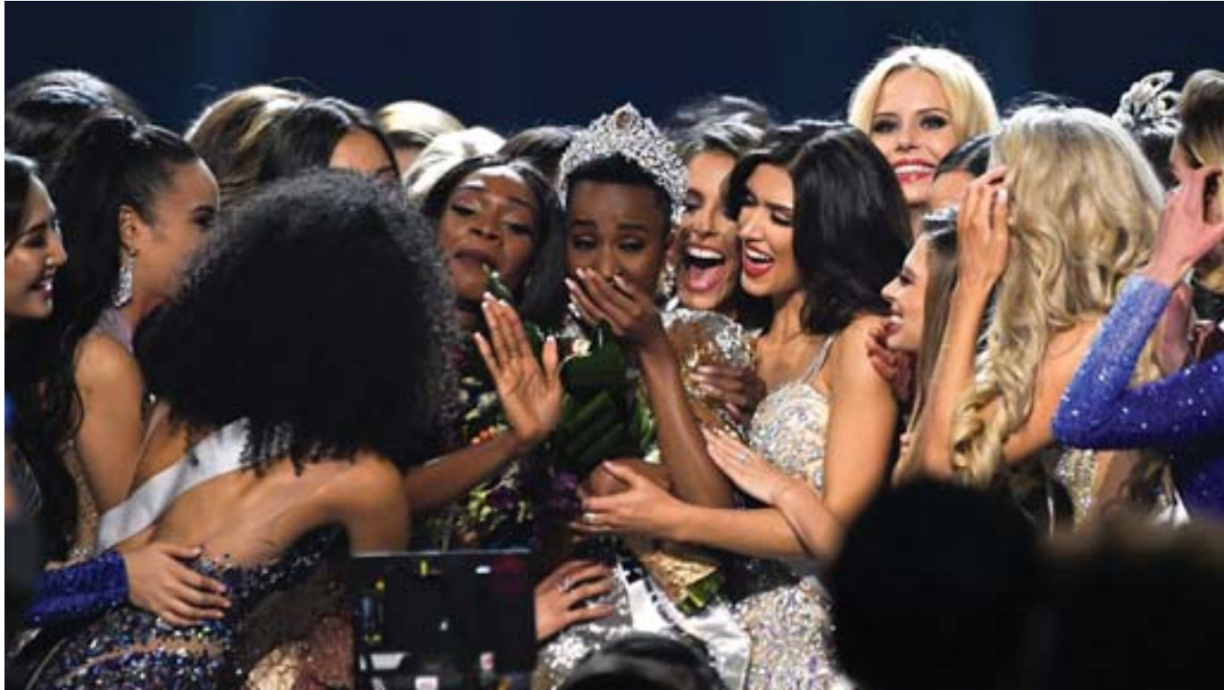
Contestants stand around an emotional newly crowned Miss Universe 2019 South Africa's Zozibini Tunzi after the 2019 Miss Universe pageant.

owned the organization from 1996-2015. Additionally, Miss Universe continues to host the swimsuit competition, which has drawn criticism for objectifying the contestants, although that part of the pageant was not televised.