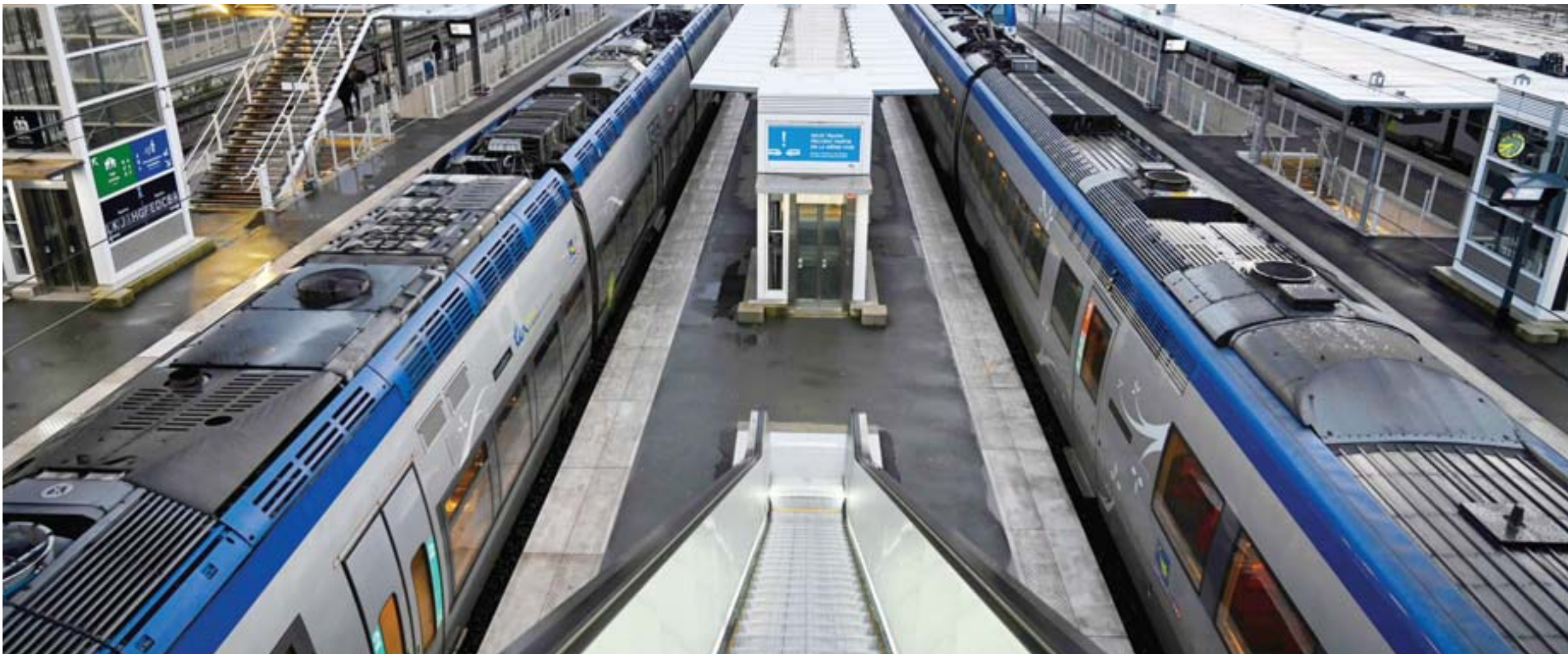
RENNES: TER (Transport Express Regional) trains are pictured at Rennes railway station yesterday. French commuters and tourists braced for another day of public transport chaos yesterday as the government prepared to respond to widespread anger over pension reform that has sparked open-ended walkouts.