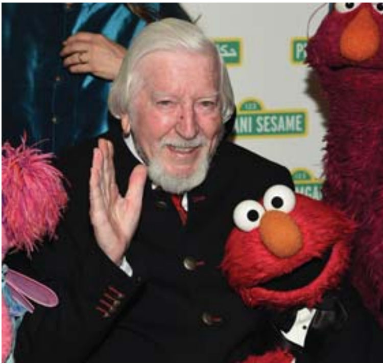
Caroll Spinney and The Muppets attend The 2017 Sesame Workshop Dinner at Cipriani 42nd Street in New York City.