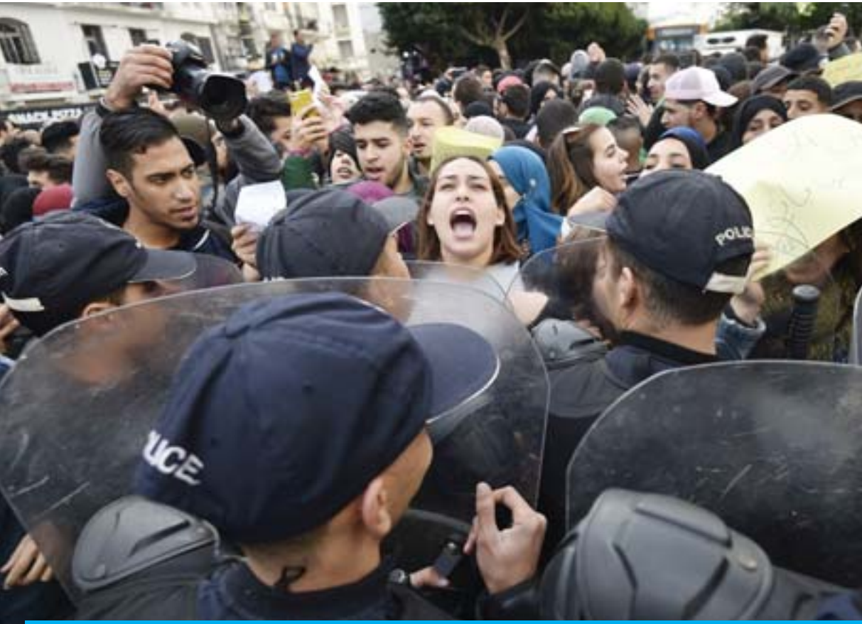
ALGIERS: Algerian security forces contain protesters shouting slogans during an anti-government demonstration in the capital yesterday.