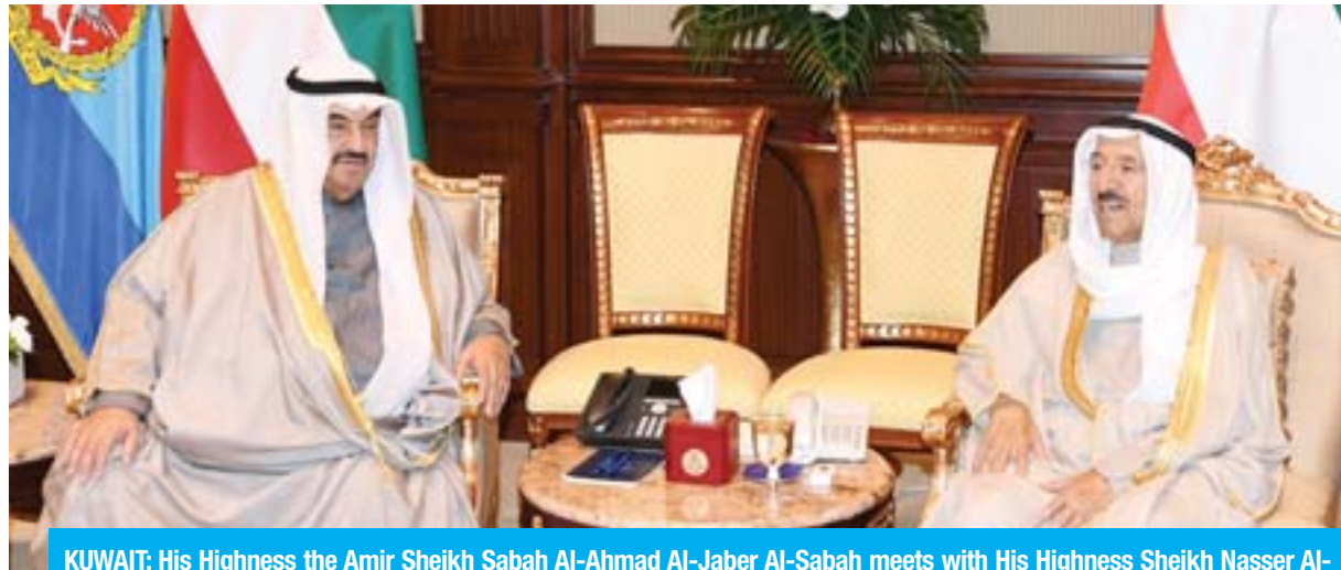
KUWAIT: His Highness the Amir Sheikh Sabah Al-Ahmad Al-Jaber Al-Sabah meets with His Highness Sheikh Nasser Al-Mohammad Al-Ahmad Al-Sabah.