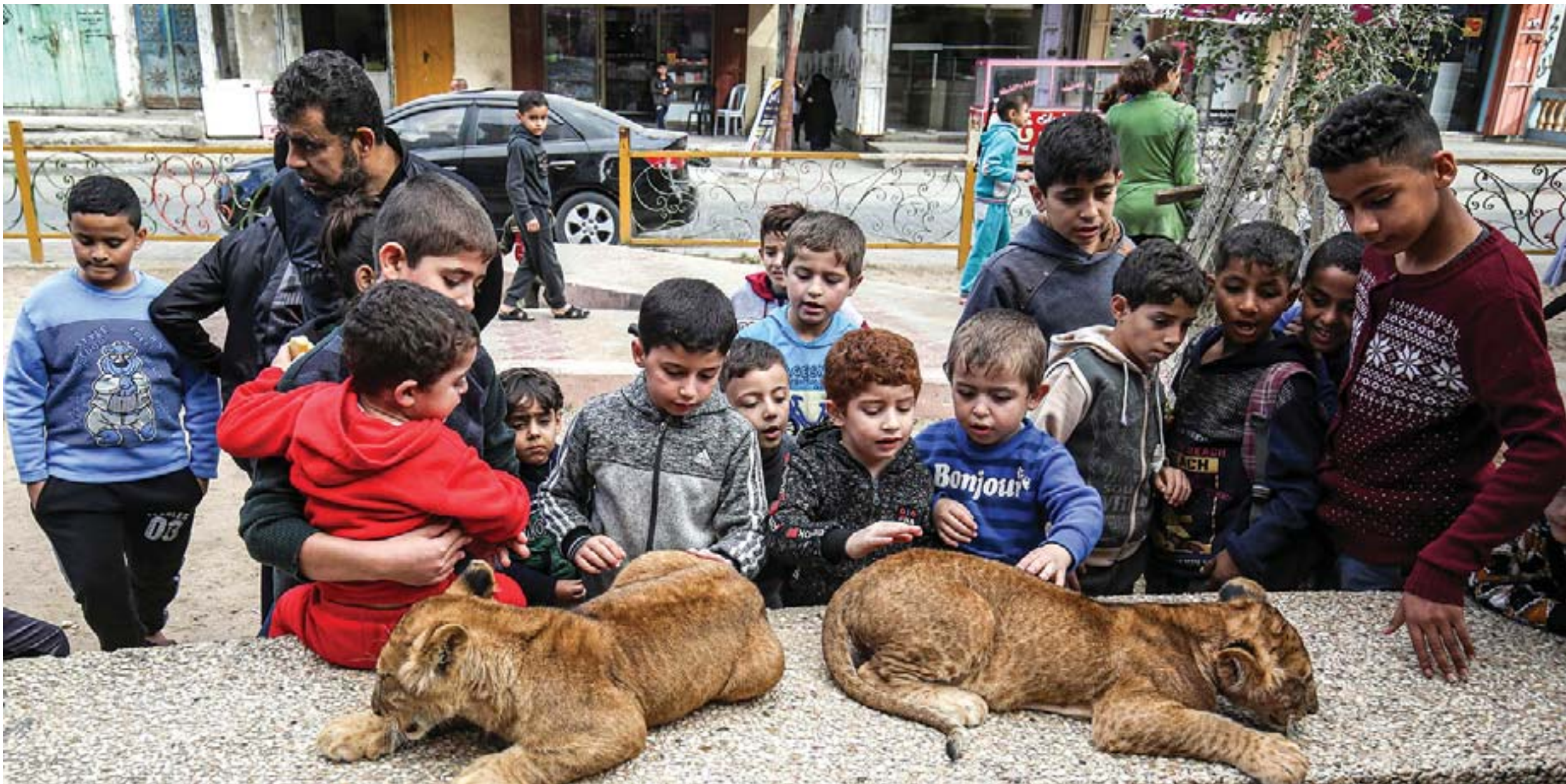
Palestinian children play with pet lion cubs sitting on a concrete ledge along a street in Rafah in the southern Gaza Strip, placed there by a local zoo owner to promote the venue. The Rafah Zoo in the southern Gaza Strip was known for its emaciated animals, with the owners saying they struggled to find enough money to feed them. In April, international animal rights charity Four Paws took all the animals to sanctuaries, receiving a pledge that the zoo would close forever. However it reopened again in August with two lions and three new cubs, penned in cages only a few square metres in size.