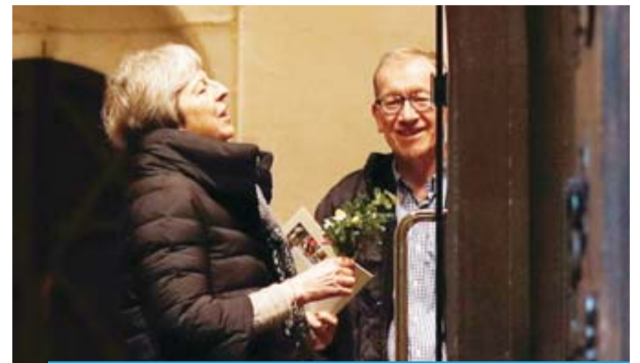
MAIDENHEAD: Britain's Prime Minister Theresa May (left) is handed a posy of flowers by the vicar as she leaves with her husband Philip after attending a church service, near her Maidenhead constituency, west of London yesterday.