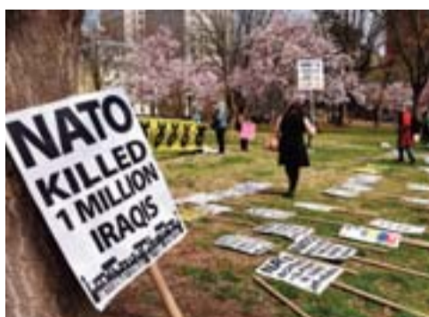
WASHINGTON: Signs lie in the grass during a protest ahead of the 70th anniversary of the summit meeting of the North Atlantic Treaty Organization (NATO) in Lafayette Square in Washington, DC.