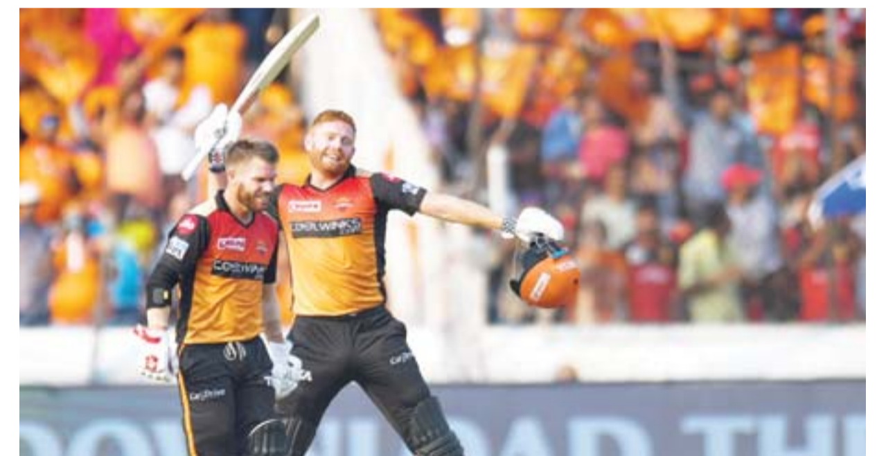
BANGALORE: Sunrisers Hyderabad cricketer Jonny Bairstow (R) celebrates with his teammate David Warner (L) after scoring century (100 runs) during the 2019 Indian Premier League (IPL) Twenty20 cricket match between Sunrisers Hyderabad and Royal Challengers Bangalore at The Rajiv Gandhi International Cricket Stadium.

A draw with fellow Kiwis the Wellington Hurricanes stopped the rot before they humiliated the Northern Bulls 56-20 in South Africa last weekend. Victory in Argentina lifted the Chiefs four places from last to 11th in the combined standings while the Jaguares remained 14th and the Tokyo-based