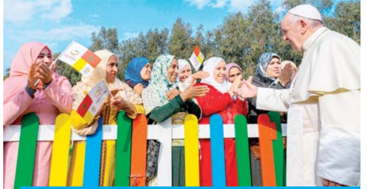
TEMARA: Pope Francis blessing Moroccan women upon his arrival for a visit to the Rural Center for Social Services at Temara, south of Rabat, during the pontiff's two-day visit to Morocco. Flags read 'Pope Francis, Servant of Hope'.