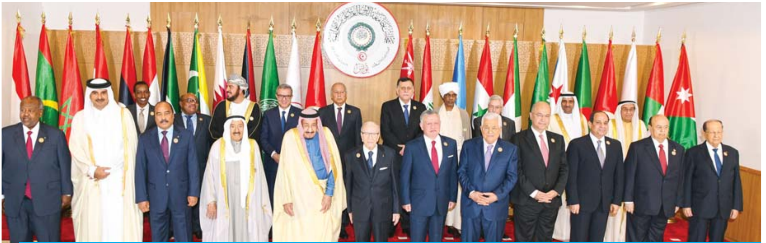
TUNIS: (From left) Djibouti's President Ismail Omar Guelleh, Qatar's Amir Tamim bin Hamad Al-Thani, Mauritania's President Mohamed Ould Abdel Aziz, HH the Amir of Kuwait Sheikh Sabah Al-Ahmad Al-Jaber Al-Sabah, Saudi Arabia's King Salman bin Abdulaziz, Tunisia's President Beji Caïd Essebsi, Jordan's King Abdullah II, Palestinian President Mahmoud Abbas, Iraq's President Barham Saleh, Egypt's President Abdel Fattah el-Sisi, Yemen's President Abedrabbo Mansour Hadi and Lebanese President Michel Aoun pose for a group photograph with other Arab leaders during the 30th Arab League summit in the Tunisian capital yesterday.

Arab leaders condemn US decision on Golan • Qatari Amir leaves summit early