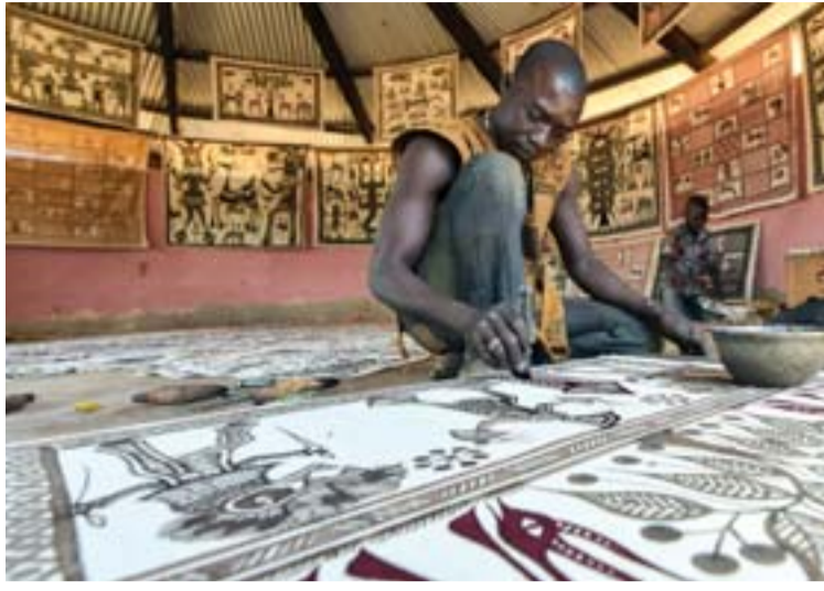
An artist paints on a cotton fabric in his workshop, in the village of Fakaha, northern Ivory Coast.