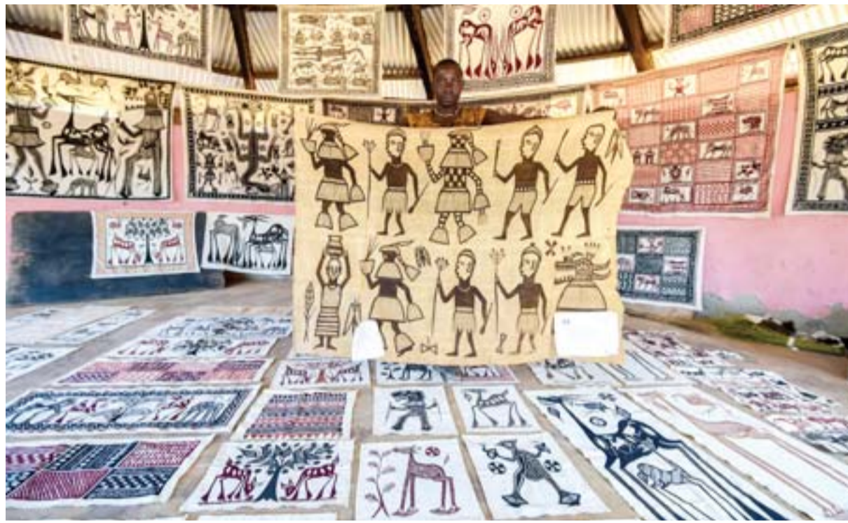
An artist in his workshop shows a painting assumed to be made by Spanish artist Pablo Picasso.

And there is an element of Picasso in it, with a definite