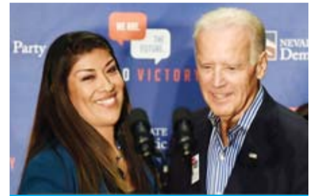
LAS VEGAS: In this file photo taken on Nov 1, 2014, Nevada Assemblywoman Lucy Flores introduces former US Vice President Joe Biden at a get-out-the-vote rally at a union hall.

"For me it's disqualifying," she told CNN. "Yes, of course I want him to change his behavior. And I want him to acknowledge this was wrong. I want this to be a bigger discussion about how there is no accountability