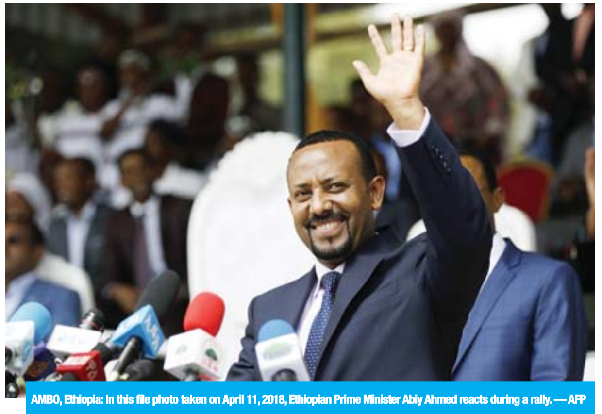
AMBO, Ethiopia: In this file photo taken on April 11, 2018, Ethiopian Prime Minister Abiy Ahmed reacts during a rally.

Abiy has touted his moves to improve media freedom - following in the footsteps of Hailemariam, who released several prominent jailed journalists - but instability threatens this progress. Elias Kifle, who heads the online