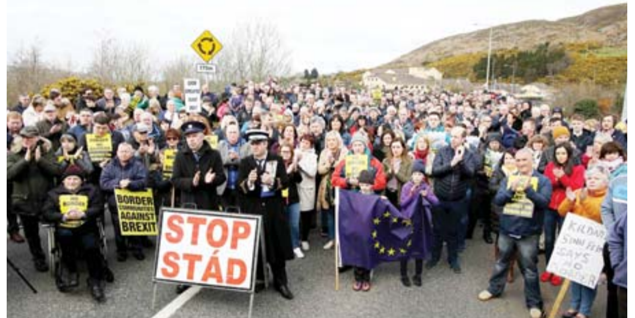
CARRICKCARNAN: Protesters against any border between Ireland and Northern Ireland because of Brexit hold placards at the Carrickcarnan border between Newry in Northern Ireland and Dundalk in the Irish Republic.

The Sunday Telegraph said senior members of the Conservative Party did not want May to lead them into a snap election, fearing the party would be "annihilated" at the polls if she faced down parliament over Brexit in the coming months. An opinion poll in the Mail yesterday gave the opposition Labor Party a lead of five percentage points over the Conservatives. That lead fell to three points if voters were offered the chance to vote for a new group of independent law-