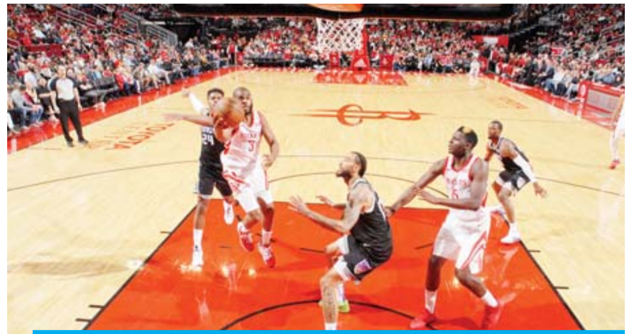
HOUSTON: Chris Paul #3 of the Houston Rockets shoots the ball against the Sacramento Kings at the Toyota Center in Houston, Texas.

D'Angelo Russell scored 20 of his 29 points in the third quarter to lead host Brooklyn over short-handed Boston. Russell added 10 assists, Caris LeVert scored 15 points and DeMarre Carroll and Joe Harris chipped in 13 each as the Nets put a 2-5 road trip behind them in their first home game since March 11. Brooklyn (39-38) remained in seventh place in the Eastern