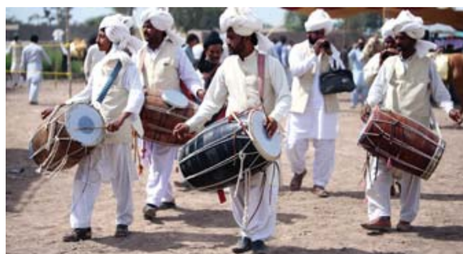
Pakistani traditional drummers perform during an attempt by Pakistani horse riders for a Guinness World Record for tent pegging.

invigorating breath of fresh air. "That is a fantastic tale which would have pleased him very much," he told AFP. "There were a lot of stories about Pablo Picasso, and since he had a sense of humor, he would sometimes pretend some of them were true."