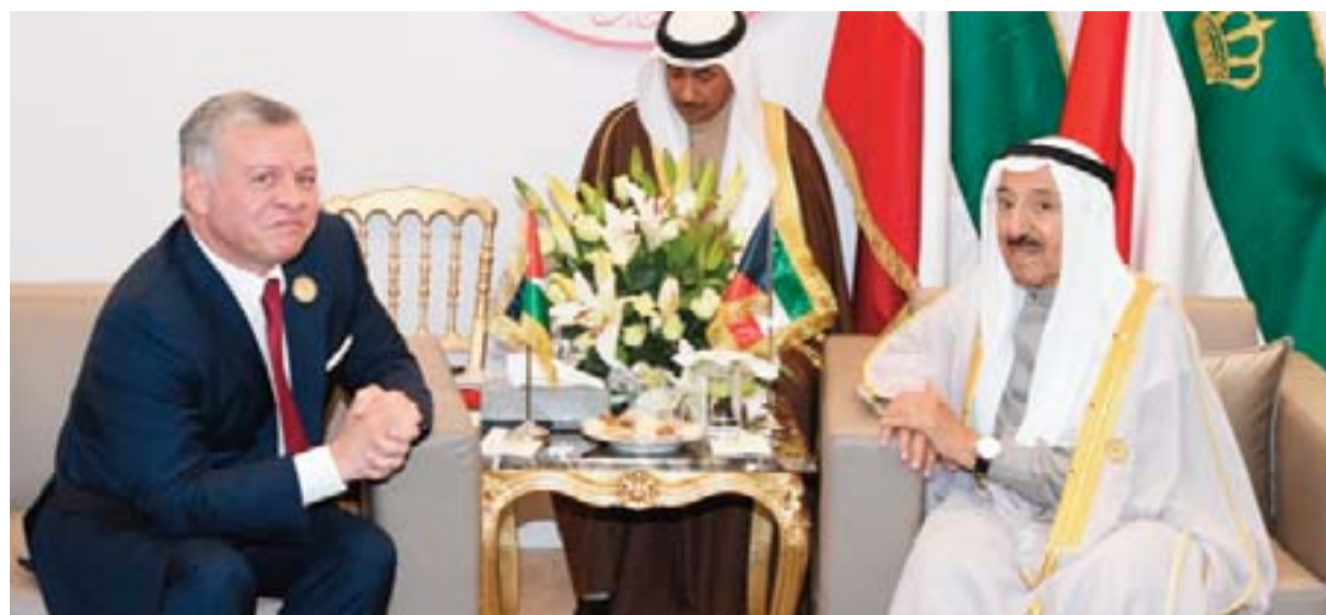
HH the Amir receives King Abdullah II of Jordan.

HH the Amir met UN Secretary-General Antonio Guterres at the Conference Palace in Tunis yesterday. During the meeting, they reviewed distinguished relations between Kuwait and the UN and ways of developing them as well as existing cooperation. The UN