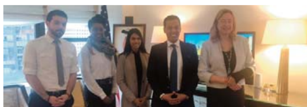
NEW YORK: Consul General Hamad Al-Hazeem during the opening ceremony of the consulate.

Its role will aim to find jobs and investment