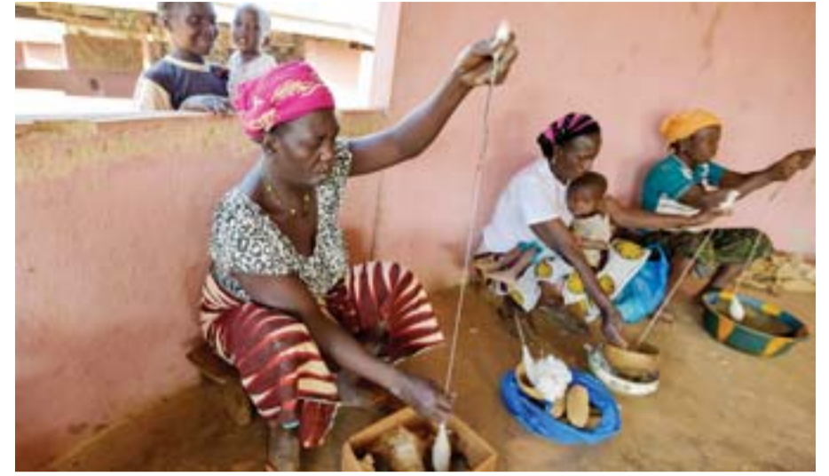
A group of women spin cotton in the village of Fakaha, northern Ivory Coast.