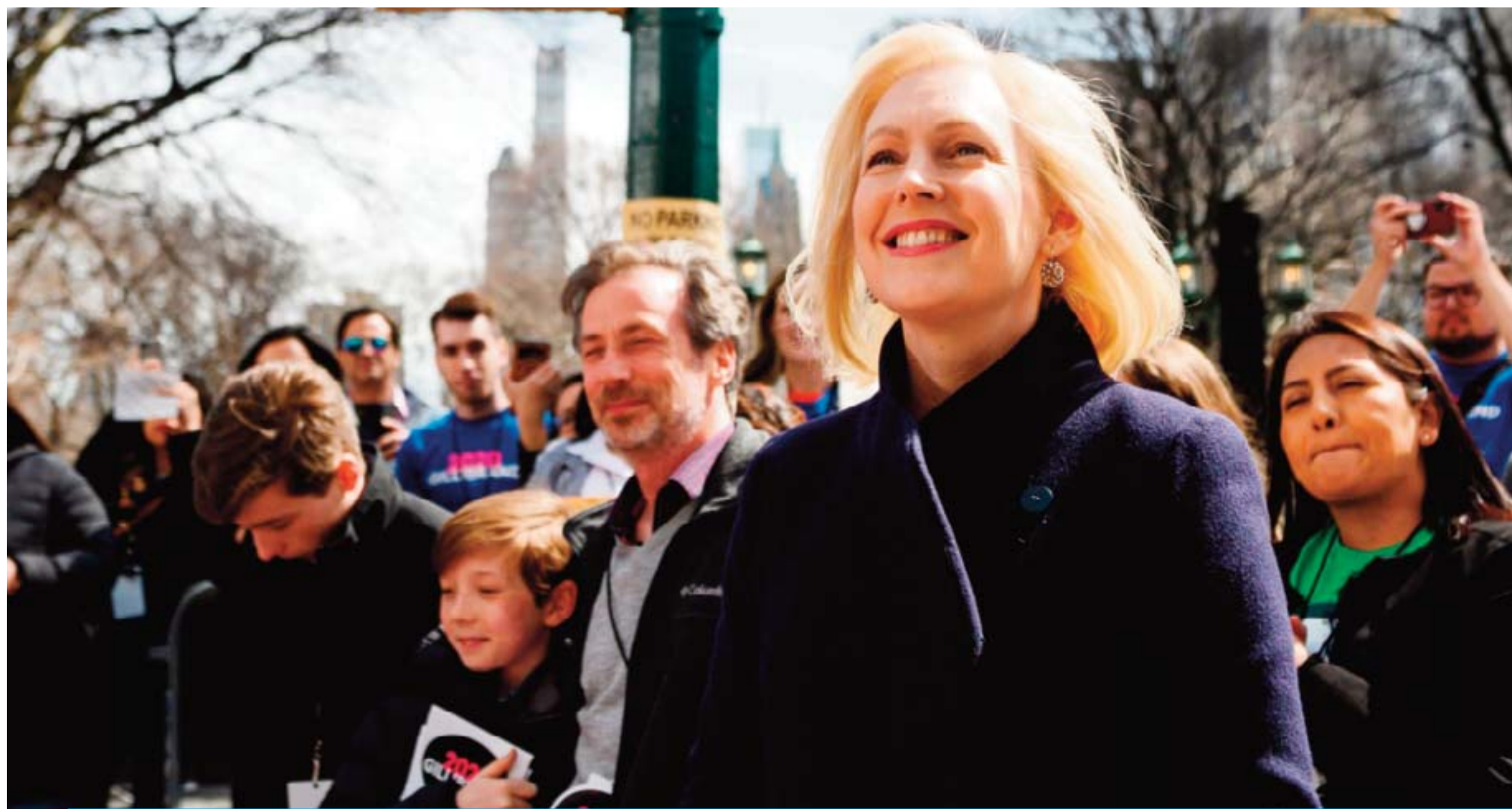
NEW YORK: Democratic presidential candidate Kristen Gillibrand waits to address the rally for the official kick-off to her campaign for president in New York City.

A tale of two Delhis: Deadly air exposes rich-poor divide