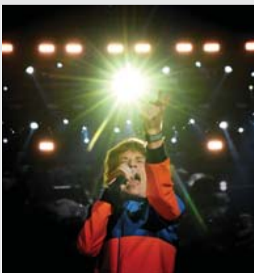
In this file photo Mick Jagger leads the Rolling Stones as they perform during the Desert Trip music festival at Indio, California.

British rock icon Mick Jagger said on Saturday he was "devastated" after his Rolling Stones were forced to cancel their United States and Canada tour dates so he could receive "medical treatment". "I really hate letting you down like this," the 75-year-old wrote on his Twitter account, without specifying what treatment he was receiving. "I'm devastated for having to postpone the tour but I will be working very hard to be back on stage as soon as I can."