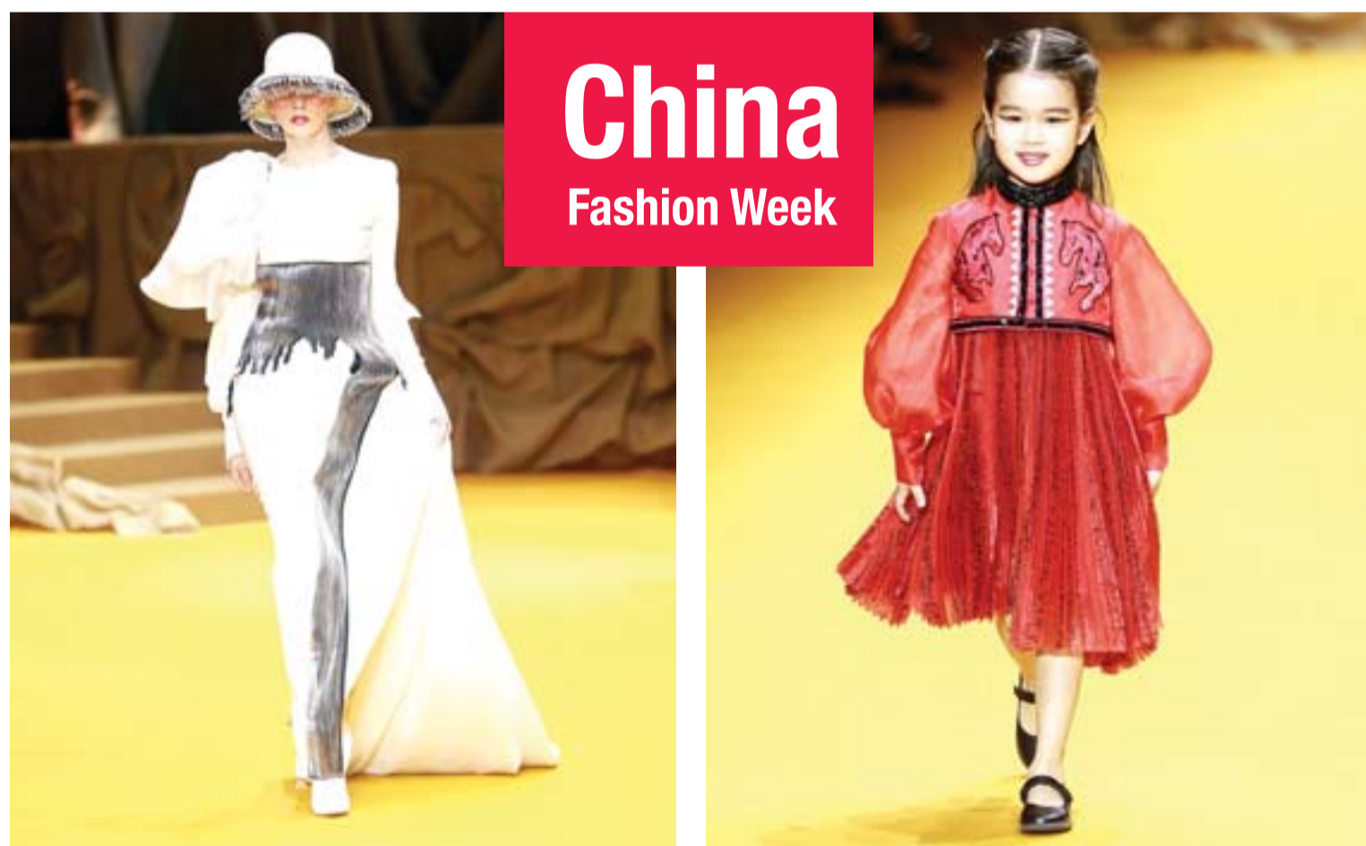
Models display creations from the "Maryma" collection by Ma Yanli during the China Fashion Week in Beijing.