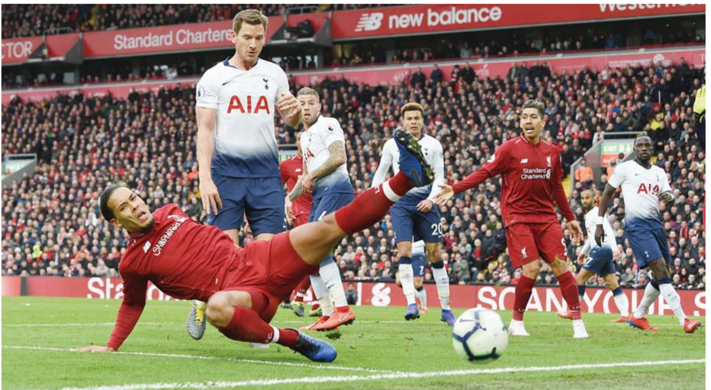
LIVERPOOL: Liverpool's Dutch defender Virgil van Dijk (L) fails to reach the ball during the English Premier League football match between Liverpool and Tottenham Hotspur at Anfield in Liverpool, north west England yesterday.

Late goals hand Chelsea thrilling win over unlucky Cardiff