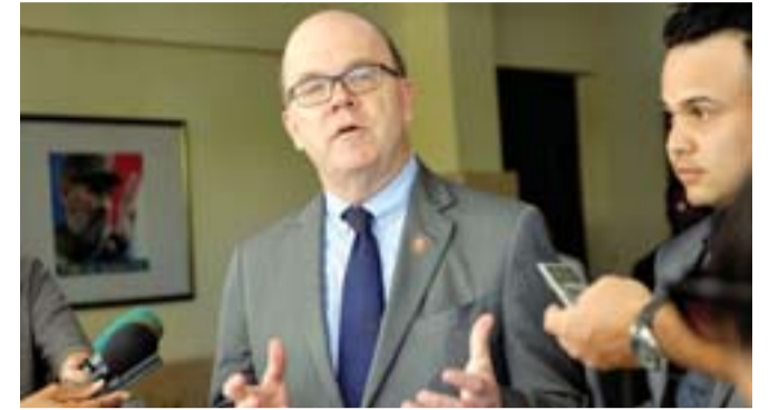
US Democratic congressman for the state of Massachusetts Jim McGovern, chairman of the Rules Committee of the House of Representatives of the US Congress, speaks to the press at the Cuban Higher Institute of International Relations (ISRI) in Havana.

In a separate statement the council said "there are many US interests linked to cultural exchanges with Cuba that are curbed by the setback in bilateral relations." "With very little money, and in the midst of a dauntingly difficult political climate, this project has flourished and continues to grow," the foundation said. Hemingway wrote many of his classics including "For Whom the Bell Tolls" and "The Old Man and the Sea" at Finca Vigia. Most of Hemingway's time in Cuba preceded the 1959 communist revolution. He committed suicide in 1961 after returning to the United States.—AFP