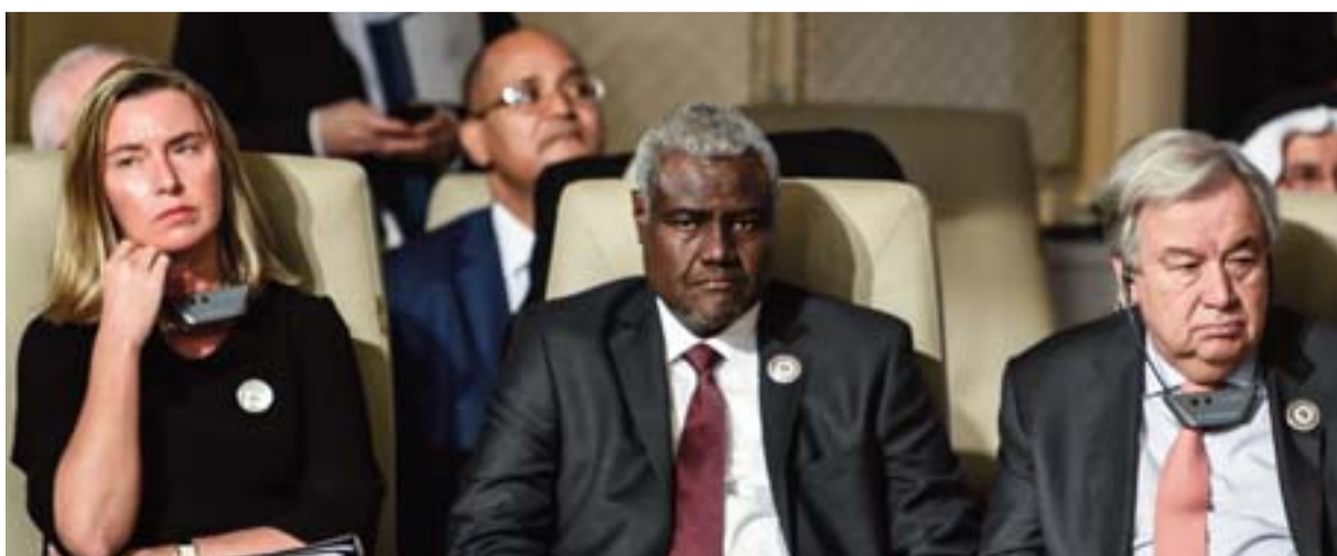
TUNIS: (From left) EU High Representative for Foreign Affairs and Security Policy Federica Mogherini, Chairperson of the African Union Commission Moussa Faki and UN Secretary-General Antonio Guterres listen as delegates address the opening session of the 30th Arab League summit yesterday.

Arab states remain divided over other issues, including how to deal with pro-democracy protests that have erupted in the region since 2011. The leaders of Sudan and Algeria were not at yesterday's meeting as both nations have been roiled by anti-government protests. Syria's seat at the summit was vacant, Damascus as been suspended from the League since 2011 over its crackdown on protesters at the start of its civil war. The League has said no consensus has yet been reached to allow Syria's reinstatement. — Agencies