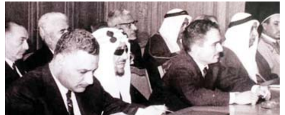
The Late Amir Sheikh Abdullah Al-Saleem Al-Sabah during the 2nd Arab Summit in 1964.

• Baghdad Summit was hosted by the Iraqi capital in November 1978 following the signing of a peace accord between Egypt and Israel. The conferees adopted a