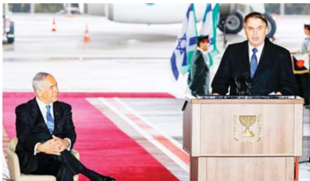
TEL AVIV: Israeli Prime Minister Benjamin Netanyahu (left) listens to a speech given by Brazilian President Jair Bolsonaro during an official welcome ceremony for Bolsonaro at Tel Aviv Ben Gurion International Airport yesterday.

Speaking to reporters Thursday, Bolsonaro suggested he was in no hurry to make a decision. "Trump took nine months to decide, to give his final word, so that the embassy was transferred," Bolsonaro said. "Perhaps now we will open a commercial office in Jerusalem."