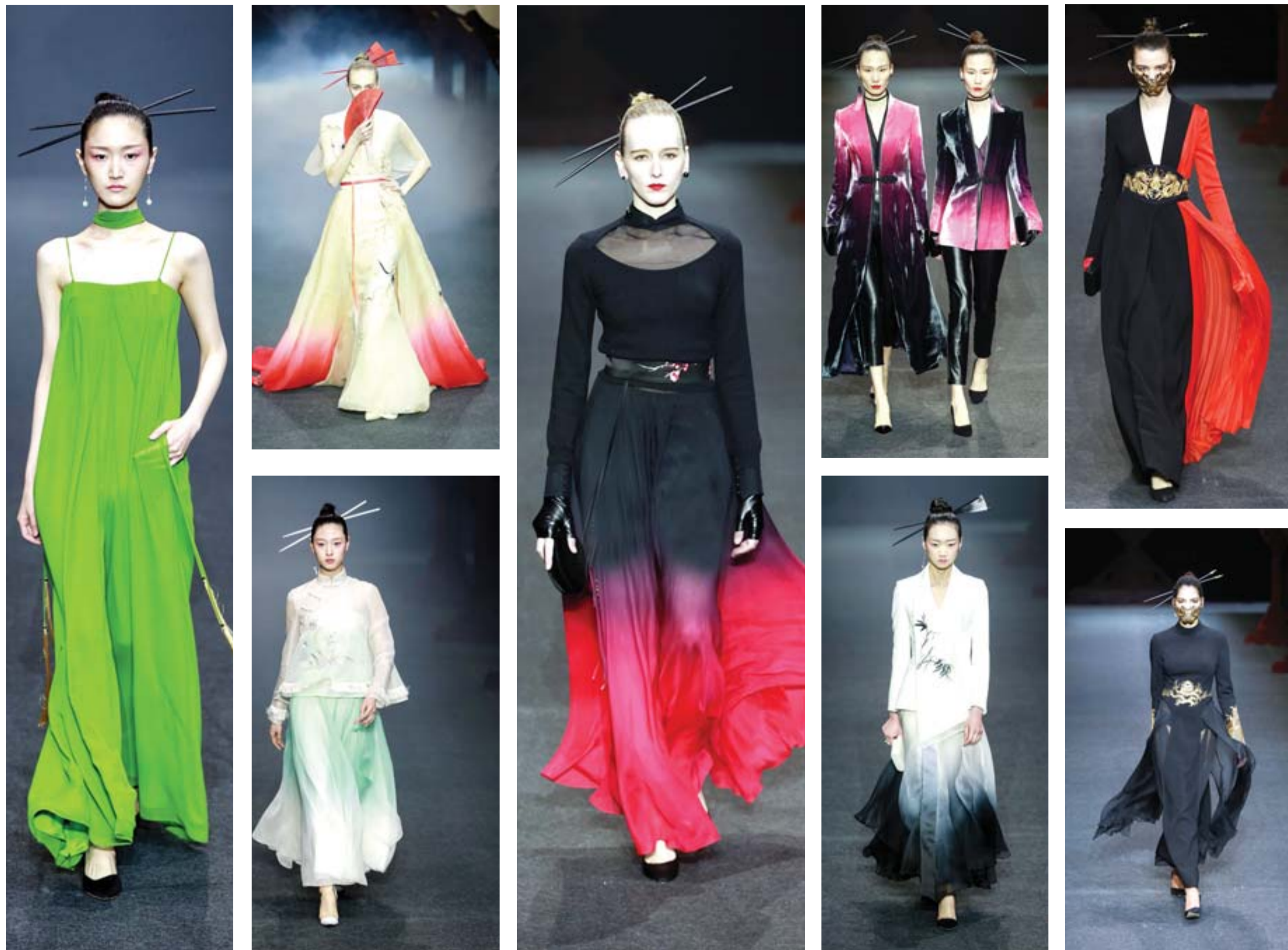
Models display creations from the "Heaven Gaia" collection by Xiong Ying during the China Fashion Week in Beijing.