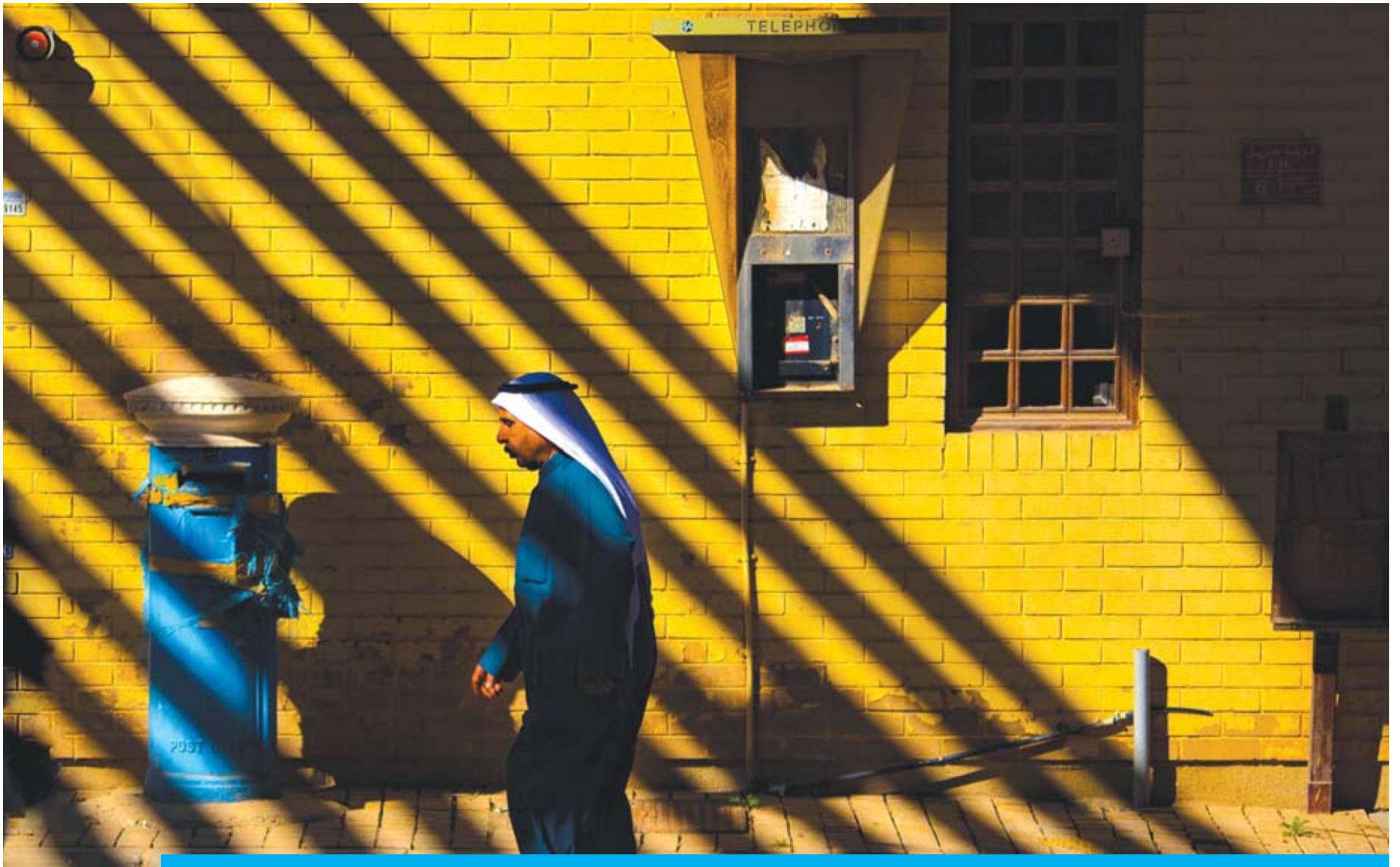
A man walks amidst the shadows of an old post office.