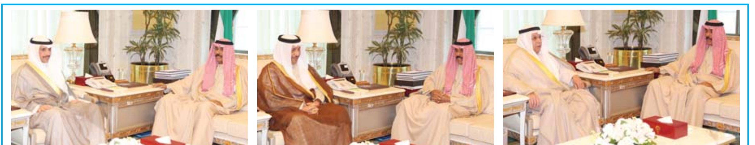
KUWAIT: His Highness the Deputy Amir and Crown Prince Sheikh Nawaf Al-Ahmad Al-Jaber Al-Sabah received Speaker Marzuq Al-Ghanem yesterday at Sief Palace Parliament. His Highness also received His Highness the Prime Minister Sheikh Jaber Al-Mubarak Al-Hamad Al-Sabah. HH then received Deputy Prime Minister and Interior Minister Sheikh Khaled Al-Jarrah Al-Sabah and Deputy Prime Minister and Minister of State for Cabinet Affairs Anas Al-Saleh.