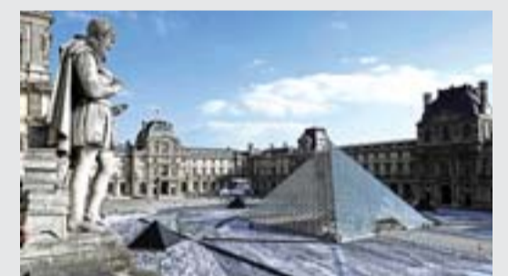
The Louvre pyramid is seen during preparations for the installation of French contemporary artist and photographer Jean Rene, aka JR, in the main courtyard of the Louvre Museum in Paris. — AFP

Even so, the story retains an element of mysterious intrigue. In a bid to seek expert input, AFP contacted the Picasso Museum in Paris, which declined to comment, then spoke with several of his biographers, who also refused to be pinned down. One theory put forward by residents of the city of Korhogo is that it was a false Picasso—a man who clearly resembled the famed Spanish painter and fooled the villagers by pretending to be him. But that also raises a question: why? —AFP