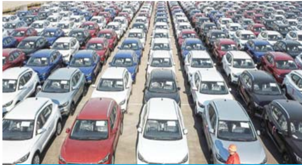
LIANYUNGANG: A staff member walks past new cars waiting to be exported at a port in Lianyungang in China’s eastern Jiangsu province yesterday. China’s manufacturing sector ended its four-month downward trend in March, official data showed yesterday, but exports continued their long slide in the wake of the Washington-Beijing trade war.

“We hope the US can work together with China, accelerate negotiations and make concrete efforts towards the goal of terminating trade tensions.” The government also said it would announce separately when the suspension would end. US President Donald Trump said on Friday that trade talks with China were going very well, but cautioned that he would not accept anything less than a “great deal” after top US and Chinese trade officials wrapped up two days of negotiations in Beijing.