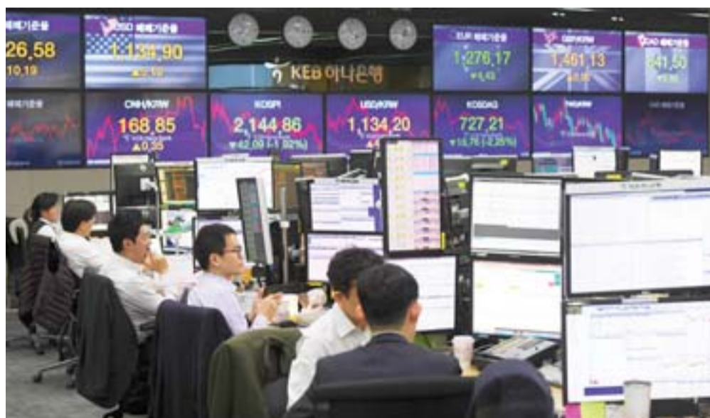
SEOUL: Currency dealers monitor exchange rates in a trading room at the KEB Hana Bank in Seoul. — AFP

But Donald expects a rebound in both retail sales and jobs, since the last reports were weakened by the December-January government shutdown. She will also watch durable goods data, due tomorrow, for a view on corporate capital spending. — Reuters