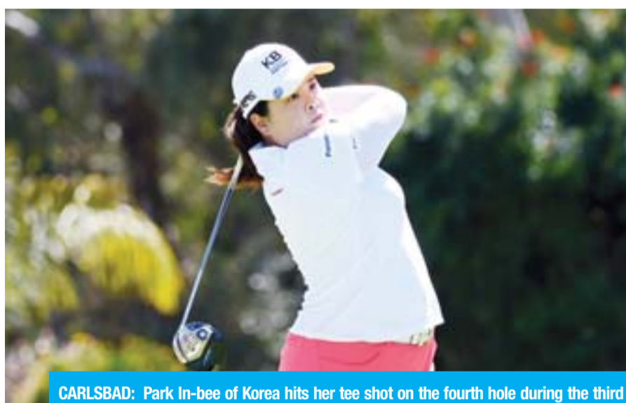
CARLSBAD: Park In-bee of Korea hits her tee shot on the fourth hole during the third round of the Kia Classic at the Aviara Golf Club in Carlsbad, California.

Garcia missed a seven-foot par putt at the par-3 seventh hole, his ball an inch from the cup, set for Kuchar to concede and halve the hole. But an irked Garcia followed his shot by quickly brushing the