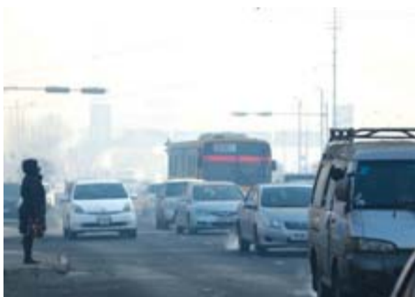
Ulaanbaatar's toxic pollution presents huge risks to children, including stunted development, chronic illness, and in some cases death.