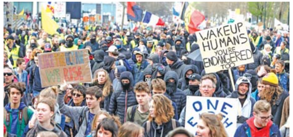
BRUSSELS: People take part in a 'Rise for Climate 5th Belgian and European march', in Brussels, to raise awareness for climate change, yesterday.

Ulaanbaatar is one of the most polluted cities on the planet, alongside New Delhi, Dhaka, Kabul, and Beijing. It