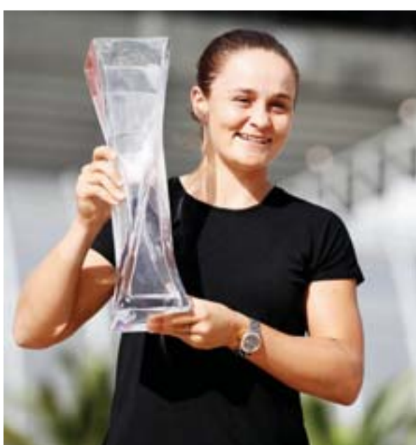
MIAMI GARDENS: Ashleigh Barty of Australia poses with the winner's trophy after defeating Karolina Pliskova of the Czech Republic during the Women's Final of the Miami Open.

Cardiff next face a trip to second-placed Manchester City on Wednesday, while Chelsea host Brighton and Hove Albion. — Reuters