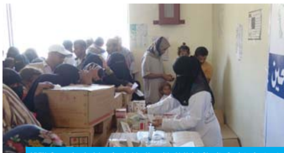
ADEN: Campaign in Aden, funded by Kuwait's Al-Najat Charity Society, for treatment of thousands of displaced from Hodeida.