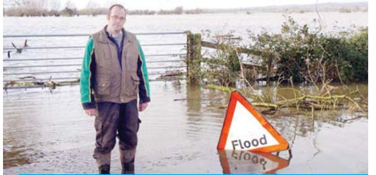
Farms from the Dakotas to Missouri and beyond have been under water for a week or more, possibly impeding planting and damaging soil.

Gro Intelligence used satellite data from the National Aeronautics and Space Administration’s (NASA) Near Real-Time Global Flood Mapping product, to calculate the approximate extent and intensity of flooding. Gro Intelligence then identified how much of this area was either cropland or pastureland, according to data from the USDA’s National