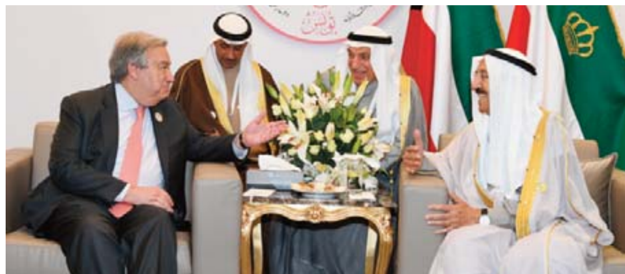
TUNIS: His Highness the Amir Sheikh Sabah Al-Ahmad Al-Jaber Al-Sabah meets UN Secretary-General Antonio Guterres.

'We are very proud to have Kuwait as a partner'