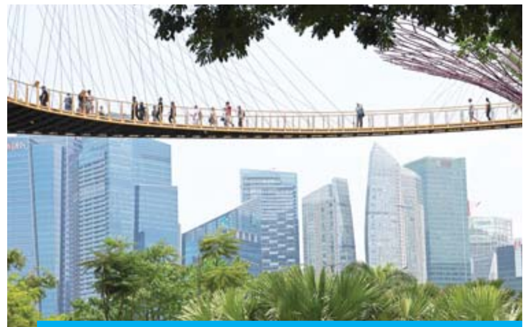
SINGAPORE: People walk on the 'skyway' at the Gardens by the Bay in Singapore.