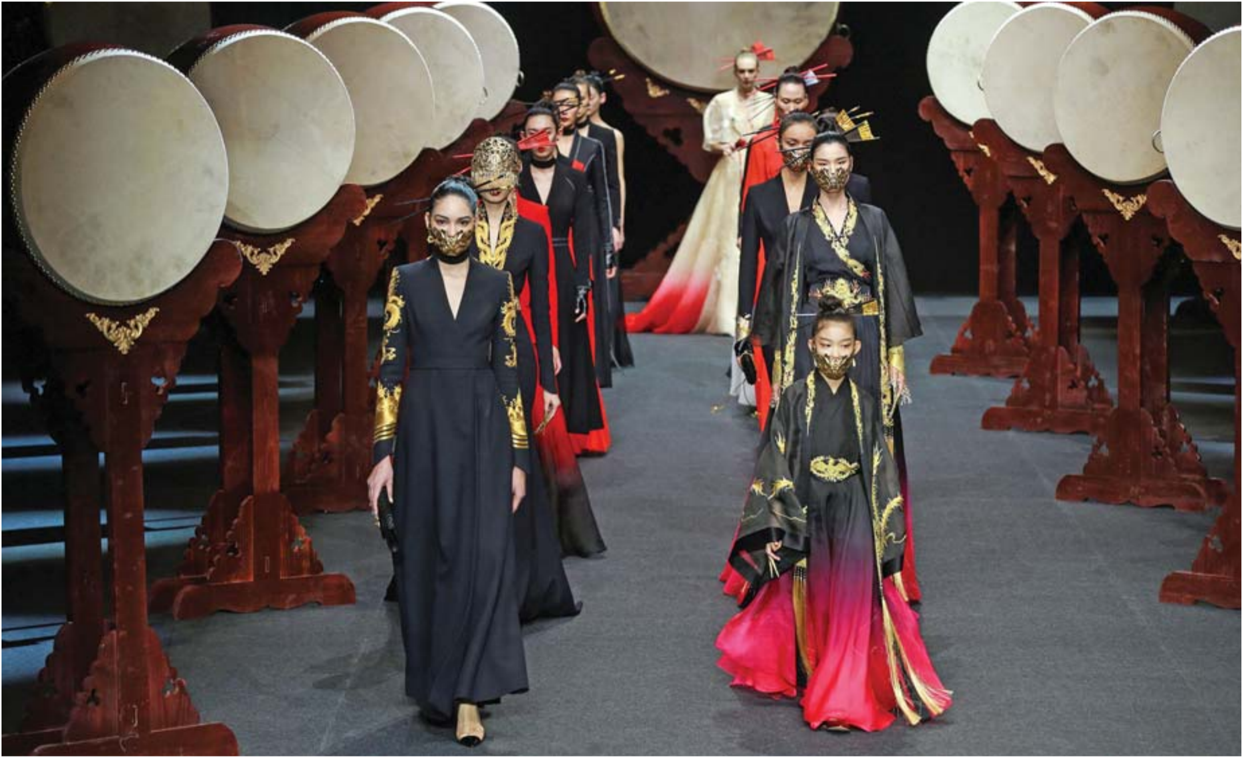
Models display creations from the 'Heaven Gaia' collection by Xiong Ying during the China Fashion Week in Beijing.