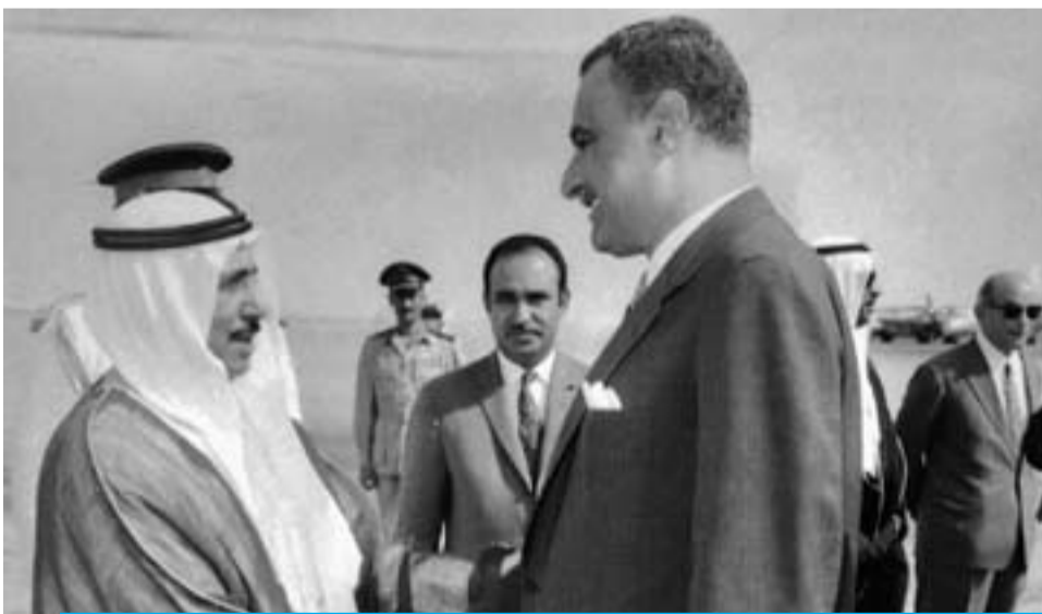
Late Amir Sheikh Sabah Al-Saleem Al-Sabah and Late Egyptian president Jamal Abdunaser during the Arab summit 1970.