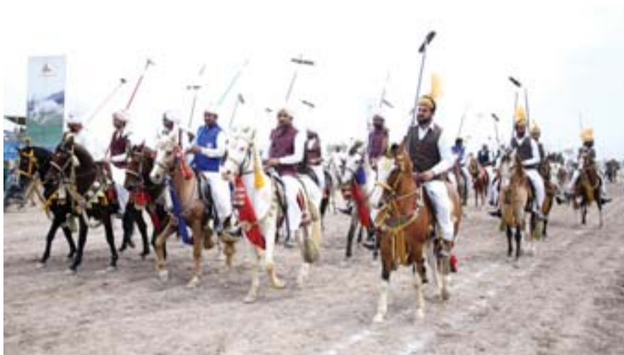
These photographs show Pakistani horse riders with lances used to pick up pegs during an attempt for a Guinness World Record for tent pegging in Khanewal district in Punjab province.

Traditional drumbeats and melodious shahnai flutes are drowned out by thundering hooves in the small Pakistani city of Tulamba, as riders pound down a dusty track seeking world record glory in the ancient sport of tent-pegging. Riders in bright costumes drive their lances into the targets, wooden pegs embedded in the dry ground, their aim sometimes obscured by the dust kicked up by other competitors.