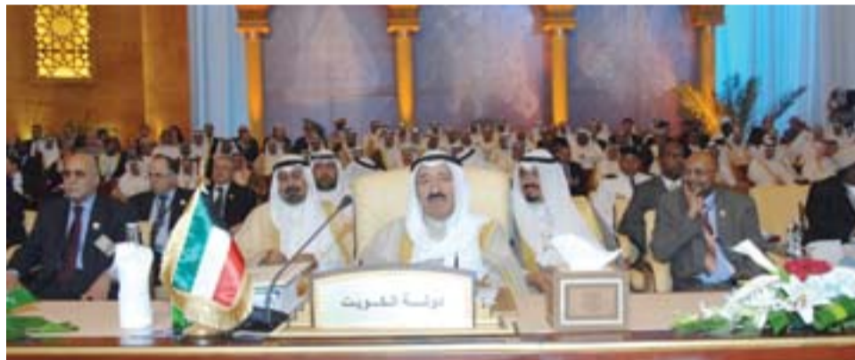
His Highness the Amir Sheikh Sabah Al-Ahmad Al-Jaber Al-Sabah during the 21st Arab Summit.

which called for a cessation of hostilities between Palestinians and Jordanian forces in Jordan.