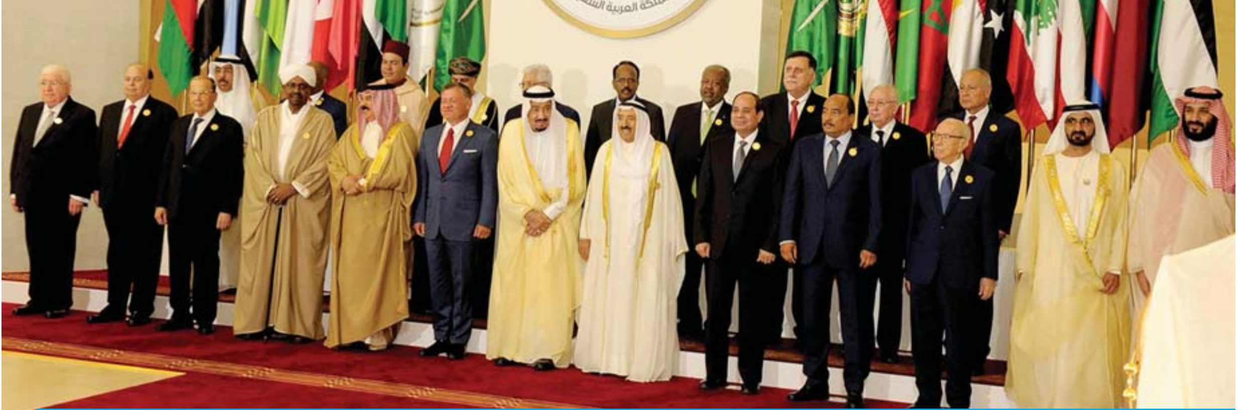
DHAHRAN: The Arab Leaders on the sidelines of Dhahran summit, April 2018, which was named "Jerusalem summit".

KUWAIT: The Arab world looks forward to the outcomes of the 30th ordinary Arab summit due in Tunis, hoping that it would lead to cementing Arab security, stability and development. A total of 42 Arab summits, including 29 ordinary and 13 extraordinary ones have been held since a maiden gathering was convened in March 1945. This is a chronology of all Arab summits involving the first emergency Inshas conference in 1946 and the last Zahran meeting in April 2018: