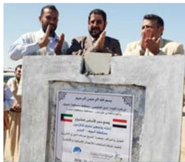
ADEN: Yemen's Saada Governor Hadi Al-Waily inaugurates a housing project funded by Abdullah Al-Nouri Charity Society.

Backed by the coalition, the Yemeni national army has controlled 60 percent of Saada Governorate, which is a key stronghold of Houthi militias, he added. "The national army is now stationed in eight out of 15 districts in Saada, three of which have been completely liberated," he boasted. He noted that Yemeni troops are also making remarkable progress in other districts, adding that army and security forces are struggling to secure and demine frontier areas. Al-Waily went on to say that the people of Saada have borne the brunt of crimes committed by Houthi militias nationwide, since their houses and farms were totally destroyed. However, the Yemeni official appreciated humanitarian aid extended by the Saudi-led coalition's member states through relief organizations, chiefly King Salman Humanitarian Aid and Relief Centre and Kuwait Red Crescent Society. — KUNA