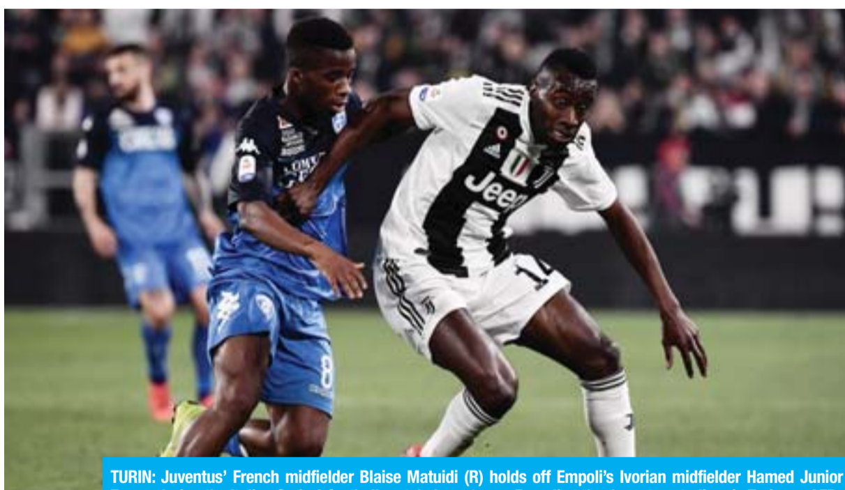
TURIN: Juventus' French midfielder Blaise Matuidi (R) holds off Empoli's Ivorian midfielder Hamed Junior Traore during the Italian Serie A football match Juventus vs Empoli at the Juventus stadium in Turin.