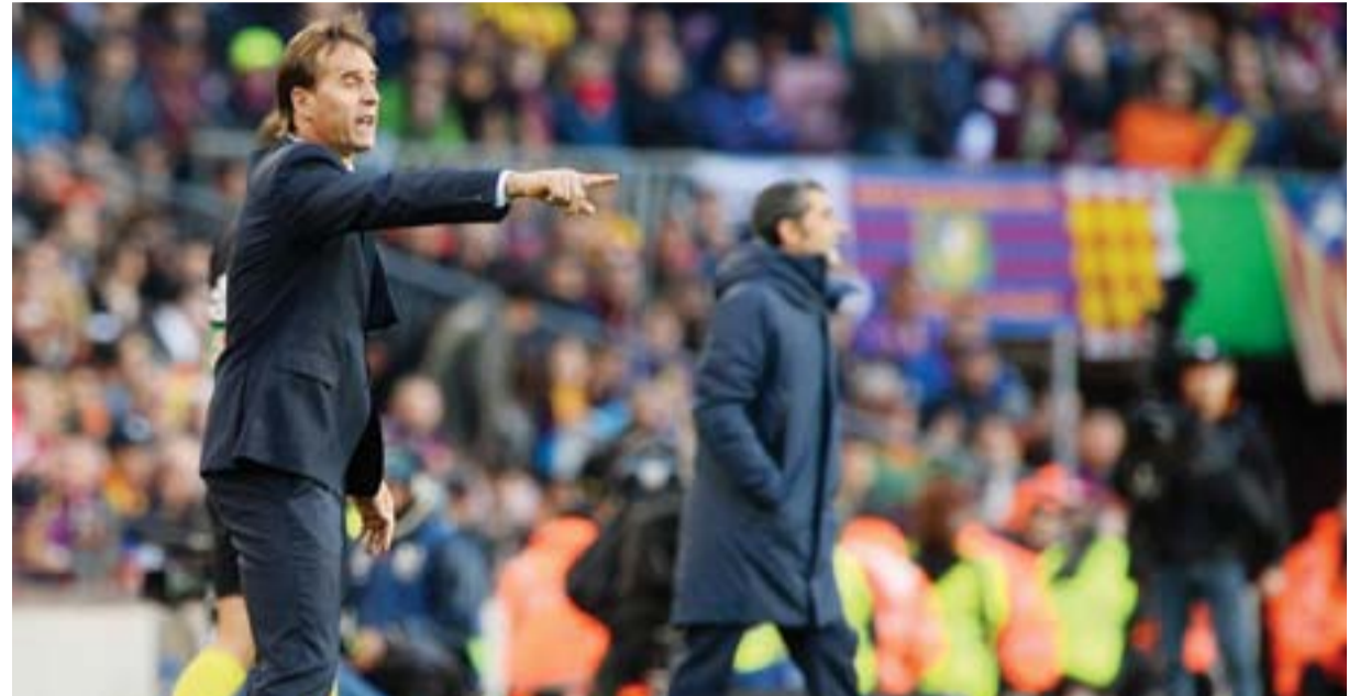
BARCELONA: Real Madrid's Spanish coach Julen Lopetegui gestures from the sideline during the Spanish league football match between FC Barcelona and Real Madrid CF at the Camp Nou stadium in Barcelona on October 28, 2018.

Spanish Federation rules allow clubs 14 days to name a permanent successor, meaning that Argentine Solari, who played for Real between 2000 and 2005, could potentially be in charge of four first team games.