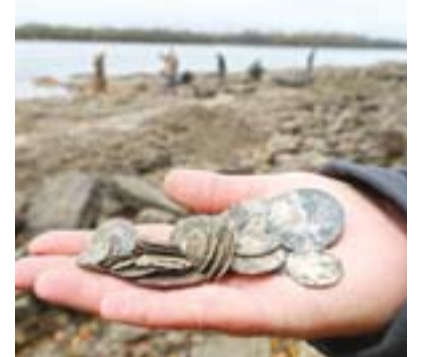
Hungarian archaeologists inspect the site where they found coins from the 16th-17th centuries and special weapons on the banks of the Danube river due to its low water level near Erd, located 25 kms from Budapest.

"The coins are 90 percent foreign and date from between 1630