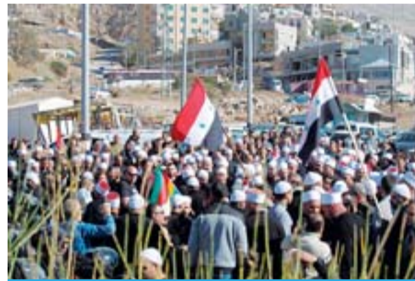
MAJDAL SHAMS: Druze men protest against municipal elections in front of a polling centre in the village of Majdal Shams in the Israeli-annexed Golan Heights yesterday.

Some 300,000 Palestinians live in east Jerusalem. Israel sees the entire city as its capital, a claim buoyed by US President Donald Trump's decision to recognize Jerusalem as Israel's capital in December. Among the