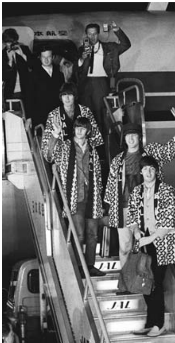
This photo taken on June 29, 1966 shows the British band The Beatles, (bottom to top) Paul McCartney, John Lennon, Ringo Starr and George Harrison, arriving with their manager Brian Epstein (top left-behind George) at Tokyo International Airport at Haneda in Tokyo ahead of their tour.

"If confirmation can be made of the existence of footage from that day, there would be huge excitement," he told the newspaper. The Beatles remain popular in Japan, and former group member Paul McCartney arrived in Tokyo this week to kick off his new world tour. — AFP