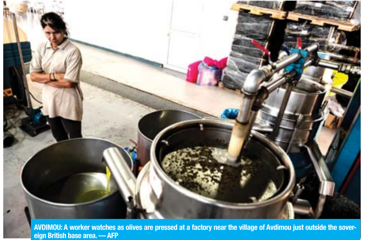
AVDIMOU: A worker watches as olives are pressed at a factory near the village of Avdimou just outside the sovereign British base area.

"Goods will no longer be able to flow freely" between the bases and the Republic of Cyprus, the European Scrutiny Committee said in July. "Instead, EU law will require Cyprus to apply customs and regulatory controls on crossing between the two for the first time," it added. There have also been reports that the passage of British military supplies through Cyprus and