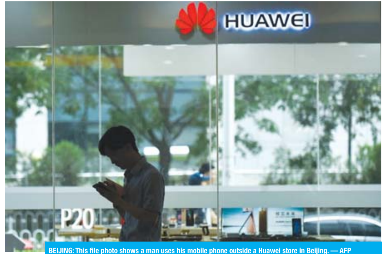
BEIJING: This file photo shows a man uses his mobile phone outside a Huawei store in Beijing.