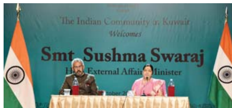
KUWAIT: India's External Affairs Minister Sushma Swaraj interacts with the Indian community at the Indian Embassy yesterday as Indian Ambassador K Jeeva Sagar looks on.