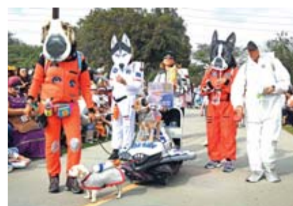
Dogs and their owners parade at the annual Haute Dog Howl'oween parade.