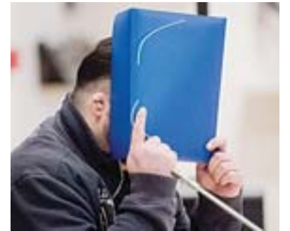
German nurse admits to killing 100 patients