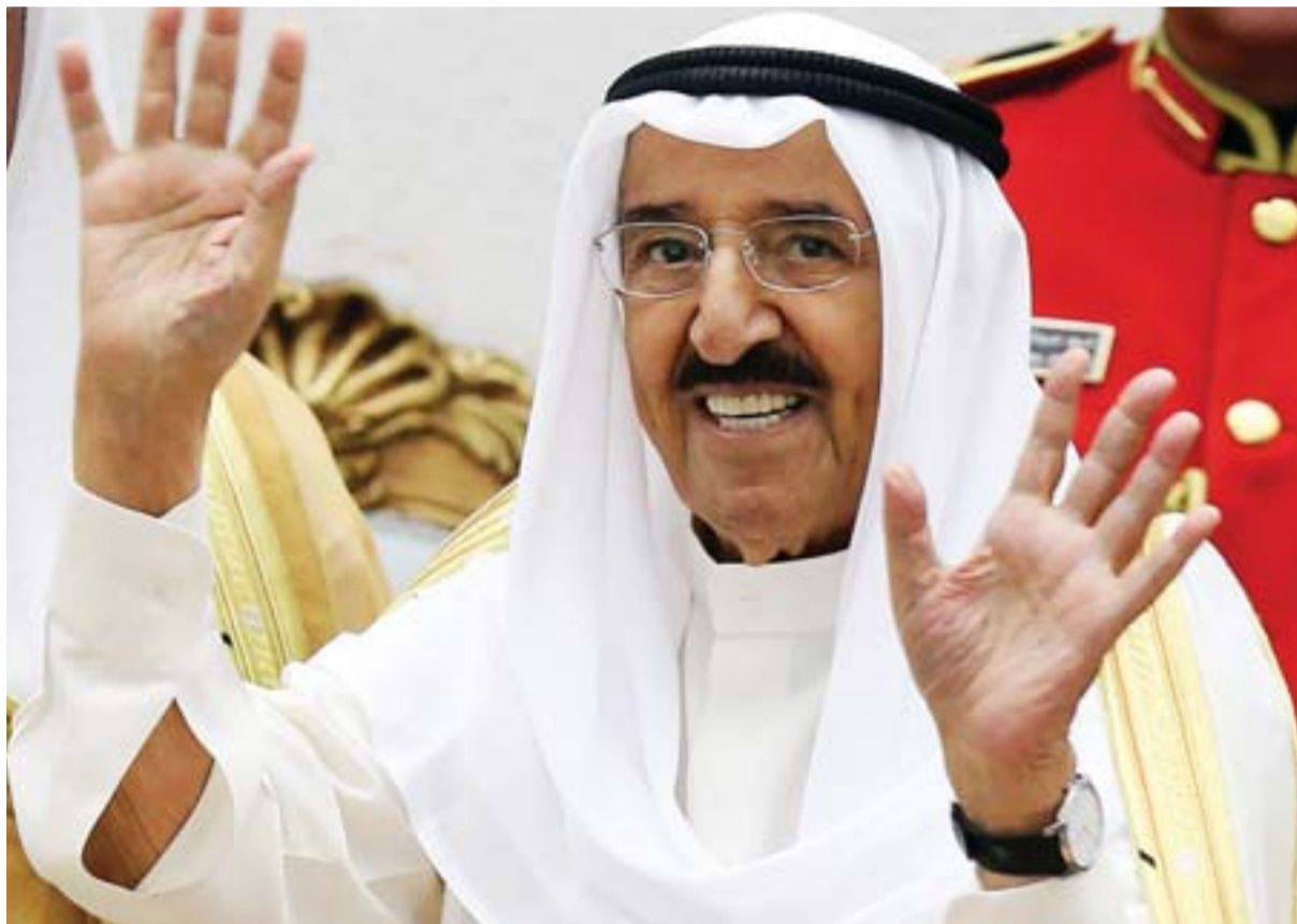
KUWAIT: HH the Amir Sheikh Sabah Al-Ahmad Al-Jaber Al-Sabah gestures as he attends the opening ceremony of the new legislative term of the National Assembly yesterday.