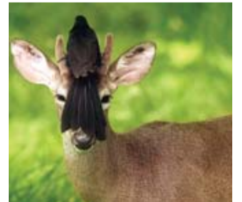
A bird resting on the head of a white-tailed deer roaming free in San Jose Villanueva.