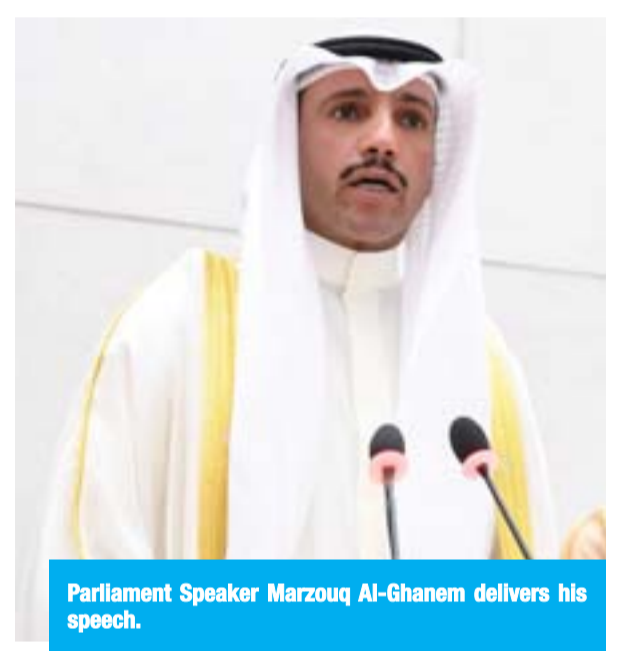
Parliament Speaker Marzouq Al-Ghanem delivers his speech.

National unity is not an empty slogan to rally the masses, it is a necessary step to propel Kuwait into the folds of developed nations, said Ghanem. The parliamentary scene in Kuwait should not be focused on who wins the next elections, it should be based on benefiting the future generations, said Ghanem who also called on the executive power to exercise its authority to reinvent itself and apply