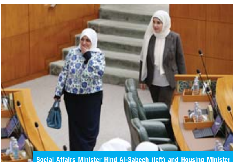
Social Affairs Minister Hind Al-Sabeeh (left) and Housing Minister Jenan Boushehri arrive to attend the opening session.