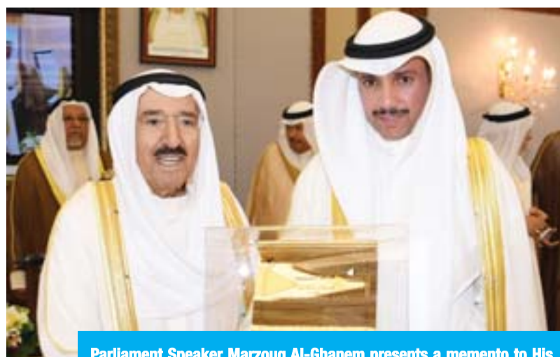
Parliament Speaker Marzouq Al-Ghanem presents a memento to His Highness the Amir Sheikh Sabah Al-Ahmad Al-Jaber Al-Sabah.