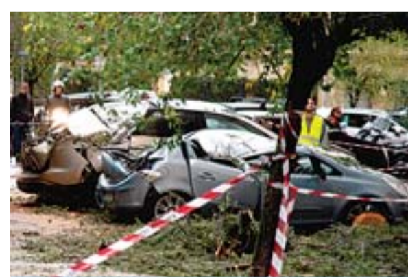
ROME: Photo show cars damaged during bad weather in the Prati district of Rome.

Italy's canal-ringed city of Venice was swamped by flooding as heavy rainfall pushed the water levels to near record levels on Monday. Rain-soaked tourists were barred from St Mark's Square on Monday as local authorities said the "acqua alta" (high water) peaked at 156 centimeters. The waters have only topped 150 centimeters five times before in recorded history. In Genoa, authorities closed the airport until 1300 GMT as they