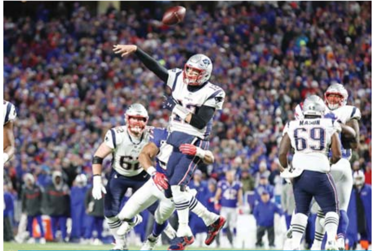
BUFFALO: Tom Brady #12 of the New England Patriots is hit by Lorenzo Alexander #57 of the Buffalo Bills as he throws during NFL game action at New Era Field on Monday in Buffalo, New York.

In other Tampa Bay news, the team appears unlikely