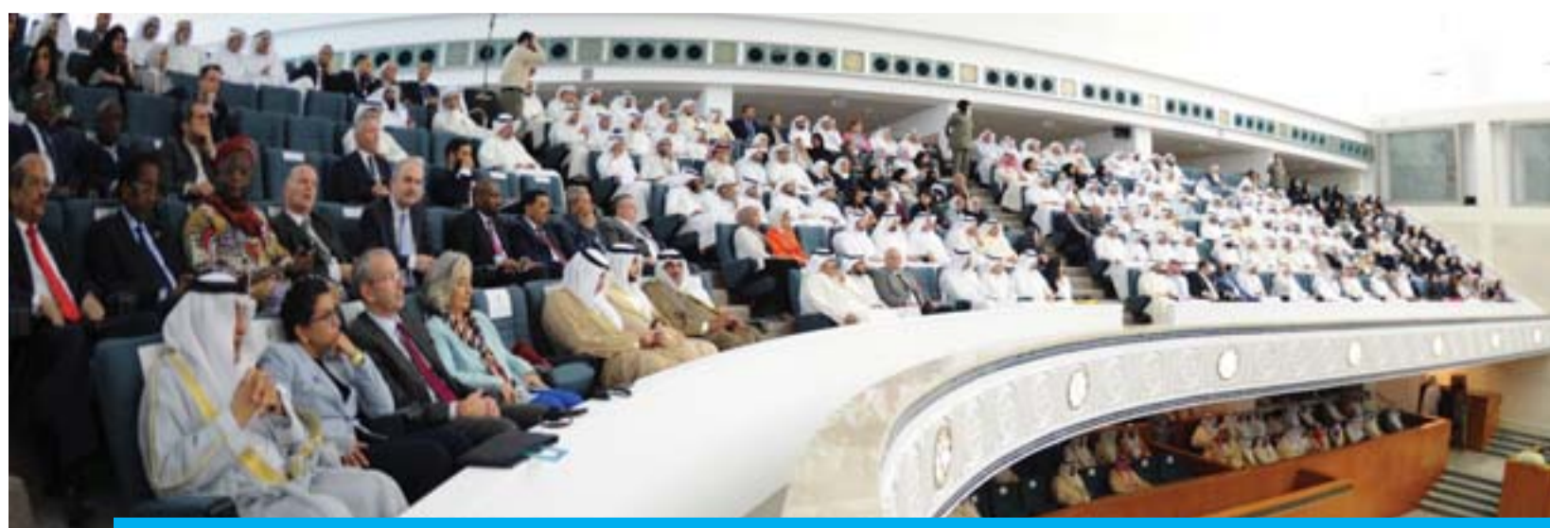
A general view of the audience at the opening of the third regular session of the 15th legislative term of the National Assembly.