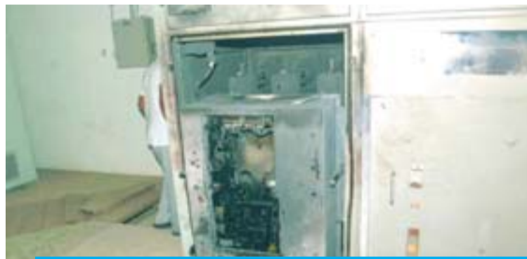
KUWAIT: Damaged equipment inside a power transformer room where a fire was reported in Salwa.

KUWAIT: An engineer and a technician, both Egyptians, suffered severe burns when a power cable exploded inside a power transformer room in Salwa. Police, firemen and paramedics responded and the injured men were rushed to Mubarak Hospital for treatment. The two victims are working for a company that has a contract with the Ministry of Electricity and Water (MEW), and they were performing maintenance work on the transformers. A source said following the repairs, the engineer and technician entered the transformer to start it, when a spark on the switchboard caused the fire. Minister of Electricity and Water Bakheet Al-Rasheed ordered an immediate investigation to find out what happened. Meanwhile, MEW Undersecretary Mohammad Bushehri