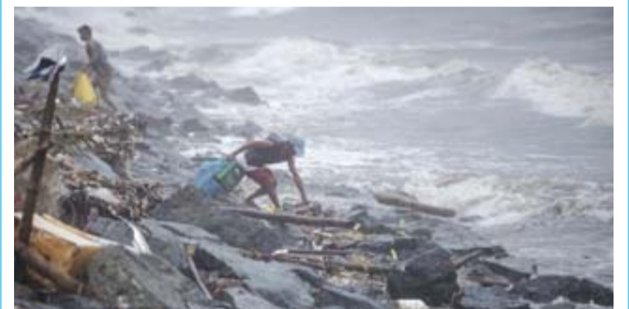
MANILA: A scavenger collects recyclable materials along the breakwater amid strong waves as weather patterns from Typhoon Yutu affect Manila Bay yesterday. — AFP

Philippine disaster officials said the storm was less powerful than Mangkhut, which struck six weeks ago and left more than 100 dead. Most of the fatalities were due to a landslide in the mining area of Itoigon. Authorities near last month's deadly landslide evacuated at least 1,000 people from the Itoigon area as Yutu approached. An average of 20 typhoons and storms lash the Philippines each year, killing hundreds of people and leaving millions in near-perpetual poverty. The Philippines' deadliest storm on record is Super Typhoon Haiyan, which left more than 7,350 people dead or missing across the central Philippines in November 2013. — AFP