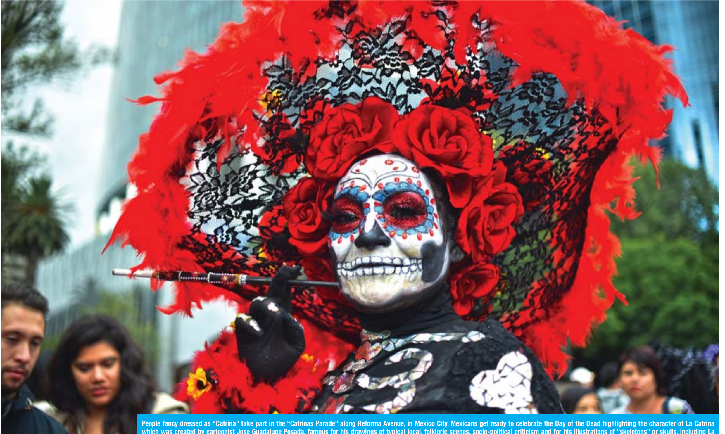
People fancy dressed as "Catrina" take part in the "Catrinas Parade" along Reforma Avenue, in Mexico City. Mexicans get ready to celebrate the Day of the Dead highlighting the character of La Catrina which was created by cartoonist Jose Guadalupe Posada, famous for his drawings of typical local, folkloric scenes, socio-political criticism and for his illustrations of "skeletons" or skulls, including La Catrina. (See Pages 20-21 for pictures and story).