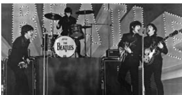
This photo taken on June 30, 1966 shows British band The Beatles, (from left to right) Paul McCartney, Ringo Starr, George Harrison and John Lennon, performing during their concert at the Budokan in Tokyo.