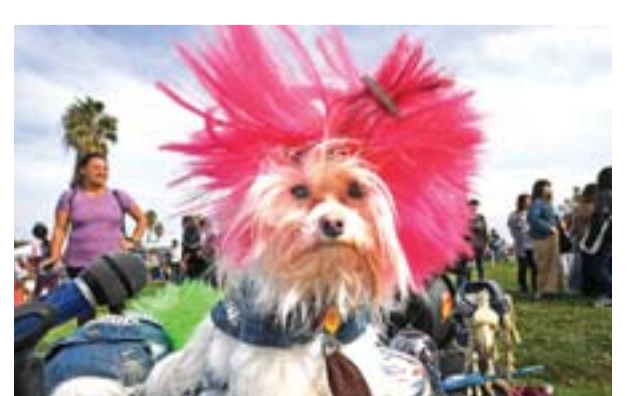
Mazie the dog struts in her costume.