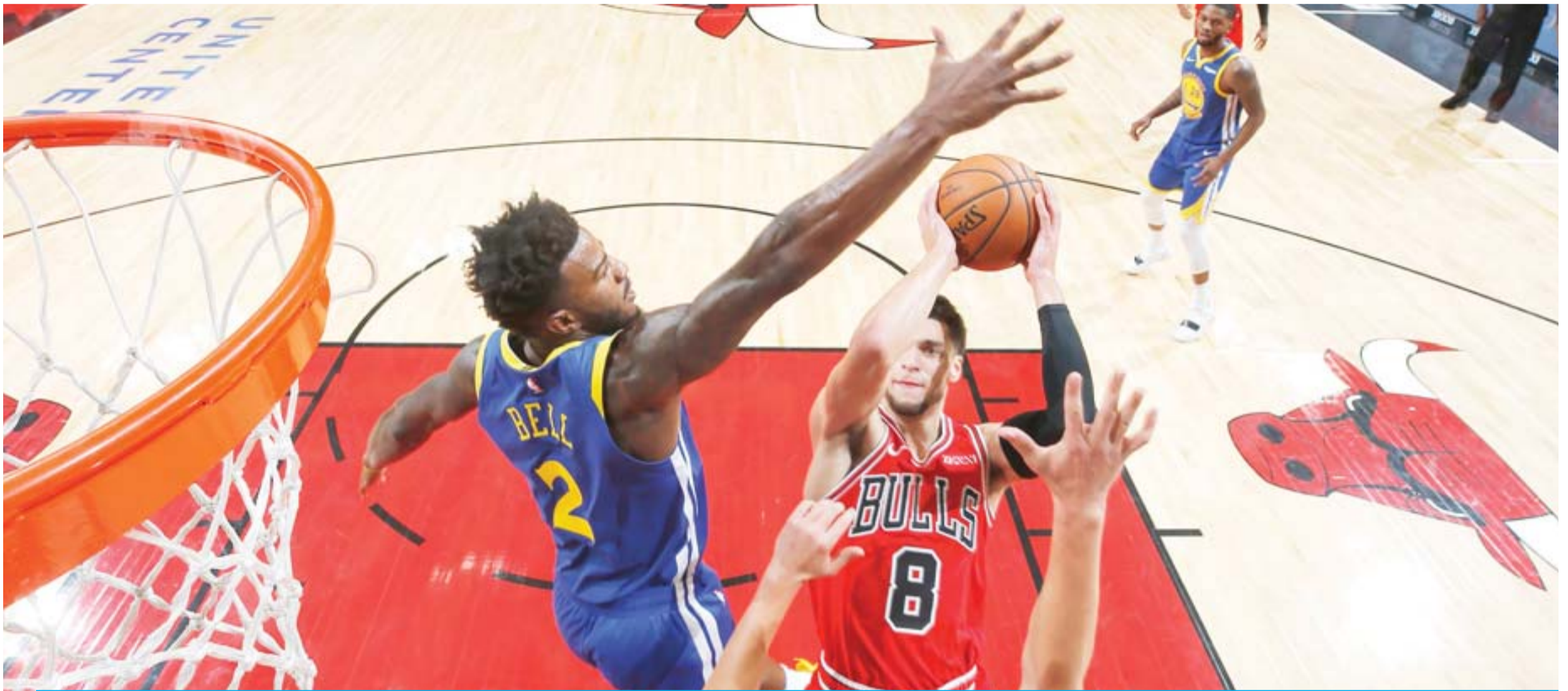
CHICAGO: Zach LaVine #8 of the Chicago Bulls drives to the basket against Jordan Bell #2 of the Golden State Warriors on Monday at United Center in Chicago, Illinois.