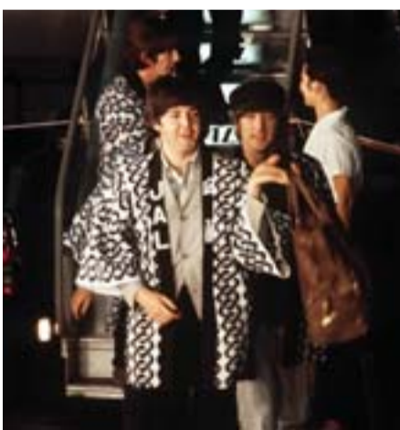
This photo taken on June 29, 1966 shows members of the British band The Beatles, Paul McCartney (center front), John Lennon (front right) and George Harrison (back left), arriving at Tokyo International Airport at Haneda in Tokyo ahead of their tour.

It's been a hard day's fight, but a group of Japanese Beatles fans have lost their bid to get police to hand over historic footage of the band's 1966 Japan visit. The superfans took their battle for the film-