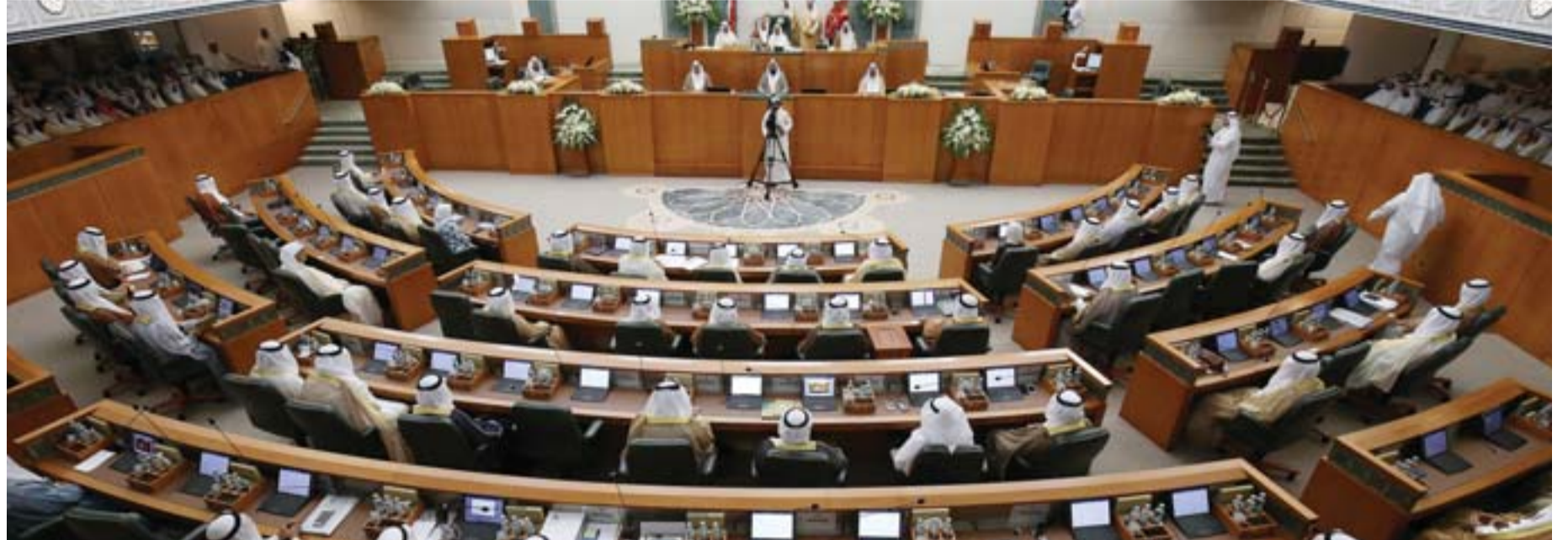
Lawmakers attend the opening session of the new legislative year.

KUWAIT: His Highness the Prime Minister Sheikh Jaber Al-Mubarak Al-Hamad Al-Sabah praised directives of His Highness the Amir Sheikh Sabah Al-Ahmad Al-Jaber Al-Sabah which called for enhancing the spirit of intimacy and solidarity amongst Kuwaitis. "I would like to express my thanks and appreciation to His Highness the Amir for his guidance and great keenness, and we affirm that we will remain committed to cooperating with the National Assembly members for the best interest of the homeland." His Highness the Premier said in a speech during the third regular session of the 15th legislative term of the National Assembly.