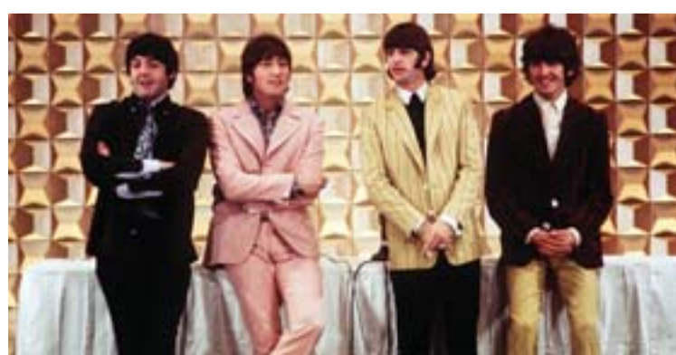
This photo taken on June 29, 1966 shows members of the British band The Beatles, (from left to right) Paul McCartney, John Lennon, Ringo Starr and George Harrison, holding a press conference in Tokyo at the start of their tour.