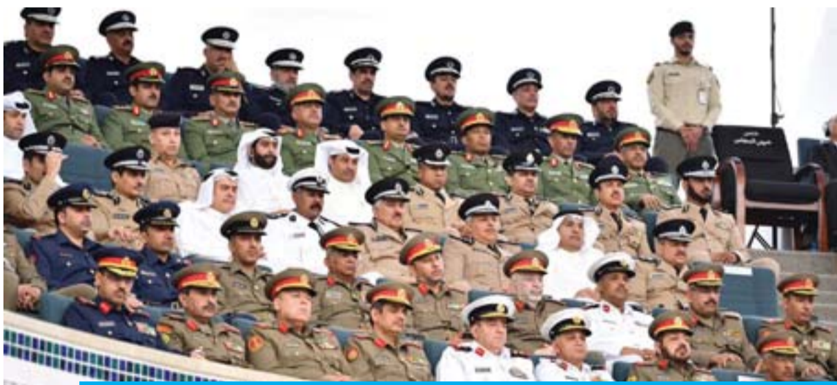
Military and police officers attend the opening session.