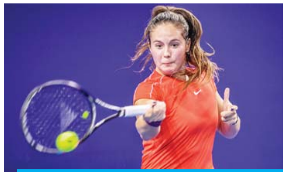
ZHUHAI: Daria Kasatkina of Russia hits a return against Wang Qiang of China in their women's singles first round match of the Zhuhai Elite Trophy tennis tournament in Zhuhai, in south China's Guangdong province yesterday.

They are both yet to play eighth seed and world number 18 Caroline Garcia from France in their round robin group. "I think I played well in the first set, and in the second set I probably started to rush a little bit and make a lot of mistakes, and kind of stupid mistakes," Sabalenka said after the match.