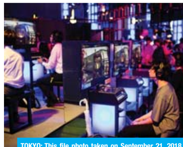
TOKYO: This file photo taken on September 21, 2018 shows visitors playing the Sony video game "Call of Duty" at the Tokyo Game Show.

Analysts said the company results showed it was entering a growth phase after a remarkable recovery that followed several painful years of huge losses. "Its game sector has continued spearheading its recovery. Strong titles offset slowing sales of PlayStation 4 consoles," Hideki Yasuda, an analyst at Ace Research