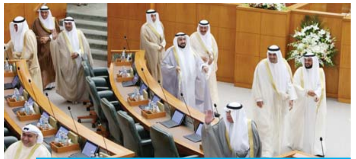
Cabinet ministers arrive to attend the opening session.