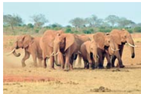
This file photo shows elephants at the Voi Wildlife Lodge in Tsavo East.

Ten thousand years ago that ratio was prob-