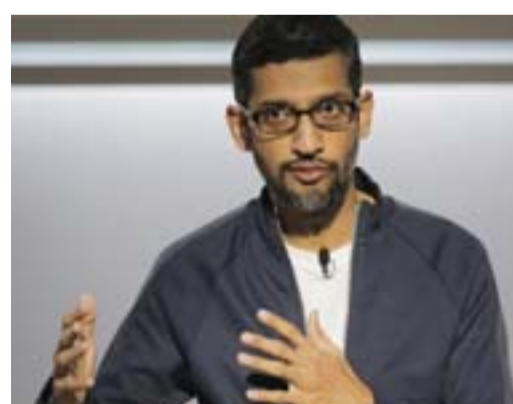
SAN FRANCISCO: In this file photo taken on October 4, 2017, Sundar Pichai, chief executive officer of Google Inc, speaks about Google's improvements in Artificial Intelligence and machine learning during a product launch event at the SFJAZZ Center.

The more people "cut the cord" and let go of traditional cable TV, the more they turn to the cloud. Streaming television services accessible at Netflix, Amazon Prime, and YouTube are hosted and powered by online data centers, as are web-