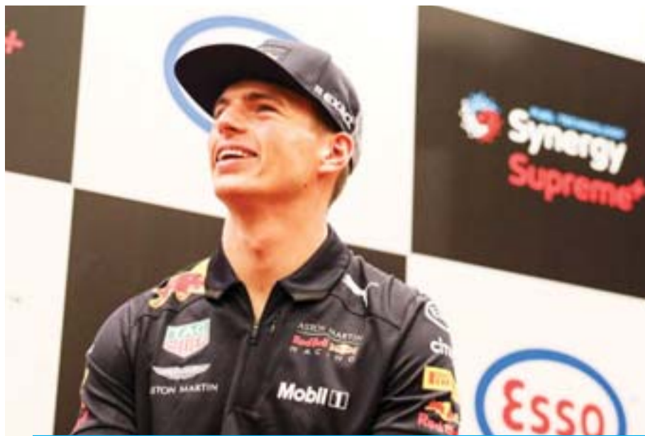
Max Verstappen attends a pre-race Esso Synergy media event in Singapore.

show and handed the lucky winners of the Red Bull Pit Stop Challenge a year's supply of Exxon and Mobil fuel. Meanwhile over in Miami, David Coulthard performed a series of smoking donuts on top of one of Miami's most iconic new towers - the 700-foot high 1000 Museum building.