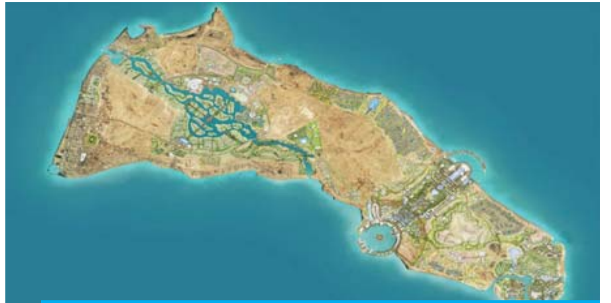
KUWAIT: This archive photo shows a proposed plan for the development of Failaka Island.

On the other hand, the cabinet congratulated Ethiopian President Sahle-Work Zewde on her election and inauguration, wishing her best in luck in leading the African country. It expressed deep sorrow for victims of floods in Jordan, the Indonesian plane crash which killed all people on board and the attack on a Synagogue in Pittsburgh, Pennsylvania, US, and affirmed rejection to all acts of terrorism and violence.