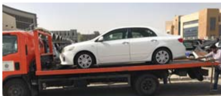
This picture released by the Interior Ministry yesterday shows a vehicle impounded after its driver was caught driving recklessly at a street in Kuwait.