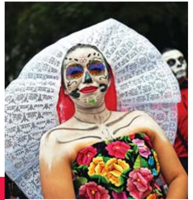
People fancy dressed as "Catrina" take part in the "Catrinas Parade".