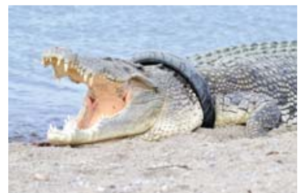
A saltwater crocodile with a tyre around its neck is seen in Palu river in Palu.

chosen as the "gold spike," or starting point, for a new geological period dubbed the Anthropocene, or "age of man". In looking for answers, conservationists are turning to climate change for inspiration. "We need a new global deal for nature," said Lambertini, noting two key ingredients in the 195-nation Paris climate treaty. "One was the realization that climate change was dangerous for the economy and society, not just polar bears," he said.