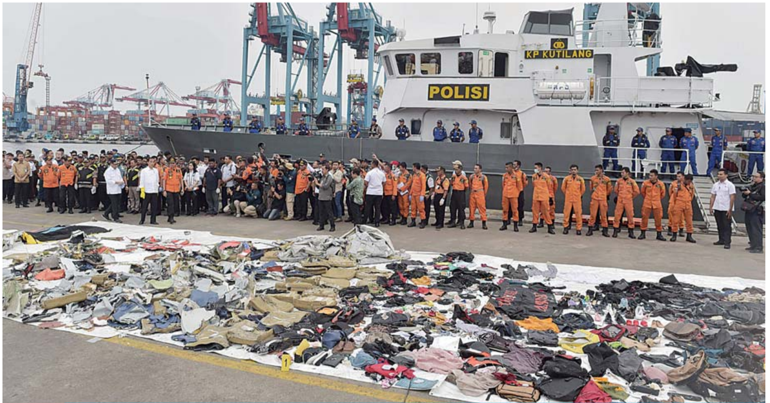
JAKARTA: Recovered debris from the ill-fated Lion Air flight JT 610 are laid out as Indonesia's President Joko Widodo visits the search and rescue operations centre at a port in northern Jakarta yesterday.