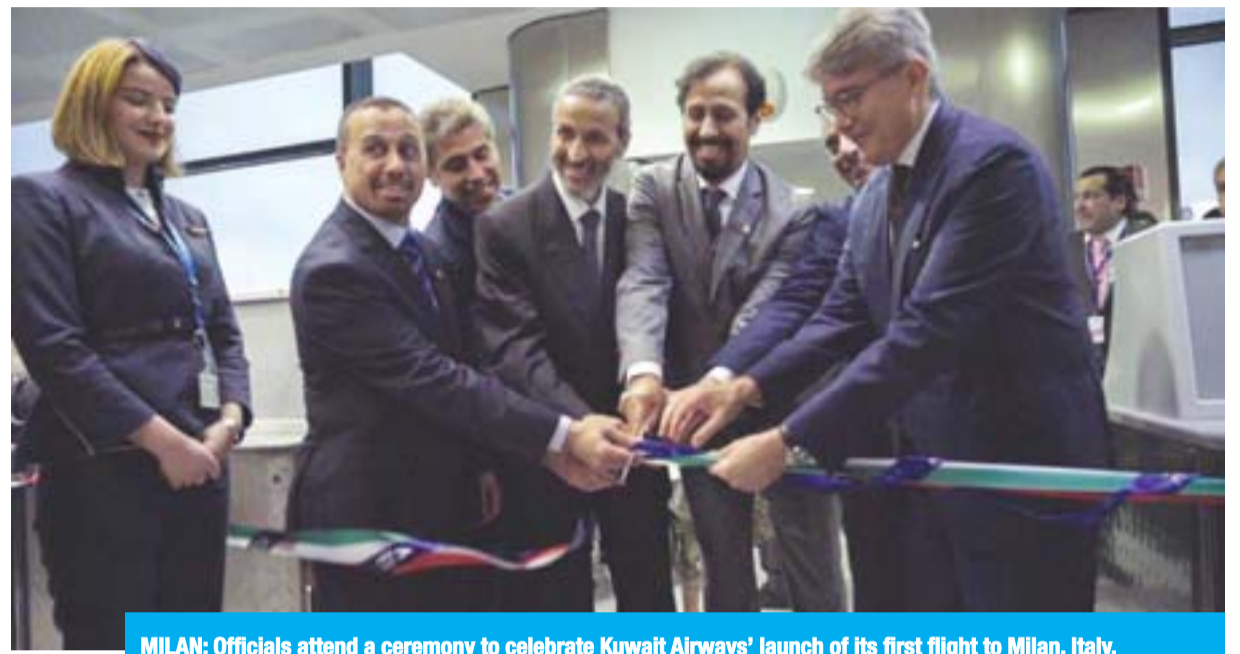
MILAN: Officials attend a ceremony to celebrate Kuwait Airways' launch of its first flight to Milan, Italy.

Welcoming KAC operating its new route, he said, "It is a very positive and smart initiative for KAC to have a share of the huge flow of passengers between Milan and the Middle East." The number of Middle East passengers