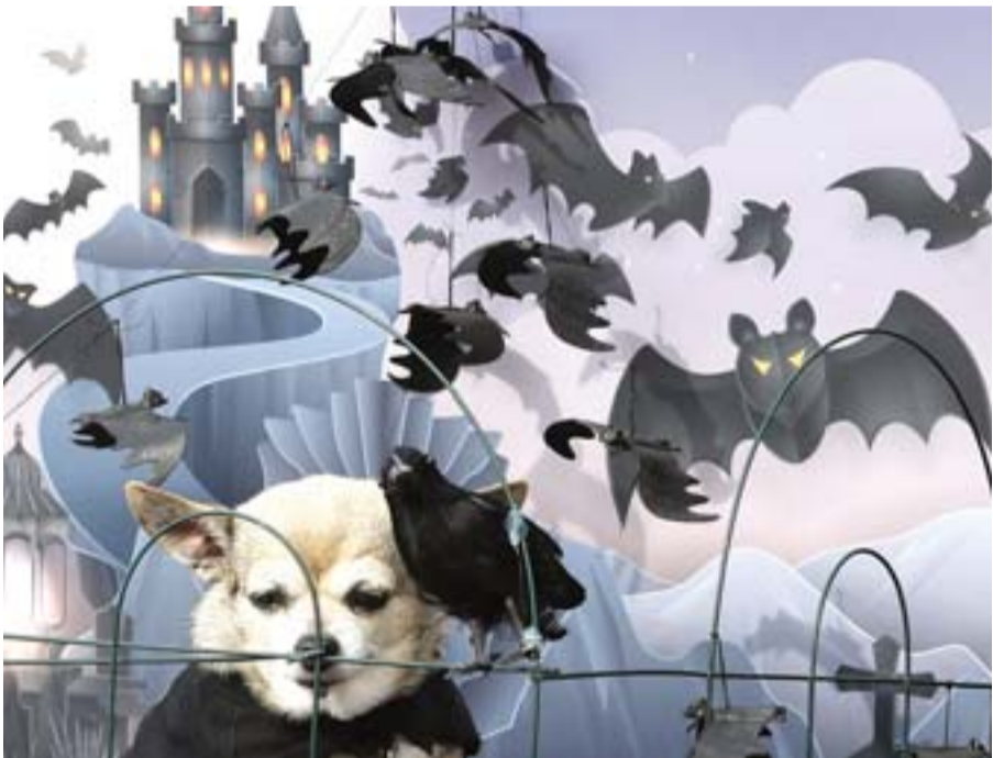
A dog dressed as a vampire attends the annual Haute Dog Howl'oween parade in Long Beach, California.