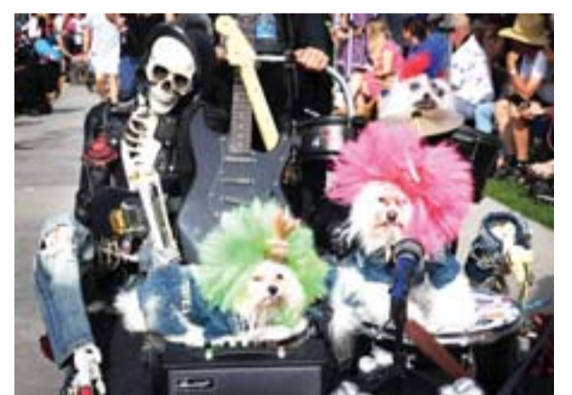
Dogs and their owners parade.