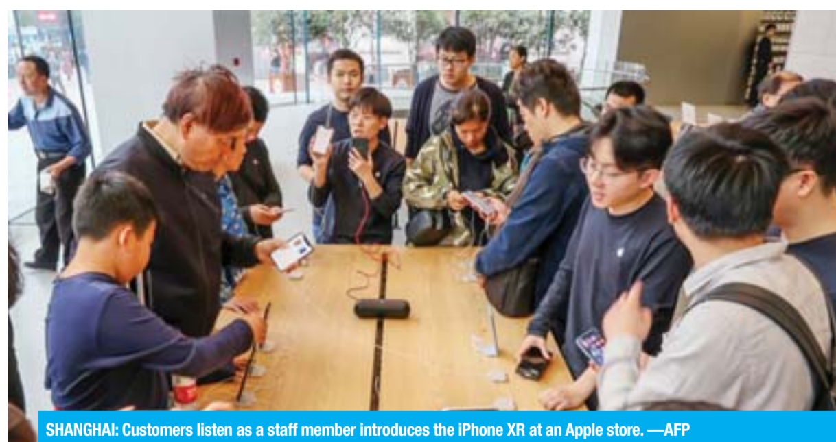
SHANGHAI: Customers listen as a staff member introduces the iPhone XR at an Apple store.

Earlier labor abuse allegations focused on workers building iPhones and other gadgets for Taiwan-based Hon Hai Precision Industry Co., better known as Foxconn. As the world's largest contract electronics maker Foxconn assembles products in huge plants in China where it employs more than one million workers. In 2010,