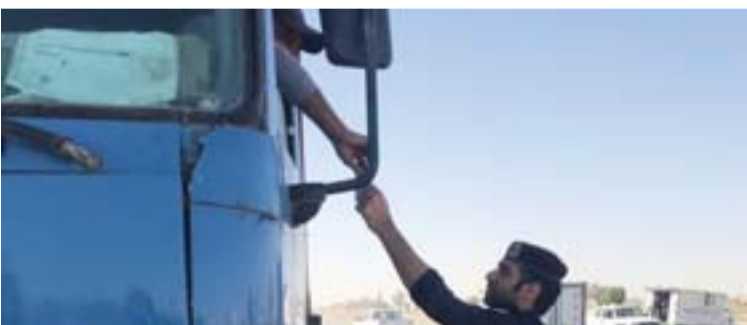
A truck driver hands his papers to a policeman during a recent traffic campaign.