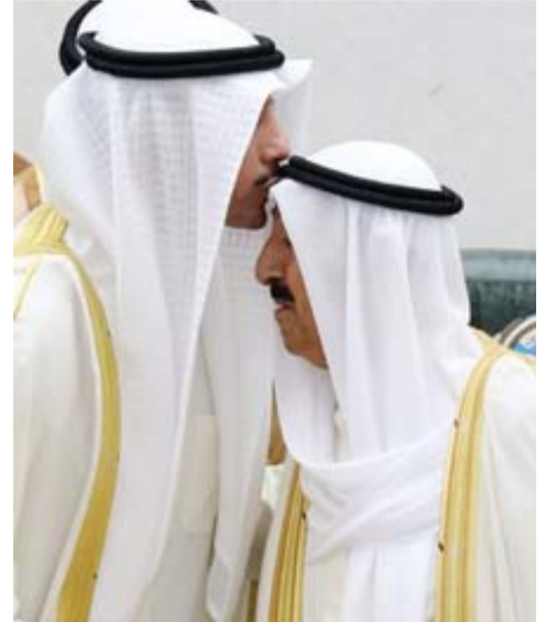
His Highness the Amir Sheikh Sabah Al-Ahmad Al-Jaber Al-Sabah is greeted by Parliament Speaker Marzouq Al-Ghanem.

KUWAIT: His Highness the Amir Sheikh Sabah Al-Ahmad Al-Jaber Al-Sabah yesterday called for protecting and safeguarding Kuwait's democracy and freedoms. In his speech to the third regular session of the 15th legislative term of the National Assembly, His Highness the Amir praised the high level of security and prosperity of the Kuwaiti people, affirming that it was the duty of all Kuwaitis to prevent anyone or group from trying to meddle with their affairs. His Highness the Amir reiterated the belief in the democratic methodology and practices, stressing that it was important to support and solidify such notions within the hearts of the people of this land.