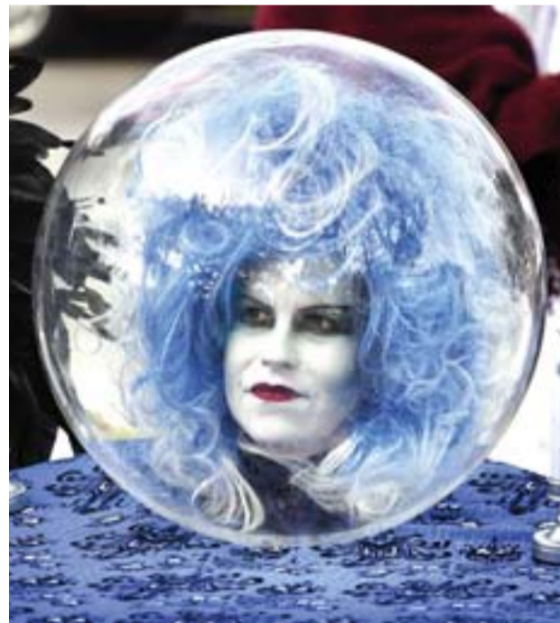
A woman dressed in a costume at the annual Haute Dog Howl'oween parade.