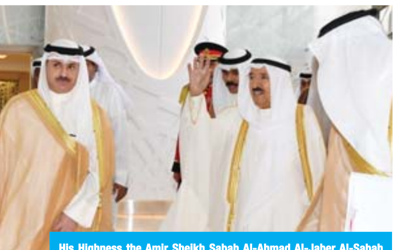
His Highness the Amir Sheikh Sabah Al-Ahmad Al-Jaber Al-Sabah gestures as he arrives at the National Assembly yesterday.

Reforms, in all of its shapes and forms, is a much-demanded policy that all countries of the globe seriously seek, said Ghanem. He added that fighting corruption, whether in government or parliament, would ensure the success of all policies for reform. The current status quo of the government institutions and bodies is not up to the level that the people of this country deserve; therefore, it is necessary to point out the mistakes and formulate adequate and swift solutions to push the wheels of development forward. The leadership of the National Assembly solemnly swears to abide by all laws and regulations to achieve prosperity for the people of Kuwait, affirmed Ghanem who called on the government to lend a helping hand to parliament to achieve this goal. Speaker Ghanem concluded his speech with expressing gratitude towards His Highness the Amir and the Kuwaiti leadership for their unwavering efforts to help the progression and development of the State of Kuwait and its people. — KUNA