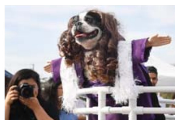
A dog dressed as Rose from the movie 'Titanic'.