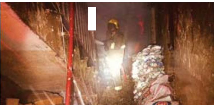
A fireman battles a blaze in Jleeb Al-Shuyoukh.

A female citizen insulted a policeman for issuing her a citation. The woman parked her car in a no-parking area, so the policeman approached her and issued her a ticket for obstructing traffic. The woman became angry and insulted him with indecent words, before driving off. The policeman then lodged a complaint against her.