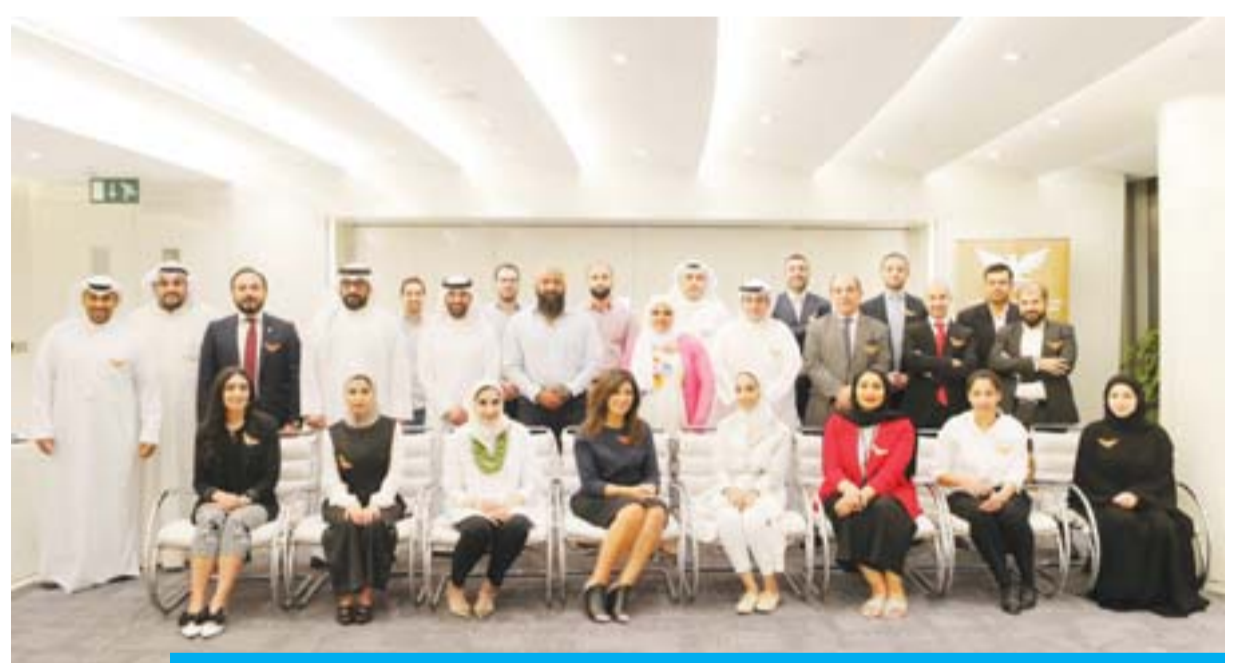
KUWAIT: KIPCO Group Judges and Tmkeen volunteers.