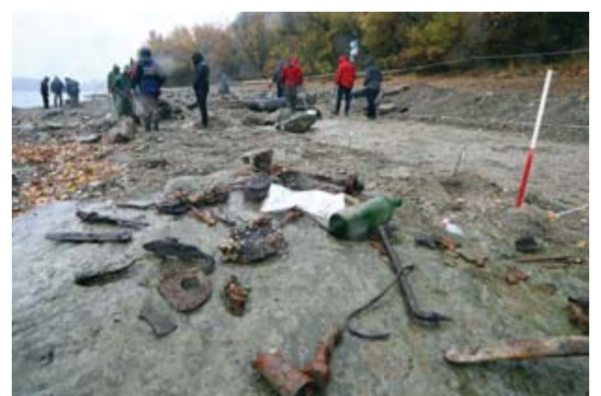
Hungarian archaeologists inspect the site where they found coins from the 16th-17th centuries and special weapons on the banks of the Danube river due to its low water level.

and 1743", archaeologist Balazs Nagy told the Klub radio station, adding that they had been minted in "the Netherlands, in France, Zurich and even the Vatican". The low level of the Danube has already revealed the remains of Budapest's former Franz Josef bridge, which was destroyed during World War II, as well as an American bomb from the same period. — AFP