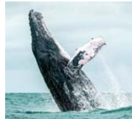
This file photo shows a Humpback whale jumping in the surface of the Pacific Ocean at the Uramba Bahía Malaga National Park in Colombia.