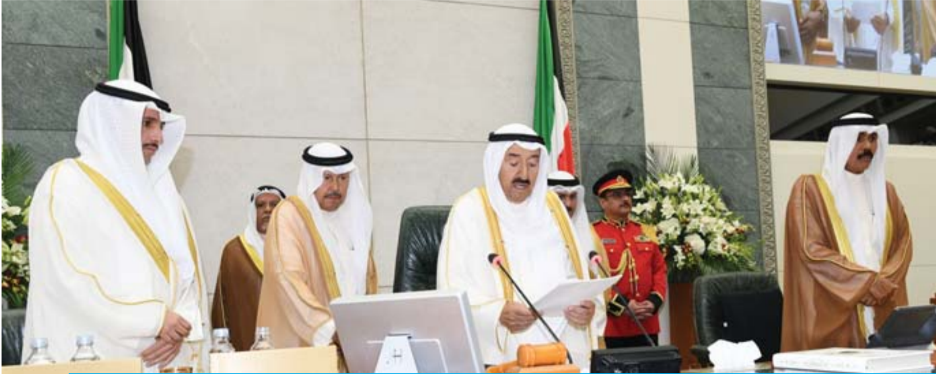
KUWAIT: His Highness the Amir Sheikh Sabah Al-Ahmad Al-Jaber Al-Sabah delivers a speech during the inauguration of the third regular session of the 15th legislative term of the National Assembly yesterday.

National Assembly Speaker calls for following Amir's directives