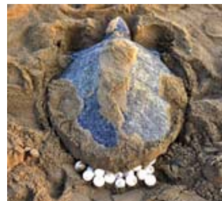
An Olive Ridley Turtle (Lepidochelys olivacea) laying her eggs in the sand at Rushikulya Beach, some 140 kilometers (88 miles) southwest of Bhubaneswar.