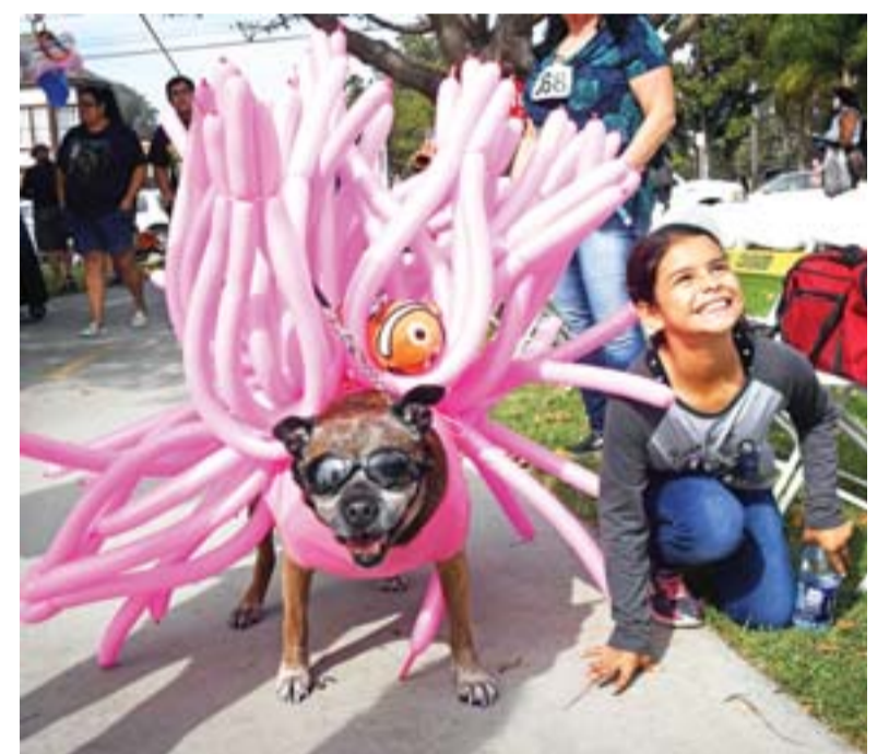
Sweenie the dog waits for the start of the annual Haute Dog Howl'oween parade.