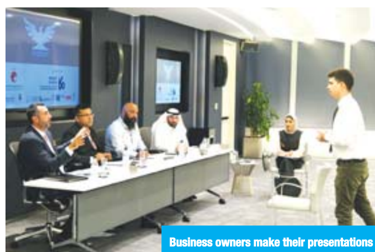
Business owners make their presentations to the judges.

benefit from their expertise as they expand their businesses. We wish the top three finalists all the best in the final judging round." The final judging round will take place on November 5, during the first day of the Youth Empowerment Symposium. The finalists will be required to give a more detailed presentation about their businesses before a live audience. This year's winner will be rewarded with $100,000 worth of services from the KIPCO Group as well as $15,000 in cash. In addition, the second and third place winners will be rewarded with $10,000 and $5,000 respectively. The winner will be announced on November 6.