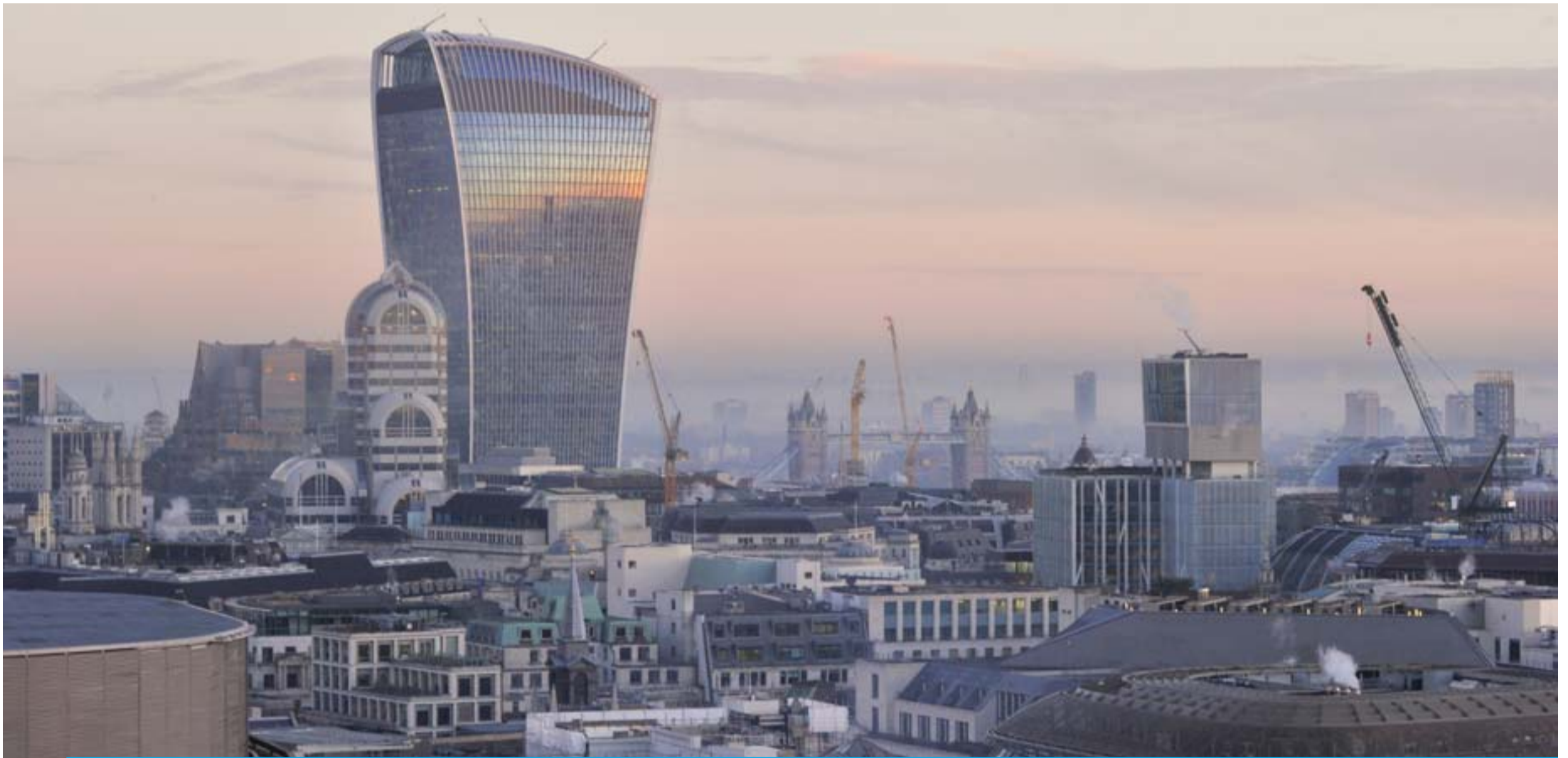
LONDON: File photo shows the sun setting over the city of London.