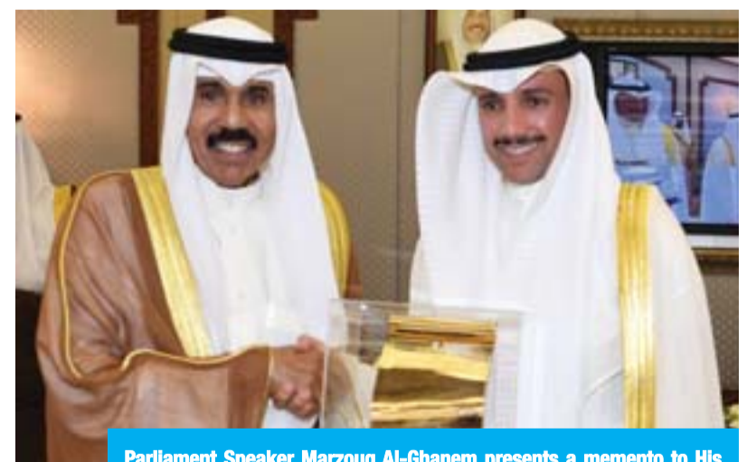
Parliament Speaker Marzouq Al-Ghanem presents a memento to His Highness the Crown Prince Sheikh Nawaf Al-Ahmad Al-Jaber Al-Sabah.