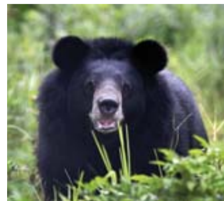
This file photo shows a rescued bear roaming around a sanctuary in Ninh Binh Province for bears rescued from farms and facilities where they were formerly exploited for bile extractions used for traditional medicine.