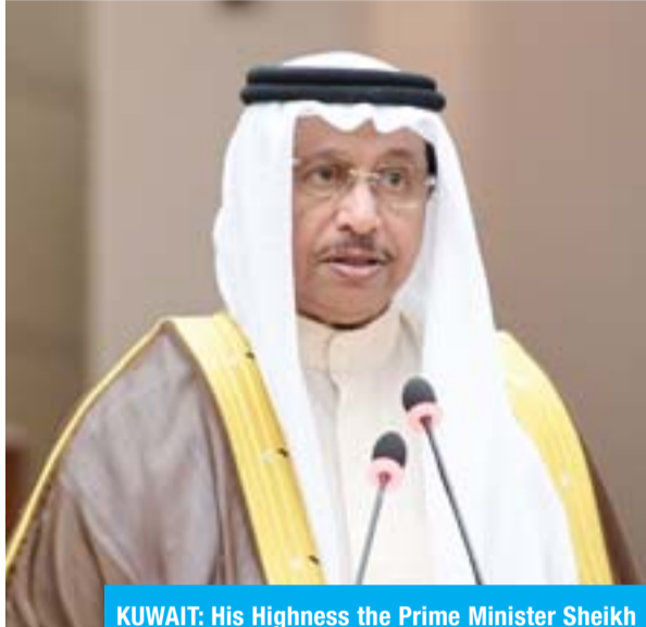
KUWAIT: His Highness the Prime Minister Sheikh Jaber Al-Mubarak Al-Hamad Al-Sabah delivers a speech during the inauguration of the third regular session of the 15th legislative term of the National Assembly yesterday.

Govt continues seeking cooperation with Assembly: Sheikh Jaber