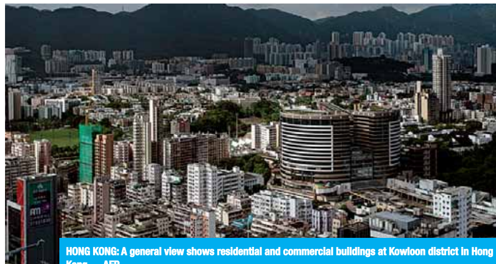
HONG KONG: A general view shows residential and commercial buildings at Kowloon district in Hong Kong.

The issue of a haunted flat melds the Hong Kong obsession with property with a Chinese population that tends to be superstitious and pursues ancient traditions, illustrated by the use of feng shui by many property developers to ensure that a building uses surrounding natural forces, such as mountains,