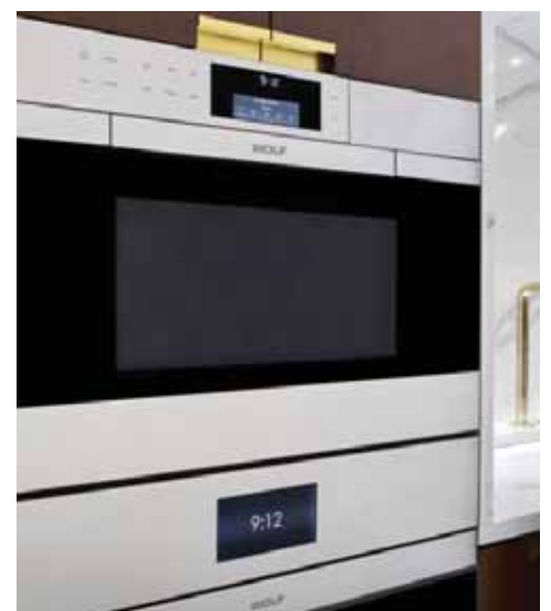
Photo provided by Sub-Zero and Wolf shows Wolf's M series convection steam oven, which combines the two methods in one.

IKEA's new Kungsfors rail system was developed in consultation with Swedish chef Maximilian Lundin. It includes stainless-steel grids, hooks, open shelves, containers and clips. American Standard's new Beale MeasureFill faucet can be preset to deliver a half cup to up to 5 cups, eliminating the need for measuring cups. But equipment and appliances aside, a well-organized kitchen may be the true mark of a pro-style kitchen. "In terms of tools, don't clutter your drawers with things you don't need," says Keller. "Take stock and eliminate the gadgets or one-purpose tools." The multiple James Beard Award winner ticks off his go-to gear: "A good-quality cutting board, scale, plating spoons, sauce whisk, timer, kitchen shears. Quality paring, utility and serrated bread knives." And one more thing: a good attitude. "Remember, cooking should be fun," Keller says. "It's rewarding, and it gives us the opportunity to nurture others." — AP