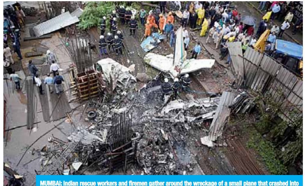
MUMBAI: Indian rescue workers and firemen gather around the wreckage of a small plane that crashed into a construction site killing five people.

There have been several crashes involving