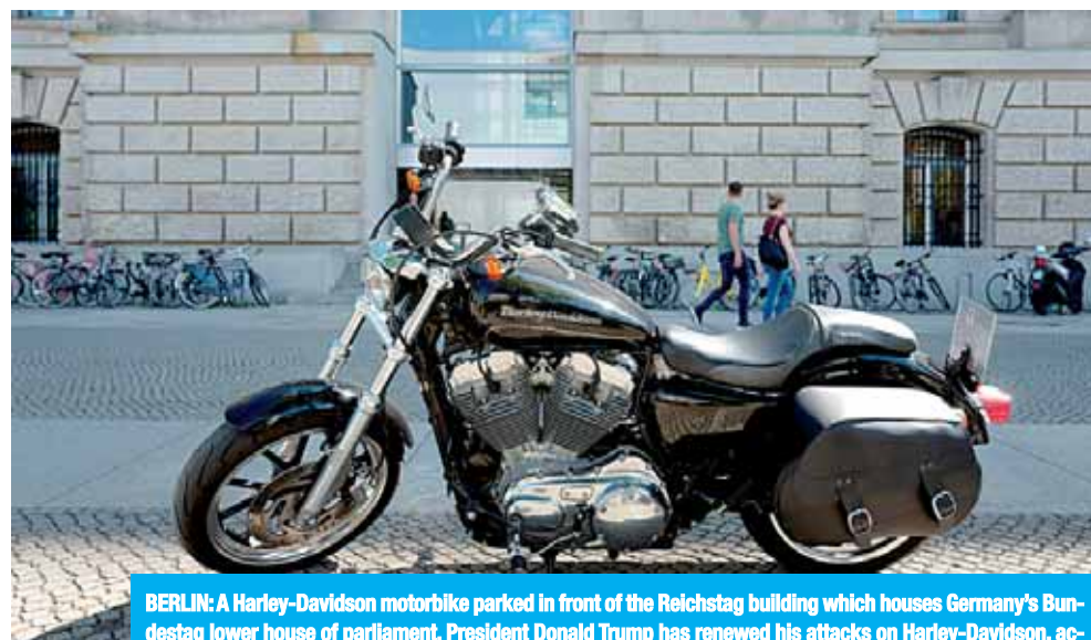
BERLIN: A Harley-Davidson motorbike parked in front of the Reichstag building which houses Germany's Bundestag lower house of parliament. President Donald Trump has renewed his attacks on Harley-Davidson, accusing the US motorcycle manufacturer of using the trade war as an 'excuse' to move production for the European market out of the United States. —AFP

After-tax profits rose at a 1.7 percent pace in the fourth quarter. —Reuters