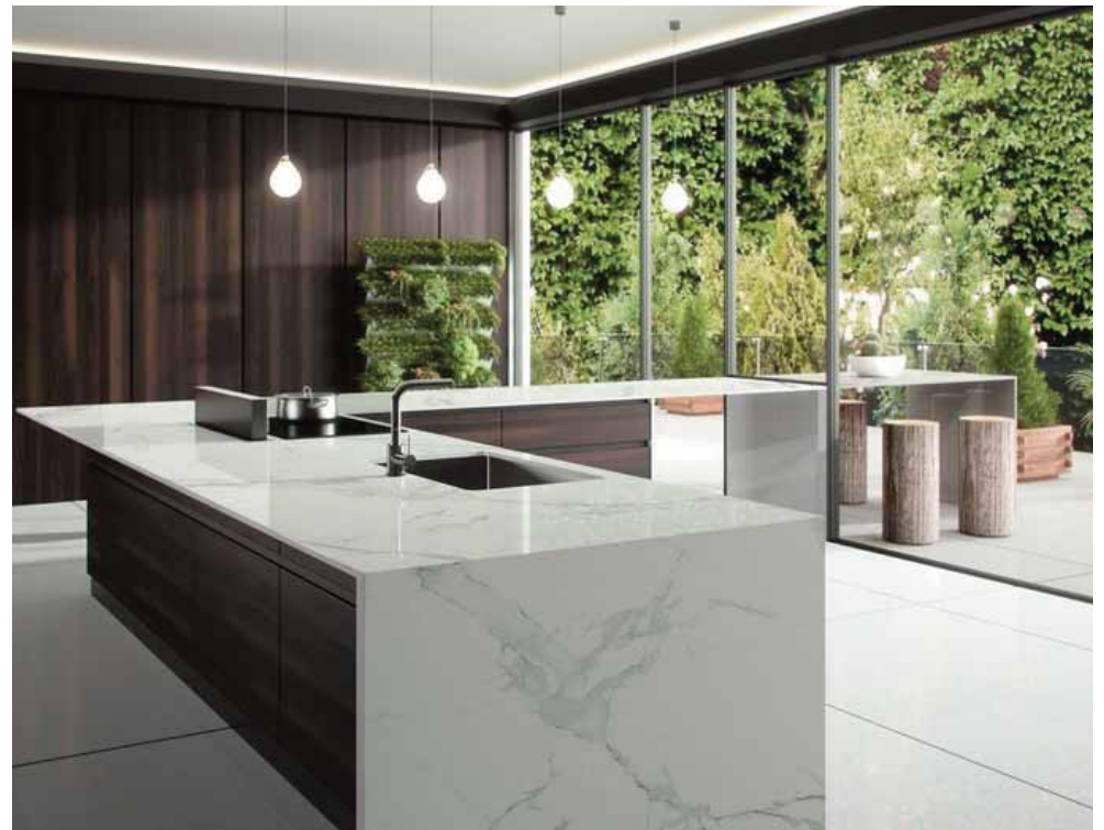
Photo provided by Cosentino shows Dekton counter surface, a brand of solid surfacing material made of resin and natural minerals that's impervious to spills, heat and wear - a boon to families and keen home cooks.