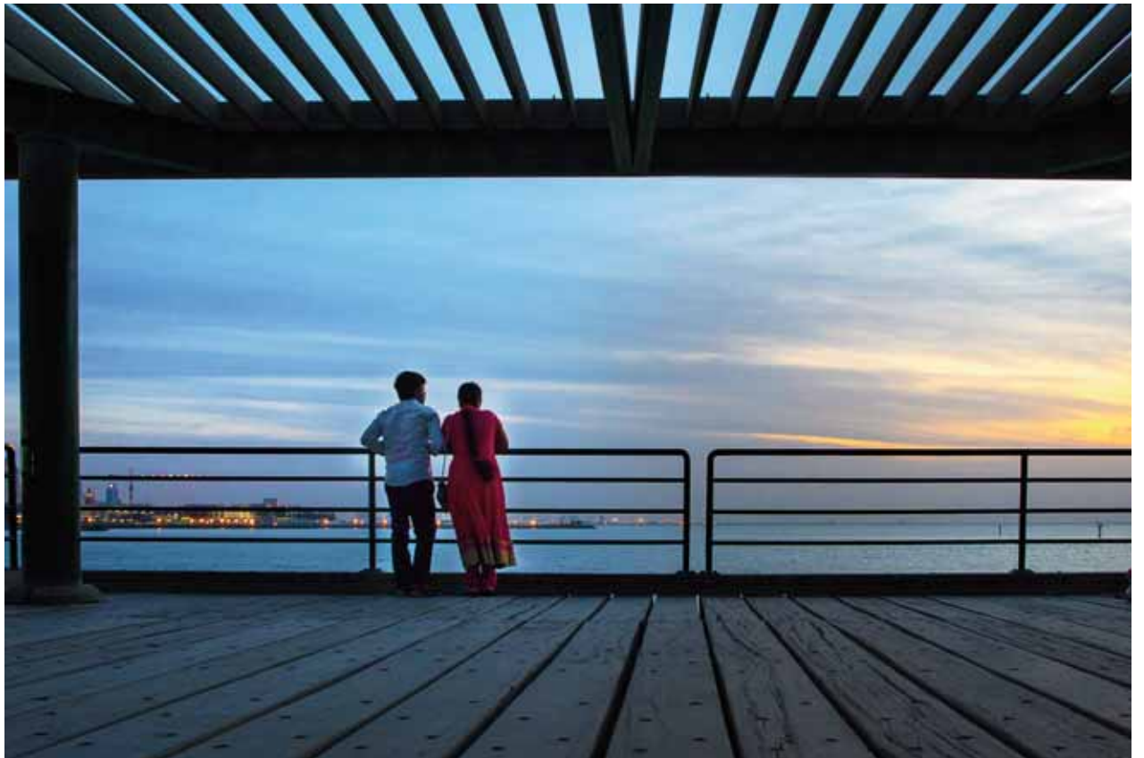
A silhouette of Kuwait City seen at sunset.