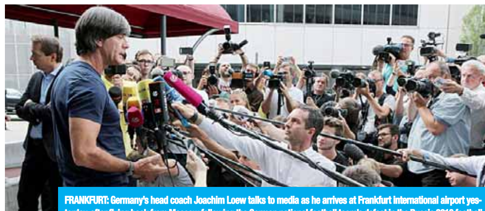
FRANKFURT: Germany's head coach Joachim Loew talks to media as he arrives at Frankfurt International airport yesterday, after flying back from Moscow following the German national football team's defeat in the Russia 2018 football World Cup.

Bild said head coach Loew's fate would be decided "in the coming days" following talks with the German football federation (DFB). After 12 years in charge, Loew is now under fire for placing too much faith in former stars past their prime. The Frankfurter Allgemeine Zeitung said only Loew's departure could give Germany the "new start" it needed. "That the party ended before it really began is bearable—but only if German football strategists recognise the sign of the times and act accordingly," the conservative