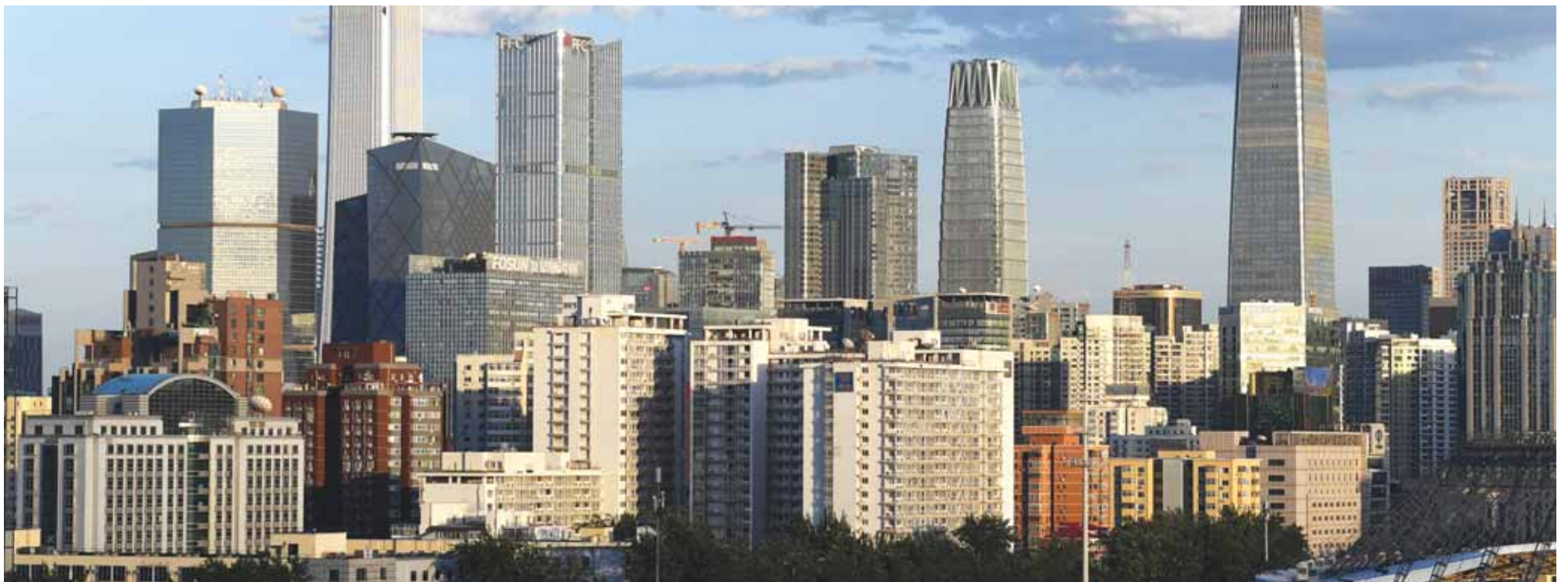
BEIJING: Photo shows the central business district in Beijing. The looming trade war with the US is clouding an already gloomy Chinese economic environment, leading local stocks to fall down along with the yuan.