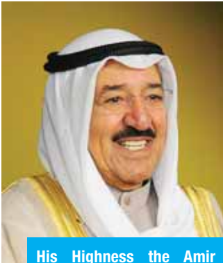
His Highness the Amir Sheikh Sabah Al-Ahmad Al-Jaber Al-Sabah

KUWAIT: His Highness the Amir Sheikh Sabah Al-Ahmad Al-Jaber Al-Sabah paid a visit yesterday to First Deputy Prime Minister and Defense Minister Sheikh Nasser Sabah Al-Ahmad Al-Sabah in Germany. His Highness the Amir visited Sheikh Nasser Al-Sabah in the hospital, where he recently underwent a lung surgery, to reassure about his health condition and congratulated him on success of the surgery. His Highness prayed to Allah Almighty to grant the defense minister a speedy recovery, perpetual good health and wellness, and a safe return home to resume his benevolent efforts in serving his country.