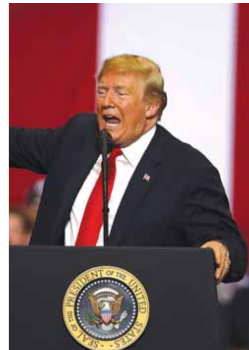
FARGO: US President Donald Trump speaks to supporters during a campaign rally at Scheels Arena. — AFP

Democrats were enraged, but with Republicans controlling both the Senate and the House, they have limited leverage to push back over Trump's second pick for the court, the final arbiter on such divisive issues as gun rights or abortion. Control over Supreme Court nominations has become a hot-button issue for the US electorate, with 70 percent of respondents in a 2016 CNN poll saying it was an important factor in their vote. November's midterm elections are expected to produce a bitter struggle for control of Congress in a deeply polarized country, especially if a court seat is still in play. —AFP