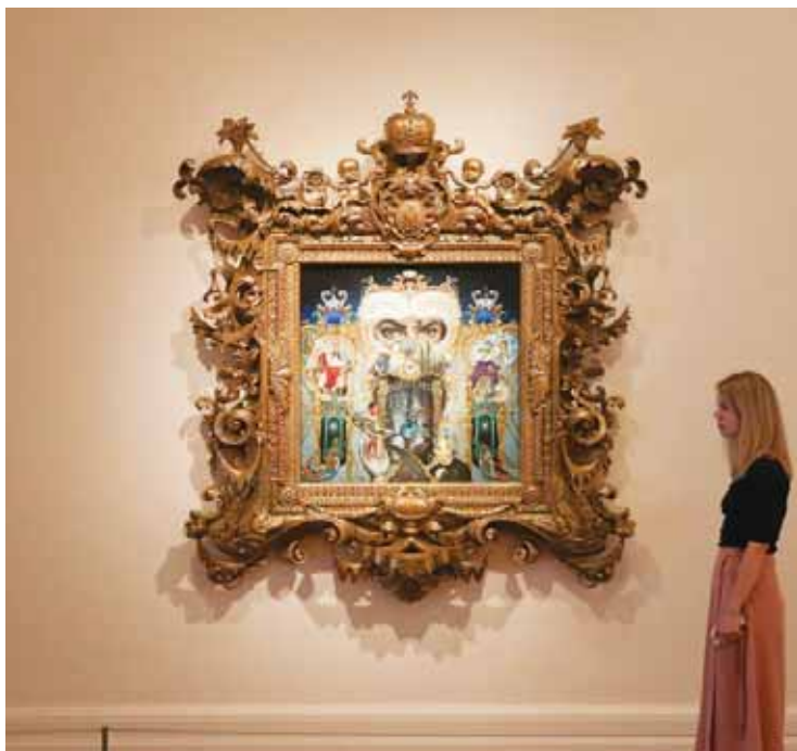
A gallery assistant poses next to an artwork entitled 'The King of Pop' by US artist Mark Ryden.

Michael Jackson's legacy as a pop-culture and artistic icon is explored in a new exhibition at London's National Portrait Gallery opening yesterday. "Michael Jackson: On the Wall"—a play on the title of classic 1979 album "Off the Wall"—follows the king of pop, who still captivates artists nine years after his death, through his multi-million selling career. The exhibition features paintings, photographs and sculptures from artists such as pop-art pioneer Andy Warhol, German sculptor Isa Genzken and US photographer David LaChapelle.