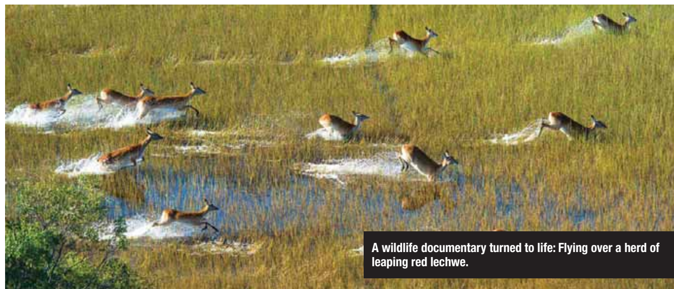
A wildlife documentary turned to life: Flying over a herd of leaping red lechwe.

Climbing up into an open-sided 4WD and trundling across grassy plains in pursuit of iconic African wildlife is a safari dream for many. And drives in the Okavango do not disappoint. With the recent re-introduction of rhino, it's now possible to view all of the Big Five (leopard, lion, elephant, buffalo, rhino). No less interesting are packs of hunting wild dogs (Moremi Game Reserve is home to almost a third of the world's population), pods of hippos bobbing and yawing, and cackles of whooping hyenas. Antelope numbers are healthy, including the water-adapted red lechwe. Last but not least, there is a phenomenal variety of birdlife that fills the air. And in this watery world, you'll also have the exciting novelty of fording stream after stream in true adventurous style.