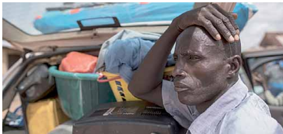
A man stands by his possessions as Christian villagers evacuate the Gamaropp village in the Barikin Ladi area near Jos. —AFP

Indian officials also planned to discuss the issue of sweeping US sanctions on Russia under which any country engaged with its defense and intelligence sectors could face secondary US sanctions. The US move has threatened a proposed $6 billion air defense missile deal that India is negotiating with Russia to help it counter the ballistic missiles and stealth aircraft that China is developing.—Reuters