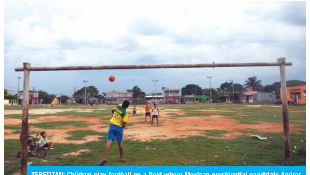
TEPETITAN: Children play football on a field where Mexican presidential candidate Andres Manuel Lopez Obrador played baseball in his childhood, in his hometown of Tepetitán.

Lopez Obrador is so popular here that street vendors in the state capital, Villahermosa, have rolled out myriad products bearing his name and image. They include devotional candles of the