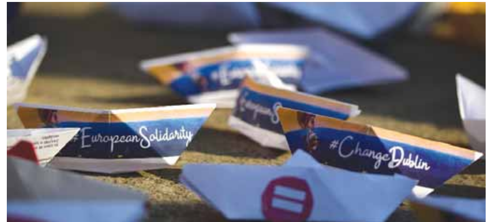
MILAN: A small paper boats are pictured in front of piazza della Scala in Milan on June 27, 2018 during a flashmob organized simultaneously in many European cities, asking the EU states to do their part, to change the Dublin Regulation in the direction already indicated by the European Parliament and to open legal and safe access routes for immigrants and refugee in all EU countries.

The leaders hope at the summit to approve work on migrant "disembarkation platforms" in countries outside Europe, most likely in Africa, according to a draft prepared by Tusk. In a bone to Merkel, the leaders will also agree to "closely cooperate" on stopping secondary movements of migrants, according to draft summit conclusions,