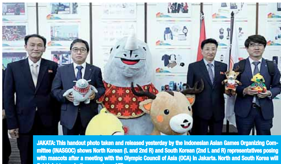
JAKARTA: This handout photo taken and released yesterday by the Indonesian Asian Games Organizing Committee (INASGOC) shows North Korean (L and 2nd R) and South Korean (2nd L and R) representatives posing with mascots after a meeting with the Olympic Council of Asia (OCA) in Jakarta. North and South Korea will field joint teams in three sports.

"It's certainly a lot more difficult than what I had envisioned," Woods said. "They've got the rough up, fairways in, it's like a mini-Open here. "You have to drive it well. You cannot play out of this rough. You have to hit a lot of fairways. The greens are tough to get to if you don't hit fairways."