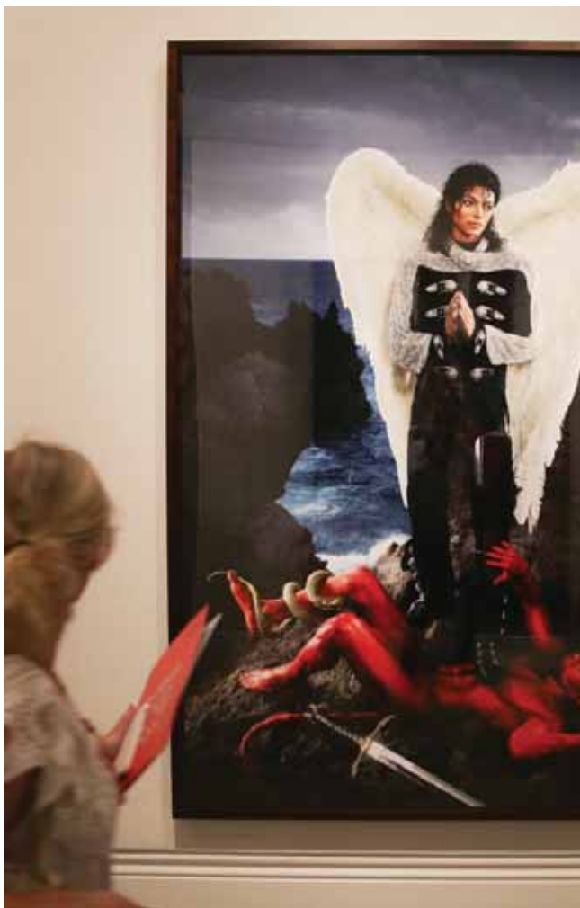
A visitor walks past an artwork entitled 'Archangel Michael: And No Message Could Have Been Any Clearer' by US artist David LaChapelle.

In this file photo Michael Jackson's children pose with family and guests during the Michael Jackson Immortalized event in Hollywood, California.