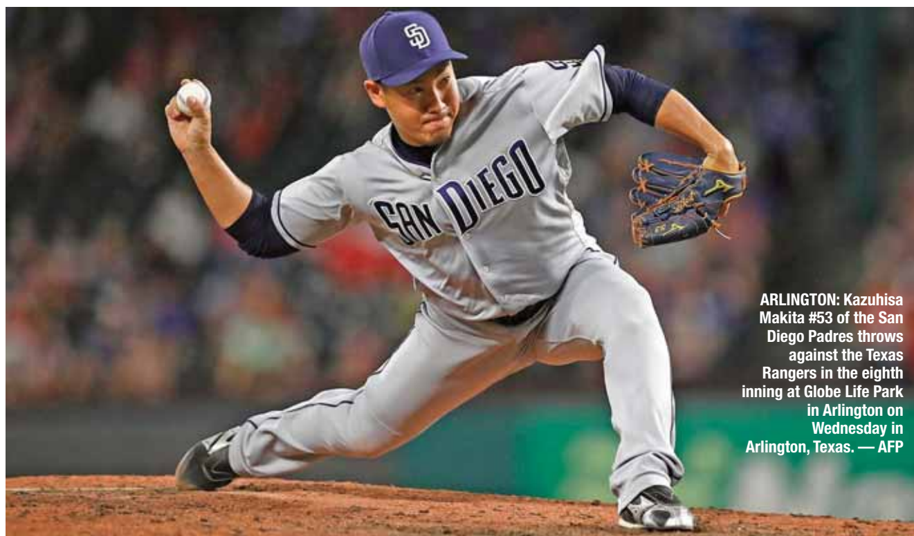
ARLINGTON: Kazuhisa Makita #53 of the San Diego Padres throws against the Texas Rangers in the eighth inning at Globe Life Park in Arlington on Wednesday in Arlington, Texas.

Edwin Encarnacion and Lonnie Chisenhall hit back-to-back homers to help Cleveland salvage a three-game set with a victory