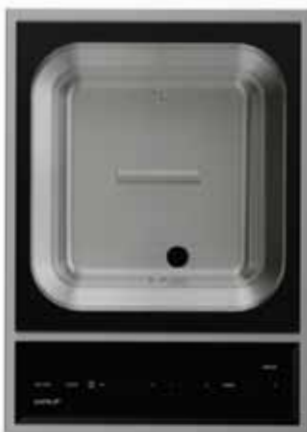
Photo provided by Sub-Zero and Wolf shows Wolf's steamer module, which cooks proteins, vegetables and grains keeping nutrients and flavors intact.

ity. Our new kitchen is designed around intimacy and proximity - to one another and the tools we need," he says. "Additional steps slow you down. The same lesson rings true for a kitchen layout at home."