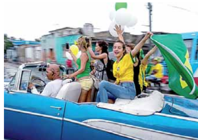
BAUTA: Fans of Brazil celebrate after a FIFA World Cup match between Brazil and Serbia in Bauta, Artemisa province, Cuba on Wednesday.

However, the victory may have come at a price as left-back Marcelo was forced off in the 10th minute with a back spasm. Visibly struggling, the Real Madrid defender was initially reluctant to leave the pitch, before being replaced by his Atletico Madrid counterpart Filipe Luis.