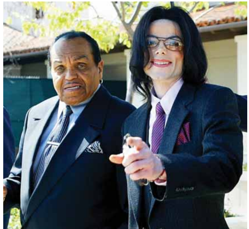
In this file photo taken on March 8, 2005 singer Michael Jackson (right) gestures as he and his father, Joseph Jackson, depart the Santa Maria Superior Court during the second week of Michael's child molestation trial in Santa Maria, California.

A strict disciplinarian father of 11 children, the steel worker in Gary, Indiana turned into one of music history's most unlikely but most successful managers as he created The Jackson 5 from his family. His most famous child, King of Pop Michael Jackson, would later break down in tears even as an adult when recalling his father beating him with his belt and, while publicly forgiving him, wrote him out of his will. — AP