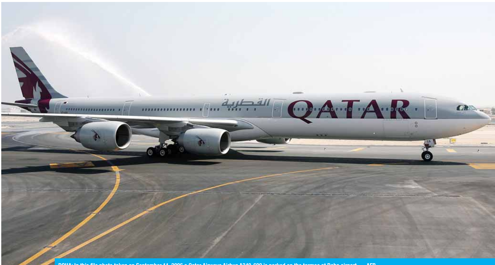
DOHA: In this file photo taken on September 11, 2006 a Qatar Airways Airbus A340-600 is parked on the tarmac at Doha airport.