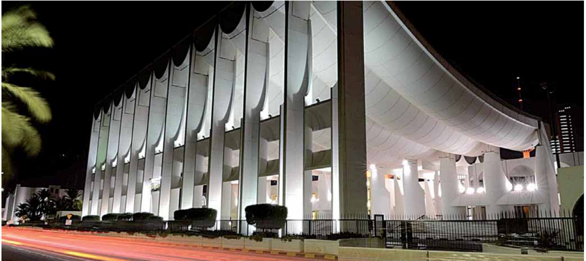
The National Assembly.

Assembly passed 14 laws, approved 21 pacts in second session