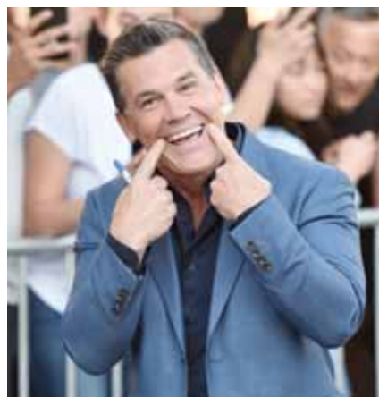
Actor Josh Brolin attends the premiere of Columbia Pictures' "Sicario: Day Of The Soldado" at Regency Village Theatre.

Relevance is often nothing more than good timing and movies are lucky if they can capture the public imagination, spotlighting urgent stories just as they are leading global news bulletins. "Sicario: Day of the Soldado," with its gut-punching focus on the immiseration of refugees trying to cross into the US from Mexico, often unaccompanied children, is one such film. The sequel to Denis Villeneuve's "Sicario" (2015) comes out in the