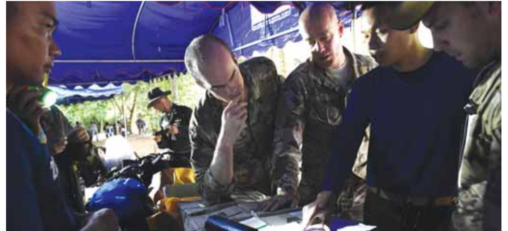
A Thai military officer (2nd-R) briefs US military personnel at a command outpost in Khun Nam Nang Non Forest Park near Than Luang cave in Chiang Rai province.

There are several air pockets within the complex and the kids are believed to be in a large chamber in the middle of the cave. But fast-running and murky flood waters have prevented