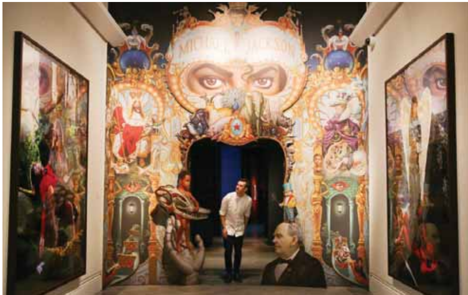
A gallery assistant poses next to an artwork entitled 'The King of Pop' by US artist Mark Ryden, on display during a photocall to promote the exhibition: 'Michael Jackson: On The Wall' at the National Portrait Gallery in central London.