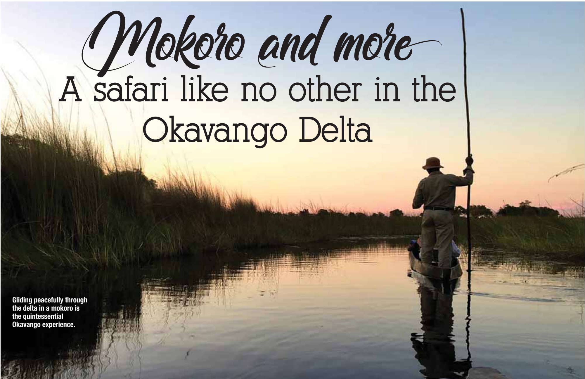
Gliding peacefully through the delta in a mokoro is the quintessential Okavango experience.

B otswana’s mighty Okavango Delta, which expands annually up to a size of almost 20,000 sq km, is one of Africa’s greatest and most pristine wildernesses. To take in its beauty, and all the iconic wildlife that call it home, there are six enthralling activities available, but none so entrancing as a trip in a traditional mokoro (narrow dugout canoe). A poler stands at the back of a mokoro (dugout canoe) with his pole raised vertically to the sky. His outline is crisp against a pinkish blue sky at sunset. To his left are a bed of reeds at the edge of the channel. Everything is reflected in the still water of the delta