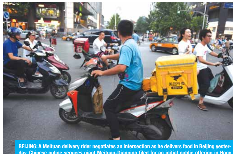
BEIJING: A Meituan delivery rider negotiates an intersection as he delivers food in Beijing yesterday. Chinese online services giant Meituan-Dianping filed for an initial public offering in Hong Kong on June 25, in what could become one of the biggest IPOs of the year.

Taiwan is China's most sensitive territorial issue. Beijing considers the self-ruled, democratic island a wayward province. Hong Kong and Macau are former European colonies that are now part of China but run largely au-