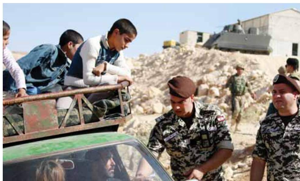
Lebanese security forces check identity and papers of Syrian refugees getting ready to cross into Syria from the eastern Lebanese border town of Arsal.

UN officials and foreign donor states have said it is not yet safe for refugees to go back to Syria, where a political deal to end the multi-sided war remains elusive. The seven-year conflict has driven 11 million Syrians from their homes. More than 1 million have fled to Lebanon, the UN refugee agency UNHCR says. The