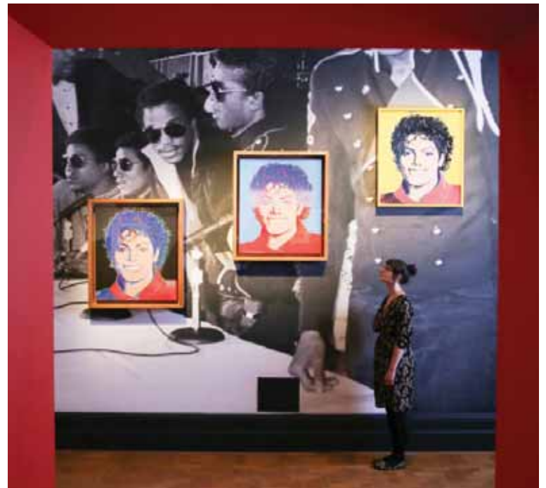
A gallery assistant poses next to an artwork entitled 'Michael Jackson' by US artist Andy Warhol.