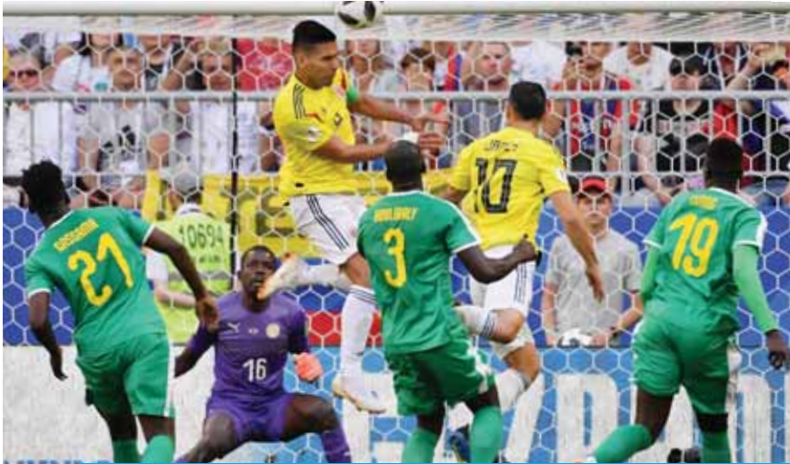
SAMARA: Senegal's goalkeeper Khadim N'Diaye (back) eyes the ball as Colombia's forward Falcao (C) jumps for a header during the Russia 2018 World Cup Group H football match between Senegal and Colombia at the Samara Arena in Samara yesterday.

They had looked set to take the lead in the 17th minute when Liverpool forward Sadio Mane went down in the area under a challenge from Davinson Sanchez and