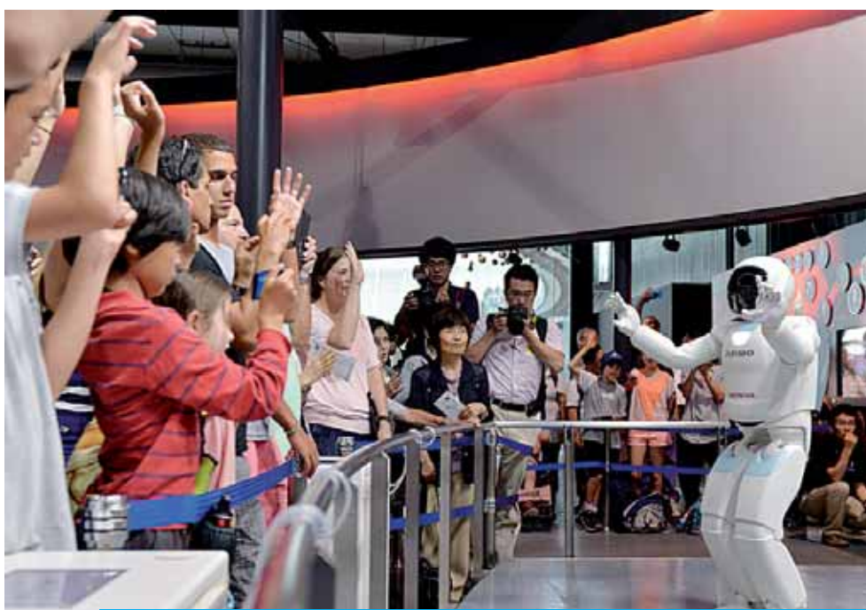
TOKYO: Honda Motor's humanoid robot Asimo interacts with visitors at the National Museum of Emerging Science and Innovation in Tokyo.

The company is expected to focus on humanoid robots that can help care for elderly and disabled people, NHK said, citing unnamed company sources. Though never sold commercially, ASIMO attracted international attention, playing football with Obama in 2014, dancing for Merkel in 2015, and taking a selfie with Australian Prime Minister Malcolm Turnbull the same year. There have been no upgrades to the model since its seventh generation, which debuted in 2011 and can listen to and understand three people talking simultaneously.