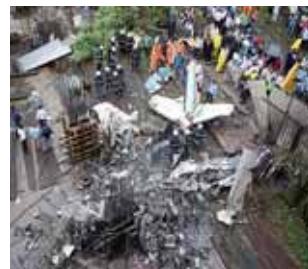
Five dead as plane plunges into Mumbai building site