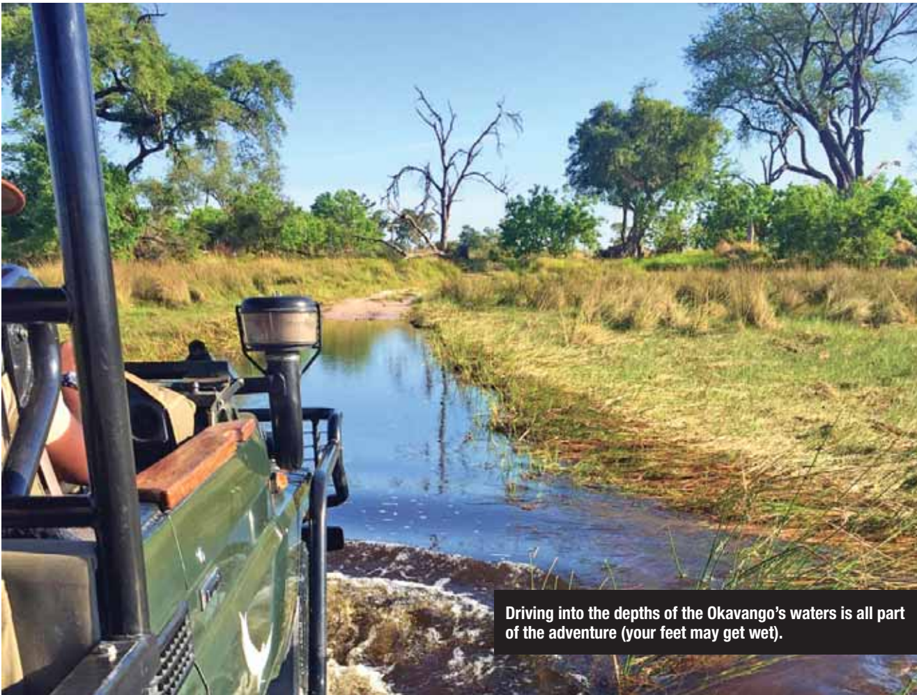
Driving into the depths of the Okavango's waters is all part of the adventure (your feet may get wet).