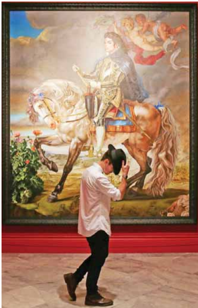
A gallery assistant poses next to an artwork entitled 'Equestrian Portrait of King Phillip II (Michael Jackson)' by US artist Kehinde Wiley.