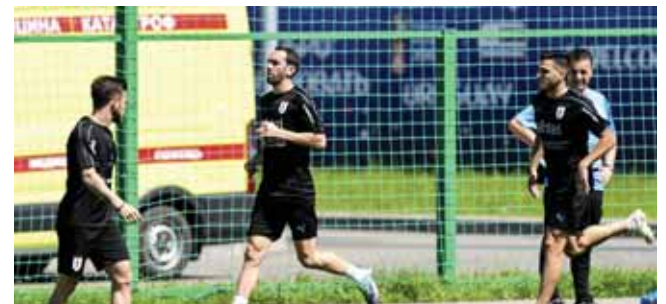
NIZHNY NOVGOROD: Uruguay's Diego Godin (C) takes part in a training session in Nizhny Novgorod on Wednesday during the Russia 2018 World Cup football tournament.

Tabarez, who has coached Uruguay since 2006, has never hidden his admiration for his captain. "Godin has always had a very defined personality, he shows solidarity and that has made him stand out the group and it has rubbed off on them too," he said last year. "He earned the captaincy for his achievements and his