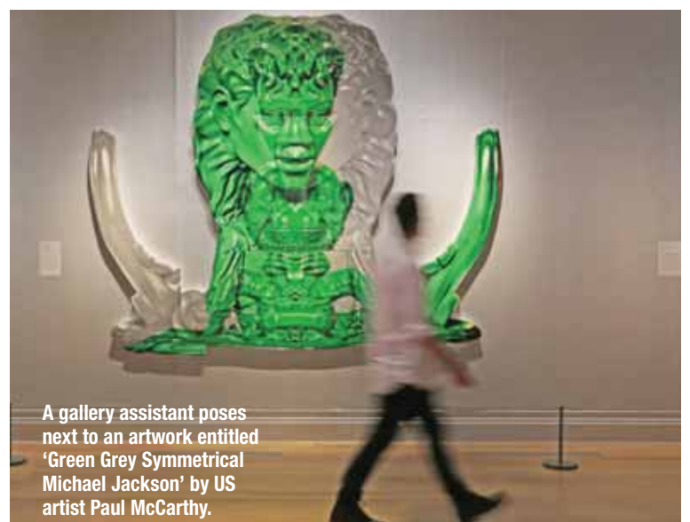
A gallery assistant poses next to an artwork entitled 'Green Grey Symmetrical Michael Jackson' by US artist Paul McCarthy.