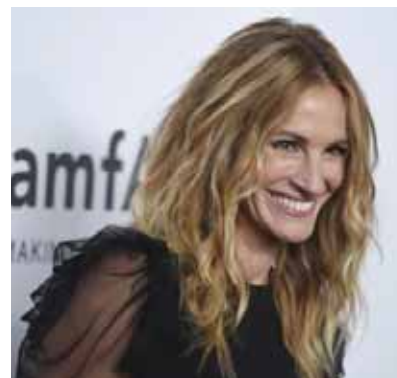
Julia Roberts attends the 2017 amfAR Inspiration Gala Los Angeles in Beverly Hills, Calif.

Julia Roberts is getting social. The "Pretty Woman" star has joined Instagram and made her first ever social media post. It's a photo of her sitting in grass wearing denim shorts and a black top that says "love." She captioned the photo, "Hello." The 50-year-old Oscar winner does not have a Twitter or Facebook account.