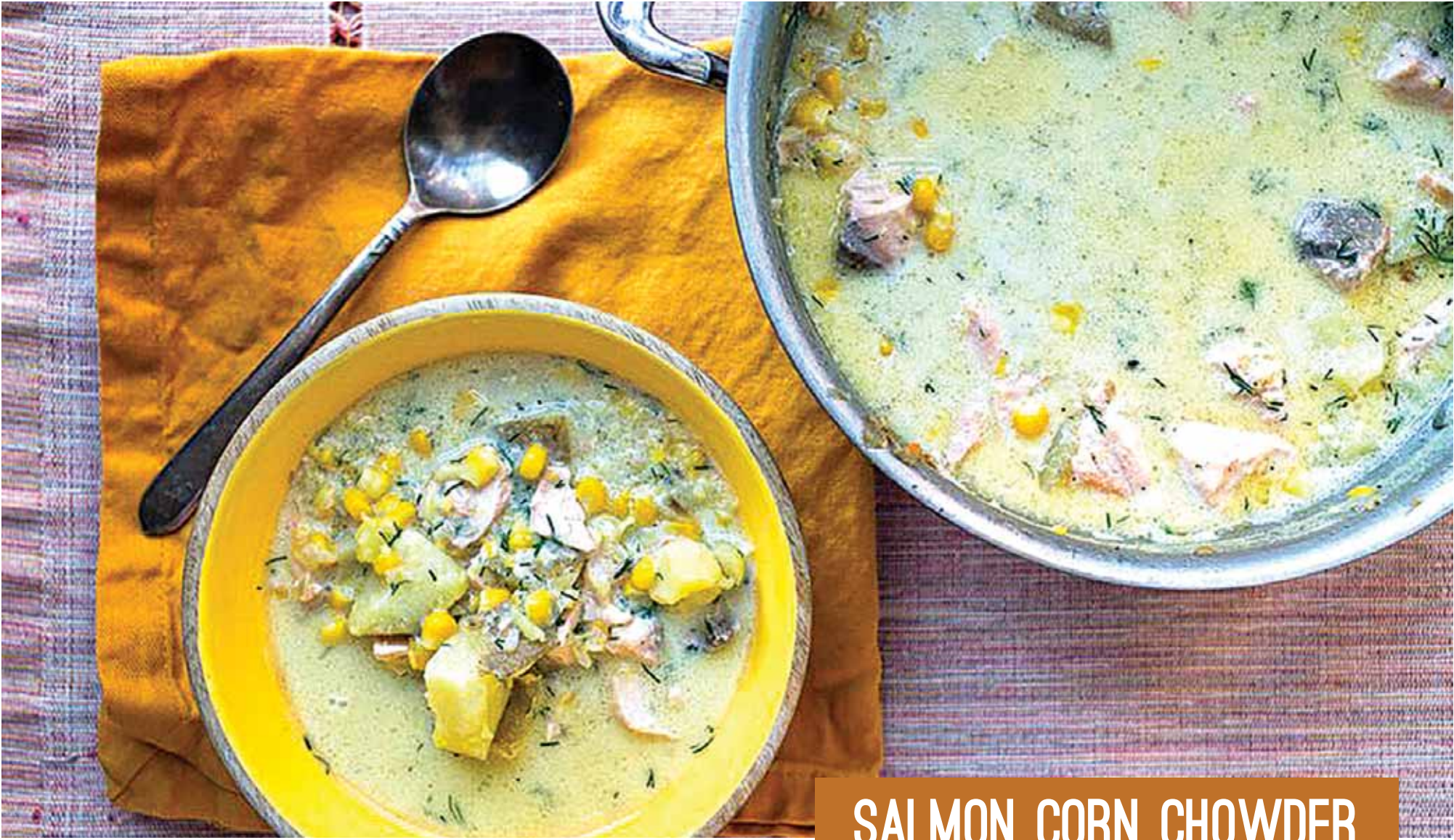
SALMON CORN CHOWDER