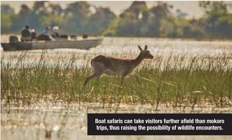
Boat safaris can take visitors further afield than mokoro trips, thus raising the possibility of wildlife encounters.

B otswana’s mighty Okavango Delta, which expands annually up to a size of almost 20,000 sq km, is one of Africa’s greatest and most pristine wildernesses. To take in its beauty, and all the iconic wildlife that call it home, there are six enthralling activities available, but none so entrancing as a trip in a traditional mokoro (narrow dugout canoe). A poler stands at the back of a mokoro (dugout canoe) with his pole raised vertically to the sky. His outline is crisp against a pinkish blue sky at sunset. To his left are a bed of reeds at the edge of the channel. Everything is reflected in the still water of the delta