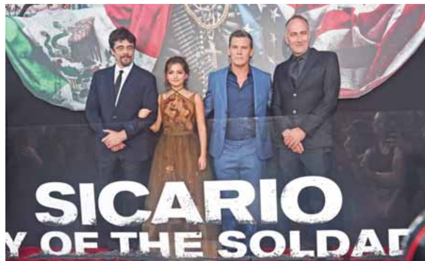
Actor Benicio del Toro, Isabella Moner, Josh Brolin and director Stefano Sollima attend the premiere of Columbia Pictures' "Sicario: Day Of The Soldado" at Regency Village Theatre on June 26, 2018 in Westwood, California.

Brolin reprises CIA agent Matt Graver, enlisting the mysterious Alejandro (Benicio Del Toro) to escalate the war by kidnapping a cartel kingpin's daughter (Isabella Moner). An intense action thriller like its predecessor, the sequel ventures deep into the merciless border world of drug dealing, human trafficking and American foreign policy. The issue of child separations is all the more emotive for Brolin since he will soon be welcoming a daughter of his own with his third wife, the 30-year-old actress