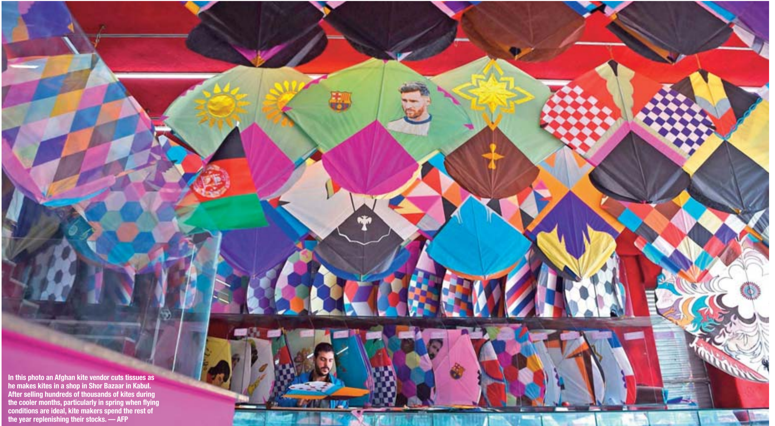
In this photo an Afghan kite vendor cuts tissues as he makes kites in a shop in Shor Bazaar in Kabul. After selling hundreds of thousands of kites during the cooler months, particularly in spring when flying conditions are ideal, kite makers spend the rest of the year replenishing their stocks.