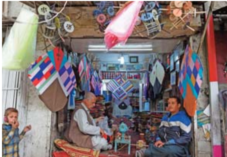
An Afghan kite shop in Shor Bazaar in Kabul.