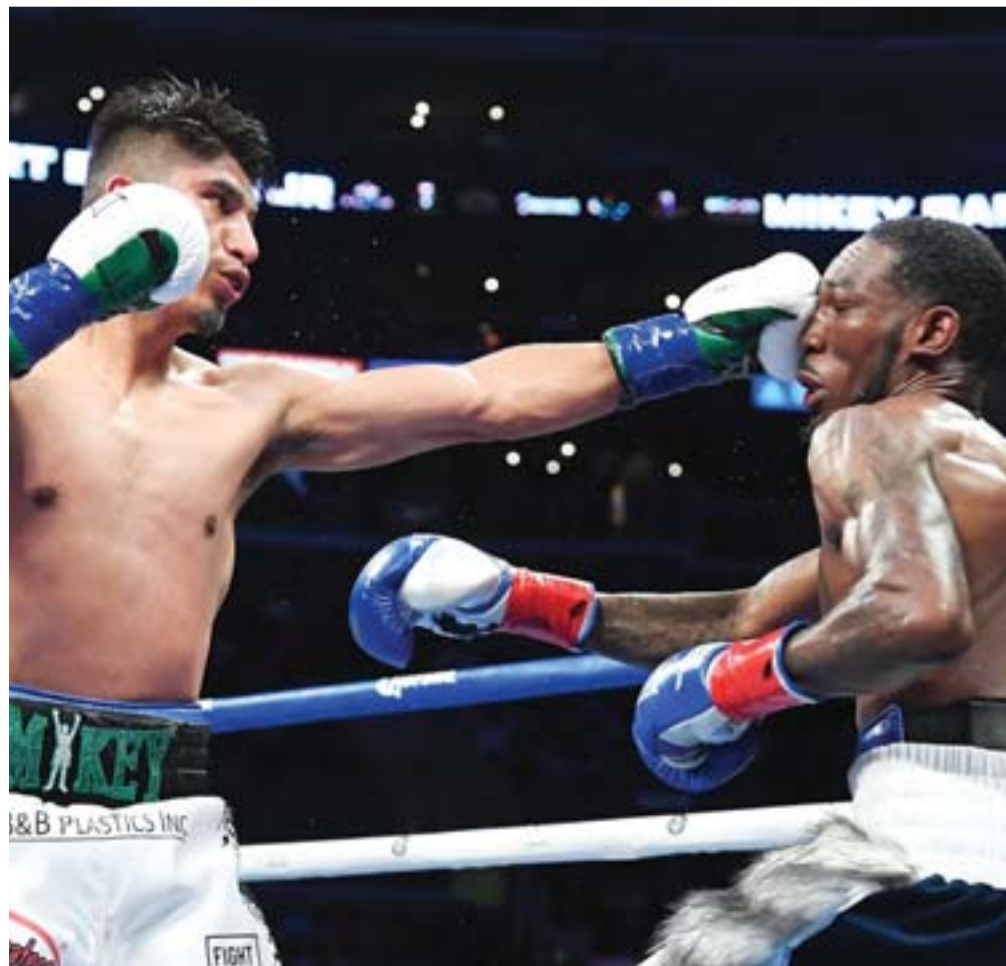
LOS ANGELES: Mikey Garcia punches Robert Easter Jr during their WBC & IBF World Lightweight Title fight at Staples Center on July 28, 2018.

Garcia immediately threw down the gauntlet to Errol Spence saying in the ring that for his next fight he wants to move up to the wel-