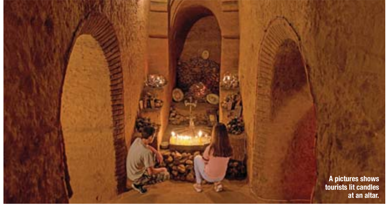
A pictures shows tourists lit candles at an altar.