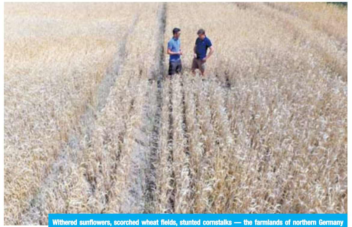
Withered sunflowers, scorched wheat fields, stunted cornstalks — the farmlands of northern Germany have borne the brunt of this year's extreme heat and record-low rainfall, triggering an epochal drought.

"The cornstalks are knee-high" and are sprouting smaller cobs or none at all, said Stein of Agro Boerdegruen, located about 150 kilometers (90 miles) west of Berlin. "Normally they should be over two meters by now." Stein said that to grow crops like potatoes—a staple of the German diet—her farms have long relied on watering systems because the region, in