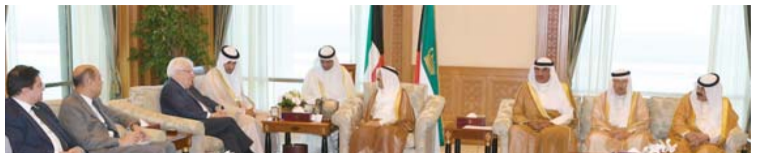
KUWAIT: His Highness the Amir Sheikh Sabah Al-Ahmad Al-Jaber Al-Sabah receiving Special Envoy of the UN Secretary-General for Yemen Martin Griffiths and his accompanying delegation.

Pakistan condolences HH the Amir Sheikh Sabah Al-Ahmad Al-Jaber Al-Sabah sent a cable of condolences to President of Pakistan Mamnoon Hussain yesterday, over the victims of the heavy rains that hit different areas of the country killing and injuring dozens. His Highness the Crown Prince Sheikh Nawaf Al-Ahmad Al-Jaber Al-Sabah and His Highness the Prime Minister Sheikh Jaber Al-Mubarak Al-Hamad Al-Sabah sent similar cables to President Hussain.