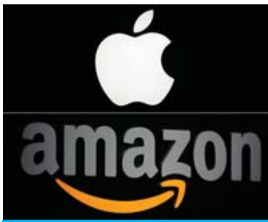
This combination of file pictures created yesterday shows the Apple logo (top) in Paris and the Amazon logo in New York.

According to TD Ameritrade's mid-year review, online commerce giant Amazon's stock was the most popular buy in the first half of 2018, with