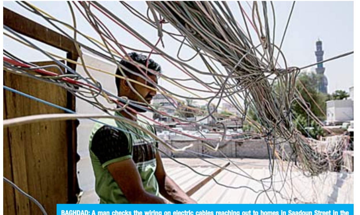
BAGHDAD: A man checks the wiring on electric cables reaching out to homes in Saadoun Street in the Iraqi capital Baghdad.

OPEC cartel-sits on some of the world's largest crude reserves, with the oil sector accounting for 89 percent of the state budget.