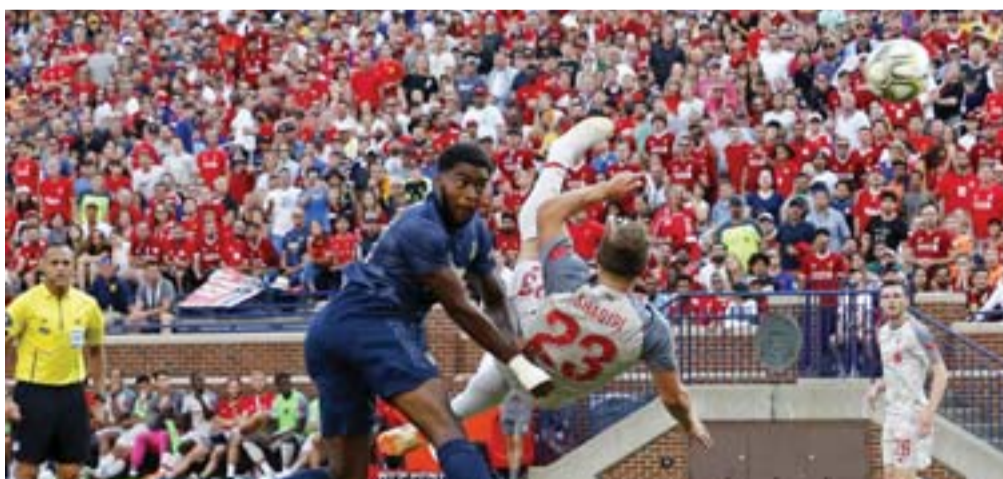
MICHIGAN: Liverpool FC Sheridan Shaqiri (right) shoots and scores during the second half of the 2018 International Champions Cup football match against Manchester United at Michigan Stadium on July 28, 2018. Liverpool FC beat Manchester United 4-1 in their friendly.

Mourinho, who has become increasingly downbeat during the tour, cut a frustrated figure as he spoke about the club's relative inactivity in the transfer market. "I would like to have two more players," Mourinho said. "I think I am not going to have two. I think it's possible I'm going to have one. I gave a list to my club of five names a few months ago and I wait to see if it's possible to have one of these players. If it's pos-