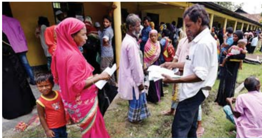
ASSAM: Villagers wait outside the National Register of Citizens (NRC) centre to get their documents verified by government officials, at Mayong Village in Morigaon district, in the northeastern state of Assam, India.

He also slammed "a real lack of state authority", meaning "some citizens end up meting out their own justice and that is very dangerous". He termed the continuing problem of jihadist violence as a global, rather than African problem and urged the next government to apply the 2015 peace accord. The first poll results are expected within 48 hours, with official results following on Friday at the latest. First round turnout is typically below 50 percent in Mali which has some eight million voters. If no candidate gains more than 50 percent of the vote in Sunday's first round, a second round will take place on August 12. —AFP