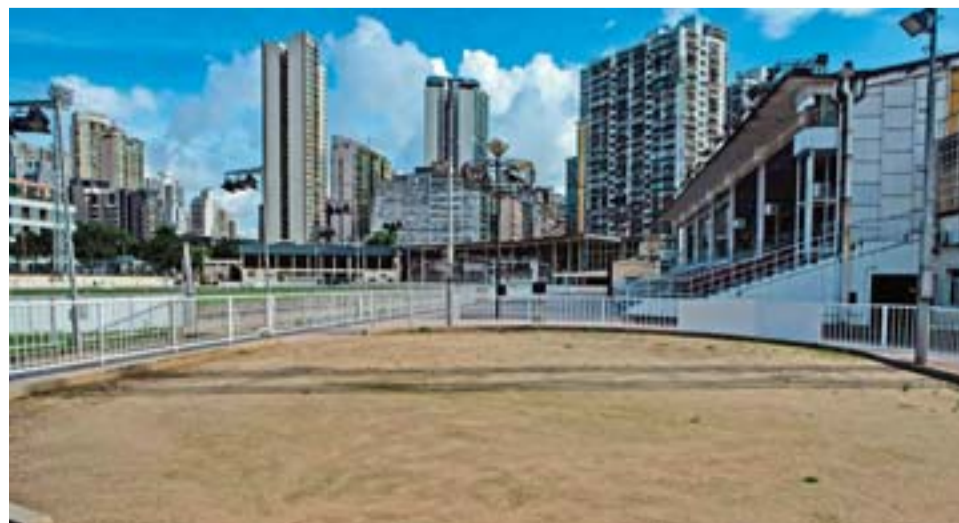
A general view of the shutdown Canidrome Club in Macau, which was Asia's only legal dog-racing track.