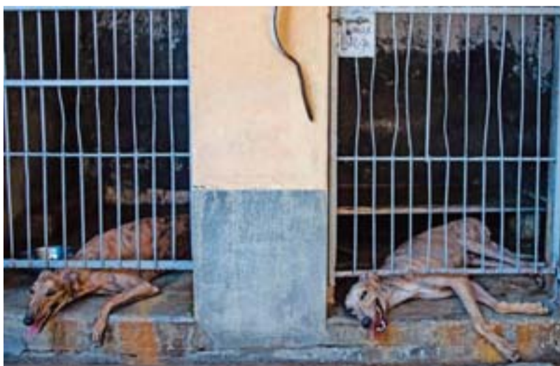
This picture shows greyhounds inside kennels at the shutdown Canidrome Club in Macau, which was Asia's only legal dog-racing track.

On a sweltering afternoon in Macau, panting greyhounds lie in tiny concrete kennels at the gambling enclave's notorious dog-racing track, as a new plan to save them emerged following the venue's closure. The dogs are currently walked each day by an army of dedicated volunteers from all over Macau, who have been helping out at the deserted Canidrome Club since it shut down on July 21. Some 533 greyhounds still live at the shabby venue, which was Asia's only legal dog-racing track. Many of those remaining have patches of fur missing, a result of sleeping on wet concrete according to activists, who say injured dogs went untreated when the Canidrome was still operating.