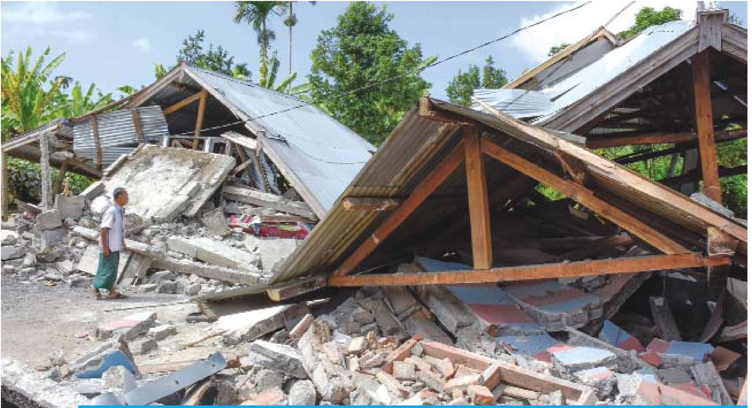
OMBOK, Indonesia: An Indonesian man examines the remains of houses, after a 6.4 magnitude earthquake struck, in Lombok.