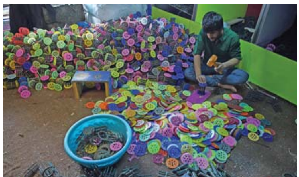
An Afghan youth makes spools for string as he works in a shop in Shor Bazaar in Kabul.