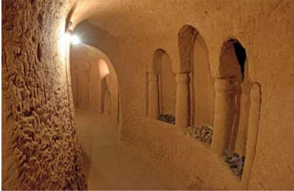
A pictures shows a tunnel part of a network of subterranean caves and tunnels known as "Master Levon's divine underground" in the village of Arinj outside the capital Yerevan.