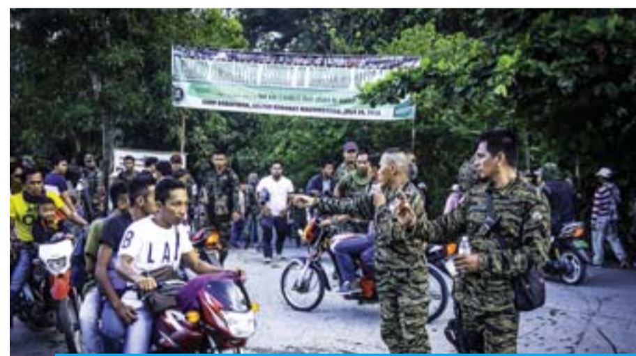
MAGUINDANAO, Philippines: Moro Islamic Liberation Front (MILF) members secure Camp Darapanan in Sultan Kudarat on the southern island of Mindanao yesterday.