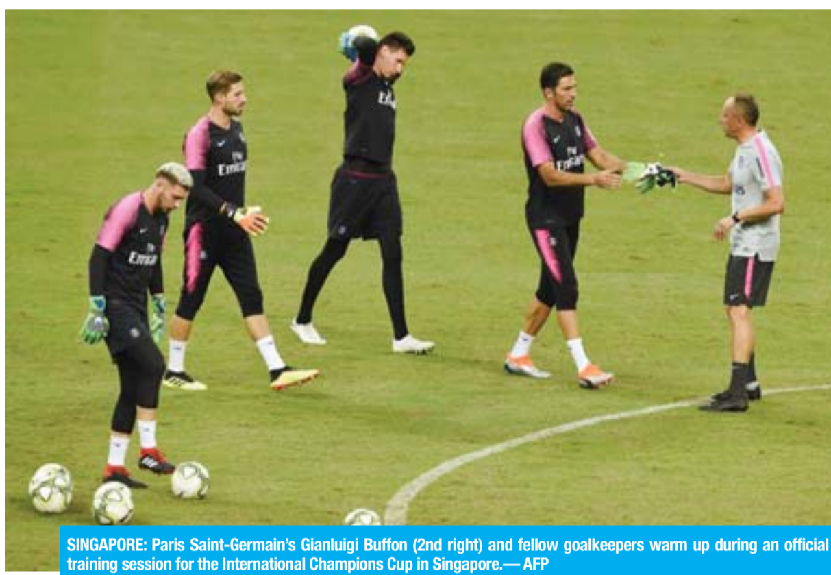
SINGAPORE: Paris Saint-Germain's Gianluigi Buffon (2nd right) and fellow goalkeepers warm up during an official training session for the International Champions Cup in Singapore.

Buffon has not had the easiest of starts with PSG, shipping four goals in his first two friendly appearances against Bayern Munich and Arsenal. Buffon, who clocked up 656 appearances in 17 years at Juventus, insisted he never expected simply to be handed a starting spot. "In 24 years of my career, nobody has ever told me that I had the number one shirt by right. It's come through hard training and being selected based