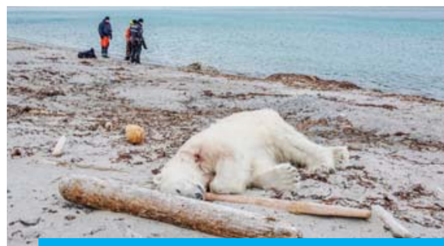
SJUSJOEN, Norway: A dead polar bear is seen at a beach north of Spitzbergen yesterday.