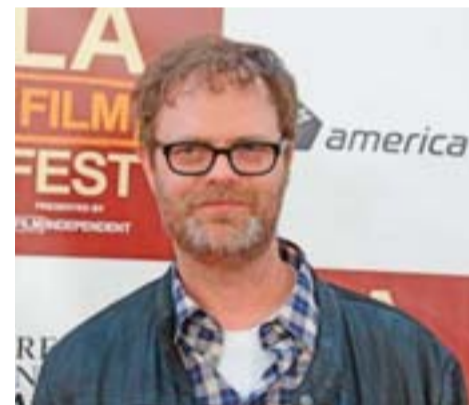
In this file photo actor Rainn Wilson arrives at the premiere of "Middle Of Nowhere," at the Los Angeles Film Festival in downtown Los Angeles, California.

For Masi Oka, who plays one of the crew members stranded in the sub, a good monster movie is enjoyable precisely because the audience feels safe as the carnage unfolds