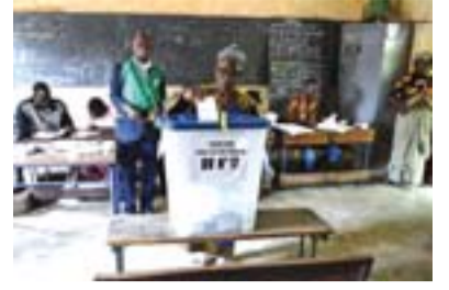
Mali votes in key election for violence-hit Sahel