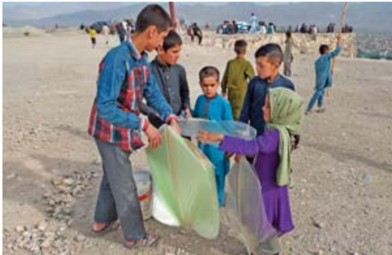
A young Afghan kite vendor (right) sells plastic kites to children during a kite battle on a hillside in Kabul.