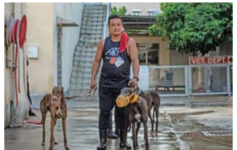
A volunteer walking with greyhounds at the shutdown Canidrome Club in Macau, which was Asia's only legal dog-racing track.