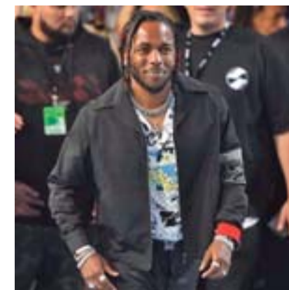
File photo shows Kendrick Lamar arrives at the MTV Video Music Awards at the Forum in Inglewood, Calif.