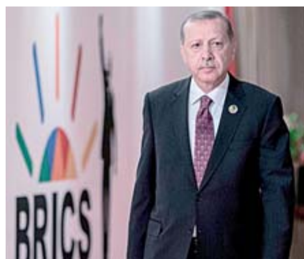
JOHANNESBURG: Turkey's President Recep Tayyip Erdogan arrives to attend a session meeting during the 10th BRICS summit in Johannesburg.

President Recep Tayyip Erdogan said Turkey is seeking to hold a summit in Istanbul with France, Germany and Russia on September 7 to discuss regional issues including the Syrian conflict, in comments published yesterday. "We