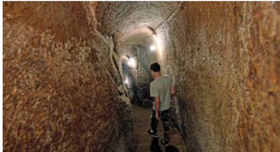
A pictures shows a tourist walking through part of a network of subterranean caves and tunnels.