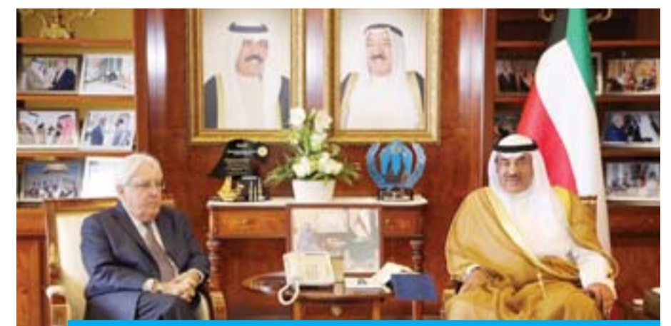
KUWAIT: Acting Prime Minister and Minister of Foreign Affairs Sheikh Sabah Al-Khaled Al-Hamad Al-Sabah receives United Nations Special Envoy to Yemen Martin Griffiths. — KUNA

Acting Prime Minister and Minister of Foreign Affairs Sheikh Sabah Al-Khaled Al-Hamad Al-Sabah had also received Martin Griffiths to discuss with him the recent developments in the Yemeni territories. Sheikh Sabah Al-Khaled affirmed to Griffiths, Kuwait's unwavering stance towards the Yemeni people and their rights to live in peace and security. He also stressed that Kuwait will continue its efforts to provide humanitarian aid to brethren in Yemen. Senior Kuwaiti diplomats, including Deputy Foreign Minister Ambassador Khaled Al-Jarallah and others, attended the meeting. —KUNA