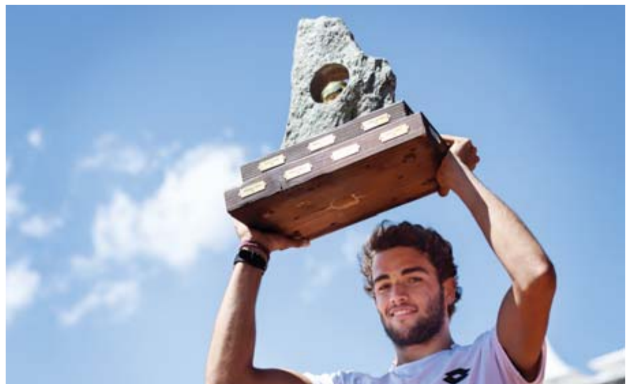
GSTAAD: Italy's Matteo Berrettini holds the trophy as he celebrates his victory at the end of the Swiss Open ATP 250 tennis tournament final match against Spain's Roberto Bautista-Agut yesterday.

"From the beginning until the end it was really tough to break him," Berrettini said. "I served really good most of the days and it was an unbelievable tiebreak. "If I lost the tiebreak, I think the match would have been really tough. I was lucky I did a really good job." Playing in his first tour level final, Berrettini produced a fearless display, firing 17 aces and losing 12 points on serve in total. He finished the tournament without dropping a set, ousting 2016 champion Feliciano Lopez and fourth seed Andrey Rublev on his way to lifting the title. —Reuters