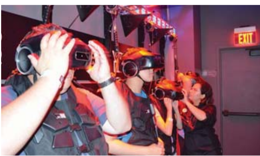
Clients of the VR attraction, The Void, put on their 3D headset in Anaheim, California.