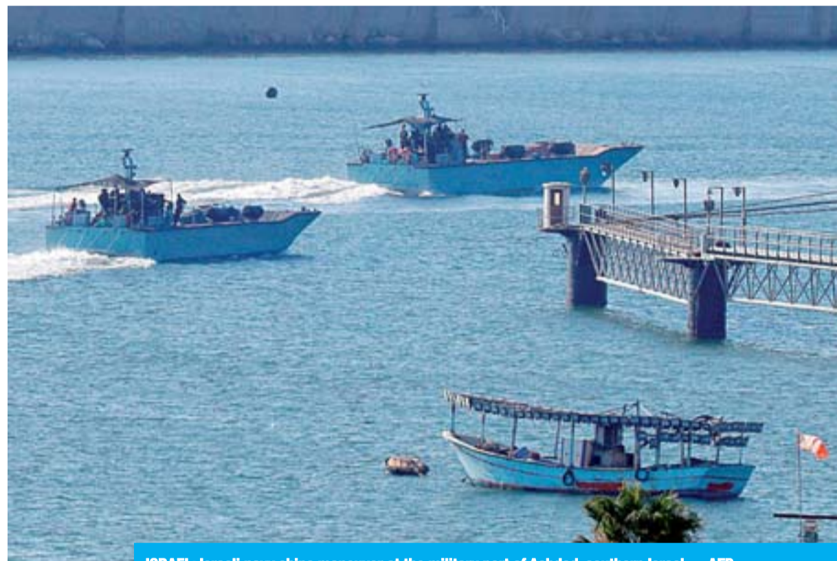
ISRAEL: Israeli navy ships maneuver at the military port of Ashdod, southern Israel.

Israel has fought three wars with Palestinian militants in Gaza since 2008 and says the blockade is necessary to keep them from obtaining weapons or materials that could be used for military purposes. UN officials and rights activists have called for the blockade to