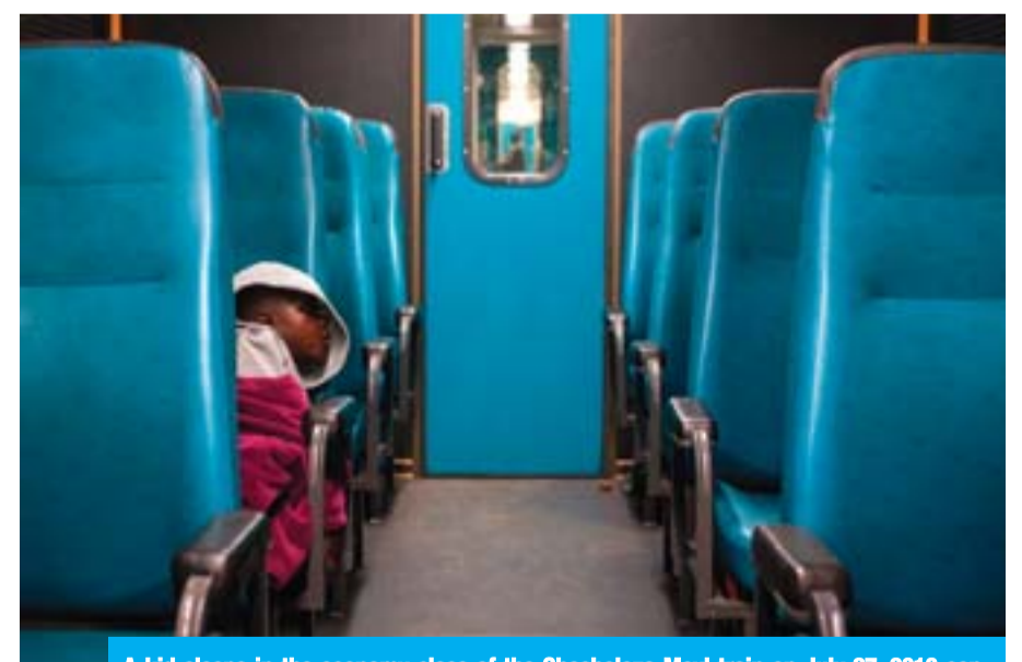
A kid sleeps in the economy class of the Shosholoz Meyl train on July 27, 2018 connecting Johannesburg to Musina.

For one mother-of-two on board, who declined to give her name, the election is a chance to register her anger at the Mugabe years and try to throw out his ZANU-PF party. "We are going back home because we want a new country. It was 37 years with that old man ruling - he was greedy and wanted everything for himself," said the nurse, who has worked in Johannesburg for six years. "I am going to vote for the young Chamisa. The old guys