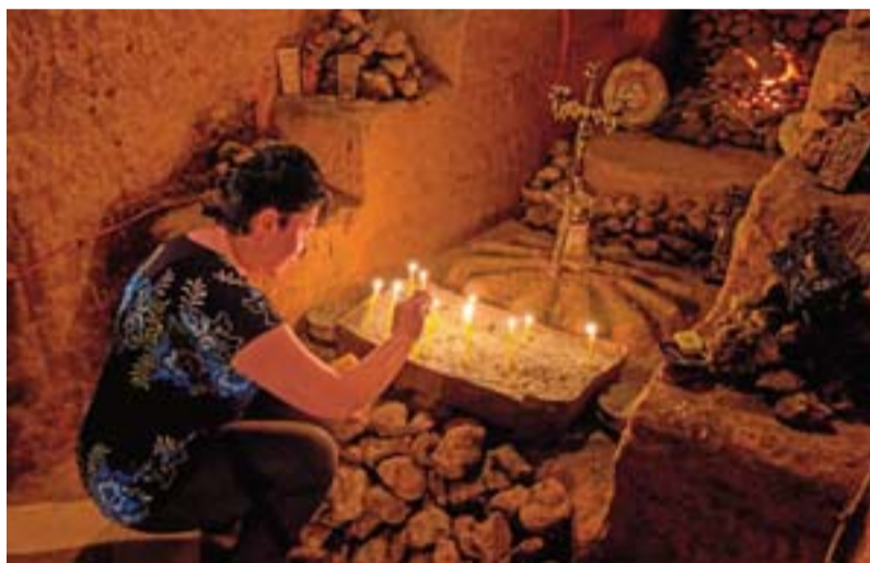
A pictures shows a tourist lit candles at an altar.

Over more than two decades he hammered out the 280-square-metre (3,000 square-foot) space, 21 meters deep into strata of volcanic rocks—only using hand tools. "My primary childhood recollection is the loud knock of my father's hammer heard at night from the cave," said his 44-year-old daughter Araksya. At the start he had to break through a surface layer of black basalt, but at the depth of a few meters Levon reached much softer tufa stone and the work progressed. He pulled out 600 truckloads of rocks and earth, using only hand-held buckets. Levon died in 2008 at the age of 67 from a heart attack after destroying the last wall that separated two tunnels.