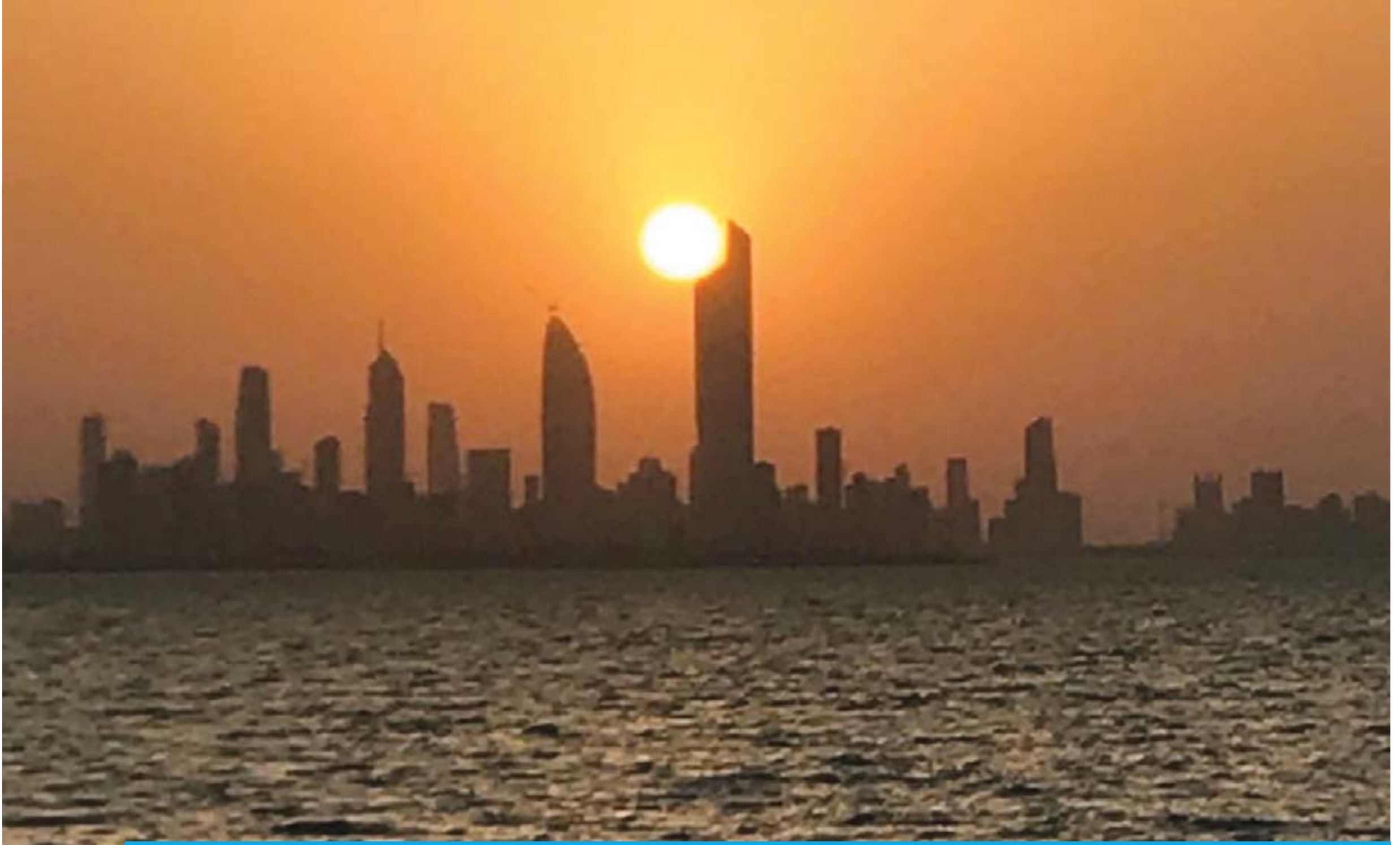
KUWAIT: Kuwait City silhouette during a golden sunset.