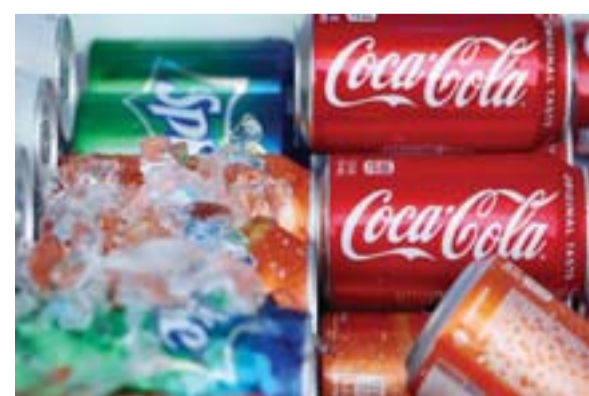
NEW YORK: Soda giant Coca-Cola also recently enacted price hikes in North America, in part because of tariffs on steel and aluminum that raised costs of cans and some production processes. — AFP

The 175-year old Stanley expects to generate $190 million more in revenues in 2018 from price hikes, Allan said at a conference call this month. Soda giant Coca-Cola also recently enacted price hikes in North America, in part because of tariffs on steel and alu-