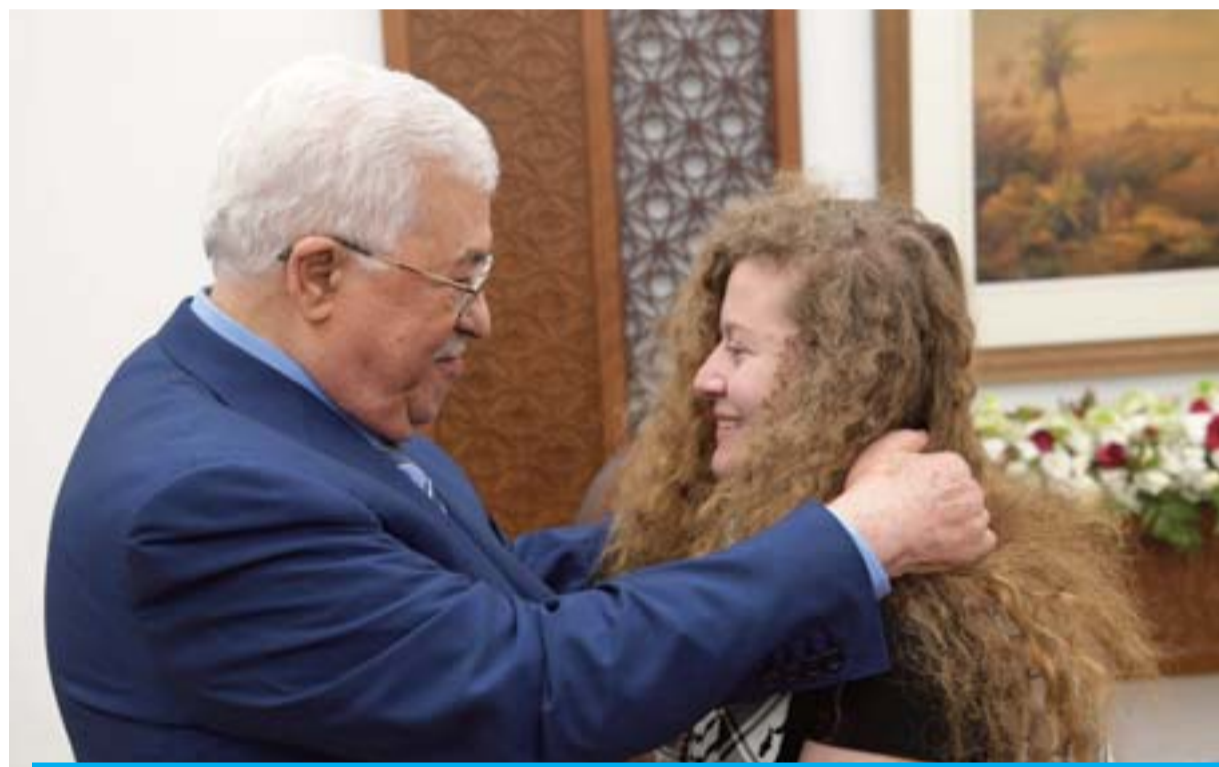
RAMALLAH: Palestinian President Mahmoud Abbas receives freed Palestinian teenager Ahed Tamimi yesterday.