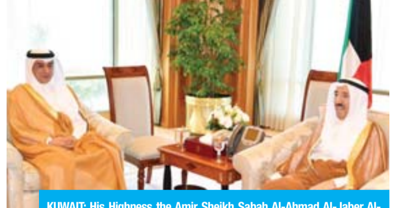
KUWAIT: His Highness the Amir Sheikh Sabah Al-Ahmad Al-Jaber Al-Sabah receiving Minister of Education and Minister of Higher Education Dr Hamid Mohammad Al-Azmi.

KUWAIT: His Highness the Amir Sheikh Sabah Al-Ahmad Al-Jaber Al-Sabah yesterday received at Seif Palace the Acting Prime Minister and Foreign Minister Sheikh Sabah Al-Khaled Al-Hamad Al-Sabah. HH the Amir also received a Special Envoy of the UN Secretary-General for Yemen Martin Griffiths and his accompanying delegation.