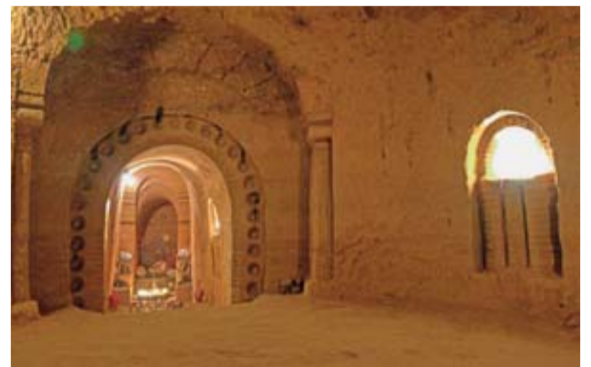
Picture shows a tunnel part of a network of subterranean caves and tunnels.