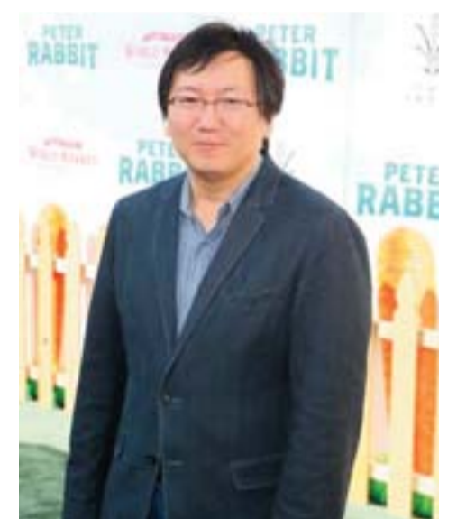
In this file photo Masi Oka attends the premiere of Peter Rabbit, in Los Angeles, California.

The idea was to create something that looked massive and terrifying but, at the same time, very graceful in the water. Oka, a former visual effects artist who worked on the "Star Wars" prequels as well as "Mission to Mars,"