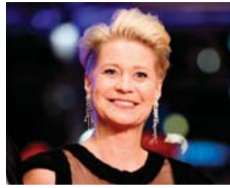
In this file photo Danish actress Trine Dyrholm poses upon arrival to attend the awards ceremony of the 66th Berlinale, Europe's first major film festival of the year, in Berlin.