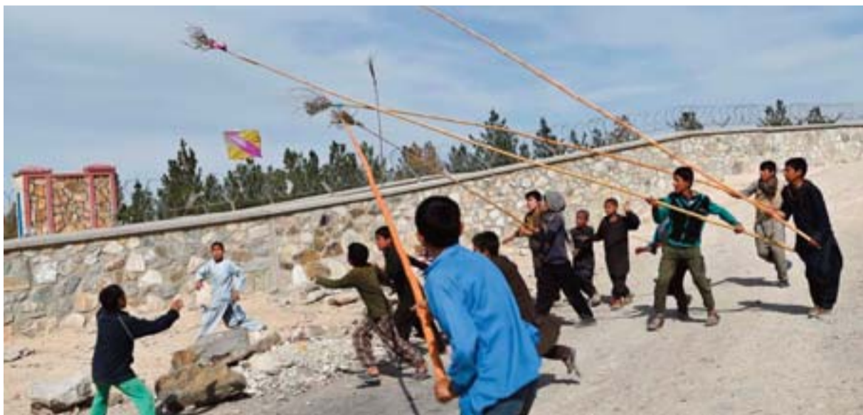
Afghan youths hold bamboo sticks to catch a loose kite after it had its strings cut during a kite battle on a hillside in Kabul.