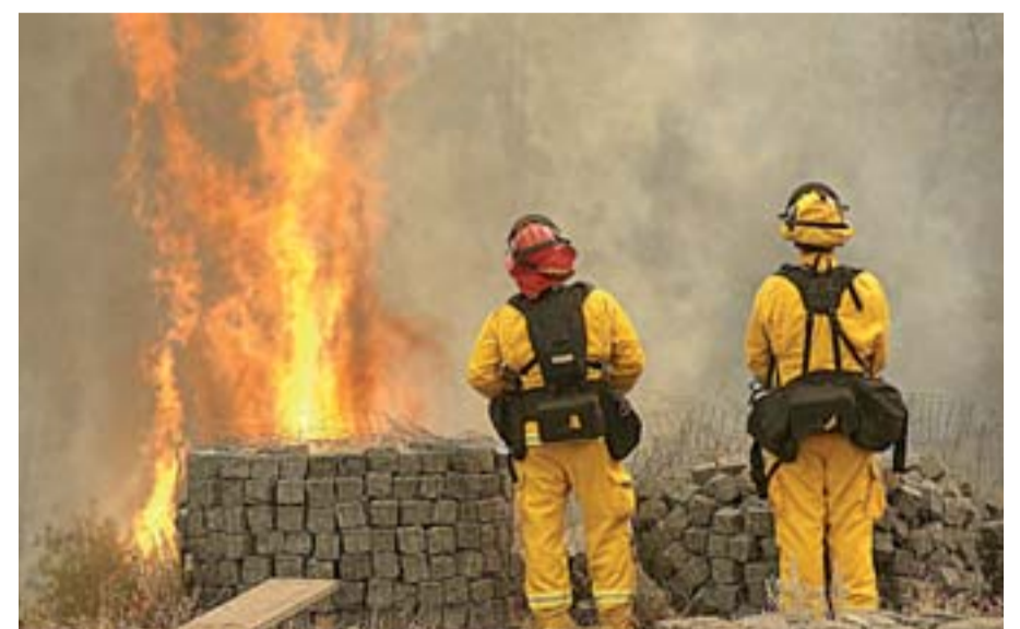
CALIFORNIA: Redding firefighters look on as the Carr Fire moves through the area in Redding, California.

He asked for help, including military aircraft, shelter supplies and water for 30,000 evacuated residents in Shasta County, in north-central California, where the Carr Fire has grown "uncontrollably," the statement said. Brown declared a state of emergency in Shasta and ordered National Guard forces to assist the 3,400 fire personnel already trying to contain the Carr Fire, which has destroyed 500 structures. More than 1,300 firefighters are battling the fast-moving Cranston Fire, which began on Wednesday and forced