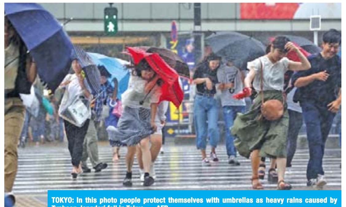
TOKYO: In this photo people protect themselves with umbrellas as heavy rains caused by Typhoon Jongdari fall in Tokyo.

"Fortunately, so far, we haven't seen new flooding," he said. The storm, after unleashing torrential rain over eastern and Japan, moved west and then south yesterday. TV footage showed high waves smashing onto rocks and seawalls southwest of