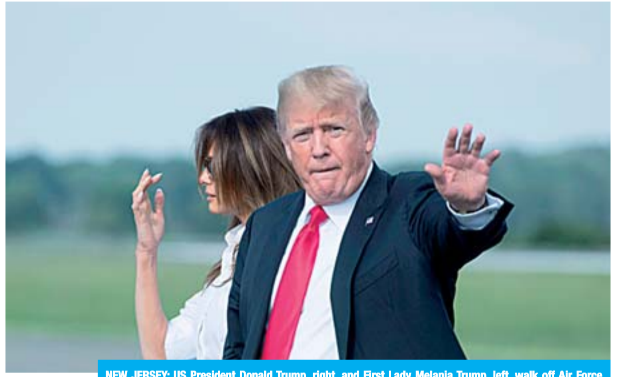
NEW JERSEY: US President Donald Trump, right, and First Lady Melania Trump, left, walk off Air Force One at Morristown Municipal Airport in Morristown, NJ.

Forty-two Democratic members of the House of