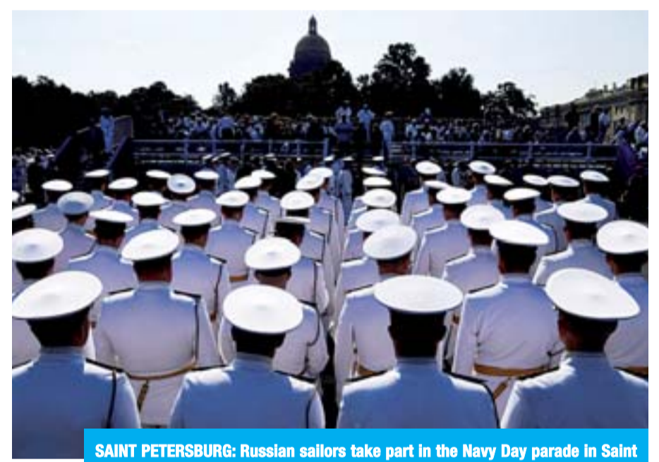
SAINT PETERSBURG: Russian sailors take part in the Navy Day parade in Saint Petersburg.

Putin reviewed a spectacular annual naval display on the Neva River in Saint Petersburg with 39 warships carrying out maneuvers. He told the 4,000 servicemen taking part that the navy "is making a weighty contribution to the fight with international terrorism." "Of course we will continue measures aimed at strengthening and developing the navy, boosting equipment," Putin said. The Navy Day celebrations also included a parade in Russia's Syrian base of Tartus in the Mediterranean for the second time, involving five ships and the Kolpino diesel submarine, the defense ministry said on Facebook.