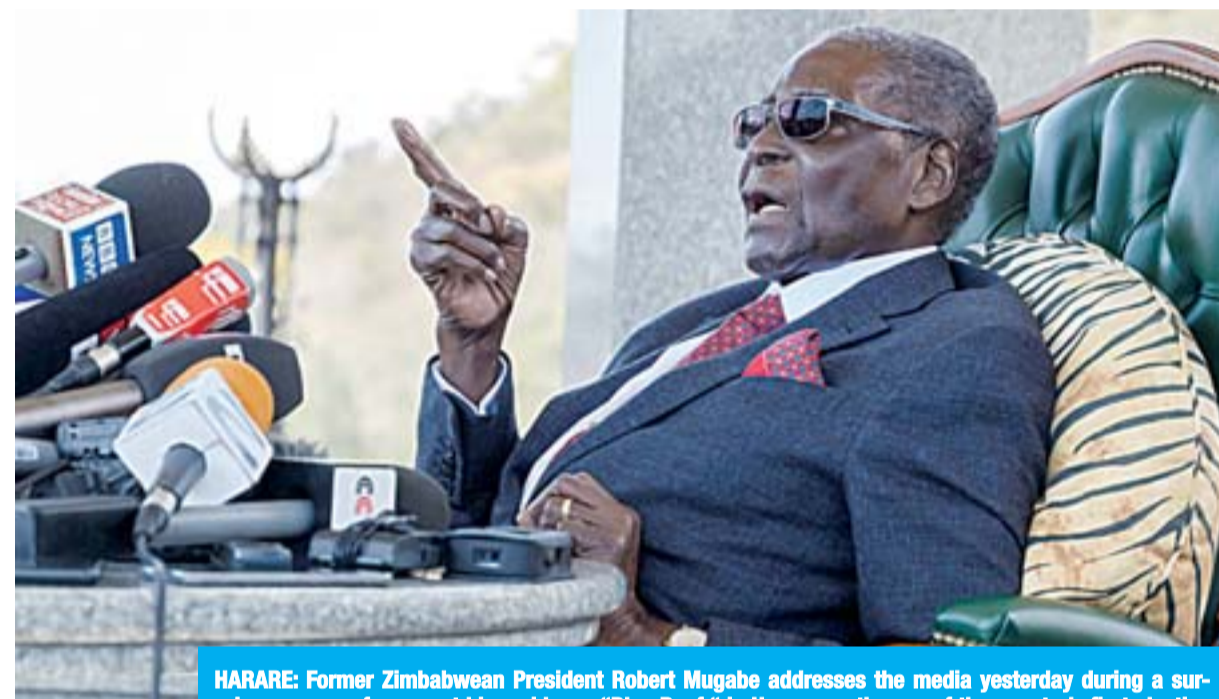
HARARE: Former Zimbabwean President Robert Mugabe addresses the media yesterday during a surprise press conference at his residence "Blue Roof" in Harare, on the eve of the country's first election since he was ousted from office last year.

A 2002 election that gave him another term was marred by violence and denounced as irregular by international observers. He won controversial elections in