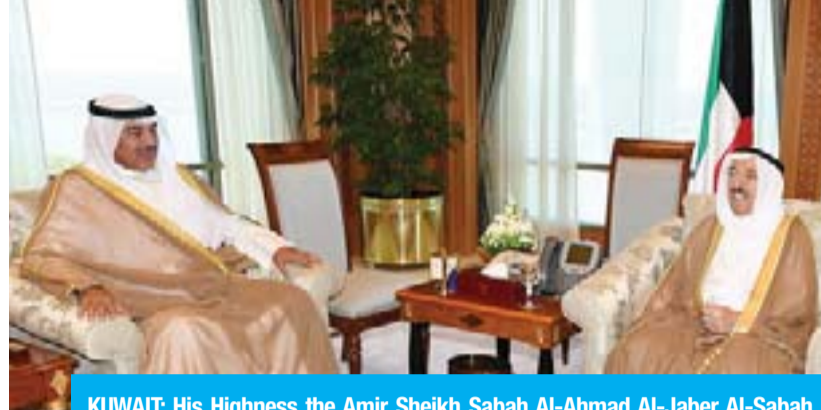
KUWAIT: His Highness the Amir Sheikh Sabah Al-Ahmad Al-Jaber Al-Sabah receiving Acting Prime Minister and Foreign Minister Sheikh Sabah Al-Khaled Al-Hamad Al-Sabah.