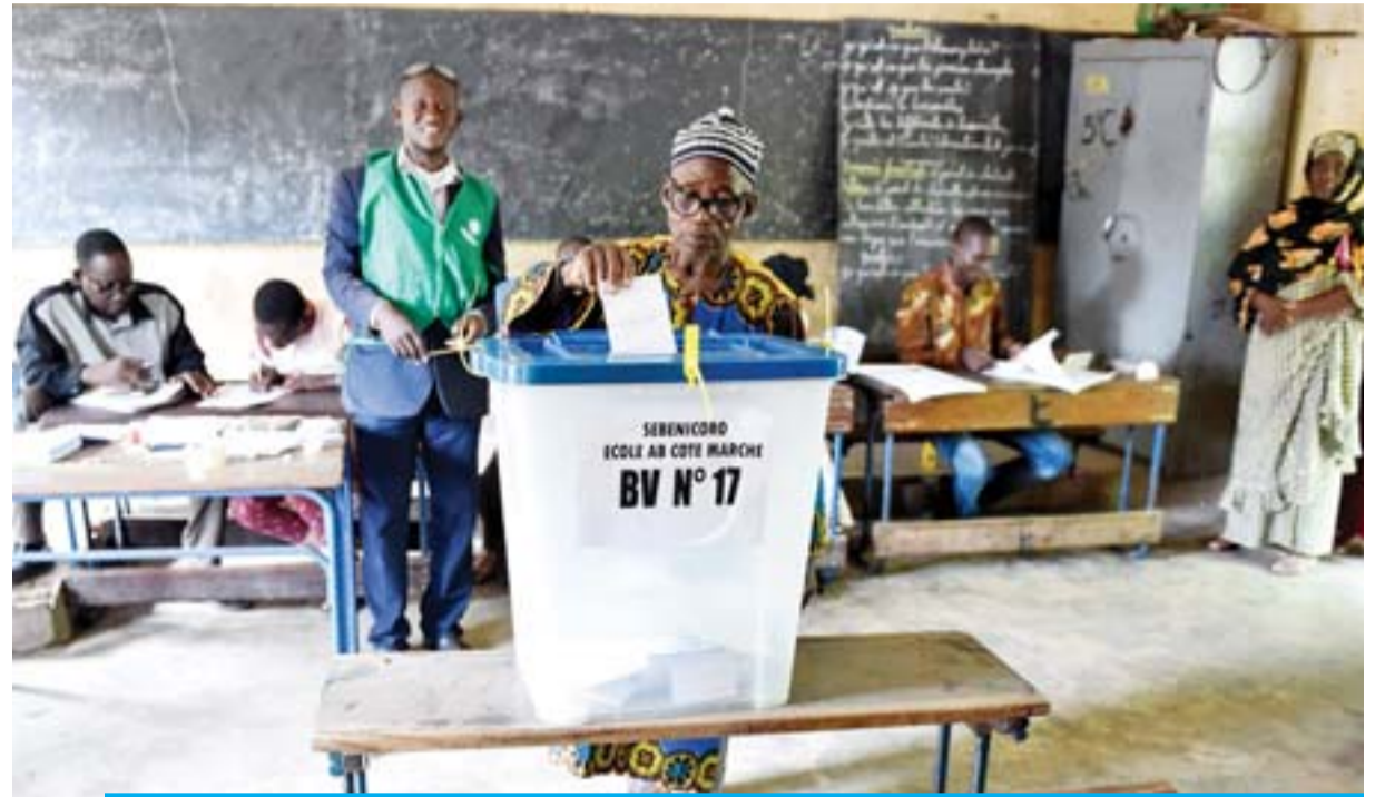
BAMAKO: A man casts his ballot at the polling station in Bamako during Malian presidential election.

Amid concerns that the vote could not be held in some restive areas, more than 30,000 personnel have been drafted to ensure security. The European Union, the African Union (AU), the Economic Community of West African States (ECOWAS) and the International Organization of La Francophonie (OIF) are fielding election observers. Keita's challengers are headed by Soumaila Cisse, 68, a former finance and economy