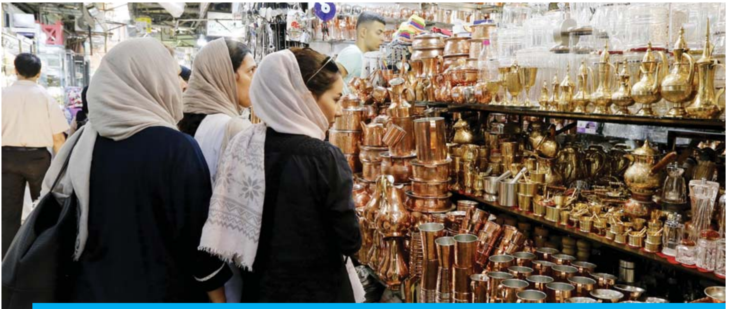
TEHRAN: Iranian women shop at Tehran's ancient Grand Bazaar on Saturday.

Tehran woos local investors with price and tax incentives