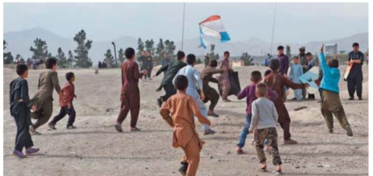
Afghan youths attempt to catch a loose kite after it had its strings cut during a kite battle on a hillside in Kabul.