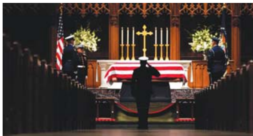
TEXAS: A visitor paying his respect to former US President George H.W. Bush salutes the flag-covered coffin as he lies in repose at St. Martin’s Episcopal Church in Houston, Texas.

Former president George W. Bush tapped the casket twice when he walked up to deliver a rousing eulogy, fighting through tears as he sang the praises of his father and predecessor as commander-in-chief, who died Friday at age 94. “He showed me what it means to be a president who serves with integrity, leads with courage, and acts with love in his heart for the citizens of our