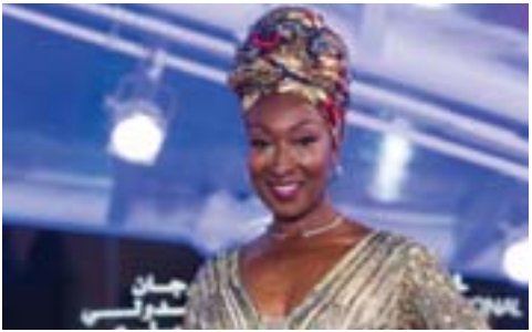
French actress Nadege Beausson Diagne.