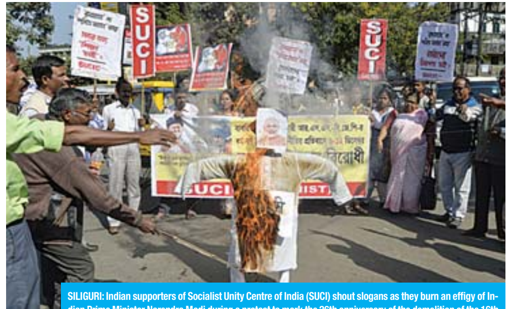
SILIGURI: Indian supporters of Socialist Unity Centre of India (SUCI) shout slogans as they burn an effigy of Indian Prime Minister Narendra Modi during a protest to mark the 26th anniversary of the demolition of the 16th century Babri Masjid located in Ayodhya, in Siliguri.