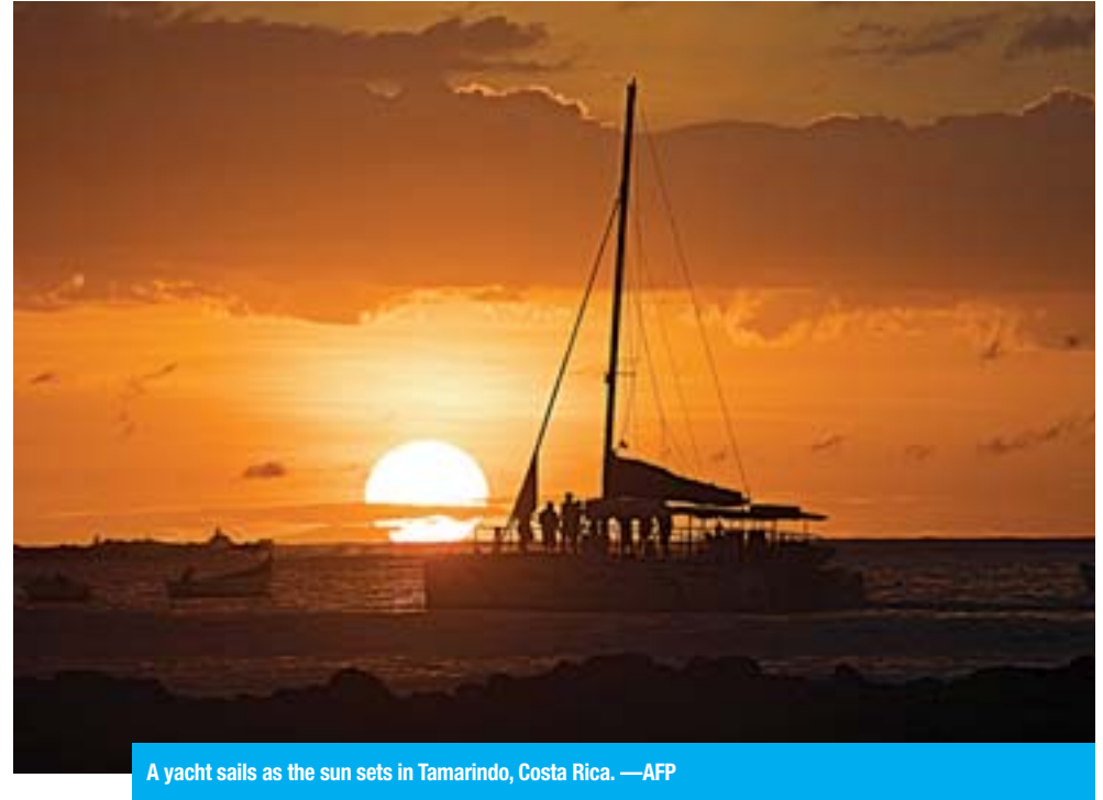
A yacht sails as the sun sets in Tamarindo, Costa Rica.