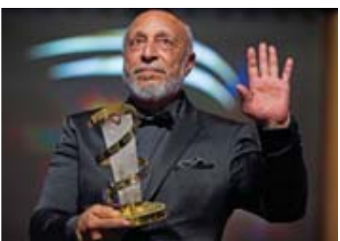
Moroccan actor Jillali Ferhati reacts after receiving a Tribute award during the 17th Marrakech International Film Festival in Marrakech.