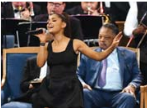
In this file photo Ariana Grande performs during Aretha Franklin's funeral at Greater Grace Temple in Detroit, Michigan.

Pop star Ariana Grande's sugary new music video for the hit "Thank U, Next" is now the fastest to rack up 100 million views on YouTube, the platform told AFP Wednesday. After dropping Friday, the clip needed little more than three days to eclipse South Korea's Psy, whose video for "Gentleman" took a few hours longer to hit 100 million views in 2013. Grande,