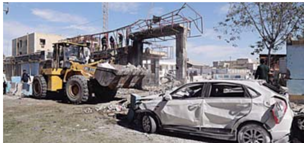
CHABAHAR, Iran: A general view of the scene of a car bombing in front of a police station in the city of Chabahar, in southern Iran. —AFP

In September, hundreds of workers walked off the job at Istanbul's new international airport in protest at poor conditions and work-related deaths on the site. Turkish authorities cracked down, arresting hundreds, according to labour unions. Most were released without charge, but some remained in prison. On Monday, opposition lawmaker Ali Seker said that the government had admitted that "at least 52 workers" have died on the site since construction began in 2015. —AFP