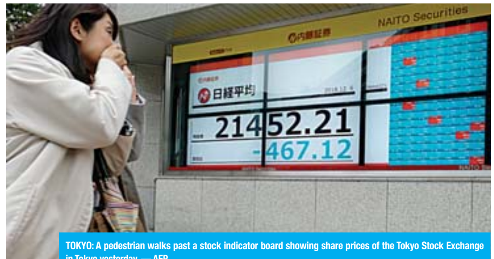
TOKYO: A pedestrian walks past a stock indicator board showing share prices of the Tokyo Stock Exchange in Tokyo yesterday. — AFP

But rising short-term rates also reflect very high borrowing by the US government which is largely using short-term debt to finance the rising deficit. Recent news has contributed to flattening the curve, including a speech on November 28 by Fed chair Jerome Powell interpreted by many as signaling a US slowdown. —AFP