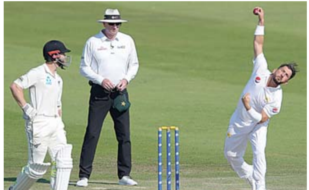
ABU DHABI: Pakistani spinner Yasir Shah (right) delivers the ball as New Zealand captain Kane Williamson (left) looks on during the fourth day of the third and final Test cricket match between Pakistan and New Zealand at the Sheikh Zayed International Cricket Stadium in Abu Dhabi yesterday.

Yasir, whose 14 wickets helped Pakistan level the series 1-1 in Dubai, now has 27 wickets in the three Tests against New Zealand. His 14 for 184 were the second