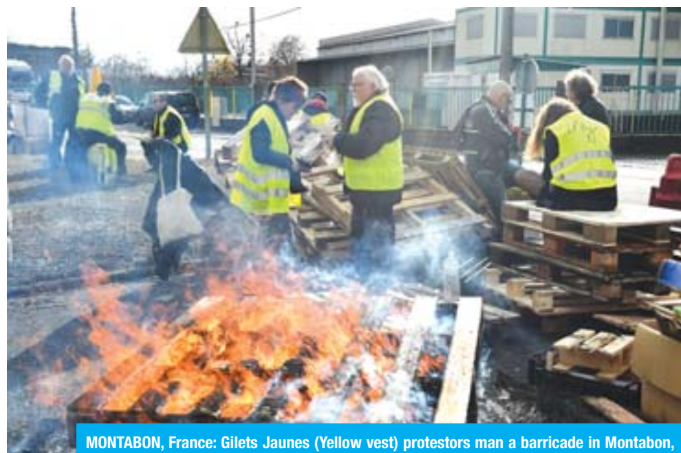
MONTABON, France: Gilets Jaunes (Yellow vest) protestors man a barricade in Montabon, northwestern France, at an access to an oil depot they block since December 2 as part of the Gilets Jaunes protests.

The one-year moratorium on fuel tax rises was announced the day after Philippe, in the first major retreat of Macron’s presidency, said the January 1 fuel tax rise would be postponed for six months. On Wednesday, De Rugy said the period was extended to assuage fears that the unpopular