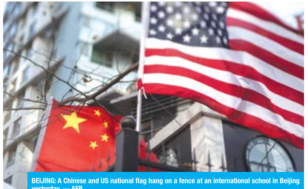
BEIJING: A Chinese and US national flag hang on a fence at an international school in Beijing yesterday.

According to the Bank of England, large corporates are more active than small in preparing for up to a month of disruption. Companies are seeking space for around six months to one year, enough to see them through Britain's departure, but much less than the normal contracts of five years. — Reuters