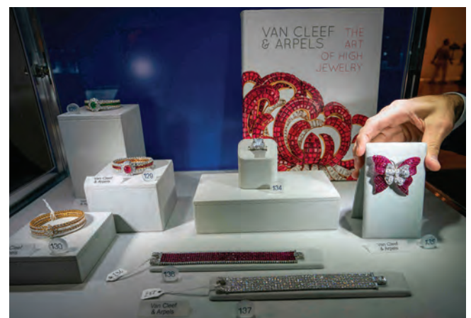
Some of the Sinatra Magnificent Jewels are displayed at Sotheby.