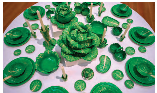
Frank Sinatra's assembled Dodie Thayer pottery lettuceware is displayed at Sotheby.