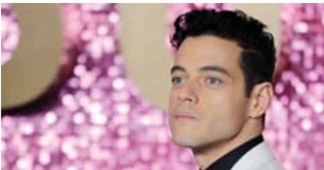
In this file photo US actor Rami Malek poses on the red carpet arriving for the world premiere of the film 'Bohemian Rhapsody' at Wembley Arena in north London.