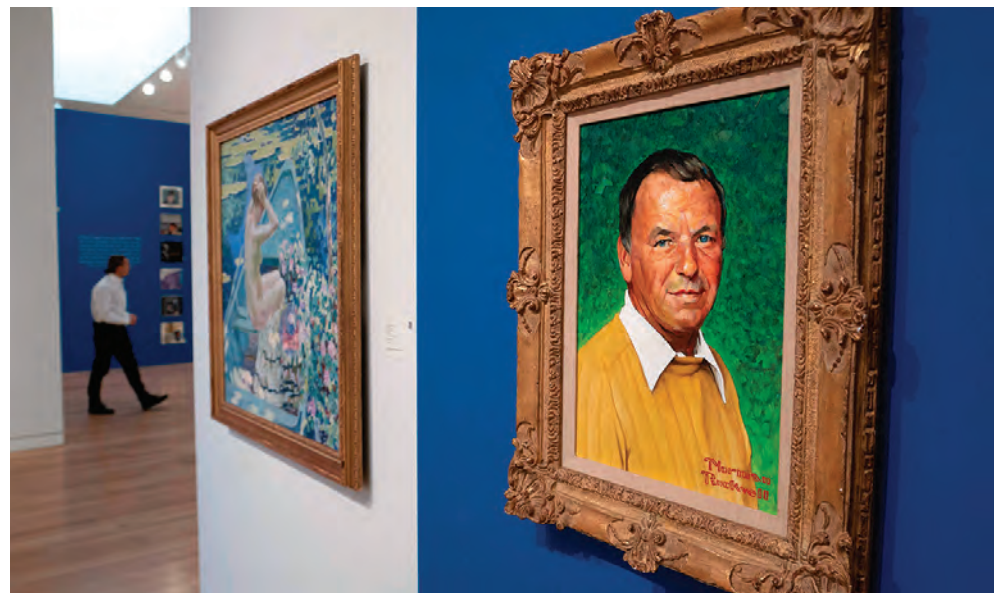
A Norman Rockwell Portrait of Frank Sinatra is displayed at Sotheby's in New York.