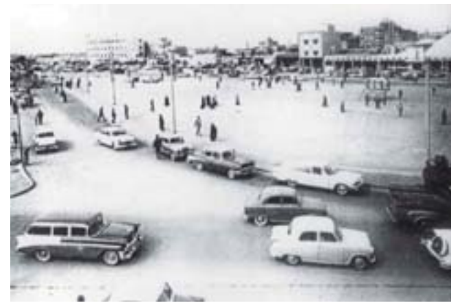
Safat Square in the fifties

poor facility management, and failure to foresee future expansion. Thus, vacant public lands have become a potential space for competing and clashing interests, either between governmental institutions, private companies or non-profit organizations who want government support. Allowing unplanned and random projects to flourish created spaces that are aesthetically unpleasant, without cultural identity and poor environmental quality.