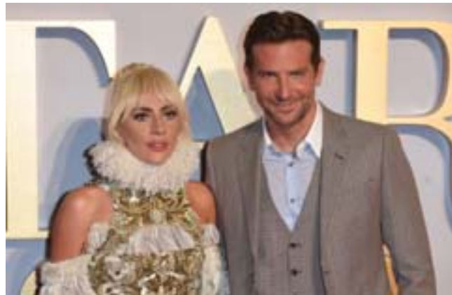
American singer and actress Lady Gaga (left) and American actor and filmmaker Bradley Cooper pose on the red carpet upon arrival for the UK premiere of the film 'A Star is Born' in central London.