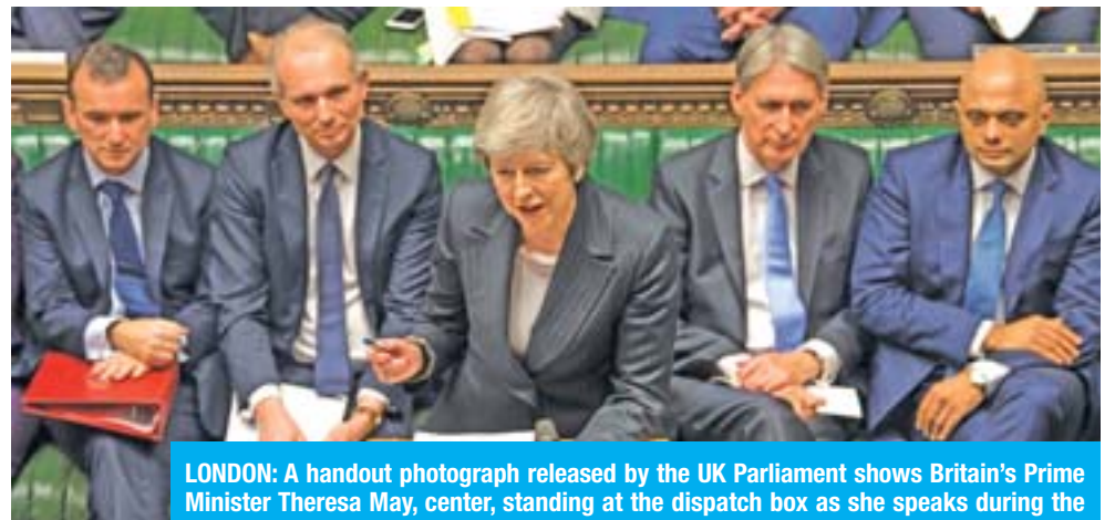
LONDON: A handout photograph released by the UK Parliament shows Britain's Prime Minister Theresa May, center, standing at the dispatch box as she speaks during the weekly question and answer session, Prime Minister's Questions (PMQs), in the House of Commons in London.