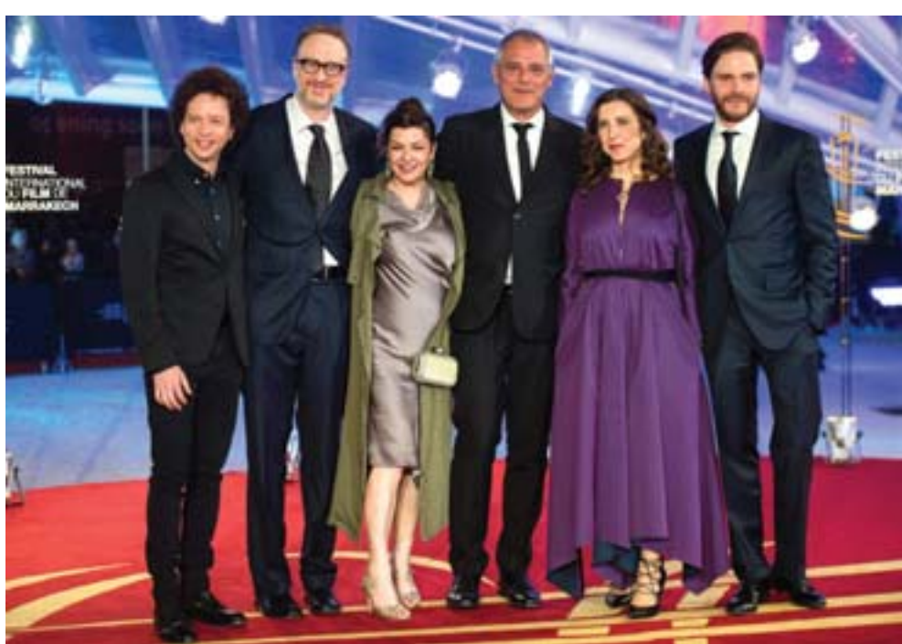
Members of the jury (from left) Mexican film director Michel Franco, US director and president of the jury James Gray, British film director Lynne Ramsay, French director Laurent Cantet, Lebanese film director Hadjithomas Joana, German-Spanish actor Daniel Bruhl attend the 17th Marrakech International Film Festival.