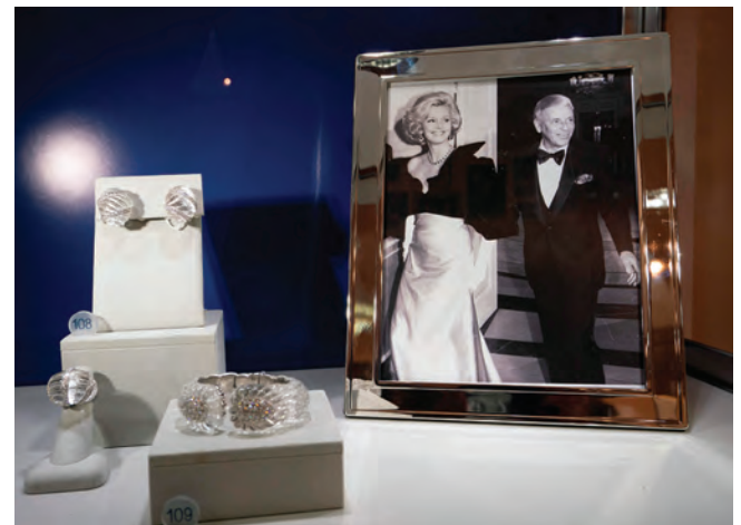
Some of the Sinatra Magnificent Jewels are displayed at Sotheby.