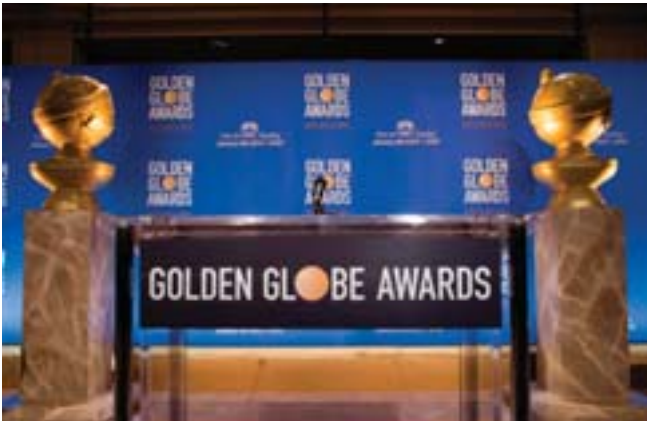
In this file photo shows the view of the atmosphere at The 74th Annual Golden Globe Awards Nominations at The Beverly Hilton Hotel, in Beverly Hills, California.