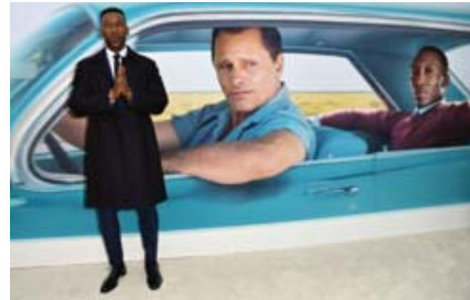
In this file photo actor Mahershala Ali attends the Premiere of 'Green Book' at The Paris Theatre.