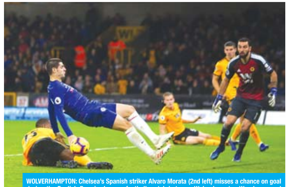
WOLVERHAMPTON: Chelsea's Spanish striker Alvaro Morata (2nd left) misses a chance on goal during the English Premier League football match between Wolverhampton Wanderers and Chelsea at the Molineux stadium on December 5, 2018.

However, on his first Premier League start, 18-year-old Morgan Gibbs-White led the fightback as he fed Raul Jimenez, who drilled a low shot under goalkeeper Kepa Arrizabal-