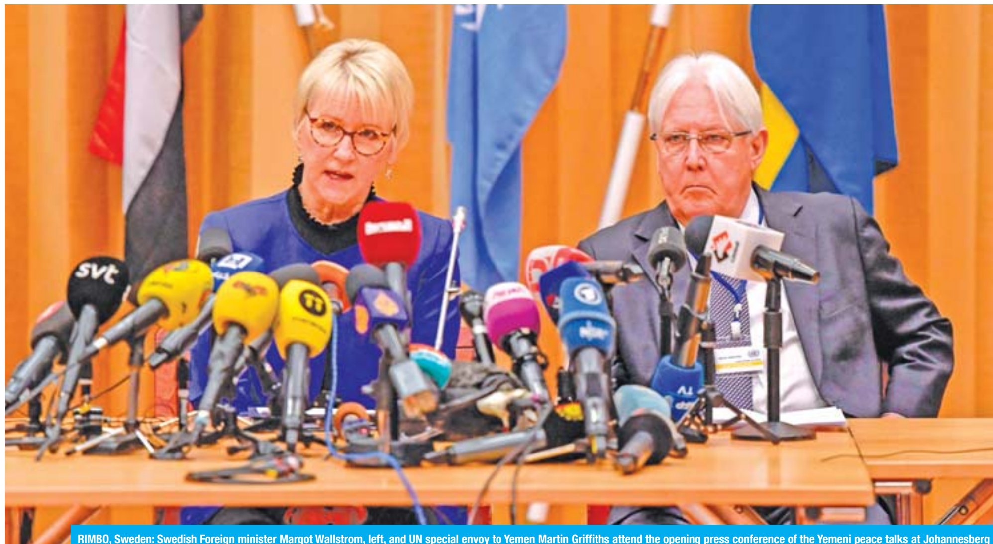
RIMBO, Sweden: Swedish Foreign minister Margot Wallstrom, left, and UN special envoy to Yemen Martin Griffiths attend the opening press conference of the Yemeni peace talks at Johannesburg castle in Rimbo, Sweden.