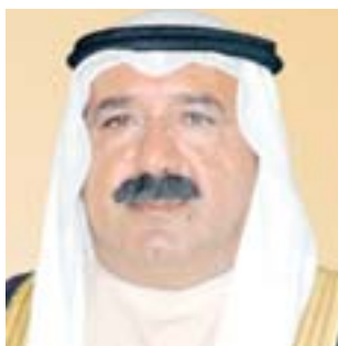
Sheikh Nasser Sabah Al-Ahmad Al-Sabah

It also discussed the economic committee's report on economic and financial sustainability in the country, added the statement, noting SCPD also reviewed a report on the National Fund for Small and Medium Enterprises Development. The meeting also discussed a report by the human and urban development committee on priorities of the government's action plan, in addition to the committee's opinion on housing issues, suggested solutions, and mortgage draft law.