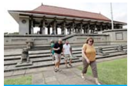
COLOMBO: This file photo shows tourists leaving the Independence Square after a visit in Colombo, Sri Lanka.

"We have cancellations in the region of about 20 percent," said Chandra Mohotti, a manager at the luxury Galle Face Hotel in the capital, Colombo, which has about 200 rooms. "Normally our hotel would be full. We are offering discounts because of the fear that allocations will not be utilized." Peak season for holidaymakers from Europe, a major source of tourists, along with India and China, typically runs from December to March. But numerous flight bookings have been cancelled, especially from Europe, a source at national carrier SriLankan Airlines told Reuters. "The crisis started just when tourists take a decision where to go," said the source, who declined to be named. "(It) has discouraged many of them." Mahinda Rajapaksa, who replaced Ranil Wickremesinghe as