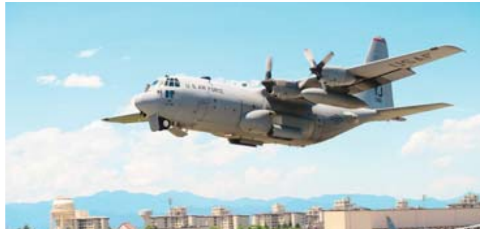
JAPAN: In this photograph courtesy of the US Air Force, a C-130 Hercules takes off during a training exercise at Yokota Air Base, Japan. — AFP

The US military has also experienced difficulties with its Osprey helicopters, with several