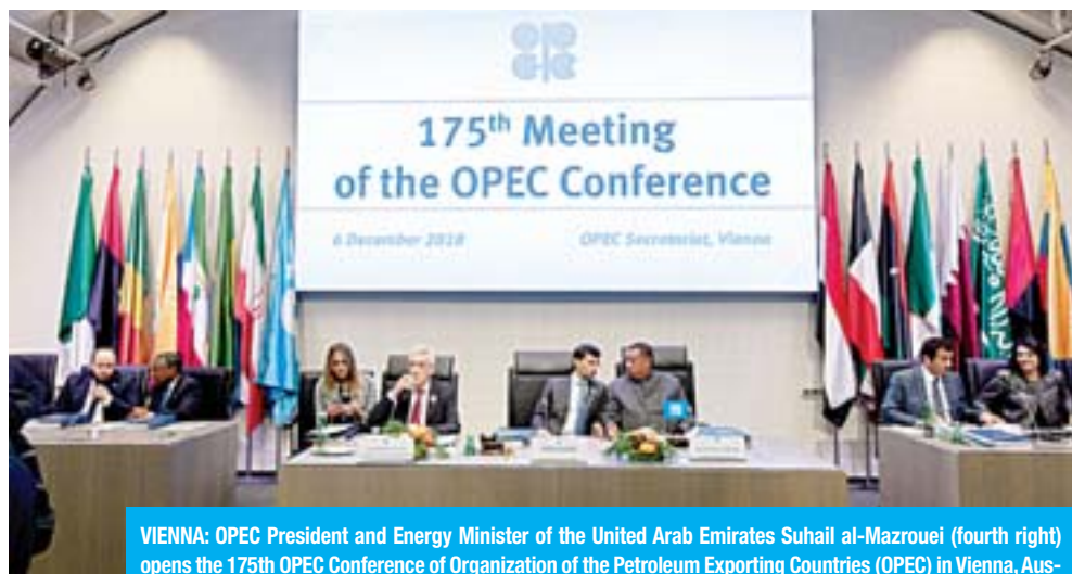
VIENNA: OPEC President and Energy Minister of the United Arab Emirates Suhail al-Mazrouei (fourth right) opens the 175th OPEC Conference of Organization of the Petroleum Exporting Countries (OPEC) in Vienna, Austria yesterday.

Trump has continued to support the kingdom despite worldwide outrage over the murder but he