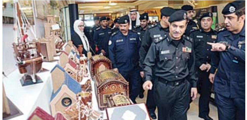
KUWAIT: Interior ministry officials tour an exhibition of handicrafts made by prisoners at Souq Sharq yesterday.