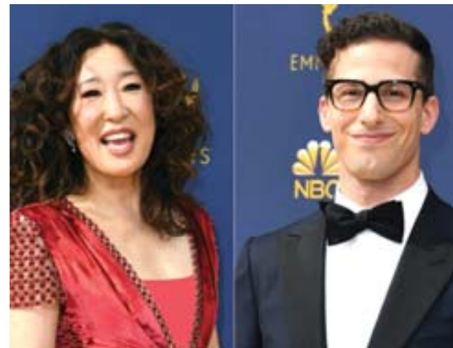
This combination of pictures shows actress Sandra Oh (left) and actor Andy Samberg (right) arriving for the 70th Emmy Awards at the Microsoft Theatre in Los Angeles, California.

The 76th Golden Globes take place on Sunday, January 6 in Beverly Hills. The Oscar nominations come after the Globes this year, on January 22. Hosting the gala will be actress Sandra Oh, who could score a nomination herself for acclaimed TV drama “Killing Eve,” and comedian Andy Samberg, organizers announced Wednesday. — AFP