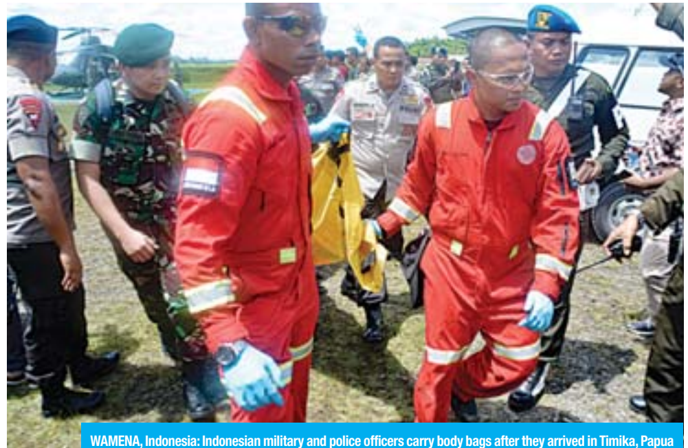
WAMENA, Indonesia: Indonesian military and police officers carry body bags after they arrived in Timika, Papua province.

Cambodia was a popular international destination for couples looking to have babies through commercial surrogacy but the practice was made illegal in 2016. Since then, Cambodia has been cracking down on surrogacy. In 2017, an Australian nurse and two Cambodian assistants were found guilty of running an illegal commercial surrogacy clinic. She was released earlier this year, according to local media reports. Neighboring Thailand has also banned surrogacy and much of the business has shifted to Laos, where dozens of fertility clinics have appeared during the past few years.—Reuters