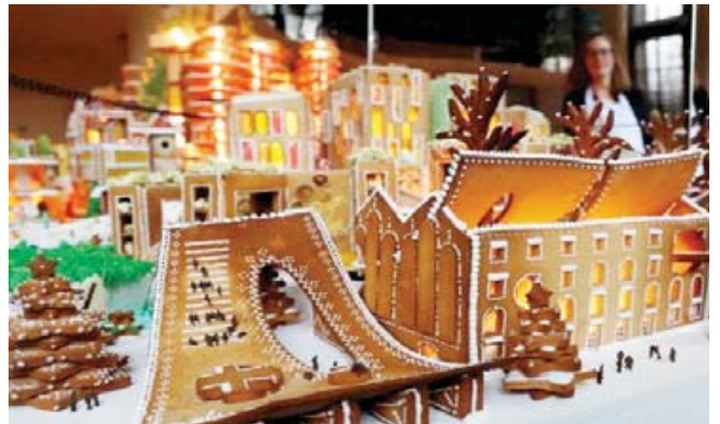
Architects swapped traditional building materials for sugar and spice to create an edible gingerbread city of the future at London's V&A Museum, to show that urban planning can be fun, and tasty.

Architects swapped traditional building materials for sugar and spice to create an edible gingerbread city of the future at London's V&A Museum, to show that urban planning can be fun, and tasty. The annual exhibition, which runs from Dec. 8 to Jan. 6, showcases buildings by architects, designers and engineers who had been asked to create a sustainable and inclusive