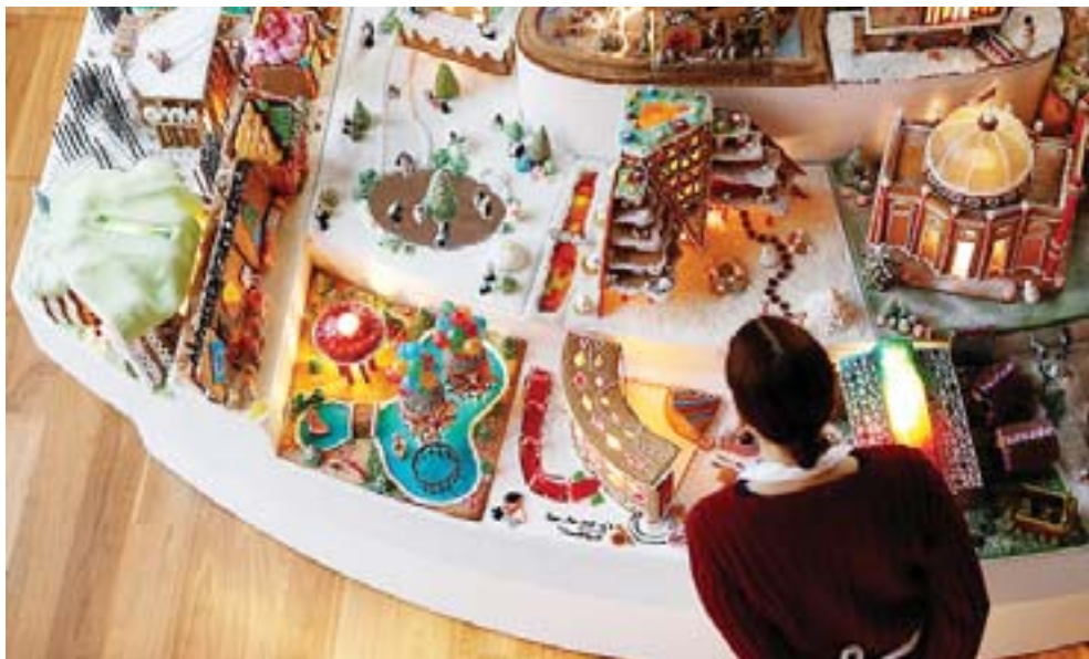
A staff member poses for a photograph next to the Museum of Architecture's Gingerbread City at the V&A Museum, in London.