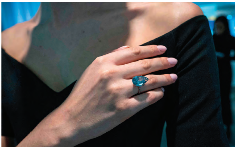
A 10.62-Carat Fancy Vivid Blue Diamond Ring, estimated to sell for $20/30 Million, is displayed at Sotheby. The ring is part of the Lady Blue Eyes: Property of Barbara and Frank Sinatra auction going on November 27-December 7, 2018.