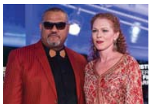
US film director Laurence Fishburne (left) and guest attend the 17th Marrakech International Film Festival.