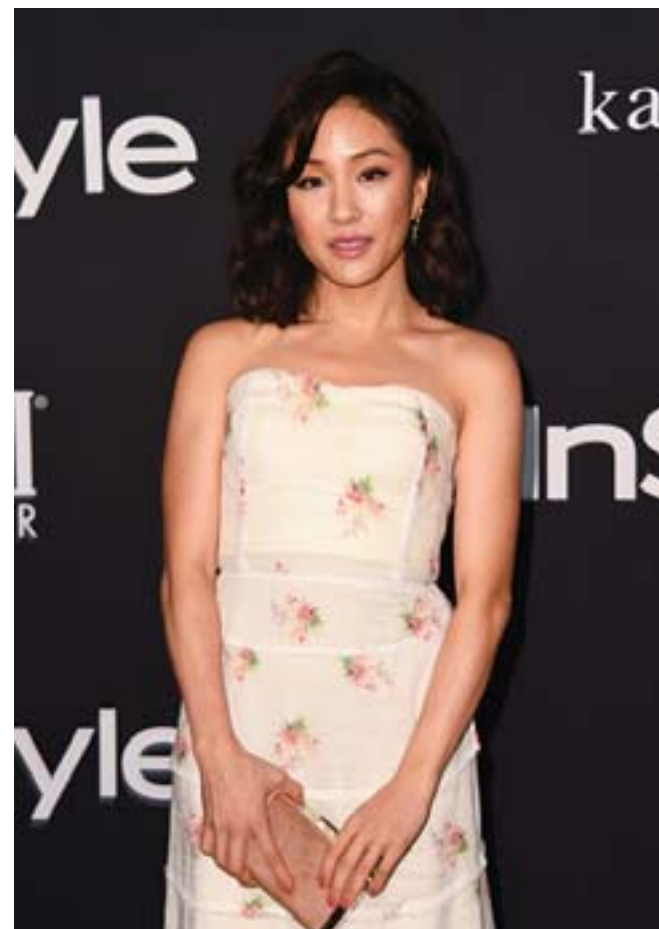
In this file photo Badass Woman award recipient US actress Constance Wu arrives at the 4th Annual InStyle Awards at The Getty Center in Los Angeles.