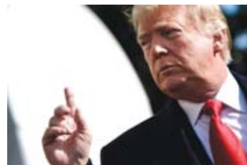
WASHINGTON: In this file photo US President Donald Trump speaks to reporters before walking to Marine One on the South Lawn of the White House in Washington, DC.

Trump has said he does not rule out pardoning his former campaign manager Paul Manafort, who faces prison time for violating federal fraud laws. Under the current separate sovereigns doctrine, states such as New York or Virginia could bring charges against Manafort if Trump pardons him. Such a pardon would be seen as Trump’s way of encouraging other suspects in the Russia probe to decline to cooperate with Mueller, with the suggestion that if they hold