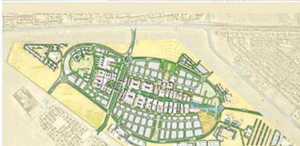
Sabah Al-Salem University City in Al-Shadadiyya to be completed by 2019.