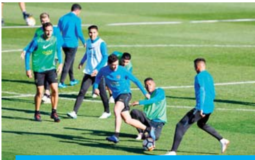
MADRID: Boca Juniors players attend a training session at the Spanish Football Federation (RFEF) headquarters in Las Rozas, northwest of Madrid yesterday.

As punishment, South America's football federation CONMEBOL ruled that River would lose home advantage, and fears over further fan violence meant the game would be played outside Argentina. The second leg is scheduled to be held at Real Madrid's Santiago Bernabeu stadium on Sunday. Boca arrived on Wednesday and with River