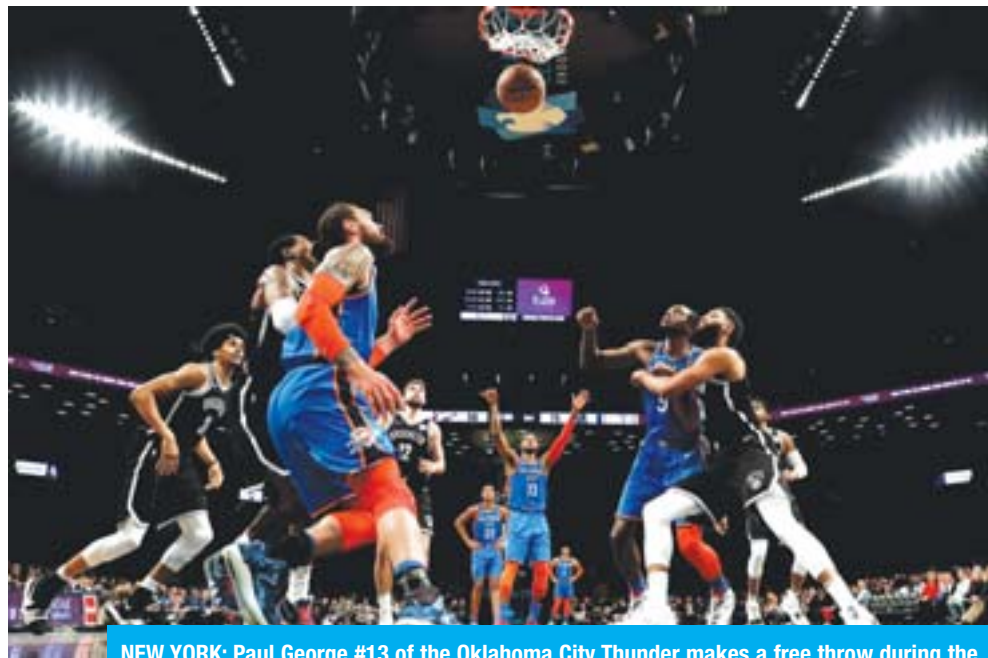
NEW YORK: Paul George #13 of the Oklahoma City Thunder makes a free throw during the third quarter of the game against Brooklyn Nets at Barclays Center on December 05, 2018 in New York City.

Karl-Anthony Towns had 35 points and 12 rebounds, and Minnesota exploded in the fourth