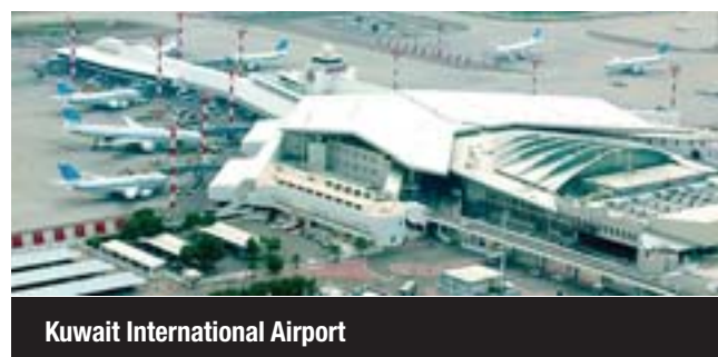
Kuwait International Airport

Kuwait's airport is yet another example of random design policymaking, which perhaps magnifies conflicting private and governmental interests. The architecture of renowned Japanese architect Kenzo Tange has been morphed into a completely different building. In the 1980s, it was considered an architectural masterpiece. However, after the first Gulf War, it underwent renovation, which altered some of its originality and was further transformed when the government allowed the private sector to add a mall and parking structure as an extension. Moreover, the airport has been divided into smaller terminals for local carriers Kuwait Airways and Jazeera Airways. The new buildings are not connected to the old airport and are completely out of context and form. A new airport designed by Foster and Partners recently started construction and it is unclear how the new building will integrate into the current location.