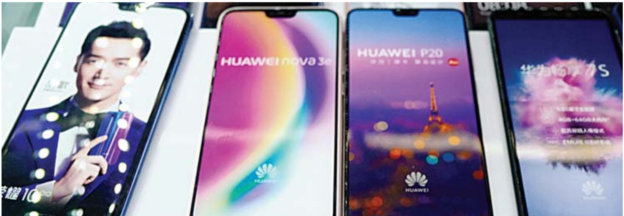
SHANGHAI: This file photo shows a Huawei logo in a shop in Shanghai. China reacted furiously yesterday after a top executive and daughter of the founder of Chinese telecom giant Huawei was arrested in Canada following a US extradition request, threatening to rattle a trade war truce with the United States. (See Page 38, 40)