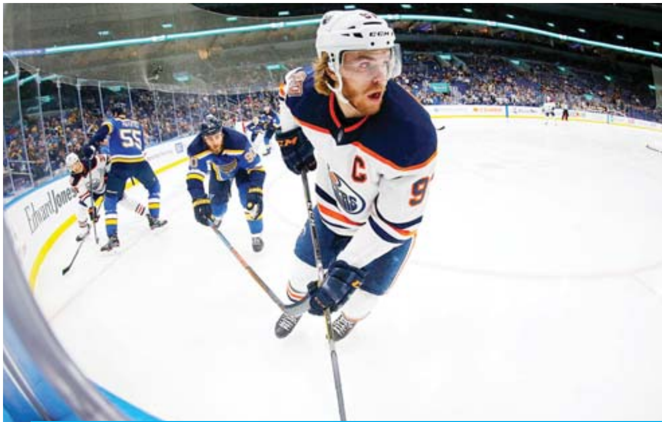
ST LOUIS: Connor McDavid #97 of the Edmonton Oilers looks to pass the puck at the Enterprise Center on December 5, 2018.

Timo Meier collected one goal and two assists, and Joe Thornton notched three assists as host San Jose thumped Carolina. Martin Jones made 39 saves for the Sharks, who have won two in a row. Barclay Goodrow, Tomas Hertl, Meier, Joe Pavelski and Marcus Sorensen notched goals for San Jose, with Kevin Labanc recording two assists. Lucas Wallmark scored for the Hurricanes, who have just one win in five games (1-3-1). Curtis McElhinney made 18 saves.