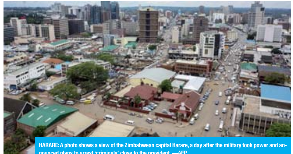
HARARE: A photo shows a view of the Zimbabwean capital Harare, a day after the military took power and announced plans to arrest 'criminals' close to the president.