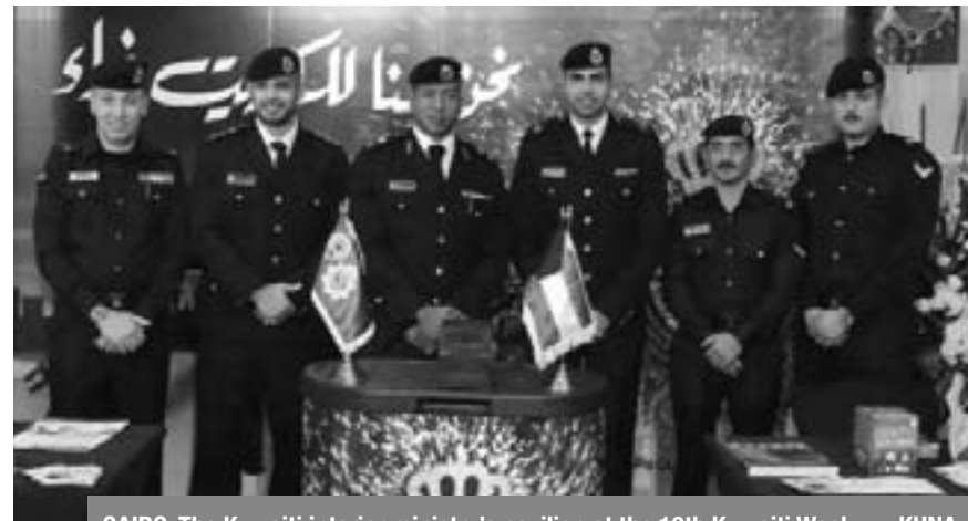
CAIRO: The Kuwaiti interior ministry's pavilion at the 10th Kuwaiti Week.