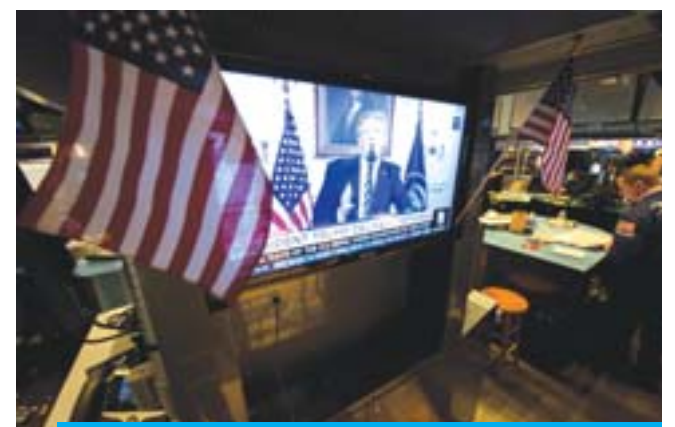
NEW YORK: A live feed of US President Donald Trump speaking is projected on the floor at the closing bell of the Dow Industrial Average at the New York Stock Exchange in New York.

US financial markets were little moved by the data. The low level of claims suggests strong job growth despite hurricane-related disruptions in September. Employment gains could, however, slow as companies struggle to find qualified workers, which economists expect will boost sluggish wage growth. The claims report also showed the number of people still receiving benefits after an