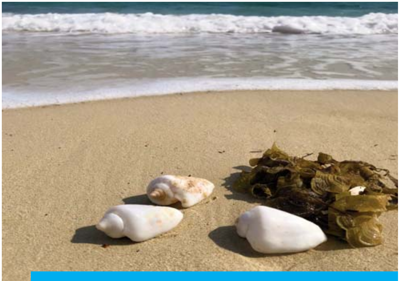
Bnaider is one of the most popular weekend destinations for people in Kuwait.