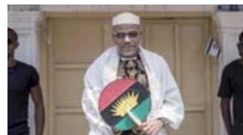
File photo shows political activist and leader of the Indigenous People of Biafra (IPOB) movement, Nnamdi Kanu.

Police said the measures were "to ensure adequate security and safety of lives and properties before, during and after the elections". "Police personnel deployed for the election are under strict instructions to be polite and civil but firm in the discharge of their duties and other responsibilities," it added. But the tactics are being seen as heavy handed. "This is an unprecedented deployment. It's an aberration. It's like we are in a war situation. For God's sake, this is an election," security consultant