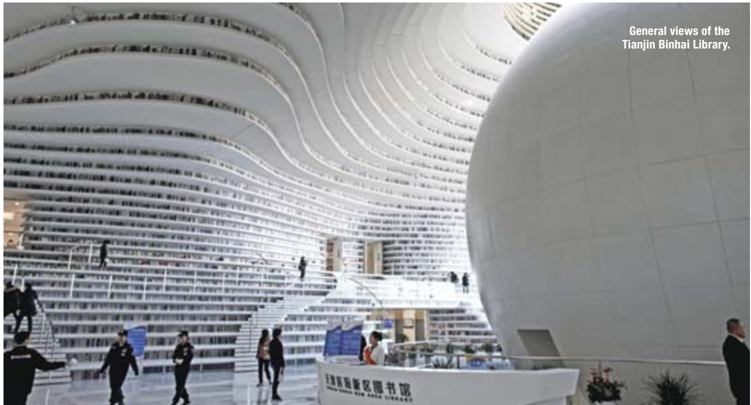
General views of the Tianjin Binhai Library.

An essential part of the original concept was for the upper bookshelves to be accessible via rooms placed behind the atrium, MVRDV told AFP, but a fast-tracked construction schedule