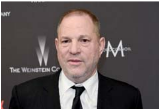
In this Jan. 8, 2017, file photo, Harvey Weinstein arrives at The Weinstein Company and Netflix Golden Globes afterparty in Beverly Hills.

Accuses its leadership of being complicit