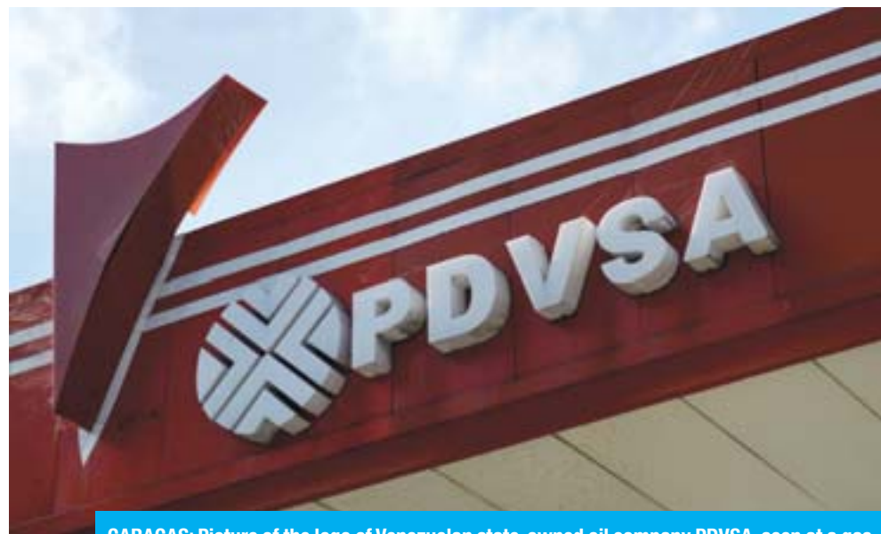
CARACAS: Picture of the logo of Venezuelan state-owned oil company PDVSA, seen at a gas station in Caracas.

“ PDVSA, only source of foreign exchange ”