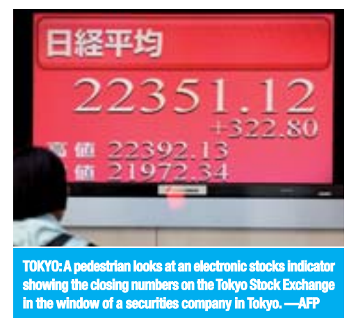
TOKYO: A pedestrian looks at an electronic stocks indicator showing the closing numbers on the Tokyo Stock Exchange in the window of a securities company in Tokyo.

Vanquishing deflation, or a state of falling prices that has weighed on Japan for more than 15 years, has been among the top goals of the