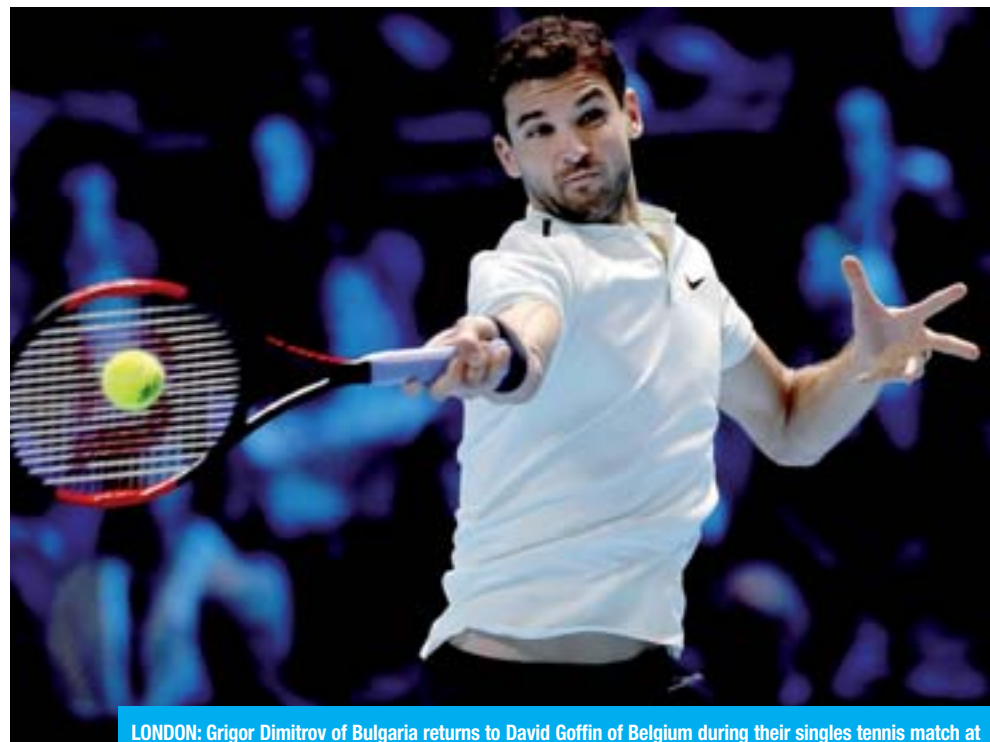
LONDON: Grigor Dimitrov of Bulgaria returns to David Goffin of Belgium during their singles tennis match at the ATP World Finals at the O2 Arena in London.

racing into a 3-0 lead after winning nine games in a row.