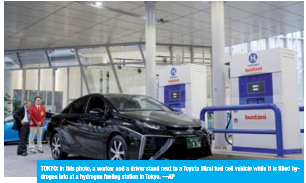
TOKYO: In this photo, a worker and a driver stand next to a Toyota Mirai fuel cell vehicle while it is filled hydrogen into at a hydrogen fuelling station in Tokyo.

vide electricity and heat for homes. Detroit-based General Motors Co., Mercedes-Benz of Germany, Japan's Honda Motor Co. and Hyundai of South Korea have also developed fuel cell vehicles that are on the roads in extremely limited numbers. The global stock of electric vehicles will soon surpass 2 million, according to the International Energy Agency. It's projected to climb to between 9 million-20 million by 2020. Fuel cell vehicles are scarcely a presence.