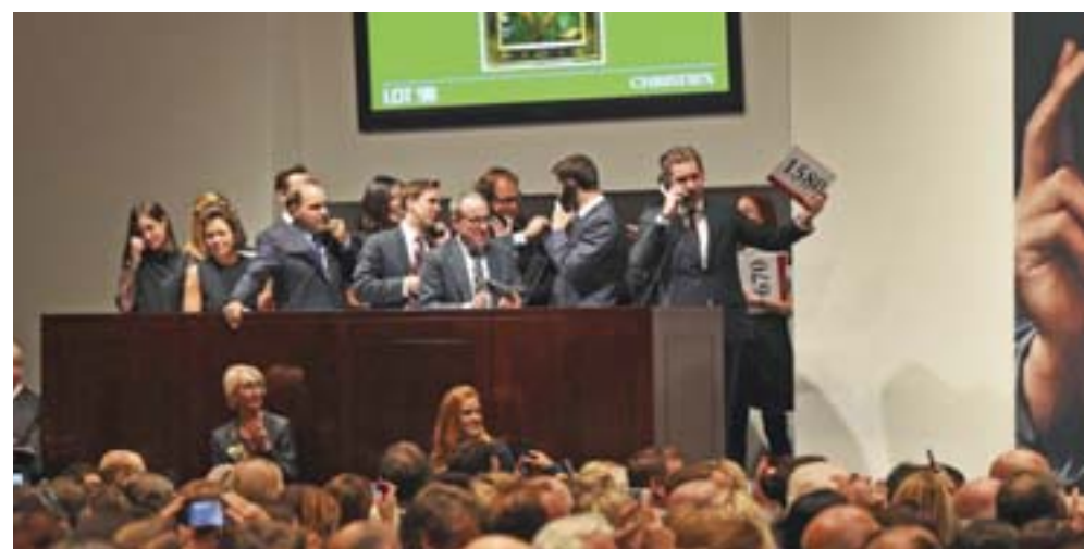
Christie's employees take bids for Leonardo da Vinci's "Salvator Mundi" at Christie's New York.