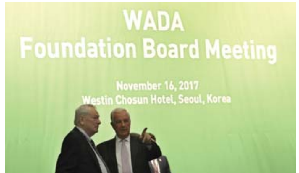
SEOUL: World Anti-Doping Agency (WADA) President Craig Reddie, right, talks with IOC member Richard Pound from Canada before the start of the WADA's foundation board meeting in Seoul.

Force India's 177 — four points more than last year's haul will cost the Silverstone-based