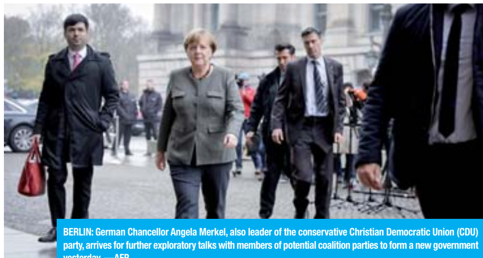
BERLIN: German Chancellor Angela Merkel, also leader of the conservative Christian Democratic Union (CDU) party, arrives for further exploratory talks with members of potential coalition parties to form a new government yesterday. —AFP

But he added that it would be "a breach of security for anybody to be found within the vicinity of the governor's office without authorization after office hours". —AFP