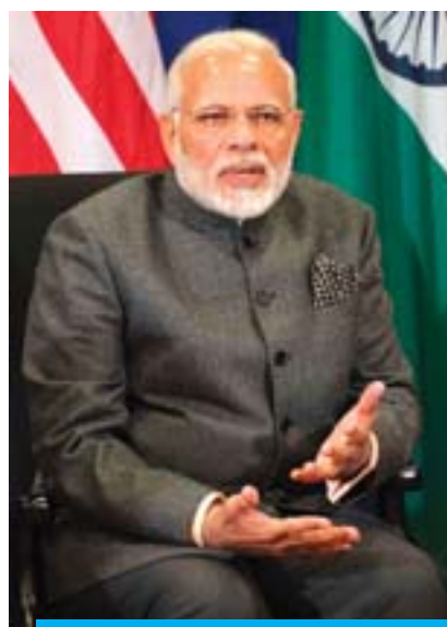
Indian Prime Minister Narendra Modi

The survey was conducted in February and March, a few months after Modi withdrew most high-value bank notes in a shock move aimed at illegal wealth, but which put millions of people in difficulty as cash was sucked out of the economy. Modi defended the measure as an attack on the rich hiding their wealth from the taxman and said gains would come to the poor. Economic growth eased to a three-year low in the June quarter and experts said part of the reason was that the withdrawal of most of the currency had hurt consumer demand in a largely cash-driven economy. A poorly implemented goods-and-services tax that went into