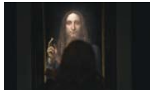
This file photo taken on November 03, 2017 shows Leonardo da Vinci's "Salvator Mundi" on display at Christie's New York during a press preview for the Post-War & Contemporary Art Evening Sale.