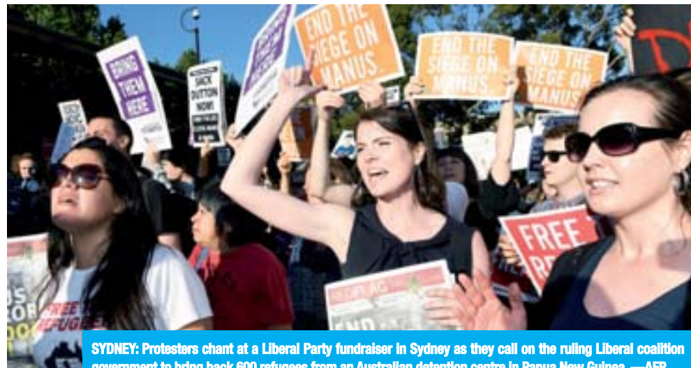
SYDNEY: Protesters chant at a Liberal Party fundraiser in Sydney as they call on the ruling Liberal coalition government to bring back 600 refugees from an Australian detention centre in Papua New Guinea.

town halls are a mix of stump speech and off-the-cuff observations, usually involving 'battler' stories she's heard from locals on the campaign trail: Claims that foreigners are buying up agricultural land and immigrants are not paying taxes; complaints about crippling energy prices and government handouts to Aboriginals; support for a ban on Muslim migrants. Hanson's rhetoric can be blunt, and draws almost instant condemnation in the cities, where she's often viewed as extreme. But in her rural heartland, where one town can be