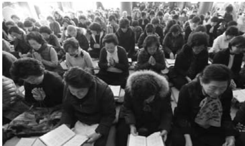
SEOUL: Parents pray for their children's success in the Scholastic Aptitude Test at the Jogye Temple in Seoul, South Korea.

"After lunch as we were exiting the hall a huge explosion shook the hall, shattering glass and causing chaos and panic," Harun Mutaref, who was at the gathering said. "I saw many bodies including police and civilians lying in blood." An AFP photographer said the windows of the wedding hall had been shattered by the force of the blast and a vehicle parked outside was on fire. Dozens of police and intelligence officers have swarmed the area and blocked access to the public. Photos posted on Twitter showed multiple bodies of men lying on top of each other in a muddy street and in a drain, and people dragging away the wounded. Noor, a senior leader of the Tajik-dominated Jamiat-e Islami party, has been an outspoken critic of Ghani and the National Unity Government. —AFP