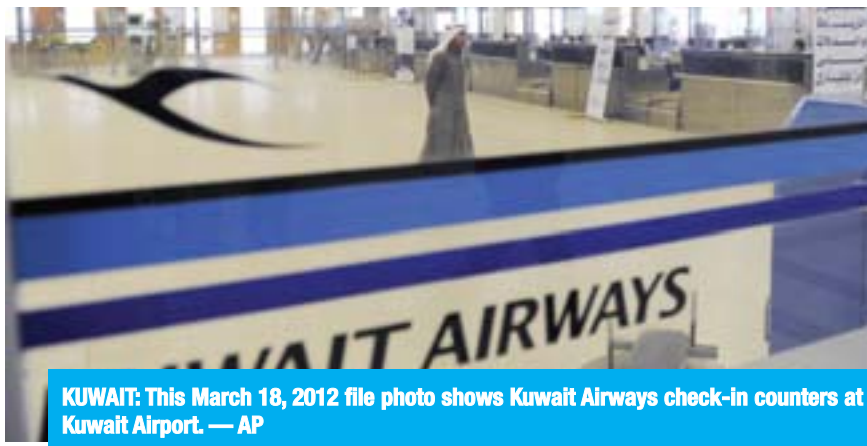
KUWAIT: This March 18, 2012 file photo shows Kuwait Airways check-in counters at Kuwait Airport.

By tomorrow, it will be mostly sunny with highest temperatures expected between 27-30 degrees, with southeastern fluctuating winds. Weather by the evening will be cloudy, with lowest expected temperature between 9-12 degrees with southeastern winds between 06-28 km/h. — KUNA