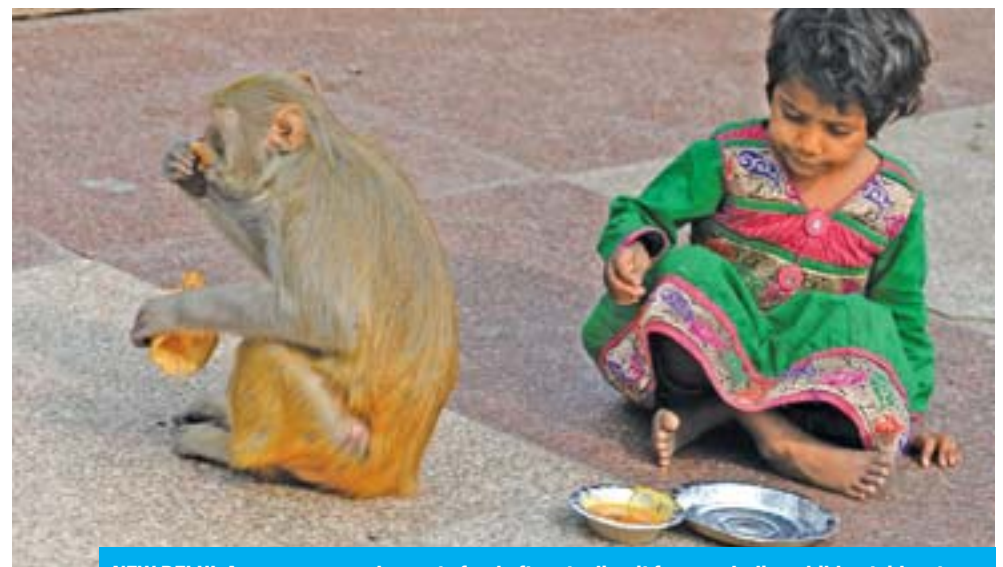
NEW DELHI: A macaque monkey eats food after stealing it from an Indian child outside a temple in New Delhi yesterday.

effect in July has further unsettled small businesses, many of which are part of the bedrock of the BJP's political base. But the poll found that more than 80 percent of those surveyed said economic conditions were good, up 19 percentage points since just before the 2014 election. "Overall, seven-in-ten Indians are now satisfied with the way things are going in the country. —Reuters