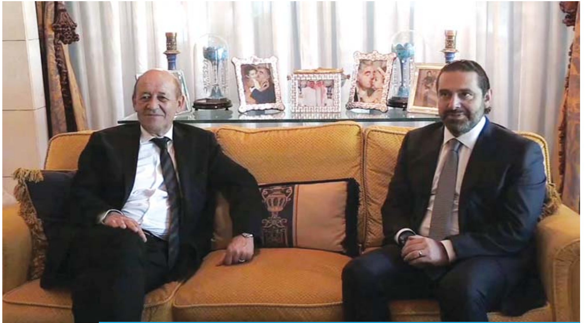
RIAD: French Foreign Minister Jean-Yves Le Drian (left) meets with Lebanese Prime Minister Saad Hariri in the Saudi capital Riyadh yesterday.