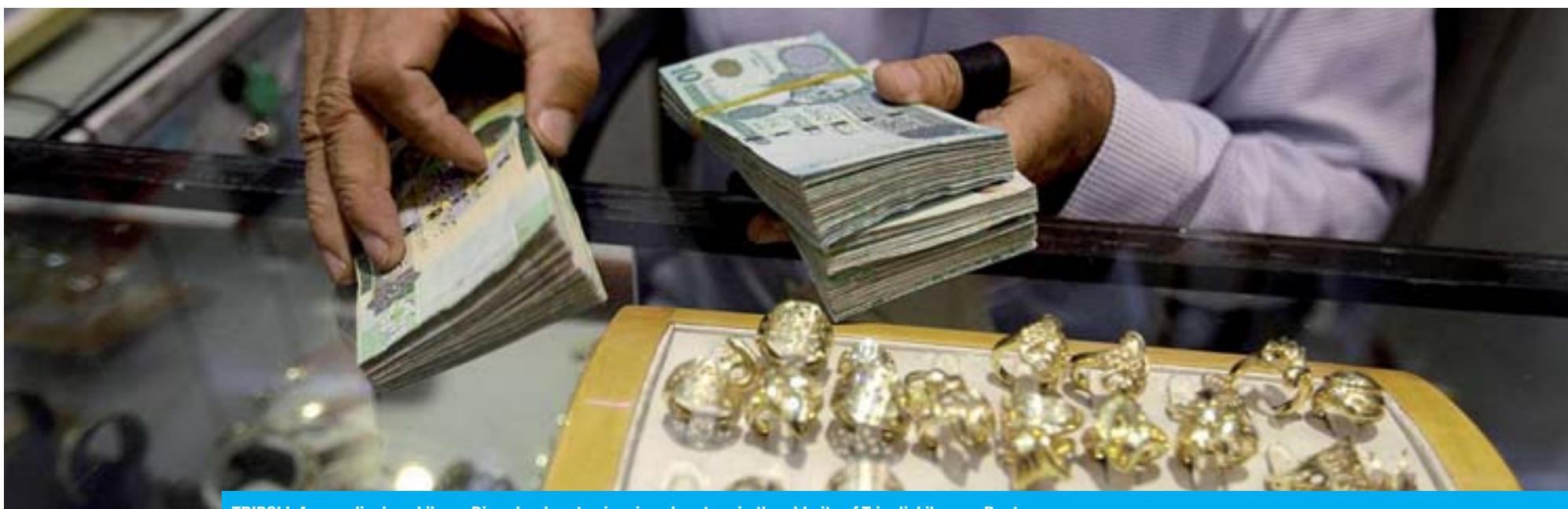
TRIPOLI: A man displays Libyan Dinar bank notes in a jewelry store in the old city of Tripoli, Libya.