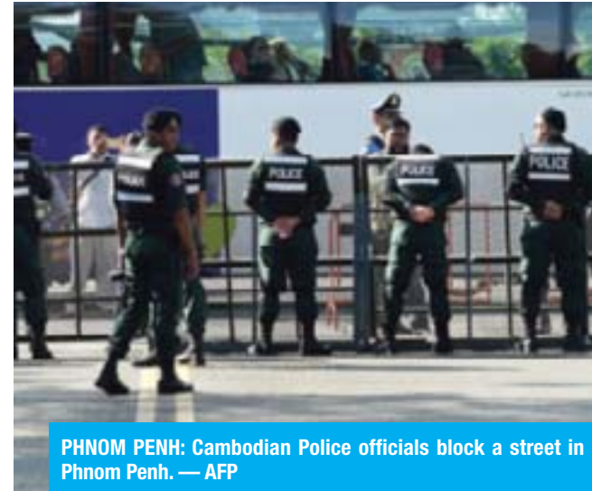
PHNOM PENH: Cambodian Police officials block a street in Phnom Penh.