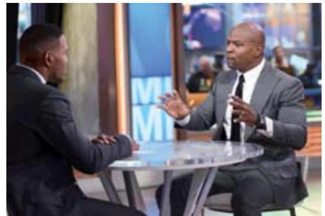
This image released by ABC shows actor Terry Crews, right, with co-host Michael Strahan during a segment on "Good Morning America," Wednesday, Nov 15, 2017, in New York.

pany, Miramax, also names The Weinstein Co. as a defendant and accuses its leadership of being complicit in Weinstein's systematic harassment and abuse of women.