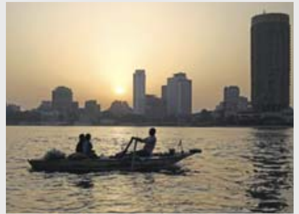
Egyptian fishermen row on the Nile River in Cairo.

A famous Arab singer will stand trial next month in her native Egypt over a video clip in which she advises a concert fan against drinking from the Nile River, officials said Wednesday. The clip shows Sherine Abdel-Wahab, widely known by her first name, saying "You are better off drinking Evian," a reference to a French brand of mineral water.