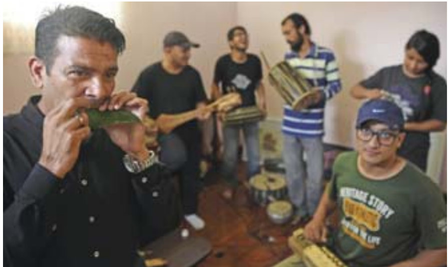
Nepali band 'Night' gather for a rehearsal during an interview with AFP in Kathmandu.

Nepal's musical heritage is enjoying a revival as young musicians fuse the sounds of traditional instruments once at risk of disappearing with lyrics that examine the modern challenges facing the country. The Himalayan country has a rich folk tradition, but its unusual traditional instruments—which include a leaf from a native tree that is played like a harmonica—were dying out as younger generations moved towards Western music styles. That was until bands such as Night, which formed in 2006 as a metal group, decided to create a modern take on its indigenous music.