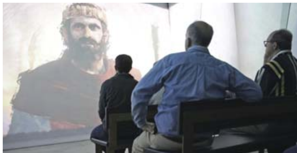
Visitors watch an animation film about King David as they go through an exhibit on the Old Testament.

Testament, displaying artifacts and manuscripts from the Green family as well as the Israel Antiquities Authority. The museum also shows items on loan from institutions including the British Museum and Paris Louvre. The "Washington Revelations" theater ride takes museum-goers on a simulation "flight" over the nation's capital, pointing out biblical references throughout the city, while the "impact" floor traces the Bible's societal influence—particularly stateside—on politics, edu-