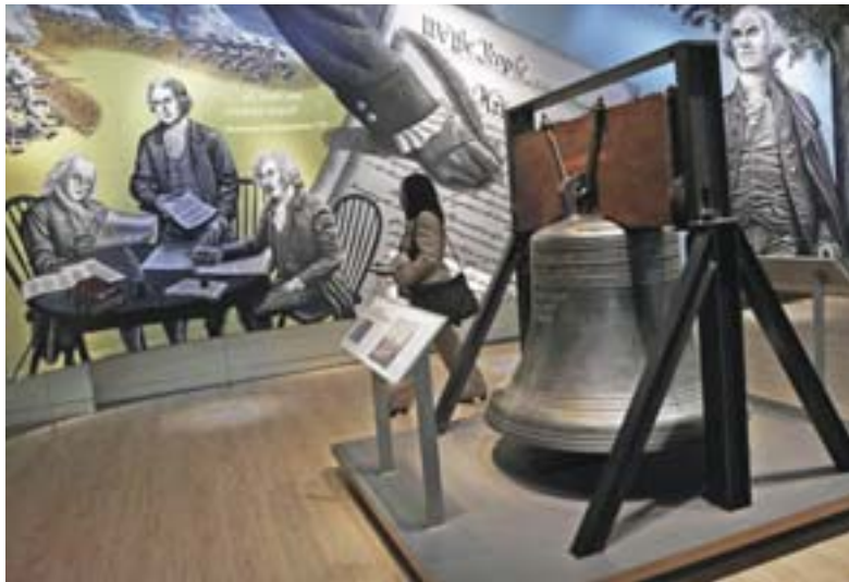
A woman walks through the "Impact of the Bible in America" section at Museum of the Bible November 15, 2017 in Washington, DC.