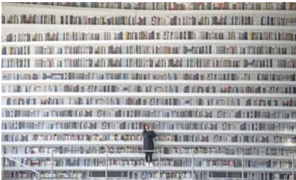
This picture taken on November 14, 2017 shows a woman taking pictures at the Tianjin Binhai Library.

There's another quirk: The irregular white stairs have proven hazardous for selfie-snappers with