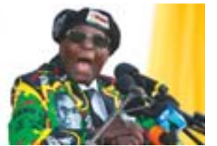
Mugabe resists pressure to quit