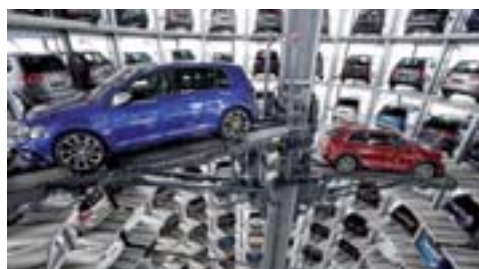
WOLFSBURG: In this file photo Volkswagen cars are lifted inside a delivery tower of the company in Wolfsburg, Germany.