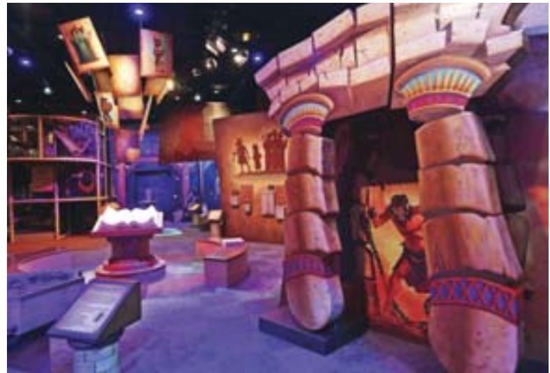
The Children's Experience section is seen at the Museum of the Bible.