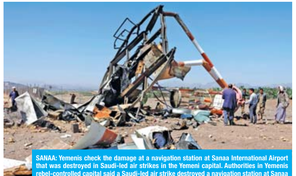
SANAA: Yemenis check the damage at a navigation station at Sanaa International Airport that was destroyed in Saudi-led air strikes in the Yemeni capital. Authorities in Yemen's rebel-controlled capital said a Saudi-led air strike destroyed a navigation station at Sanaa airport, which is critical to receiving already limited aid shipments.