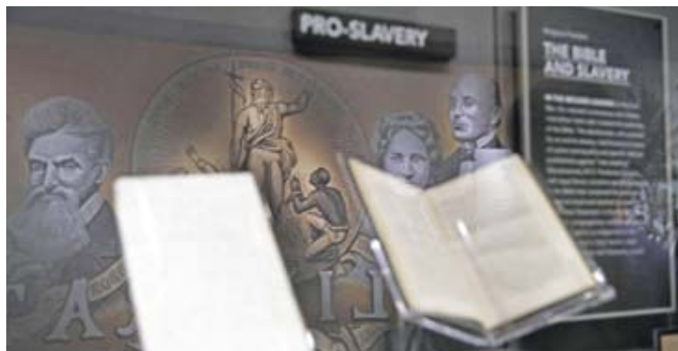
An exhibit discussing slavery in the United States is displayed inside the Museum of the Bible.

Another area explains the evolution of the Old