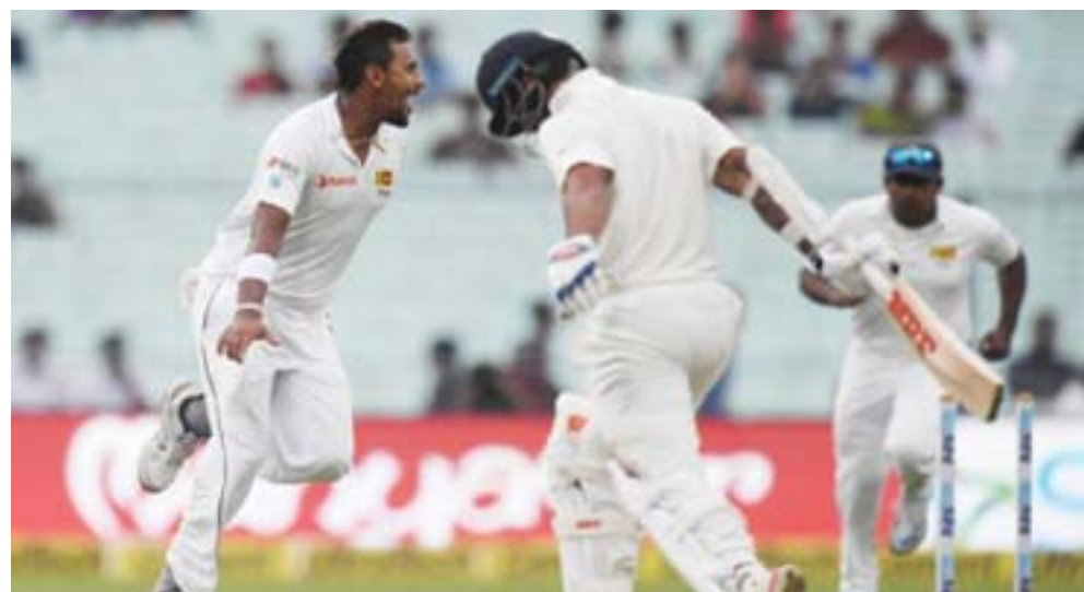
KOLKATA: Sri Lanka's Suranga Lakmal celebrates after taking the wicket of India's Shikhar Dhawan during the first day of the first Test between India and Sri Lanka at the Eden Gardens cricket stadium in Kolkata.

Sumgong has also won the Rotterdam and Las Vegas Marathons and finished runner-up in the Boston, Chicago and New York races.