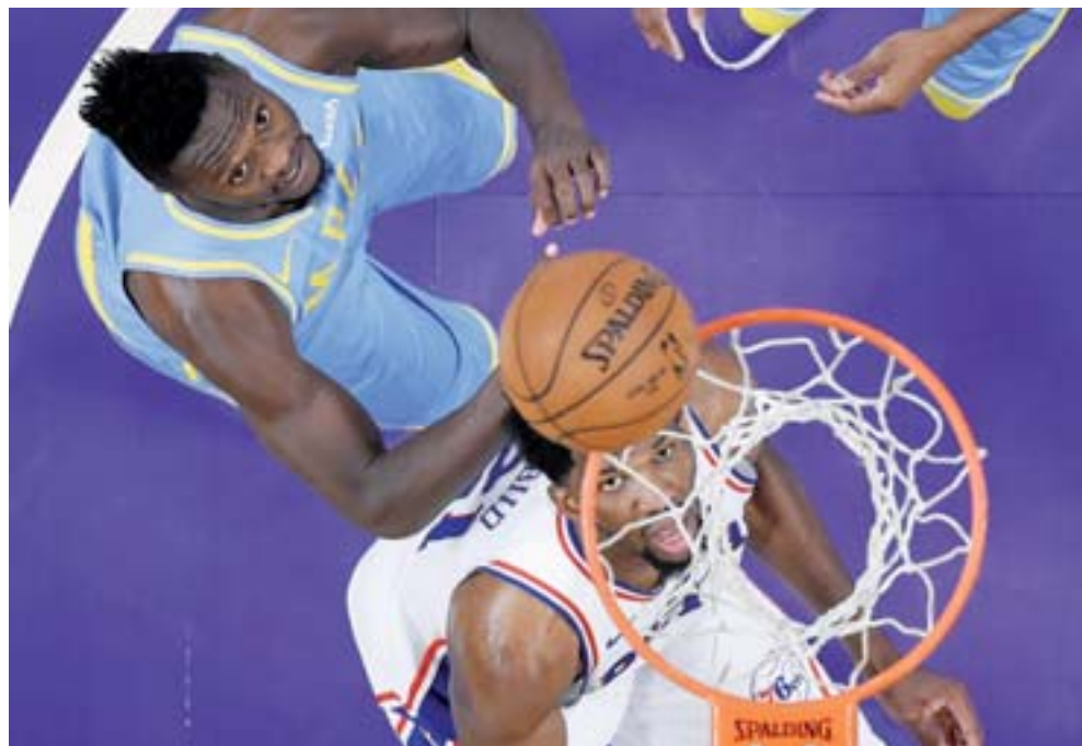
LOS ANGELES: Philadelphia 76ers center Joel Embiid, right, of Cameroon, watches his shot go in, next to Los Angeles Lakers forward Julius Randle during the second half of an NBA basketball game.

DeMar DeRozan scored 17 of his team-high 25 points in the third quarter and Toronto placed six other players in double figures in defeating New Orleans. The Raptors won their sixth consecutive game over the Pelicans. Toronto also has defeated New Orleans in 14 of its last 17 meetings. Kyle Lowry scored 22 points and Jonas Valanciunas added 21 points for the Raptors. The Pelicans were led by DeMarcus Cousins with 25 points and Anthony Davis with 19.