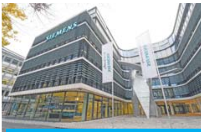
MUNICH: This file photo in Munich, southern Germany shows the headquarters of German industrial conglomerate Siemens.