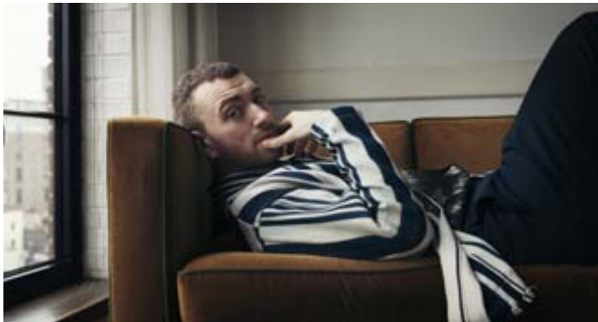
In this Nov 2, 2017 photo, musician Sam Smith poses for a portrait in New York to promote his latest album, "The Thrill of It All."

"I got dumped on the phone," Smith says with a light laugh. "A phone call. It still pisses me off." "I remember putting down the phone, walking into my garden and my friends were there and I was (like), 'It's over,'" he added. "We all decided, '...Instead of being depressed tonight, let's just go out and have the most amazing night.'" "Scars" is another personal song on the album, focusing on his mom and dad. "Pray" was inspired after a trip to Iraq for charity work, and a boy coming out to his father makes up "HIM." The latter was also created in response to an article Smith read about the singer not saying "he" or "him" in the songs on his debut album, even though he was a gay man. "I remember thinking, '(Expletive) you, I'm going to write a song and call it 'HIM' because I'm just not trying to hide anything here.' I never have. I think maybe I was scared of saying the wrong thing," he said.