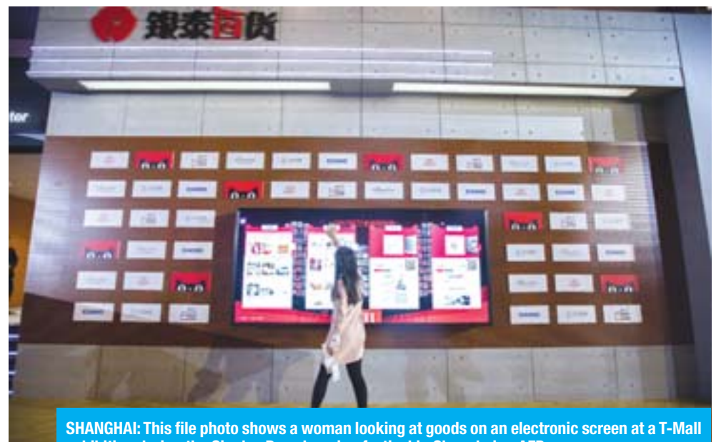
SHANGHAI: This file photo shows a woman looking at goods on an electronic screen at a T-Mall exhibition during the Singles Day shopping festival in Shanghai.

foreign lenders held 2.4 percent of the country's banking assets, according to KPMG. In spite of those foreign-held assets growing at 20 percent a year for the past decade, today foreigners hold just 1.4 percent of what has become a 181.7 trillion yuan market. Foreign entrants also face a banking