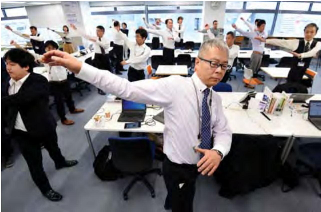
This photo shows employees of an information technology company exercising together in their office after lunchtime in Tokyo.