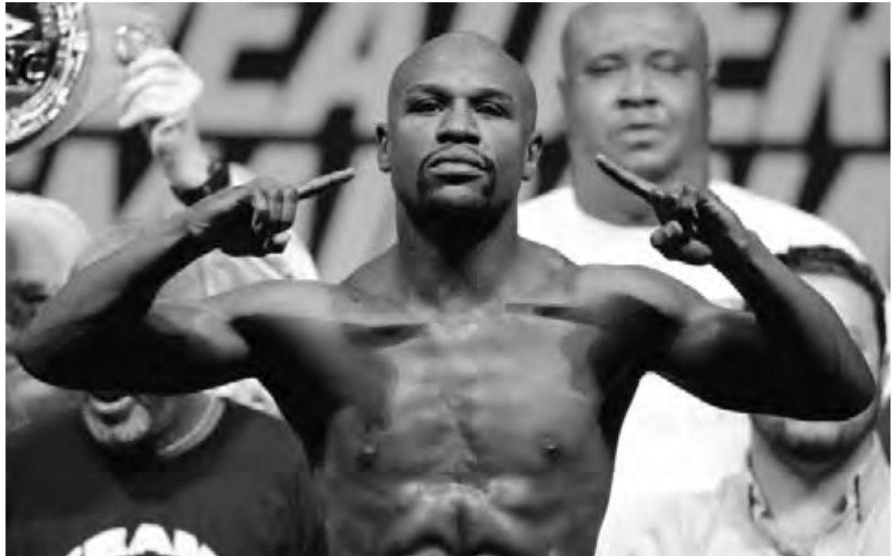
LAS VEGAS: In this Sept. 12, 2014, file photo, Floyd Mayweather Jr. poses on the scale during a weigh in for a fight against Marcos Maidana in Las Vegas. Mayweather Jr. said Wednesday, he will come out of retirement to face UFC star Conor McGregor in a boxing match on Aug. 26.

Imran Khan is hopeful that the squad of 2017 can achieve a victory during the holy month of Ramadan, much like his squad did 25 years ago.