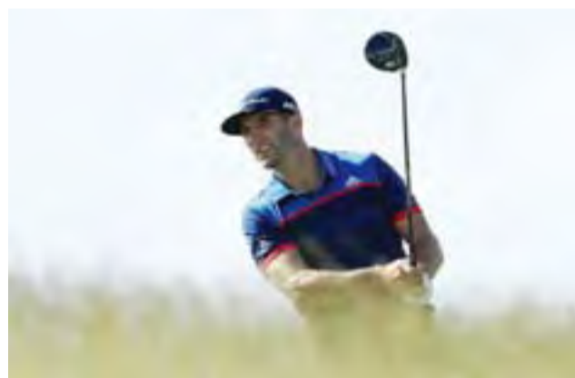
HARTFORD: Dustin Johnson of the United States plays his shot from the tenth tee during the first round of the 2017 US Open at Erin Hills yesterday in Hartford, Wisconsin.

"Obviously it was very disappointing not to be able to play, kind of with a freak accident," he said. "I'm excited to come back and defend this week." Johnson ended up watching the Masters on television as a frustrated viewer. "I couldn't really do much else, I was laying on the couch," he said. "Leading into the Masters I was playing the best golf that I've ever played. I've still got some work to do to get back to when I was playing that good." —AFP