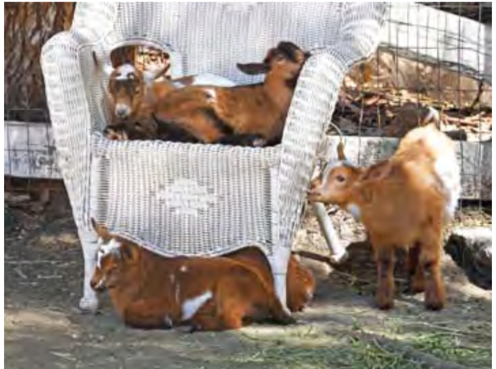
Baby goats resting during a "Goat Yoga" class .