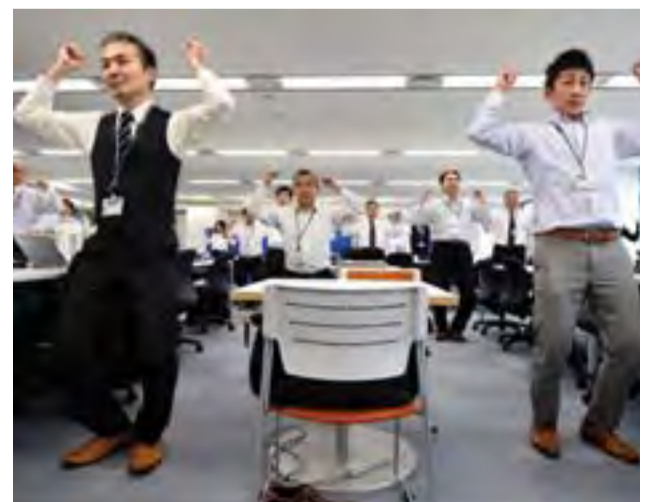
Employees of an information technology company exercising together in their office after lunchtime in Tokyo.