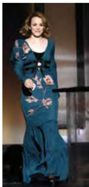
Actress Rachel McAdams walks onstage.

Warren Beatty, Morgan Freeman, Reese Witherspoon, Jane Fonda and Emma Stone also paid homage to Keaton during a gala ceremony last week in Hollywood. Steve Martin and Martin Short performed a musical roast of the actress. Allen, who directed Keaton to her Oscar-winning performance in "Annie Hall," said he owes much of what he's accomplished in his life to her. — AP