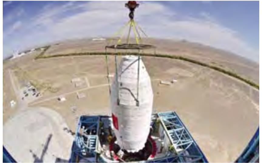
CHINA: This recent undated photo shows the Hard X-ray Modulation Telescope (HXMT), named Insight, being lifted onto a Long March-4B rocket at the Jiuquan Satellite Launch Center in northwest China's Gobi Desert.

The telescope will seek out new black hole activity by repeatedly scanning the Milky Way for active celestial bodies that emit X-rays. Black holes are usually undetectable, but when matter falls into a black hole, it is accelerated and heated, emitting X-rays in the process, Zhang explained. Compared with other countries' space telescopes, HXMT has a large