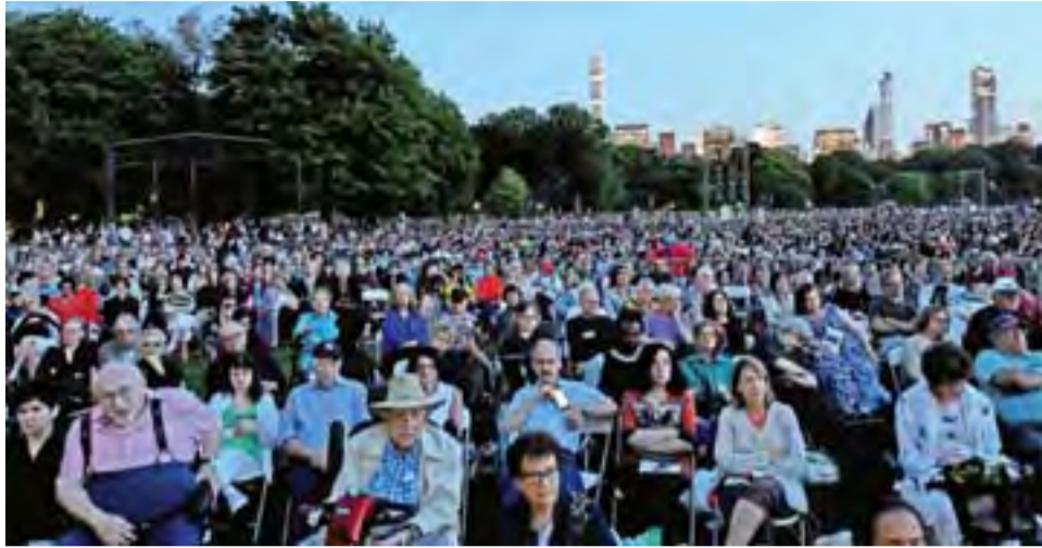
Attendees listen as conductor Alan Gilbert leads the New York Philharmonic in a free concert.