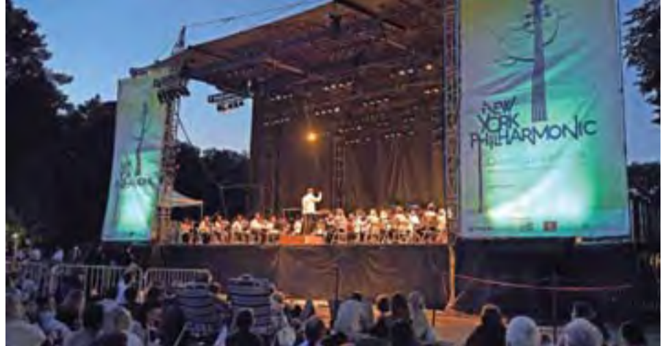
Conductor Alan Gilbert leads the New York Philharmonic in a free concert in New York's Central Park.