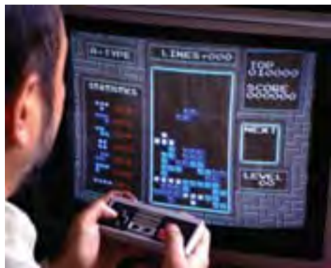
In this June 1990 file photo, Tetris, an addictive brain-teasing video game, is shown as played on the Nintendo Entertainment System in New York.

From the "ping ... ping" of Atari's 1972 groundbreaking paddle game "Pong," the sounds, infectious ditties and, with time, fully-formed orchestral scores that are an essential part of the sensory thrill for gamers have formed a musical universe. With its own culture, sub-cultures and fans, game music now thrives alone, free from the consoles from which it came.