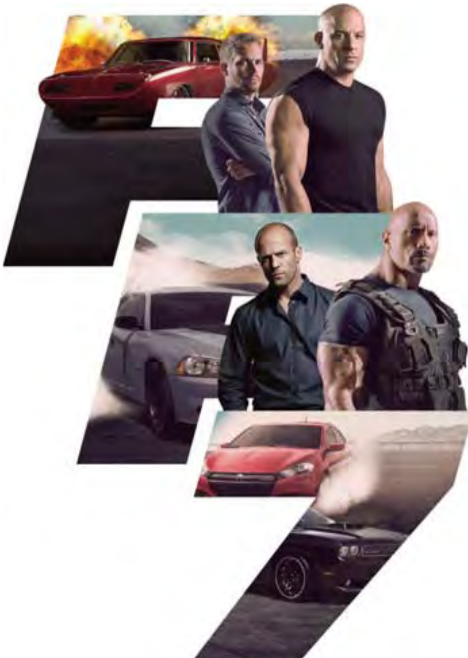
FAST & FURIOUS 7 ON OSN MOVIES ACTION HD

00:00 In Treatment 00:30 Queen Sugar 01:15 The Leftovers 02:15 No Contract, No Cookies: The Stella D'oro Strike 03:00 Veep 03:35 Silicon Valley 04:10 LifeStories: Families In Crisis 04:45 Sugartime 06:40 Cinema Verite 08:10 Jockey 09:40 First Time Felon 11:25 The Immortal Life Of Henrietta Lacks 13:00 Conspiracy 14:35 Ethel