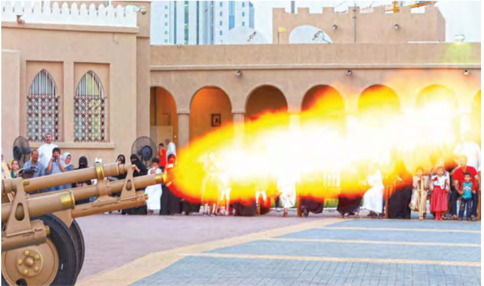
KUWAIT: The cannon fired daily during Ramadan at Naif Palace to signal the end of the fast at Maghrib.