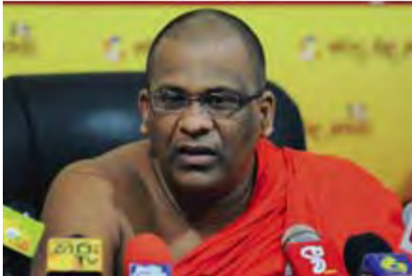
COLOMBO: This file photo shows controversial Sri Lankan Buddhist monk Galagodaatte Gnanasara during a press conference in Colombo.—AFP

Prime Minister Ranil Wickremesinghe vowed on Wednesday that he would not allow a repeat of 2014 anti-Muslim riots in which four people died and hundreds of homes were destroyed, promising tougher legislation. With stoning and desecration of Muslim-owned places now an almost daily occurrence, the government faces international criticism over its failure to tackle the violence and rein in the BBS. In a video message released Sunday, the group denied any involvement, but accused the government of allowing Islamic extremism to flourish in the Buddhist-majority nation. Earlier this month, Western diplomats urged Sri Lanka to take action to stop the renewed outbreak of religious violence.—AFP