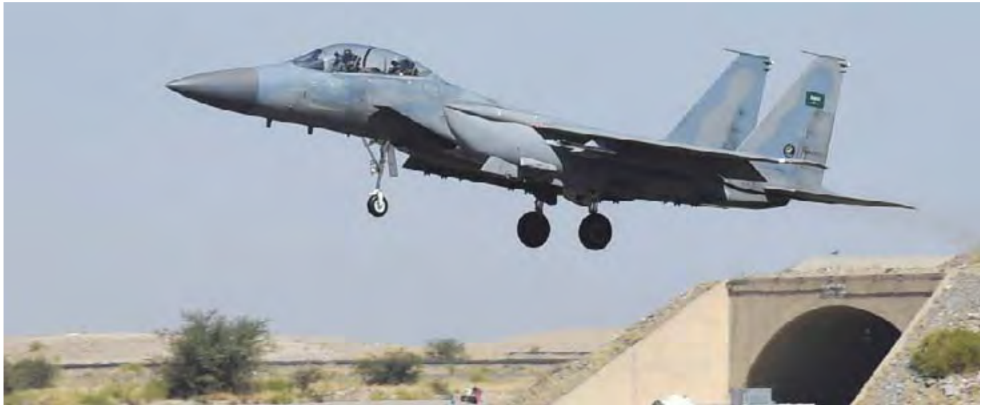
RIYADH: This file photo taken on November 16, 2015 shows a Saudi F-15 fighter jet landing at the Khamis Mushayt military airbase, some 880 km from the capital Riyadh, as the Saudi army conducts operations over Yemen.