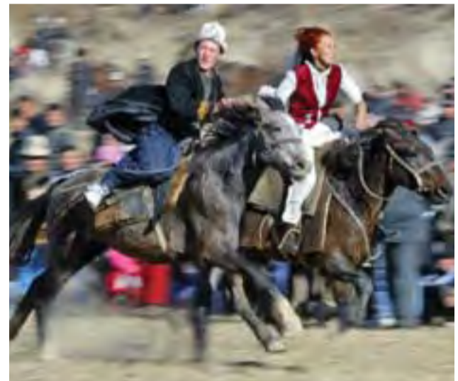
A Kyrgyz man rides to catch a woman wearing a traditional bridal gown during a folk festival.

And Kochorbayeva said instances of girls or women reporting the crime remain the exception. "The rate of discovery is still very weak," she said. "It is difficult for girls to file complaints, considering their own families may not support them." She says that reflects Kyrgyzstan's patriarchy. "Here, the older generation decides the fate of the younger generation. That's the essence of a patriarchal society." — FP