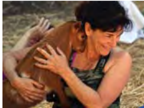
Students struggling to maintain their concentration as goats get close during a "Goat Yoga".