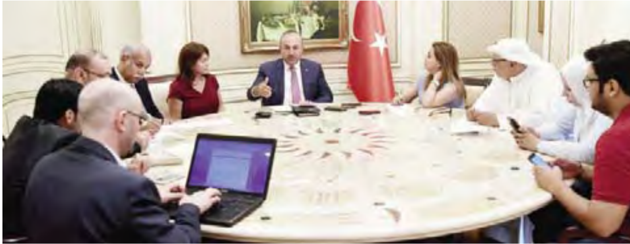
KUWAIT: Turkish Foreign Minister Mevlut Cavusoglu (center) attends a press conference in Kuwait City yesterday as part of his tour of Gulf countries. Cavusoglu held talks with Qatar's Emir the day before as the search for a diplomatic solution to the Gulf crisis intensified and the UN voiced fears over growing humanitarian concerns in the region.