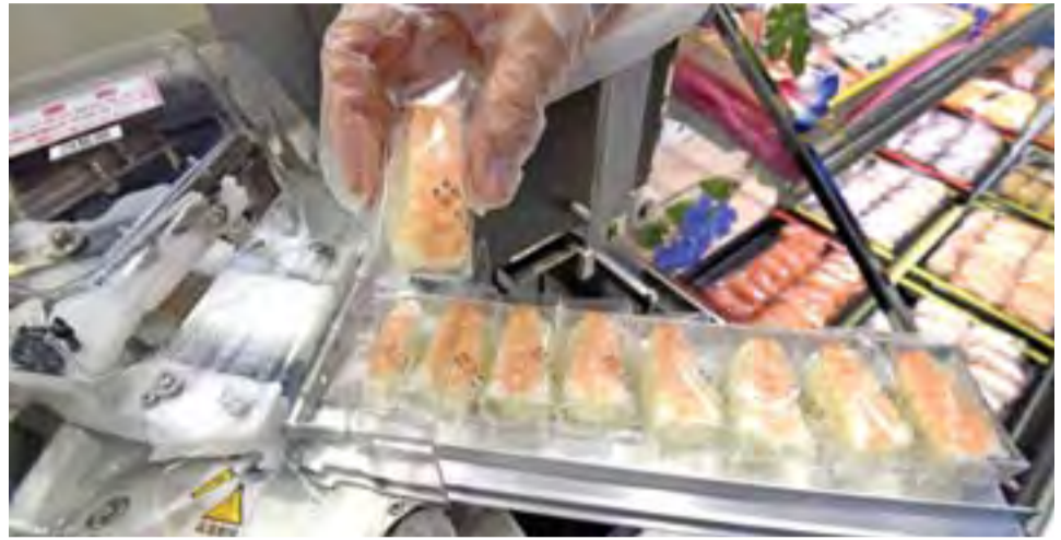
An employee of Japan's cooked rice processing machine maker SUZUMO demonstrates their automatic sushi wrapping machine at the International Food Machinery and Technology Exhibition in Tokyo.