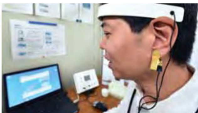
An employee of the Tokyo-based electrical equipment manufacturing company Fujikura checking his health at the company's health care room.