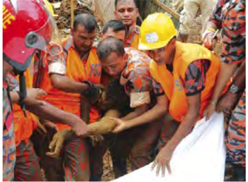
RANGAMATI: Bangladeshi firefighters recovered a dead body at the site of a landslide.