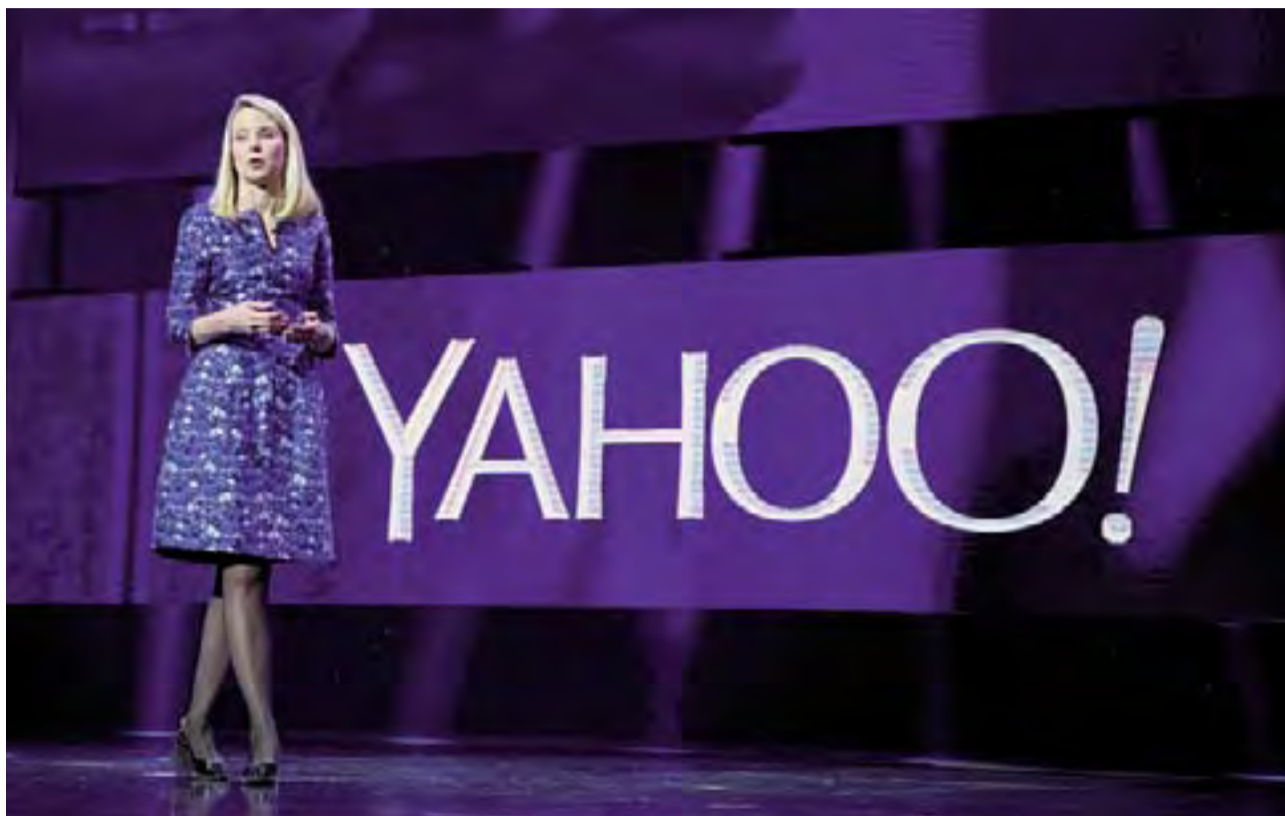
LAS VEGAS: In this file photo, Yahoo president and CEO Marissa Mayer speaks during the International Consumer Electronics Show in Las Vegas.

Verizon is counting on the combination of Yahoo and AOL to build a strong third alternative in a rapidly growing digital advertising market that is currently dominated by Google and Facebook. But Yahoo's ad revenue has been