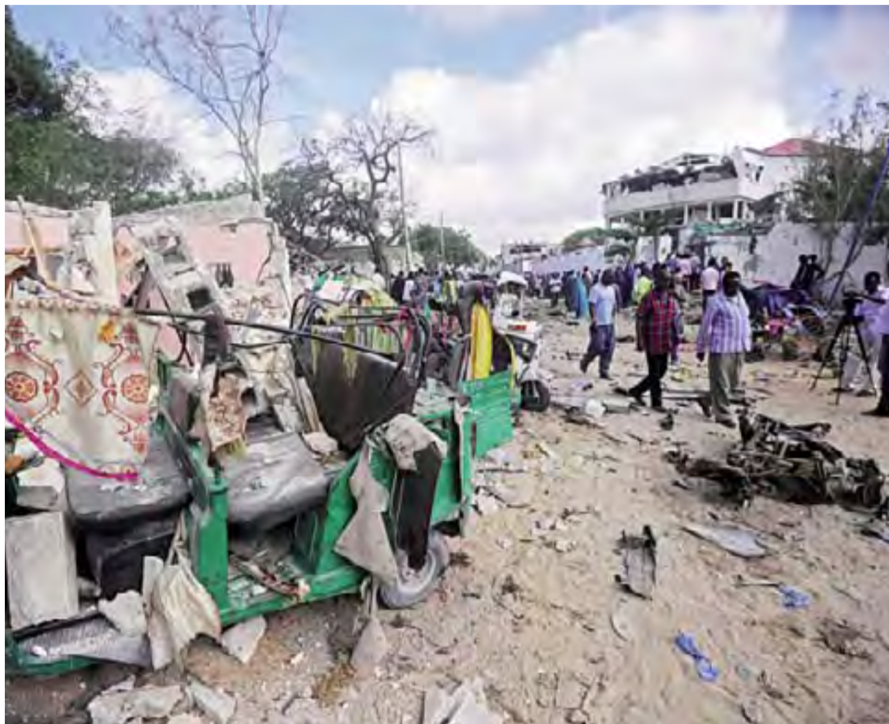
MOGADISHU: People walk at the site of a terror attack outside the Pizza House restaurant.