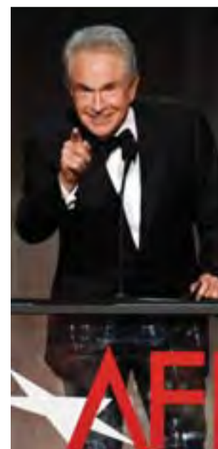
Actor/filmmaker Warren Beatty gestures to actress Diane Keaton in the audience during the event.