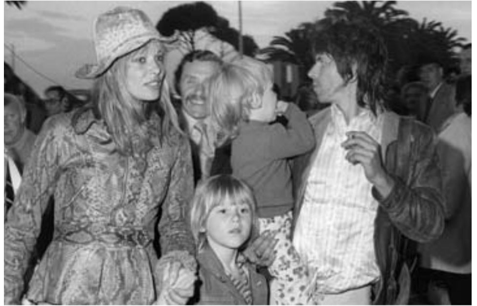
This file photo taken on May 12, 1971 shows Rolling Stone guitarist Keith Richard (right), his actress wife Anita Pallenberg, and their children arrive at for the 25th International Cannes film festival to show their support for the screening of the documentary film 'Gimme Shelter' chronicling the last weeks of The Rolling Stones' 1969 US tour.

She told The Guardian in 2008 that she decided not to write an autobiography, saying she spoke to several publishers and "they all wanted salacious." Singer Marianne Faithfull, who was involved in the late 1960s with Stones frontman Mick Jagger, described Pallenberg as a lifelong friend in a tribute on Facebook. "She taught me so much, especially after we got clean; it was very good, and so much fun! Farewell my love, go well."