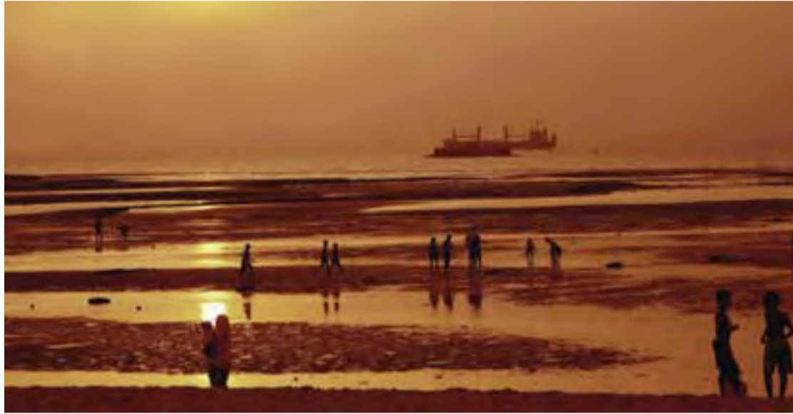
KUWAIT: Photo captures the sunset in Kuwait. Kuwait residents are braving the blazing sun amid a heat wave that has raised temperatures to unprecedented levels. A recent international report identified Kuwait as one of the hottest spot on earth this year.