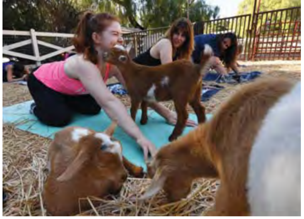
Students during a "Goat Yoga" class.

goats, said she decided to host the classes to raise money for her 16-year-old daughter and a friend who are planning to showcase the animals at a farm show in Wisconsin this summer. "We didn't know how it was going to go but it's taken off, we're booked solid," she said. "People love it. They decompress, they cuddle the goats and relax."