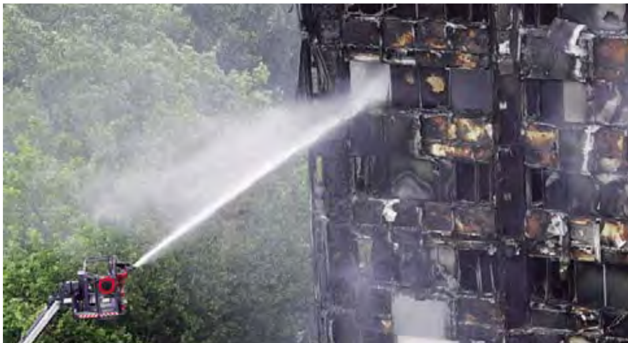
LONDON: An automated hose sprays water onto Grenfell Tower, a residential tower block in west London that was caught in a huge blaze. —AFP

DUBAI: A Bahraini court yesterday issued sentences of up to life in prison for 26 Shiites over the attempted murder of policemen in the Sunni-ruled kingdom, a judicial source said. Twenty of the defendants were jailed for life while the rest were each handed 15-year prison terms, the source said. They were found guilty of forming a "terrorist group" between 2011 and 2013 and attempting to kill policemen in the Shiite village of Diraz, west of Manama. Villages of the Shiite majority have been scene to frequent protests and clashes since in March 2011, when security forces crushed nationwide protests demanding political reforms. Police last month opened fire to disperse a months-long sit-in in Diraz, killing five people in the crackdown. The tiny Gulf state is a key regional ally of the United States and is home to its Fifth Fleet, but the administration of former president Barack Obama often scolded Manama over rights concerns. In another case, a court in Manama jailed a Bahraini for 10 years and revoked his citizenship for joining the Islamic State Sunni extremist group, a public prosecution statement said. —AFP