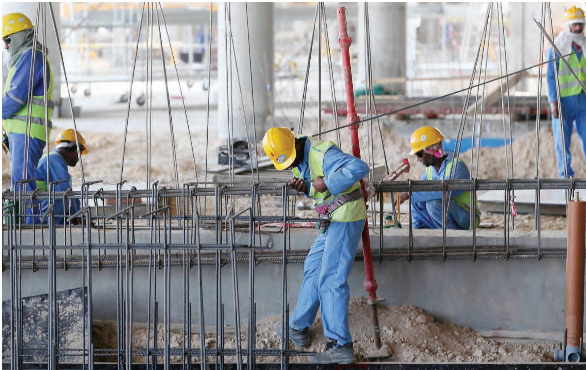
DOHA: This file photo shows migrant laborers working on a construction site in Doha in Qatar.—AFP