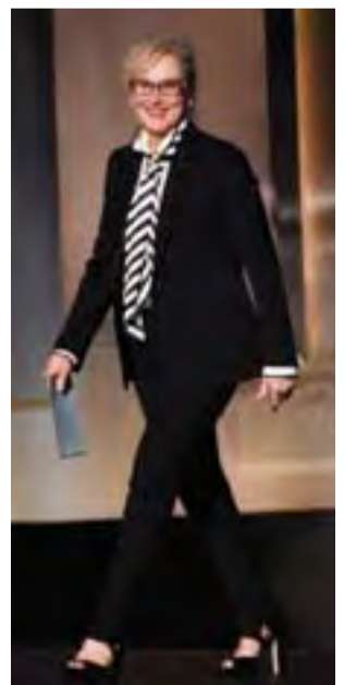
Actress Meryl Streep walks onstage.