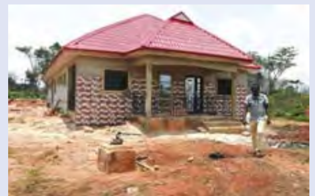
BENIN CITY: A man walks past a house built with proceeds from money repatriated by immigrant from Europe in Benin City, capital of Edo State, southern Nigeria.

On the walls, the owner's mother has stuck a notice from her Pentecostal church: "2017 My Year of Greater Light". "The mother of the owner is (a) pure water seller, she is a street vendor," the construction engineer says, adding that without the money from overseas, building the house would be impossible. Behind him, workers dig the foundations of another house by hand, sweating in the suffocating heat, 10 hours a day, for 3,000 naira. —AFP