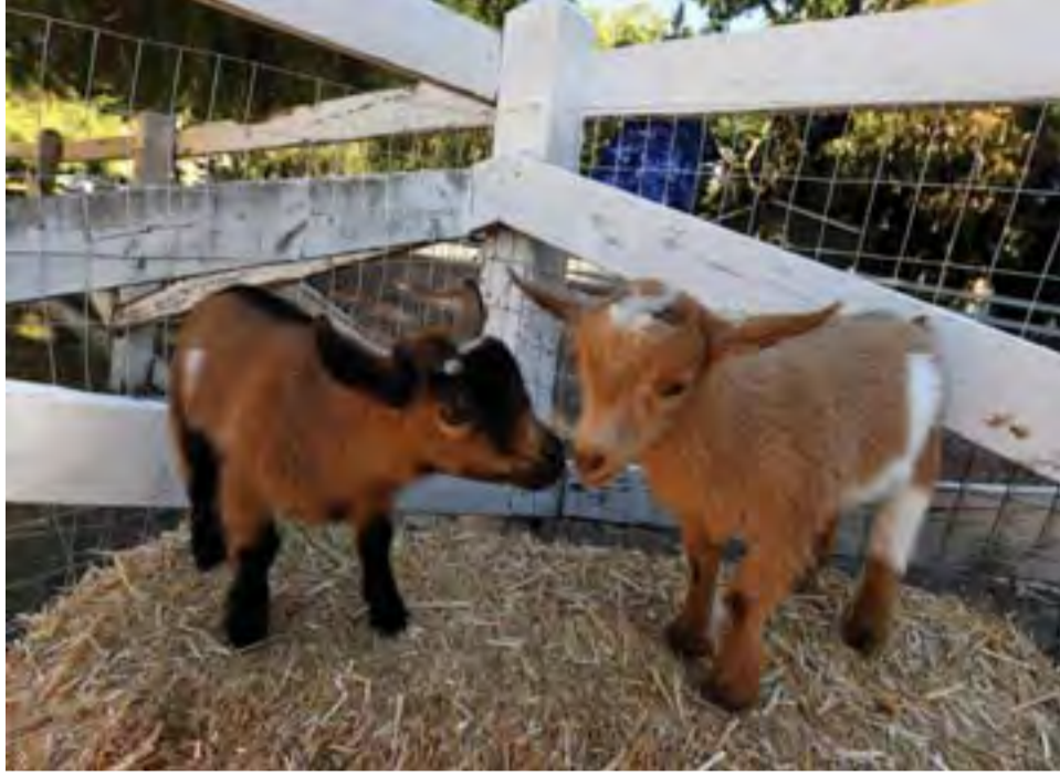
Baby goats resting during a "Goat Yoga" class.