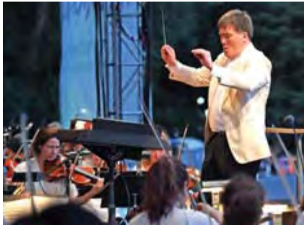
Conductor Alan Gilbert leads the New York Philharmonic in a free concert in New York's Central Park.

Plans for Musicians for Unity—including how it will secure funding—are still in their infancy, but Gilbert envisions starting modestly with two to three concerts a year. Occasions could include a concert in 2018 to mark the centennial of the birth of anti-