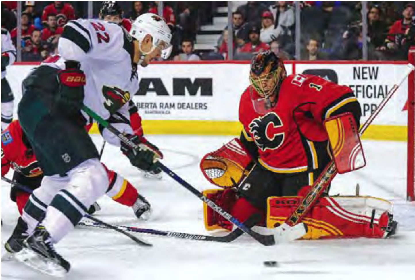
CALGARY: This file photo taken on February 17, 2016 shows Switzerland's Nino Niederreiter (L) of the Minnesota Wild shooting on the net of Jonas Hiller (R) of the Calgary Flames during an NHL game at Scotiabank Saddledome in Calgary, Alberta, Canada. Niederreiter, widely considered to be Switzerland's greatest player, began his professional career in the Swiss league, but his skills ultimately propelled him to the NHL. He was the fifth player chosen in the 2010 entry draft, the highest selection ever for a Swiss player.

The reasons for Switzerland's meagre international record are varied, players and experts said, although one factor stood out.