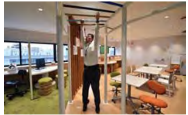
An employee of the Tokyo-based electrical equipment manufacturing company Fujikura stretching with playground equipment at the company's health activity room.