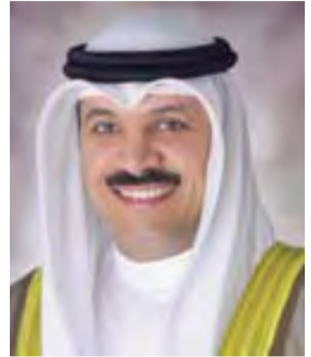
CBK Governor and Board Chairman Dr Mohammad Al-Hashel

KUWAIT: The Central Bank of Kuwait (CBK) has decided to keep the discount rate at its current value 2.75 percent, a fixed rate since March 16. CBK's board of directors decided to continue employing the available measures and materials that aim at ensuring the competitiveness and attractiveness of the Kuwaiti Dinar as a store of domestic savings, CBK Governor and Board Chairman Dr Mohammad Al-Hashel said yesterday.