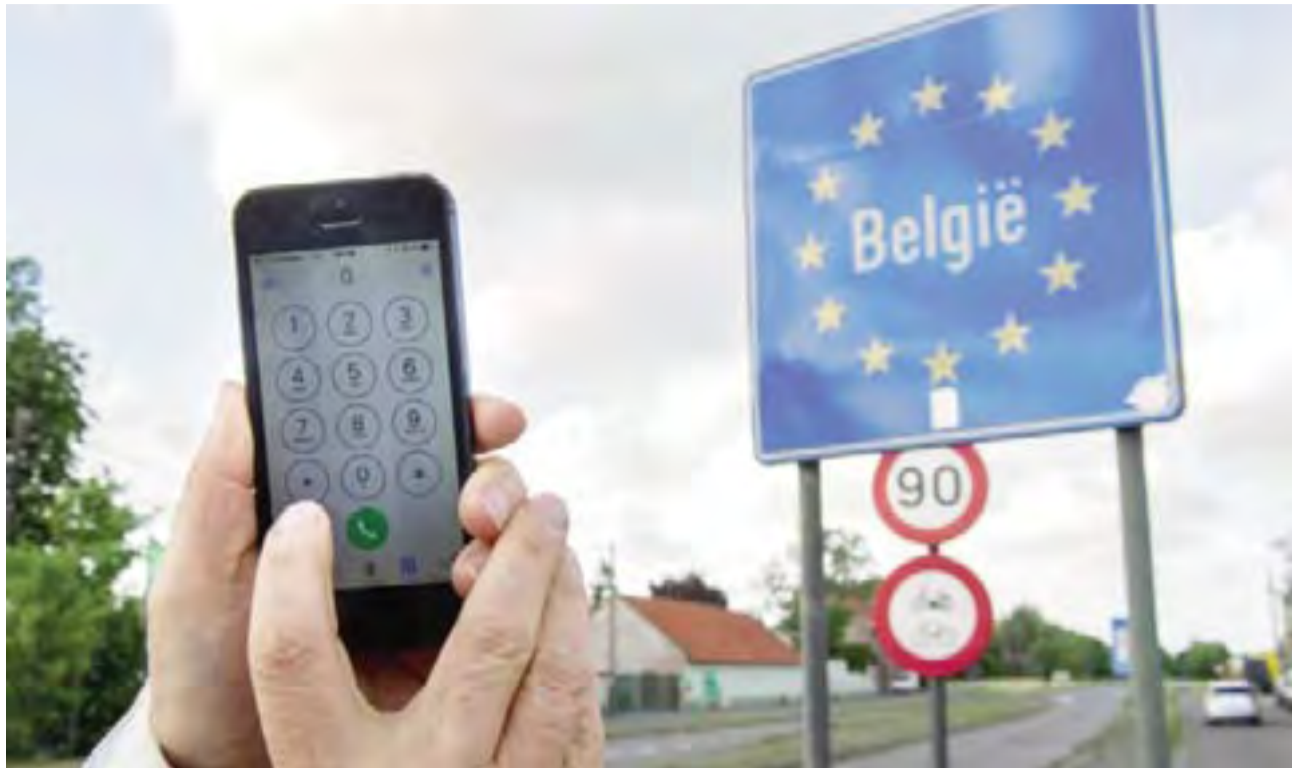
BOESCHEPE: This file photo shows a man using his mobile phone in Boeschepe at the Franco-Belgian border.—AFP

The alternative is the black market where, in Aweil for example, 26 year old Sadik sells a 16 liter container of petrol for 2,800 pounds, up from 1,700 six months ago. Rather than a black market, this is in fact a parallel market, operating in plain sight, on a busy city road. The only time Sadik has any problems with officials, he says, is when they come to complain that traders are stockpiling fuel to push prices higher still, as he too tries to earn enough to live.—AFP