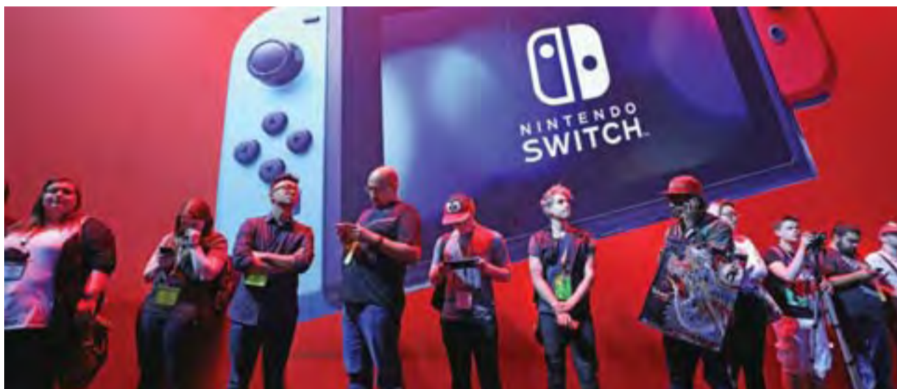
Game enthusiasts and industry personnel walk past the Nintendo Switch exhibit during the Electronic Entertainment Expo E3 at the Los Angeles Convention Center on June 13, 2017 in Los Angeles.

E3 2017 in comparison had more than its share of closet-skeletons coming on the back of the colossal upsets that were 'No Man's Sky' and 'Star Wars: Battlefront'. We won't know if this year's show will succeed in the 'acclaim' department until the games are actually released but for now we can at least enjoy the speculation, hope and wariness the latest E3 as to offer. So without any further ranting - let's get into this year's show's major highs and stinging lows.