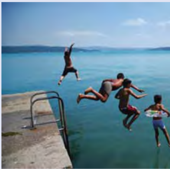
TURKEY: Children jump into Istanbul's Bosphorus Strait.

gram as a symbol of its rise and of the Communist Party's success in turning around the fortunes of the once poverty-stricken nation. In April, China's first cargo spacecraft successfully docked with an orbiting space lab a key development toward China's goal of having its own crewed space station by 2022. Last month, China opened a "Lunar Palace" laboratory on Earth to simulate a moon-like environment and house students for up to 200 days as the country prepares for its long-term goal of sending humans to the natural satellite.—AFP