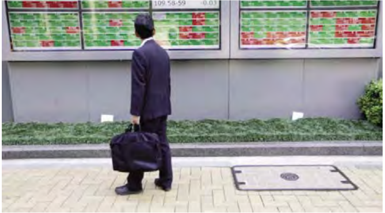
TOKYO: A man looks at an electronic stock board showing Japan's Nikkei 225 index at a securities firm in Tokyo.—AP