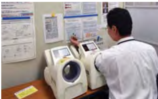
An employee of the Tokyo-based electrical equipment manufacturing company Fujikura checking his blood pressure.