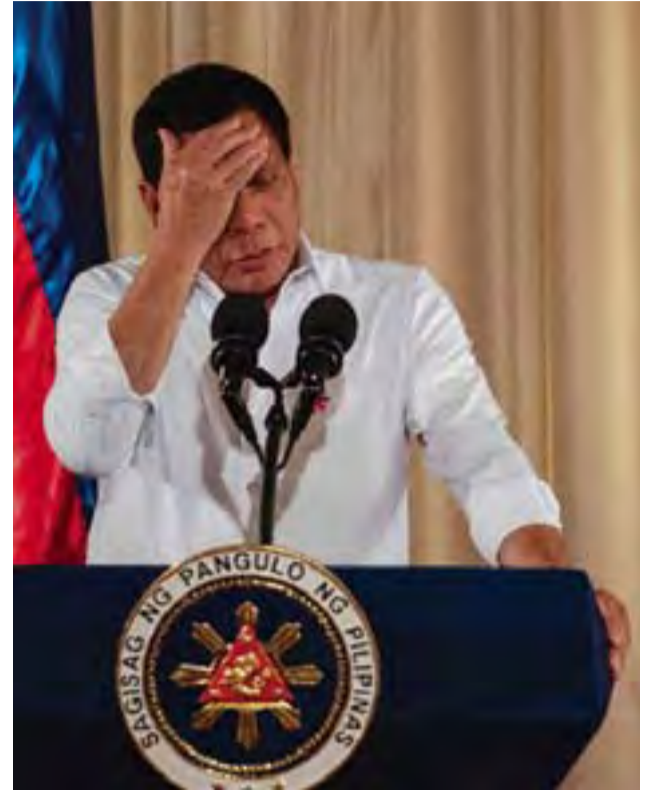
MANILA: This file photo taken on June 01, 2017 shows Philippine President Rodrigo Duterte gesturing as he gives a speech during the mass oath taking of officials of various national leagues at the Malacanang Palace in Manila.

scious, including a small child. The force of the blast tore the clothes off some people. It is the latest tragedy to strike a kindergarten in China in recent weeks. A school bus packed with kindergarten pupils erupted in flames inside a tunnel in eastern Shandong province on May 9, killing 11 children, a teacher and the driver. Officials later said the fire was intentionally set by the driver, who was angry at losing overtime wages.