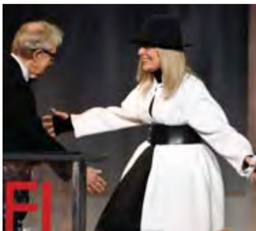
Filmmaker Woody Allen, left, greets actress Diane Keaton onstage to give her the 45th AFI Life Achievement Award during a gala tribute to Keaton at the Dolby Theatre.

Diane Keaton is such a special entertainer that even normally reclusive Woody Allen is appearing in a televised tribute to her. Allen is among those honoring the actress in the American Film Institute's presentation of its 45th Life Achievement Award. The AFI's "Tribute to Diane Keaton" will premiere Thursday night on TNT.