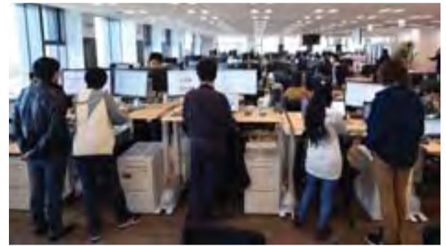
This photo shows employees of an information technology company exercising together in their office after lunchtime in Tokyo.