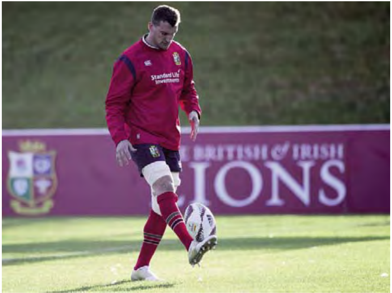
ROTORUA: British and Irish Lions tour captain Sam Warburton kicks a ball during a team training session in Rotorua, New Zealand, yesterday. The Lions play the Maori All Blacks here tomorrow.

The 34-year-old said the leadership shuffle was all part of Cheika's long-term strategy. "We have had a number of discussions about that going way back so it hasn't come out of nowhere. Those roles, they're fluid and they evolve over time," Moore said. "I am really comfortable with how all that is panning out." Cheika will be mindful that the Wallabies beat fifth-ranked Scotland by just one point in their previous two meetings and lost to them 9-6 in their last home encounter in 2012. The Scots have been in scintillating form of late, beating Wales and Ireland during the Six Nations before defeating Italy 34-13 in Singapore last weekend. —AFP