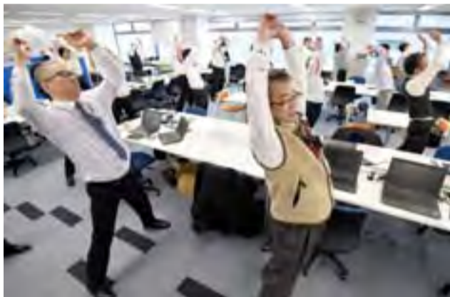
Employees of an information technology company exercising together in their office after lunchtime in Tokyo.