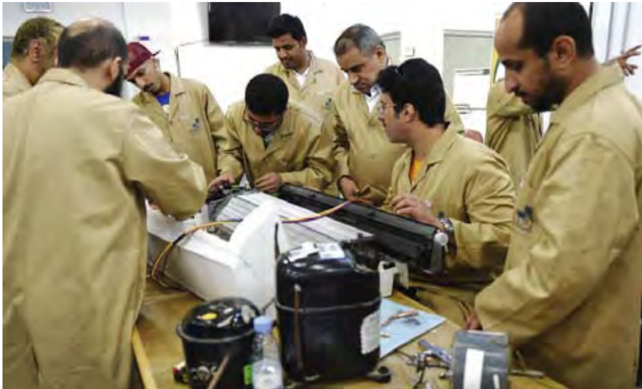
RIYADH: Saudi men attend a technical education evening class at an electrical workshop as part of a pioneering program in Riyadh.