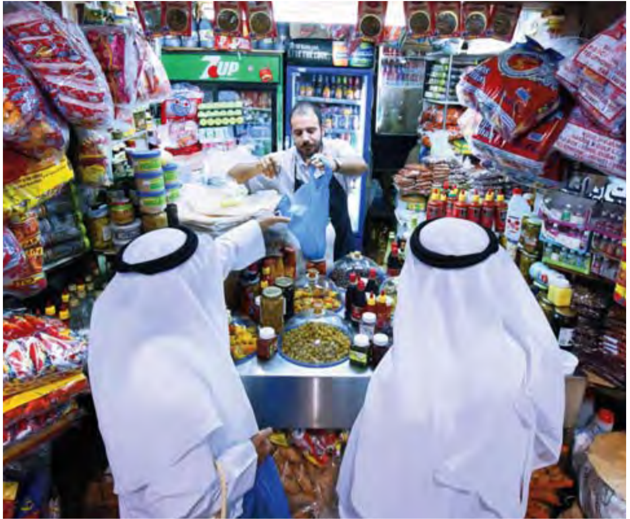
Locals shop for olives and other edibles after breaking the fast in a downtown market in Kuwait City.