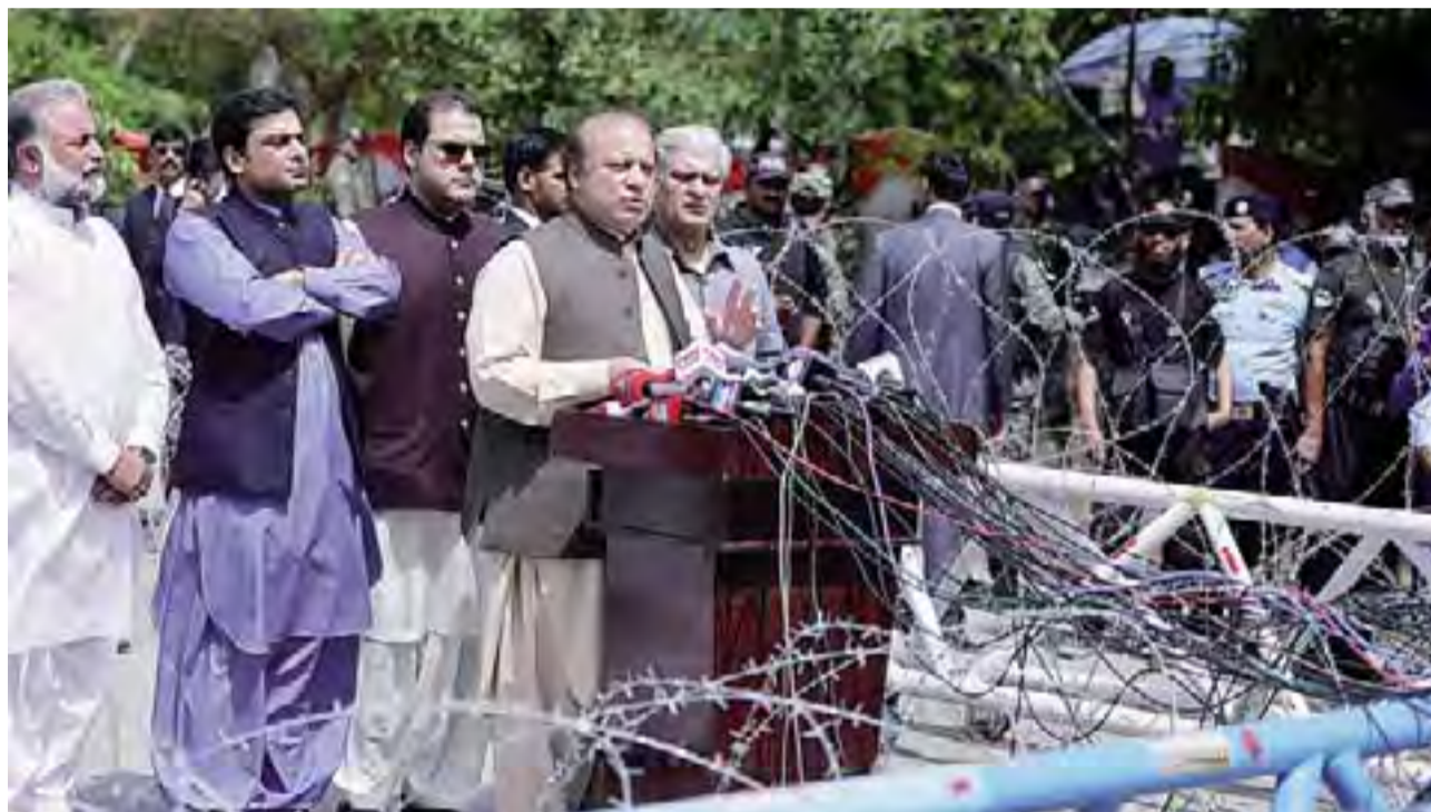
ISLAMABAD: Pakistan's Prime Minister Nawaz Sharif speaks to media after appearing before an anti-corruption commission at the Federal Judicial Academy.