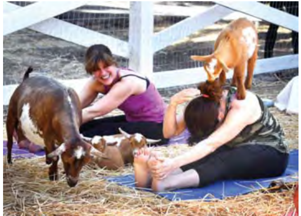
Students struggling to maintain their concentration as goats get close during a 'Goat Yoga' class organized by Lavenderwood Farm in Thousand Oaks, California.