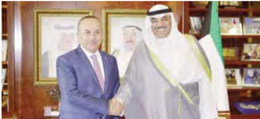
KUWAIT: Kuwaiti First Deputy Prime Minister and Minister of Foreign Affairs Sheikh Sabah Khaled Al-Hamad Al-Sabah welcomes his Turkish counterpart Mevlut Cavusoglu yesterday.

"We want to hear the views of Saudi Arabia regarding possible solutions and will share with them our views in a transparent way ... We pay a great attention to our relations with them," he said. Cavusoglu said Qatari officials believe they are not the cause of the current crisis and want to know the claims of the four countries. "We are trying hard to prevent any escalation and find a quick solution to the crisis ... Resolving the crisis is not through taking (boycott) decisions but through dialogue," Cavusoglu said.