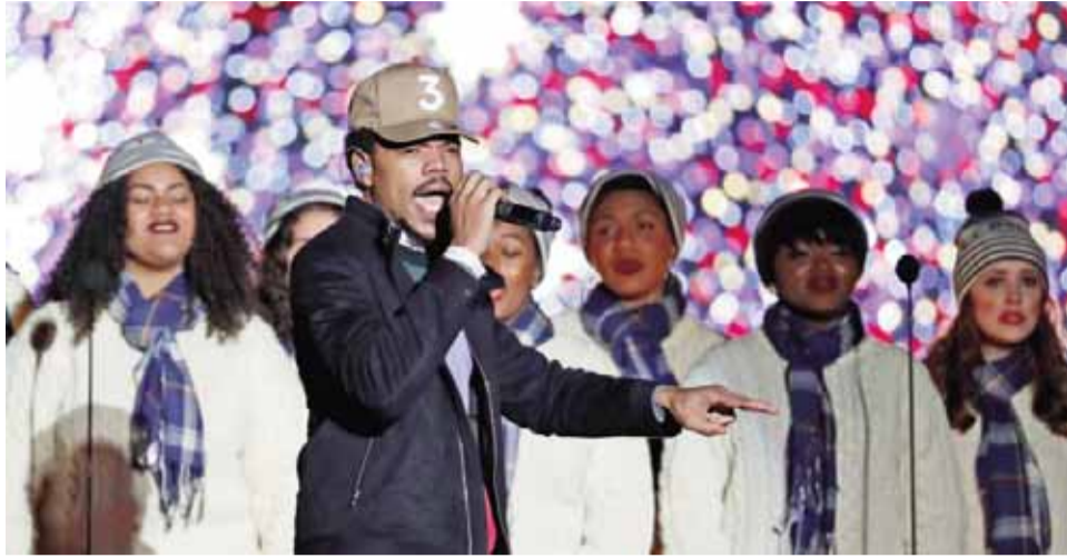
This file photo shows Chance the Rapper performing during the lighting ceremony for the 2016 National Christmas Tree in Washington.