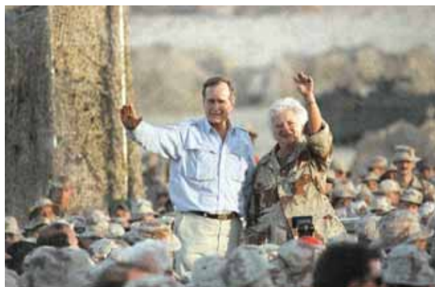
SAUDI ARABIA: In this Nov 22, 1990 file photo, US President George H W Bush and First Lady Barbara Bush wave to US Marines during a Thanksgiving visit at a desert encampment in Saudi Arabia.

He was treated at the same facility in Nov 2012 for bronchitis, spending nearly two months in the hospital. George Herbert Walker Bush was born June 12, 1924 in Milton, Massachusetts to a wealthy New England political dynasty, the son of Prescott Bush, a successful banker and US senator for Connecticut. — AFP