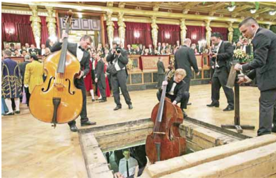
Musical instruments are being removed to make space on the dance floor at the opening ceremony of the Ball of the Vienna Philharmonic Orchestra in Vienna.