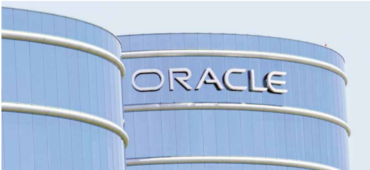
REDWOOD CITY: This June 18, 2012, file photo shows Oracle headquarters in Redwood City, California.

Earlier this month, the Labor Department also sued Google, saying the company has refused to provide the department with employee compensation records and other information as part of an audit designed to ensure it isn't discriminating against workers based on gender or race. Oracle, Google and other technology companies have made public commitments to improving gender and racial diversity in recent years. But change has been slow to come, and the companies continue to be dominated by white (and sometimes Asian) men, especially in technical and leadership positions.