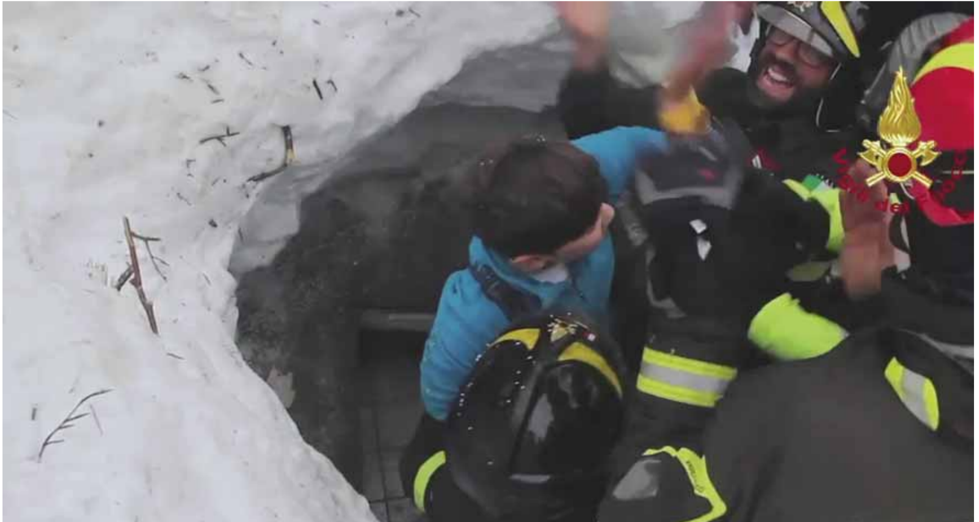
RIGOPIANO, Italy: This frame from video shows Italian firefighters extracting a child alive yesterday from under snow and debris of an hotel that was hit by an avalanche on Wednesday.