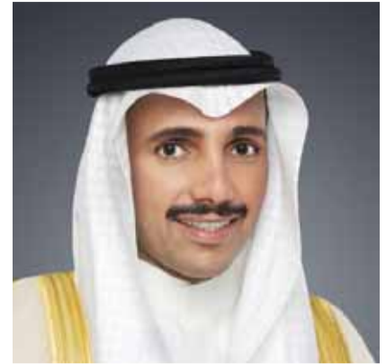
National Assembly Speaker Marzouq Al-Ghanem