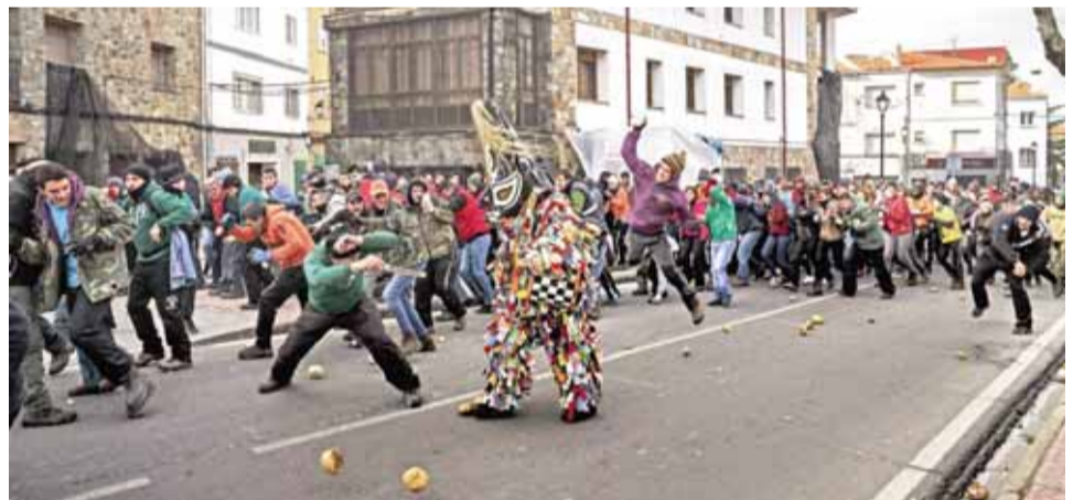
People throw turnips at the Jarramplas as he makes his way through the streets beating his drum during the Jarramplas festival in the tiny southwestern Spanish town of Piornal, Spain.

It wasn't all political talk. Madonna talked about her early days in New York, hanging with artists like Andy Warhol and Keith Haring, and how her kids are not the least bit impressed with her iconic career. "They want nothing to do with it," she said. "I always say with my kids, every day is a small crucifixion." Madonna also explained why she considers herself a feminist. "I believe that women have the right to be treated with the same human rights as men," she said. "I feel like we are still very far behind."