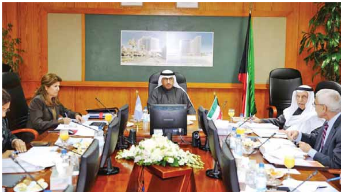
KUWAIT: Minister of Education and Minister of Higher Education Mohammad Al-Fares chairs KISR's board meeting.

Since then, KISR's role and responsibilities have expanded greatly to include the advancement of national industry and the undertaking of studies to address key challenges, such as the preservation of the environment, sustainable management of Kuwait's natural resources, responsible management of water and energy, and development of innovative methods of agriculture.