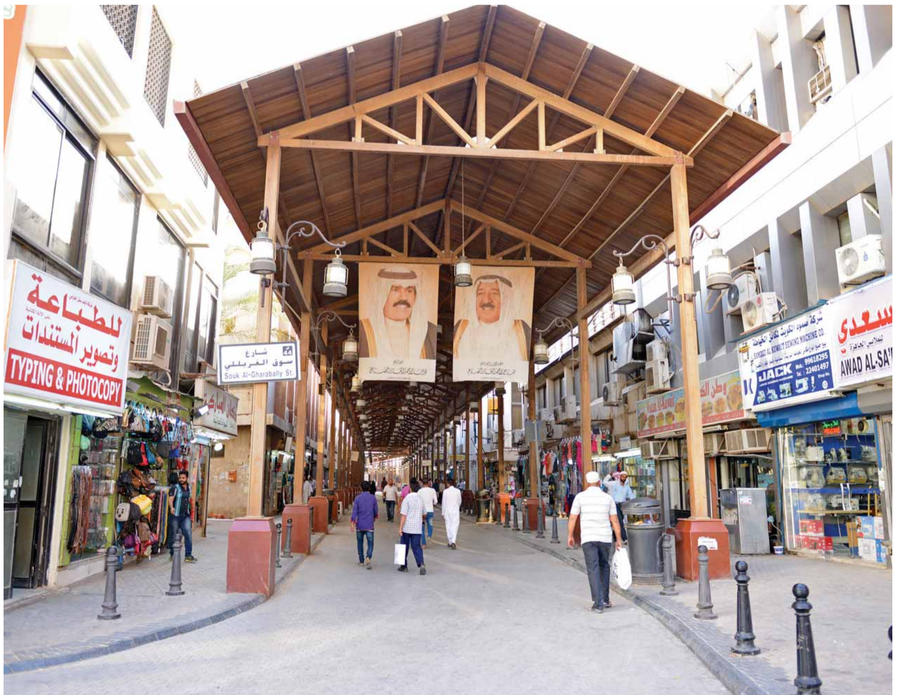
KUWAIT: An entrance to the historic Souq Mubarakia in Kuwait City.