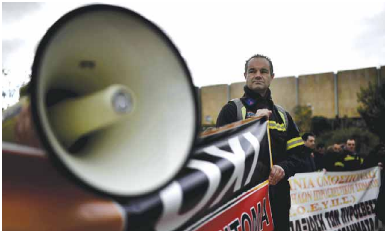
ATHENS: A firefighter takes part in a demonstration in central Athens yesterday during an anti-austerity protest.