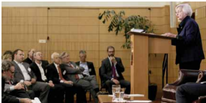
STANFORD, CA: Federal Reserve Board Chairwoman Janet Yellen discusses monetary policy and the economic outlook at Stanford University on Thursday in Stanford, California.

While they can be "useful benchmarks" for the Fed, "the rules should not be followed mechanically, since doing so could have adverse consequences for the econ-