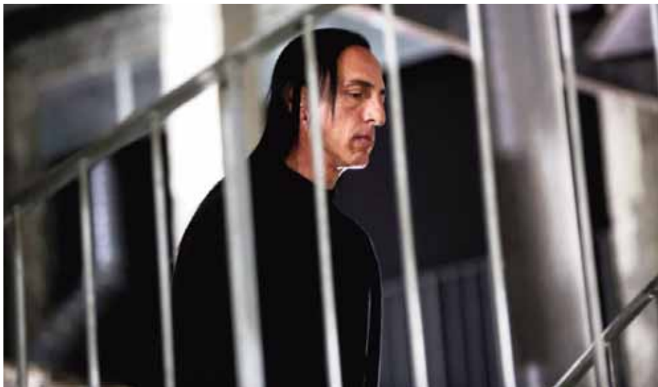
Fashion designer Rick Owens acknowledges applause at the end of his Men's Fall/Winter 2017-2018 fashion collection, presented in Paris.

Textured shirts hand-printed in pop patterns and inspired by white birch forests jazzed up the start of the show. But the style crescendo came later - in loose sweaters and cardigan jackets conceived in luxurious wool-cut jacquard that reflected the changing hues of autumn leaves. A 1983 archive coat in