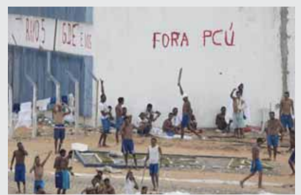
NIZEA FLORESTA, Brazil: Inmates walk amid tension as confrontation between rival gangs continues in the Alcacuz prison near Natal yesterday. — AP

Sen Miguel Barbosa of the leftist opposition Democratic Revolution Party seized on the extradition to take a swipe at Pena Nieto. He said it was apparently the only choice after Guzman twice pulled off embarrassing escapes from maximum-security lockups. — AFP