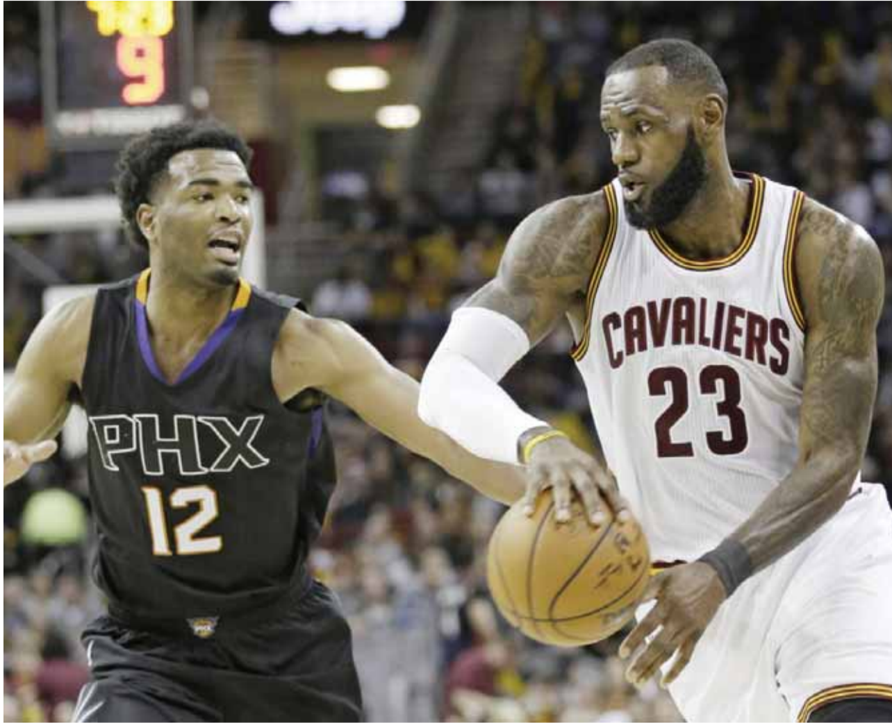
CLEVELAND: Cleveland Cavaliers' LeBron James (23) passes against Phoenix Suns' TJ Warren (12) in the second half of an NBA basketball game.