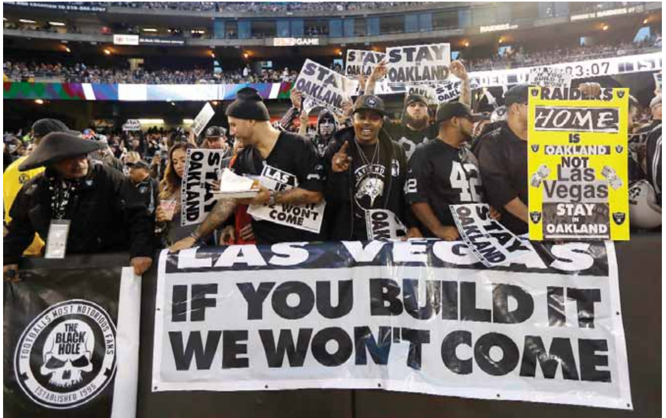
OAKLAND: In this Nov 6, 2016, file photo, Oakland Raiders fans hold up signs about the team's possible move to Las Vegas during an NFL football game between the Raiders and the Denver Broncos.