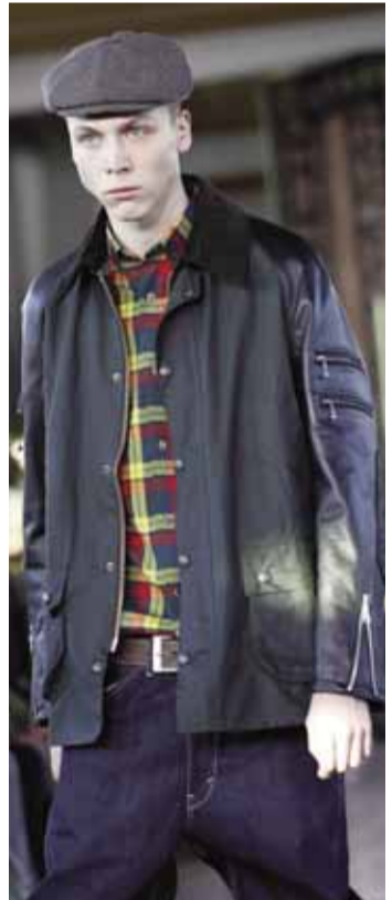
Models present creation by Japanese fashion designer Junya Watanabe during the men's Fashion Week for the Fall/Winter 2017/2018 collection in Paris yesterday.