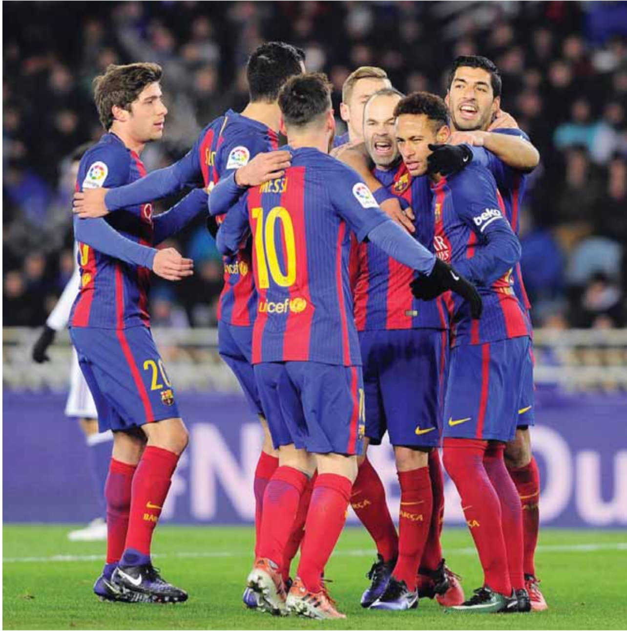
SAN SEBASTIAN: Barcelona's players celebrate after Brazilian forward Neymar scored his team's first goal during the Spanish Copa del Rey (King's Cup) quarter final first leg football match Real Sociedad vs FC Barcelona at the Anoeta stadium.