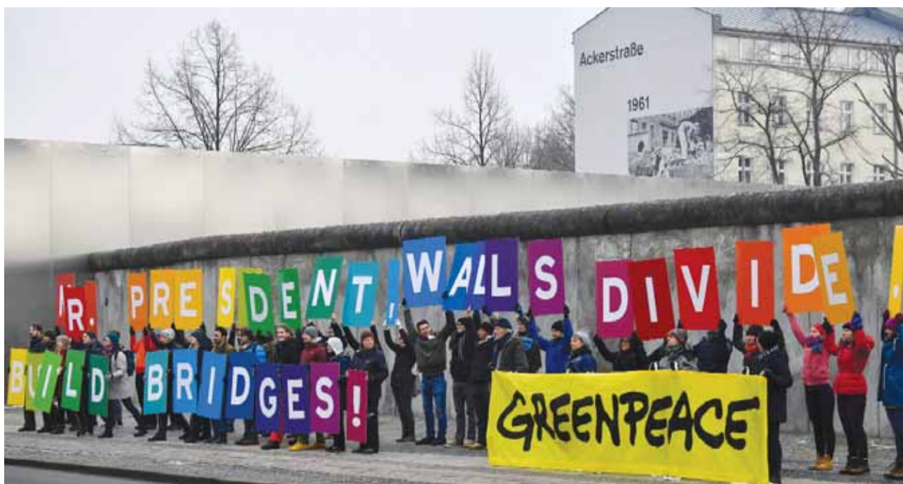
BERLIN: Activists from Greenpeace display a message along the Berlin Wall yesterday to coincide with the inauguration of Donald Trump as the 45th president of the United States.