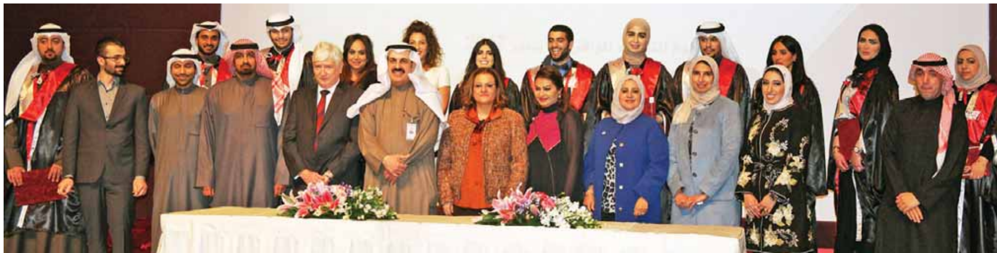
KUWAIT: The Commercial Bank of Kuwait recently celebrated the graduation of a number of its employees from professional programs organized by the Institute of Banking Studies.