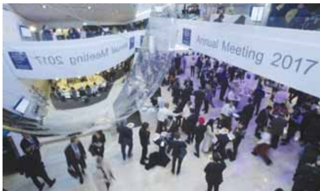
DAVOS: Participants talk on the fourth day of the annual meeting of the World Economic Forum in Davos yesterday. —AP

But the growing gap between the world's rich and poor was also very much on show in Davos-where billionaires, politicians and A-listers party late into the night at invitation-only events, often after arriving by helicopter. —AFP