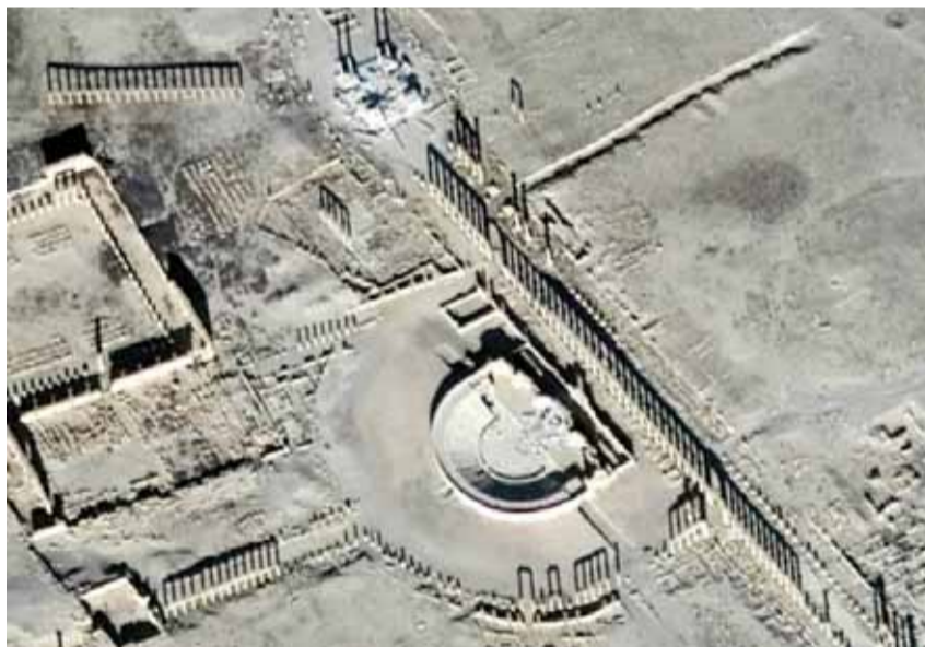
PALMYRA, Syria: This handout picture provided yesterday and taken on Jan 10, 2017 shows a close-up of a satellite-detected image of the damaged Roman tetrapylon (top) and amphitheater (center) in this ancient city.

Syria's government waged a fierce battle to take back all of the northern city of Aleppo from rebel forces. The surprise fall of Palmyra, in the central province of Homs, gave IS a propaganda boost as it faced twin assaults on two of its key strongholds - Raqqa in Syria and Iraq's second city Mosul. Syrian forces have battled to prevent further IS advances around Palmyra, and on Thursday fierce clashes between pro-government fighters and jihadists near a military airport in the region left 30 dead, a monitor said.