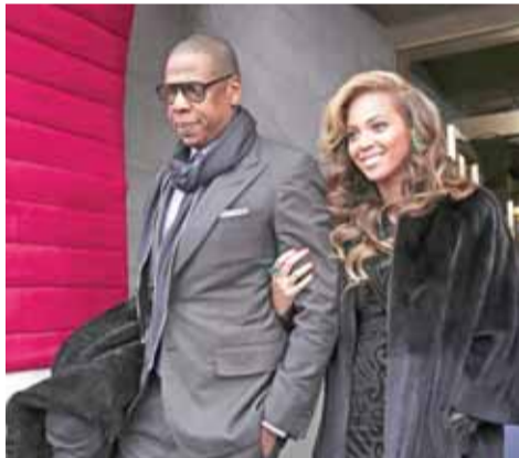
This file photo shows recording artists Jay-Z and Beyonce arriving on the West Front of the Capitol in Washington for the Presidential Barack Obama's ceremonial swearing-in ceremony during the 57th Presidential Inauguration.

Not only is President Barack Obama the nation's first black president, but it's safe to say he has been America's first hip-hop commander-in-chief. Obama embraced hip-hop more than any of his predecessors: He's referenced Jay Z's lyrics and Kanye West in speeches, released playlists on Spotify that included Nas, Chance the Rapper, Mos Def and Method Man, and was caught dancing to Drake's "Hot Line Bling" at a White House event.