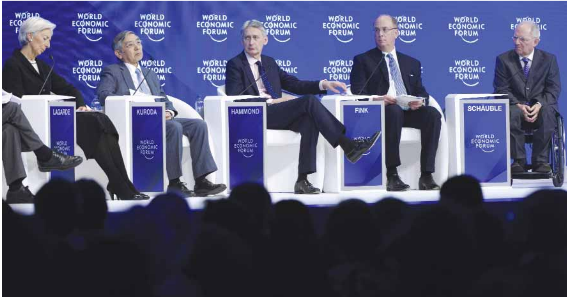
DAVOS: (From left), France's Christine Lagarde, Managing Director of the International Monetary Fund, IMF, Bank of Japan Governor Haruhiko Kuroda, British Treasury Chief Philip Hammond, Laurence D Fink, Chairman and CEO of BlackRock Inc and German Finance Minister Wolfgang Schäuble attend a plenary session of the 47th annual meeting of the WEF in Davos yesterday.