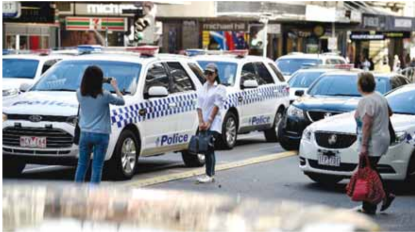
MELBOURNE: Tourists take photos between police cars after a car ploughed into pedestrians in the center of Melbourne yesterday.