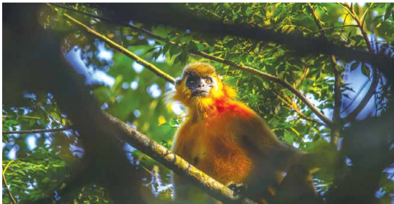
JORHAT: This file photo taken on October 9, 2014 shows a capped gibbon sitting in a tree at the Gibbon Wildlife Sanctuary in Jorhat district in the eastern state of Assam.

Texas had 41 abortion clinics in 17 counties the year before the law took effect and 21 clinics in 6 counties the year after - making Dallas, Fort Worth, Houston, Austin, San Antonio and El Paso the only cities with abortion providers. Most of the more than 53,000 abortions in Texas in 2014 were among women living in those big cities. HB2 had required doctors who perform abortions to have admitting privileges at nearby hospitals and forced clinics to meet hospital-like standards for outpatient surgery. The Supreme Court declared the law unconstitutional in a 5-3 ruling last summer.