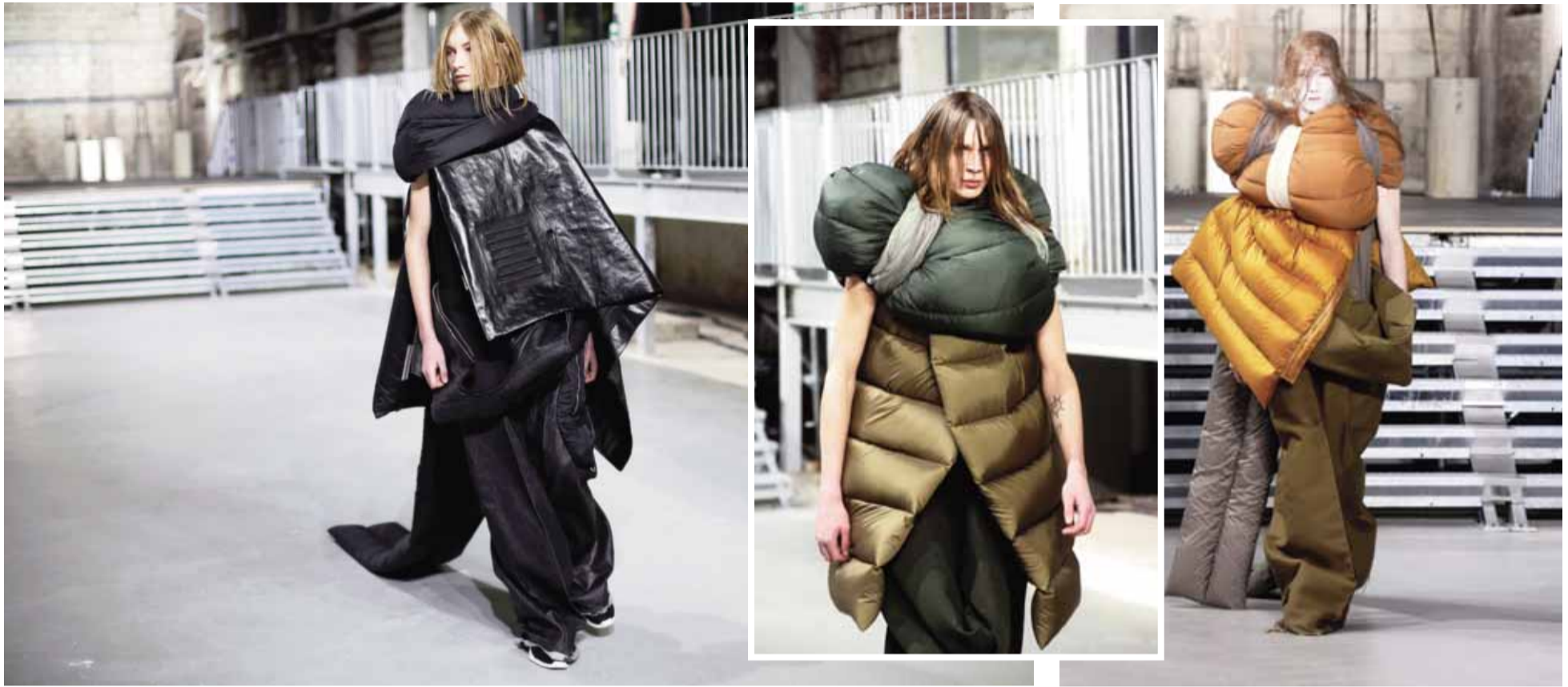
Models wear creations as part of Rick Owens Men's Fall/Winter 2017-2018 fashion collection, presented in Paris.