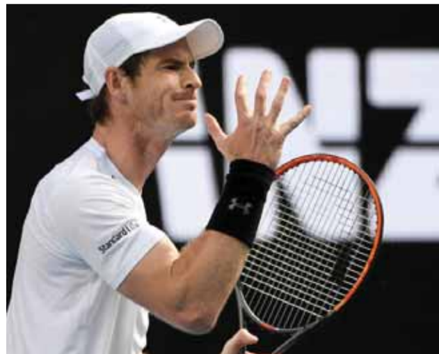
MELBOURNE: Britain's Andy Murray reacts after a point against Sam Querrey of the US during their men's singles third round match on day five of the Australian Open tennis tournament.

Former finalist Jo-Wilfried Tsonga also came through in four sets against American Jack Sock and will play Briton Dan Evans, who beat Australia's Bernard Tomic 7-5, 7-6 (7/2), 7-6 (7/3). In the women's draw, Kerber finally got into her stride with a 6-0, 6-4 destruction of Kristyna Pliskova, the 58th-ranked twin sister of Czech fifth seed Karolina. The German defending champion was an early loser at both of her warm-up tournaments and was taken to three sets in unconvincing wins in round one and two.