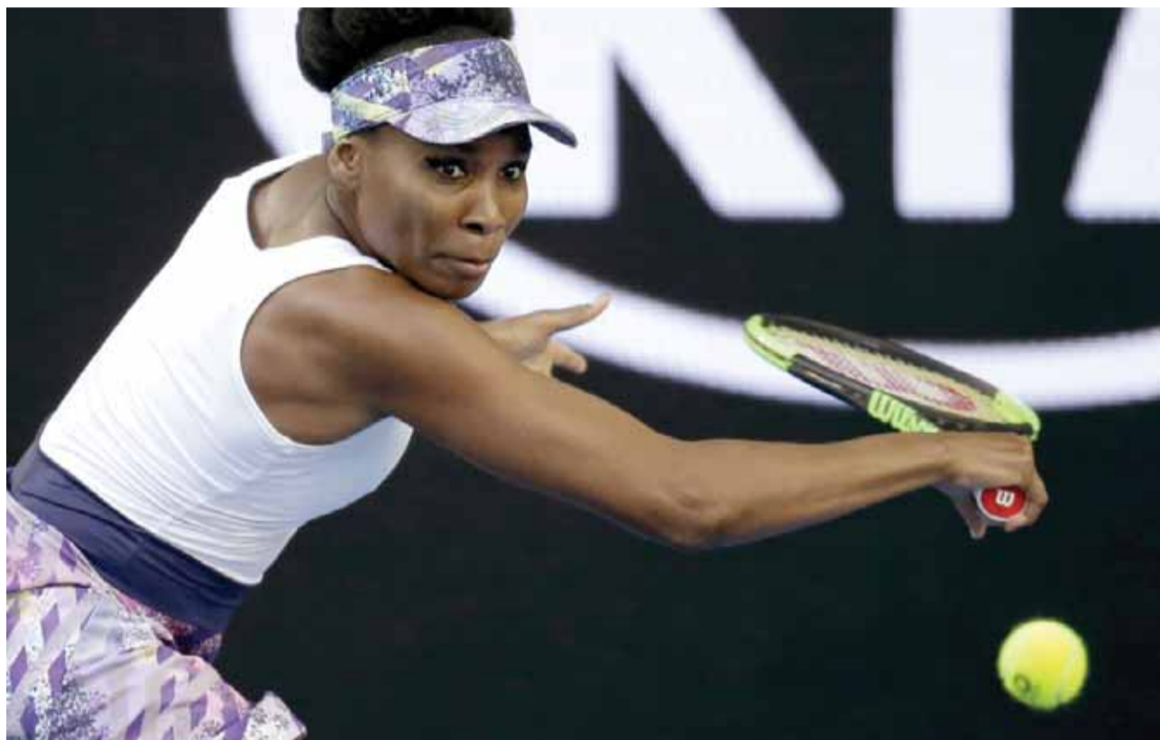
MELBOURNE: United States' Venus Williams eyes on the ball for a return to China's Duan Yingying during their third round match at the Australian Open tennis championships.

Nishikori peeled off a ripping forehand return winner to grab an early break in the final set to hit the front and stay there. He hit 46 winners, 27 of them on his forehand, and dominated the rallies. Nishikori became the first Asian man to contest a Grand Slam final when he lost to Marin Cilic at the 2014 US Open after defeating three top-10 players-Milos Raonic, Wawrinka and Djokovic along the way.