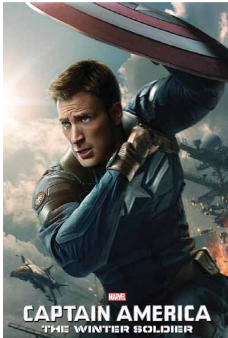
CAPTAIN AMERICA THE WINTER SOLDIER ON STAR MOVIES HD