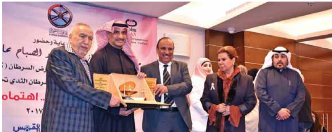
KUWAIT: The Cancer Awareness National Campaign (CAN) organized a ceremony recently to celebrate the conclusion of the second annual breast cancer awareness campaign, which was held under the title 'You Deserve our Attention.'