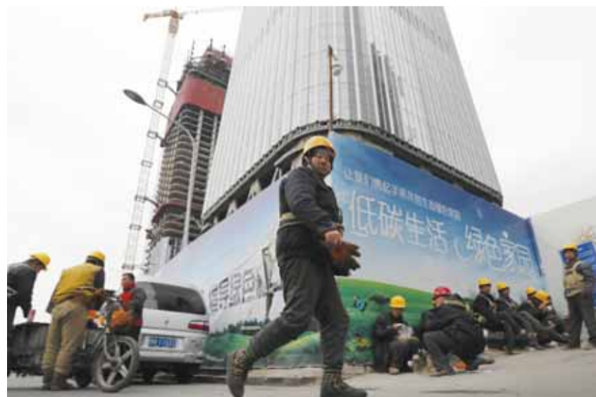
BEIJING: In this Dec 13, 2016 photo, workers buy their lunch outside a construction site at the Central Business District in Beijing. China's economic growth accelerated slightly in the final quarter of 2016 but its full-year performance still was the weakest in nearly three decades.

China's sluggish exports could also come under fresh pressure if US President-elect Donald Trump follows through on pledges to impose tough protectionist measures. "Relations with a Trump administration is the biggest known unknown. Trump advisers and cabinet-nominees have identified the US-China relationship as in need of adjustment to support the president-elect's objective of a manufacturing renaissance," said Condon. — Reuters