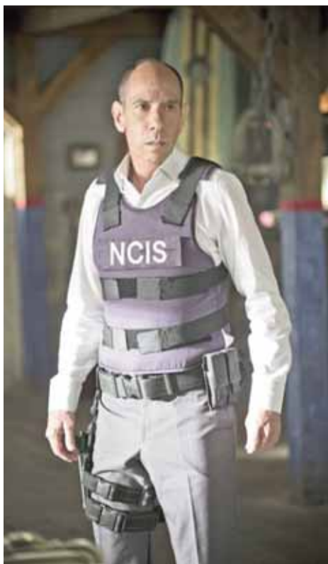
This image released by CBS shows Miguel Ferrer in character as NCIS Assistant Director Owen Granger in NCIS: Los Angeles.

M iguel Ferrer, who brought stern authority to his featured role on CBS' hit "NCIS: Los Angeles" and, before that, to NBC crime drama "Crossing Jordan," has died. CBS said Ferrer died Thursday of cancer at his Los Angeles home. He was 61. He had played assistant director Owen Granger on "NCIS: Los Angeles" since 2012. Before that, he played the chief medical examiner and gruff-but-supportive boss to series star Jill Hennessy for the six seasons of "Crossing Jordan."