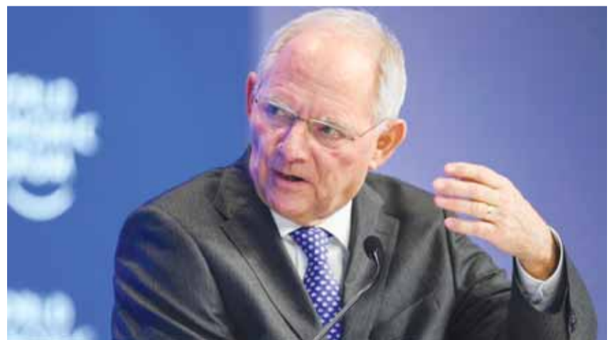
DAVOS: German Finance Minister Wolfgang Schaeuble gestures during a session on the closing day of the World Economic Forum yesterday.