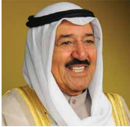
His Highness the Amir Sheikh Sabah Al-Ahmad Al-Jaber Al-Sabah