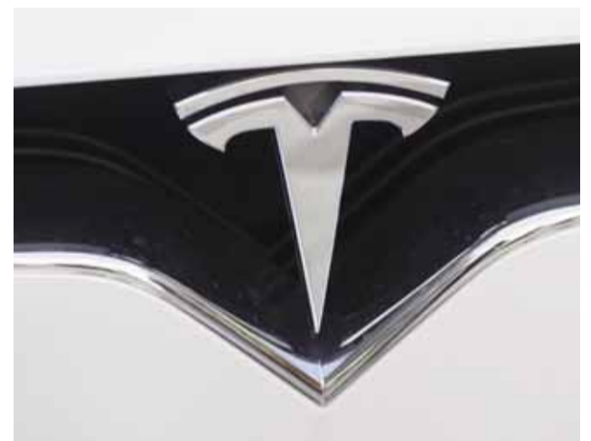
WASHINGTON: This file photo taken on December 20, 2016 shows the Tesla logo seen in Washington, DC.

Some reports said the driver may have been watching a DVD at the time, ignoring Tesla's warning to remain vigilant while using the Autopilot system. Thomas noted the software update Tesla rolled out in September that included revised driver monitoring, including a "strike out" feature to shut off the system for the remainder of the drive after an "extended period of driver disengagement."