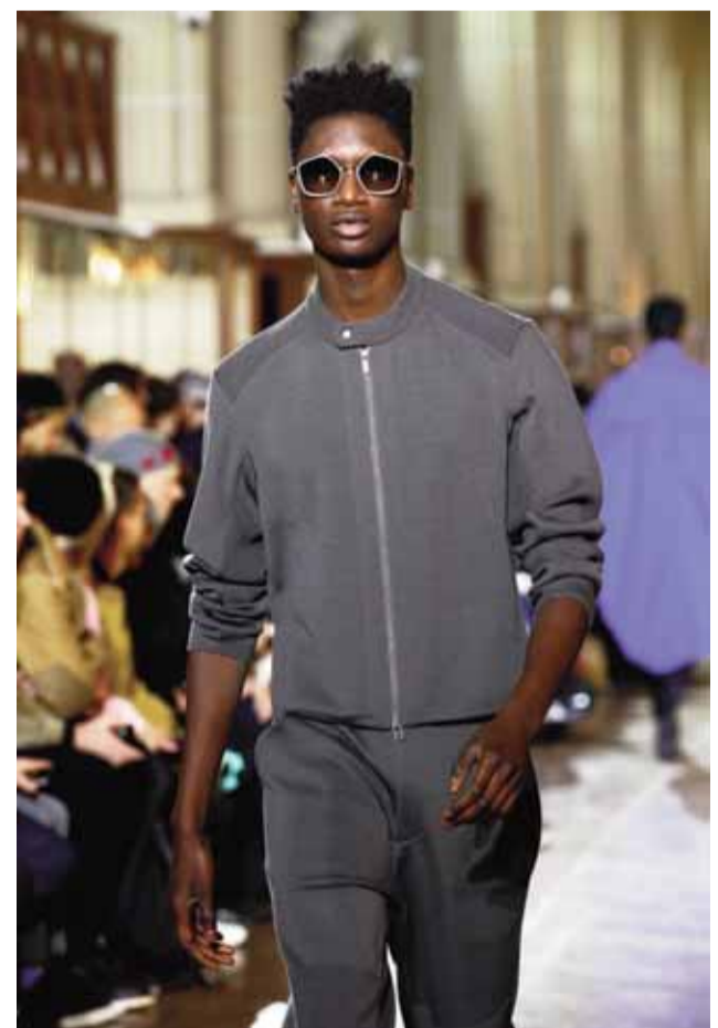
Models wear creations for Louis Vuitton Men's Fall Winter 2017-2018 fashion collection.