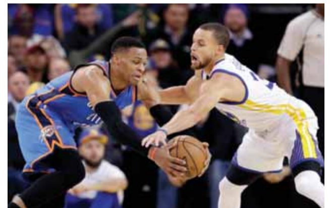
OAKLAND: Golden State Warriors' Stephen Curry, right, defends Oklahoma City Thunder's Russell Westbrook during the second half of an NBA basketball game.

James is the all-time top All-Star scorer with 291 points. He will make his 13th consecutive All-Star start in 14 NBA seasons. Only Kobe Bryant and Kareem Abdul-Jabbar have started more. Butler and DeRozan reached their third All-Star Games while Irving, the 2014 All-Star Game MVP, is in his fourth game in six seasons. Antetokounmpo, 22, makes his All-Star debut as the first Milwaukee player in the game since Michael Redd in 2004. Durant, an eight-time All-Star selection, has the best All-Star Game scoring average at 25.6 points. Harden makes his fifth All-Star appearance while Curry, the two-time reigning NBA MVP, and Davis are in the All-Star Game for the fourth time and Leonard, the two-time reigning NBA Defensive Player of the Year, starts for the second year in a row. —AFP