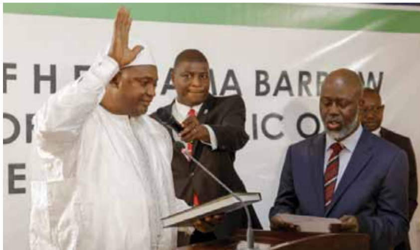
DAKAR: Adama Barrow (left) is sworn in as president of Gambia at Gambia's embassy in Senegal on Thursday.

Barrow, who was sworn in at The Gambia's embassy in Dakar on Thursday, remained in Senegal awaiting the outcome of the talks, with hopes of taking over the reins of state from Jammeh as soon as his safety could be guaranteed. He hailed a "victory of the Gambian nation" and demanded loyalty from his