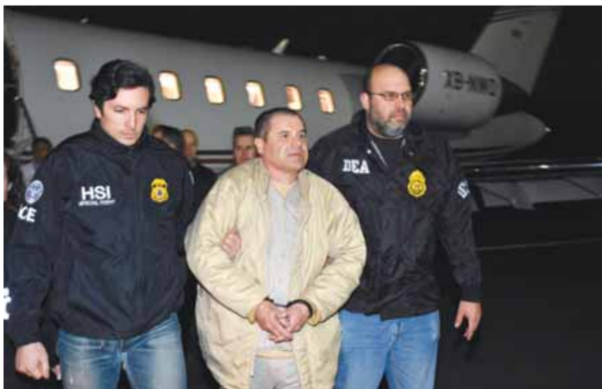
RONKONKOMA, New York: US law enforcement authorities escort Joaquin "El Chapo" Guzman from a plane to a waiting caravan of SUVs at Long Island MacArthur Airport on Thursday.