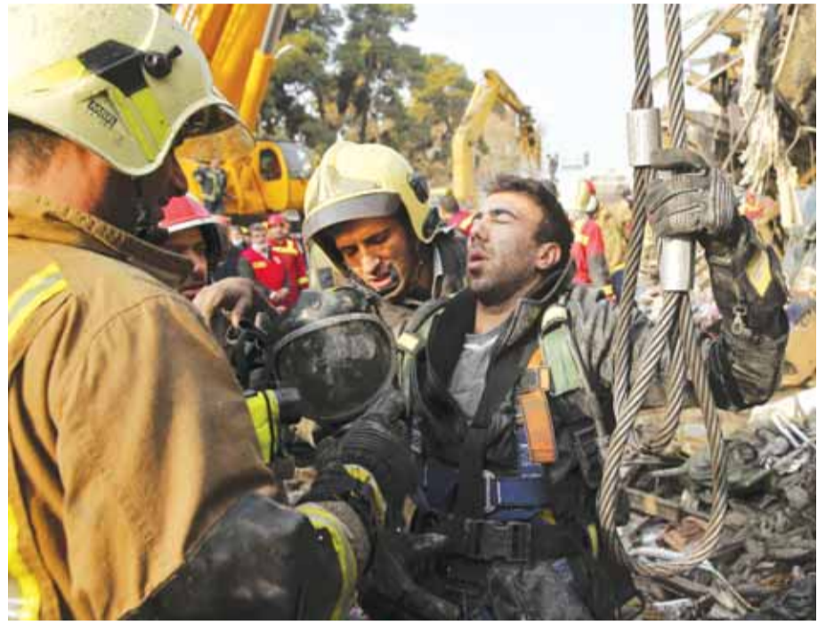
TEHRAN: Iranian firefighters help their colleague yesterday during debris removal at the Plasco building which caught fire and collapsed on Thursday.