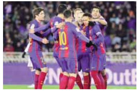
Barca end Sociedad hoodoo