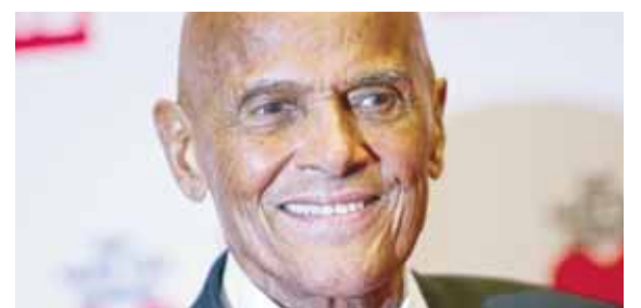
In this file photo, Harry Belafonte arrives at the charity gala Ein Herz fuer Kinder (A heart for children) in Berlin.

"Most of the things that fuel prejudice, that fuels hate ... are contrived," Belafonte, who turns 90 on March 1, said in a release. "The differences that exist between us should be things that attract us to one another, not alienate us from one another." Belafonte has been a longtime civil rights activist, marching with the likes of the Rev. Martin Luther King Jr. He is an honorary co-chair of the Women's March today in Washington. The album is set for release on Feb 24. — AP