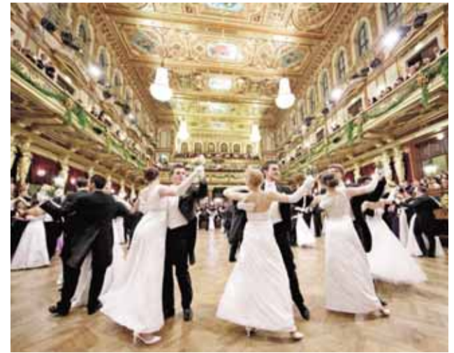
Debutants perform during the opening ceremony of the 76th Vienna Philharmonic Ball.