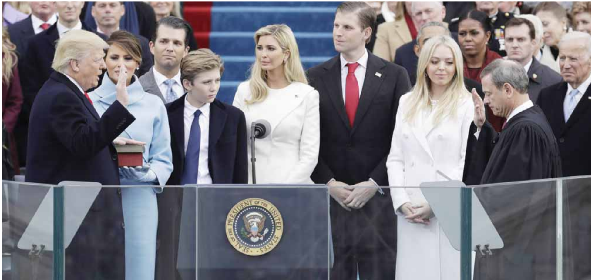
WASHINGTON: Donald Trump is sworn in as the 45th president of the United States by Chief Justice John Roberts as Melania Trump and his family look on during the 58th Presidential Inauguration at the US Capitol in Washington yesterday.