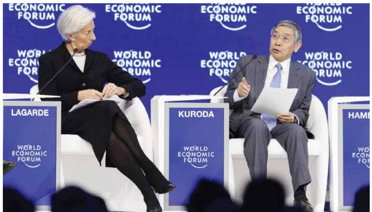
DAVOS: International Monetary Fund (IMF) Managing Director Christine Lagarde (left) listen to the Governor of the Bank of Japan Haruhiko Kuroda during a session at the Congress hall on the closing day of the World Economic Forum yesterday.