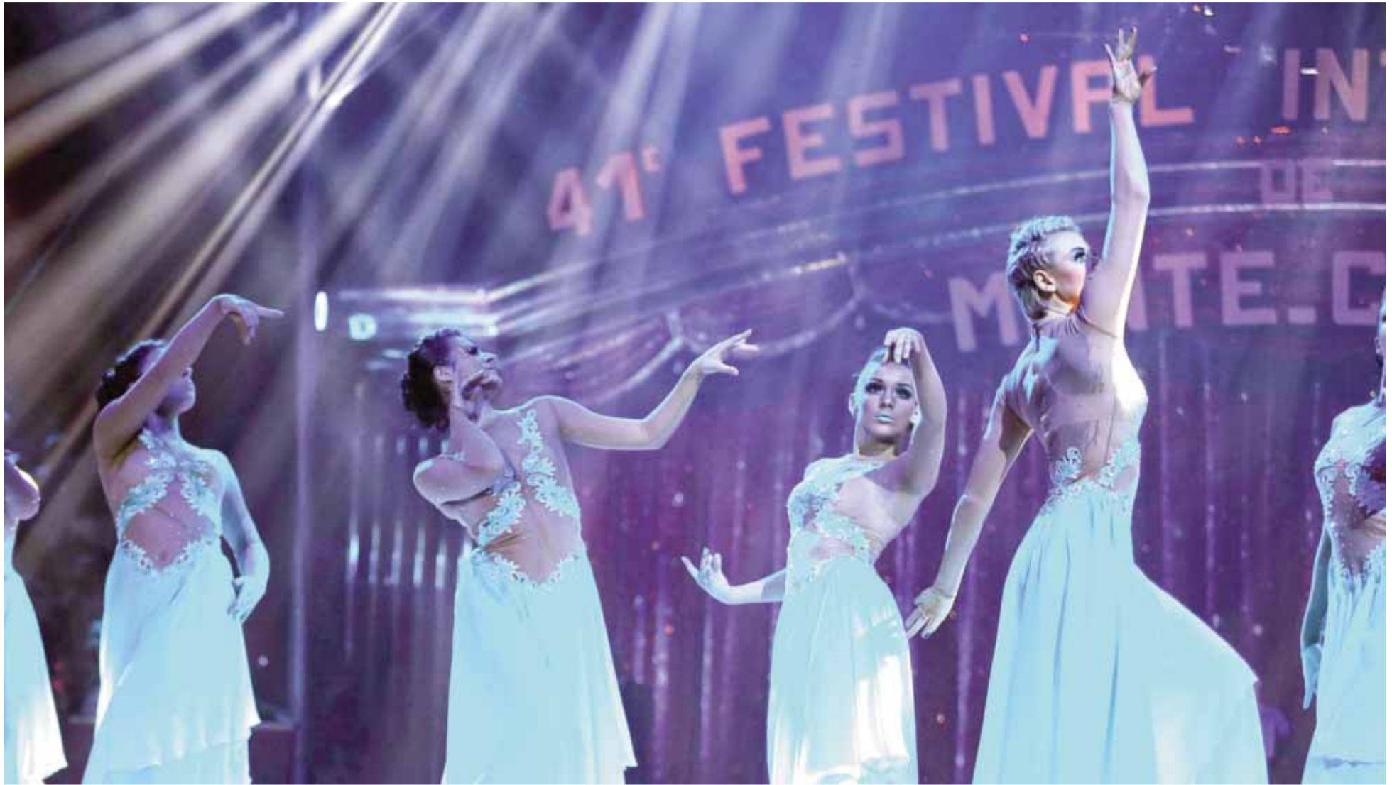
The Skokov Troop performs during the opening of the 41st Monte-Carlo International Circus Festival in Monaco.