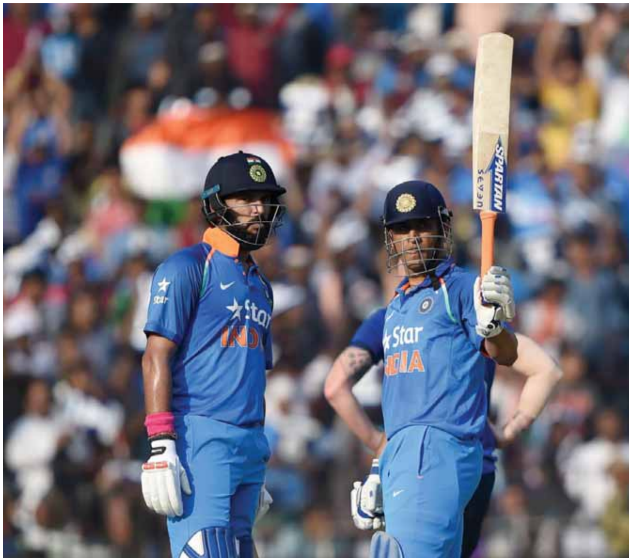
CUTTACK: India's Mahindra Singh Dhoni (R) raises his bat after completing his half century as India's Yuvraj Singh (L) looks on during the second One Day International cricket match between India and England at the Barabati Stadium

"I am not satisfied with my effort," he said. "The focus was on playing a big innings in my first time as a Test opener. It was a big opportunity for me so if I had made a bigger contribution, I would have felt better. "Shakib and I tried to lengthen the innings after two early wickets. After I got out we lost two more wickets which put us on the back-foot. If we had handled that period better, we could have been in a better position." Soumya's recall and elevation to opener came as injuries kept Imrul Kayes, Mushfiqur Rahim, and Mominul Haque, and a combined 98 Tests worth of experience, out of the match. In their place were Soumya for his fourth Test and debutants Nurul Hasan and 18-year-old Nazmul Hossain with the fledgling trio all featuring well in the innings. Soumya brought up his 50 driving Colin de Grandhomme to the boundary and had a life on 52 when dropped off the same bowler in the first of four missed chances by New Zealand. — AFP