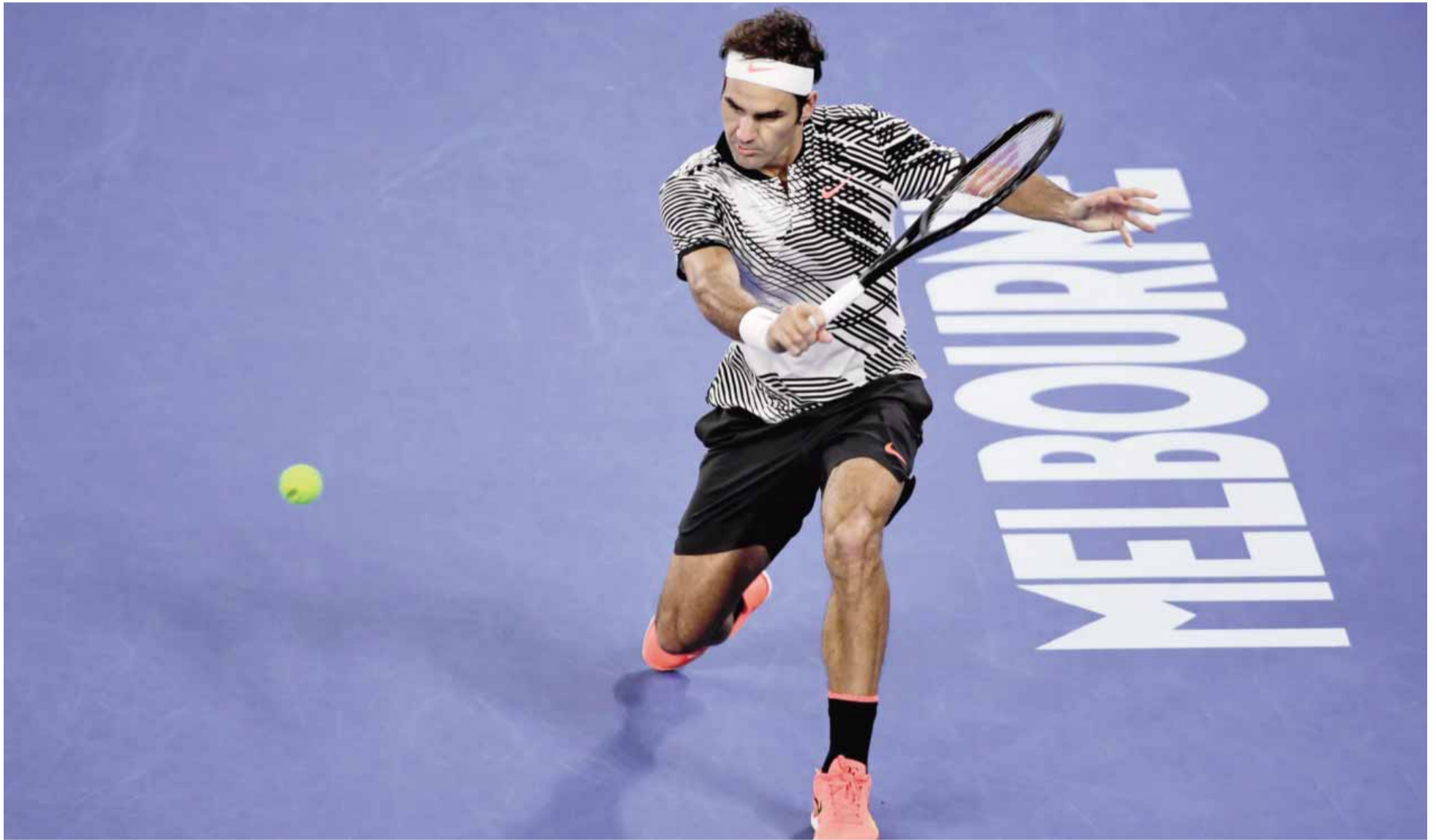
MELBOURNE: Switzerland's Roger Federer hits a return against Czech Republic's Tomas Berdych during their men's singles third round match on day five of the Australian Open tennis tournament.