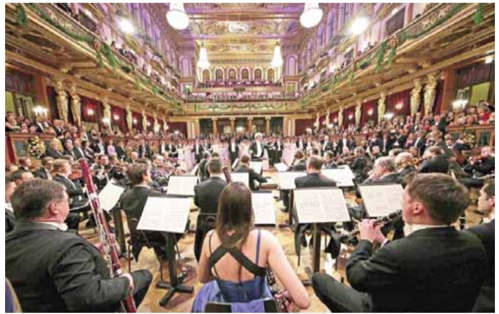
Conductor Semyon Bychkov and musicians perform at the opening ceremony of the Ball of the Vienna Philharmonic Orchestra in Vienna.