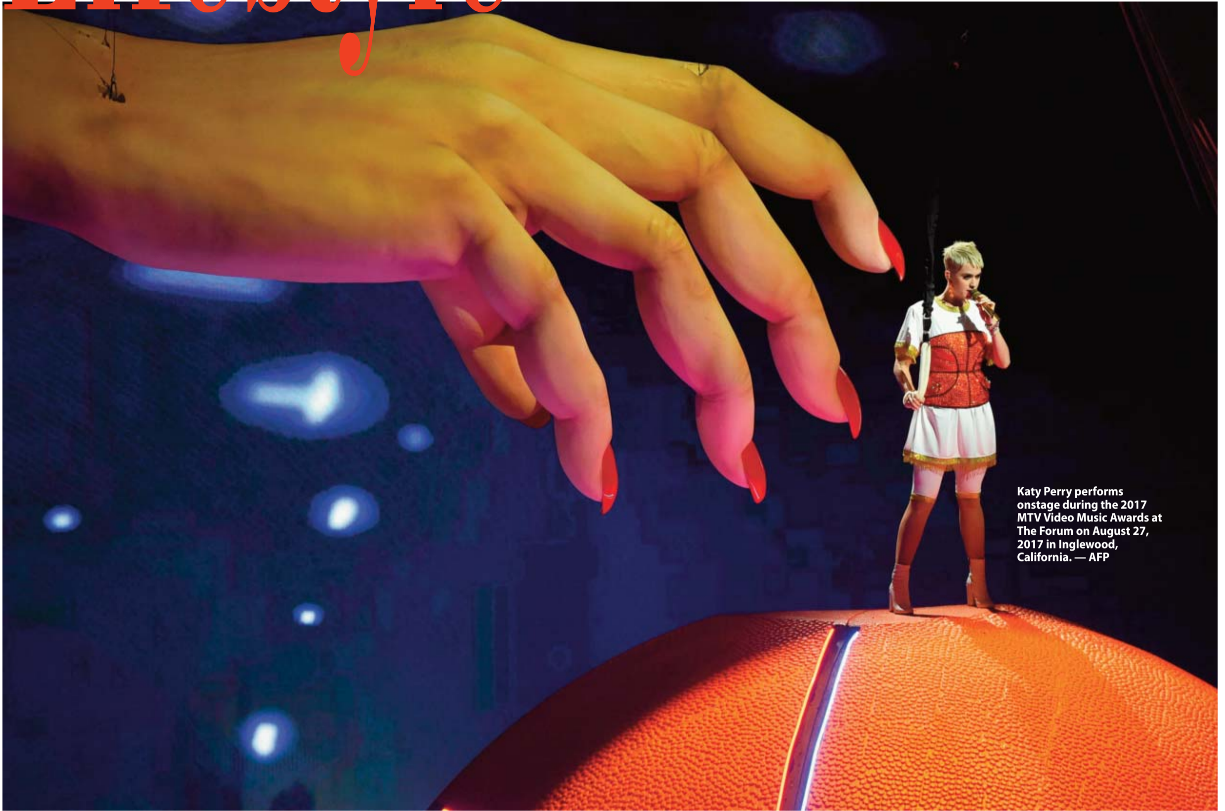
Katy Perry performs onstage during the 2017 MTV Video Music Awards at The Forum on August 27, 2017 in Inglewood, California.