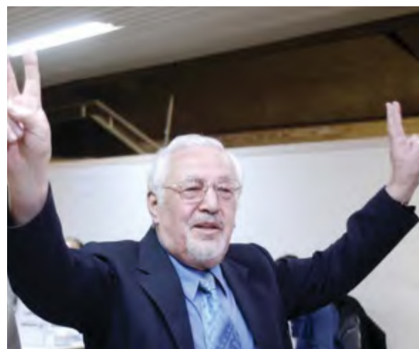
TEHRAN: In this file photo, Ebrahim Yazdi, once Iran's Foreign Minister, flashes the victory sign, as he arrives at the Interior Ministry, to register as a presidential candidate, in Tehran, Iran.

Mehdi Karroubi and Mir Hossein Mousavi, two reformist candidates in that election, claimed widespread fraud and led street protests against the results. Thousands were arrested and dozens killed during the regime's crackdown on the protests, known as the Green Movement. Yazdi and his party were close to the reformists, and he endorsed President Hassan Rouhani's bid for presidency in 2013 and this year. His body will be repatriated to Iran for burial in the coming days, the ISNA news agency reported those close to him as saying.—AFP