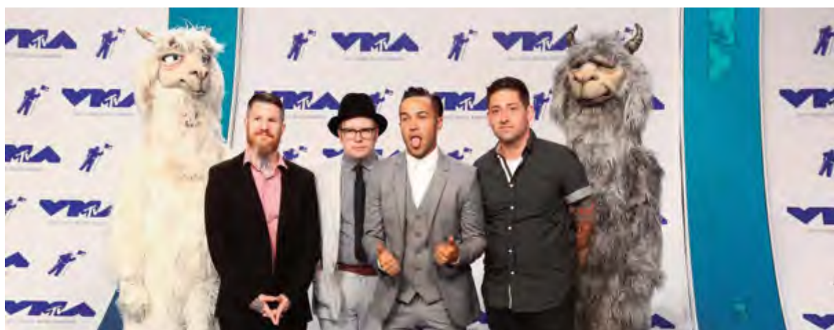
(From left) Andy Hurley, Patrick Stump, Pete Wentz and Joe Trohman of musical group Fall Out Boy arrive at the MTV Video Music Awards 2017.