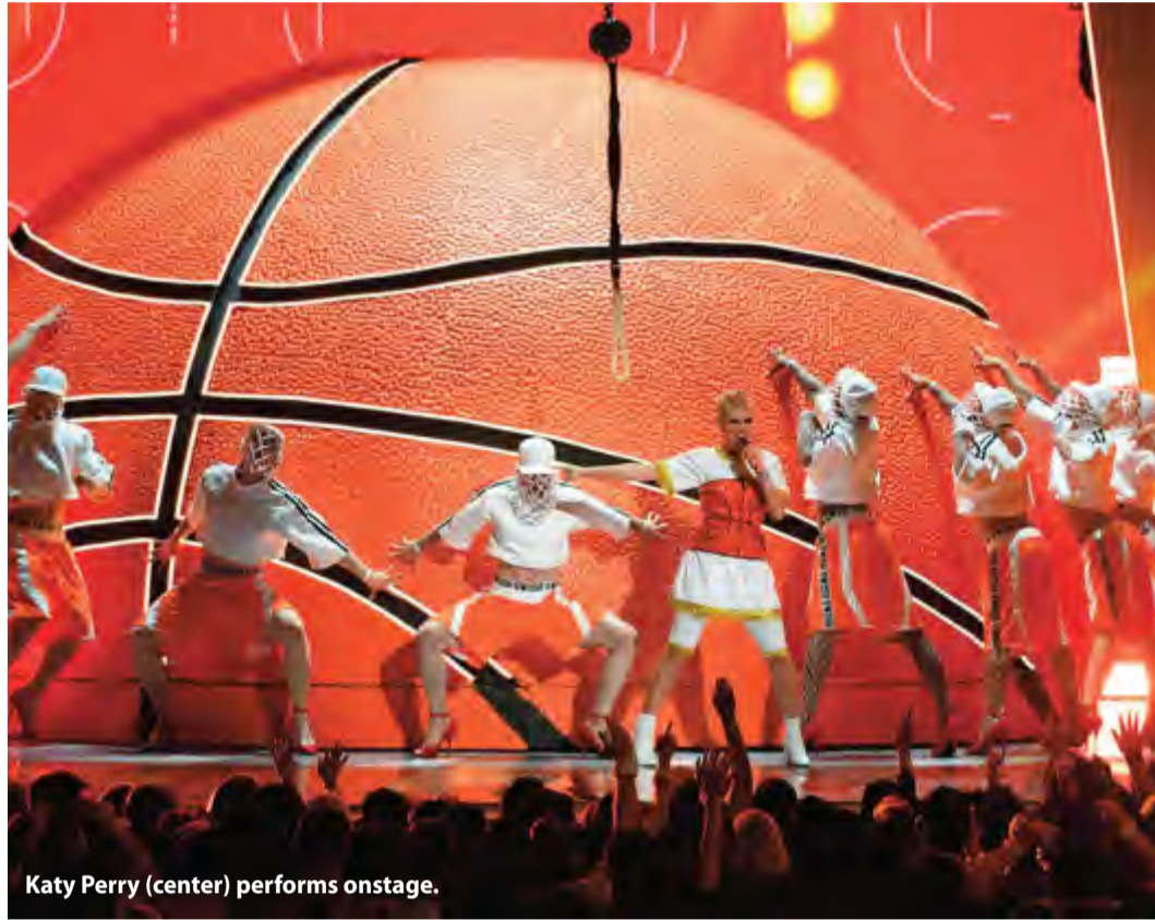
Katy Perry (center) performs onstage.