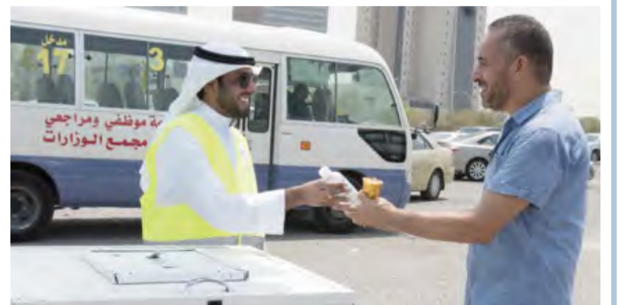
Kuwait International Bank staff distributes cold refreshments and water during the hot summer.

The Bank constantly strives to support different segments across the local community, while simultaneously encouraging them to participate in volunteer work. He also lauded the efforts of KIB volunteers who have demonstrated their strong sense of social responsibility, which has extended past their job functions to lend a helping hand to anyone in need. It is also worth noting that as part of its leading social responsibility program, KIB continuously strives to adopt a number of various humanitarian programs and activities that reflect its social responsibility vision on the one hand, and its deep-rooted commitment to the principles of Islamic Shari'ah on the other.