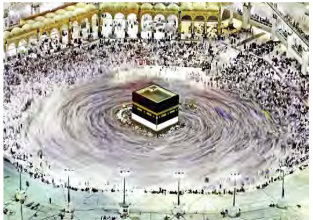
MAKKAH: This long exposure photograph shows pilgrims circumambulating the Kaaba, Islam's holiest shrine, in the Grand Mosque on Sunday prior to the start of the annual hajj pilgrimage.