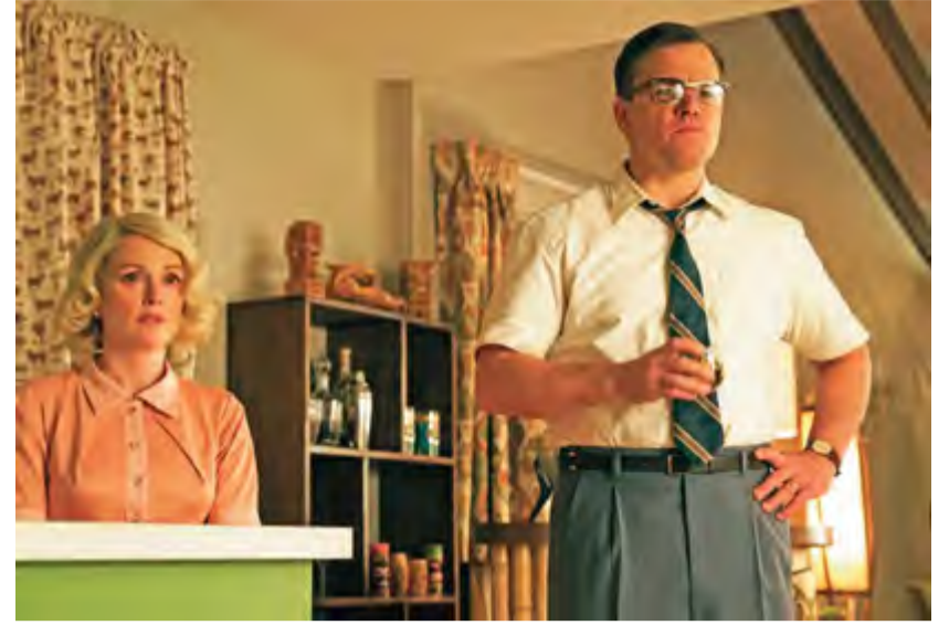
This image released by Paramount Pictures shows Julianne Moore, left, and Matt Damon in a scene from "Suburbicon."