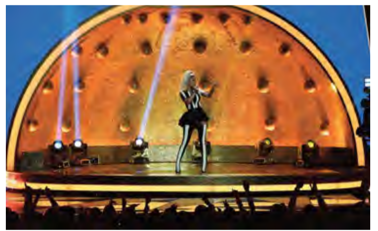
Nicki Minaj performs onstage.