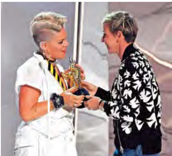
Pink (left) accepts the Michael Jackson Video Vanguard Award from Ellen DeGeneres onstage.