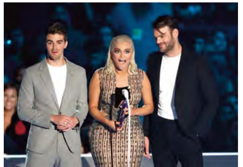
Bebe Rexha (center) and The Chainsmokers' Andrew Taggart (left) and Alex Pall (right) speak onstage.