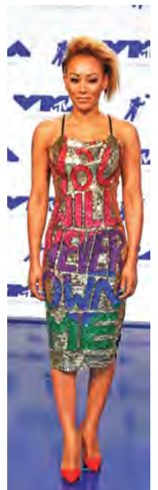
Singer Mel B