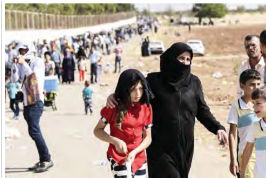
KILIS: Syrian refugees arrive at the Oncupinar crossing gate, close to the town of Kilis, south central Turkey, in order to cross to Syria for the Eid Al-Adha Muslim holiday.