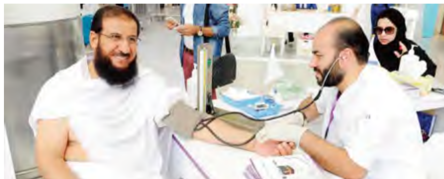
Pilgrims undergo medical checkup before leaving for hajj.

JEDDAH: The General Secretariat of the Organization of Islamic Cooperation (OIC) has strongly condemned the suicide attack at a mosque in Kabul, Afghanistan that killed at least 28 people and injured many others. The OIC Secretary General, Dr Yousef A Al-Othaimeen, voiced his shock and dismay at this horrific attack that targeted worshippers praying in a holy place. He stated that the perpetrators and supporters of this deplorable crime have definitely no place among Muslims. He further expressed his sincere condolences to the families of the victims, the people and the Government of Afghanistan, and prayed for the quick recovery of the wounded. While reiterating the OIC's support to Afghanistan in fighting extremism and terrorism, the Secretary General appealed to all Afghans and Muslim leaders to vigorously work toward solidarity and brotherhood among themselves and to unite their ranks against any attempt to stir sectarian divide.