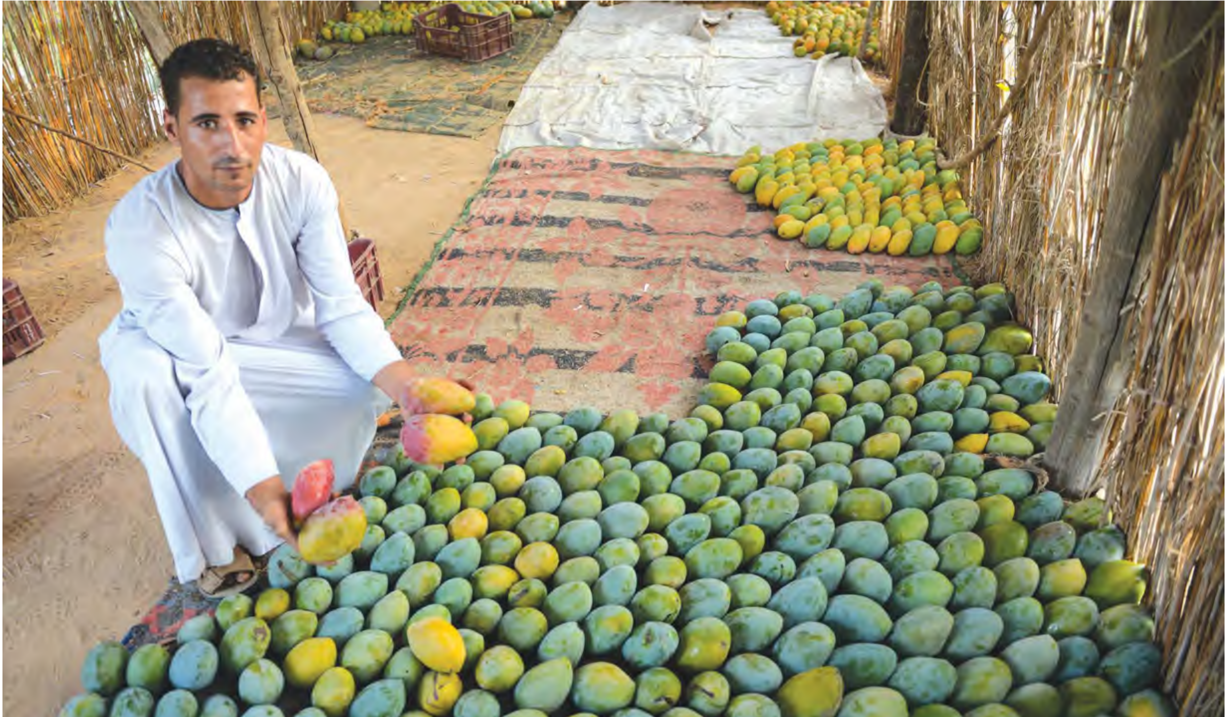
An Egyptian farmer poses with mangoes at a field in Wadi Al-Natroun area in Al-Beheira Governorate.