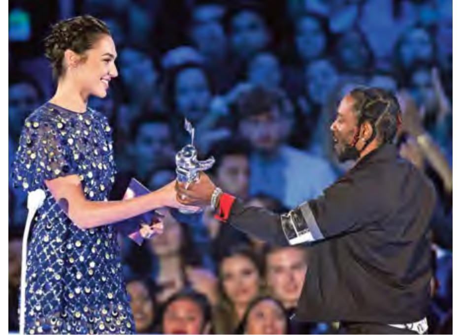
Gal Gadot, left, presents the award for video of the year to Kendrick Lamar for "HUMBLE." at the MTV Video Music Awards.