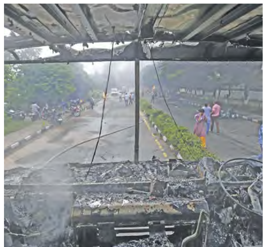
PANCHKULA: In this file photo, a fire brigade truck burned by Dera Sacha Sauda sect members lies near Panchkulais court house, India.

In June and August, massive landslides in southwestern Sichuan province killed more than 30 and left scores missing. In July, 63 people were killed by landslides and floods in the central province of Hunan. Some 1.6 million people were forced from their homes. Last week, powerful Typhoon Hato killed 18 people as it tore across southern China, including Hong Kong and Macau.—AFP