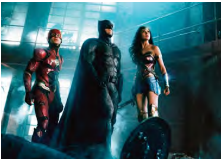
This image released by Warner Bros. Pictures shows Ezra Miller, from left, Ben Affleck and Gal Gadot in a scene from "Justice League."