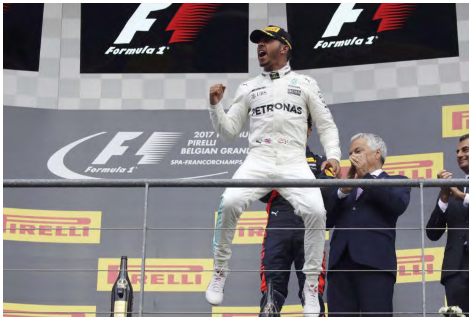
FRANCORCHAMPS: Mercedes driver Lewis Hamilton of Britain, center, jubilates on the podium after winning the Belgian Formula One Grand Prix in Spa-Francorchamps, Belgium, Sunday. Ferrari driver Sebastian Vettel of Germany placed second and Red Bull driver Daniel Ricciardo of Australia placed third.