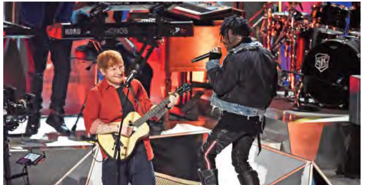
Ed Sheeran, left, and Lil Uzi Vert perform a medley at the MTV Video Music Awards.

Taylor Swift declared the end of her reputation in her new music video for her first single "Look What You Made Me Do," from her next album. In the video, which premiered during the VMAs first hour, the pop star emerged from the grave as a zombie and sang her accusations in a dark world where previous versions of herself come back to haunt her.