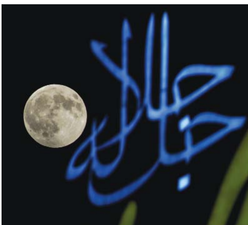
KUWAIT: Photo shows the full moon over Anjafa Beach.