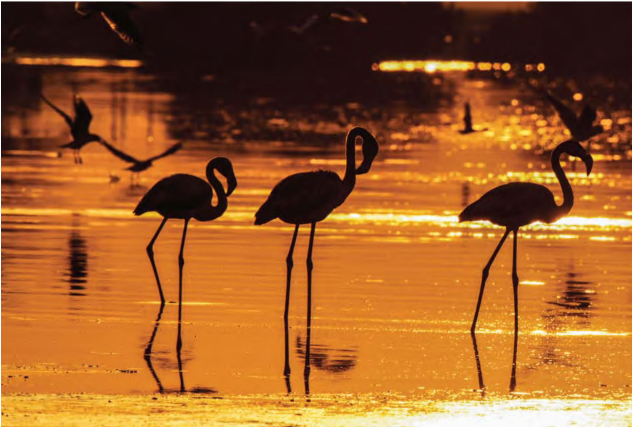
KUWAIT: Flamingo birds spotted at one of the beaches of Kuwait Bay.