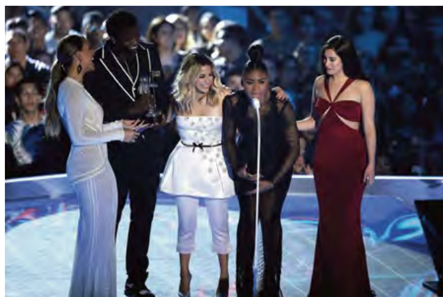
Gucci Mane, second from left, and from right Dinah Jane, Ally Brooke, Normani Kordei, and Lauren Jauregui of Fifth Harmony, accept the award for best pop video for "Down".