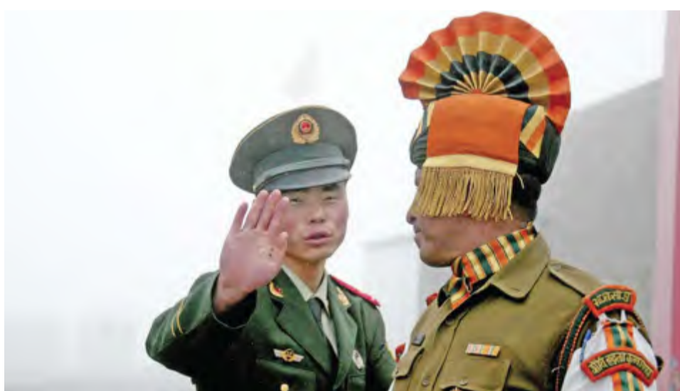
SIKKIM: This file photo shows a Chinese soldier, left, gesturing next to an Indian soldier at the Nathu La border crossing between India and China in India's northeastern Sikkim state.

The plateau is strategically significant as it gives China access to the so-called "chicken's neck"—a thin strip of land connecting India's northeastern states with the rest of the country. Another inci-