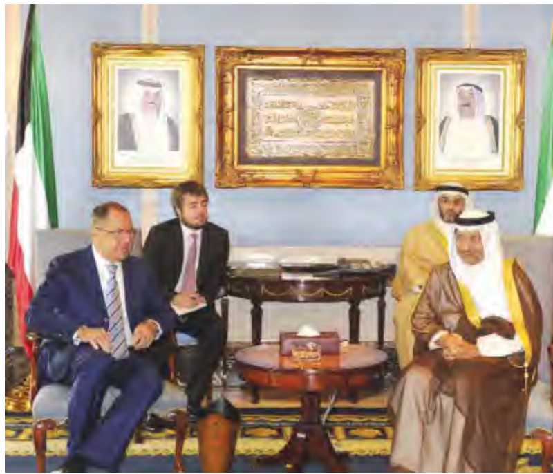
KUWAIT: His Highness the Prime Minister Sheikh Jaber Al-Mubarak Al-Hamad Al-Sabah receives Foreign Minister of the Russian Federation Sergey Lavrov.