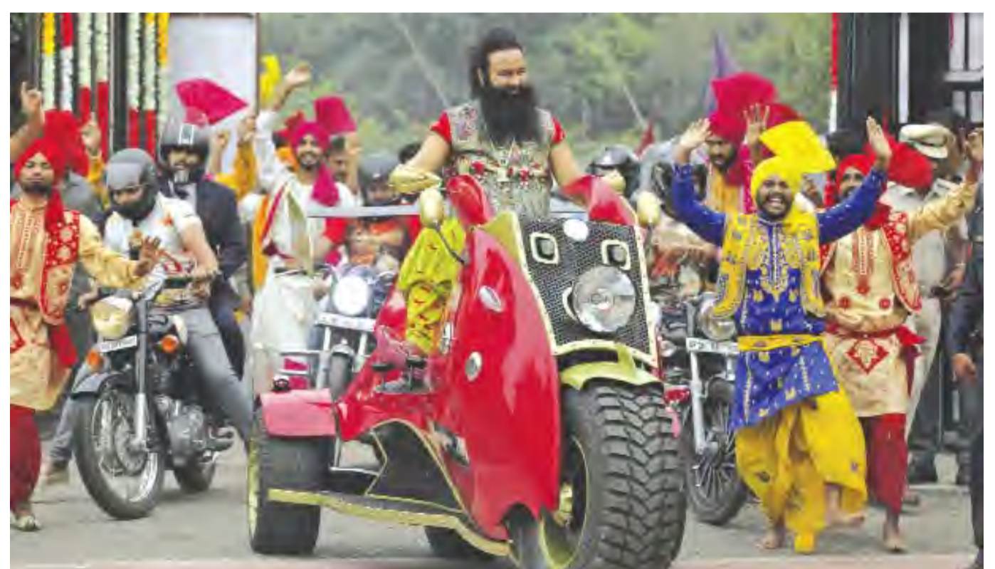
In this Oct 5, 2016 file photo, an Indian guru who calls himself Dr Saint Gurmeet Singh Ram Rahim Insan rides a motorcycle as he arrives for a press conference ahead of the release of his new film 'MSG: The Warrior Lion Heart' in New Delhi.

In 2002 an anonymous letter was sent to then prime minister Atal Bihari Vajpayee accusing the guru of repeatedly raping the sender and several other women at the headquarters of his sect in Haryana. A judge asked the Central Bureau of Investigations to look into the accusations, but it took years to trace the alleged victims and it was not until 2007 that two women came forward and filed their complaint. A local journalist who had covered the case was later killed. Singh still faces a