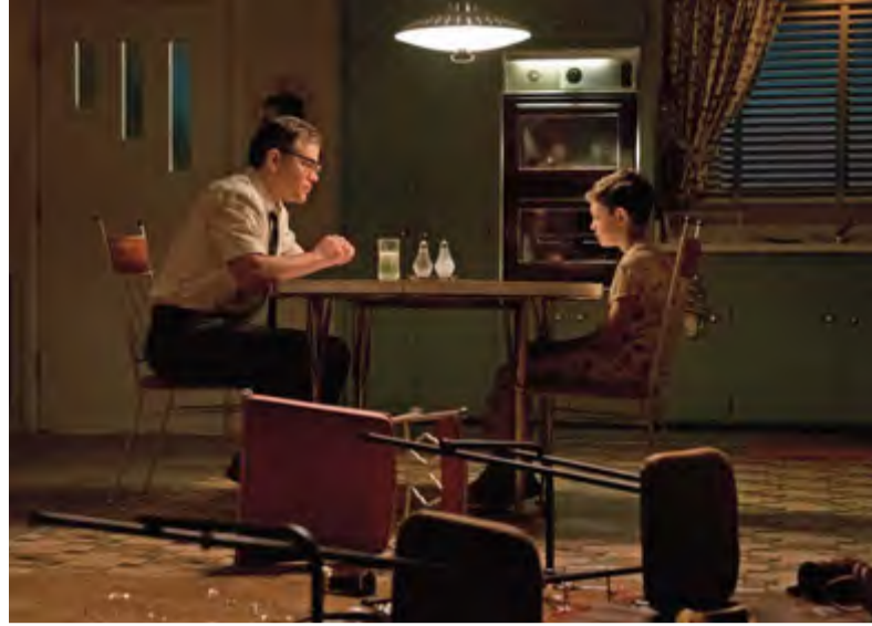
Matt Damon, left, and Noah Jupe in a scene from "Suburbicon."