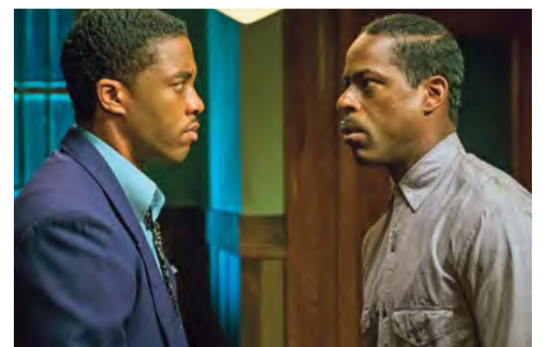
This image released by Open Road Films shows Chadwick Boseman, left, and Sterling K. Brown in a scene from "Marshall."