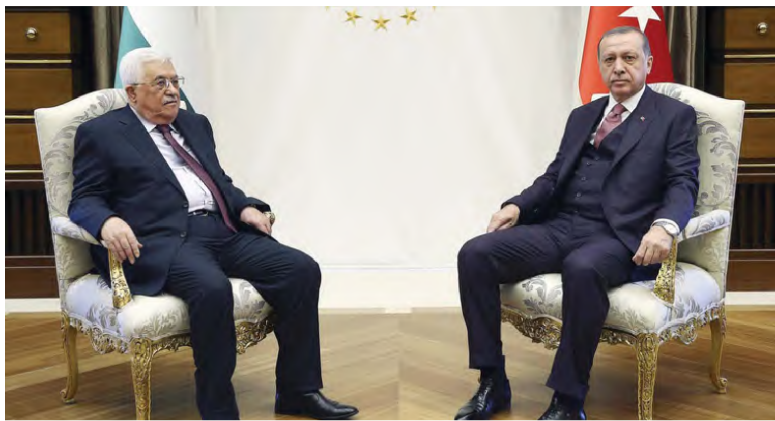
ANKARA: Turkey's President Recep Tayyip Erdogan, right and Palestinian Authority President Mahmoud Abbas, left, hold a meeting at the Presidential Palace in Ankara, Turkey.

The fate of one soldier remains unclear. The bodies of five Hezbollah fighters killed in fighting the militants were also handed over, allowing for the transfer of militants.