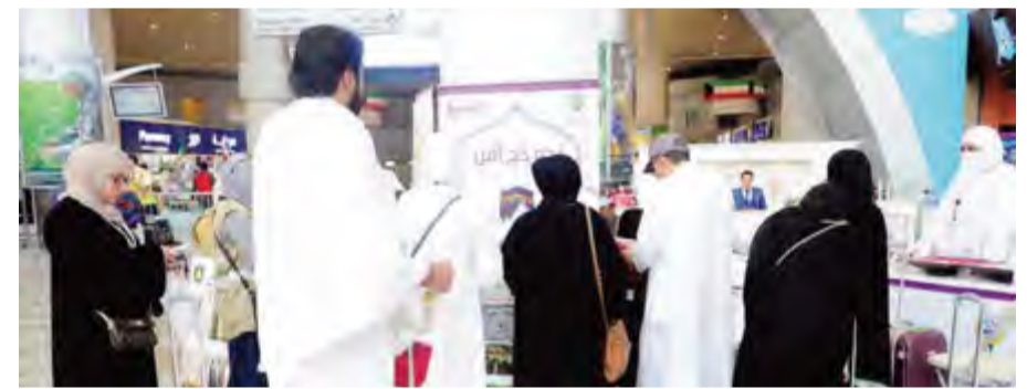
KUWAIT: Kuwait's International Airport has been teeming with activity as pilgrims begin the Holy Islamic journey of Hajj.