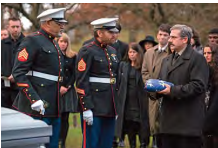
This image released by Lionsgate shows Laurence Fishburne, from left, Bryan Cranston and Steve Carell in a scene from "Last Flag Flying."

F BI battles with the White House. Revelatory government leaks on the front page. Soldiers haunted by unwinnable wars. Courtroom clashes over civil rights. Movies take years to make, but many of this fall's films may feel almost preternaturally programmed for the President Trump era. Some have been in development for more than a decade, others have been fast-tracked since the election. But moviegoers will soon have no shortage of films offering timely reflections on America and the policies of its president. The fall movie season has much more than politics on its mind. There are a string of major releases - "Blade Runner 2049" (Oct 6), "Thor: Ragnarok" (Nov 3), "Justice League" (Nov 17), "Star Wars: The Last Jedi" (Dec 15) - that many expect will reverse the brutal summer box-office slide. And of course, many Oscar contenders are also lined up, including festival hits "Call Me By Your Name" (Nov 24), "The Florida Project" (Oct 5) and "Mudbound" (Nov 17).