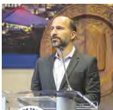
Expedia's CEO Dara Khosrowshahi

Khosrowshahi has been CEO of Expedia since August of 2015. The online booking site is one of the largest travel agencies in the world. He will replace ousted CEO Travis Kalanick and faces the difficult task of changing Uber's culture that has included sexual harassment and allegations of deceit and corporate espionage.