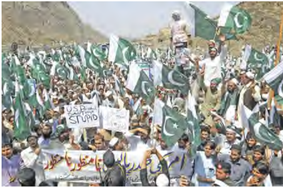
TORKHAM: Pakistani tribal people rally against the United States in Torkham, a border town along the Afghanistan border.—AP

tic about the proposal. In Kabul, Gen. Dawlat Waziri, spokesman for the Afghan Defense Ministry, said militants along the border were not the only border issue with Pakistan but that the extremists have sanctuaries in big Pakistani cities as well. "If Pakistan really wants to fight terrorism, first of all they should start fighting them (terrorists) in their big cities and then come down to the borders," Waziri said.—AP