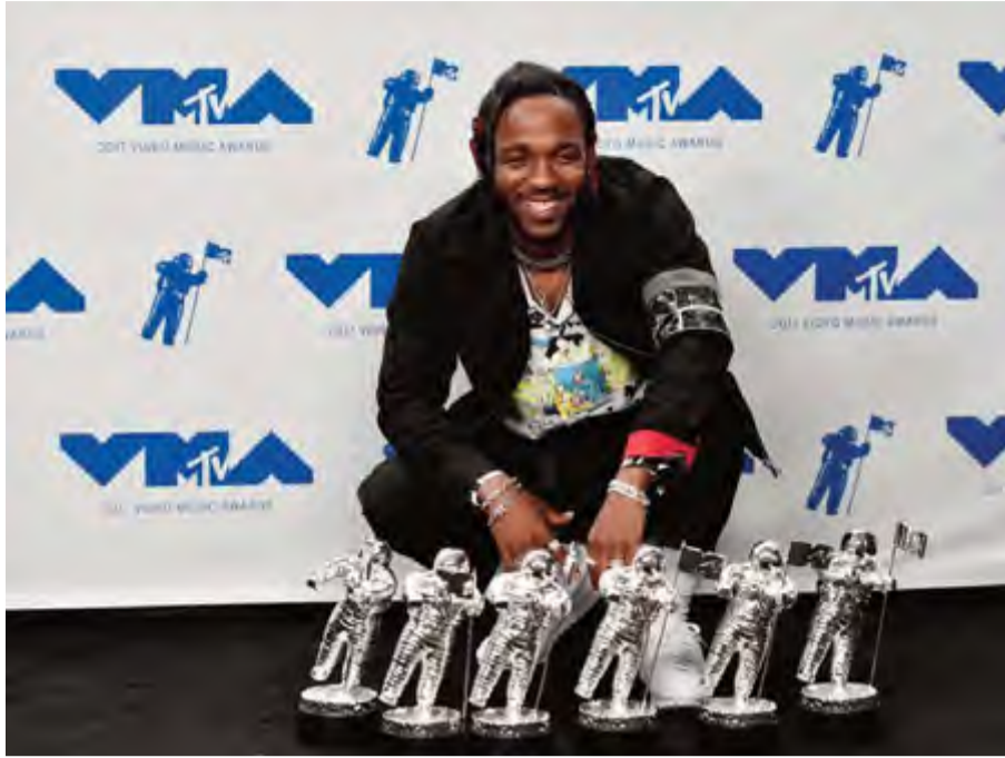
Kendrick Lamar poses in the press room with the awards for best hip hop video, best direction, best cinematography, best art direction, best visual effects, and video of the year for "HUMBLE." at the MTV Video Music Awards at The Forum in Inglewood, Calif.