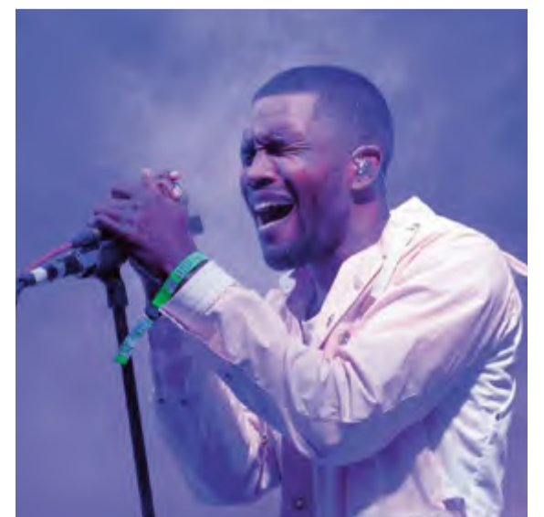
This file photo shows Frank Ocean performing during the 2014 Bonnaroo Music & Arts Festival in Manchester, Tennessee.

Conor McGregor. Ocean made waves but largely won acceptance in the often macho world of hip-hop when he revealed at the start of his career that his life's first love was a man.