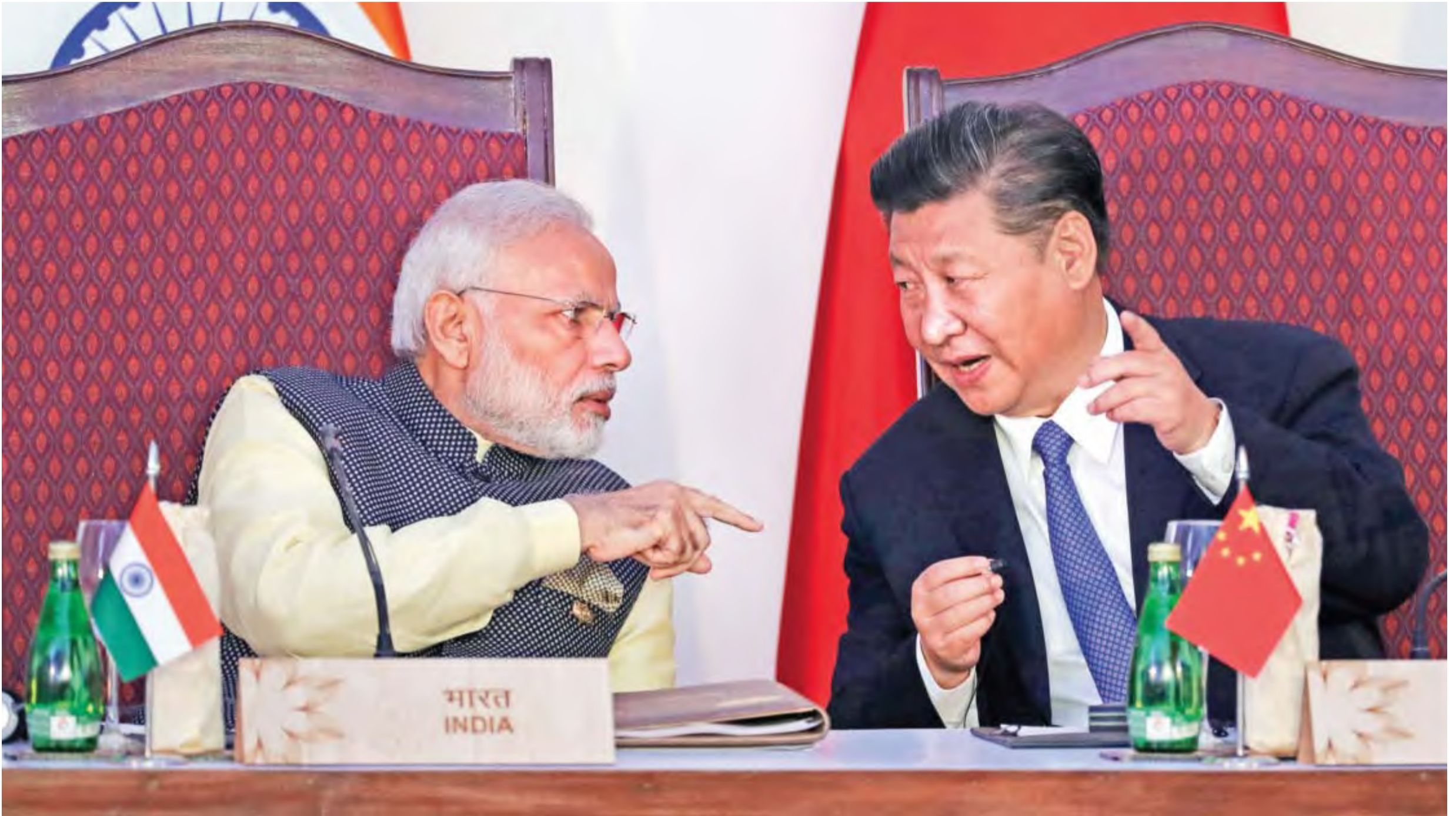
GOA: In this file photo, Indian Prime Minister Narendra Modi, left, talks with Chinese President Xi Jinping at the BRICS summit in Goa, India.