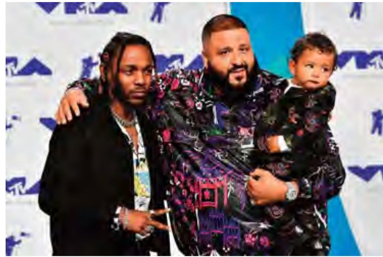
Kendrick Lamar (left) and DJ Khaled attend the 2017 MTV Video Music Awards.