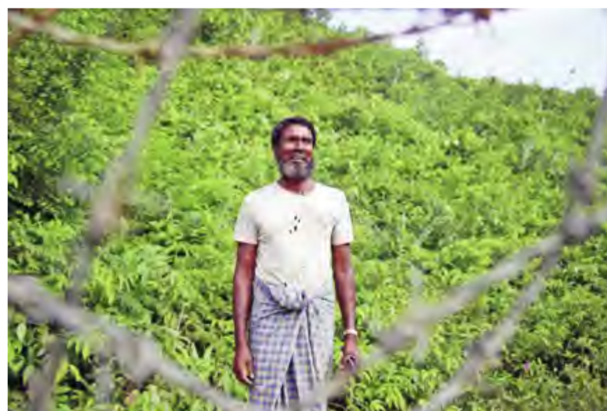
A Rohingya man cries after failing to cross Myanmar's barbed wire border fence due to the presence of Bangladeshi guards near Maungdaw on the frontier with Bangladesh yesterday. (See Page 9)