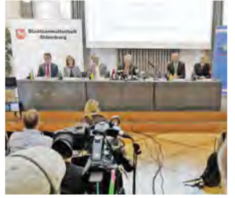
German killer nurse jailed for murder of 90 patients