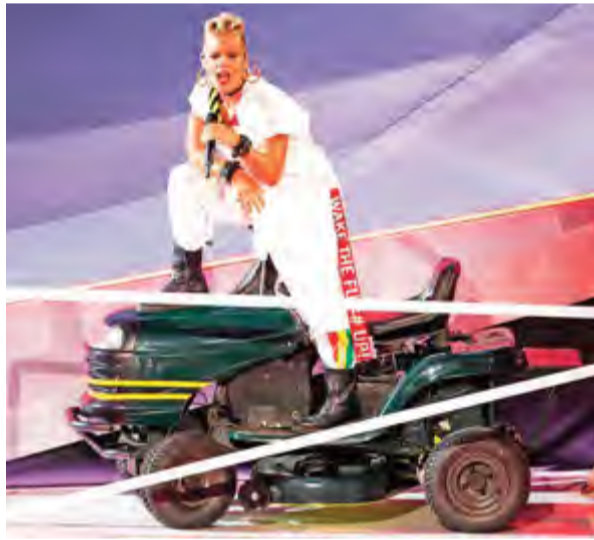
Pink performs at the MTV Video Music Awards 2017.