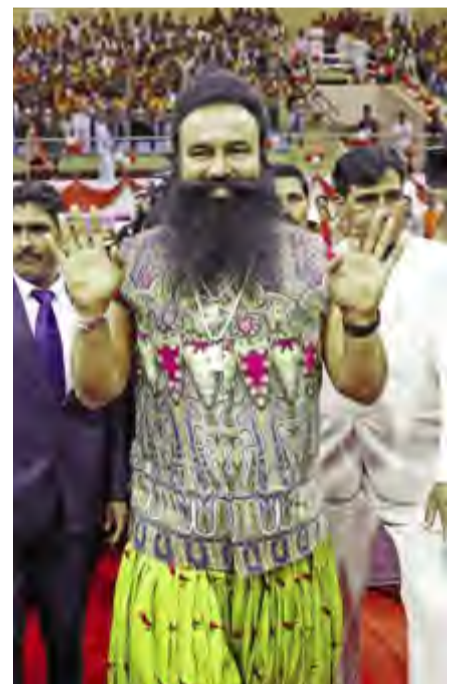
Gurmeet Ram Rahim Singh

Authorities had imposed a security clampdown on the city of Rohtak where Singh is being held due to fears of a repeat of Friday's violence, when tens of thousands of his supporters set fire to cars and clashed with security forces. Prime Minister Narendra Modi condemned the violence but his ruling Bharatiya Janata Party, which is also in power in Haryana, was criticized for failing to anticipate the riots. Police were taking no chances yesterday in Rohtak,