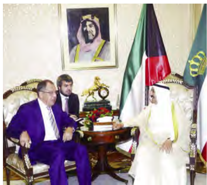
KUWAIT: HH the Amir Sheikh Sabah Al-Ahmad Al-Jaber Al-Sabah meets Russian Foreign Minister Sergey Lavrov yesterday. (See Page 3)