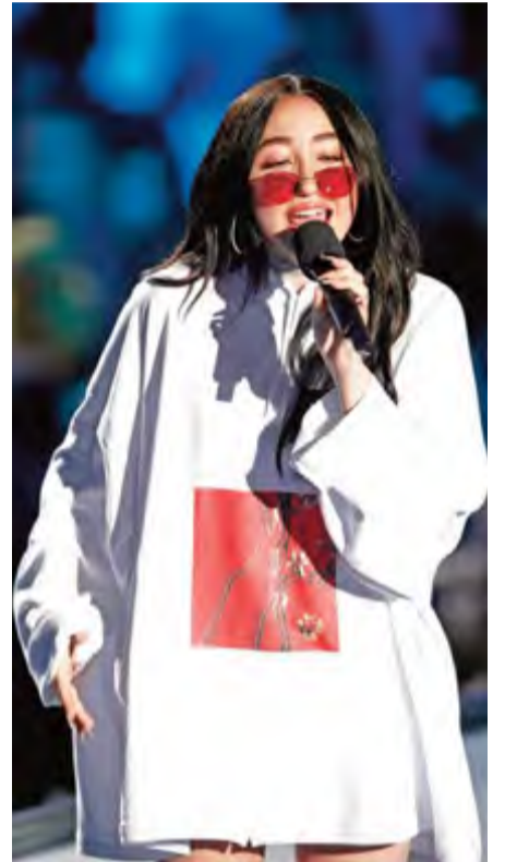
Noah Cyrus speaks onstage.