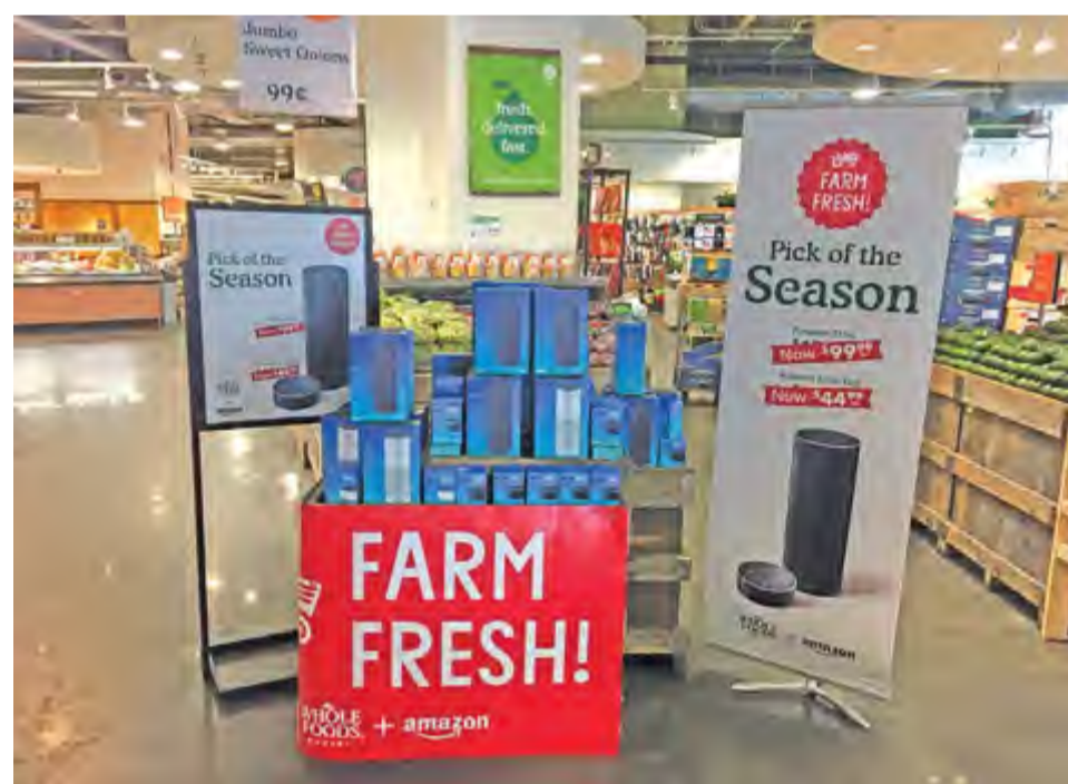
NEW YORK: Amazon's Echo and Echo Dot appear on sale at a Whole Foods Market in New York yesterday.

Amazon already lowered prices at Whole Foods yesterday on a range of kitchen staples, including ground beef and rotisserie chicken. Whole Foods was just starting to test a loyalty program. But soon, shoppers at all stores will be able to tap Amazon's $99-a-year Prime loyalty program to get discounts at stores. And they will eventually be able to buy some Whole Foods products from Amazon.com. Lockers will be added in some locations so