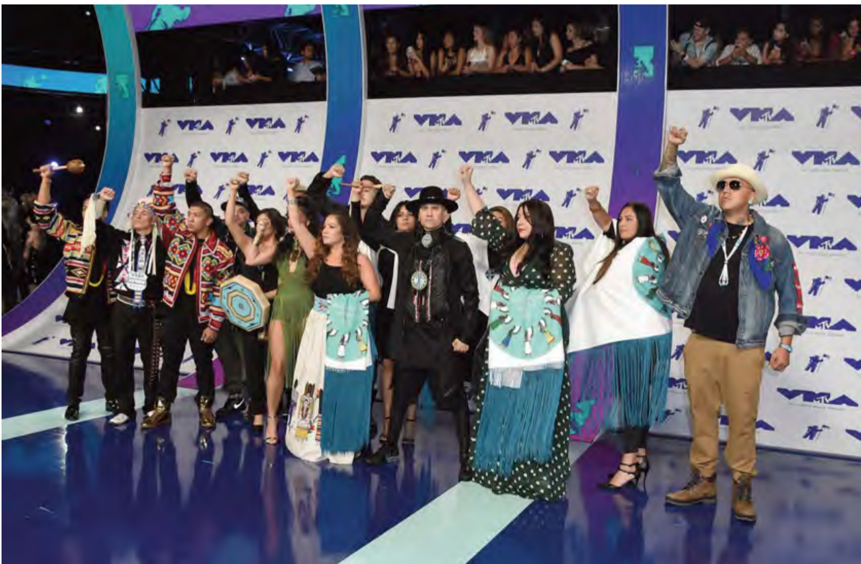
Taboo, fourth from left, and Native American musicians raise their fists in protest of the Dakota Access Pipeline as they arrive at the MTV Video Music Awards.