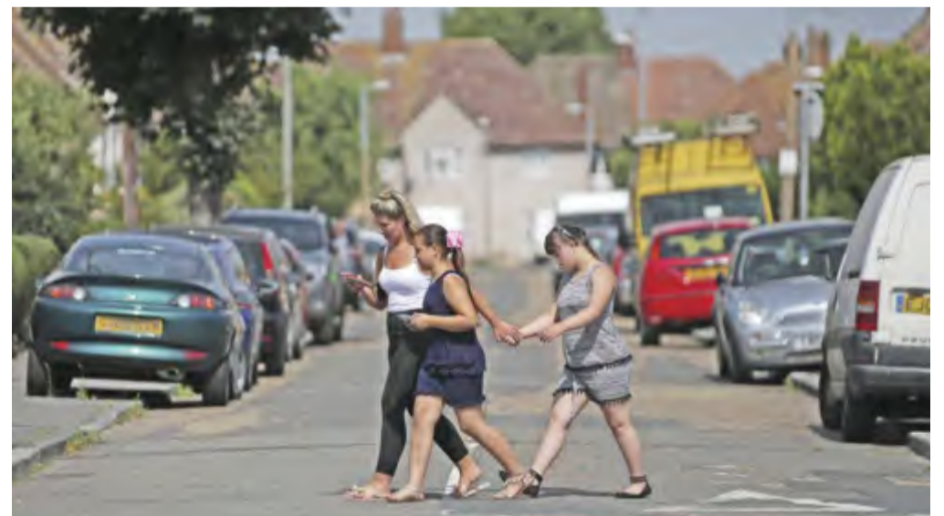
TILBURY: Residents cross the road in the dock town of Tilbury in Essex, east of London.

“Let's have the negotiators do their negotiation... as for flexibility, we are working within the mandate given us by the European Council