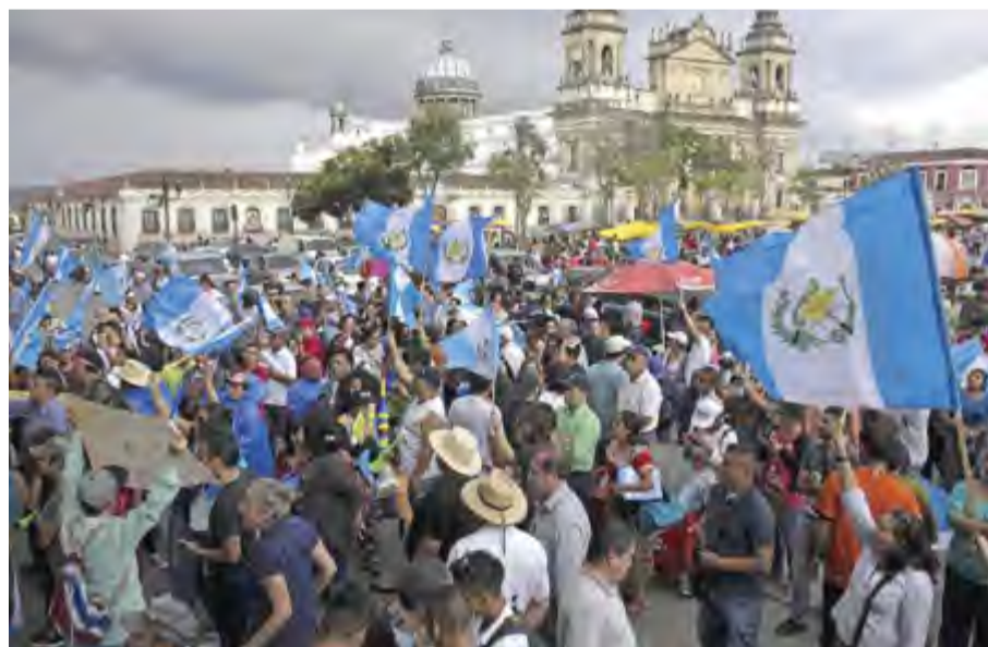
GUATEMALA CITY: People gather to protest Guatemala's President Jimmy Morales outside the National Palace of Culture in Guatemala City.