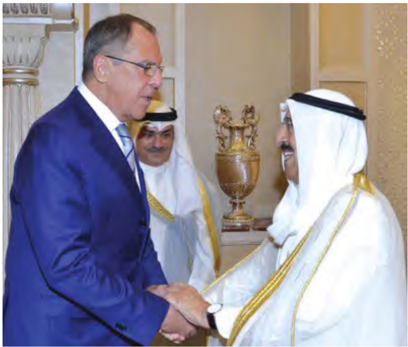
KUWAIT: His Highness the Amir Sheikh Sabah Al-Ahmad Al-Jaber Al-Sabah yesterday held a luncheon banquet in honor of visiting Russian Foreign Minister Sergey Lavrov and his accompanying delegation.