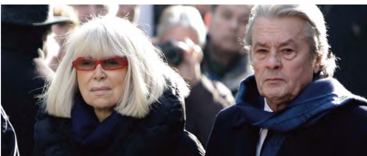
In this March 4, 2011 file photo, French actor Alain Delon and French actress Mireille Darc arrive at the funeral ceremony of French actress Annie Girardot in Paris.

She performed in some 50 films, including Jean-Luc Godard's "Weekend" and Yves Robert's "The Tall Blond with One Black Shoe." She turned to television series in the 1990s and directed documentaries. French Culture Minister Francois Nyssen tweeted her praise for "a talented actress, a woman of courage and commitment."