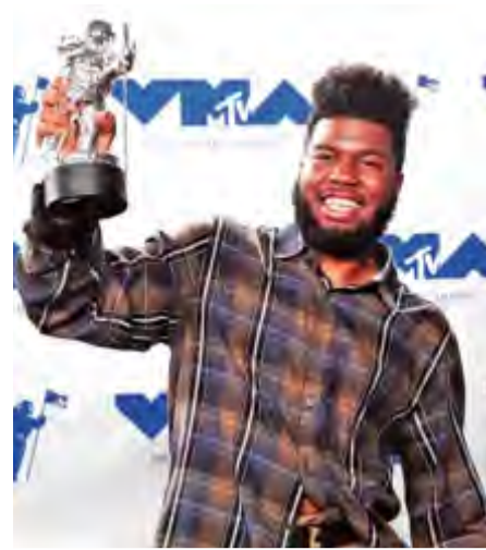
Khalid, winner of Best New Artist, poses in the press room.