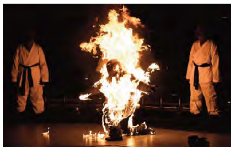
A dancer on fire appears during a performance by Kendrick Lamar.