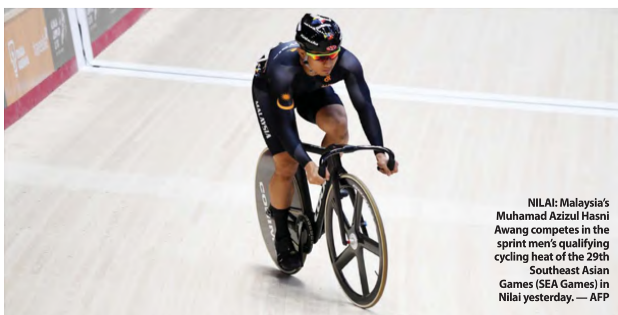
NILAI: Malaysia's Muhamad Azizul Hasni Awang competes in the sprint men's qualifying cycling heat of the 29th Southeast Asian Games (SEA Games) in Nilai yesterday.