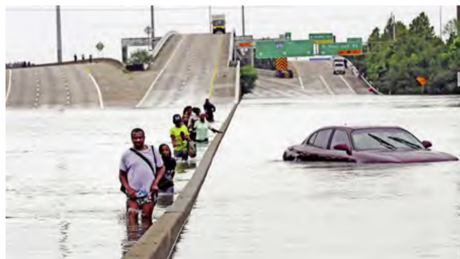
HOUSTON: Evacuees wade down a flooded section of Interstate 610 as floodwaters from Tropical Storm Harvey rise on Sunday.