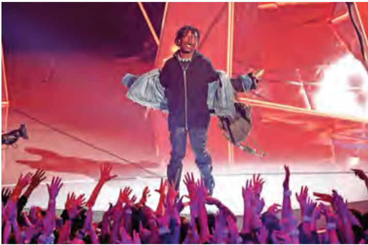
Lil Uzi Vert performs onstage.