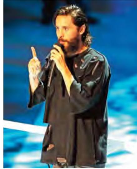
Jared Leto speaks on stage.