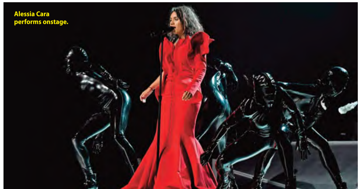
Alessia Cara performs onstage.