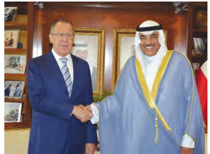
KUWAIT: Kuwait's First Deputy Prime Minister and Foreign Minister Sheikh Sabah Al-Khaled Al-Hamad Al-Sabah meets his Russian counterpart Sergey Lavrov yesterday, as both officials held talks over bilateral ties and current global happenings. Sheikh Sabah Al-Khaled and Lavrov, who is on an official visit to Kuwait, also discussed numerous issues of mutual concern in a meeting that brought together a bevy of Kuwaiti and Russian diplomats.