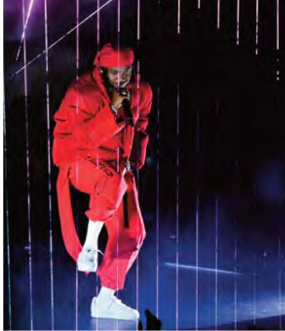
Kendrick Lamar performs onstage.