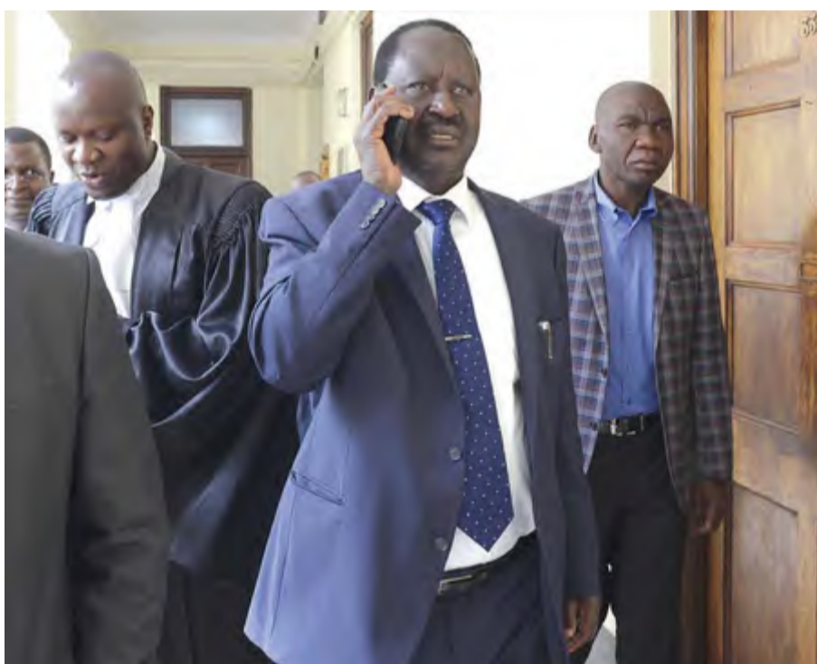
NAIROBI: Kenya's opposition leader and National Super Alliance (NASA) leader Raïla Odinga, center, arrives to attend a hearing in Nairobi, over an opposition petition challenging the result of the August 8 presidential election.