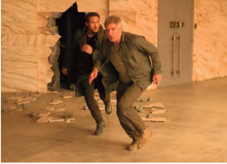
This image released by Warner Bros. Pictures shows Ryan Gosling, left, and Harrison Ford in a scene from "Blade Runner 2049."