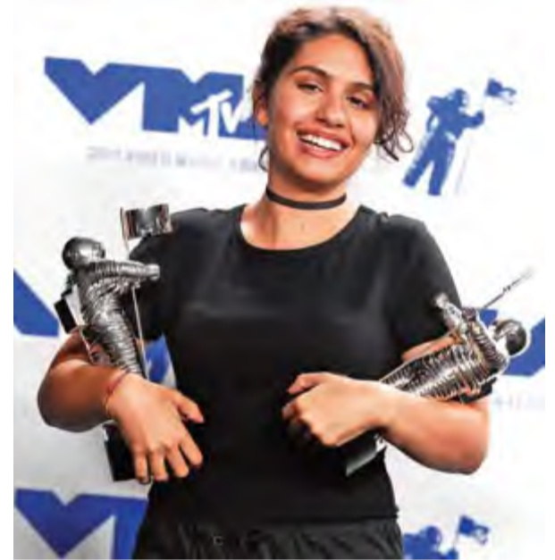
Alessia Cara poses in the press room with the awards for best dance video for "Stay" and for best fight against the system for "Scars To Your Beautiful".

With the top-selling album of the year, Kendrick Lamar was the big winner with six awards, including video of the year. He opened the show rapping his single "DNA," in a cage of laser lights. Then as he transitioned to his hit "Humble," a performer is set ablaze just a few feet away from Lamar in a dangerous and somewhat scary moment. The rest of the performance featured ninja-like dancers scaling a wall of fire behind Lamar. — AP