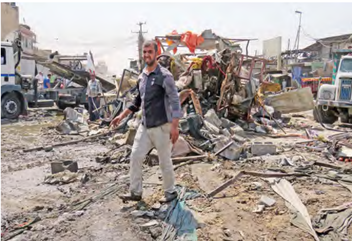
BAGHDAD: Iraqis look at the damage following a car bomb explosion in Baghdad's Shiite-majority district of Sadr City.

BAGHDAD: A car bomb exploded in a market in the Iraqi capital's Shiite-majority district of Sadr City yesterday, killing 11 people and wounding 26, security officials and medical sources said. The Islamic State group claimed responsibility for the attack in a statement carried by its propaganda agency Amaq. A police officer, who asked to remain anonymous, said the explosion ripped through a market in northeastern Baghdad leaving "11 dead and 26 wounded".