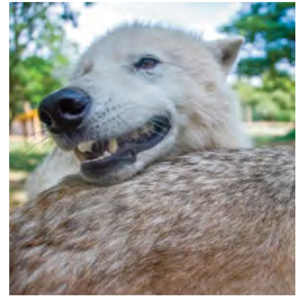
ERNSTBRUNN: Photos show wolves at the Wolf Science Center (WSC) in Ernstbrunn, Austria. The WSC, co-founded by Kotschal in 2008, researches the behaviour and cognition of wolves and dogs. The six packs of between two and four Timber Wolves, as well as its dogs, arrived aged 10 days old and were hand-reared by humans in order to get them used to people.