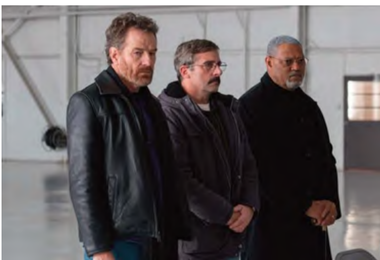
This image released by Lionsgate shows Bryan Cranston, from left, Steve Carell and Laurence Fishburne in a scene from "Last Flag Flying."