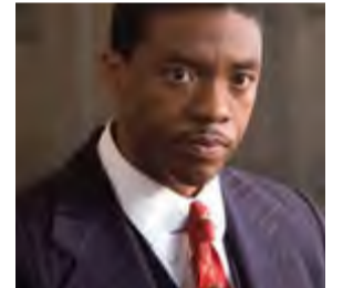
shows Chadwick Boseman in a scene from "Marshall."

Whether all of these films will resonate any differently in 2017 than they might have another year remains to be seen. George Clooney's "Suburbicon" (Oct 27), which he directed from a script by Joel and Ethan Coen, is about a bucolic 1950s suburb with a violent and racist underbelly. Clooney, who recently announced a grant of $1 million with his wife Amal to combat hate groups in the wake of Charlottesville, says the film is about out-of-control white-male paranoia. "Trump got elected while we were shooting it," said Clooney. "A bunch of crew members came up to me and said, 'It's too bad it's not coming out today.' And I said, 'Unfortunately these issues never get old.' So, yes, it's timely, but unfortunately it's always timely." — AP