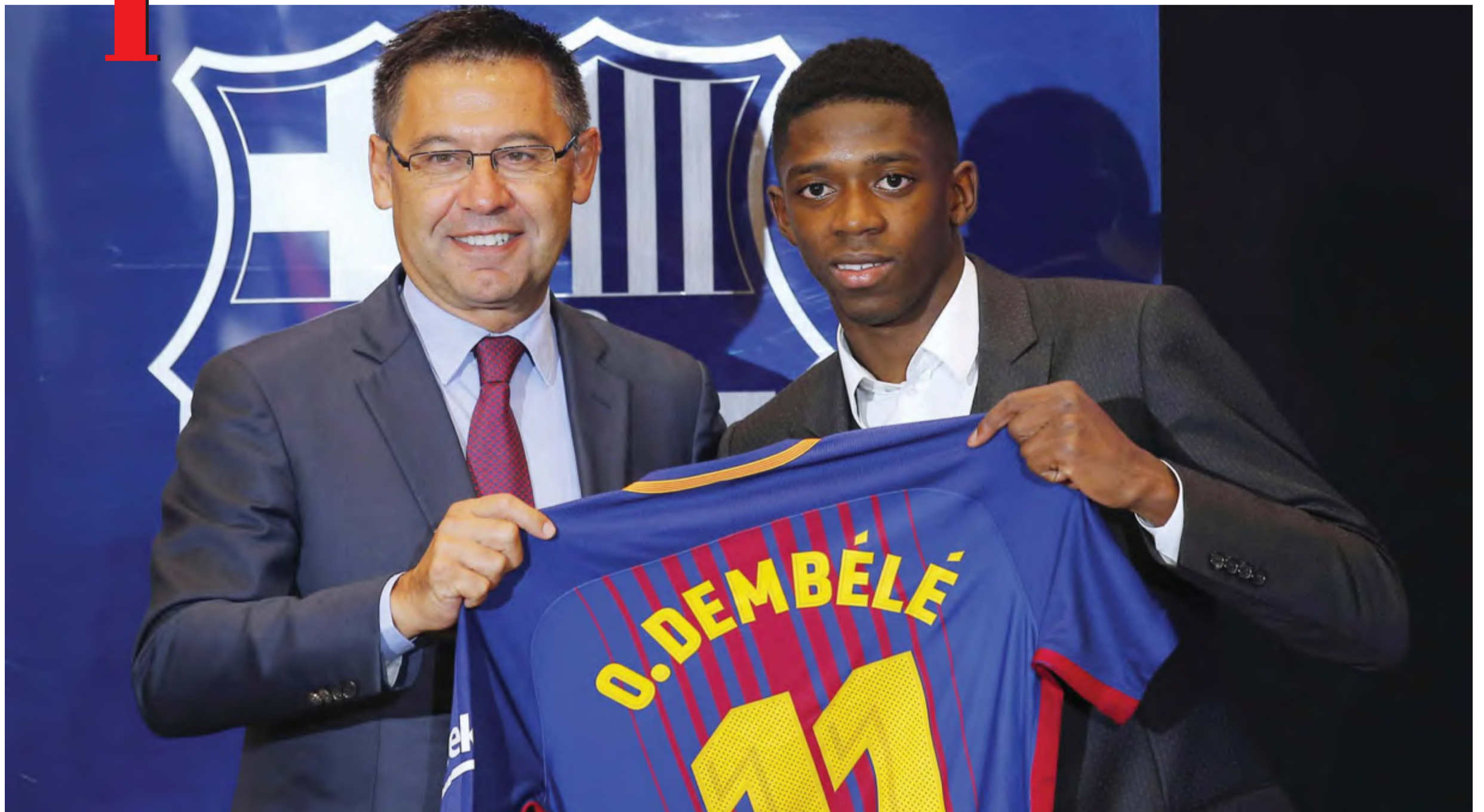
BARCELONA: Barcelona's new signing Ousmane Dembele, right, and FC Barcelona's president Josep Maria Bartomeu pose for the media during official presentation at the Camp Nou stadium in Barcelona, Spain, yesterday. Barcelona is shoring up its attack following Neymar's departure by buying Ousmane Dembele from Borussia Dortmund in a deal that could reach 147 million euros (about $173 million).