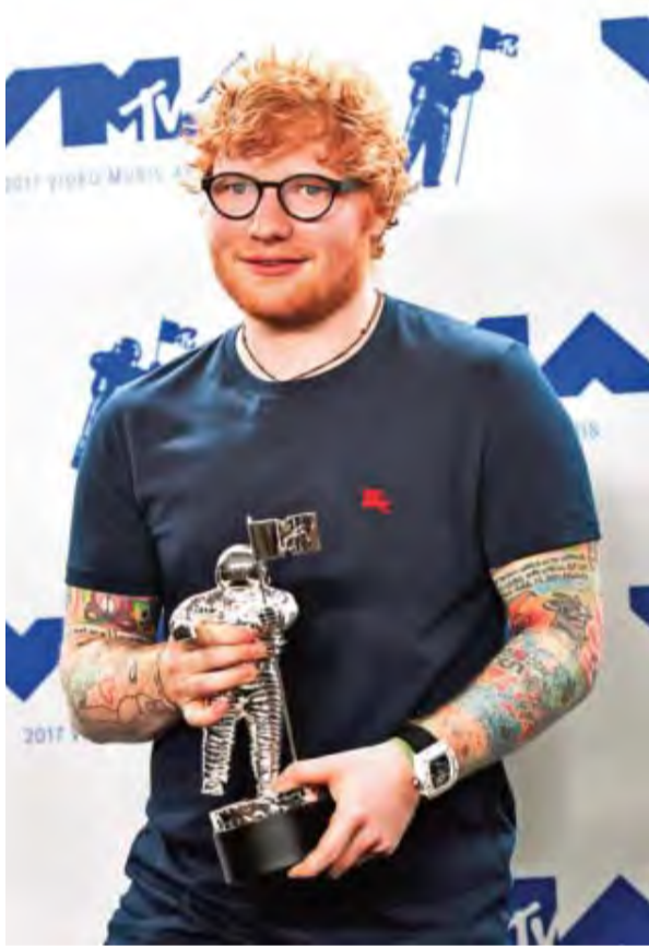
Ed Sheeran, winner of Artist of the Year.

The MTV Video Music Awards are known for creating viral moments meant to shock or amaze. But this year's show was a much more grown-up affair that was full of important speeches, exciting performances and pop culture events. Several award presenters called for equality, including the mother of a woman who was killed while protesting white supremacists in Charlottesville, Virginia, and a descendant of Confederate Gen. Robert E. Lee. Other artists reached out to those suffering from depression. Pink taught her daughter a valuable lesson of self-acceptance. Finally, Kendrick Lamar, the night's big winner, set the stage ablaze at the beginning of the show, while Taylor Swift said goodbye to her reputation in a new music video. Here are the show's top moments: