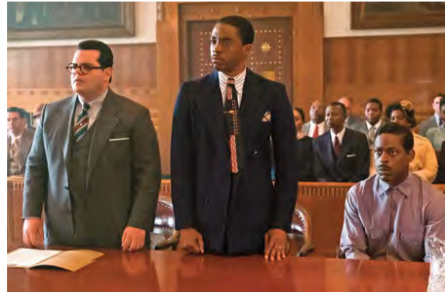
This image released by Open Road Films shows, from left, Josh Gad, Chadwick Boseman and Sterling K. Brown in a scene from "Marshall."

Real-life heroes Other timely tales of American heroism are