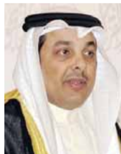
Minister of Justice, Awqaf and Islamic Affairs Yaqoub Al-Sanea

KUWAIT: Around 700 security personnel will be present and stationed at various locations in and out of Kuwait International Airport to facilitate all procedures for returning pilgrims, Interior Ministry (Mol) announced yesterday.