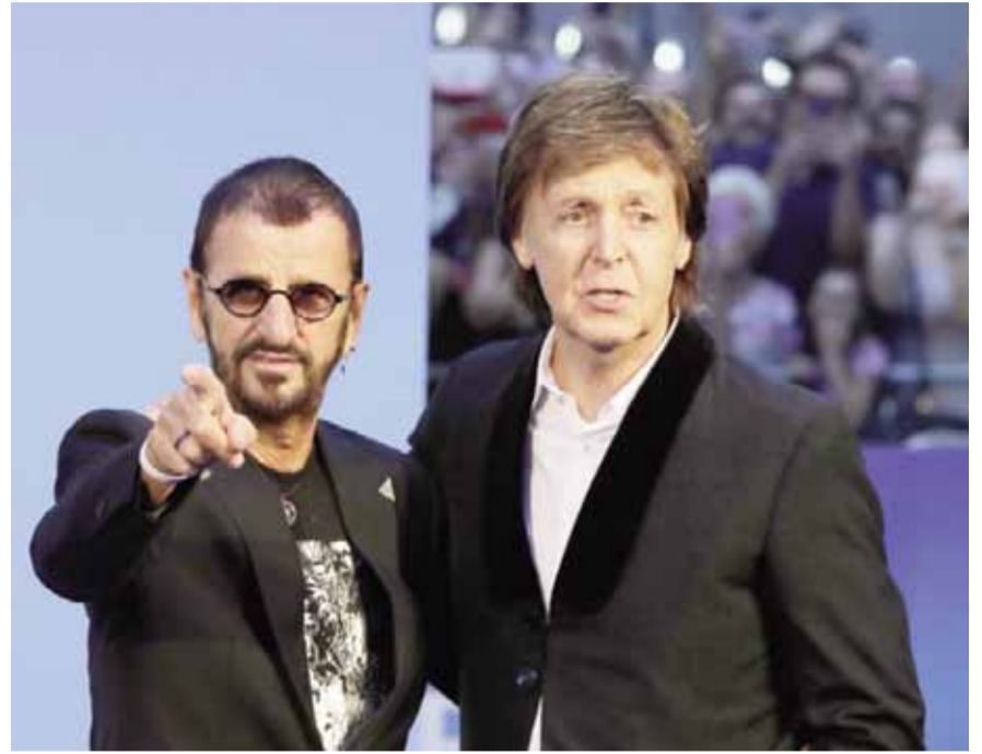
LONDON: Musicians and members of the Beatles, Paul McCartney, right, and Ringo Starr pose for photographers upon arrival at the World premiere of the Beatles movie, Ron Howard's 'Eight days a week-the touring years' on Thursday, Sept. 15, 2016.

Those who saw The Beatles live probably didn't hear them sound systems at the time couldn't outplay screaming fans. The movie features remastered music so audiences can actually hear the performances. A companion album, "The Beatles: Live At The Hollywood Bowl," has also been released. Now, the guys on stage can finally listen to what they were playing.