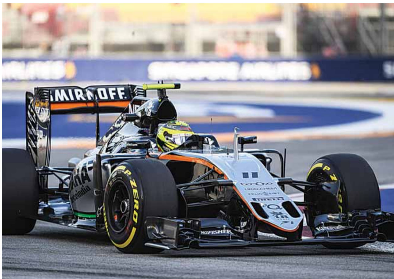
SINGAPORE: Sahara Force India F1 Team's Mexican driver Sergio Perez takes a corner during the first free practice session of the Formula One Singapore Grand Prix.

Still, Archie Manning said it's clear his youngest son and Brees admire and appreciate one another on personal and professional levels. "There's mutual respect there," Archie Manning said. "Everybody respects Drew as a quarterback and a person." Brees turned pro in 2001, Manning in 2004. Both are seasoned veterans and not just former Super Bowl winners, but also Super Bowl MVPs. Brees has thrown for 61,326 yards and 432 touchdowns, Manning for 44,394 yards and 297 TDs. —AP