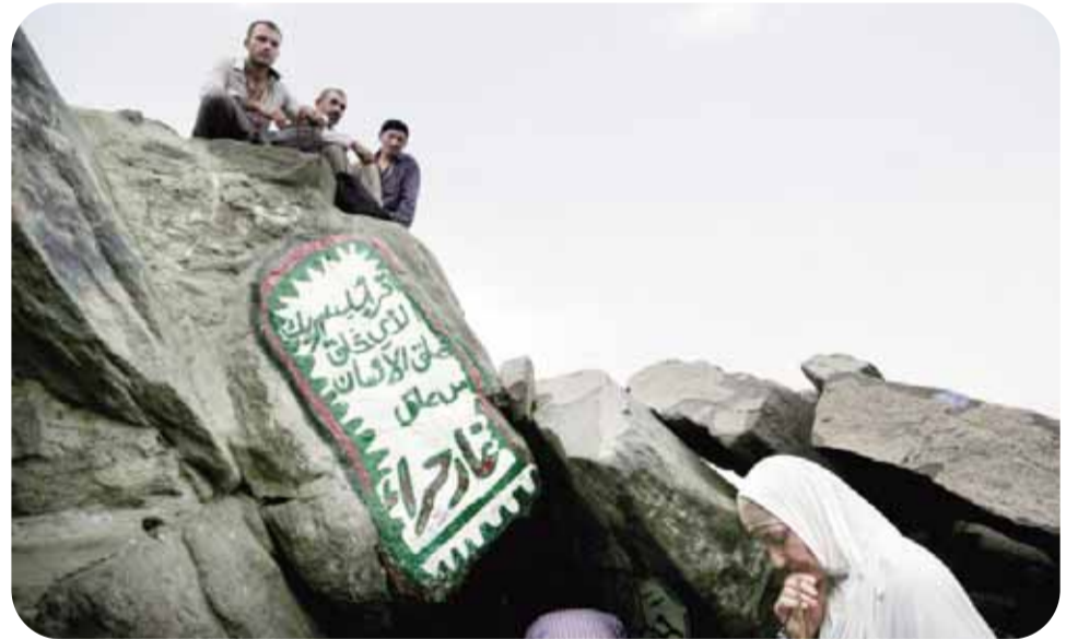
In this Friday, Sept. 9, 2016 photo, a Turkish Muslim woman prays outside Hira cave.