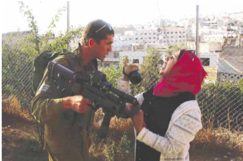
HEBRON: An Israeli soldier scuffles with a Palestinian woman trying to film the scene of a reported Palestinian stabbing attack on a soldier near the Jewish settler enclave of Tal Rumeida in the center of this West Bank town yesterday.