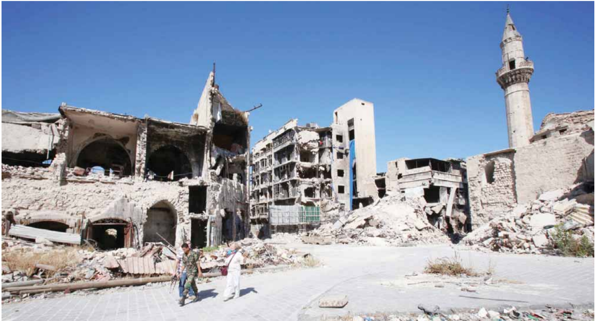
ALEPPO: A Syrian government soldier and unidentified people walk in the damaged Khan al-Wazir market in the government-held side of Aleppo's historic city center yesterday.