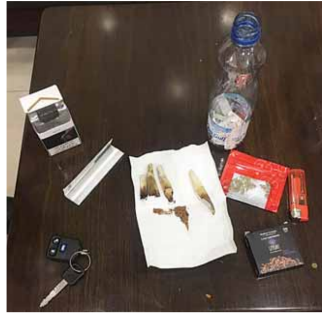
KUWAIT: Photos show some items including illicit drugs and bottles of liquor seized by police.