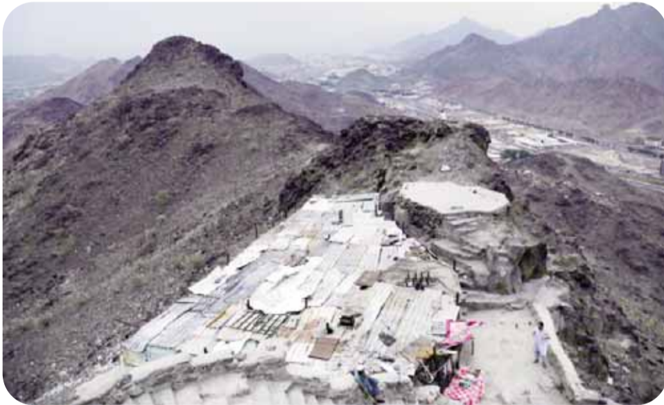
In this Friday, Sept. 9, 2016 photo, Pakistani men live near Hira cave on Noor Mountain, where Prophet Muhammad received his first revelation from God to preach Islam.