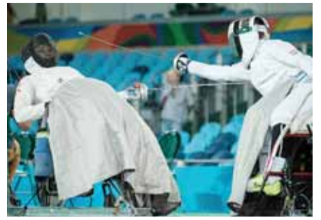
Paralympic fencers: Group of lethal wheelchair 'warriors'