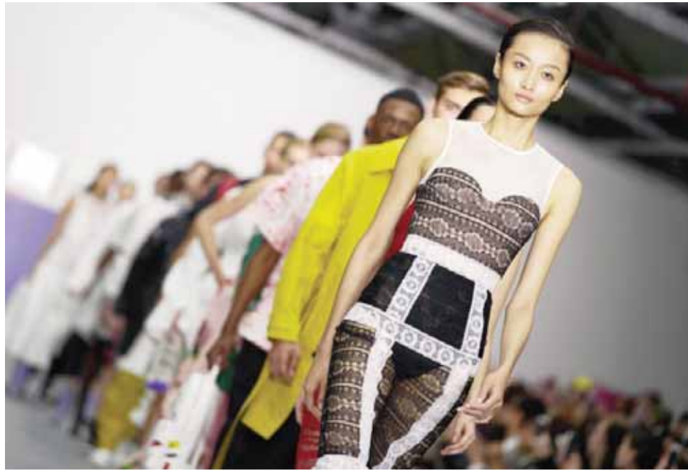
LONDON: Models present creations from designers Teatum Jones, during the 2017 Spring / Summer catwalk show during London Fashion Week on September 16, 2016.