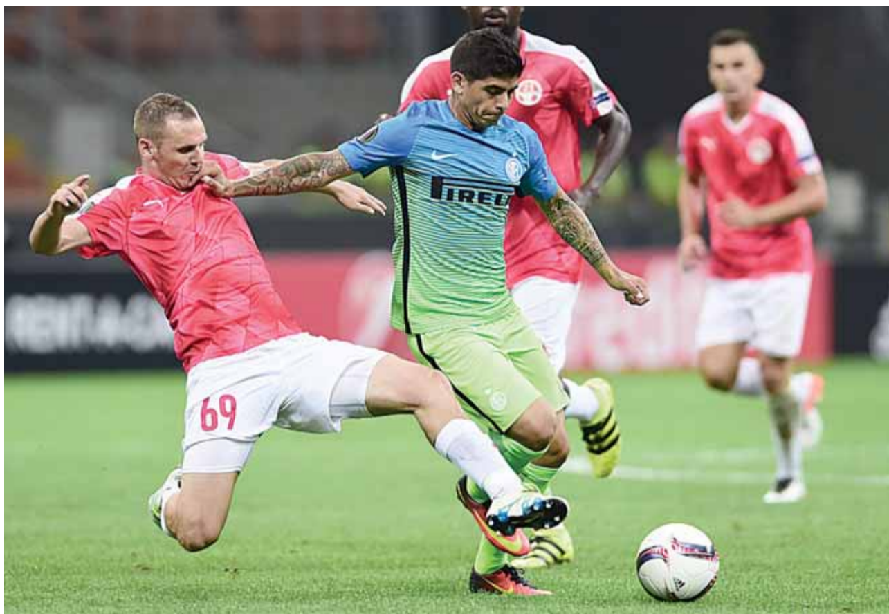
MILAN: Hapoel Beer Sheva's Hungarian midfielder Mihaly Korhut (left) vies for the ball with Inter Milan's Argentinian midfielder Ever Banega during the Europa League football match between Inter Milan and Hapoel Beer Sheva on September 15, 2016 at the San Siro Stadium.

The 53-year-old former Manchester United assistant has expressed his frustration at the uncertainty over his position as his spell in caretaker charge approaches two months since the resignation of Steve Bruce in July. Phelan, who is set for further talks over his future after the weekend, was named Premier League manager of the month for August after guiding the relegation favorites to eighth place with seven points from their opening four games. "There's a bit of belief now and hopefully we can cement our place outside the bottom area of the league," Phelan said. "If you get in that area, it can be difficult so we have to be in the frame of mind that we can go to the next level," he added.