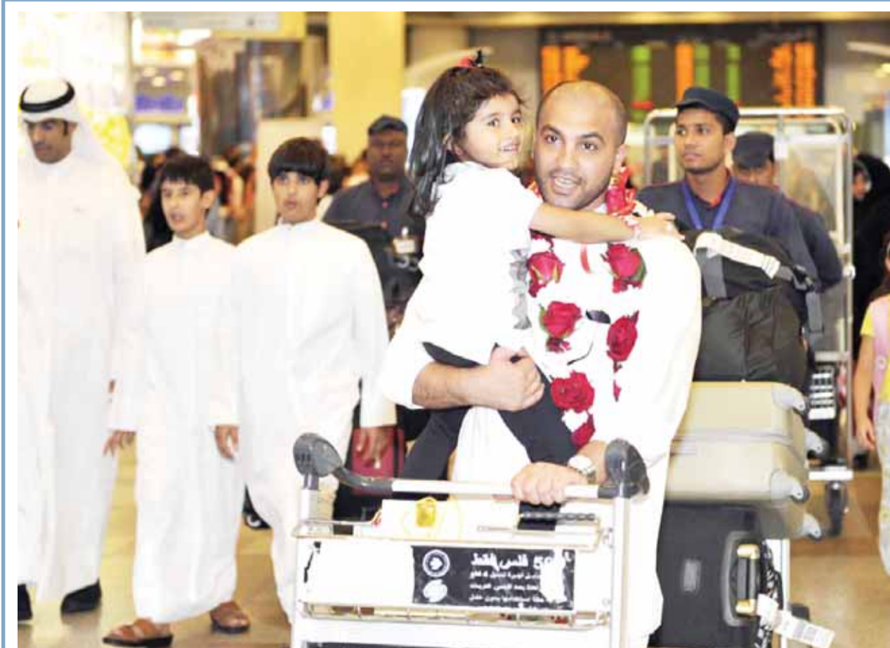
KUWAIT: Kuwaiti pilgrims are welcomed at Kuwait International Airport yesterday as they arrive home after participating in the hajj pilgrimage. (See Page 3)

WASHINGTON: After years of fueling conspiracy theories, Republican White House nominee Donald Trump admitted that President Barack Obama is an American citizen in a much-hyped and nationally televised event yesterday. "President Barack Obama was born in the United States, period," Trump said, as his campaign tried to silence damaging charges of racism. Trump pointedly did not apologize, and repeated false allegations that Hillary Clinton started the so-called "birther" movement questioning Obama's nationality - and therefore legitimacy as president. "Her campaign of 2008 started the birther controversy. I finished it. I finished it. You know what I mean," Trump said.