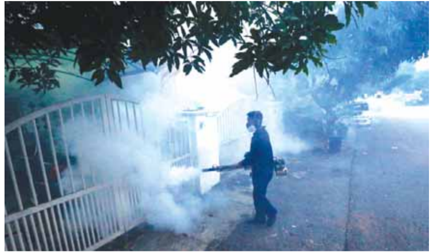
KUALA LUMPUR: A worker of Ministry of Health Malaysia carries out mosquito fogging at Kuala Lumpur, Malaysia. Two new Zika virus infection cases were detected on Tuesday raising the total number of cases in the country to six.

The researchers also proposed adding Zika to a category of congenital infections known to happen before or during birth. The list includes toxoplasmosis, syphilis, rubella, cytomegalovirus, HIV and herpes. Zika is a virus spread