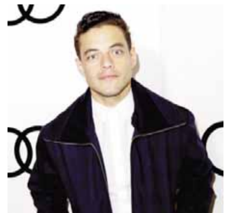
WEST HOLLYWOOD: Outstanding Lead Actor in a Drama Series Emmy Nominee for "Mr. Robot" Rami Malek arrives at the "Audi Celebrates The 68th EMMYS" Pre-Party on Thursday, Sept. 15, 2016.