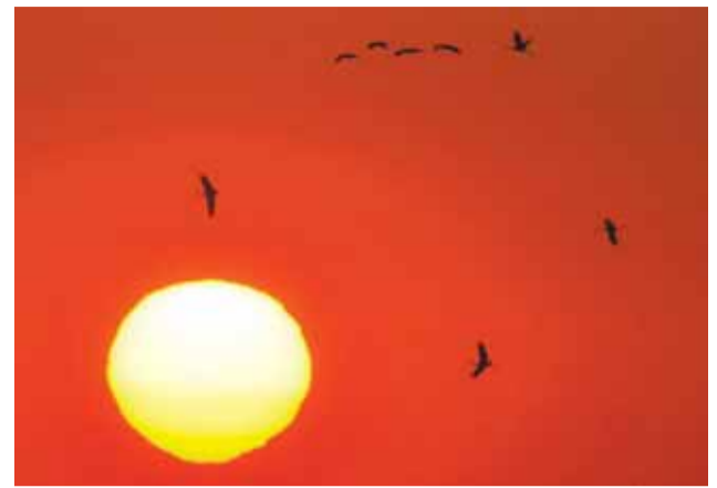
BRANDENBURG: Cranes fly at sunrise near the village of Bending in Brandenburg, eastern Germany, yesterday.

Vehicles from both the southern states were stoned and burnt by protesters over the sharing of the Cauvery river water, police have not been allowing even ambulances with Karnataka number plates to drive into Tamil Nadu across the tense border. Thousands of police officers have been deployed in Karnataka and a curfew declared after protesters set buses and cars ablaze this week. The protests erupted after the Supreme Court ordered Karnataka state to release water from a river to ease a shortage in Tamil Nadu until later this month. Two people have been killed in the violence in Bangalore, which is known as India's Silicon Valley and is home to local IT companies as well as offices of international giants such as Amazon and Microsoft. India suffers severe water shortages that cause frequent tensions between states and the row over sharing the Cauvery River, which starts in drought-hit Karnataka, stretches back decades. Olithselvan said the 12-hour transplant operation had gone well and the patient was recovering. — AFP