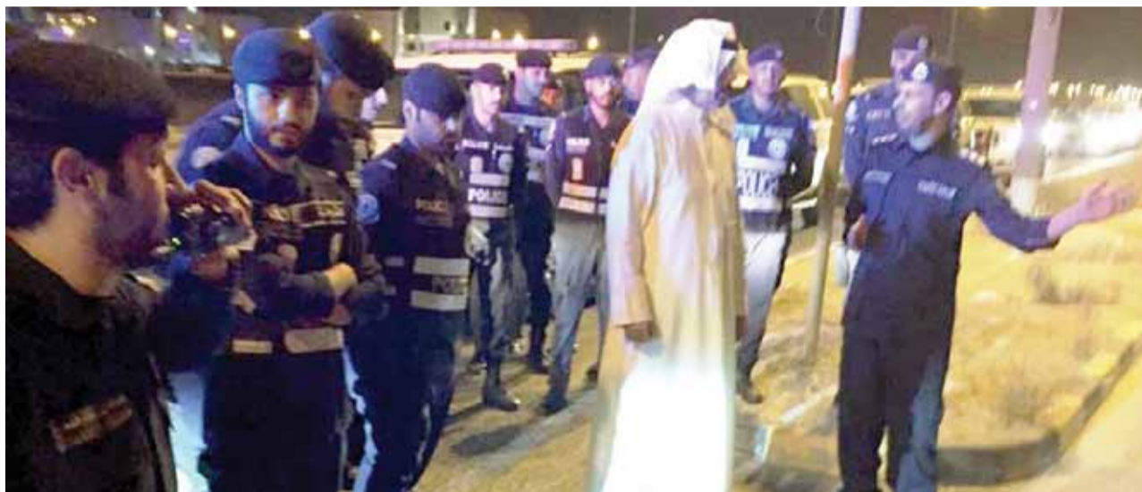
KUWAIT: Deputy Prime Minister and Minister of Interior Sheikh Mohammad Al-Khaled Al-Hamad Al-Sabah is seen during a surprising inspection tour.