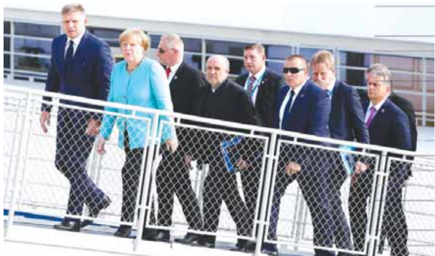
BRATISLAVA: Slovakian Prime Minister Robert Fico (left), German Chancellor Angela Merkel and Hungarian Prime Minister Viktor Orban (right) alight after taking a boat down the Danube River during an EU summit yesterday.

But cracks in the union are evident everywhere. The migration crisis is the most divisive issue, with many Eastern European leaders blaming Merkel for opening the continent's doors to refugees from conflict in Syria and elsewhere. Slovak Prime Minister Robert Fico, who is hosting the summit, said all wanted unity but a "very honest" exchange of views was needed to make that possible. — AFP