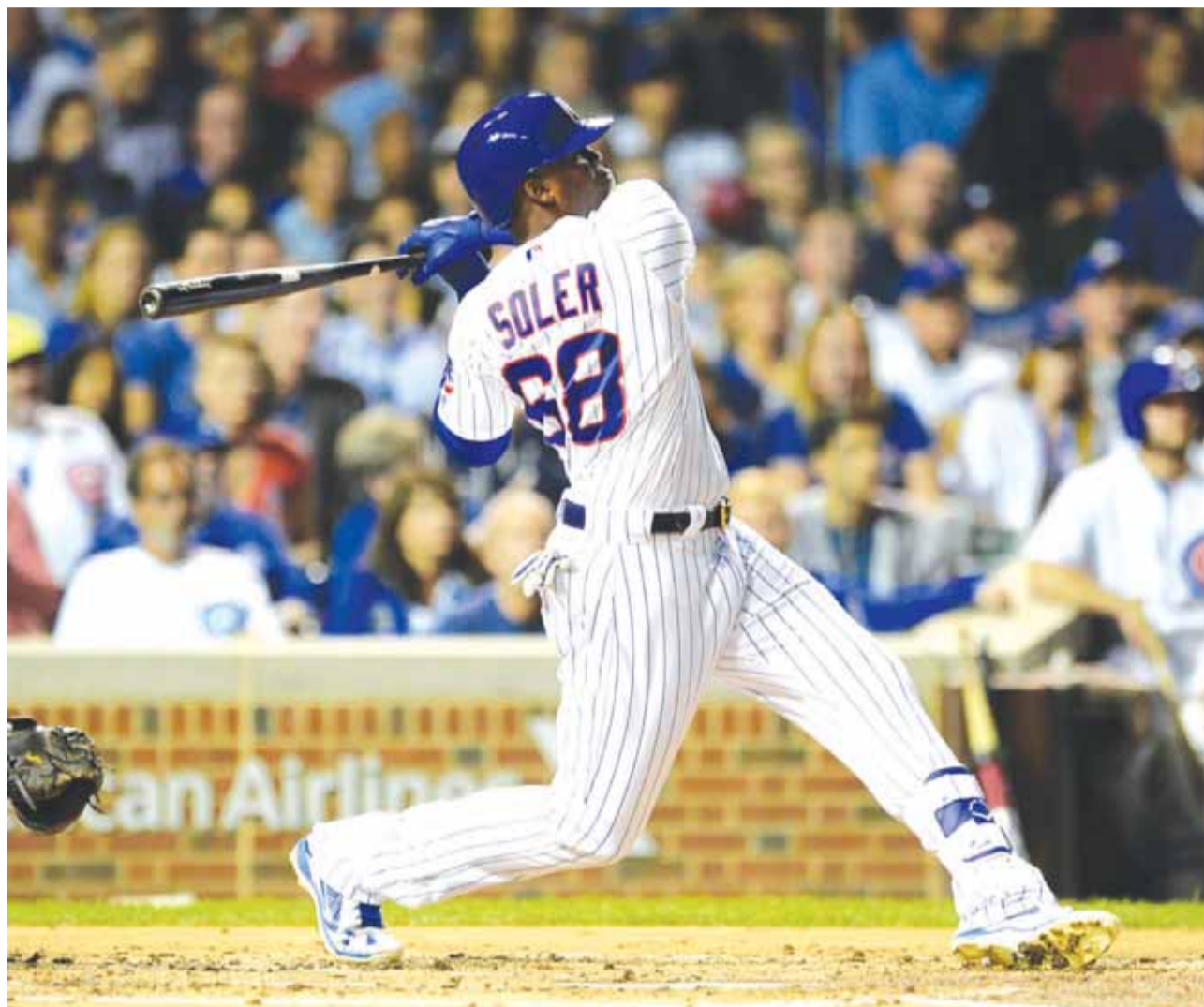
CHICAGO: Chicago Cubs' Jorge Soler watches his two-run home run during the second inning of a baseball game against the Milwaukee Brewers.

Andrew McCutchen hit two solo homers, Chad Kuhl pitched six effective innings and Pittsburgh beat Philadelphia. Jordy Mercer hit a three-run homer, and John Jaso and Sean Rodriguez also went deep to help the Pirates split a four-game series. Kuhl (4-3) allowed two runs and four hits, striking out five. He retired the first 12 batters