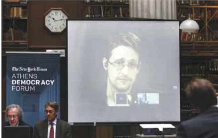
ATHENS: National Security Agency leaker Edward Snowden speaks via video link during the Athens Democracy Forum, organized by the New York Times, at the National Library yesterday.

Three prominent human rights groups - Amnesty International, Human Rights Watch and the American Civil Liberties Union - launched a campaign Wednesday to pressure Obama to pardon the fugitive whistleblower. Snowden is also the subject of an Oliver Stone movie that hit screens Friday in the United States. High-profile lawyers and celebrities including the writer Joyce Carol Oates, actors Martin Sheen and Susan Sarandon, and musicians Peter Gabriel and Thurston Moore