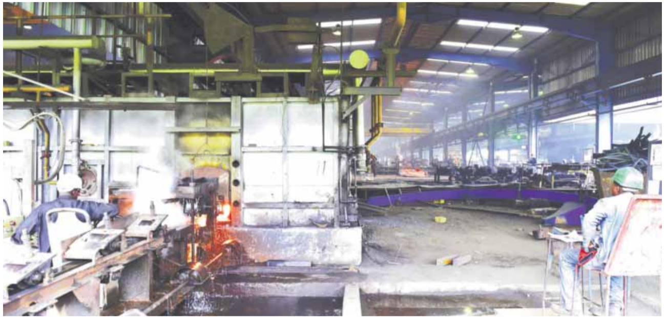
ABIDJAN: A worker is seen at a steel factory producing concrete reinforcing steel, in Abidjan.

Mozambique has said that most of the money was to fund maritime security and shipyards. According to Rice, Nyusi indicated to Lagarde that he would support the audit. "The managing director welcomed that the president indicated the Government of Mozambique's willingness to work with the IMF on the terms-of-reference for this process-to be initiated by the office of the attorney general-and to implement it," he said in a statement. He said that an IMF staff team would visit the country next week. — AFP