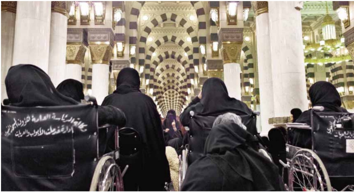
MEDINA, SAUDI ARABIA: In this Thursday, Sept. 15, 2016 photo, a Saudi woman teaches Islam to women in Al-Masjid an-Nabawi or Prophet Muhammad's Mosque, which situates Muhammad's tomb.