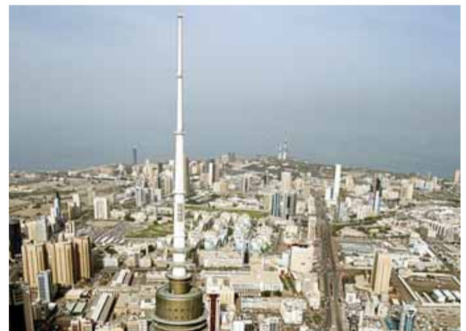
KUWAIT: Liberation Tower overlooks Kuwait City in this photo. The Liberation Tower is the symbol of Kuwaiti liberation, the representation of country's resurgence, second tallest tower in Kuwait, and the fifth tallest telecommunication tower in the world. Officially unveiled by the late Kuwaiti Amir, Sheikh Jaber Al-Ahmad Al-Jaber Al-Sabah on 10th March 1996, this 372 meter tall tower is 40 meters taller than the Eiffel Tower.

Meanwhile, the price of Kuwaiti crude oil went down $1.33 on Thursday to $39.55 per barrel after it was at $40.88 pb on the day before, said Kuwait Petroleum Corporation (KPC) yesterday. The price of the Brent crude went down yesterday 39 cents to $46.20 per barrel. The West Texas Intermediate followed suit going down 36 cents to $43.55 pb. —Agencies