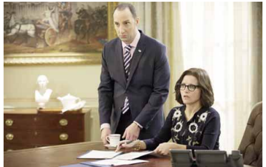
In this image released by HBO, Tony Hale, left, and Julia Louis-Dreyfus appear in a scene from the comedy series, "Veep." — AP

Now, all 2,500 branch members can jump in if so inclined - but they have to agree to view all episodes in contention before voting, as the panels did. In the program categories, including best comedy and drama, all academy members are eligible to vote. — AP