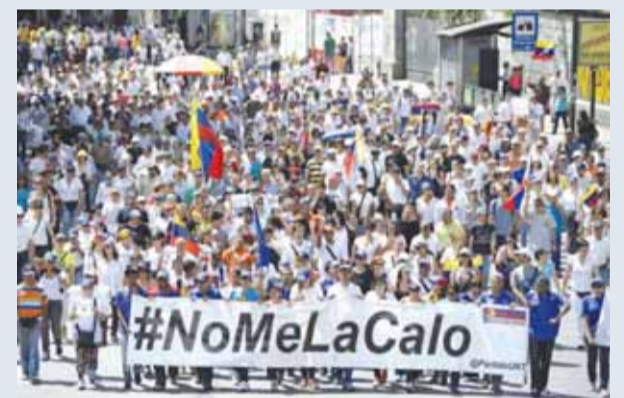
CARACAS: Venezuelan opposition activists march yesterday, demanding the government to set the date for a recall referendum against President Nicolas Maduro.