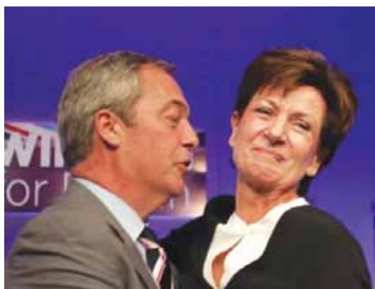
BOURNEMOUTH: Outgoing leader Nigel Farage embraces new leader of the anti-EU UK Independence Party (UKIP) Diane James as she is introduced at the UKIP Autumn Conference on the southern coast of England yesterday.