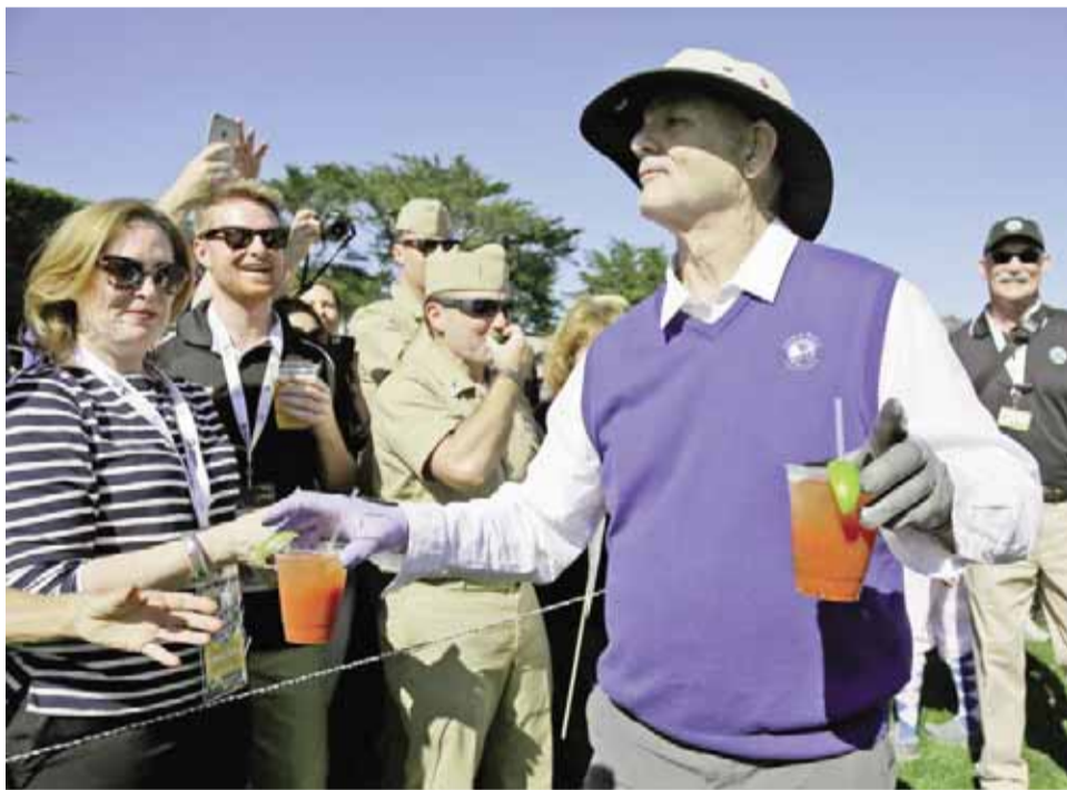
PEBBLE BEACH, CALIFORNIA: In this file photo, Bill Murray hands out Bloody Mary cocktails to fans on the 17th tee of the Pebble Beach Golf Links during the celebrity challenge event of the AT&T Pebble Beach National Pro-Am golf tournament.