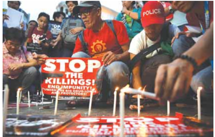
MANILA: Activists light candles during a candlelight vigil for victims of extrajudicial killings in the drug war of the government in front of a church yesterday.

In 2001, president and populist ex-movie star Joseph Estrada was removed from office in a military-backed popular revolt, though an impeachment trial against him on