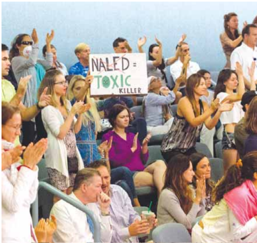
MIAMI BEACH: Demonstrators cheer at a city commission meeting in Miami Beach, Florida. Opponents want to stop the aerial spraying of the insecticide naled, used to combat the Aedes aegypti mosquito. —AP

"Too many experience one of two extremes: too little, too late, where women receive care that is not timely or sufficient, and too much, too soon, marked by over-medicalisation and excessive use of unnecessary interventions," the report said. The problem of over-medicalisation has traditionally been found in rich countries but it has become more common in low-and middle-income countries, bringing higher health costs and the risk of harm, the report said. — Reuters