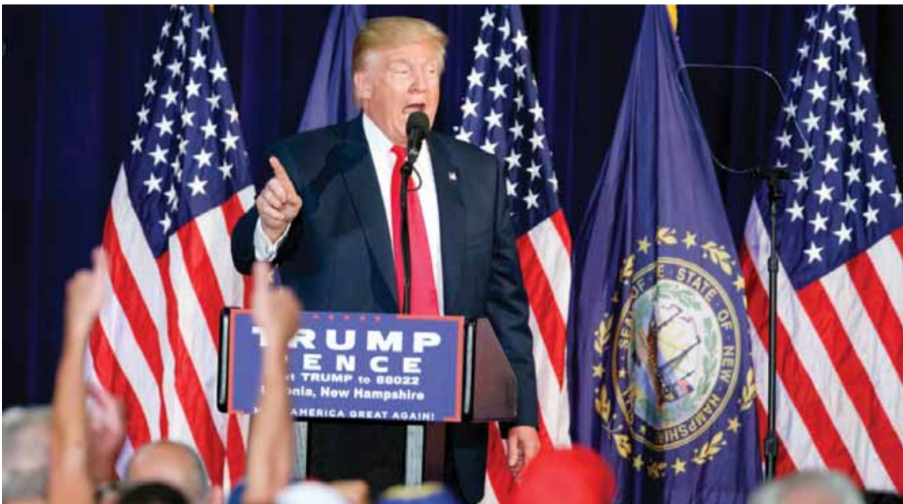
Republican presidential candidate Donald Trump speaks during a campaign rally at Laconia Middle School on Thursday in Laconia, NH.

War damage to Syria's physical capital amounts to $137.8 billion, or 230 percent of pre-war GDP, the report said, and, with 470,000 killed, 6.6 million displaced and 5 million having fled, the country has lost about 50 percent of its population. The strains on governance, state revenues and state institutions such as central banks are profound: Preliminary data indicate that Yemen, for example, missed its 2015 revenue targets by as much as 60 percent. — AFP