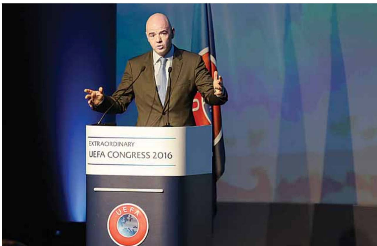
ATHENS: FIFA President Gianni Infantino speaks during the vote for the new UEFA president.

"I play football because I love football. Playing regular football is the most important thing for me. I love playing for my country... but it's an ambition of mine to play first-team football. "My options at City were limited so I'm very grateful to be here. I'm only on loan here and, technically, I'm supposed to go back to City. "But my focus is on playing for Torino. The (long-term) future will take care of itself but my future is here, it's on Sunday when we play Empoli." Hart was one of several England players lambasted for their poor performance against Iceland in France earlier this summer. But he said he is used to the flak: "People say bad things about me every single day, but football is about opinions and I don't take things too personally."