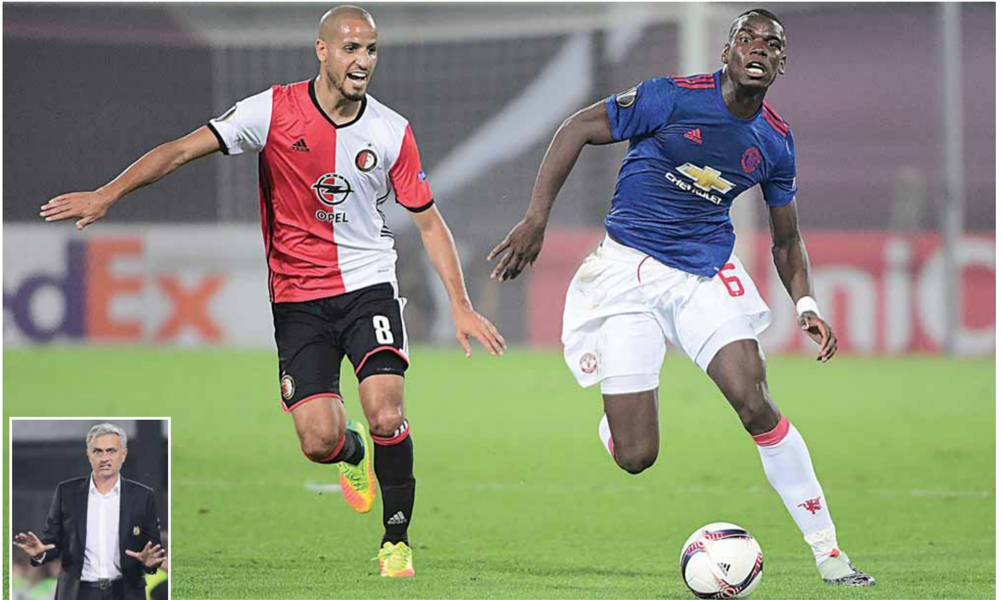
ROTTERDAM: Manchester United's Paul Pogba (right) vies with Feyenoord's Karim El Ahmadi during the UEFA Europa League football match between Feyenoord Rotterdam and Manchester United at the Feyenoord Stadium. (Inset) Manchester United's manager Jose Mourinho reacts during the match.