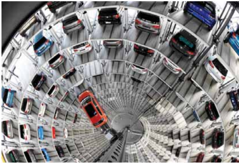
WOLFSBURG: Photo shows VW Golf cars inside the so-called cat towers of car manufacturer Volkswagen AG (VW) at the company's assembly plant in Wolfsburg, northern Germany. One year after 'Dieselgate', Volkswagen (VW) faces lawsuits around the world.

VW built itself over decades into Europe's car champion and now sells vehicles under 12 separate brands—from Seat, Skoda and Volkswagen to luxury brands Audi and Porsche. The firm rakes in 200 billion euros ($225 billion) in sales each year and employs 600,000 people globally. But the Wolfsburg-based group was rocked to