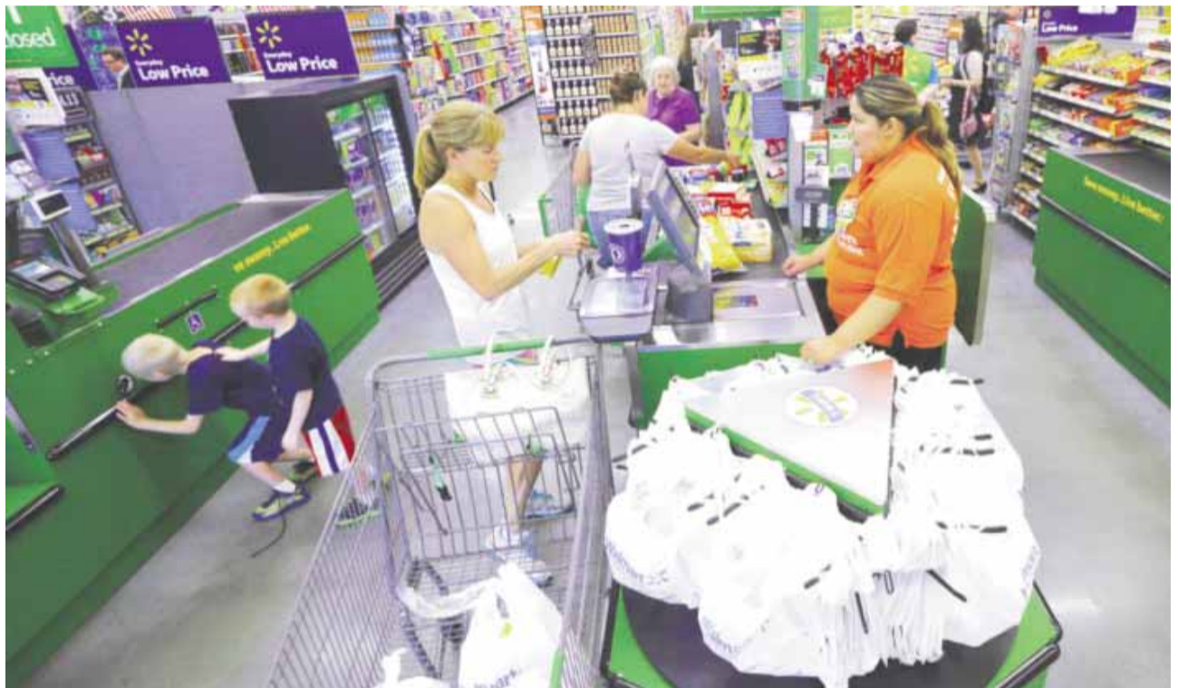
BENTONVILLE: A customer, center, checks out at a Wal-Mart Neighborhood Market store in Bentonville, Arkansas. The Commerce Department released retail sales data for August on Thursday.

He warned the outlook for the oil tanker market was worsening. "Many shipping companies have ordered tankers that are now being delivered. Supply is rising but the demand hasn't changed." — Reuters