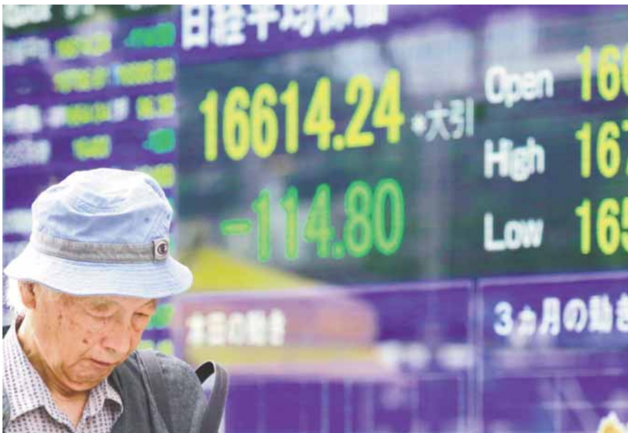
TOKYO: A man walks past an electronic stock indicator of a securities firm indicating Japan's benchmark Nikkei 225 that lost 114.80 percent or 0.7 percent to close at 16,614.24 in Tokyo. Although oil prices regained overnight drops, amid the possibility of a weaker global economy and guess work about the US Federal Reserve's plans for interest rates.

was making preparations to load a cargo of Qua Iboe crude at the end of September, trading sources said, its first since it imposed force majeure in July. Traders were also eyeing weekly US rig count data, to be released by Baker Hughes yesterday. Last week's data showed US drillers had added seven oil rigs in the week to Sept. 9, bringing the rig count to 414, the most since February. "The focus will turn to drilling activity in the US, with another rise expected to raise concerns about a recovery in US output," Australian bank ANZ said in a note. The United States has witnessed more growth in daily output than any other major producer thanks to the boom in shale oil production. — Reuters