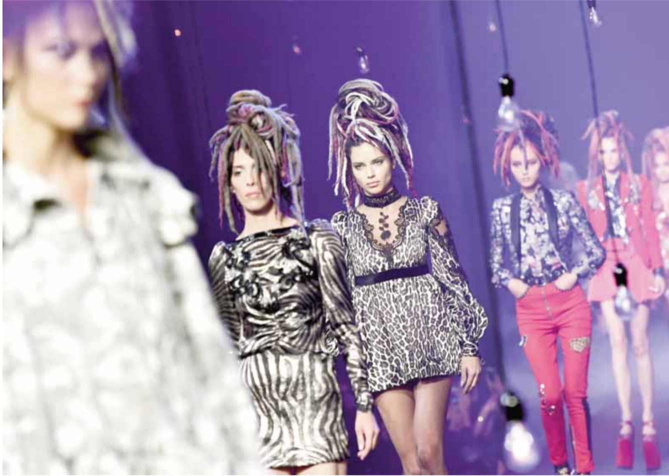
NEW YORK: Models displays the fashion of Marc Jacobs during New York Fashion Week in New York on September 15, 2016.