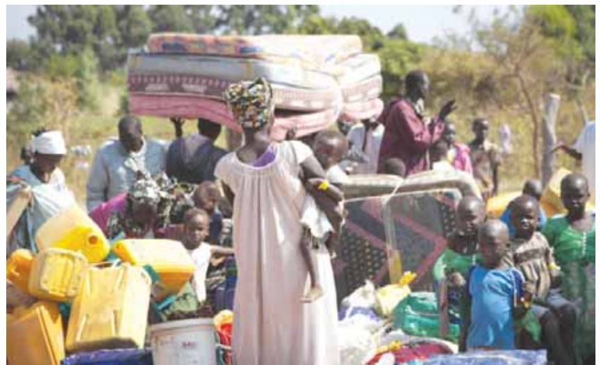
KOBOKO, Uganda: In this Jan 6 2014 file photo, refugees who fled the recent violence in South Sudan and crossed the border into Uganda arrive and await transportation from a transit center in this town. — AP

On Thursday the United States threatened to push for an arms embargo against the Juba government should it block the formation of the force. Meanwhile several civil society activists who met with a UN Security Council team last week have fled a government crackdown. — AFP