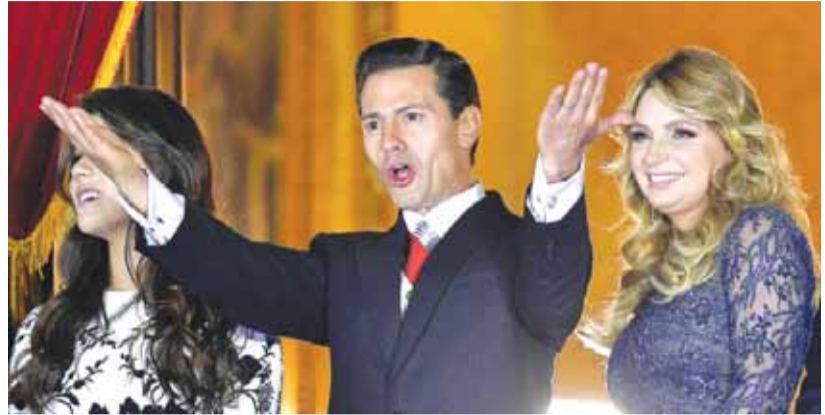
MEXICO CITY: Mexican President Enrique Peña Nieto and his wife the First Lady Angelica Rivera are seen on the main balcony of the National Palace during ceremonies called 'The Shout' marking the start of celebrations of Independence Day yesterday.