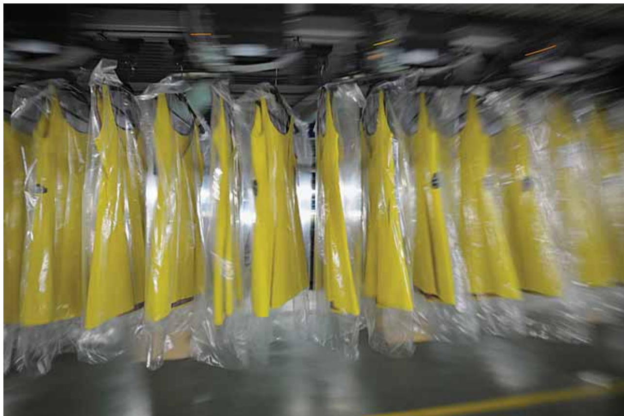
Clothes by the Spanish Zara brand hang at the headquarters of the Inditex group in Arteixo, northwestern Spain. Spain's Inditex, the the world's biggest clothing retailer and owner of the popular Zara brand, is thriving thanks to its unique production model, relentless international expansion and online sales.