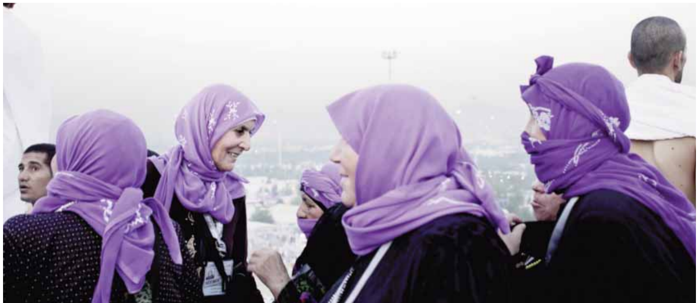
Syrian women from Hama make their way down after prayer on a rocky hill known as the Mountain of Mercy, on the Plain of Arafat, during the annual hajj pilgrimage