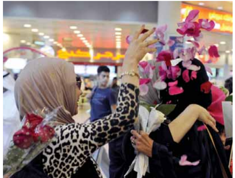
KUWAIT: Kuwaiti pilgrims are welcomed by relatives at the Kuwait Airport. Hundreds of security personnel have been deployed at various locations in and out of Kuwait International Airport to facilitate all procedures for returning pilgrims, Interior Ministry (Mol) announced yesterday.