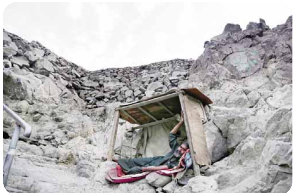
A Pakistani beggar who sleeps on Noor Mountain.