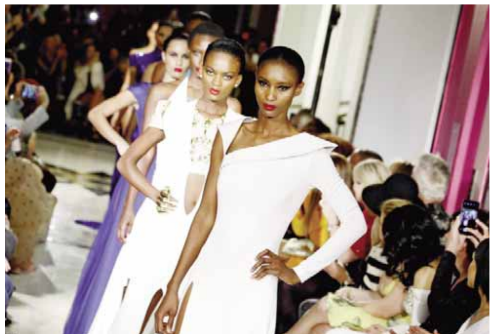
NEW YORK: Models walk the runway at the Marc Bouwers fashion show during New York Fashion Week September 2016 at The Museum of the City of New York on September 15, 2016.— AFP