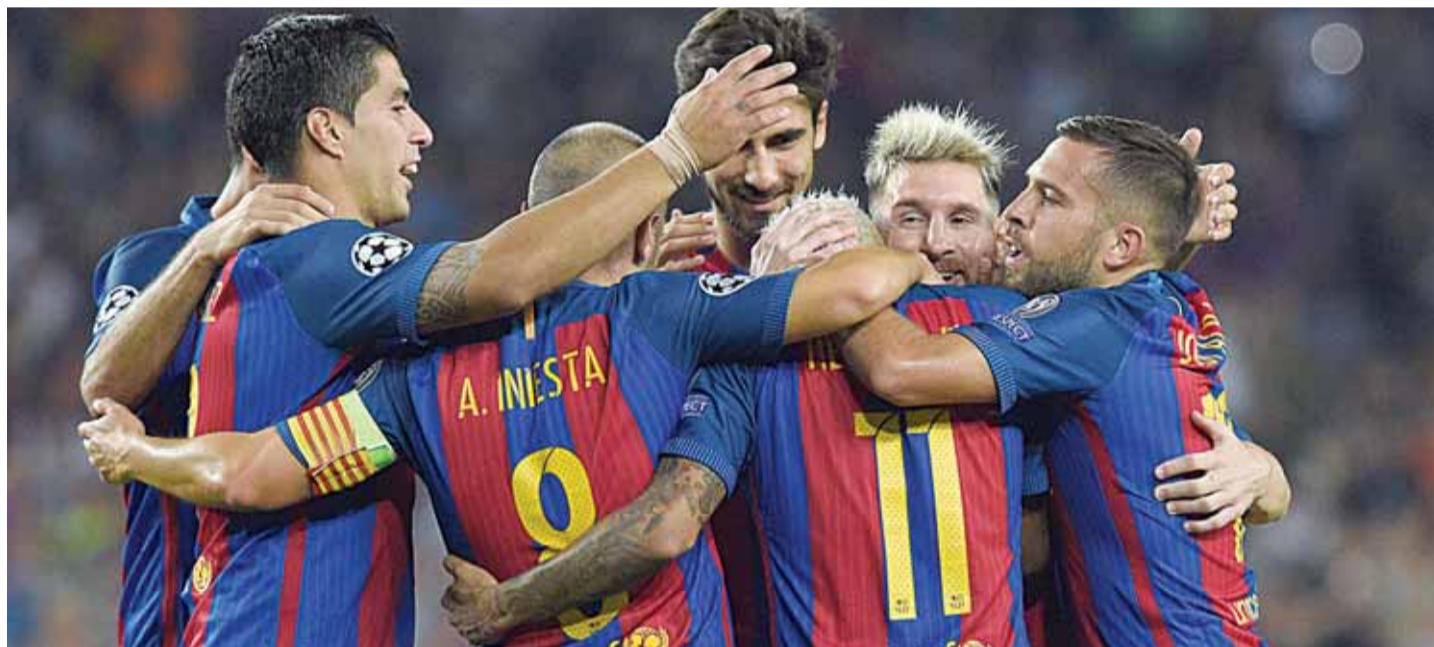
BARCELONA: Barcelona's Brazilian forward Neymar (3rd right) celebrates a goal with teammates during the UEFA Champions League football match FC Barcelona vs Celtic FC at the Camp Nou stadium.