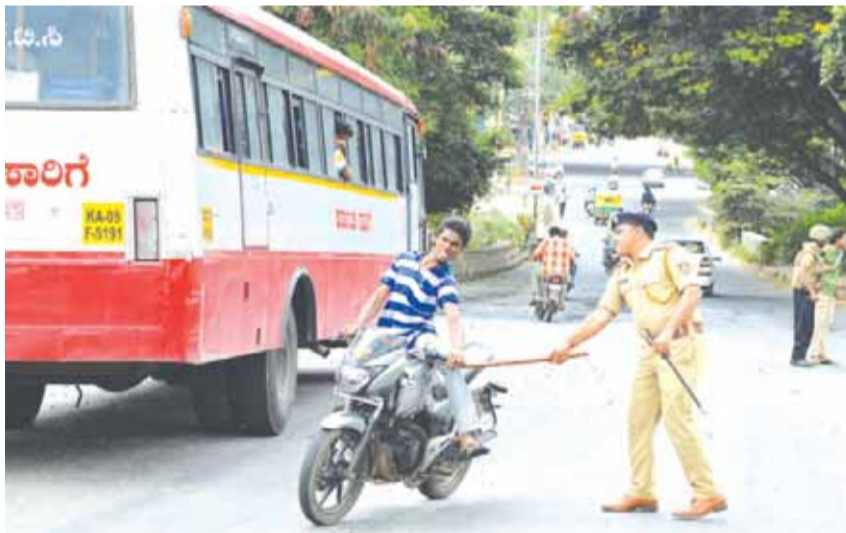
BANGALORE: A police personnel canes a motorcyclist during a curfew following violence in the city due to the Cauvery water sharing dispute with neighboring state Tamil Nadu on Sept 13, 2016.

days of disruption this month after the water protests and an unrelated strike, hitting operations in a city that accounts for a significant chunk of India's $97 billion in information technology exports. The head of Indian drugmaker Biocon jokingly referred to Bangalore as "Bandhaluru", using the Hindi word "Bandh" for closed. Employees of two large Indian companies told Reuters their buses were stopped and rocked by protesters, who asked them to join the demonstrations.