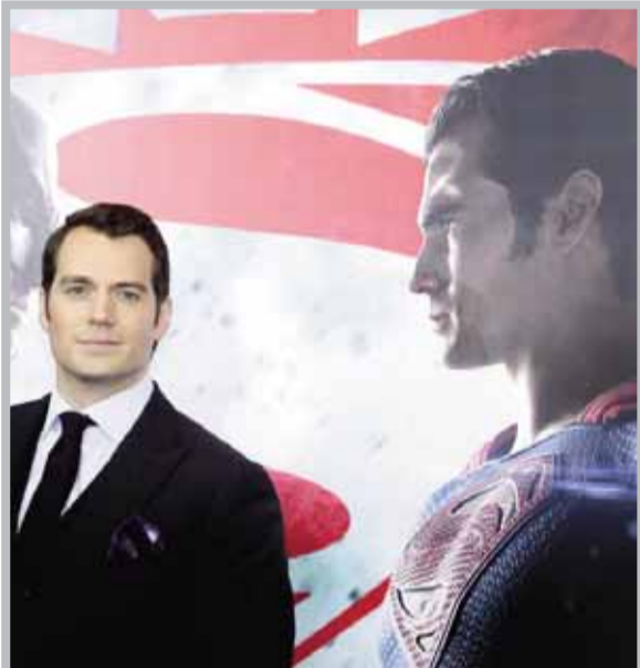
NEW YORK: In this March 20, 2016, file photo, Henry Cavill attends the premiere of "Batman v Superman: Dawn of Justice" at Radio City Music Hall.