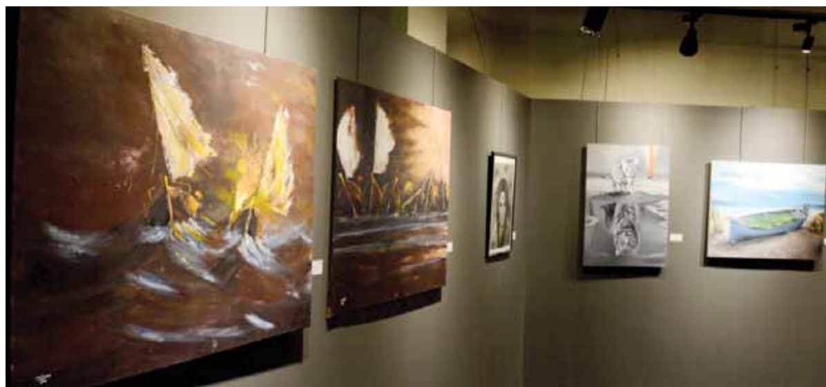
KUWAIT: Beautiful paintings are on display. Formative art exhibitions characterize Kuwait as capital of Islamic culture.