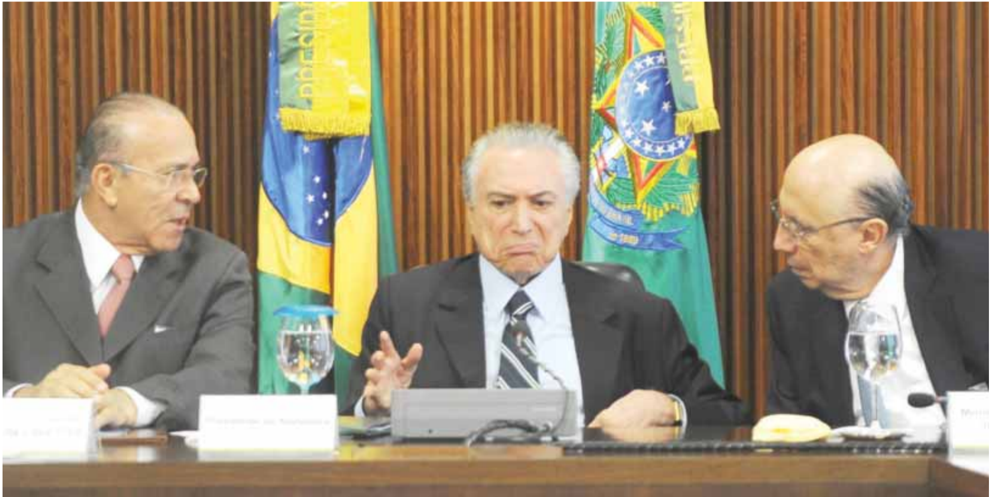
BRASILIA: Brazil's interim President Michel Temer (center) gestures between Chief of Staff Eliseu Padilha (left) and Economy Minister Henrique Meirelles during the first ministers' meeting at the Planalto Palace yesterday.