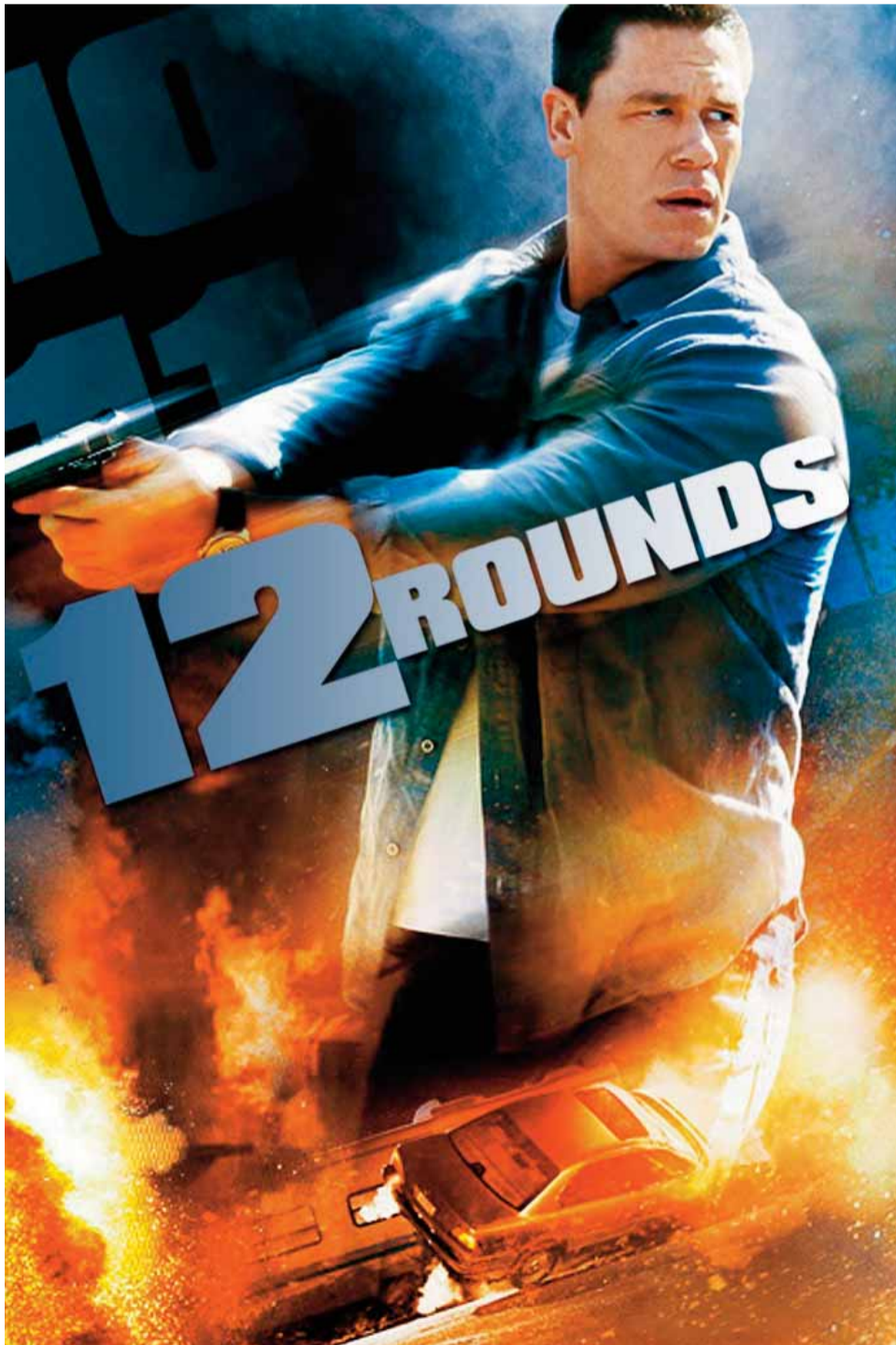
12 ROUNDS ON OSN MOVIES ACTION HD

03:15 Kourtney And Kim Take Miami 04:10 Kourtney And Kim Take Miami 05:05 Kourtney And Kim Take Miami 06:00 Fashion Bloggers 06:25 Keeping Up With The Kardashians 07:20 Keeping Up With The Kardashians 08:20 E! News 09:15 Keeping Up With The Kardashians 13:05 E! News 14:05 Christina Milian Turned Up 15:00 WAGS 16:00 Botched 17:00 Keeping Up With The Kardashians 18:00 Keeping Up With The Kardashians 19:00 E! News 20:00 Fashion Police 21:00 #RichKids Of Beverly Hills 22:00 WAGS 23:00 E! News 00:00 Keeping Up With The Kardashians 01:50 New Money