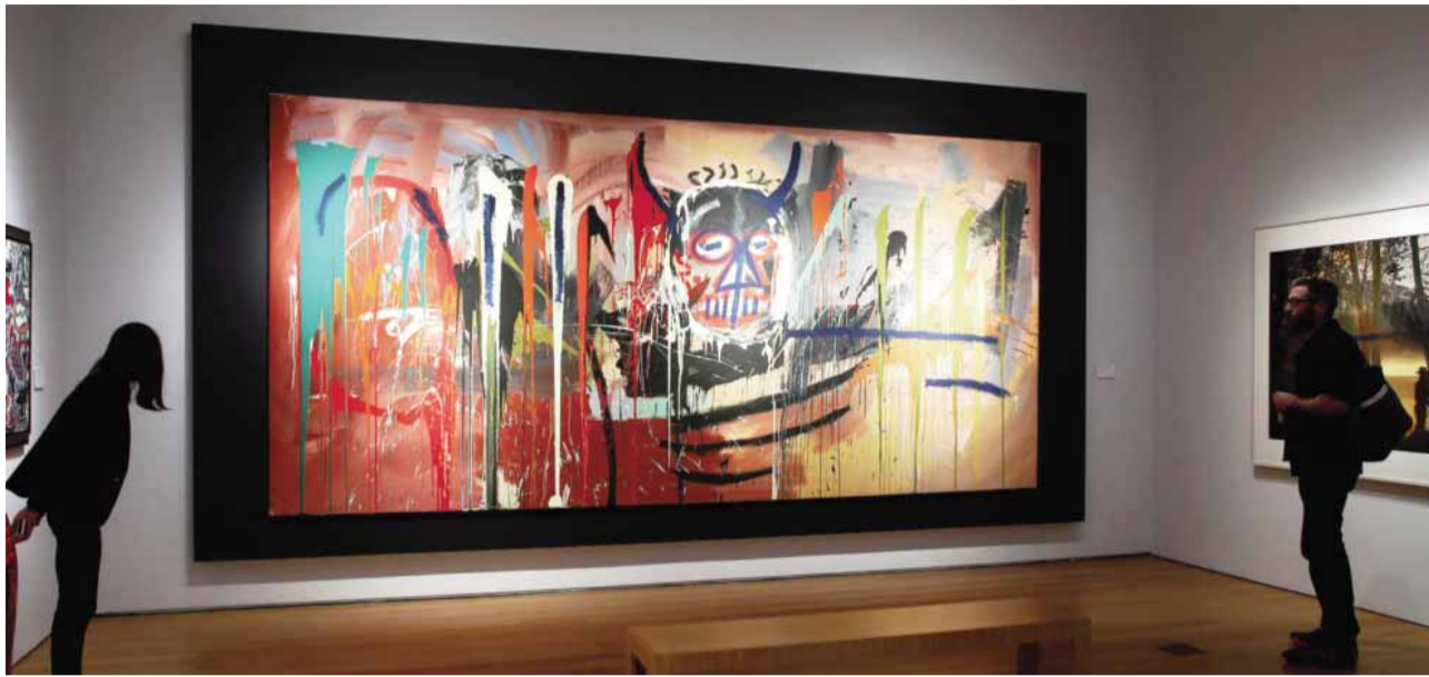
NEW YORK: People observe the artwork 'Untitled' made by artist Jean-Michel Basquiat during a press preview of Christie's forthcoming evening auctions of the Contemporary, Impressionist, Modern and Post-War Art.