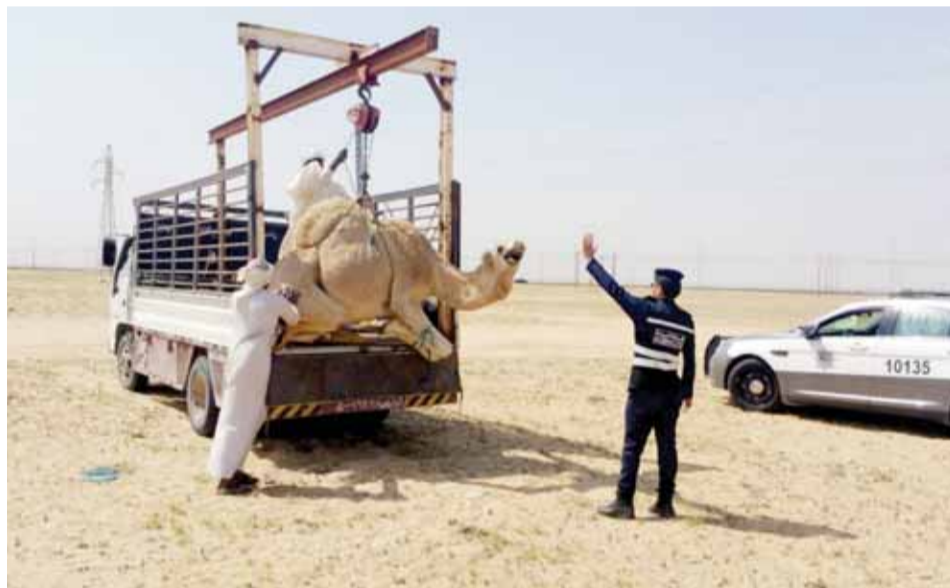
An environment police officer looks on as a camel is being lifted to safety.

The traffic department carried out a campaign on Thursday that resulted in issuing 3,995 traffic citations, 234 vehicles and motorcycles were impounded, a person was sent for deportation and 10 juveniles were sent to concerned authorities. In other news, the Interior Ministry announced that the Wafra detour will open on Road 306 (in Mina Abdullah between King Fahd and Fahaheel roads) from today.