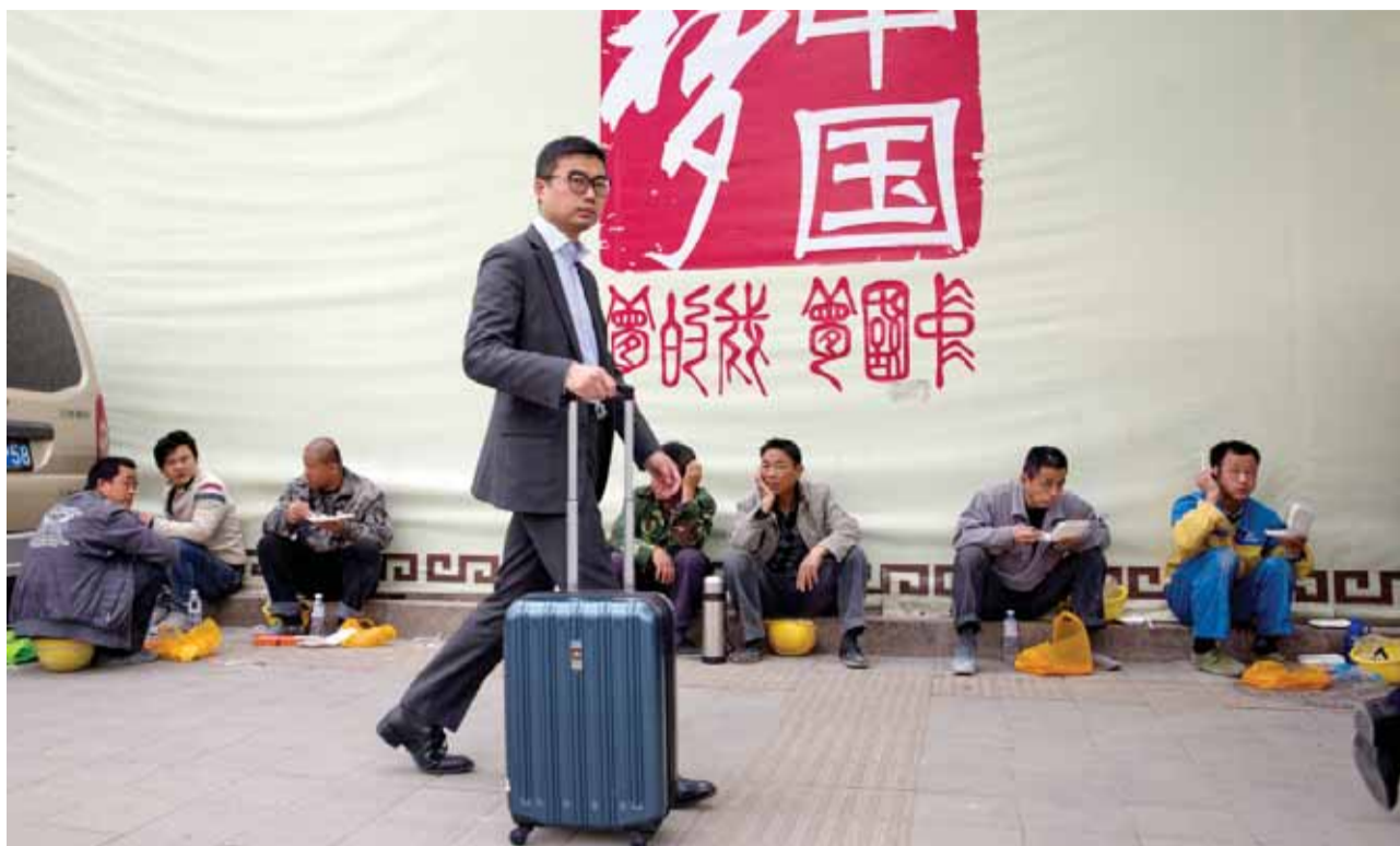
BEIJING: A white collar worker walks past construction workers eating their meals near the Chinese government propaganda slogan "China Dream" on a street in Beijing yesterday. China's economic growth slowed in the first quarter to 6.7 percent compared with the previous year, according to official data released yesterday. — AP

In Brazil, where President Dilma Rousseff is facing impeachment, the UN is projecting that the economy will contract by 3.4 percent this year, reflecting the deepening political crisis, rising inflation, a surging fiscal deficit and high interest rates. — AP