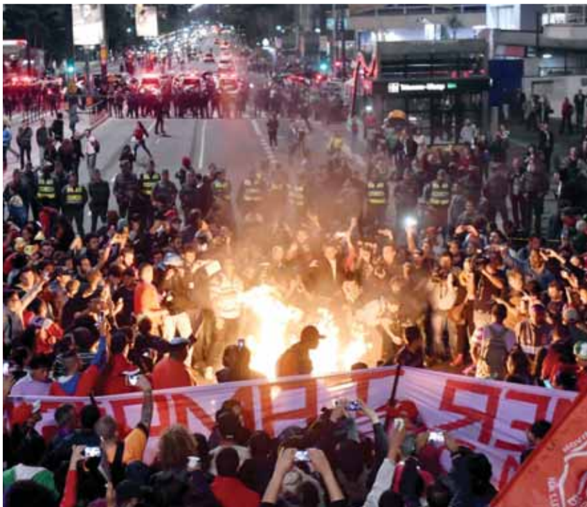
SAO PAULO: Supporters of the government of Brazilian suspended President Dilma Rousseff protest against her impeachment trial yesterday.