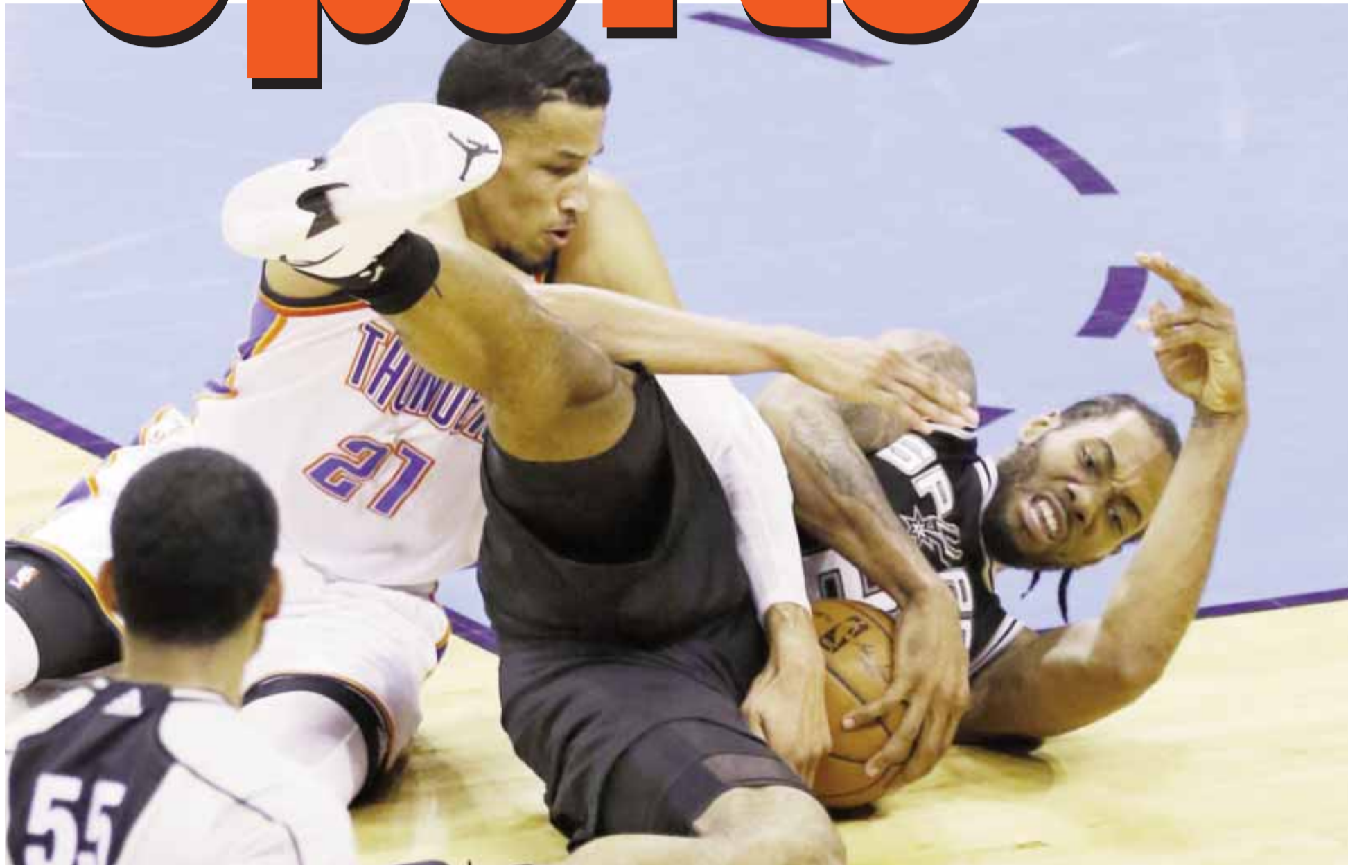
OKLAHOMA: Oklahoma City Thunder guard Andre Roberson (left) reaches for a ball held by San Antonio Spurs forward Kawhi Leonard in the third quarter of Game 6 of a second-round NBA basketball playoff series on Thursday, May 12, 2016.