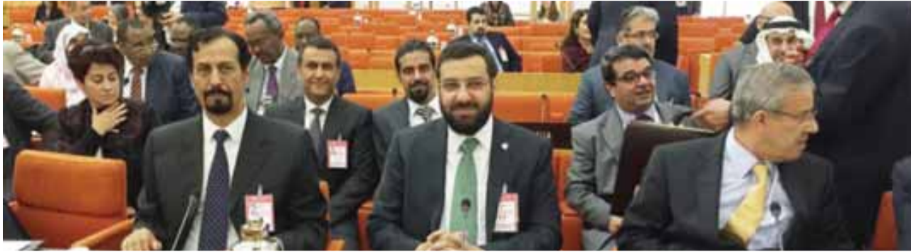
ROME: Kuwait's Minister of Public Works and State Minister for National Assembly Affairs Ali Al-Omair (center) attends FAO's 33rd regional ministerial meeting for the Middle East and North Africa.