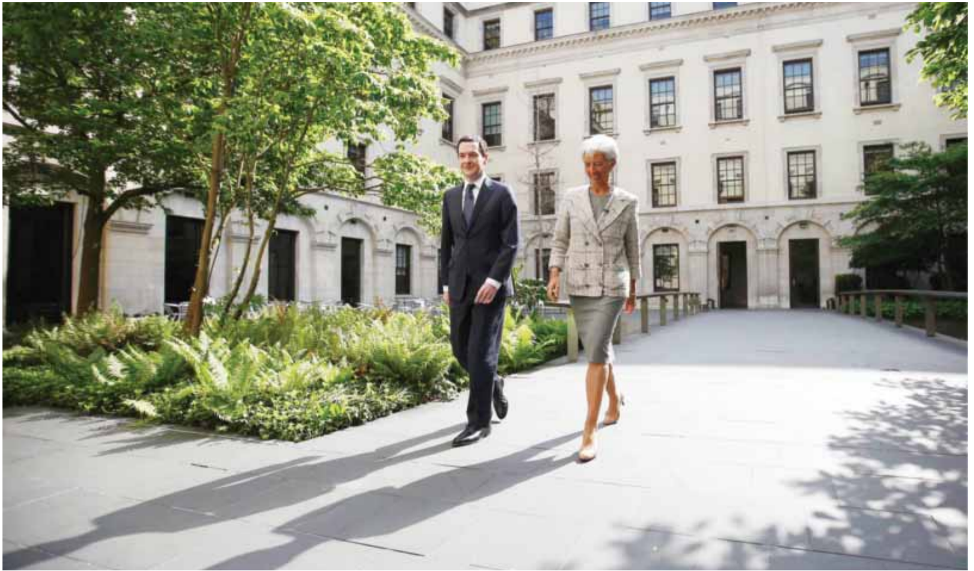
LONDON: International Monetary Fund (IMF) Managing Director Christine Lagarde (right), walks with British Chancellor of the Exchequer George Osborne, ahead of a press conference, at the Treasury Office in central London yesterday.