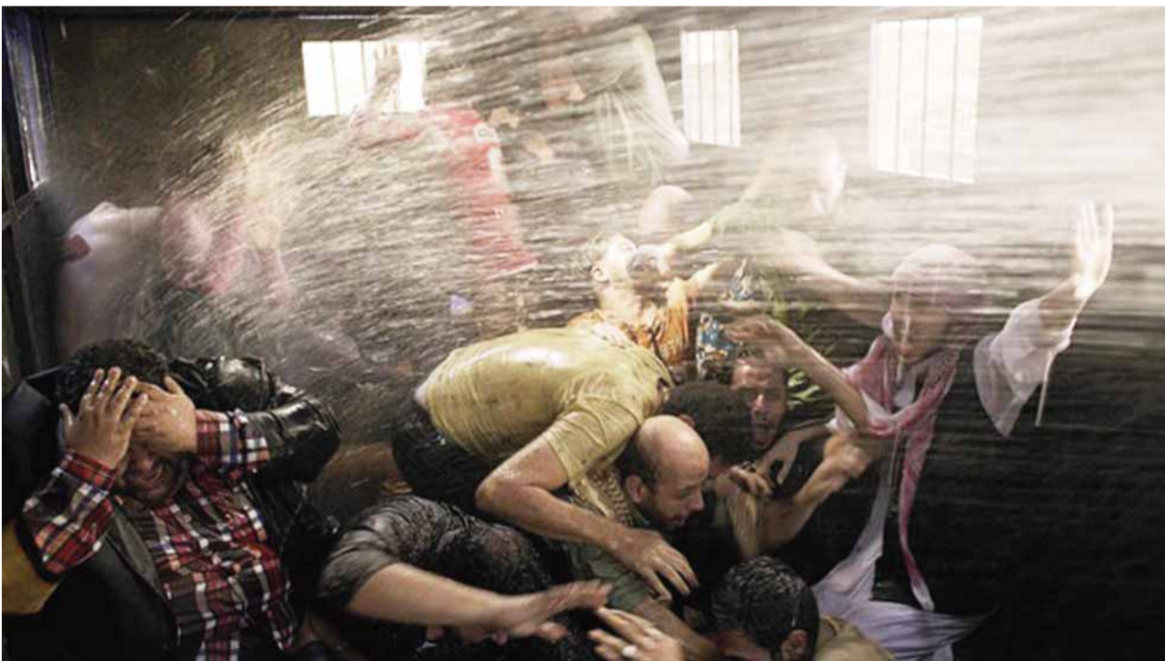
A screen shot from Mohammed Diab's movie 'Clash'. — AFP

Diab, who took part in the revolution and then protested against Morsi, said his film gives no easy answers. "No-one is good and no one is bad, we're all shades of grey." His film sums up the situation in one line: "The golden age of the revolution has passed." — AFP