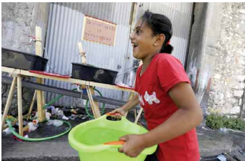
ATHENS: A Syrian refugee girl reacts as she tries to hold a plastic bowl with water at the port of Piraeus yesterday.

The FPÖe under Heinz-Christian Strache is leading opinion polls with more than 30 percent, compared to the low 20s for the SPOe and ÖVP, ahead of the next election scheduled for 2018. Faymann took a harder line on migrants in recent months, but this failed to boost his support and alienated many in the SPOe, particularly those in the left wing of the party. The final straw was the first round of the presidential election on April 24 when the FPÖe's Norbert Hofer scored 35 percent and the main parties' candidates won a dismal 11 percent each. Hofer, 45, portrayed as a friendly face of the FPÖe, will take on Alexander van der Bellen, 72, the professorial former head of the Greens, in a runoff on May 22. — AFP