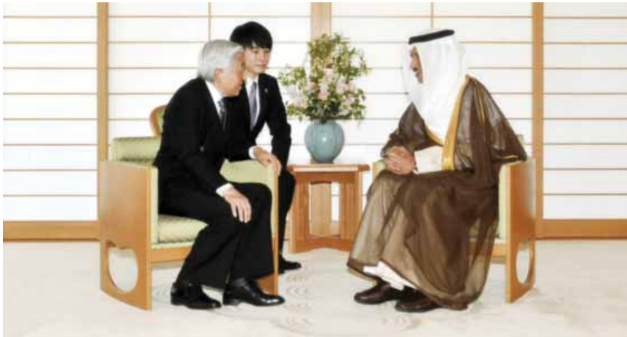
TOKYO: Japan's Emperor Akihito meets Kuwait's Prime Minister HH Sheikh Jaber Al-Mubarak Al-Sabah at the Imperial Palace yesterday. During the reception, Sheikh Jaber handed a letter from HH the Amir Sheikh Sabah Al-Ahmad Al-Jaber Al-Sabah to the emperor, enclosing an invitation to visit Kuwait. The letter also discussed distinguished bilateral relations.

BEIRUT: Lebanon's Hezbollah announced yesterday that its top military commander had been killed in an attack in Syria, where the group has deployed thousands of fighters backing the Damascus regime. Hezbollah said it was investigating the cause of the blast near Damascus airport but did not immediately point the finger at Israel as it did when the commander's predecessor was assassinated in the Syrian capital in 2008.