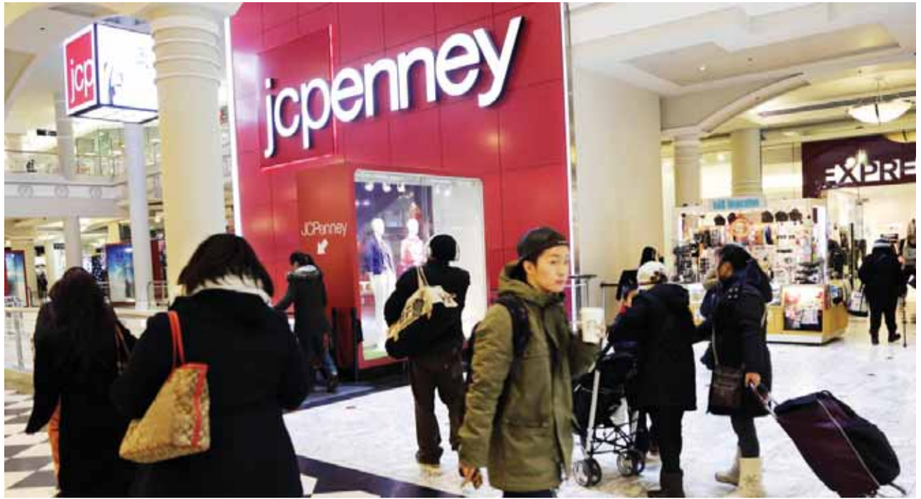
NEW YORK: Shoppers visit a JC Penney store in New York. The Texas-based retailer reports financial results yesterday.

The March increases ended months of falling sales and inventories. Falling inventories have been a big drag on the US economy. They trimmed economic growth by 0.3 percentage point from January through March, reducing the first-quarter increase to a lackluster 0.5 percent annual rate. Inventories have pulled economic growth lower for three straight quarters. So March's rising inventories could provide a boost to second-quarter growth, expected to come in at around 2 percent. Manufacturers and wholesalers reported higher sales and bigger inventories in March. —AP