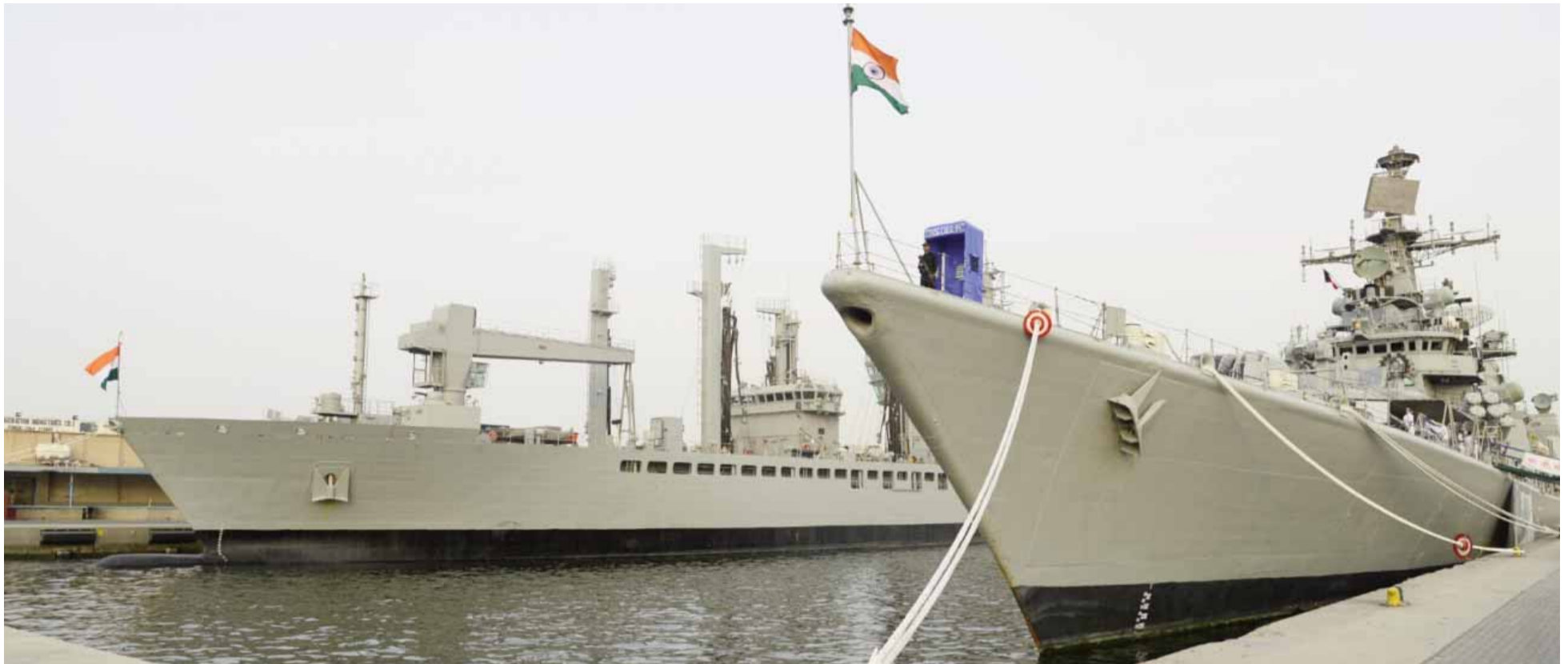
Indian naval ships INS Delhi (right) and INS Deepak (left) are docked at Shuwaikh Port.