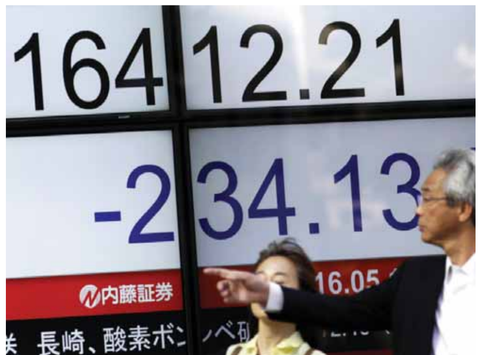
TOKYO: A woman and man walk past an electronic stock board showing Japan's Nikkei 225 index at a securities firm in Tokyo yesterday. Most Asian stock markets headed lower yesterday as investors evaluated the latest set of corporate earnings and awaited a slew of US and Chinese economic data. — AP

BONDS, CURRENCIES: US government bond prices rose. The yield on the 10-year US Treasury note dipped to 1.74 percent from 1.76 percent. The euro fell to $1.1298 from $1.1373 and the dollar inched up to 109.13 yen from 109.14 yen. — AP