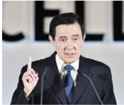
TAIPEI: President Ma Ying-jeou speaks at a local design awards ceremony on April 21, 2016.

But while Ma may have fulfilled a personal ambition, the public felt short-changed and increasingly saw him as a mainland puppet jeopardizing Taiwan's