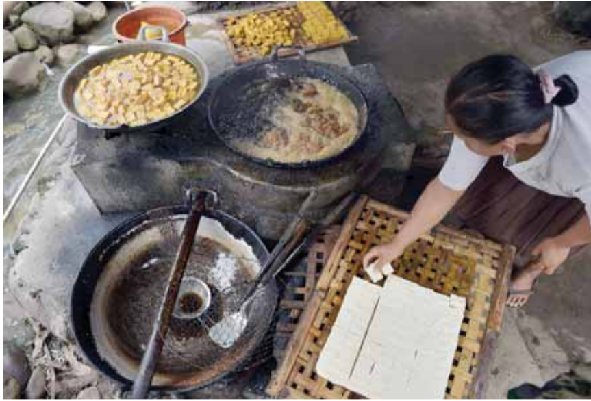
KALISARI, Indonesia: A woman fries tofu in the village of Kalisari, Banyumas, in Central Java.

Renewable energy accounts for just a fraction of the power generated across Indonesia, a sprawling archipelago of more than 17,000 islands with around 250 million people. But the government has committed to curbing Indonesia's greenhouse gases-it is one of the world's top emitters-and wants a quarter of the country's energy to be derived from renewables by 2025. Small-scale projects alone won't meet this target, but they are making a contribution. While most renewable energy projects use traditional sources of power such as solar or wind, the Kalisari initiative is among a handful taking a more original approach. Other projects