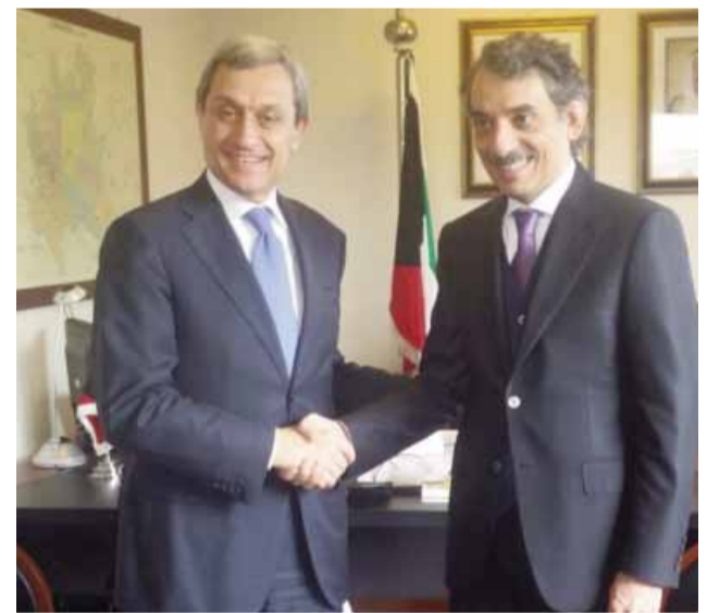
ROME: Consul General in Milan and North Italy Abdunnasser Bou-Khaddur meets with Milan's Prefect Alessandro Marangoni. — KUNA

Italy's central state archives was established in 1875 under the name of the royal archives. The archives, located in Rome, switched to its current name by 1953 and it operates under the supervision of the Ministry of Culture. — KUNA