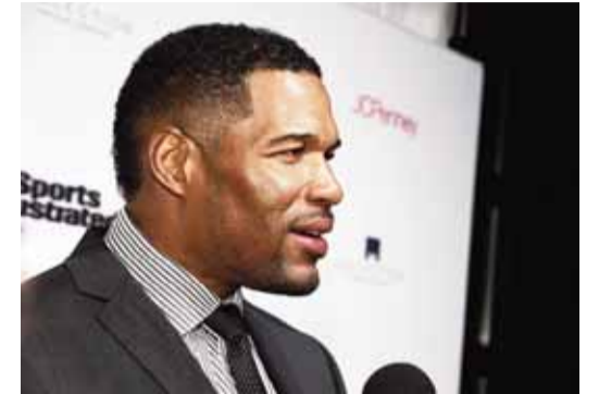
TV Personality Michael Strahan