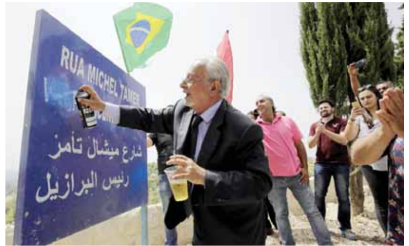
BTAABOURA: A Lebanese man uses spray paint to erase the word "vice" from a plaque reading in Portuguese and Arabic: "Street Michel Temer, Vice President of Brasil" at the entrance of this village yesterday during a celebration after Temer became acting President of Brazil.

The country's Christian, Sunni, Shiite and Druze cannot agree on a candidate and parliament has met time and again but failed to break the impasse. The Temer ancestral family home lies in the midst of a thick olive grove. His father lived here but the house is now abandoned and in ruins. Lebanon and Brazil have strong bonds. The Lebanese began emigrating to Brazil and other South American countries in the 19th century with more departures during the 1979-1990 civil war. Many are now settled in Rio de Janeiro and in Sao Paulo.