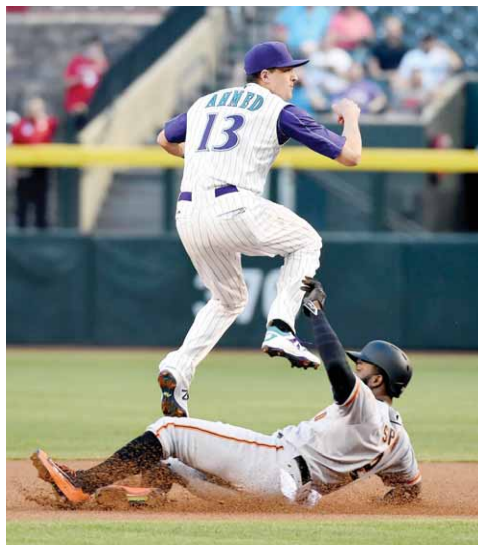
PHOENIX: Nick Ahmed #13 of the Arizona Diamondbacks turns a double play while jumping over Denard Span #2 of the San Francisco Giants during the first inning at Chase Field on May 12, 2016.

Matt Holliday homered twice in two innings off Jered Weaver, Matt Carpenter homered as well and St Louis held off a late rally to beat Los Angeles and complete a three-game sweep. Holliday matched his career high with four hits to pace an 18-hit outburst by the Cardinals. Matt Adams and Yadier Molina added three hits apiece, and every Cardinals starter had a hit. The Angels