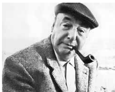
Nobel prize for literature receiver poet Pablo Neruda.

Neruda first went underground and became a fugitive as he tried to lead leftist opposition to the government, but eventually he had to flee the country. Neruda crossed the Andes mountains on horseback en route to Argentina with local people who knew the land and almost drowned in the Currigüe river in southern Chile. He recalled this brush with death when he gave a speech accepting the Nobel prize for literature in 1971. He said he rode a horse that was struggling to keep its head above water plunging them both in the torrent.