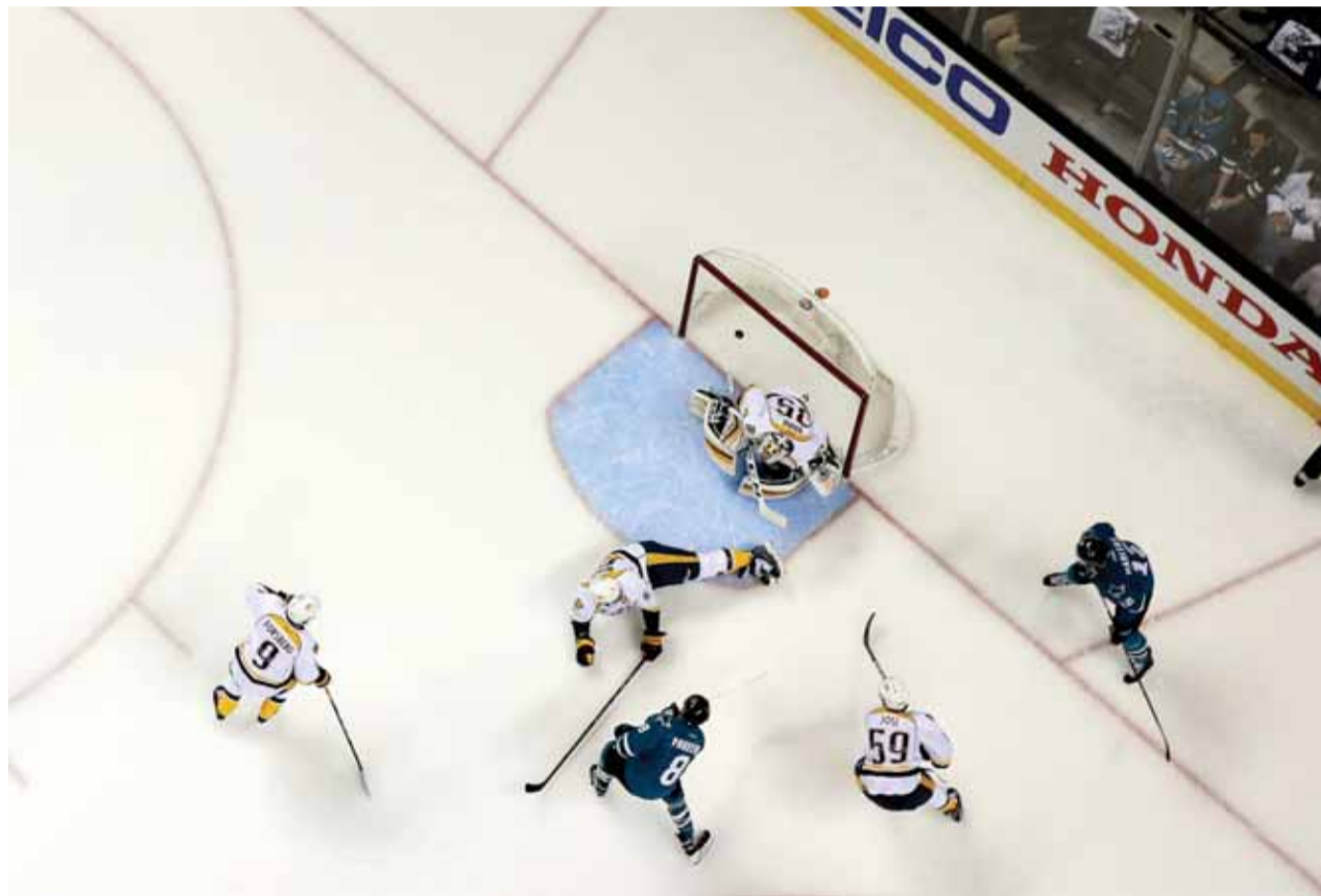
SAN JOSE: Joe Pavelski #8 of the San Jose Sharks scores a goal past Shea Weber #6 and goalie Pekka Rinne #35 of the Nashville Predators in the first period of Game Seven of the Western Conference Second Round on May 12, 2016.