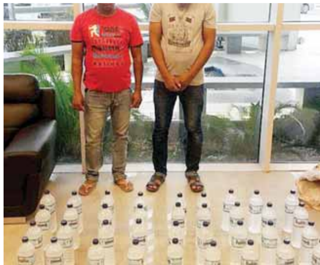
KUWAIT: This handout photo shows two persons arrested during crackdowns yesterday with possession of homebrewed liquor bottles.