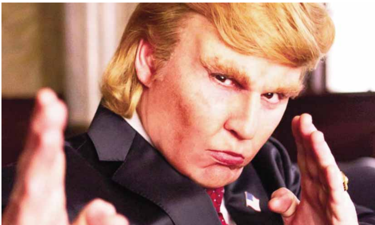
Actor Johnny Depp's portrayal of Donald Trump on Funny or die.

Moura added, "We wanted to be as respectful as we could to Colombian history." Moura, who is a Brazilian native, didn't speak Spanish before ultimately landing the role. He revealed that he traveled to the Colombian set location ahead of the "Narcos" cast and crew to familiarize himself with the language. "You know what he did?" Padilha asked, addressing the audience. "Three months before we even scouted Colombia, [he] went to Medellin on his own, enlisted into a university where Pablo Escobar went and stayed there speaking Spanish for three months. When we got there, he knew how to speak Spanish; that's what it takes." — Reuters