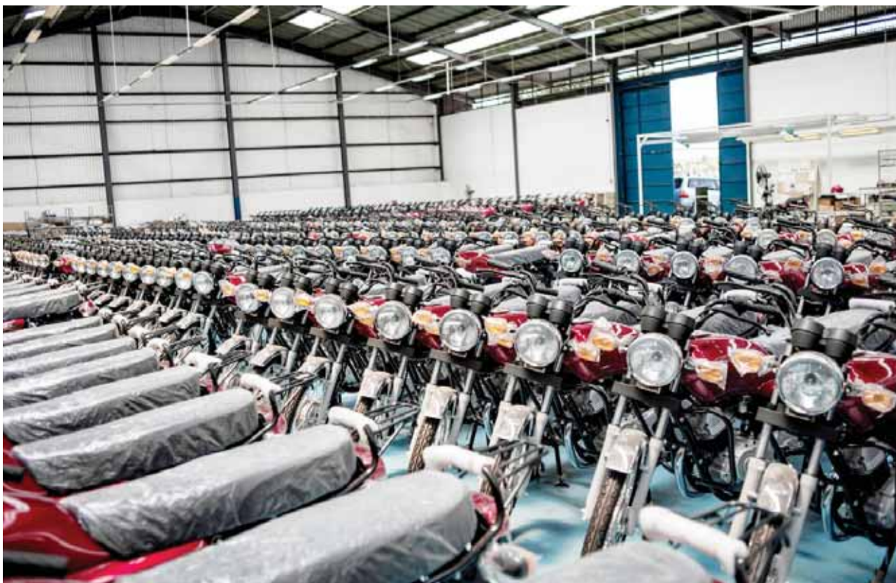
LAGOS: Motorcycles assembled at the new Yamaha factory in Lagos yesterday. CFAO Yamaha Nigeria Limited opened a new showroom, technical training centre and assembly line yesterday in Lagos after years of absence in the local market. — AFP

Last year, a Moscow court ordered him to pay 75.6 billion rubles (around $1 billion) to the bank's former clients over his role in the lender's collapse. Pugachev immediately appealed to Russia's Supreme Court to quash the ruling, but he lost the appeal in January. — AFP