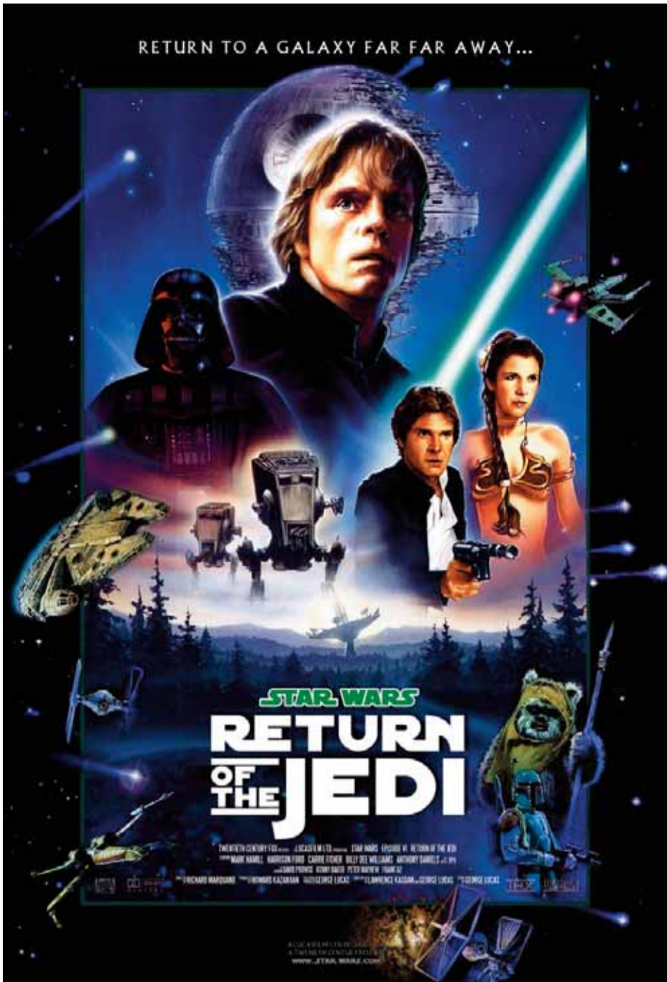
STAR WARS- EPISODE VI - RETURN OF THE JEDI ON OSN MOVIES PREMIERE HD