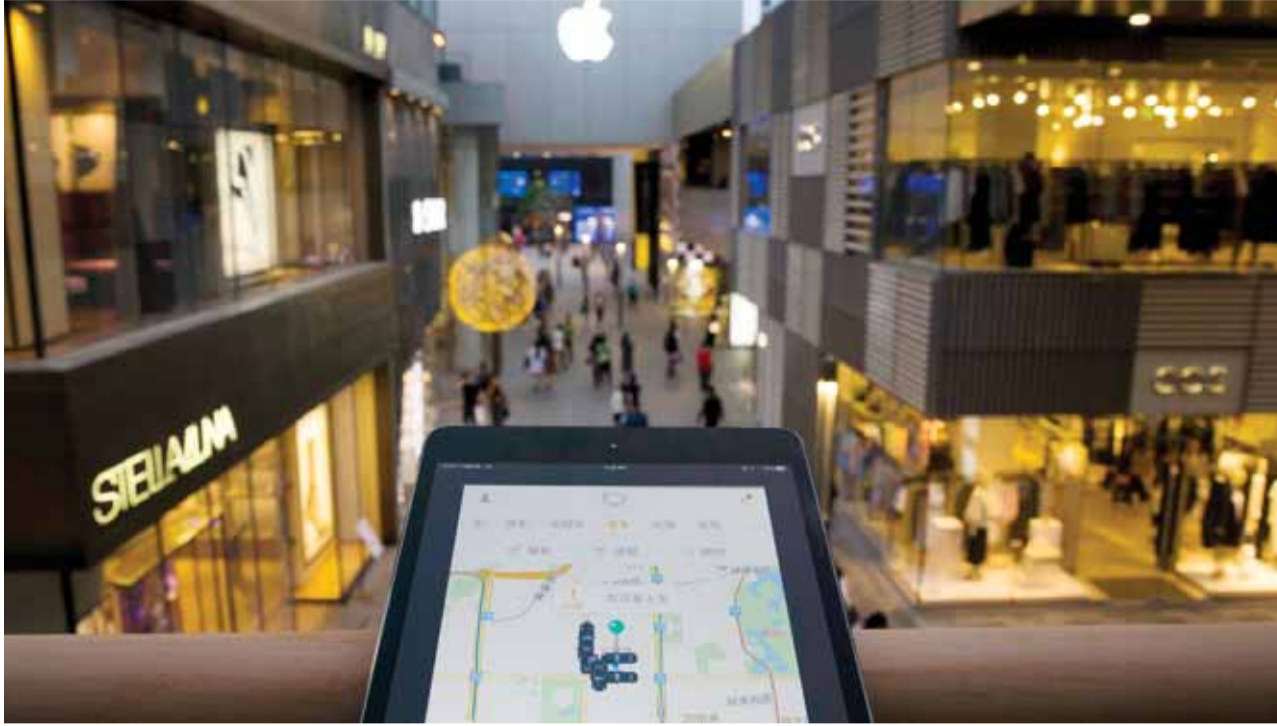
BEIJING: A mobile device displaying the Didi Chuxing app is posed near the Apple store logo in Beijing yesterday. Apple Inc has invested $1 billion in Chinese ride-hailing service Didi Chuxing, the main competitor in China for Uber Technologies Ltd.