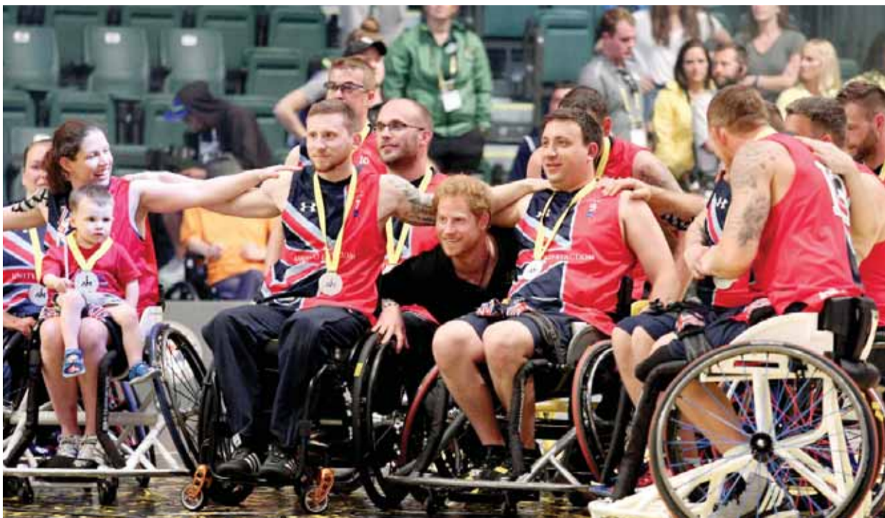
FLORIDA: Britain's Prince Harry, Patron of the Invictus Games Foundation, poses with players of the United Kingdom men's wheelchair basketball team after the medal ceremony, on the final day of the 2016 Invictus Games in Orlando. The United Kingdom finished second behind the United States in the final, winning the Silver medal. The Netherlands finished third.