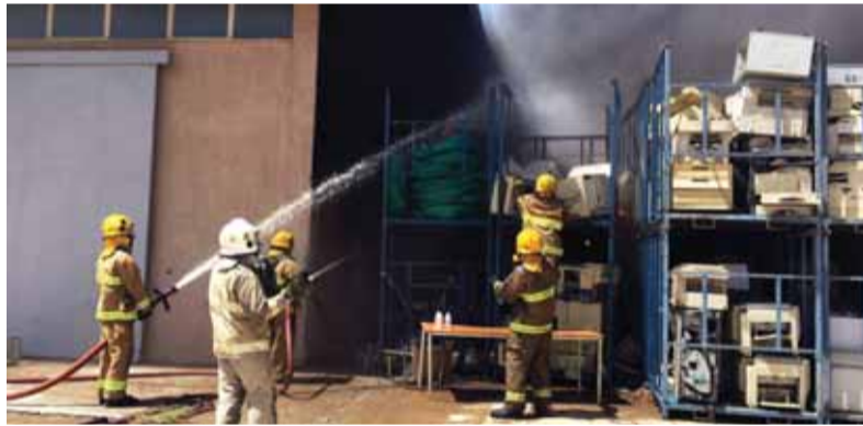
KUWAIT: Firefighters tackle a blaze at a Ministry of Education warehouse in Subhan yesterday.