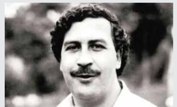
Notorious Colombian drug lord Pablo Escobar.