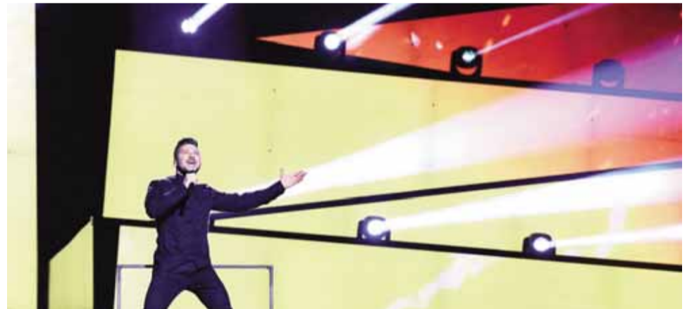
STOCKHOLM: Sergey Lazarev representing Russia performs the song "You Are The Only One" during the first semi-final of the Eurovision Song Contest 2016 on Tuesday.