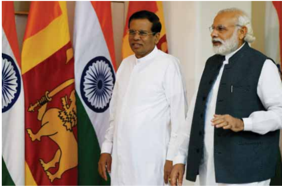
NEW DELHI: Indian Prime Minister Narendra Modi (right) and Sri Lankan President Maithripala Sirisena arrive for a meeting yesterday. Sirisena is on a two-day visit to India.

It was the prospect of tangible change that voters chose in 2014, propelling Modi to a landslide election victory won on the bold promise that "the good days are coming" for 1.3 billion people and by tapping dreams of a more modern India. While many promises remain unrealized, power reforms and the creation of tens of millions of new bank accounts have helped Modi maintain his pop-