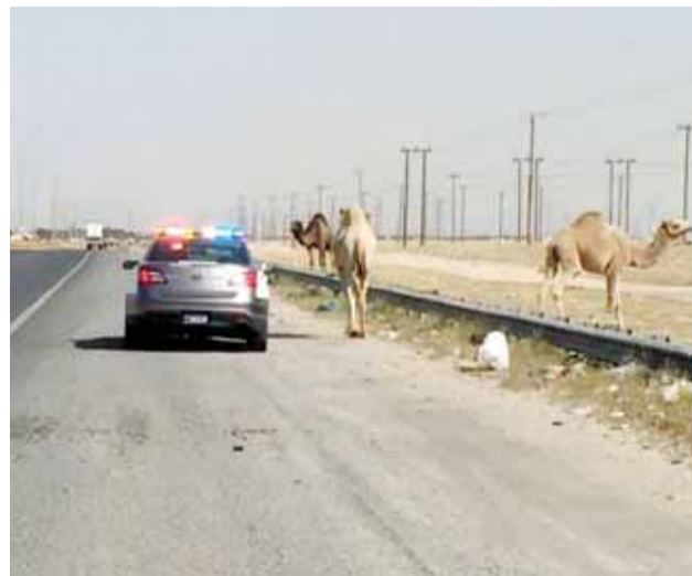
Camels pass by a police patrol car. Two shepherds were arrested yesterday for failure to control their animals.