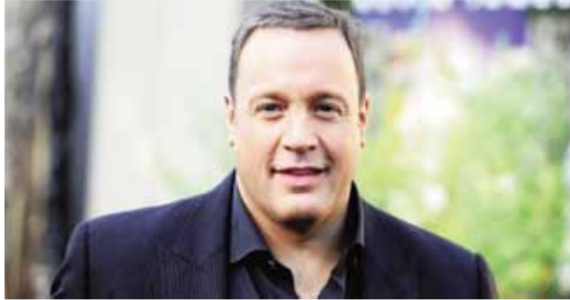
Comedian Kevin James

C BS has given an official series order to Kevin James' new comedy "Kevin Can Wait." The previously untitled project from CBS Television Studios and Sony Pictures Television had already received a production commitment for the 2016-17 season from the network.