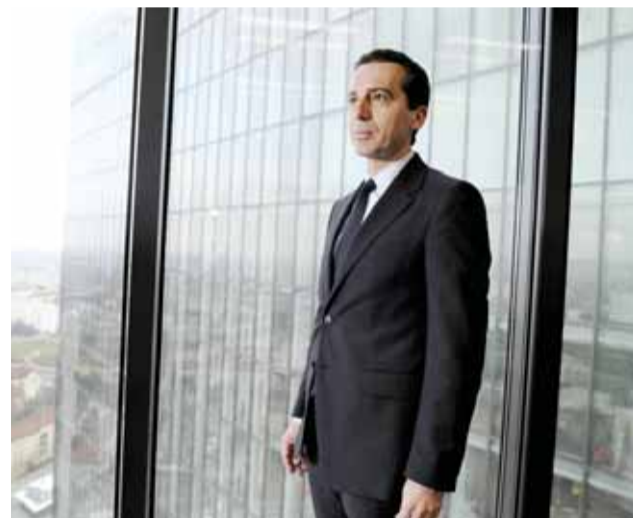
VIENNA: Picture taken on March 19, 2012 shows the CEO of the Austrian Federal Railways (ÖBB) Christian Kern posing after an interview.