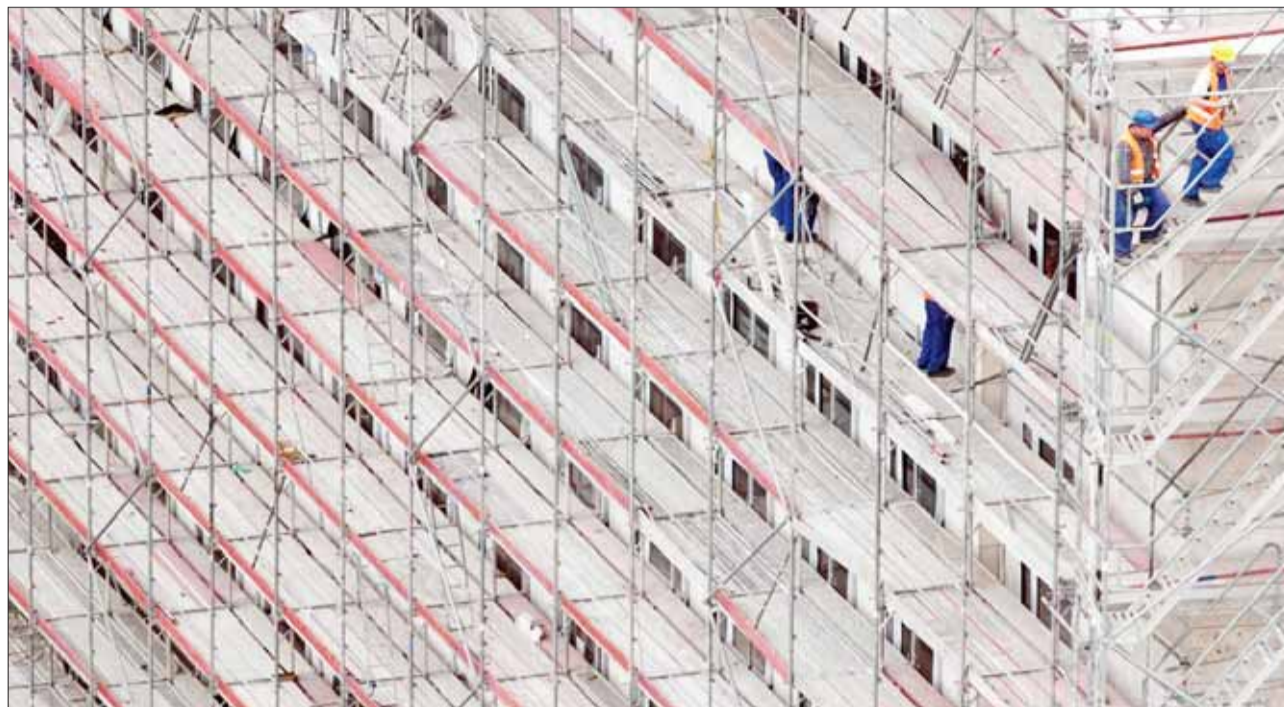
BERLIN: Workers on a scaffolding at a building under construction in Berlin. The German economy, Europe's biggest, grew at its fastest rate in two years in the first three months of 2016, outpacing both the rest of the eurozone and the Group of Seven most industrialised countries, data showed yesterday.