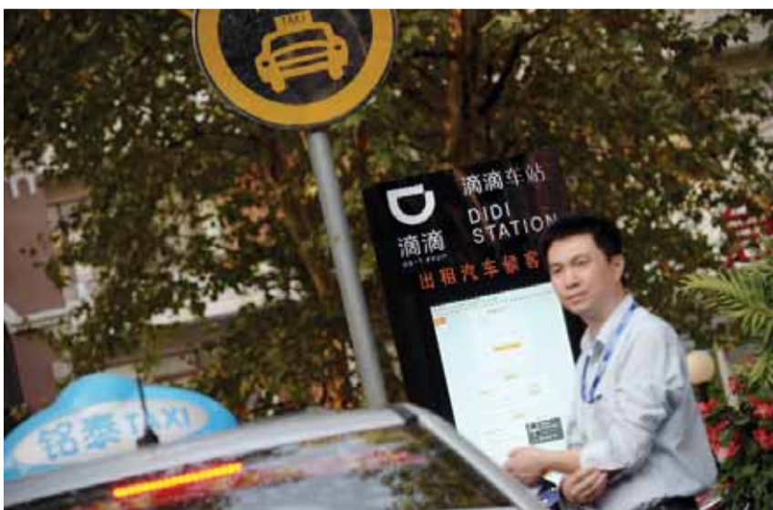
SHANGHAI: A taxi driver waits at a newly-installed Didi Station, a road-side stop for taxis booked by the Chinese car-hailing app Didi Kuaidi, which has since changed its name to Didi Chuxing, in Shanghai.

"This is as much about sending signals about their seriousness in that country as it is about helping Didi build a ride-sharing platform," he said. Didi Chuxing is a poster child for Chinese technology, a critical sector in Beijing's goal to shift the economy towards higher-value services.