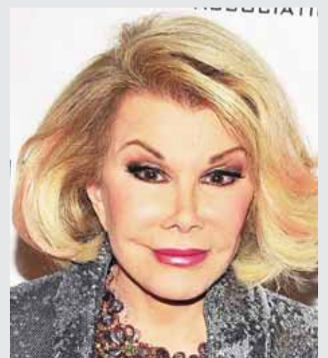
Legendary Comedian Joan Rivers