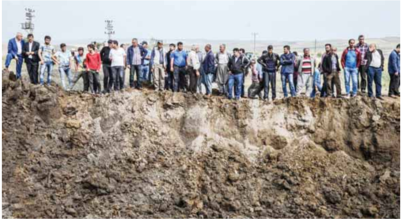
DIYARBAKIR: People look in a huge crater after a powerful blast yesterday in the area of Sarikamis on the outskirts of this majority Kurdish city. — AFP

Either way, without a majority Rouhani's government will have to pick its battles. Analysts say the president is likely to focus on pushing economic reform rather than social liberalization. That could bring a fresh set of problems, frustrating millions of young, well-educated Iranians who voted for him in 2013 hoping for more political and social freedoms. For all the new faces, just 12 percent of incoming lawmakers are aged 40 or under, according to Interior Ministry data, whereas around 60 percent of Iranians are under 30. — Reuters