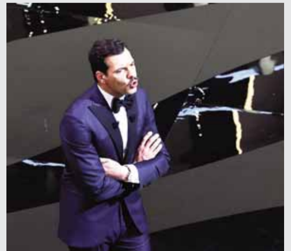
CANNES, FRANCE: French actor and Master of Ceremony Laurent Lafitte speaks on stage on Tuesday during the opening ceremony for the 69th Cannes Film Festival.

Allen told Variety magazine Thursday: "It would take a lot to offend me." "I'm a comic myself and I feel they should be free to make whatever jokes they want."