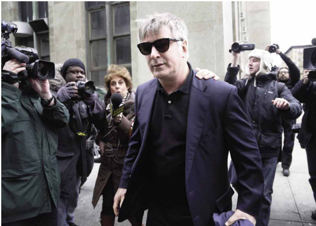
NEW YORK: Actor Alec Baldwin leaving criminal court after testifying at his stalker's trial, having run-ins with photographers, and being suspended from his ultimately short-lived MSNBC show because of his behavior during one of the encounters, Baldwin wrote a New York magazine cover story in 2014 decrying the constant tabloid coverage of his comings and goings.