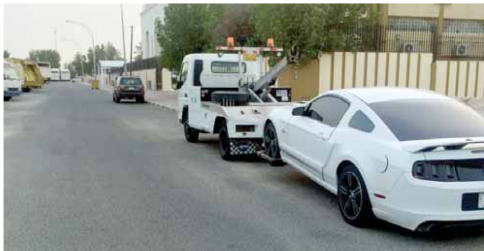
A sports car is being impounded during a recent traffic campaign.

He said the embassy has two shelters that house 400-450 people on average, adding, "We hope to return them to their country with the cooperation of Kuwaiti officials." — Al-Rai