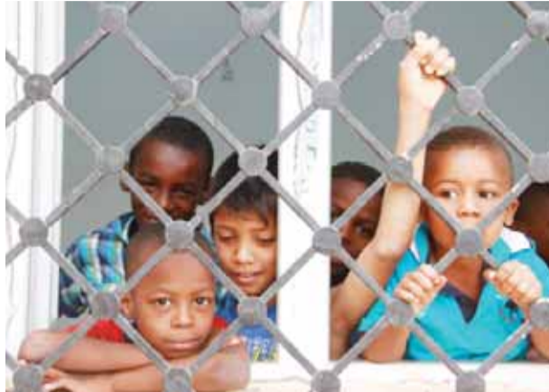
BANI WALID, Libya: Displaced Libyan children who fled the eastern Libyan cities of Abu Grein and Sirte look out of the window at a school where they are taking shelter on May 10, 2016.

His comments come as IS jihadists have over the past