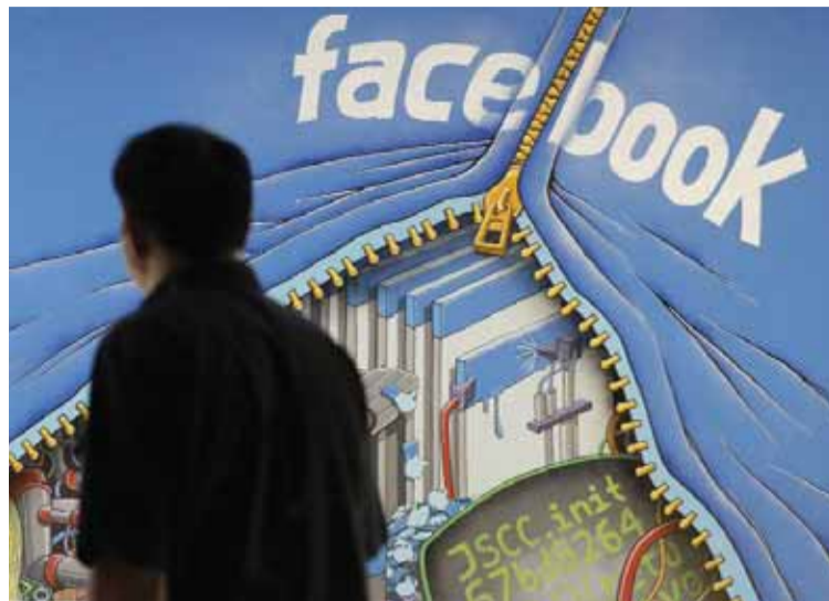
A man walks past a mural in an office on the Facebook campus in Menlo Park, California. Yesterday, Facebook pulled back the curtain on how its Trending Topics feature works, a reaction to a report that suggested Facebook downplays conservative news subjects. — AP

Trending topics were introduced in 2014 and appear in a separate section to the right of the Facebook newsfeed. According to Facebook, potential trending topics are first determined by a software formula, or algorithm, that identifies topics that have spiked in popularity on the site. Next, a team of trending topic staffers review potential topics and confirm the topic is tied to a current news event; write a topic description with information corroborated by at least three of 1,000 news outlets; apply a category label to the topic; and check to see whether the topic is covered by most or all of ten major media outlets (including The New York Times, Fox News, BuzzFeed and others). Stories covered by those outlets gain an importance level that may make them more likely to be seen. — AP