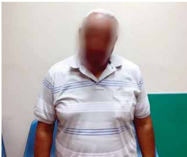
A suspect arrested for forging security clearance certificates for Bangladeshi labor forces.