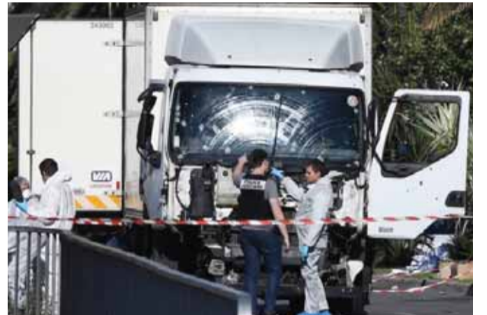
NICE: Forensics officers and policemen look for evidences near a truck on the Promenade des Anglais seafront in the French Riviera town of Nice yesterday, after it drove into a crowd watching a fireworks display.