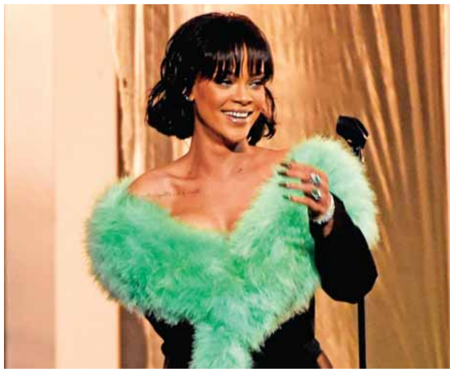
In this file photo, Rihanna arrives on stage to perform "Love On The Brain" at the Billboard Music Awards in Las Vegas.

Rihanna was set to play at the Allianz Stadium in Nice last night as part of her Anti World Tour. She's next scheduled to perform Sunday night at the Commerzbank Arena in Frankfurt, Germany. A Bastille Day celebration turned fatal Thursday when a 15-meter truck drove into a crowd that had gathered for fireworks. The driver of the vehicle, which also had explosives and weapons inside, was killed. Related 'Fifty Shades' Sequel Filming in Nice During Terrorist Attack President Obama condemned the attack as a "horrific act of terrorism," and the anti-terrorism unit in France has launched an investigation. It's the second-deadliest attack in France since World War II—the terrorist attacks on Nov 13 of last year killed 130 people. — Reuters