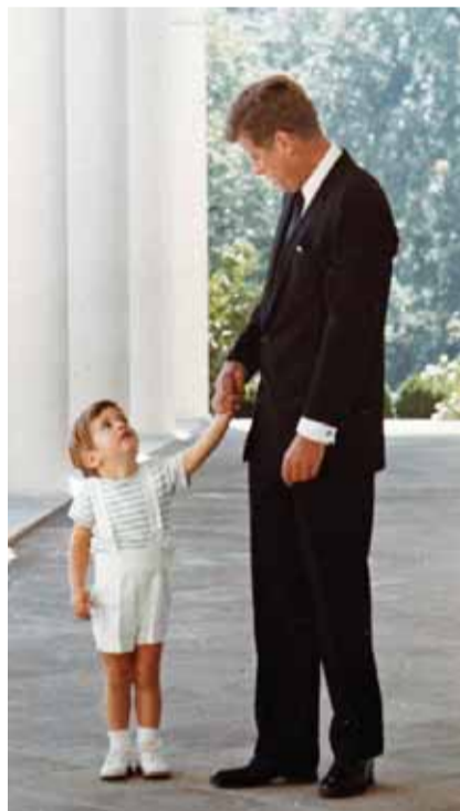
In this 1963 file photo, US President John F Kennedy holds hands with his son, John F Kennedy Jr, outside the White House in Washington.