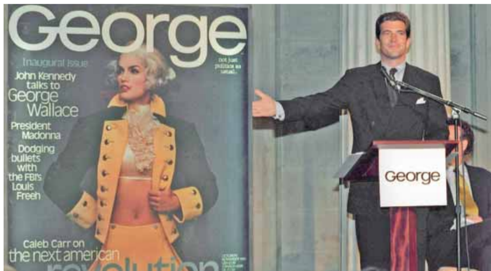
In this Sept 7, 1995 file photo, John F Kennedy Jr, co-founder and editor-in-chief of the politics-as-lifestyle George magazine, unveils the magazine's first cover in New York.