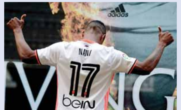
VALENCIA: Valencia's new player Portuguese Luis Carlos Almeida de Cunha 'Nani' poses during his Official presentation.

"It's normal that big clubs in the world go through bad years, the same thing happened to Manchester United and now they are better," said Nani. "The same has happened to Valencia. We hope to return the club to the level it deserves as soon as possible." Portugal's Euro 2016 final triumph over hosts France was still at the front of Nani's thoughts. "The European Championship was a unique experience, we made history," he said. "It was a dream come true and now I'm delighted because I have a new chapter to look forward to, with new aims to achieve. "I'm going to try to be happy like I was with my country and in the other clubs that I've played at. "Valencia is the best option for me. It has been at world level. It's an ideal club for me to be happy and prove my level. I wanted to play in La Liga."