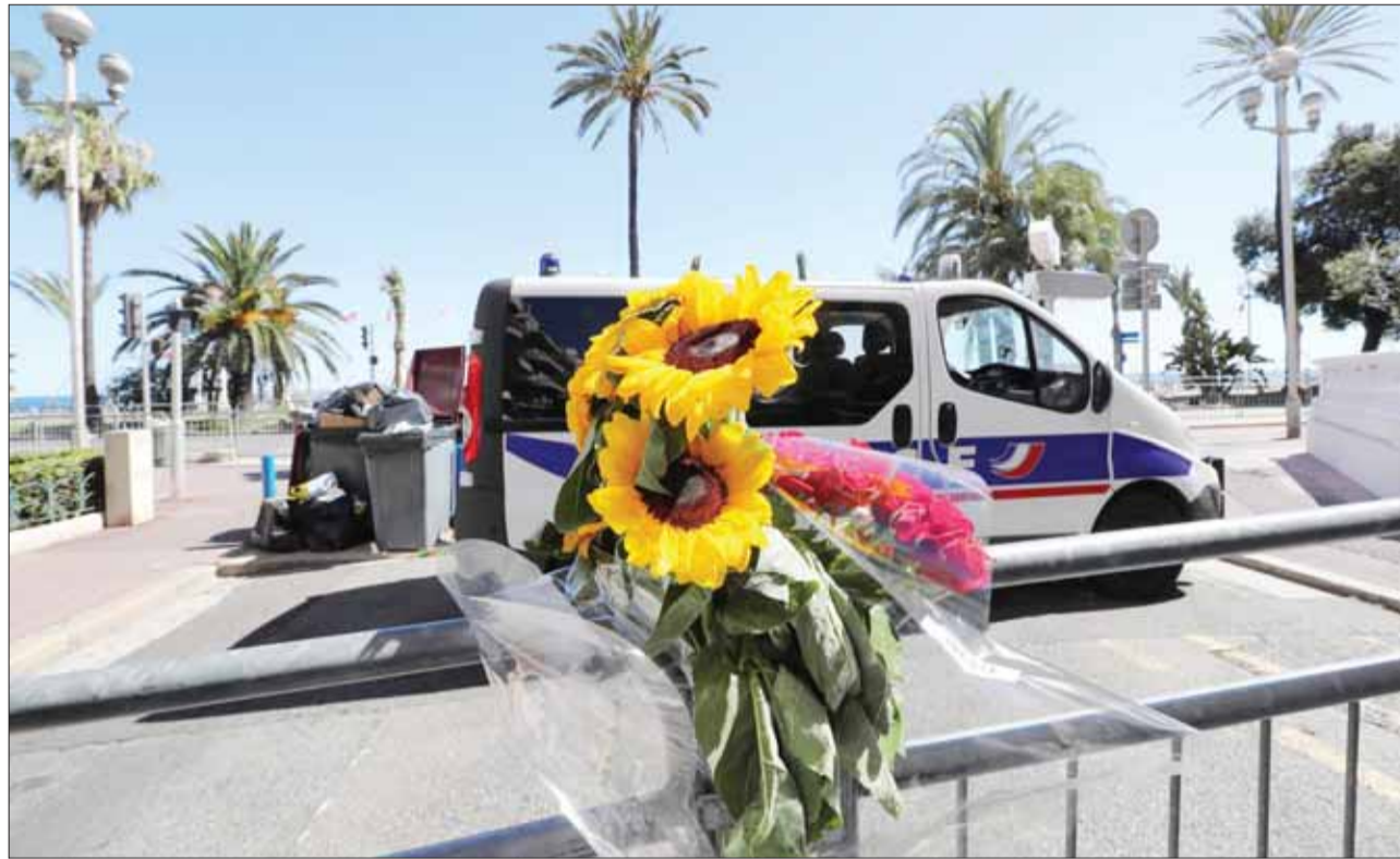
NICE: Flowers put near the site of the deadly attack on the Promenade des Anglais seafront in the French Riviera city of Nice, after a gunman smashed a truck through a crowd celebrating Bastille Day, killing at least 84 and injuring dozens of children in what President Francois Hollande called a 'terrorist' attack. — AFP