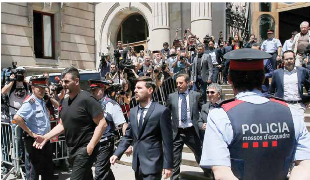
BARCELONA: In this June 2, 2016 file photo, Barcelona soccer player Lionel Messi, center, leaves a court.