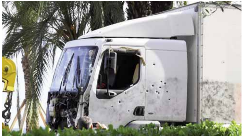
NICE: Policemen walk on the site where a truck drove into a crowd watching a fireworks display on the Promenade des Anglais seafront in the French Riviera town of Nice yesterday. (Right) Photo shows the truck, riddled with bullets. (See Pages 8&9)