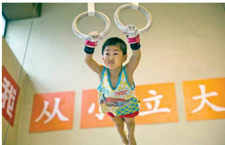
SHANGHAI: In this photo taken Thursday, June 16, 2016, a young child practices on still rings at the Xuhui Sports School near the slogans "Set ambitious goals from young".

Already, Beijing has ordered the country's football association to be divested from the government and has issued policies to promote the sport on school campuses. The country has commercialized football and basketball through