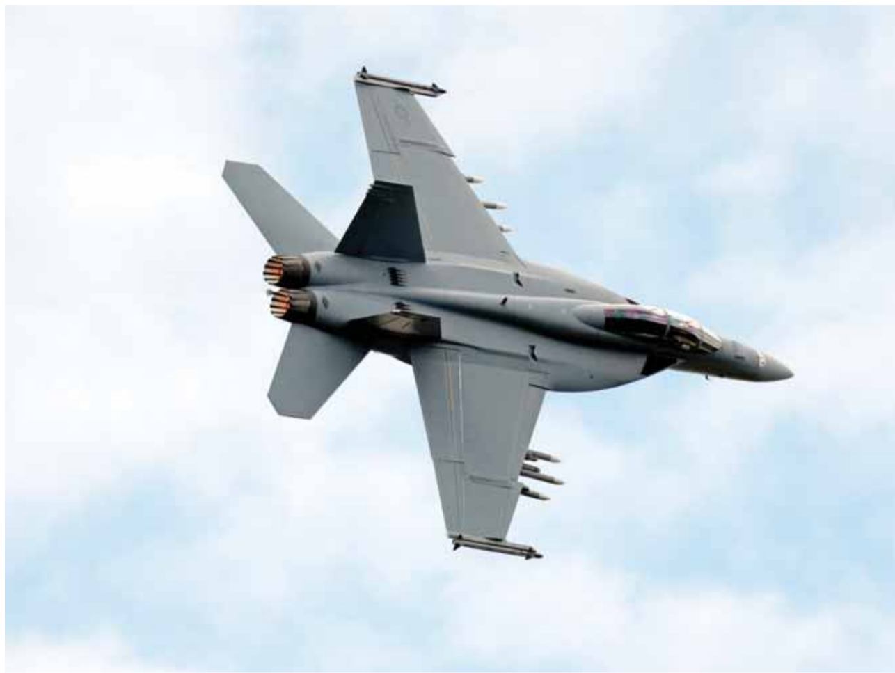
FARNBOROUGH: Photo shows the Boeing F/A-18 Super Hornet - a twin-engine, supersonic, all weather multi-role fighter at the Farnborough Airshow.