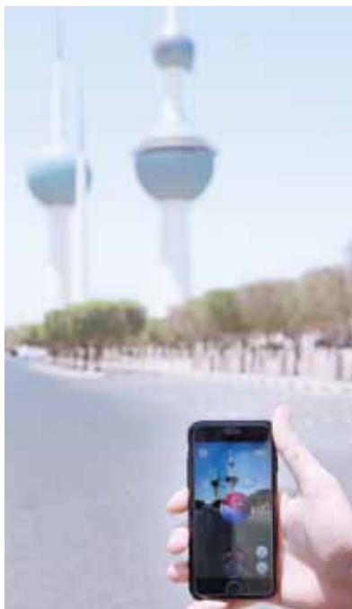
KUWAIT: Photo shows a Pokemon Go user near the Kuwait Towers in Kuwait City. — Photo by Yasser Al-Zayyat

The TRA said Pokemon Go could result in users being spied upon and urged players not to activate their phone cameras at home or in other private areas. Pokemon Go works in the UAE but cannot yet be downloaded from local app stores. The National daily reported this week a warning from Abu Dhabi police of the dangers of using mobile apps while walking in the city. The TRA said that it is still "reviewing the effects and dangers that... these games and apps have on society" before making a decision on whether to release Pokemon Go locally. — Agencies