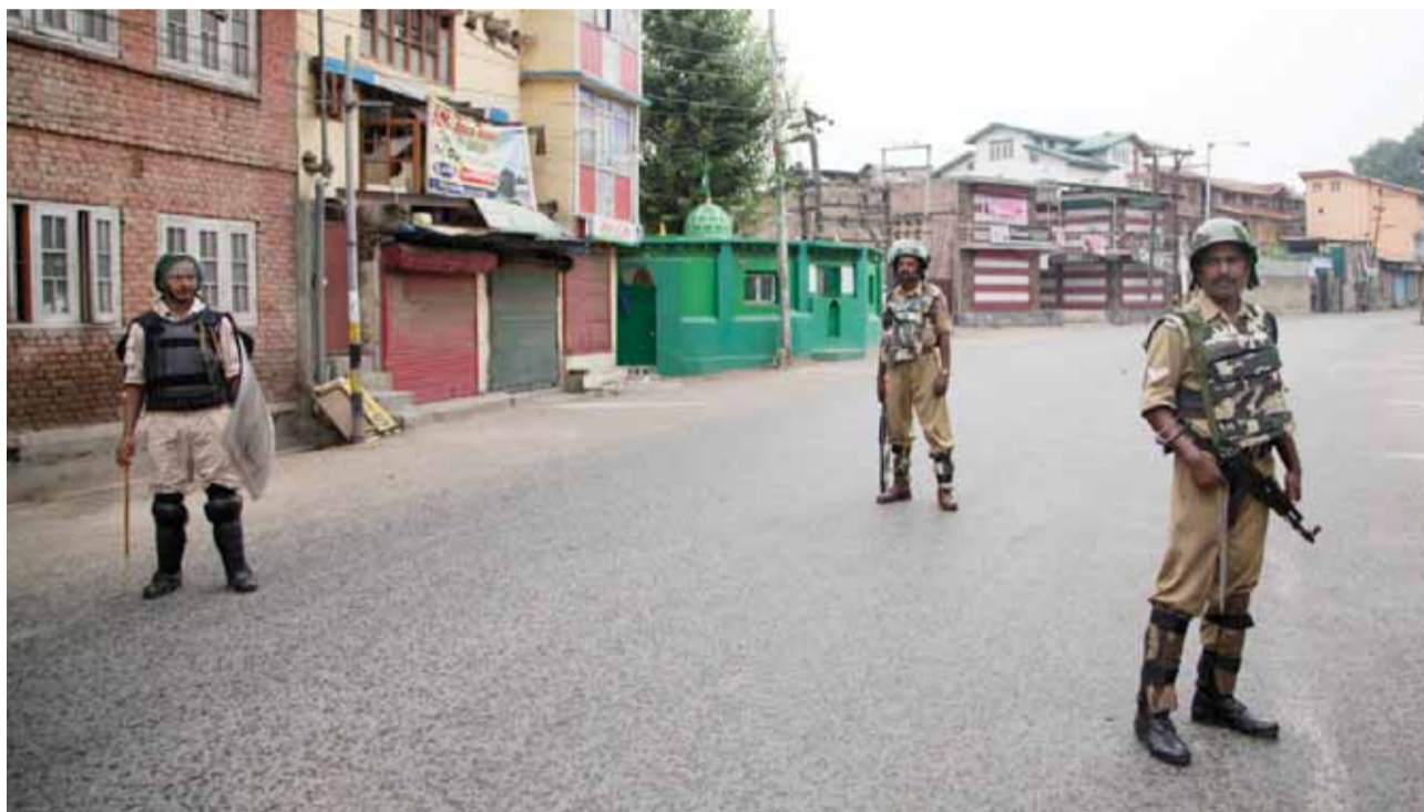
INDIA: Indian paramilitary soldiers stand guard during a curfew in Srinagar, Indian controlled Kashmir, yesterday.—AP

The study registered that there had been improvements despite some setbacks. In Punjab, the country's most populous province, teacher absenteeism dropped from 20 percent to six percent between 2010 and 2015. But the rise in funding—mainly spent on salary boosts for teachers—has had little effect. In Sindh province, standardized test scores of fifth and sixth graders, or children aged 10 and 11, showed zero improvement between 2012 and 2014. Improvements in other provinces were also marginal. Britain's development agency is the primary donor, giving $150 million in 2016, or about two percent of Pakistan's overall education budget.—AFP