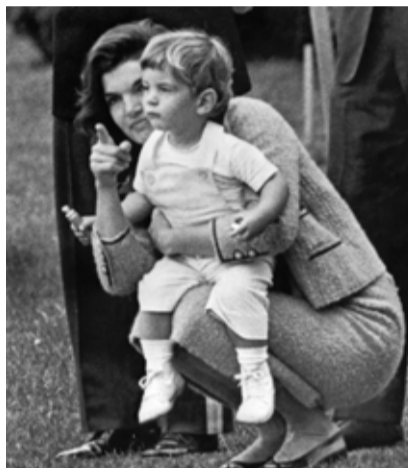
In this Oct 15, 1962 file photo, John F Kennedy, Jr, son of the president, watches from the rose garden with his mother Jacqueline Kennedy as his father gives a formal greeting to Algerian Premier Ahmed Ben Bella during ceremony on the White House grounds in Washington.

know, 'I'm junior. I'm not my father,'" another presidential son, Michael Reagan, says in the film. "I believe that he had greatness in him," CNN journalist Chris Cuomo tells the producers. "And I don't give a damn if that meant anything about politics." — AP