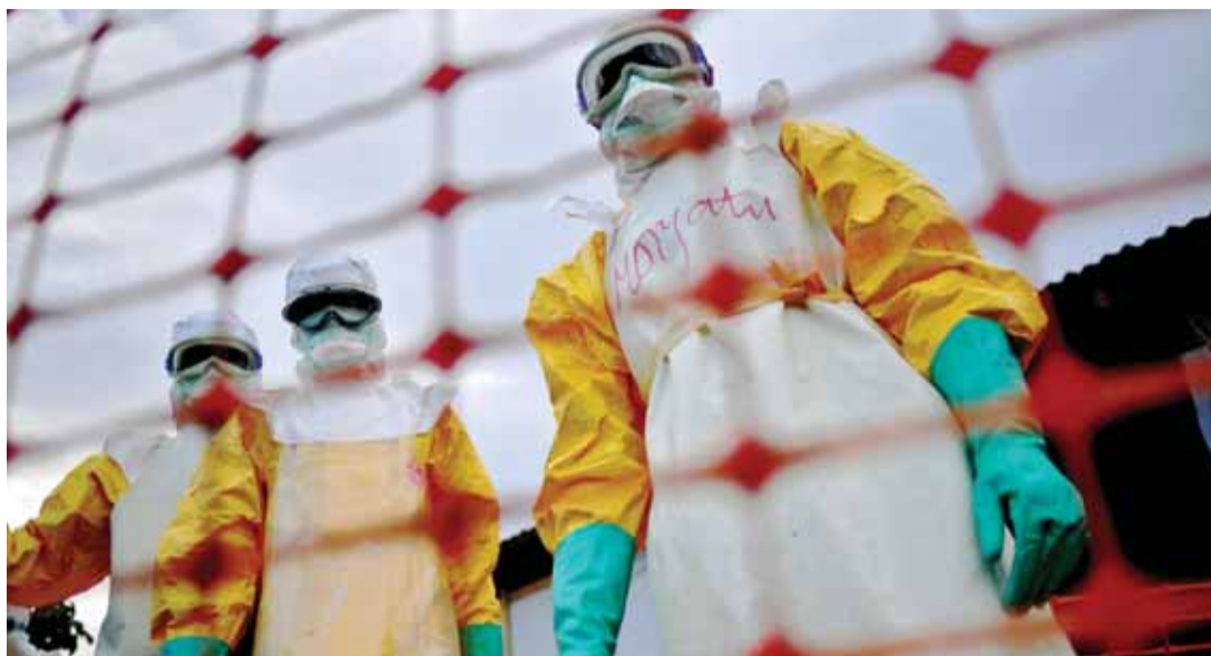
SIERRA LEONE: This file photo shows Medecins Sans Frontieres (MSF) medical staff wearing protective clothing treat the body of an Ebola victim at their facility in Kailahun.

The virus is infectious even after a victim has died, putting at risk people caring for the sick or handling corpses. The disease is best contained by limiting exposure through patient isolation and safe burials.