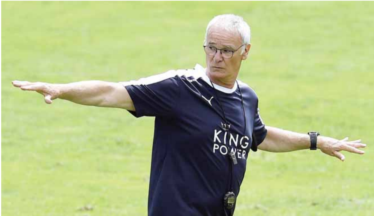
STEGERSBACH: Leicester City's Italian manager Claudio Ranieri gestures during a public training session of Leicester City.

Spain's Rafael Nadal paid tribute in a message in French. "I've heard the news, and I am horrified by what's happened in Nice. Support to the French people, to all the victims and their families" the 14-time major winner tweeted. La Liga giants Real Madrid and Barcelona expressed their sorrow. European champions Real "deeply regret the attack in Nice and want to convey our solidarity with the victims, families and all the French people".