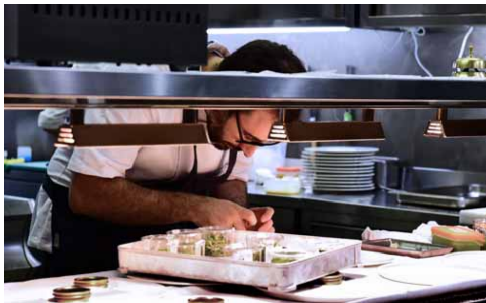
Photo shows a commis chef preparing a dish in the kitchen of the "Osteria Francescana" restaurant in Modena.