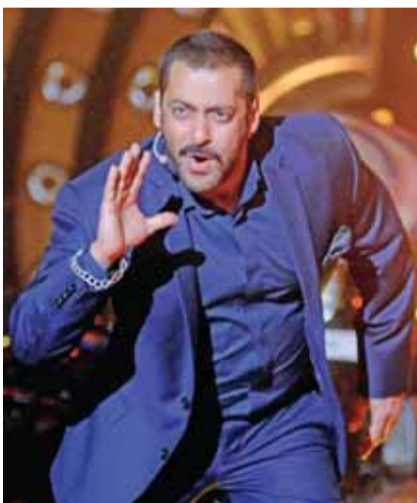
Indian Bollywood actor Salman Khan hosts the reality show 'Bigg Boss Na' in Lonavala.

He's been accused of killing a homeless man, shooting dead an endangered animal and assaulting a former Miss World but it seems nothing can stop the box office appeal of Bollywood bad boy Salman Khan. The Indian superstar's latest blockbuster smashed records this week, just over a fortnight after he sparked fresh controversy by saying his