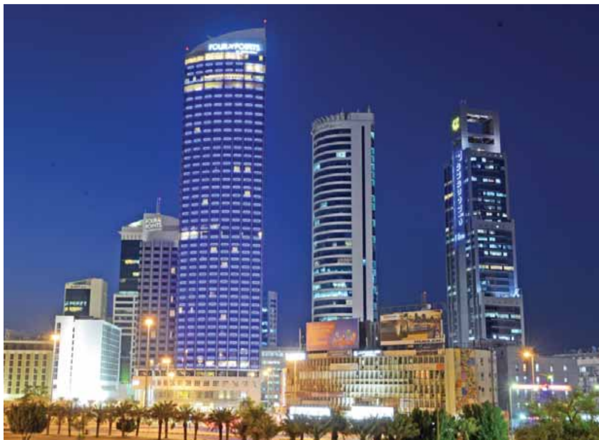
KUWAIT: Photo shows the Alwatiya - a part of Kuwait's traditional neighborhood.