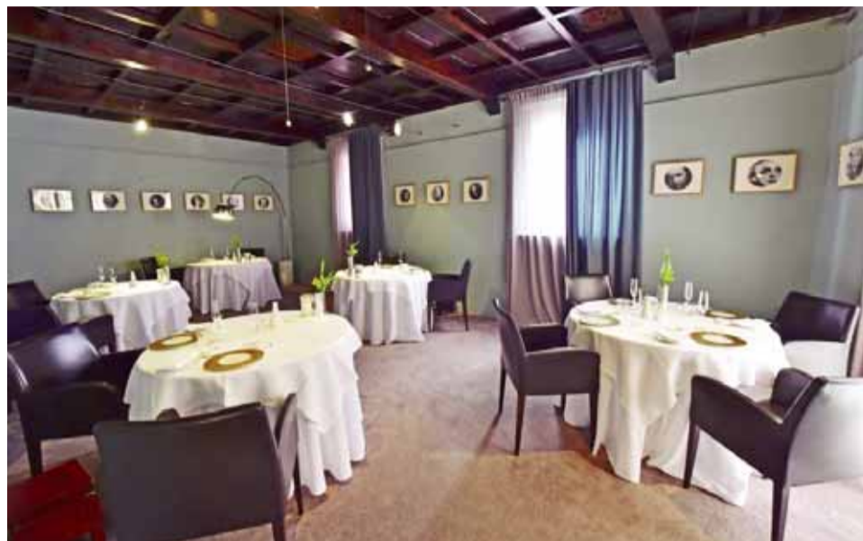
Photo shows tables in the "Osteria Francescana" restaurant in Modena.

H is father wanted him to become a lawyer, and he nearly did. But Massimo Bottura's obsession with cooking instead has paid off: His restaurant, the Osteria Francescana, may have put the noses of conservative Italian chefs out of joint, but it now boasts the title "best in the world". Set in the heart of Modena in north-