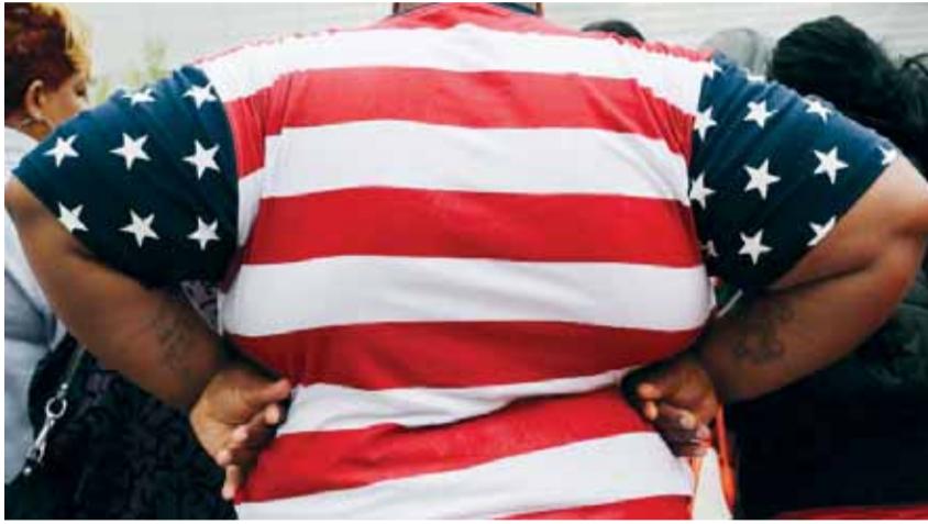
NEW YORK: This file photo shows an overweight man in New York.