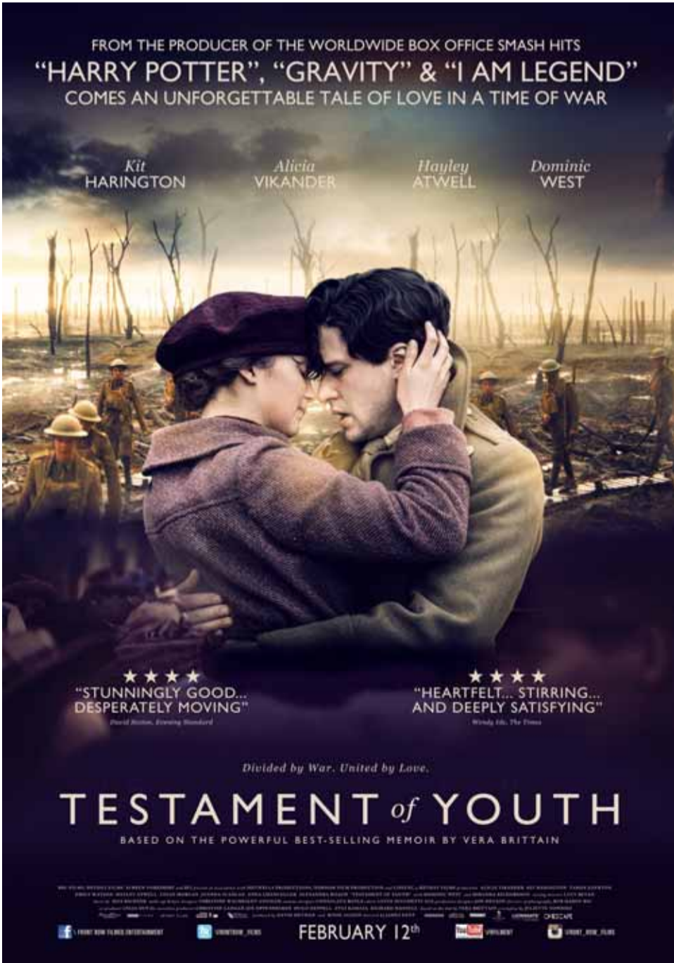
TESTAMENT OF YOUTH ON OSN MOVIES HD FESTIVAL

03:00 Teenage Mutant Ninja Turtles 03:24 Teenage Mutant Ninja Turtles 03:48 Henry Danger 04:12 Nicky, Ricky, Dicky & Dawn 04:36 The Haunted Hathaways 05:00 Max & Shred 05:24 Henry Danger 05:48 Nicky, Ricky, Dicky & Dawn 06:12 SpongeBob SquarePants 06:36 SpongeBob SquarePants 07:00 Teenage Mutant Ninja Turtles 07:24 Teenage Mutant Ninja Turtles 07:48 Winx Club 08:12 Teenage Mutant Ninja Turtles 08:36 Teenage Mutant Ninja Turtles 09:00 Teenage Mutant Ninja Turtles 09:24 Teenage Mutant Ninja Turtles 09:48 Henry Danger 10:12 Nicky, Ricky, Dicky & Dawn 10:36 The Haunted Hathaways 11:00 Winx Club 11:24 SpongeBob SquarePants 11:48 SpongeBob SquarePants 12:12 Teenage Mutant Ninja Turtles 12:36 Teenage Mutant Ninja Turtles 13:00 Harvey Beaks 13:24 The Loud House 13:48 Get Blake 14:12 Rabbids Invasion 14:36 100 Things To Do Before High School 15:00 Game Shakers 15:24 The Loud House 15:48 SpongeBob SquarePants 16:12 Teenage Mutant Ninja Turtles 16:36 Harvey Beaks 17:00 Sanjay And Craig 17:24 Harvey Beaks 17:48 The Loud House 18:12 Henry Danger 18:36 Nicky, Ricky, Dicky & Dawn