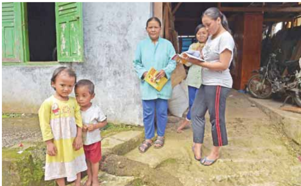
Indonesian villagers with their books to read they received from a "moving library".