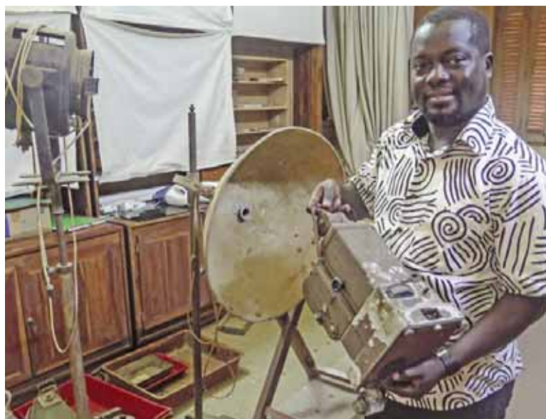
A man holds a large format camera at the photographic studio of the late Benin photographer Cosme Dossa in Porto-Novo.