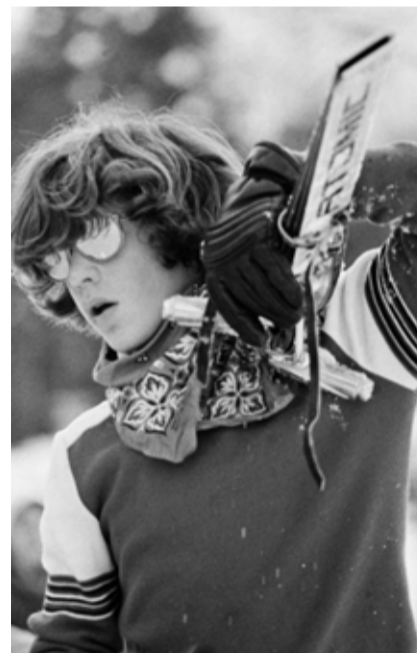
In this February 1975 file photo, John F Kennedy Jr, son of the late US President John F Kennedy, carries his snow skis while visiting a Massachusetts ski resort with the family of his uncle, Sen Edward Kennedy.