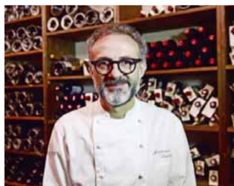
Italian chef Massimo Bottura posing in his restaurant "Osteria Francescana".

H is father wanted him to become a lawyer, and he nearly did. But Massimo Bottura's obsession with cooking instead has paid off: His restaurant, the Osteria Francescana, may have put the noses of conservative Italian chefs out of joint, but it now boasts the title "best in the world". Set in the heart of Modena in north-