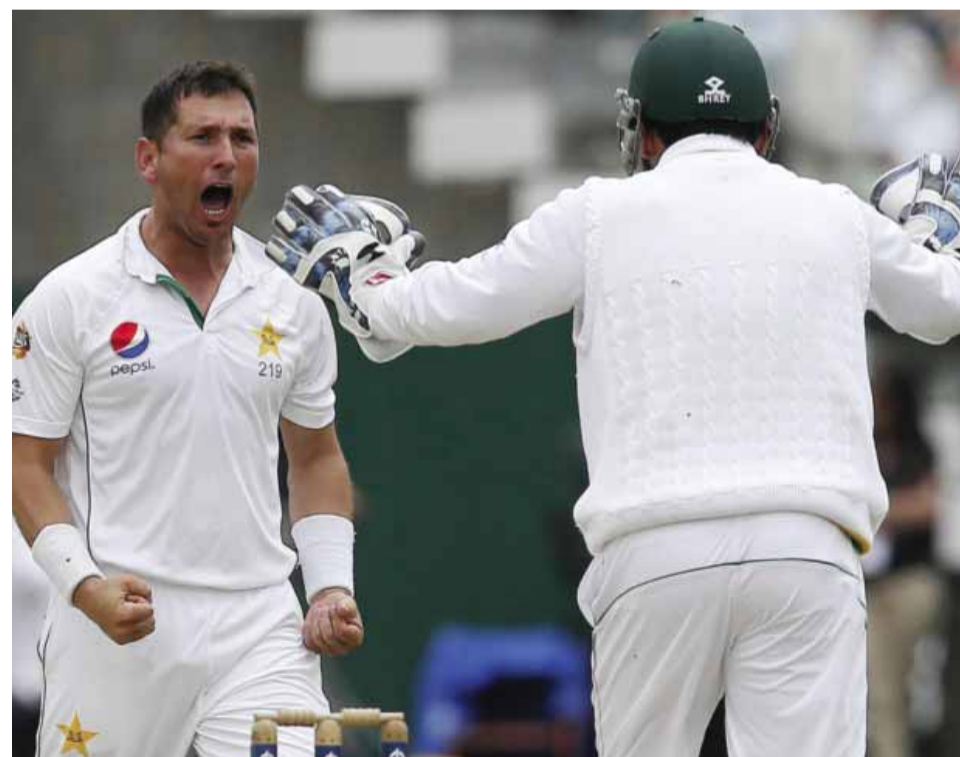
LONDON: Pakistan's Yasir Shah celebrates taking the wicket of England's James Vince for 16 runs on the second day of the first Test cricket match between England and Pakistan at Lord's cricket ground.

282 for six overnight, were bowled out for 339. Misbah only added four to his overnight 110 not out before he was bowled by Stuart Broad after the 42-year-old had become the oldest player in 82 years to make a Test century on Thursday. Amir, booed by a small section of a capacity crowd as he walked out to bat, inside edged his first ball in Test cricket in six years, from Broad, for four. He was last man out for 12, caught in the slip off Broad, who took three for 71.