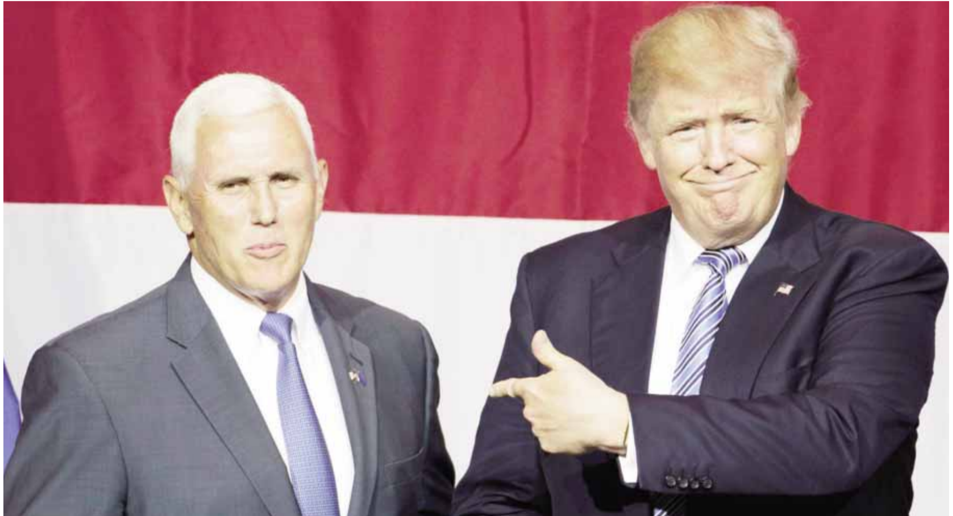
INDIANA: File photo shows US Republican presidential candidate Donald Trump (right) and Indiana Governor Mike Pence taking the stage during a campaign rally at Grant Park Event Center in Westfield, Indiana.