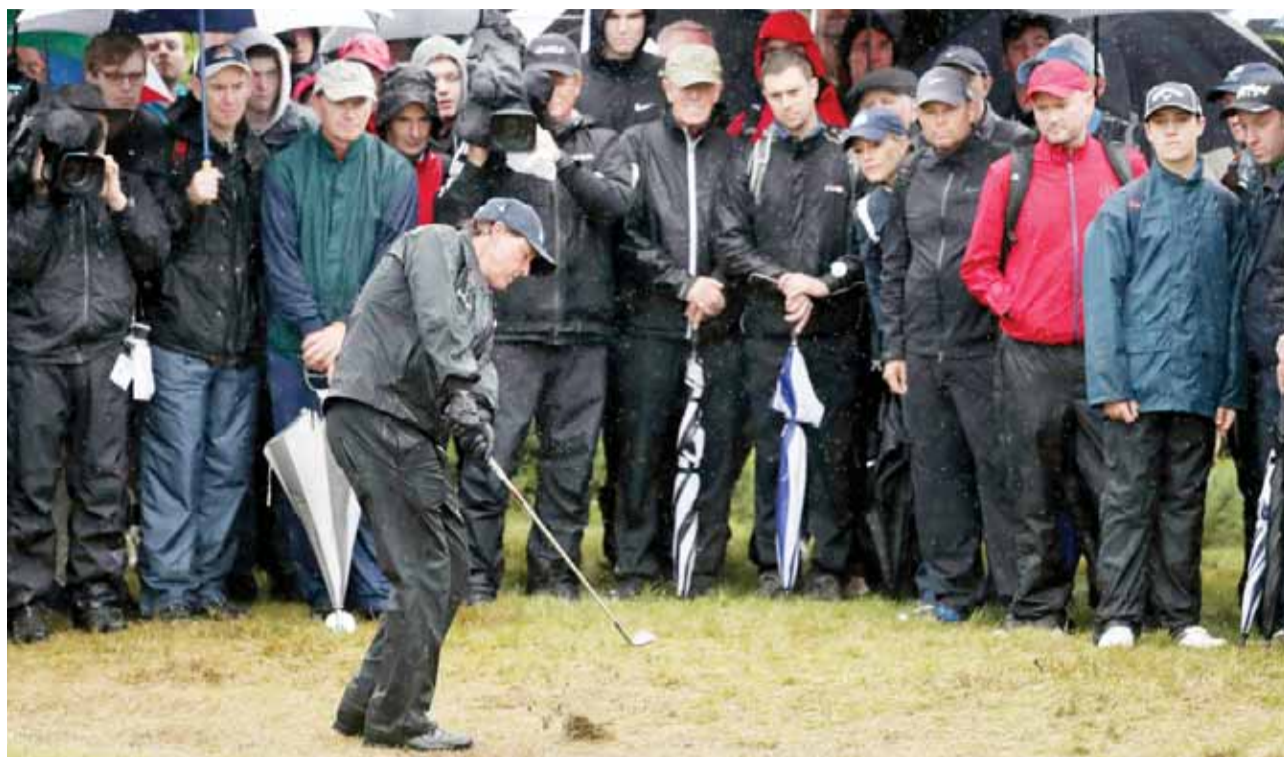
TROON: Phil Mickelson of the United States plays a shot from the light rough on the 12th fairway during the second round of the British Open Golf Championship at the Royal Troon Golf Club.