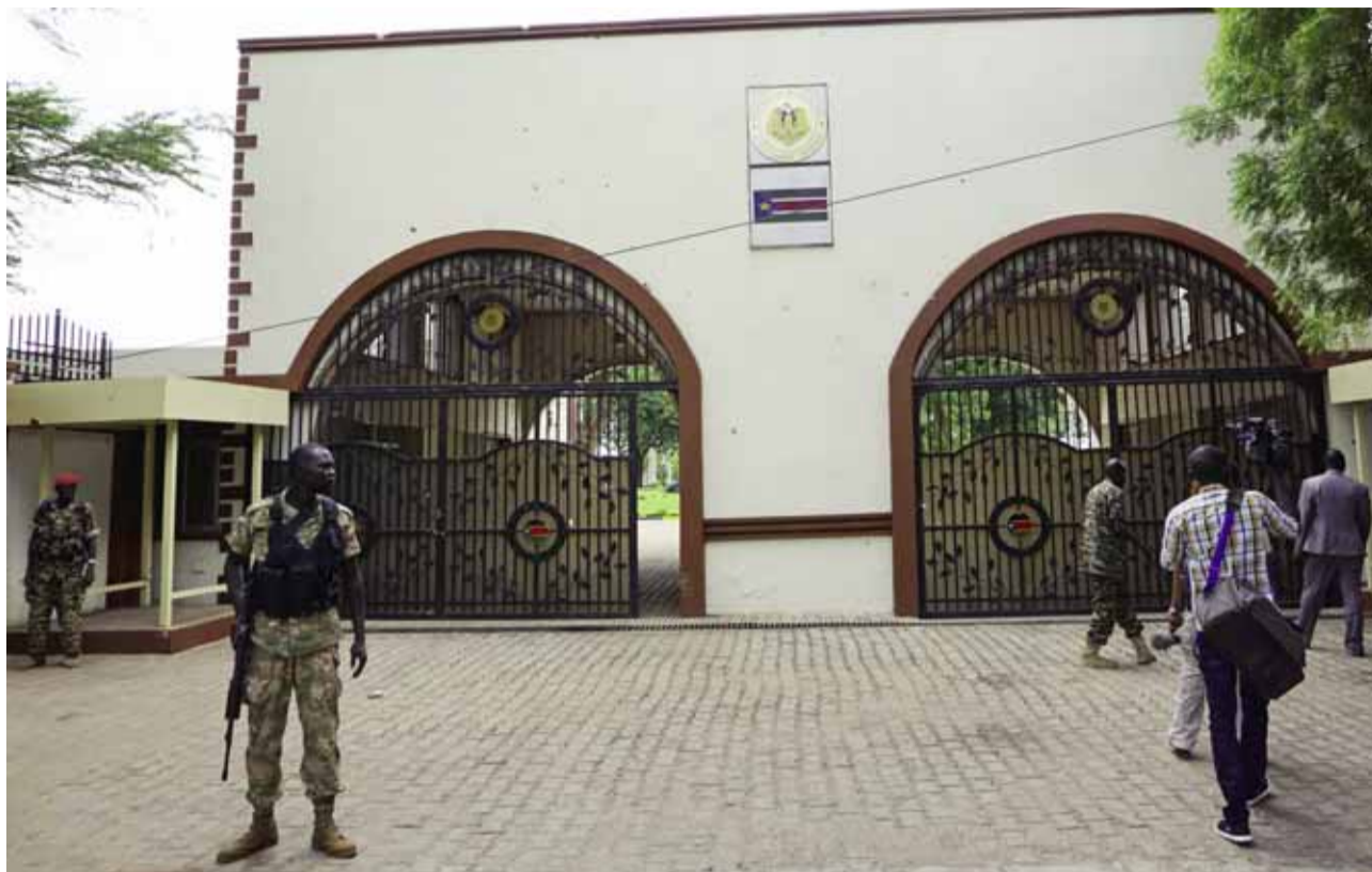
JUBA: Soldiers stand guard outside the bullet-scarred main gate of the presidential palace in Juba, where clashes between rival units this week left scores dead and set off battles elsewhere in the city.