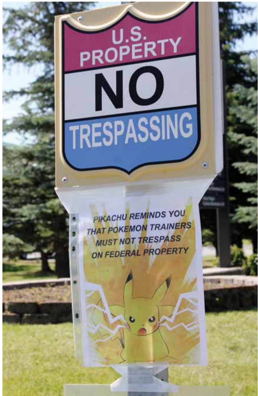
ANCHORAGE, ALASKA: A sign at the National Weather Service informs "Pokemon Go" players that it's illegal to trespass on federal property. — AP

United studied the route and concluded it would lose money. Two months later, United officials were surprised when their proposal for a new hangar for widebody aircraft at Newark was not on the agenda of the Port Authority board. A lobbyist hired by United to work with the Port Authority reported that the Port Authority official was holding up the hangar approval because the airline had not started Newark-Columbia service. — AP