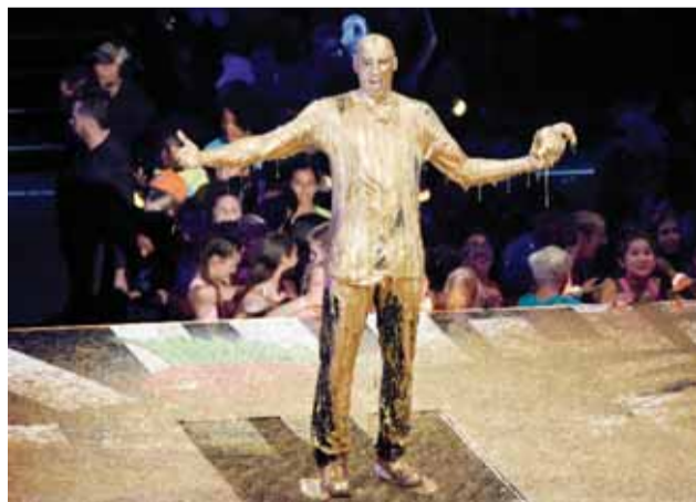
LOS ANGELES: Retired NBA basketball player and Legend Award recipient Kobe Bryant poses after being "slimed" onstage during the 2016 Kids' Choice Sports Awards at Pauley Pavilion.

Bryant brought down the curtain on his standout 20-year career with a 60-point showing in his final game against the Utah Jazz in April. He won five NBA Championships with the Lakers, two NBA Finals MVP awards and two Olympic gold medals for the United States. Former England soccer captain David Beckham and ex New York Yankee shortstop Derek Jeter are previous winners of the Kids Choice 'Legend' prize that comes with a gold sliming. — Reuters