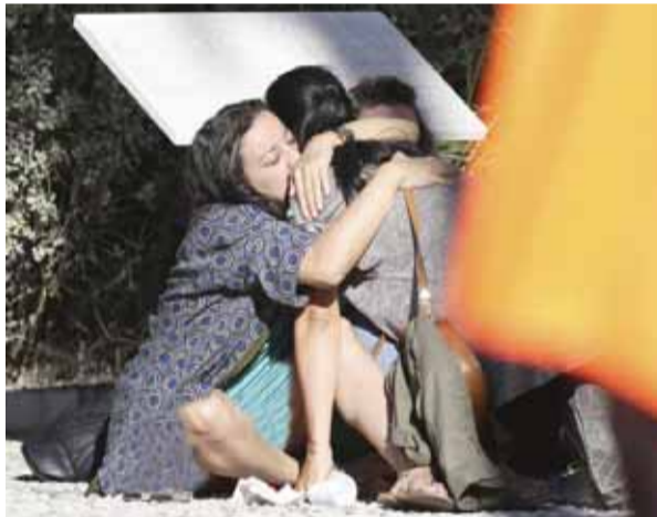
NICE: Parents of victims embrace each other near the scene of a truck attack in Nice, southern France yesterday.

Though ramming attacks by vehicles have become more common in various parts of the world, many have been associated with attempts to blow them up—a common tactic in Iraq but also used in a makeshift, abortive way at Glasgow Airport in 2007. Israel has seen a number in recent years, mainly where lone Arabs have driven into pedestrians or bus stops. — Reuters