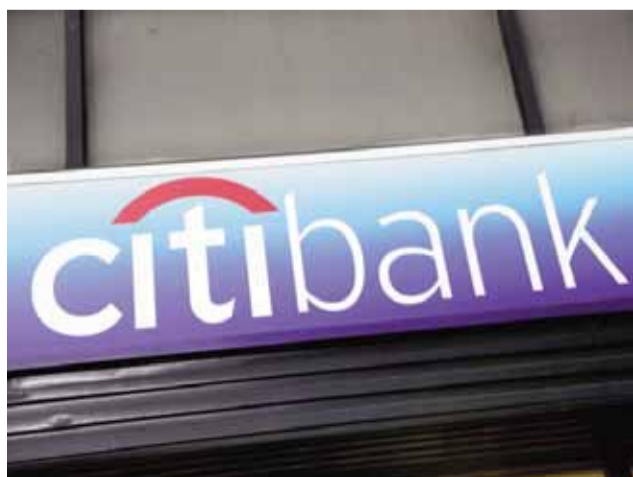
NEW YORK: A Citibank sign hangs above a branch office.—AP

Revenue fell 10 percent to $17.54 billion, beating the $17.52 billion analysts expected. Citigroup's shares rose 1 percent in premarket trading yesterday.—AP