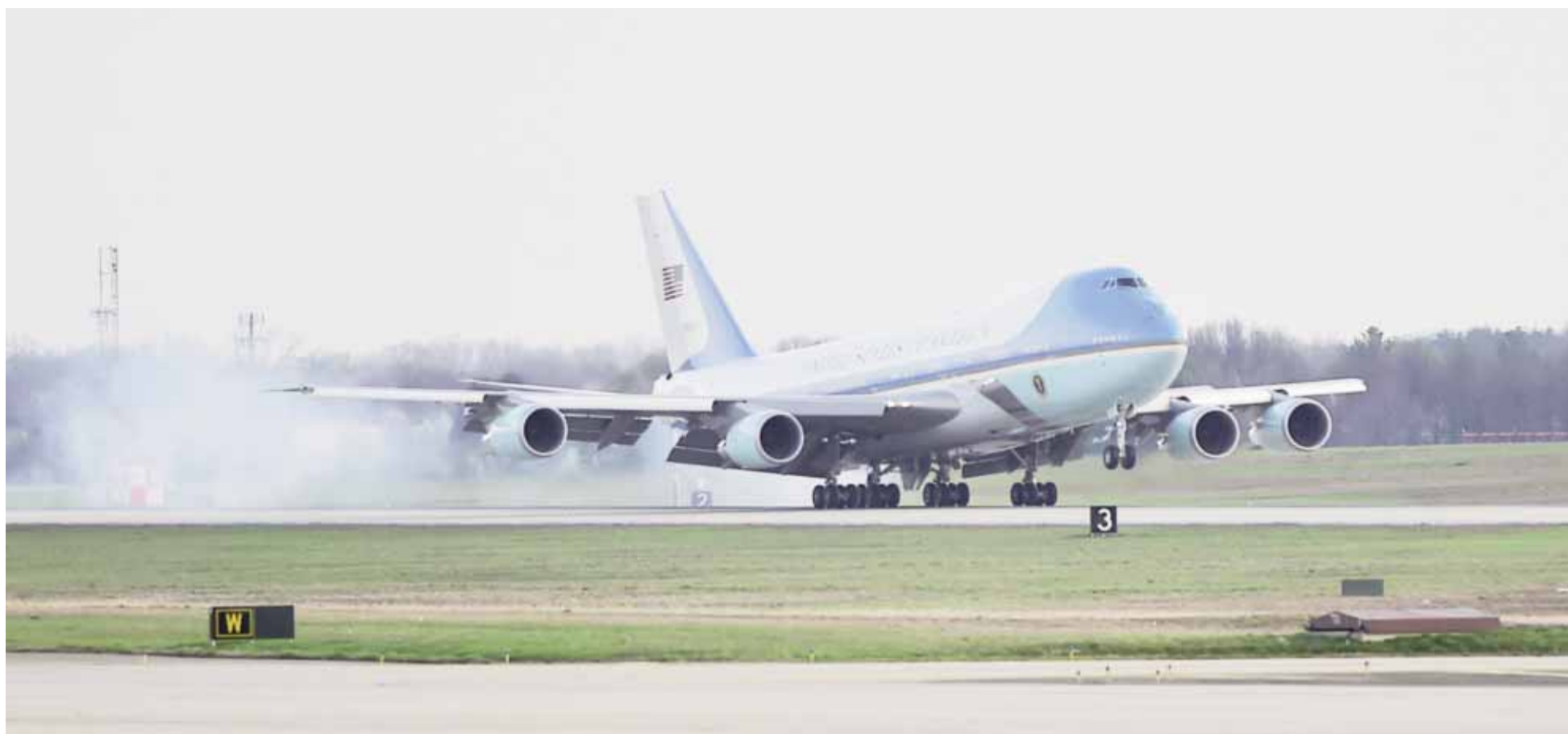
ANDREWS AIR FORCE BASE, MARYLAND: This file photo taken on March 25, 2016 shows Air Force One, a Boeing 747, landing at Andrews Air Force Base.