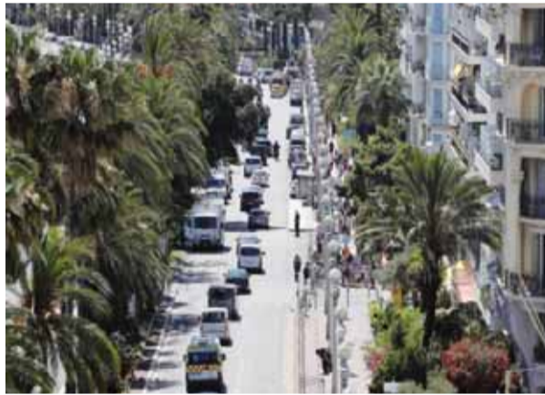
NICE: People stand behind a police barricade (right) set up at the site in Nice where a gunman smashed a truck into a crowd of revelers celebrating Bastille Day, killing at least 84 people.