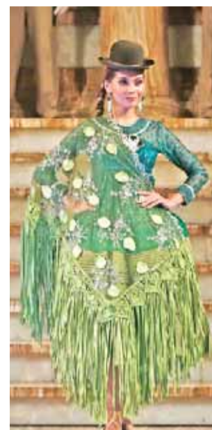
Women model creations by a local designer Eliana Paco, at the government palace in La Paz, Bolivia, Thursday. The fashion show is designed to promote the Andean style and beauty of Aymara women, who are commonly called Cholitas in Bolivian slang. —AP photos