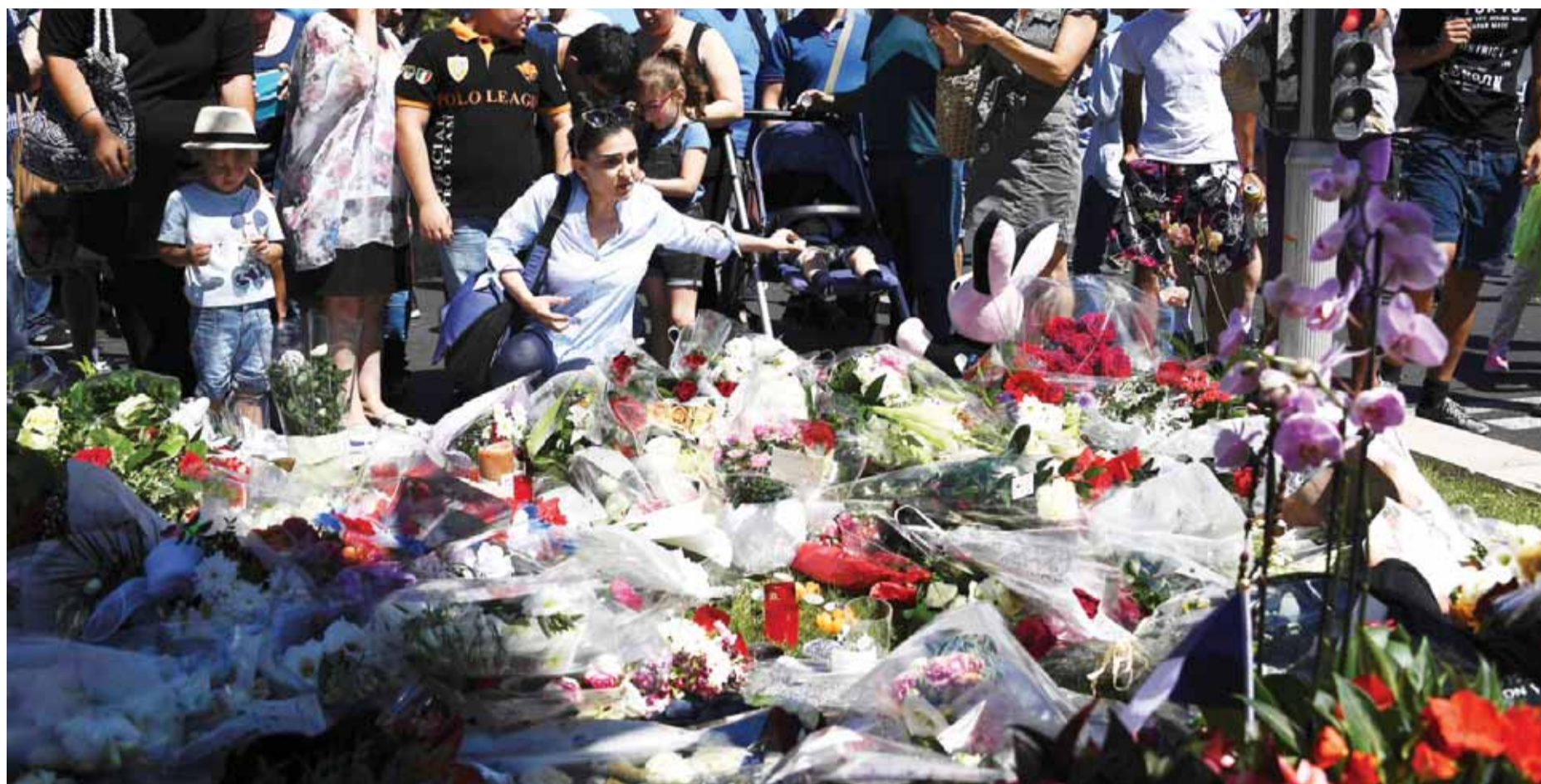
NICE: People lay flowers in the street of Nice to pay tribute to the victims the day after a gunman smashed a truck into a crowd of revelers celebrating Bastille Day, killing at least 84 people.