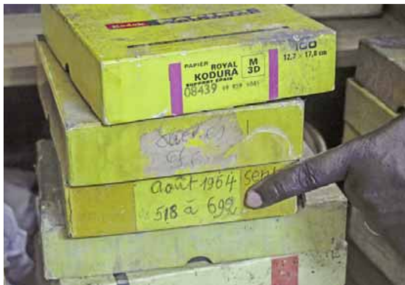
Photo shows boxes of negatives for large format camera at the photographic studio.

All five of Libya's World Heritage sites were named on Thursday by the agency as at risk of damage from the civil war that continues to rage in the country. Meanwhile, the complex of churches and holy sites in the Georgian town of Mtskheta was removed from the in-danger list, where it had been listed since 2009. The meeting will end on July 20. — AFP