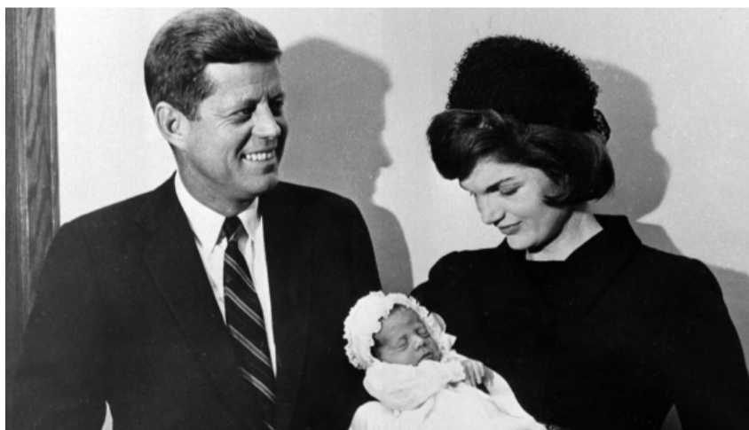
In this Dec 8, 1960 file photo, President John F Kennedy and first lady Jacqueline Kennedy pose at Georgetown University Hospital in Washington with their son, John F Kennedy Jr, following a baptism for the infant.