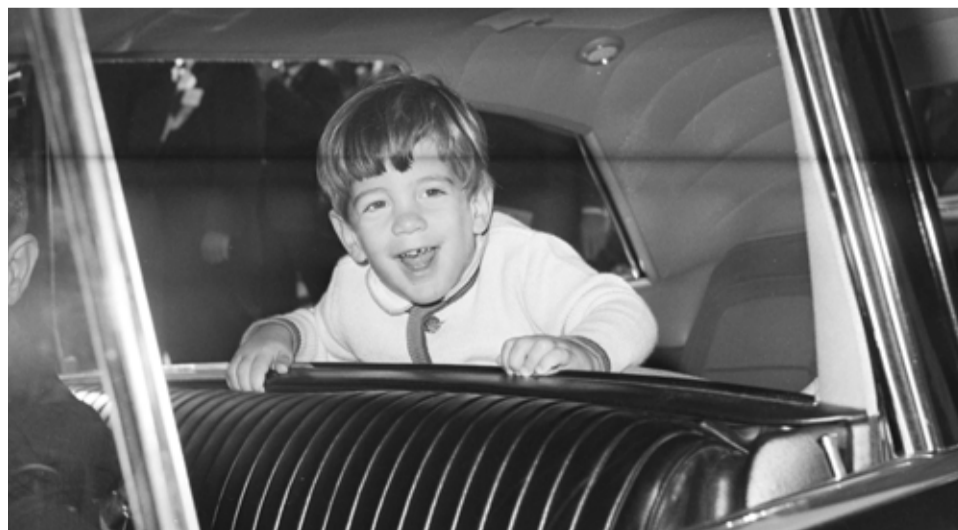
In this Nov 11, 1963 file photo, John Kennedy Jr, jumps in the back seat of the presidential limousine while waiting for his father to take part in Veterans Day ceremonies at Arlington National Cemetery, Va.