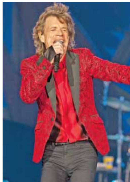
In this file photo, Mick Jagger of the Rolling Stones performs at the Indianapolis Motor Speedway in Indianapolis.

Khan has starred in more than 100 films and television shows since his first hit "Maine Pyar Kiya" (I Fell in Love) in the 1980s. But his personal life has long been dogged by controversy. Although he was cleared last year of killing a homeless man in a late-night hit-and-run crash in 2002, that decision is now being challenged in the Supreme Court. Khan is also battling allegations he used unlicensed arms to shoot an endangered Indian antelope for which he spent a week behind bars in 1998. — AFP