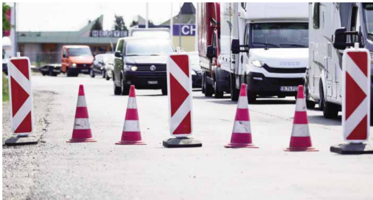
NICKELSDORF, AUSTRIA : Vans and cars wait in line to be controlled at the Austrian-Hungarian border of Nickelsdorf on July 12, 2016.

The closures are meant to kick into force once the number of migrants coming into Austria this year hits 37,500. At that point—so far, 22,135 have entered—Vienna has said it will turn people away. To allow this to happen, Austria's abrasive new Interior Minister Wolfgang Sobotka is pressing for parliament to approve the necessary "emergency decree". Sobotka insists Austria has no other choice while "so many other European Union members fail to do their part" to stop the influx. "We cannot shoulder the whole world's burden," he said earlier this year. Neighboring Hungary may yet save him the bother, however. Since July 5 Hungary's police and army have been forcibly returning to Serbia any migrants found within eight kilometres (five miles) of the border—prompting outrage from rights groups.