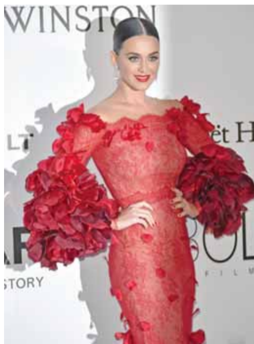
File photo shows US singer Katy Perry posing as she arrives for the amfAR's 23rd Cinema Against AIDS Gala at the Hotel du Cap-Eden-Roc in Cap d'Antibes, France.

Pop superstar Katy Perry re-emerged yesterday after a quiet spell with a song of unity as part of the television coverage of the 2016 Rio Olympics. The singer-one of the most successful artists of her generation-offered her first new music since her blockbuster 2013 album "Prism" with the song "Rise." A midtempo electronic track, "Rise" takes on a triumphant tone befitting sports competitions, a change from the giddier pop feel of Perry's biggest hits.