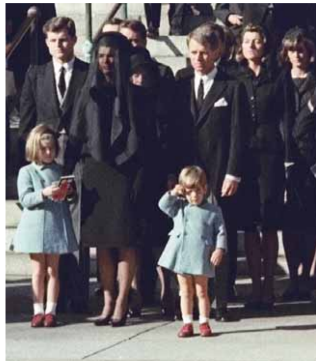
In this Nov 25, 1963 file photo, three-year-old John F Kennedy Jr, salutes his father's casket in Washington, three days after the president was assassinated in Dallas.