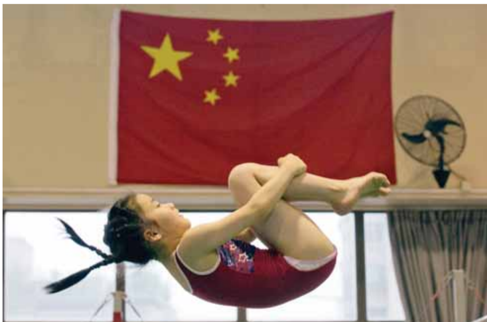
SHANGHAI: In this photo taken Thursday, June 16, 2016, a young gymnast trains near the Chinese national flag at the Xuhui Sports School.