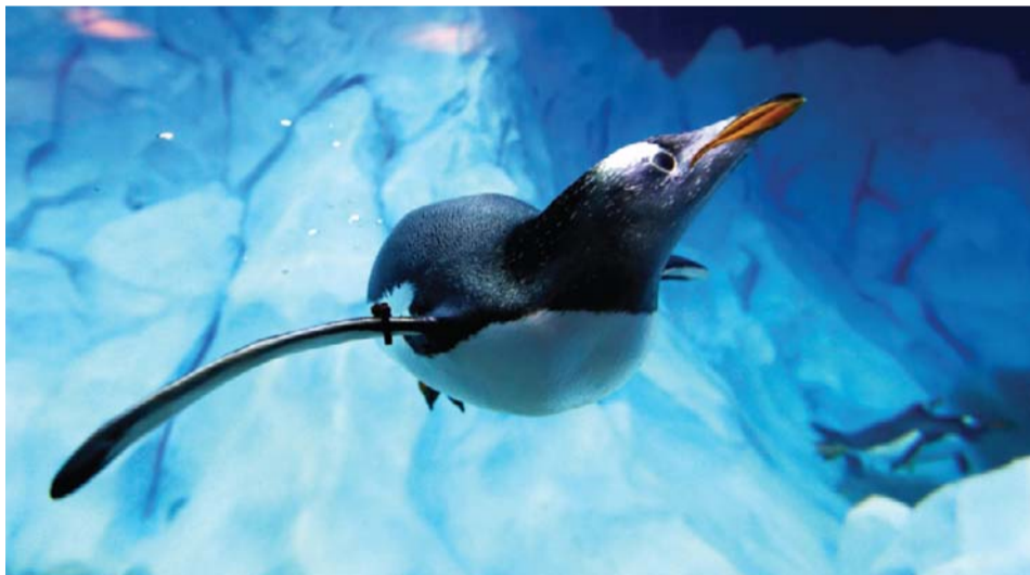
A penguin swims in the Detroit Zoo's new Polk Penguin Conservation Center.

It's "the biggest project that the Detroit Zoo has ever undertaken" Kagan said. A $10 million donation from the Polk Family Fund is the largest gift in the zoo's 88-year history. The center is free with Detroit Zoo admission, but requires timed-entry passes that are available on a first-come, first-served basis. — AP