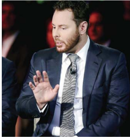
NEW YORK: Parker Foundation Chairman Sean Parker speaks during the Clinton Global Initiative annual meeting in New York.

"The common understanding is that all these people have always worked together and anybody who works on cancer is happy to share all their research and help each other out," said Hanks, 59, whose wife, the actress and singer Rita Wilson, underwent a double mastectomy