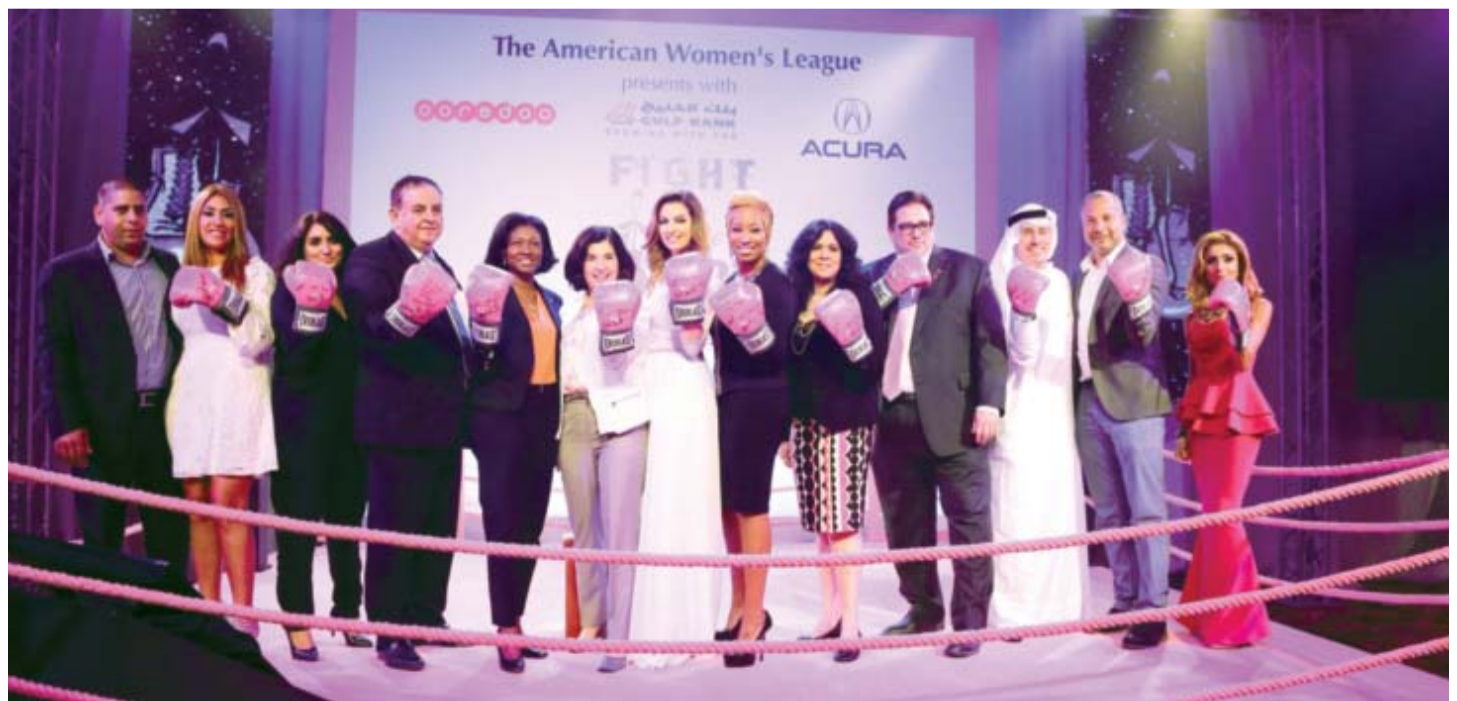
AWL Breast Cancer Awareness campaign.