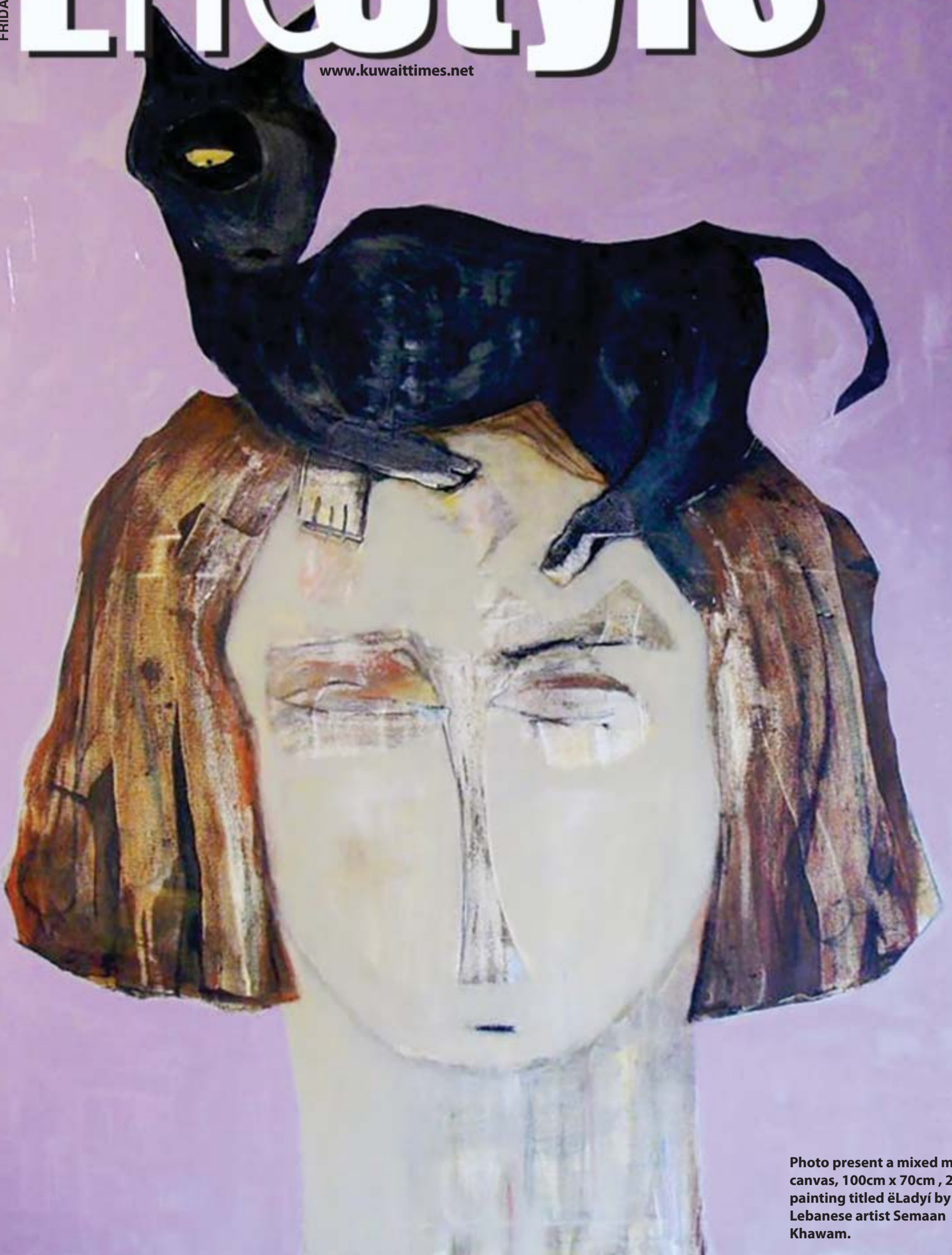
Photo present a mixed media on canvas, 100cm x 70cm , 2015 painting titled eLadyi by Lebanese artist Semaan Khawam.