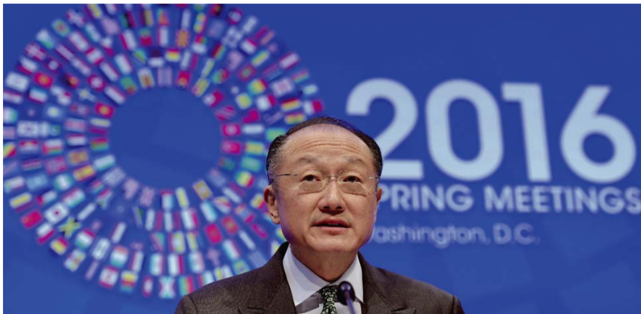
WASHINGTON: World Bank President Jim Yong Kim speaks at a press conference during the 2016 International Monetary Fund, World Bank Spring Meetings at IMF headquarters yesterday.

Those who urged the appeals court Wednesday to leave court orders protecting them in place included investors who paid full price for their bonds in the 1990s and who were hoping to do better than the 70 percent payout offered to those who did not get a chance to negotiate directly with Argentina through a court-appointed mediator. — AP