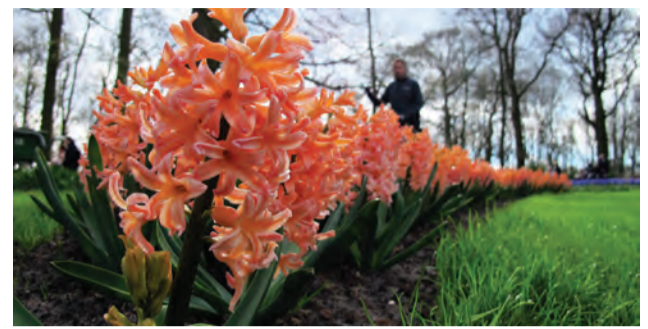
Photo shows hyacinths at the world's largest bulb garden of Keukenhof in Lisse.