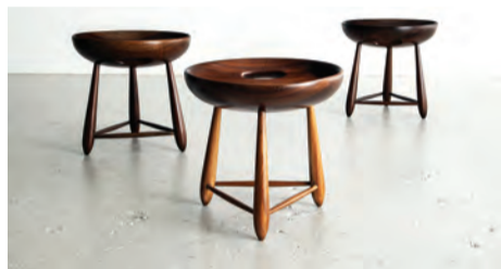
Set of three-legged milking stools in Brazilian hardwood, 1954, designed by Sergio Rodrigues for Oca.