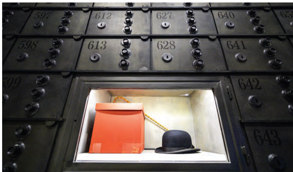
Charlie Chaplin's hat and stick displayed in a showcase at the Chaplin's World museum in Corsier-sur-Vevey, western Switzerland.