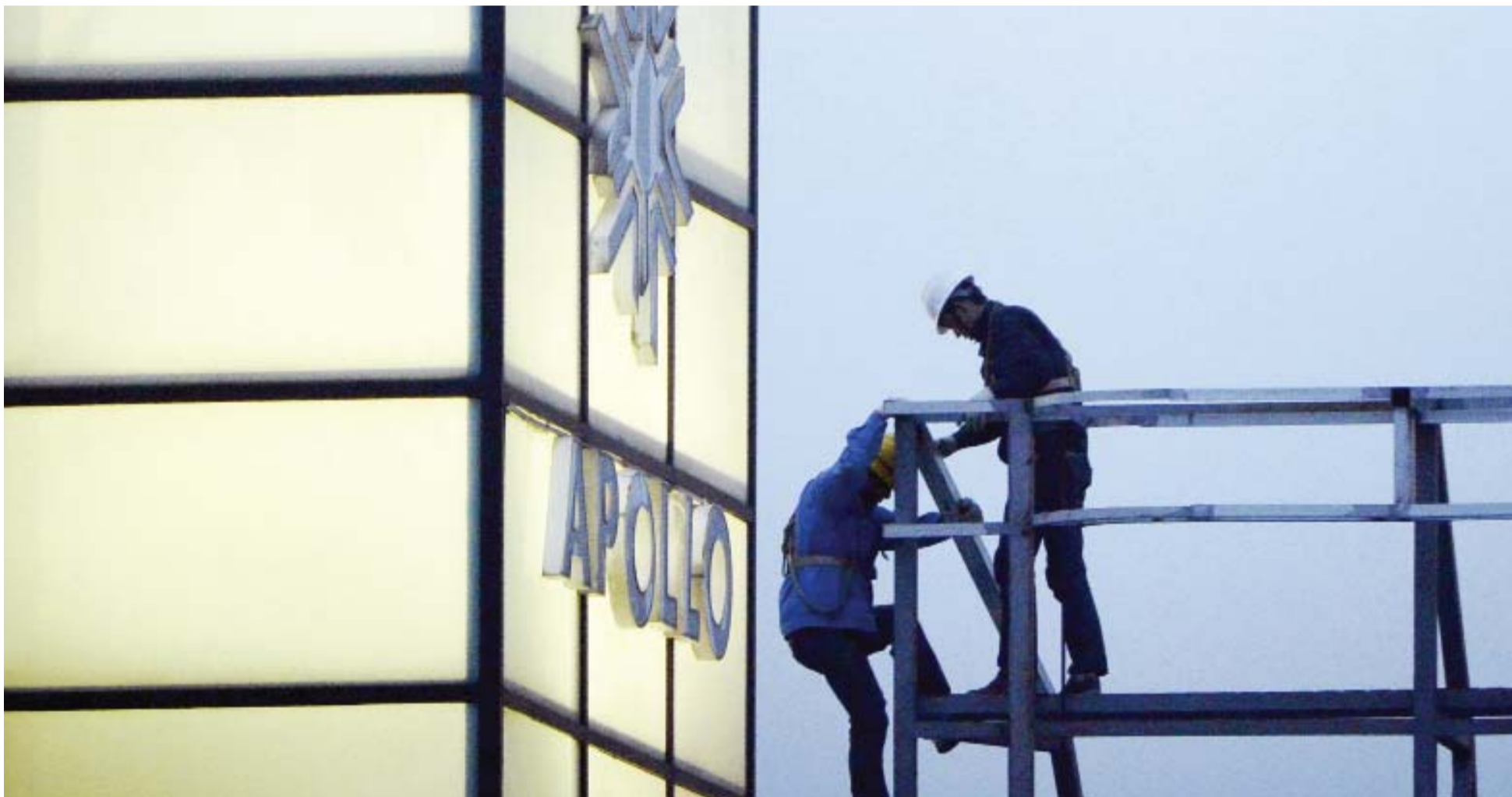
SHANGHAI: Two workers prepare to leave after working on the roof of a building in Shanghai yesterday. China's growth slowed further in the first three months of this year, economists polled by AFP forecast, even as authorities step up policy support for the world's second-largest economy.