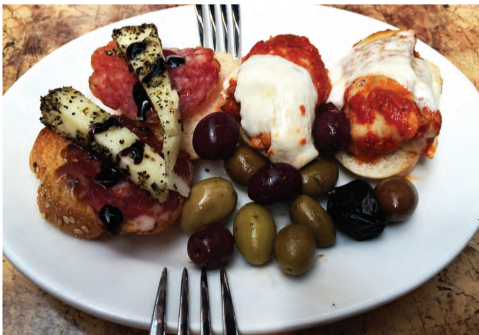
A sample of food from Mike's Deli in the Arthur Avenue Retail Market in the Bronx borough of New York.