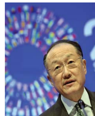
Dark economic cloud over IMF-World Bank meeting