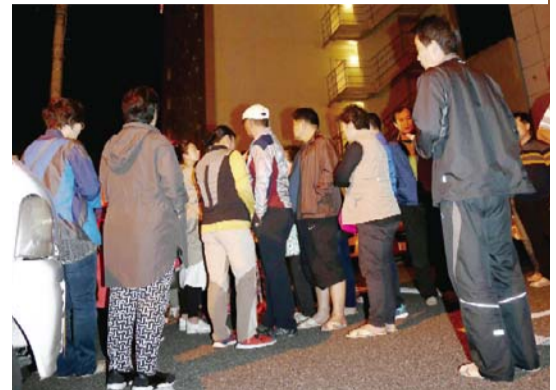
KUMAMOTO: People gather outside a hotel after an earthquake in Kumamoto, southern Japan yesterday. A powerful earthquake with a preliminary magnitude of 6.4 has struck southern Japan. — AP

Footage on NHK showed a signboard hanging from the ceiling at its local bureau violently shaking. File cabinets rattled, books, files and papers rained down to the floor, and one employee appeared to have fallen off a chair, while others slid underneath their desks to protect their heads. — AP