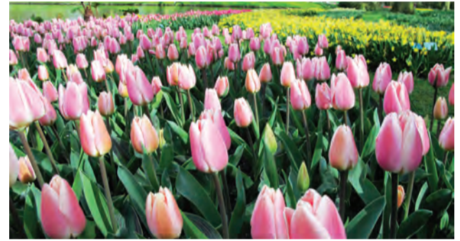
Photo shows tulips at the world's largest bulb garden.