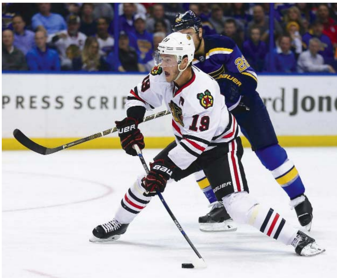
ST LOUIS: Jonathan Toews #19 of the Chicago Blackhawks controls the puck against Kevin Shattenkirk #22 of the St Louis Blues in Game One of the Western Conference Quarterfinals during the 2016 NHL Stanley Cup Playoffs at the Scottrade Center on April 13, 2016.