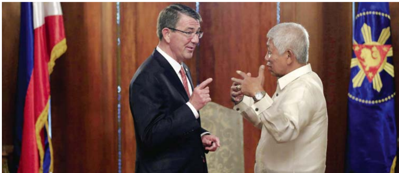
MANILA: US Defense Secretary Ash Carter (left) gestures as he talks with his Philippine counterpart Voltaire Gazmin during their joint press conference at the Malacanang presidential palace in Manila yesterday.