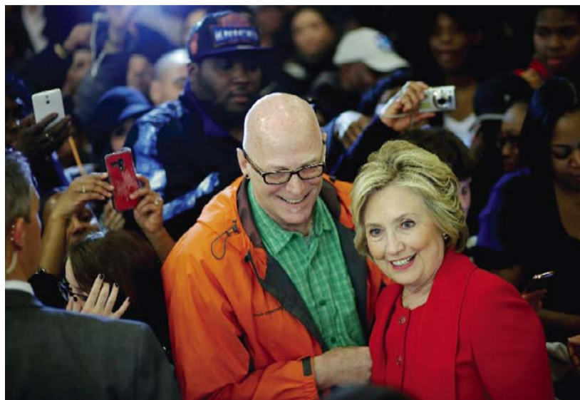
NEW YORK: Democratic presidential candidate former Secretary of State Hillary Clinton greets supporters during a Bronx Organizing Event in the Bronx borough of New York City.

"This is going to be tough primary for us but when I look at the thousands of