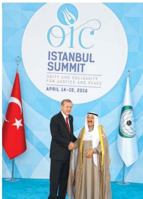
ISTANBUL: His Highness the Amir meets Turkish President Recep Tayyip Erdogan during the 13th Organization of Islamic Cooperation (OIC) Summit at Istanbul Congress Center (ICC) yesterday.