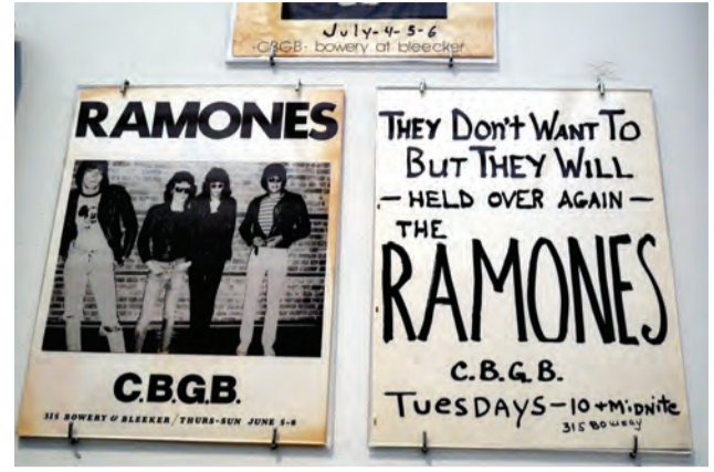
The Ramones items are on display during a press preview at the Queens Museum.