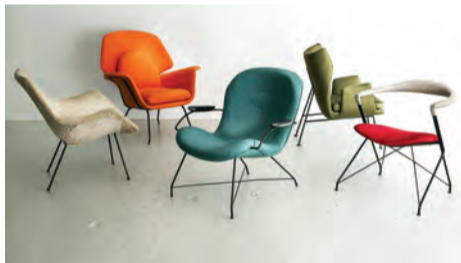
Various lounge chairs produced by the Brazilian furniture company Forma in the 1950s and '60s.