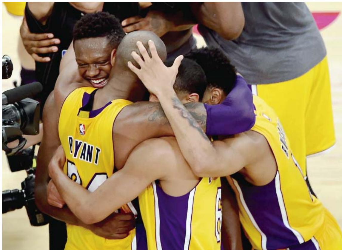
LOS ANGELES: Kobe Bryant of the Los Angeles Lakers celebrates with teammates following his final game as a Laker in their season-ending NBA western division matchup against the Utah Jazz in Los Angeles, where the Lakers defeated the Jazz 101-96.

James Harden scored 38 points as the Houston Rockets took the final Western Conference playoff spot with an easy victory over the Sacramento Kings. The Rockets never trailed and had a 64-44 lead at halftime behind 16 points from Harden and 10 each from Dwight Howard and Michael Beasley. They won their last three games to sneak into the playoffs after losing three of the previous four to fall behind Utah and into ninth place in the West.