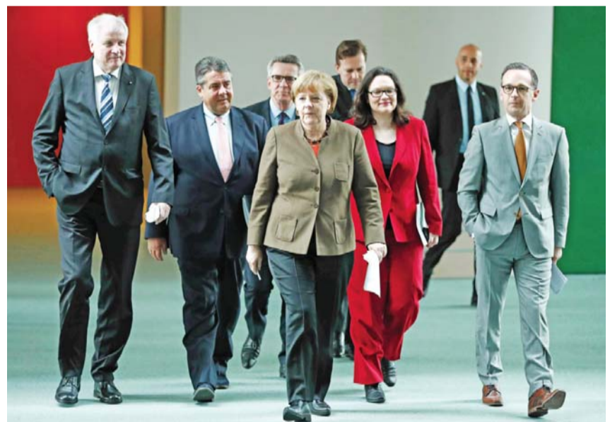
BERLIN: (L-R) Bavarian state premier and leader of the conservative Christian Social Union (CSU) Horst Seehofer, German Vice Chancellor, Economy and Energy Minister Sigmar Gabriel, German Interior Minister Thomas de Maiziere, German Chancellor Angela Merkel, German Labor and Social Minister Andrea Nahles, German Justice Minister Heiko Maas arrive for a press conference yesterday at the Chancellery in Berlin.

"The integration of people from very different cultures does not happen on