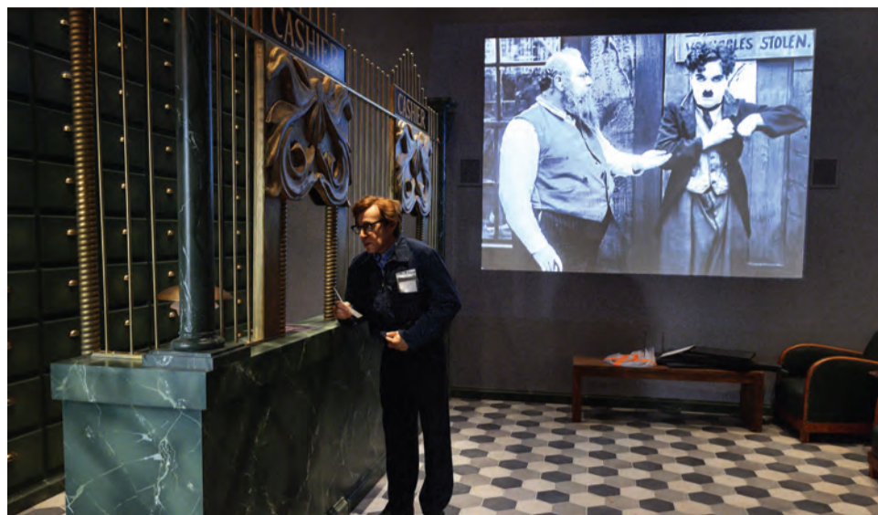
A picture shows a room of the Chaplin's World museum in Corsier-sur-Vevey, western Switzerland.