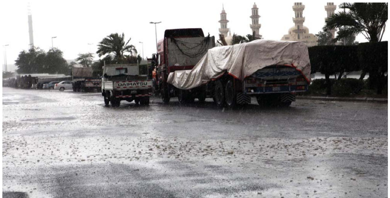
KUWAIT: Heavy rains and hailstones lashed Kuwait yesterday. Emergency teams were deployed in Kuwait's governorates to deal with any accident resulting from the stormy weather. Photos show people struggling to make their way on foot as the rain inundated Kuwait. — Photos by Joseph Shagra

Most of the operations involved chips valued at 37.5 fils or 50 fils. In the last session, activity was marked with profit bagging, while most of the transactions targeted shares of Baitak, the National Bank of Kuwait, National Investments and Agility. The KSE ended trading on mixed boards Thursday. The price index was down 5.68 points to 5,300.51 points, while the weighted index rose by 0.62 points to stand at 365.07 points, as well as the KSX 15 index up by 1.26 points, to read 836.14 points. Value of trade was KD 18.3 million while the volume was KD 233 million done through 4,852 deals. — Agencies