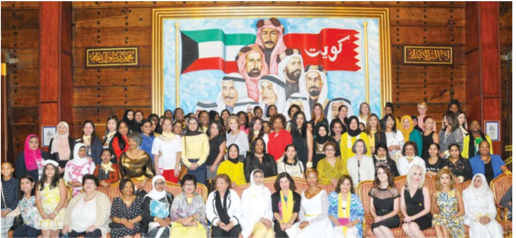
Picture of AWL Endometriosis Awareness event held in March.