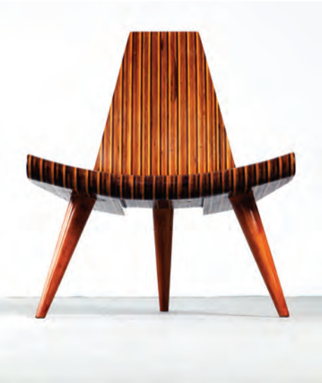
Three-legged chair in five types of hardwood, 1947, Joaquim Tenreiro.