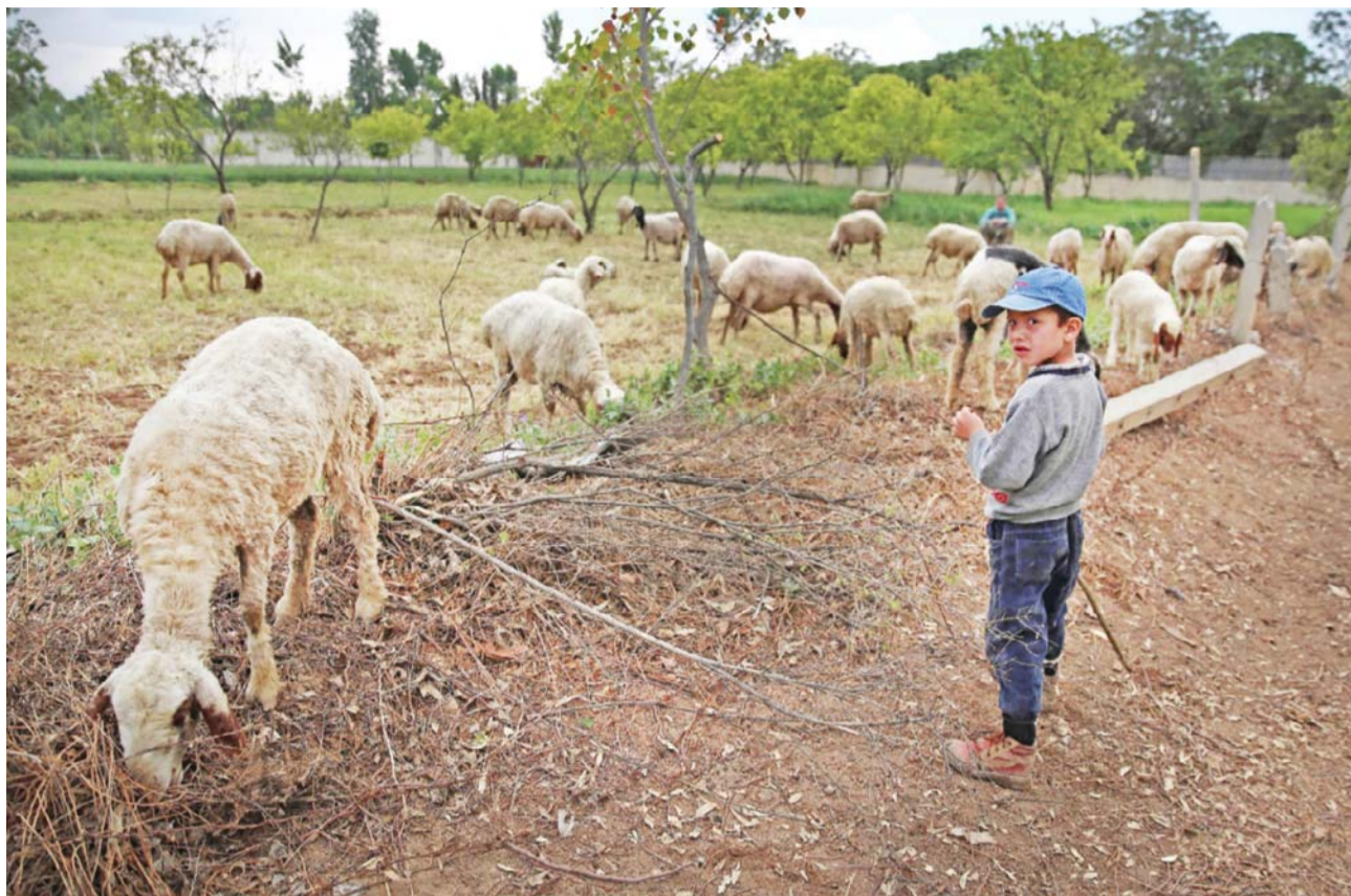
DAMASCUS: A Syrian boy watches over his family's sheep near the frontline of fighting between rebel fighters and Syrian regime forces in Jisreen, in the rebel-held region of Eastern Ghouta, on the outskirts of the capital Damascus yesterday.