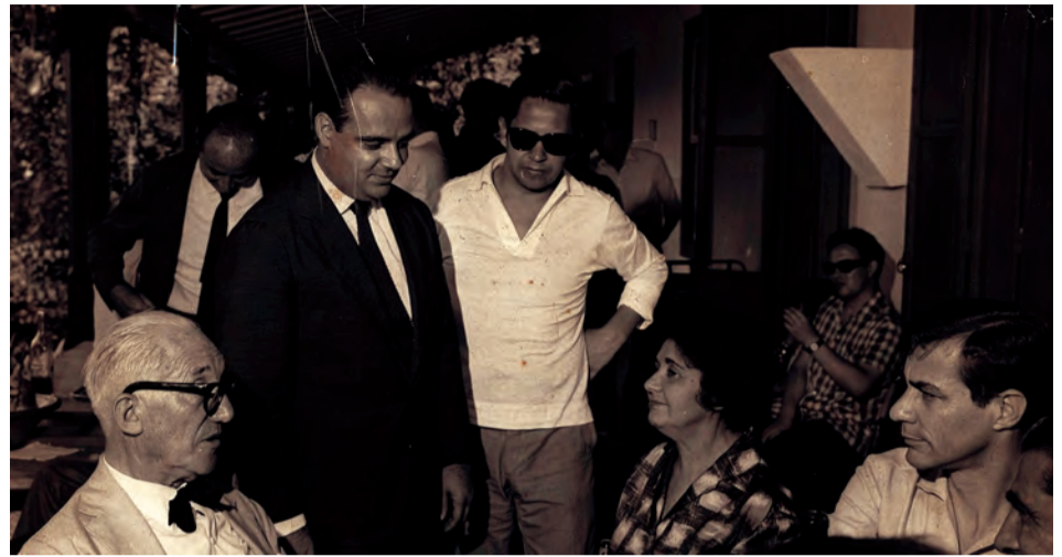
This undated photo provided by The Monacelli Press shows Sergio Rodrigues, standing left in black suit, with Le Corbusier, sitting left, and others.