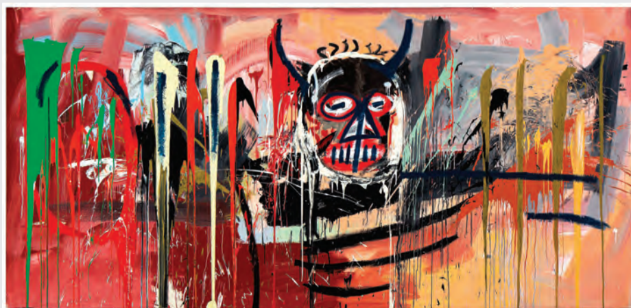
This undated photo provided by Christie's shows Jean-Michel Basquiat's self-portrait "Untitled, 1982" that has appeared in every major Basquiat retrospective.