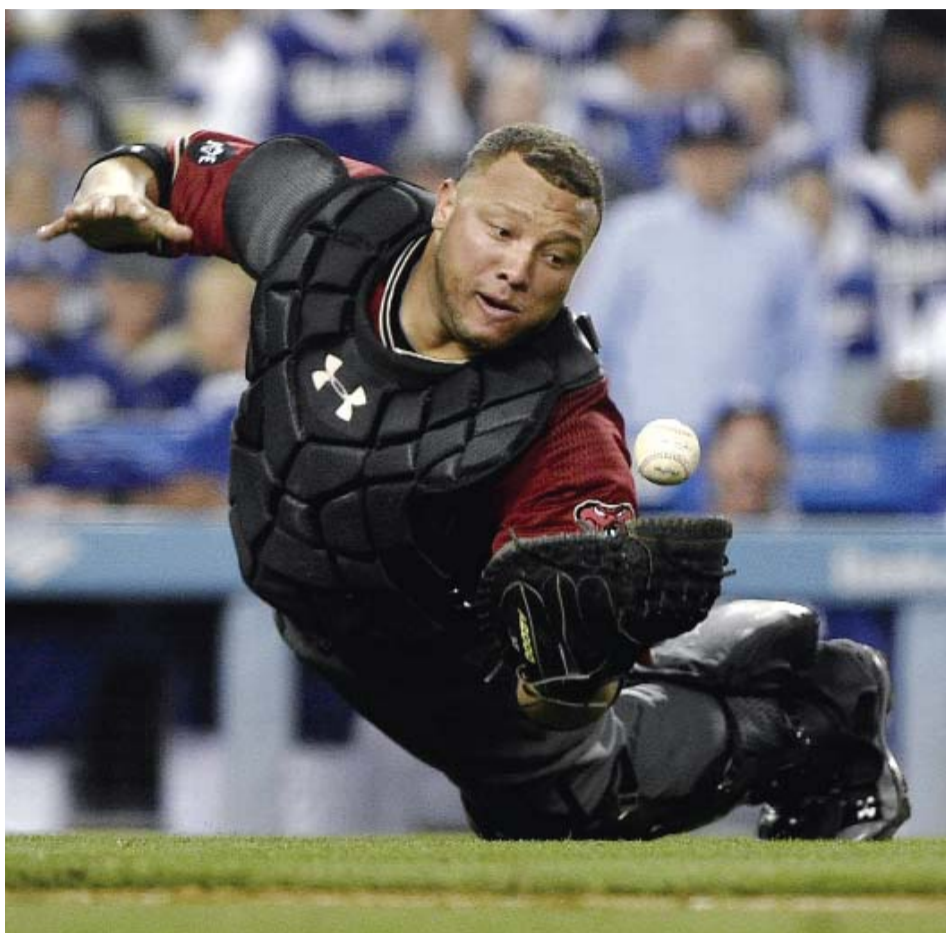
LOS ANGELES: Arizona Diamondbacks catcher Wellington Castillo is unable to make a catch on an infield fly hit by Los Angeles Dodgers' Yasmani Grandal during the eighth inning of a baseball game in Los Angeles on Wednesday, April 13, 2016. Grandal reached on the error.

Adrian Gonzalez hit his first home run of the season and Alex Wood pitched into the eighth inning, leading Los Angeles to a victory over Arizona. Wood (1-1) allowed a run and five hits in seven-plus, struck out three and walked three in his 100th major league appearance and 69th start. The left-hander gave up only one hit after