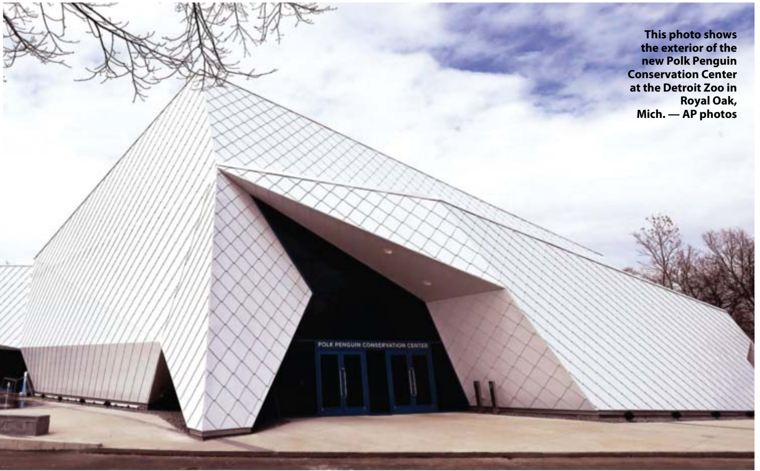
This photo shows the exterior of the new Polk Penguin Conservation Center at the Detroit Zoo in Royal Oak, Mich.