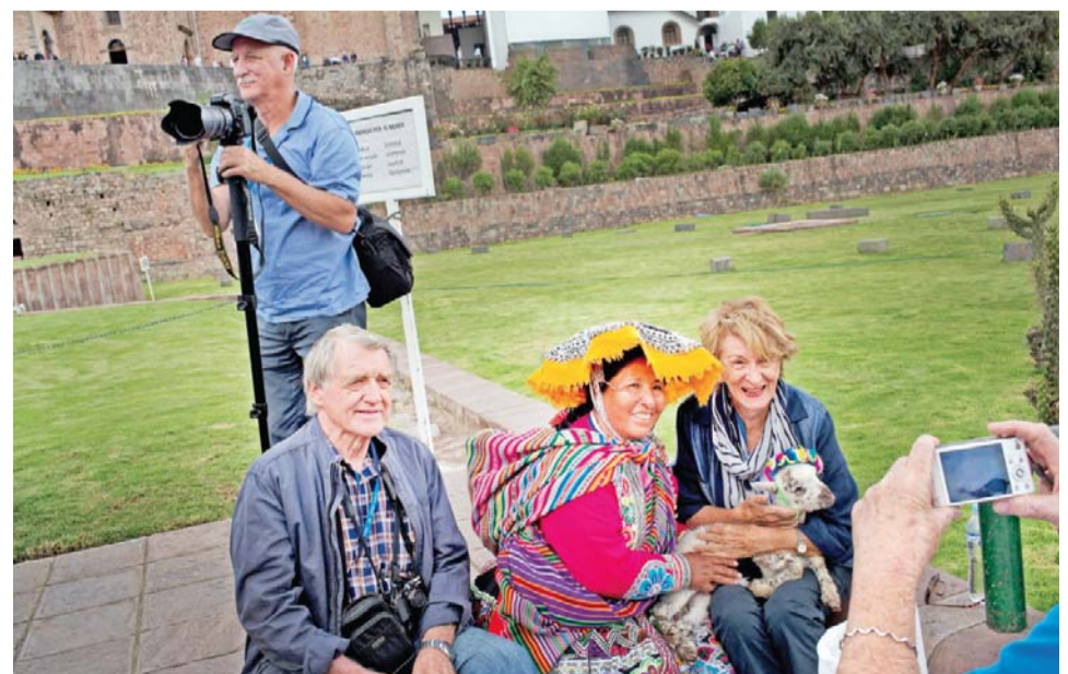
Tourists pose for pictures with a Quechua woman and her pet camelid, before tipping her outside Santo Domingo Convent in downtown Cusco, Peru.