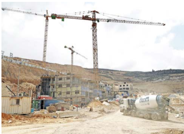
RAMALLAH: Workers and bulldozers work at a construction site yesterday in the Israeli settlement of Givat Zeev near the West Bank city of Ramallah. — AFP

Sadr later took up the demand for a technocratic government, organising a two-week sit-in that put Abadi under pressure to act, but also supported the course of action he wanted to take. Sadr relented after Abadi presented his first list of nominees at the end of March, but has yet to react to the most recent developments in efforts to replace the cabinet. The political crisis surrounding efforts to change the cabinet comes as Iraqi forces battle to regain more ground from the Islamic State group, which seized swathes of the country in 2014. Iraq has also been hit hard by the plummeting price of oil, revenues from account for the vast majority of government funds. — AFP