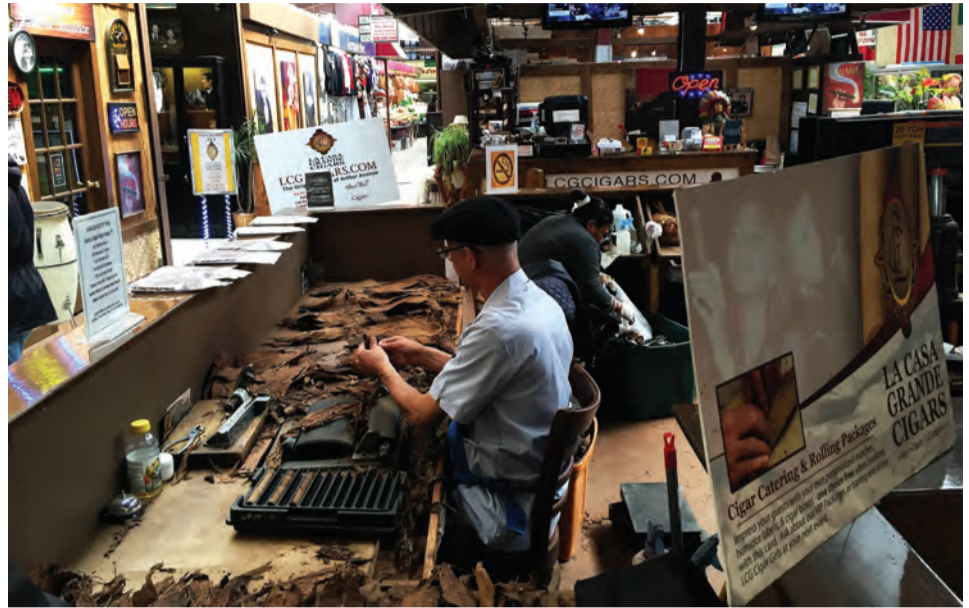
A worker hand-rolls cigars at a shop in the Arthur Avenue Retail Market in the Bronx borough of New York.