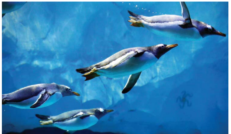
Penguins swim in the Detroit Zoo's new Polk Penguin Conservation Center.