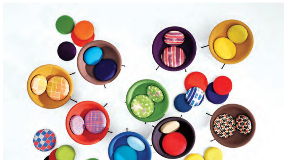
This undated photo provided by The Monacelli Press shows a group of the Lina Bo Bardi Bowl Chair, photographed from above which was originally designed in 1951.