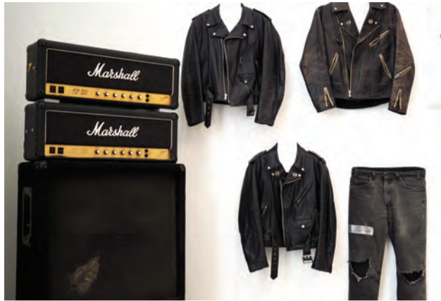
Johnny Ramones and Marky Ramones jackets and jeans are on display during a press preview.