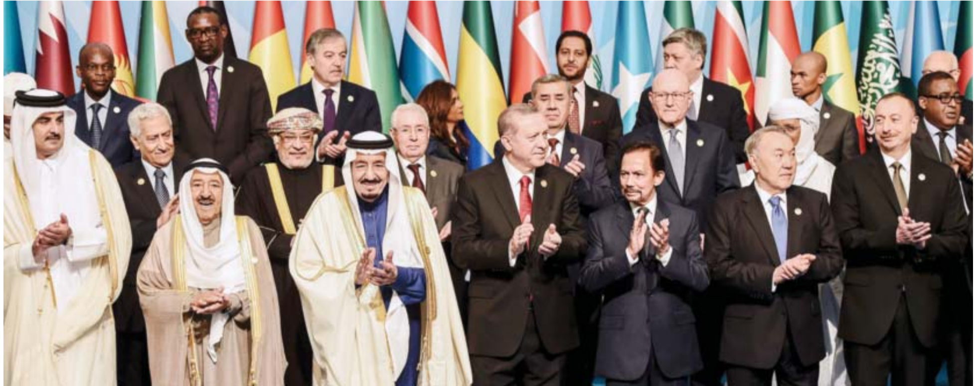
ISTANBUL: (From left) Qatar's Emir Hamad Bin Khalifa Al-Thani, Amir of Kuwait Sheikh Sabah Al-Ahmad Al-Jaber Al-Sabah, King Salman bin Abdulaziz Al Saud of Saudi Arabia, Turkish President Recep Tayyip Erdogan, Brunei's sultan Hassanal Bolkiah, Kazakhstan's President Nursultan Nazarbayev and Azerbaijani President Ilham Aliyev pose for a family photo after the 13th Organization of Islamic Cooperation (OIC) Summit at Istanbul Congress Center (ICC) on April 14, 2016.