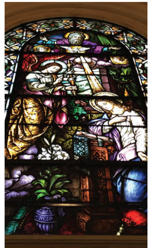
The detail of a stained glass window in Our Lady of Mount Carmel church in the Belmont area of the Bronx borough of New York.