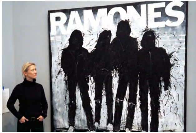
The Ramones image is on display during a press preview.