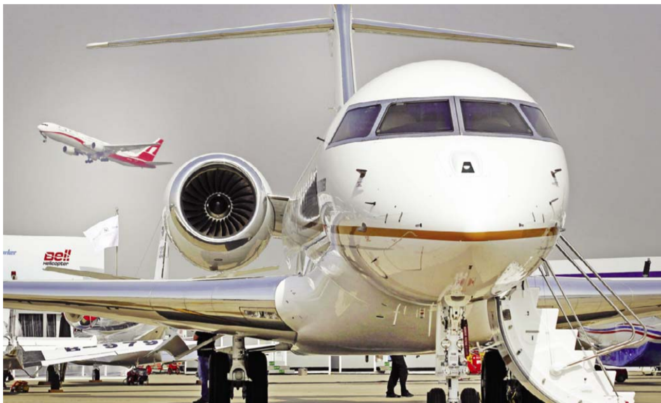
SHANGHAI: Business jets stopped at exhibition area ahead of the 2016 Asian Business Aviation Conference and Exhibition (ABACE 2016) at Shanghai Hongqiao Airport in Shanghai.