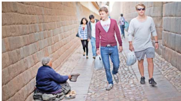
Tourists walk past an elderly woman street beggar downtown Cusco, Peru.