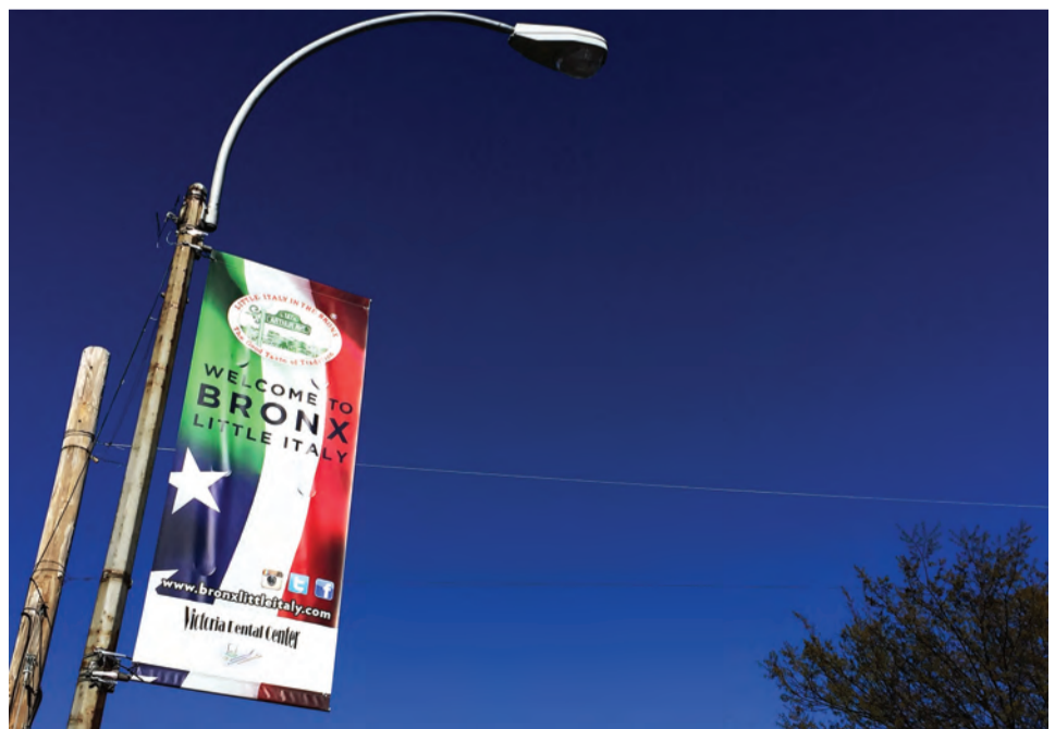
A banner hangs from a streetlamp in the Belmont section of the Bronx borough of New York proclaiming the area to be 'Little Italy.'