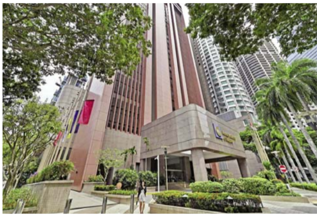
SINGAPORE: A general view shows the Monetary Authority of Singapore (MAS) building in Singapore yesterday.

One of the drags on inflation over the past year has been the fall in oil prices, which hit 13-year lows in February. Since then, oil prices have recovered by about a third higher, which should help push up inflation. The ECB hopes that rising wages and expectations of higher prices will also start to push up inflation, though that may take some time. The core rate, which strips out energy and the other volatile items like food, alcohol, and tobacco, picked up to 1 percent in the year to March from 0.8 percent the previous month. - AP