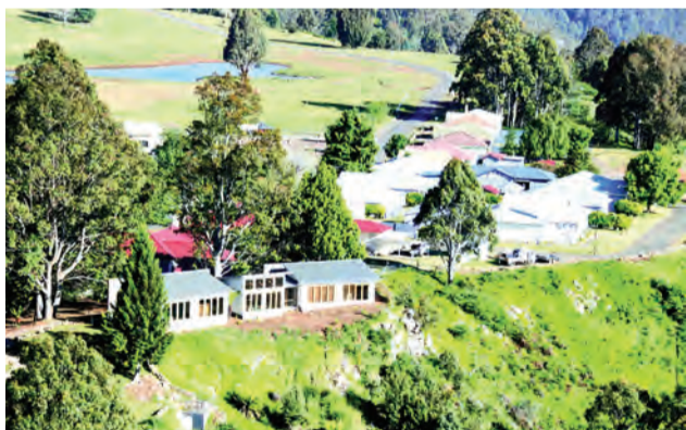
This undated handout shows an Aerial view of Tarraleah village in Tasmania.

"We work to ensure that the park is as beautiful as possible for visitors but that it is also in bloom for as long as possible," gardener Luud ter Laak told AFP. "That's why we plant the bulbs in three layers. First the tulips that bloom later, then the earlier tulips and then the crocuses." The bulb trade in the Netherlands began in the 17th century after they were discovered in central Asia. So precious were bulbs once in the country that they were literally worth their weight in gold. — AFP