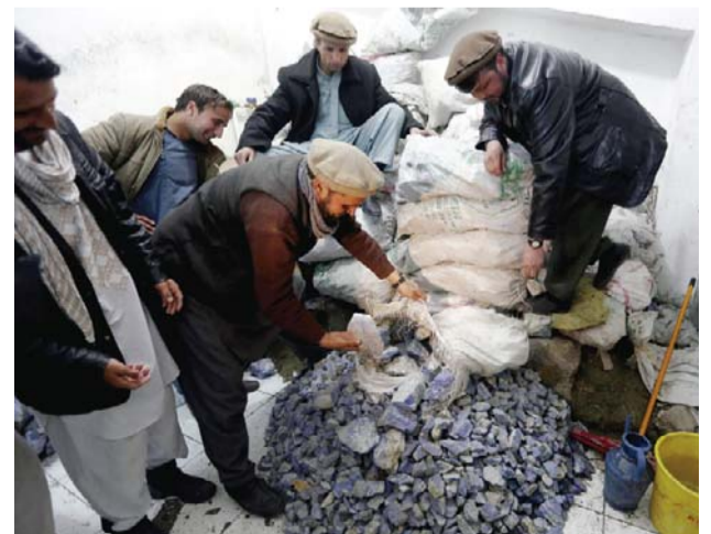
KABUL: Afghan businessmen check lapis lazuli in the city of Kabul, Afghanistan. The brilliant blue stone lapis lazuli, prized for millennia, is almost uniquely found in Afghanistan.