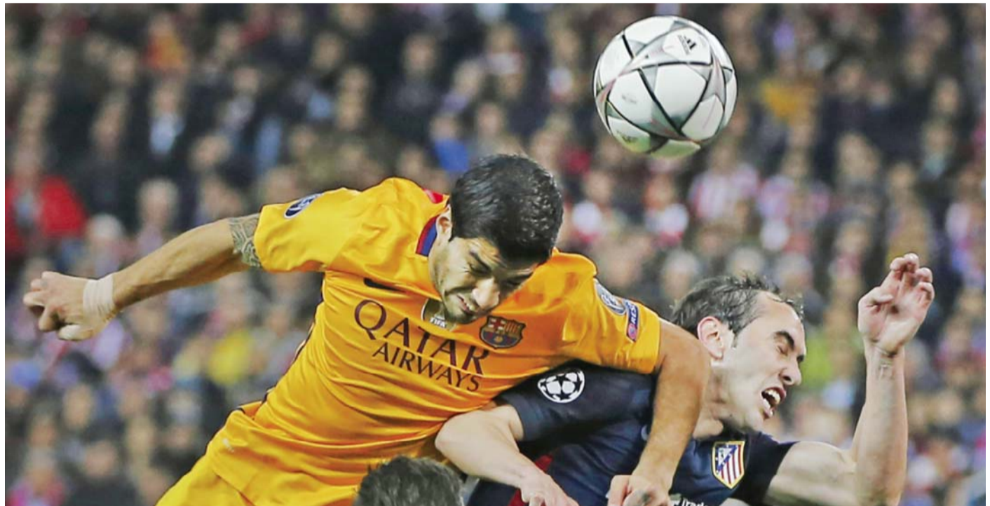
MADRID: Barcelona's Luis Suarez (left) elbows Atletico's Diego Godin as they jump for a high ball during the Champions League 2nd leg quarterfinal soccer match between Atletico Madrid and Barcelona at the Vicente Calderon stadium on Wednesday April 13, 2016.

Hertha travel tomorrow to fifth from bottom Hoffenheim who are battling to avoid the drop. Last season's runners-up VfL Wolfsburg, eliminated from the Champions League by Real Madrid on Tuesday, are down in eighth position and visit Werder Bremen tomorrow. — Reuters