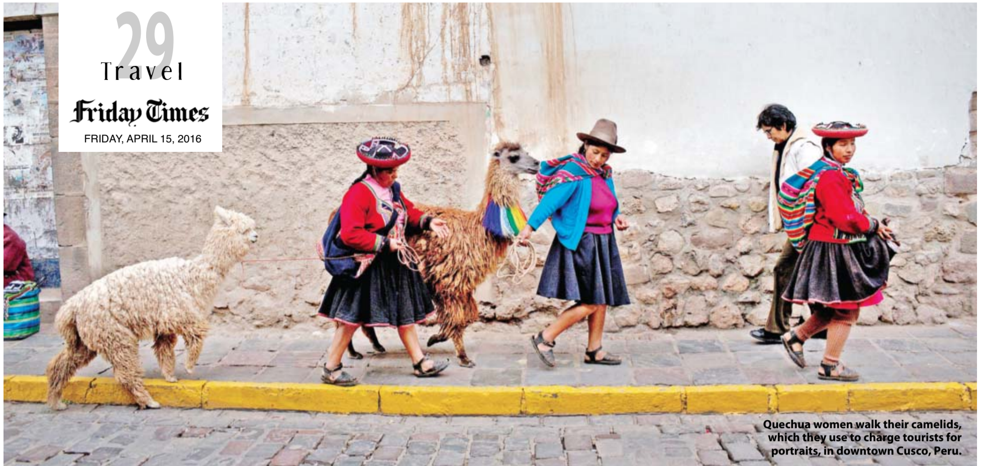
Quechua women walk their camelids, which they use to charge tourists for portraits, in downtown Cusco, Peru.

Peru is South America's third-largest country, with an area of 1,285,220 sq km (496,226 sq mi), extending about 1,287 km (800 mi) se-nw and 563 km (350 mi) NE-SW. Comparatively, the area occupied by Peru is slightly smaller than the state of Alaska. It is bounded by Ecuador and Colombia, on the by Brazil and Bolivia, on the S by Chile, and on the W by the Pacific Ocean, with a total land boundary length of 5,536 km (3,440 mi) and a coastline of 2,414 km (1,500 mi).