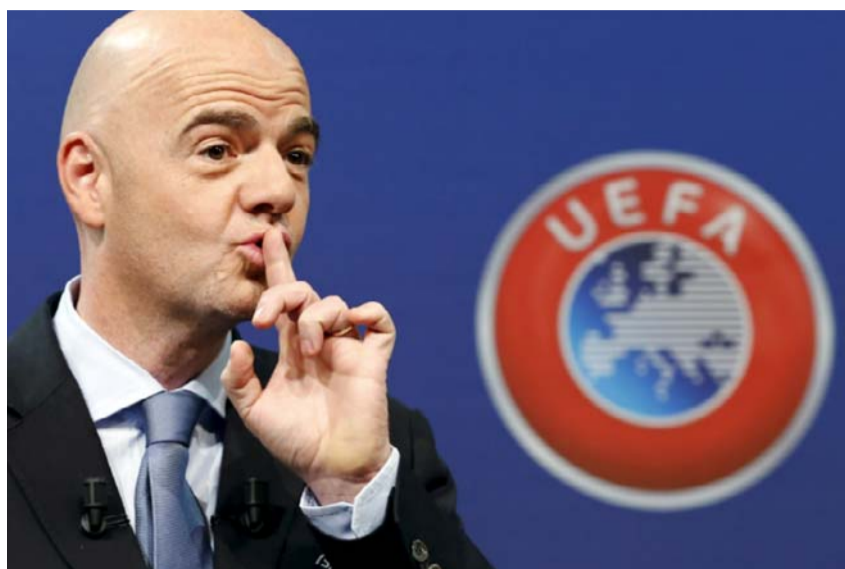
FIFA President Gianni Infantino

"(UEFA) were criticized at the time by people saying 'That's almost half of the teams, the qualifiers will be as boring as ever, no-one will be interested,'" Infantino told interviewer Alexi Lalas. "And the exact opposite came true-which is that it was great from a sporting point of view because many more teams have a chance to qualify, which means many, many more teams have the dream to qualify. "It was great and it will be great for the World Cup in terms of popularity. Because you will have more nations involved in the World Cup. There is enough quality-we see it in Europe," said Infantino, citing the results of