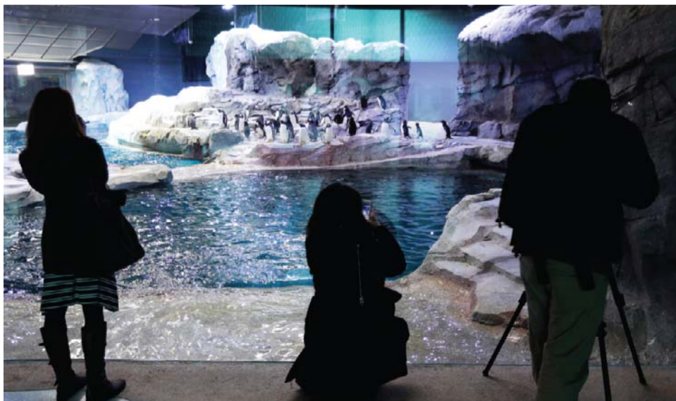
Members of the media photograph the new habitat for penguins in the Detroit Zoo's new Polk Penguin Conservation Center.