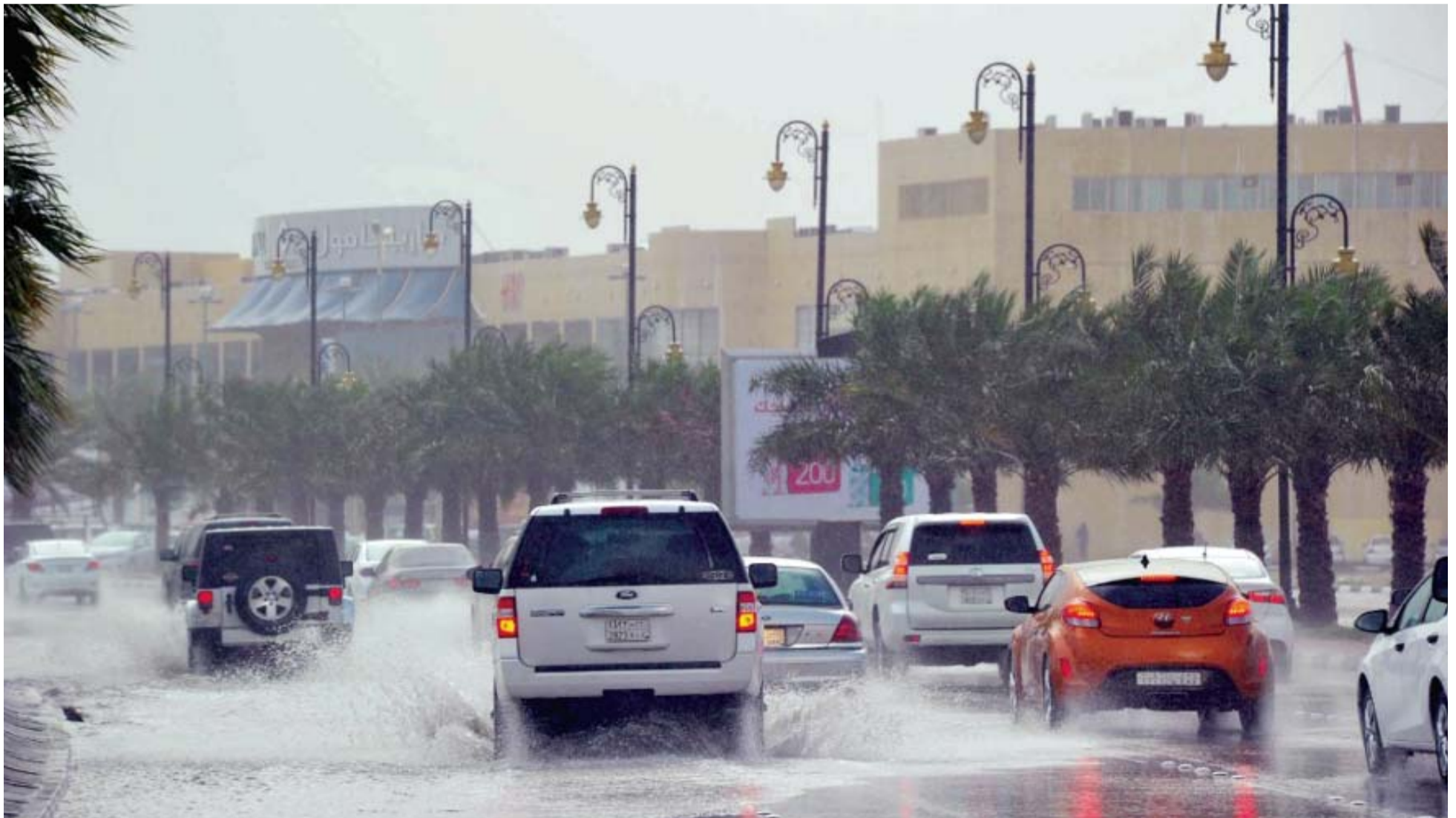
JEDDAH: Road traffic came to a virtual standstill on many of the roads in Saudi Arabia as floodwaters inundated roads following heavy rains.