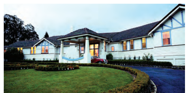
This undated handout shows the Tarraleah Lodge Hotel in Tarraleah village in Tasmania.

"It was a thriving community, we had a normal butcher, shopping center, the school was always busy, the post office, the swimming pool," she told the Australian Broadcasting Corporation. "We used to have a Christmas party at the hall every year—great times." The sale of residential property and farmland to foreigners, including Australia's largest trading partner China, is a sensitive issue, with Canberra knocking back some sales on national interest grounds.