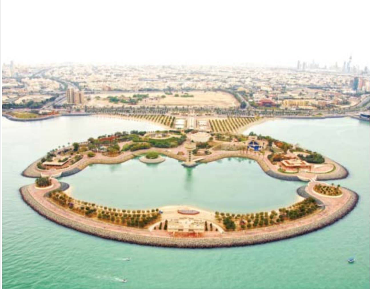
KUWAIT: The Green Island is an artificial island, located off the coast of Kuwait in Salmiya. It offers encircling promenade, parks, playgrounds and regularly hosts concerts and other family attractions.