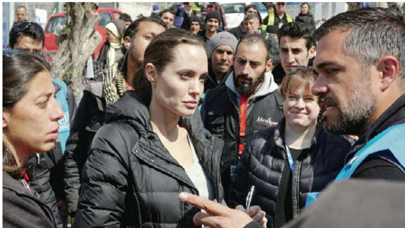
This file photo of March 17, 2016 shows Hollywood star and UN refugee agency envoy Angelina Jolie listening to an aid worker during a visit to the Moria refugee camp on the Greek island of Lesbos.