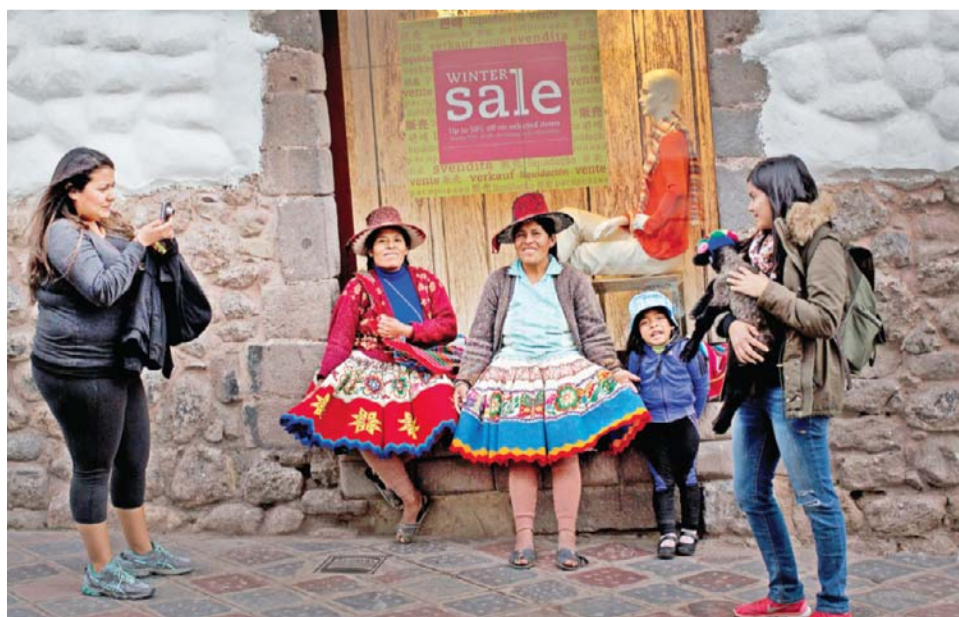
A tourist takes a picture of her friend holding a baby alpaca provided by the Quechua women standing outside a department store who then take a tip for the service, in downtown Cusco, Peru.