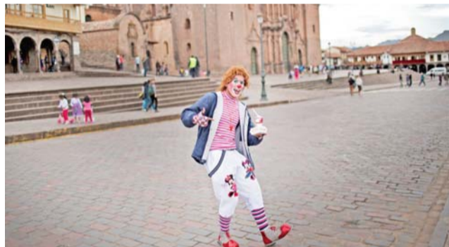
A clown poses for the picture in the Plaza de Armas in Cusco, Peru.

Peru is South America's third-largest country, with an area of 1,285,220 sq km (496,226 sq mi), extending about 1,287 km (800 mi) se-nw and 563 km (350 mi) NE-SW. Comparatively, the area occupied by Peru is slightly smaller than the state of Alaska. It is bounded by Ecuador and Colombia, on the by Brazil and Bolivia, on the S by Chile, and on the W by the Pacific Ocean, with a total land boundary length of 5,536 km (3,440 mi) and a coastline of 2,414 km (1,500 mi).