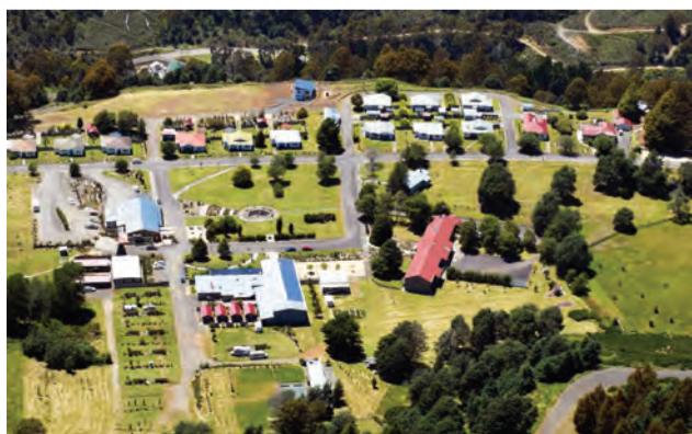
This undated handout photo from real estate company, Knight Frank Tasmania and received yesterday, shows an Aerial view of Tarraleah village in Tasmania.