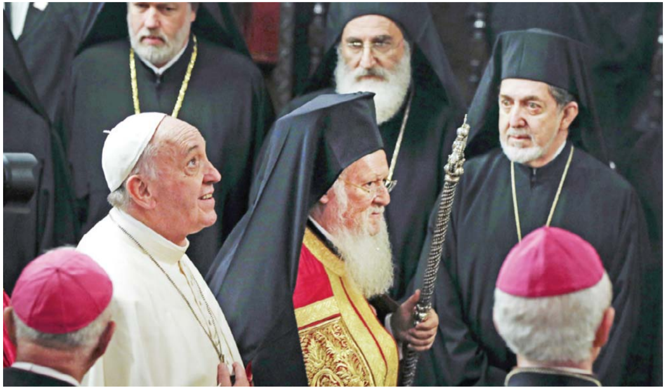
ISTANBUL: Pope Francis (left) arrives with Ecumenical Patriarch Bartholomew I to attend an ecumenical prayer at the Patriarchal Church of St. George in Istanbul.

The pope has repeatedly spoken out about human trafficking, railing January 2014 against "the merchants of human meat who want to enslave migrants". In September 2013: he calls for disused Catholic convents to be used to house asylum-seekers instead of being converted into luxury hotels, speaking during a visit to a refugee centre. "The Church does not need to turn empty convents into hotels to earn money. Empty convents are not ours, they are for the flesh of Christ, for refugees," the pope tells refugees and staff.