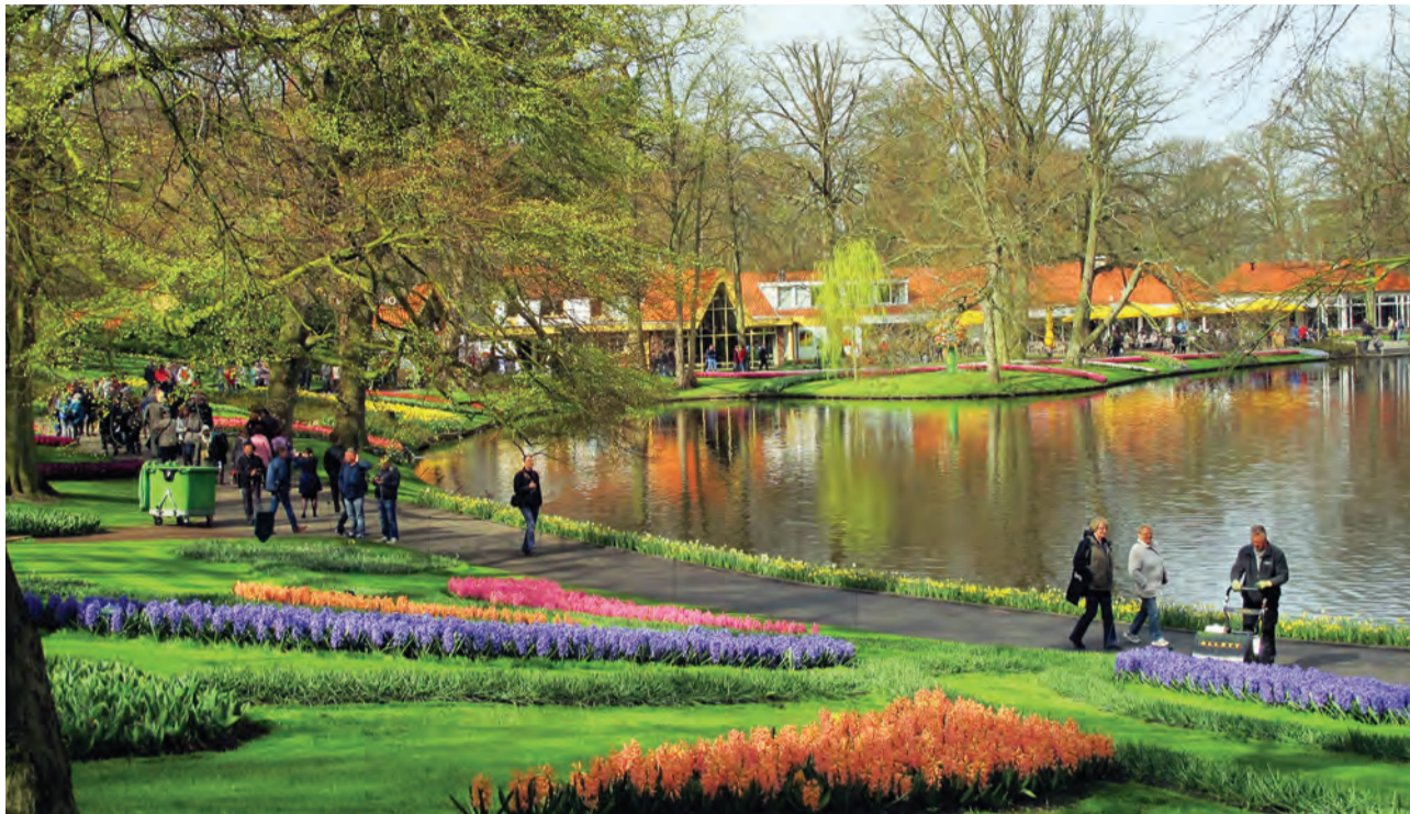
A general view of the world's largest bulb garden of Keukenhof in Lisse.