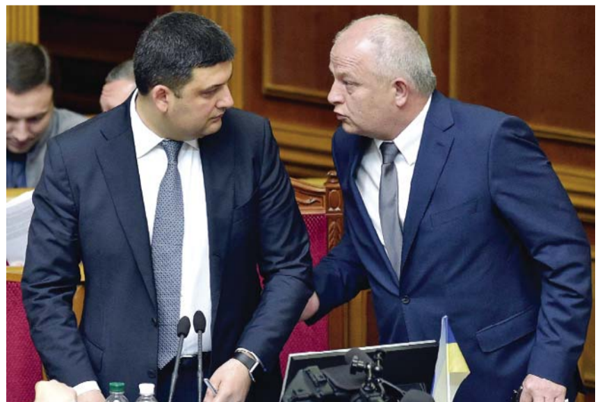
KIEV: Newly-appointed Prime Minister of Ukraine Volodymyr Groysman (left) speaks to Stepan Kubiv, newly appointed First Vice Prime Minister and Economy Minister, during a parliamentary session in Kiev yesterday.

Groysman, however, kept several ministers from Yatsenyuk's government who have faced accusations of corruption and cronyism, including Interior Minister Arsen