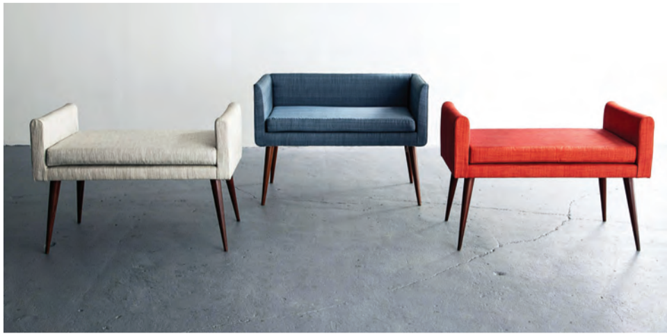
This set of upholstered vanity stools with turned Brazilian hardwood legs was designed by Tenreiro in 1954 for a private residence.