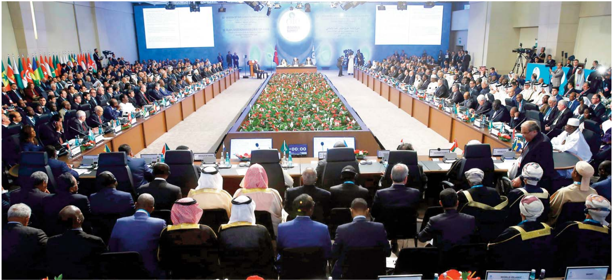
ISTANBUL: Leaders and representatives of the Islamic countries gather for the 13th Organization of Islamic Cooperation, OIC Summit in Istanbul yesterday.