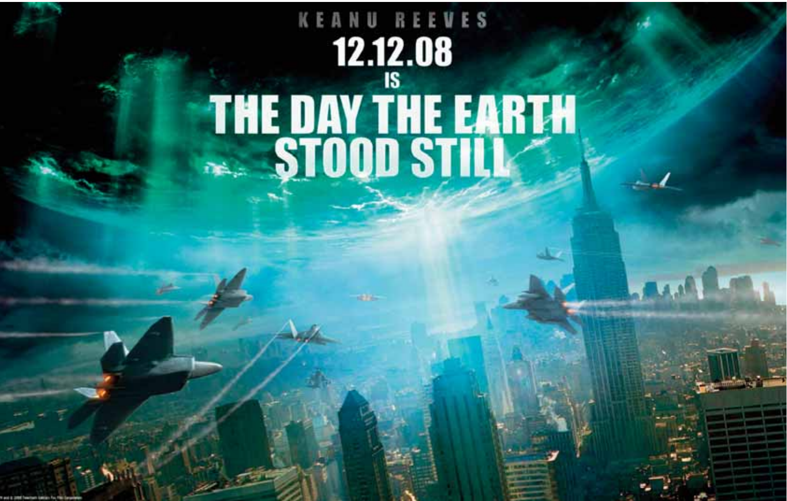
THE DAY THE EARTH STOOD STILL ON OSN MOVIES ACTION HD

01:45 Lucy-PG15 03:30 Need For Speed-PG15 05:45 Planes: Fire And Rescue-PG 07:15 Non-Stop-PG15 09:00 Earth To Echo-PG15 11:00 Blended-PG15 13:00 Annie-PG 15:00 Postman Pat: The Movie-PG 17:00 Earth To Echo-PG15 19:00 Teenage Mutant Ninja Turtles 21:00 Pompeii-PG15 23:00 The Rover-18