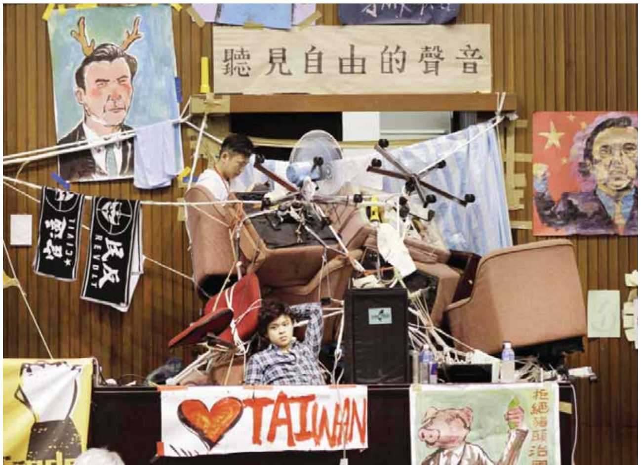
TAIPAI: In this March 28, 2014 file photo, student protesters against a Taiwan's trade pact with China continue to occupy the legislature floor. China and Taiwan have been separately ruled since the Chinese civil war of the 1940s, but China claims sovereignty over the island and insists the two sides eventually unify. They have in recent years set aside that dispute to build trust and sign economic cooperation deals, and their presidents will meet for the first time today in Singapore. — AP