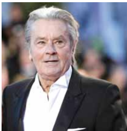
French actor Alain Delon poses on May 25, 2013 as he arrives for the screening of the new restored version of the film "Plein Soleil" presented in Cannes Classics at the 66th edition of the Cannes Film Festival in Cannes.

"If I Go Crazy" would be just at home in the hands of a proper street corner busker (which Case has been), but in the hands and voice of Case, it evolves into a study of perseverance when faced with life's dice rolls. The best stuff comes on "Pelican Bay," an ode to the notorious Pelican Bay State Prison in northern California, where the state's worst of the worst got to do their time.