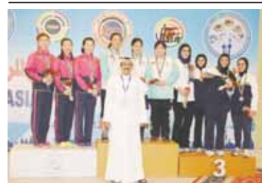
Kuwait women's skeet team bags medal