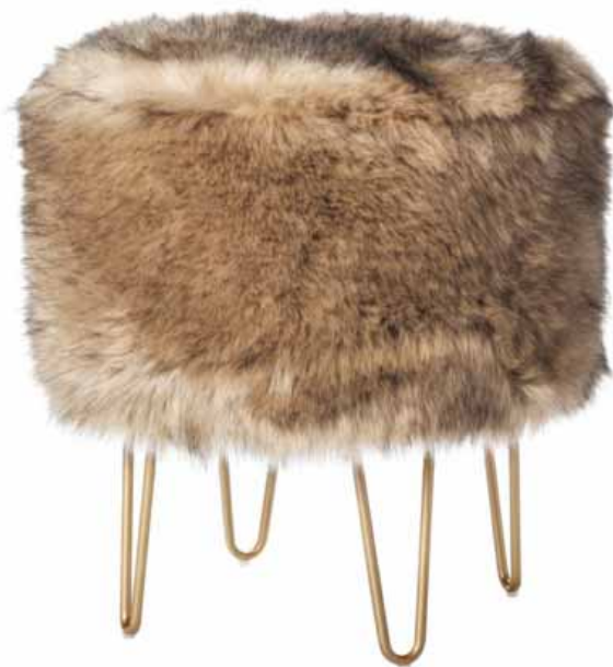
This photo shows a faux fur ottoman stool from the fall Threshold collection with hairpin legs, creates a cozy yet chic resting spot.

At Wayfair, find faux red fox, cheetah and sable patterned throws, all machine-washable. A white, shaggy, oversize ottoman at Urban Outfitters would be a fun addition to a family room, or a playful element in an otherwise traditional living space. Cute little stools are popping up like furry mushrooms all over the winter décor marketplace. World Market's got a faux flokati one on distressed wooden legs; Target's has a tan and black fur seat and brass hairpin legs. Unusual faux furs like coyote, lemur and snow leopard are found in accessories at www.fabulousfurs.com . Z Gallerie's Ludlow slipper chair, all dressed up in ivory plush with Lucite legs, would be a cushy spot to relax in a bedroom. And Restoration Hardware's oversize ultra-faux-fur throws, in a neutral palette of fog, graphite and cream, are an indulgence best savored on a bed or chaise. An exotic collection mimics Siberian fox and Russian mink. —AP