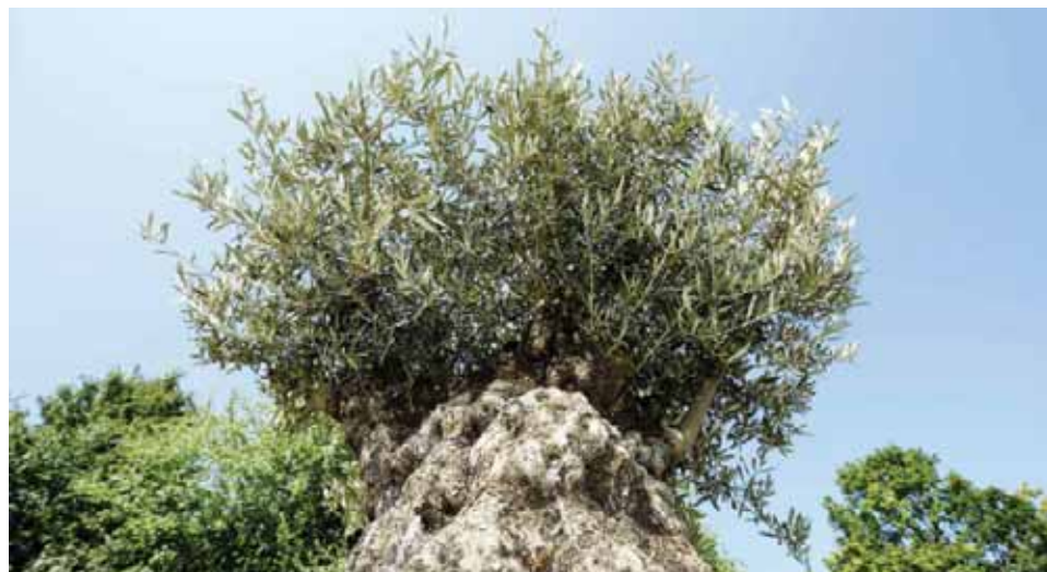
LOEWENSTEIN, Germany: A photo shows an old olive tree before being transported to a customer in Loewenstein.