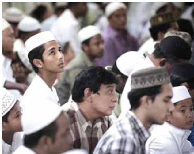
YANGON: Muslim worshippers attend prayers at a mosque.