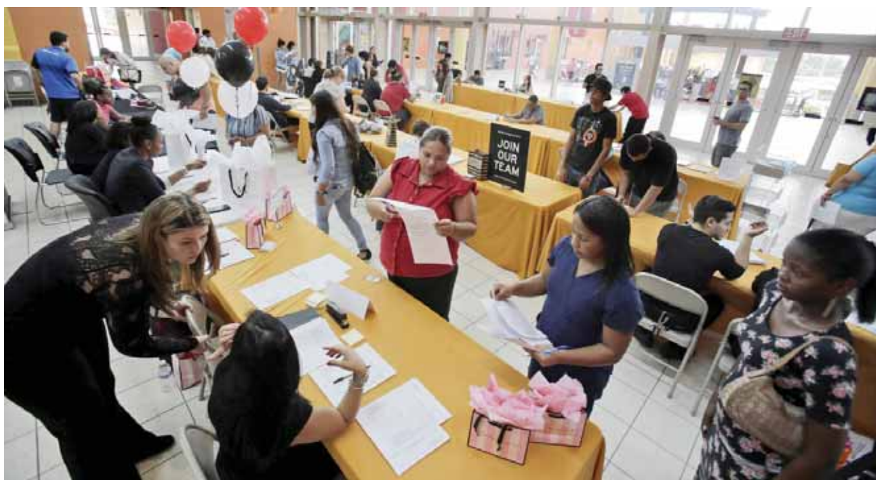
MIAMI: People attend a job fair at Dolphin Mall in Miami. The federal government issued its October jobs report yesterday.