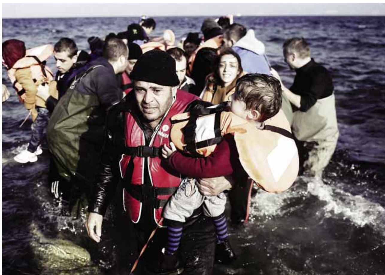
LESBOS: Refugees and migrants arrive on the Greek island of Lesbos after crossing the Aegean Sea from Turkey.