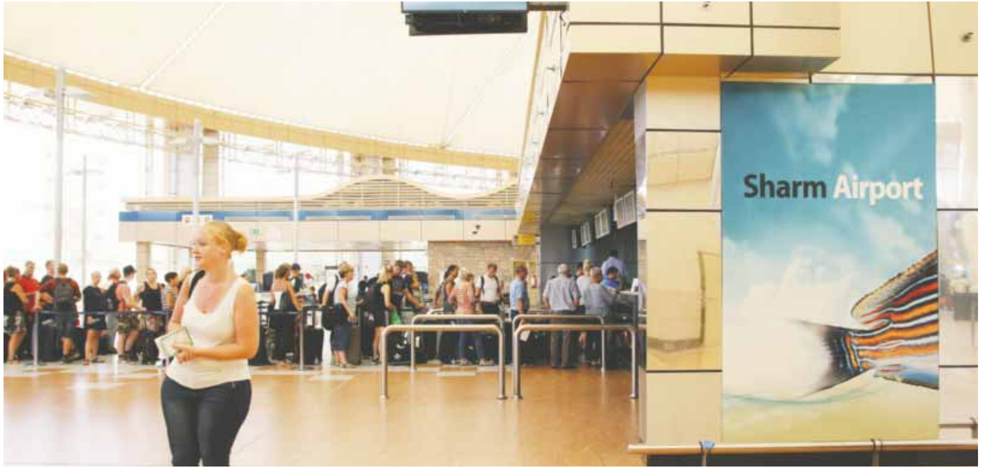
SINAI: Tourists wait in the departure hall to be evacuated from Sharm el-Sheikh airport.