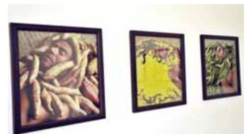
Photographs on display at the Modibo Keita museum in Bamako.