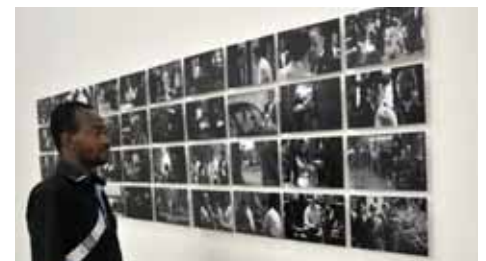
A man looks at photographs taken by Nigerian photographer Uche Okpa-Iroha on November. — AFP photos

fashioned way. Beside her makeshift studio there are wigs, dark sunglasses and other props "to flavor the sauce" says Diabate-smiling as her pictures do steady business. The theme this year is "Telling Time", an English-language title with a deliberate double-meaning which can signify "telling someone the hour of the day" or "a significant époque". It is inspired in part by the country's recent turmoil, when jihadists linked to Al-Qaeda seized the towns and cities of the desert north with the help of Tuareg rebels in the wake of a military coup. The jihadists quickly sidelined their Tuareg allies but were themselves ousted by a French-led military intervention launched in January 2013. — AFP