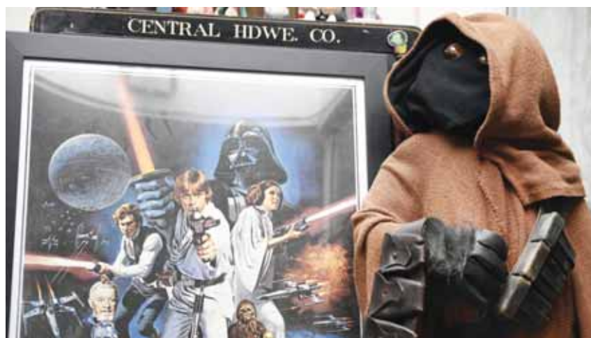
A vintage Star Wars poster for sale at Meltdown Comics and Collectibles in Los Angeles.