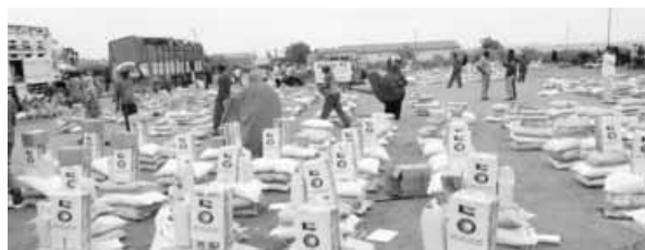
KRCS continues relief operations to displaced Yemenis in Somalia.