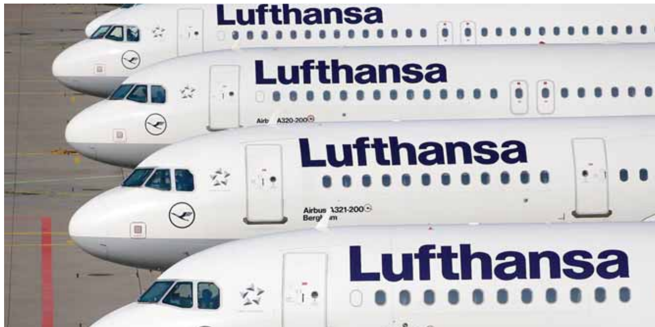
FRANKFURT: Lufthansa aircraft are parked as Lufthansa pilots went on a three-day-strike in Frankfurt. A union representing cabin crews at Germany's Lufthansa is calling members out on strike in a contract dispute with the airline.

"If the payment is made, the national lottery will be privatized. But we will not give special treatment to any company. We can hold a tender again," Simsek said. The highest bidder at the lottery tender, a consortium led by a unit of Net Holding which bid $2.76 billion, failed to meet an April deadline to complete the deal. — Reuters