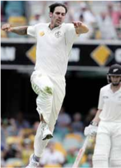
BRISBANE: Australia’s Mitchell Johnson celebrates after he got the wicket of New Zealand’s Ross Taylor during play on day two of the first cricket test between Australia and New Zealand in Brisbane, Australia, yesterday.

BRISBANE: Usman Khawaja’s magnificent 174 helped Australia to a dominant 556 for four declared and an imposing lead of 399 at the end of the second day of the first test against New Zealand yesterday. Australia’s pace attack, with Mitchell Johnson to the fore, fired up with a lethal 20-minute spell in the final session to reduce the tourists to 157-5 at the close of