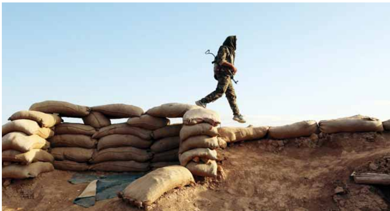
AL-HOL: A fighter from the Syrian Democratic Forces (SDF), which includes Kurds, Arabs and Syriac Christians, monitors the countryside of the northeastern town in the Syrian Hasakeh province.

There is no global or European blanket ban and some flights, including all Russian ones, have continued from the airport. But France and Belgium have warned citizens against travelling to Sharm el-Sheikh and Britain has advised against all but essential travel by air to or from the resort.