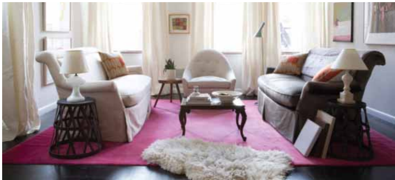
curtains that extend from the ceiling to floor can make a room seem taller than it really is, as seen in this living room says designer Maxwell Ryan.

As the weather gets colder and we come indoors, it's easy to wish your indoor space had some of the open, airy feeling of the outdoors. It is possible to make a room feel larger than it really is: Choosing the right colors and finishes and arranging furniture properly can create the illusion of space. Here, three experts on designing small living spaces share their strategies for making rooms feel larger and more open, without the expense of construction or major redecorating.