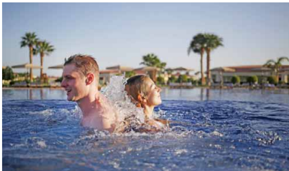
A couple enjoys a jacuzzi in a swimming pool in Sharm El-Sheikh, 400 kilometers (250 miles) southeast of Cairo, Egypt.

However, its future could be grim if it is proven that an Islamic State bomb brought down the Russian passenger plane. In a northern corner of Sinai, the army is fighting Islamic militants who claim allegiance to the Islamic State group, and such a revelation would undermine President Abdel-Fattah El-Sissi's assertion that the insurgency is under control and Egypt is safe for tourists. The sector was looking to re-launch itself on the world stage this week with a multimillion dollar promotional campaign highlighting the country's history and all-year-rounding sun-worshipping opportunities, primarily in and around Sharm El-Sheikh.