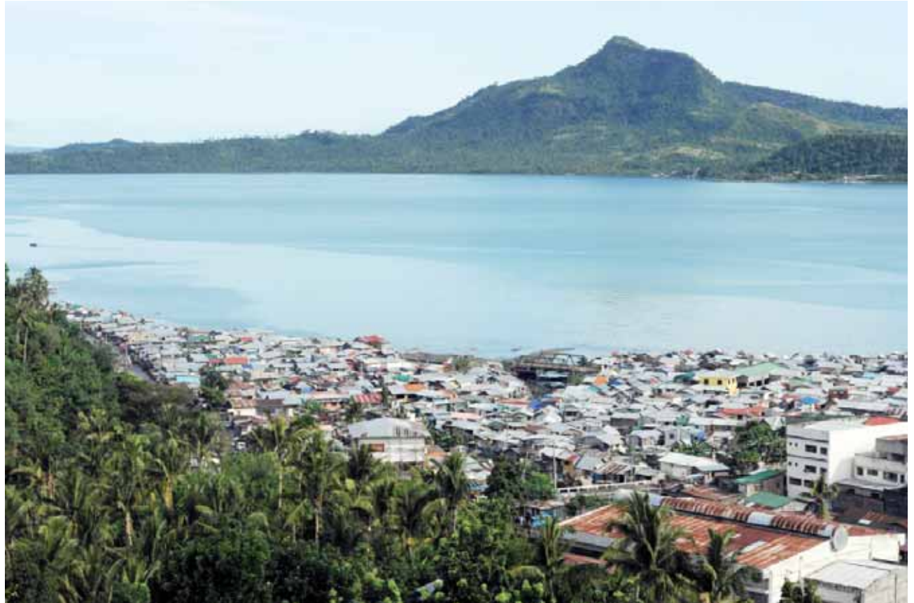
LEYTE PROVINCE: This photo taken on November 2, 2015 shows a general view of downtown Tacloban City.

Dr Al-Qattan said that special handling protocols of the disease from World Health Organization (WHO) and Centers for Disease Control and Prevention (CDC) have been distributed to all treatment centers in the country, adding that the Ministry is following up on any updates of the cholera outbreak in Iraq. She advised people, especially children, pregnant women and those of poor health, to postpone their travel plans to the neighboring country up north. Travelers from Iraq, meanwhile, should visit the nearest health centers as soon as possible once they witness acute diarrheal infection within seven days of their arrival. Neither contaminated water or food sources should be touched nor should it be carried while travelling, she cautioned. — Agencies