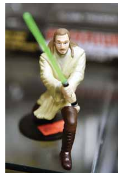
A figurine of Liam Neeson's character Qui-Gon Jinn in "Star Wars: Episode I - The Phantom Menace" is for sale at Meltdown Comics and Collectibles in Los Angeles.