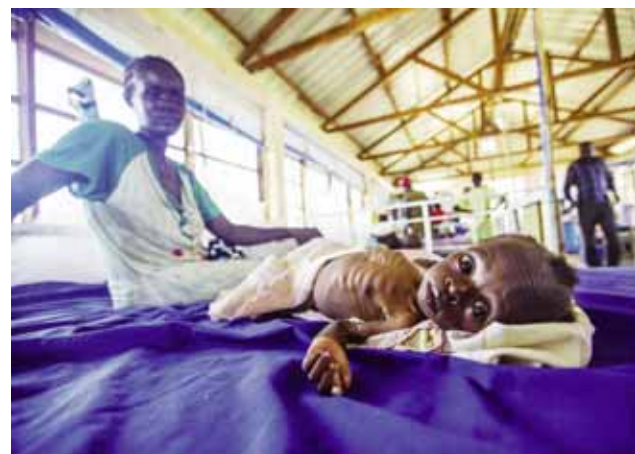
AWEIL: A file picture taken on October 9, 2015 shows a two-month-old girl with a severe malnutrition lying on a bed next to her mother at the Aweil State Hospital.

Civil war began in December 2013 when President Salva Kiir accused his former deputy Riek Machar of planning a coup, setting off a cycle of retaliatory killings that have split the poverty-stricken, landlocked country along ethnic lines.