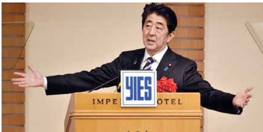
TOKYO: Japan's Prime Minister Shinzo Abe answers questions during the Yomiuri International Economic Society (YIES) lecture meeting entitled "What We Should Do Next" in Tokyo yesterday.

Abe and many Japanese experts have long supported the TPP, which should give greater foreign market access for "Japan Inc."