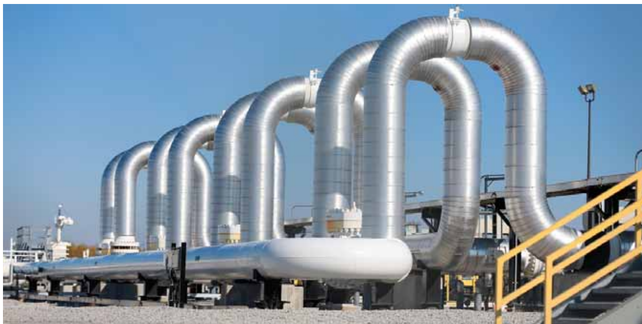
STEELE CITY: The Keystone Steele City pumping station, into which the planned Keystone XL pipeline is to connect to, is seen in Steele City, Nebraska. The Obama administration says, it is continuing a review of the proposed Keystone XL oil pipeline, despite a request by the project's developer to suspend the review.

Warba Bank is keen to continue providing comprehensive and innovative banking solutions for Kuwaiti nationals and giving them the chance to acquire what they want without suffering financing burdens and without any additional charges on resale.