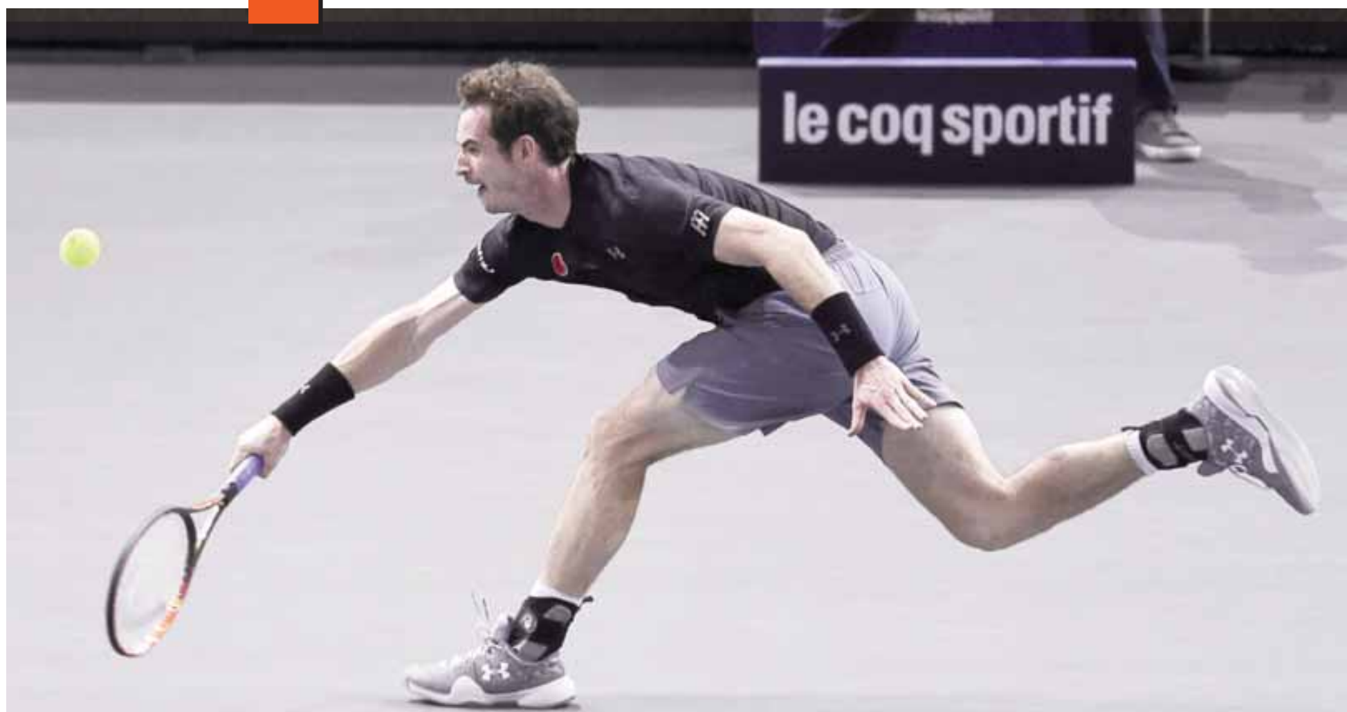
PARIS: Britain's Andy Murray returns the ball to France's Richard Gasquet during their quarter final tennis match at the ATP World Tour Masters 1000 indoor tennis tournament in Paris yesterday.