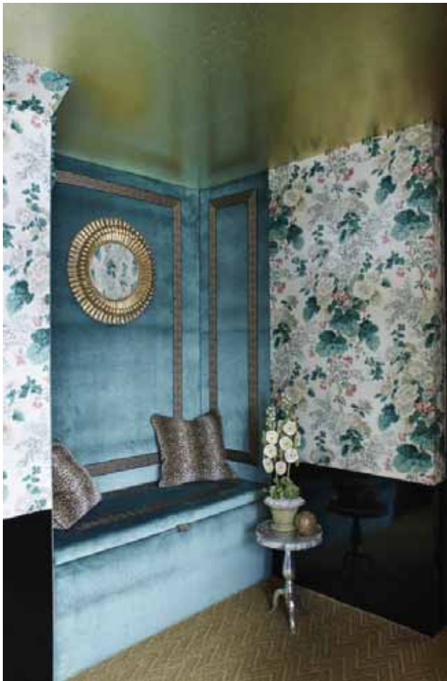
In this photo provided by Young Huh, just as mirrors can make a small room feel larger, fabrics that reflect light and ceiling paint with a reflective finish can accomplish the same trick, as shown in this seating nook that is part of a lounge vestibule, designed by Huh.