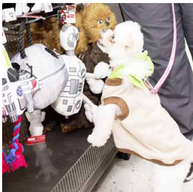
Misty chooses a new Star Wars toy at a Petco pet store in Los Angeles.

er at the UCLA School of Theater, Film and Television. "And Disney knows that many of the items they are selling will never be opened and will be kept like an artifact or jewel that someone might sell some day."