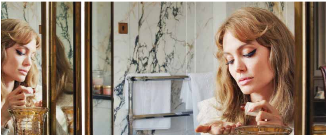
In this photo provided by Universal Pictures, Angelina Jolie Pitt, stars as Vanessa in the film "By the Sea." The movie directed by Jolie Pitt releases in US theaters on Nov 13, 2015.

Shoppers vented on social media, including Twitter and Facebook, where some gushed about the new offerings and others griped that H&M's website had stalled when they tried to visit. A Twitter account for H&M stores in the United Kingdom offered apologies, saying: "The interest for this launch has exceeded all collaborations and we're truly sorry for those not being able to shop." — AP