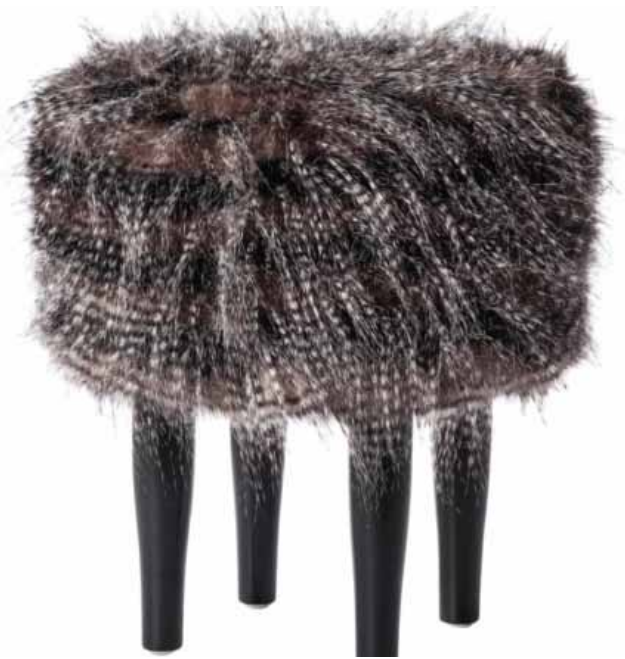
This photo shows Nate Berkus designed an elegant stool for the fall collection, clad in a shaggy chic striated faux fur.