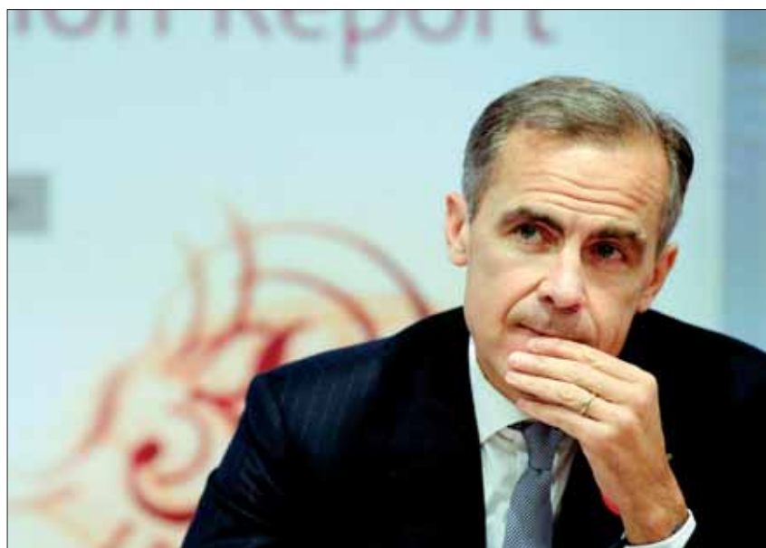
LONDON: Governor of the Bank of England Mark Carney gestures, during an Inflation Report press conference, at the Bank of England, in London, Thursday. — AP

counterbalanced," either by savings elsewhere or through taxes. The Left Bloc announced late Thursday it has reached a written agreement on future government policies with the Socialists but gave no details. The Socialists are still negotiating a formal deal with the Communists. — AP