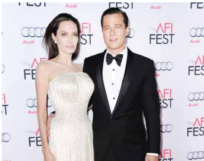
Angelina Jolie, left, and Brad Pitt arrive at the 2015 AFI Fest opening night premiere of "By The Sea" on Thursday, in Los Angeles.