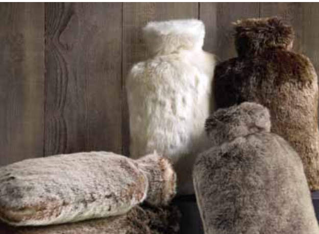
This photo shows faux fur covered water bottles would make a luxe and welcome gift.