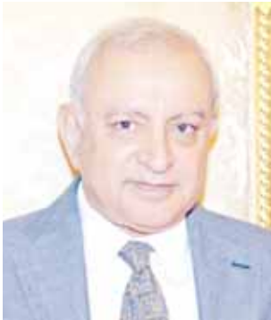
Minister of Education and Minister of Higher Education Bader Hamad Al-Essa

PARIS: Kuwait has called for eradicating "seeds of war and violence" through consolidating the concept of "peace education" and enhancing a culture of peace to maintain "Man's values and dignity" and safeguard children against the repercussions of armed conflicts. The call was voiced by Minister of Education and Minister of Higher Education Bader Hamad Al-Essa