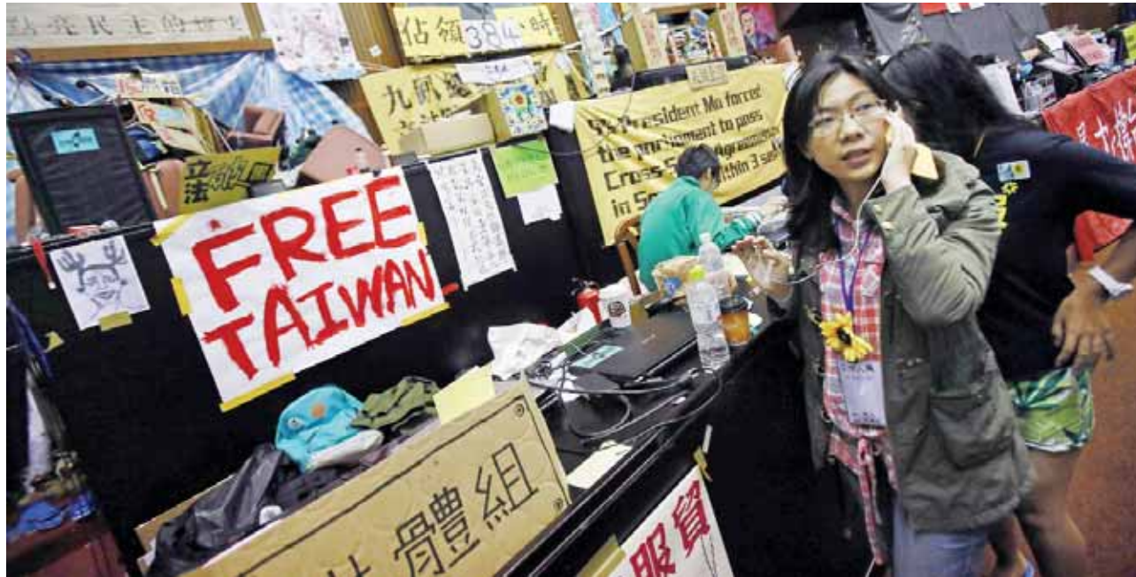
TAIPEI: A student protester against a Taiwan's trade pact with China takes a phone call inside the occupied legislature in Taipei, Taiwan. China and Taiwan have been separately ruled since the Chinese civil war of the 1940s, but China claims sovereignty over the island and insists the two sides eventually unify.

believed to have spent tens of billions of dollars buying shares to prop up prices. Goldman Sachs estimated in a report in August that the group, dubbed the "National Team" by financial analysts, spent 860 billion-900 billion yuan ($135 billion-$140 billion) in June and July. July's order canceled planned IPOs by 28 private companies in electronics, food processing and other industries.