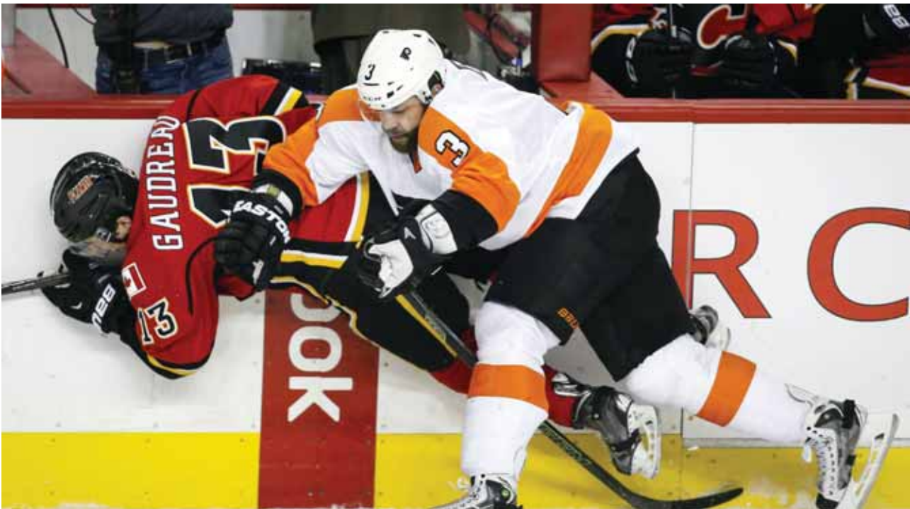
CALGARY: Philadelphia Flyers' Radko Gudas, right, of the Czech Republic, checks Calgary Flames' Johnny Gaudreau during second-period NHL hockey game action in Calgary, Alberta, Thursday.

A three-goal burst in the first period led the Tampa Bay Lightning to a 4-1 win over the Buffalo Sabres. Steven Stamkos, Tyler Johnson,