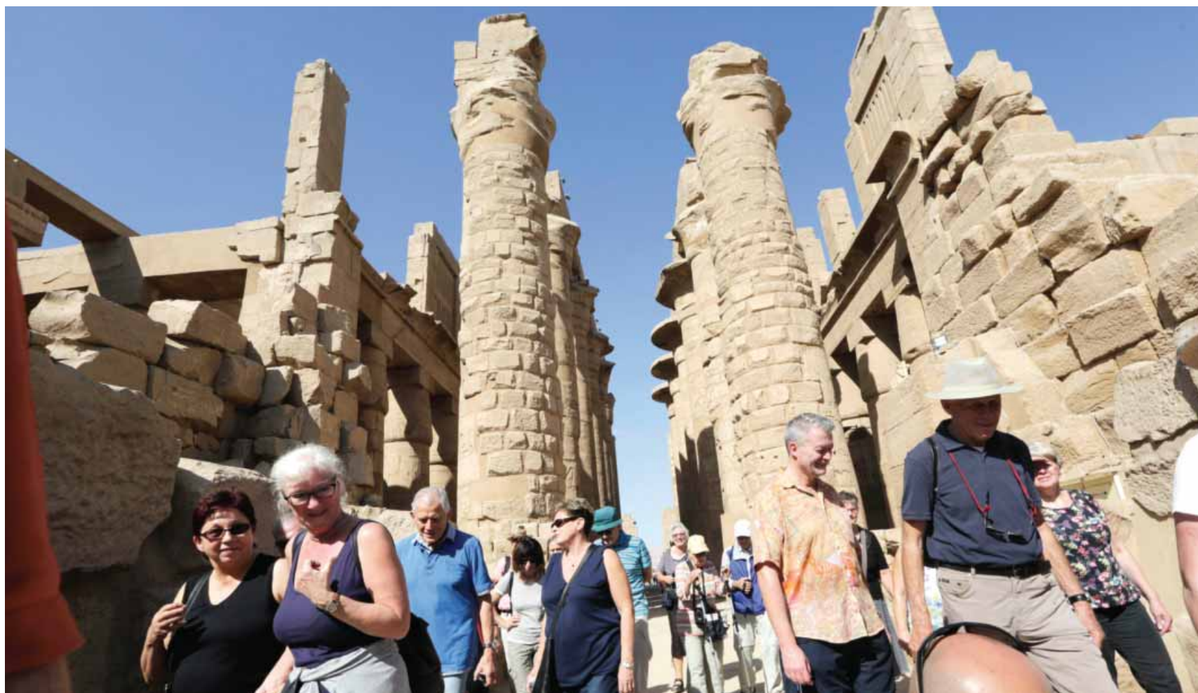
German tourists visit the Karnak Temple in Luxor, Egypt, Friday.

Egypt had launched festivities, archaeological openings and a new tourism campaign to draw much-needed foreign visitors. But with many flights to Red Sea resorts grounded Thursday amid suspicion that a bomb brought down a Russian airliner, hopes for a recovery were fading. Egyptians, who depend on the key sector, were keeping a brave face even as some stranded tourists grew angry and tour operators bristled over possible cancellations.