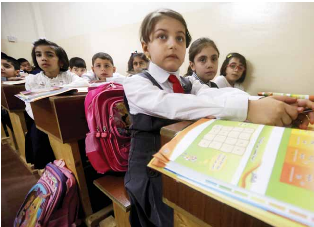
KIRKUK: Iraqi children listen during a class on October 26, 2015 at the Mariamana school in the multi-ethnic northern Iraqi city of Kirkuk where Kurdish, Arab and Turkmen children sit in the same classrooms and Islamic and Christian education textbooks are stacked on the same tables.

As they withdrew from Aarsal, the jihadists took dozens of Lebanese police and soldiers hostage and still hold them in the hilly terrain on the town's outskirts. In October, eight people were killed and others wounded when Lebanon's army targeted militant positions along the mountainous eastern border.