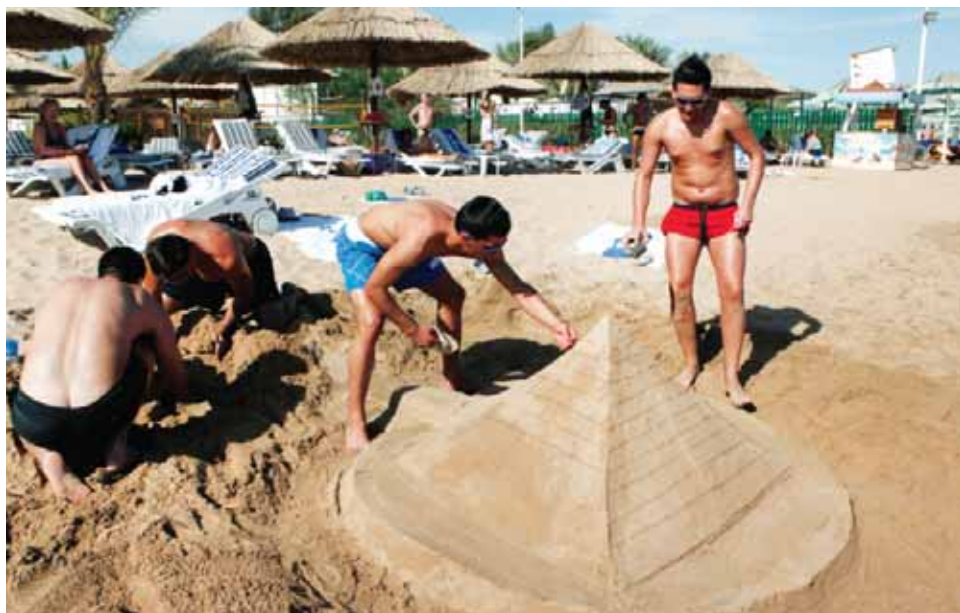
File photo shows tourists build a sand pyramid at a closed beach in the Red Sea resort of Sharm El-Sheikh, Egypt.