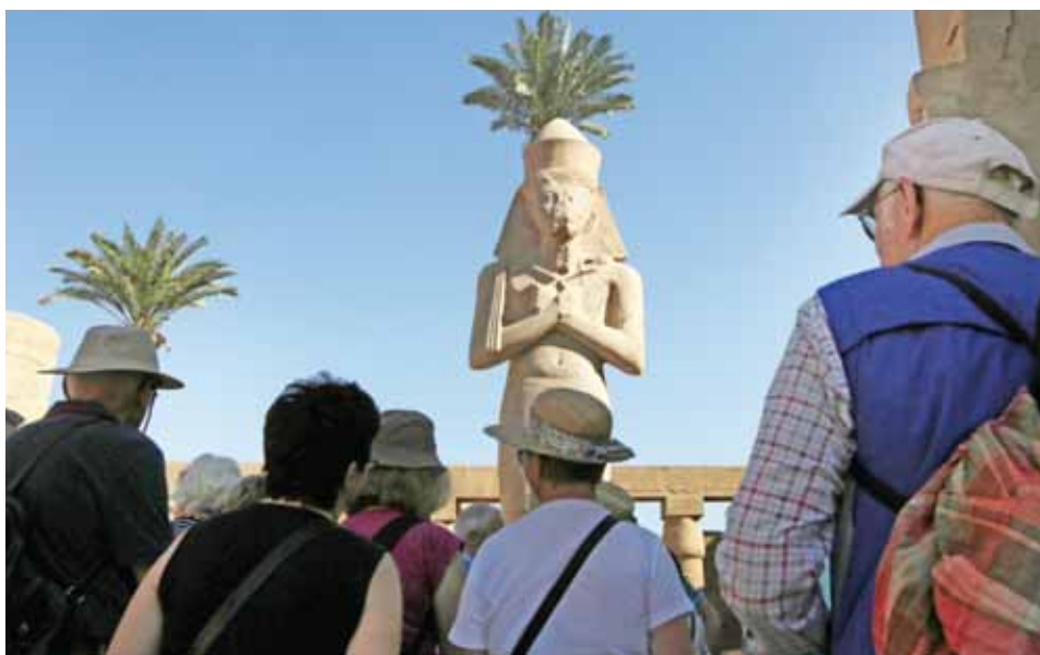
Tourists visit the Karnak Temple in Luxor, Egypt.