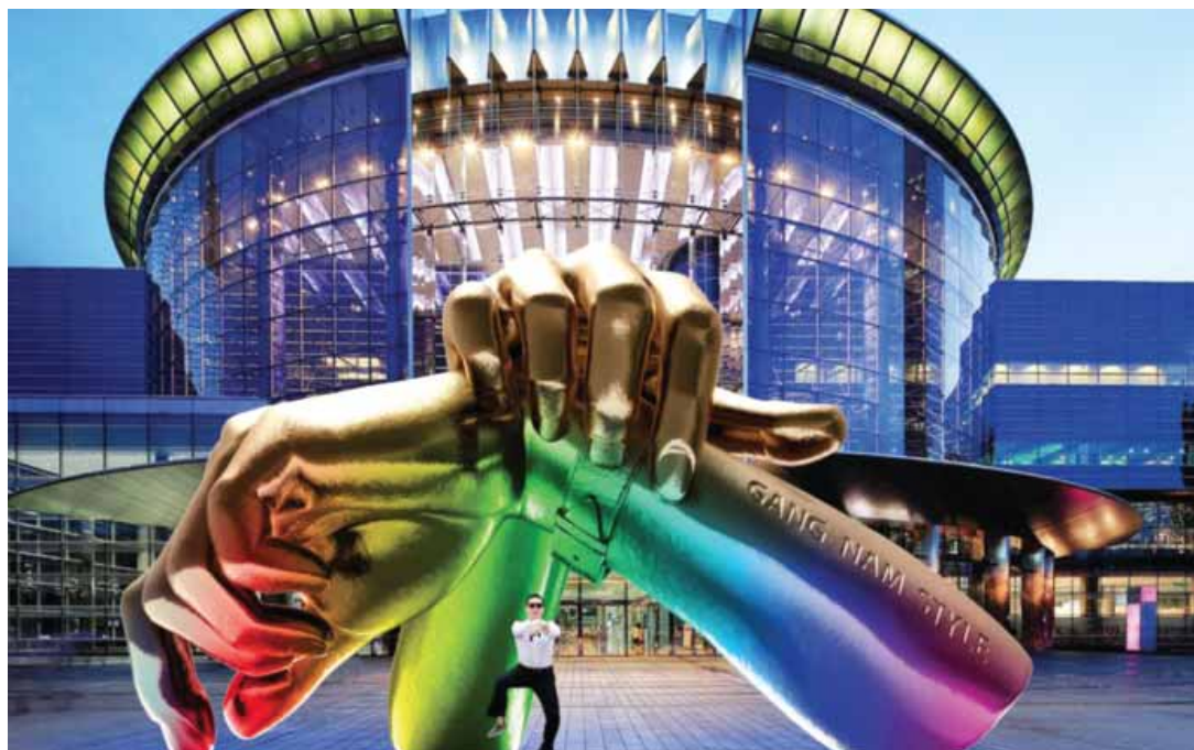
A handout computer generated image released by Gangnam District Office yesterday shows a metal sculpture consisted of two giant fists overlapped at the wrist in the style of the horse dance, outside the COEX shopping and exhibition Centre in Seoul.