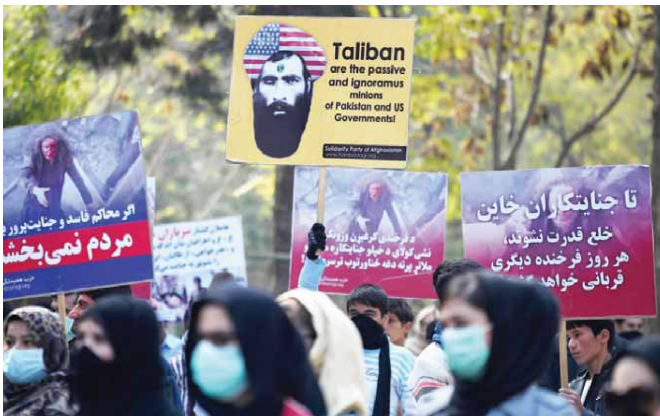
KABUL: Afghan Solidarity members hold posters and chant slogans as they stage a protest against Taliban militants who stoned an Afghan woman to death, at Shar-e-Naw Park.

Some separatist leaders remained defiant, however. "Our Million March will go ahead come what may," Syed Ali Geelani, the senior most separatist leader who called for the counter-rally said in a statement Thursday. Kashmir has been divided between India and Pakistan since the end of British colonial rule in 1947.—AFP