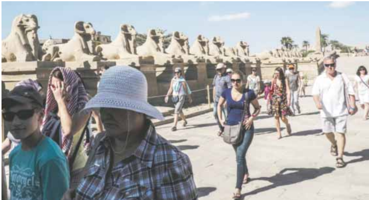
LUXOR: Russian tourists visit the famed Karnak temple, one of Egypt's most popular heritage attractions, in the southern city of Luxor yesterday. Tempers flared and confusion gripped crowds of British tourists stranded at Sharm El-Sheikh airport as airlines scrambled to fly them home, days after a Russian plane crashed in the Sinai Peninsula.