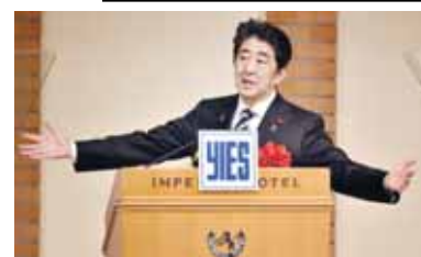
Abe: Pacific Rim free trade deal set rules for economy

Greece approves reform bill, eyes bailout tranche