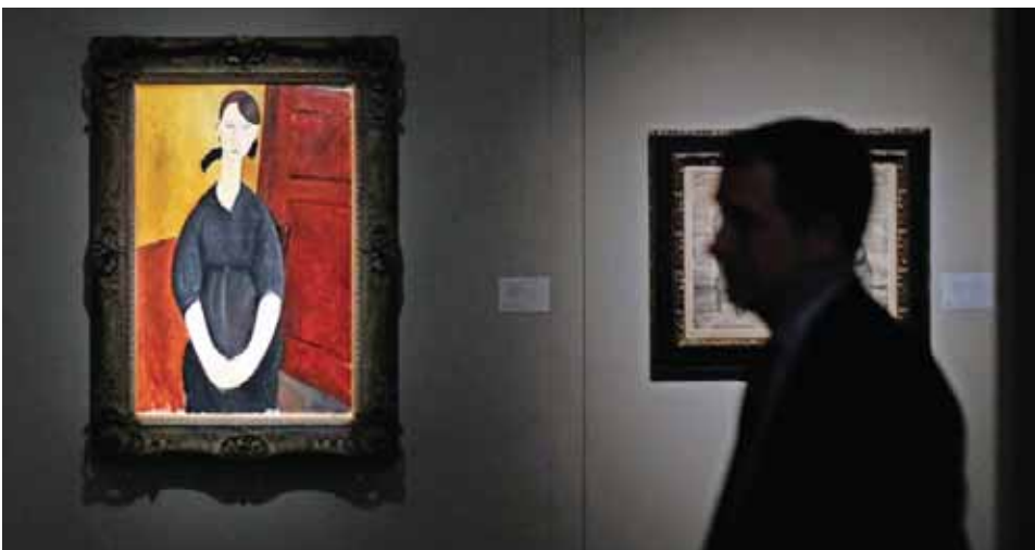
Italian artist Amedeo Modigliani's "Portrait de Paulette Jourdain" is pictured during Sotheby's press preview of the Autumn Evening Auctions in New York.

In 2000, during restoration work, Koch discovered that there was another painting on the reverse—a mocking depiction of Picasso's art dealer—that had been hidden under the lining for a century. It was a lucrative night for Koch. Just minutes earlier, at the same auction, Sotheby's sold his Monet "Water Lilies" study in oil for $33.85 million, clearing its minimum pre-sale estimate of $30 to 50 million. Another high-