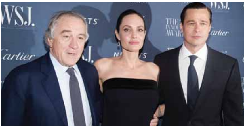
Robert De Niro, from left, Angelina Jolie Pitt and Brad Pitt attend the WSJ Magazine Innovator Awards 2015 at The Museum of Modern Art.

"By the Sea" is the third feature film that Jolie has produced and directed, following the Bosnia war drama "In the Land of Blood and Honey" (2011) and "Unbroken" (2014), about a former Olympic athlete held at a Japanese prisoner camp during World War II. "Unbroken," which got middling reviews and no major Oscar nominations, was a disappointment for Jolie. However the film still made $161 million in worldwide ticket sales on a budget of just $65 million, according to the specialty website Box-Office Mojo. "By the Sea" needs a good showing at the AFI