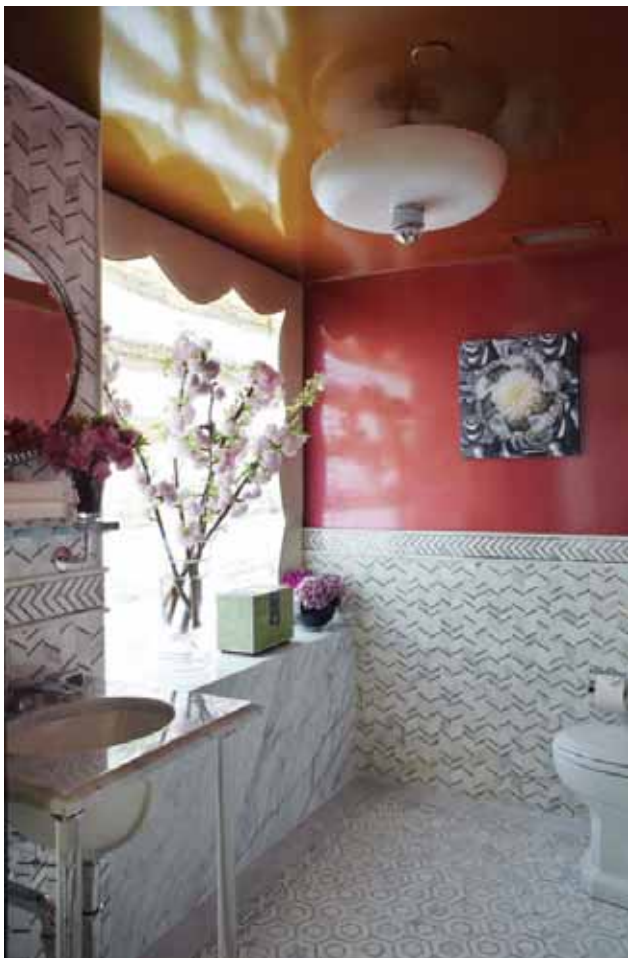
bold colors, small-scale patterns and a shimmering painted ceiling in this modestly-sized bathroom designed by Huh work together to make this small space feel expansive and bright.