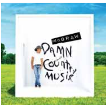
This CD cover image released by Big Machine Records shows “Damn Country Music,” the latest release by Tim McGraw.

Few veteran artists straddle contemporary and traditional country music styles as well, and as entertainingly, as Tim McGraw. On his new album, “Damn Country Music,” McGraw includes tunes George Jones would have felt comfortable performing, while others push country music into new territory. On the traditional side, the cheating song “Don’t Make Me Feel At Home” conjures up the sort of psychological dilemma found in classic country works by singers like Johnny Paycheck. “Here Tonight,” with harmony vocals by daughter Gracie McGraw, draws on upbeat Celtic sounds with the timeless, celebratory feel of early Dixie Chicks.