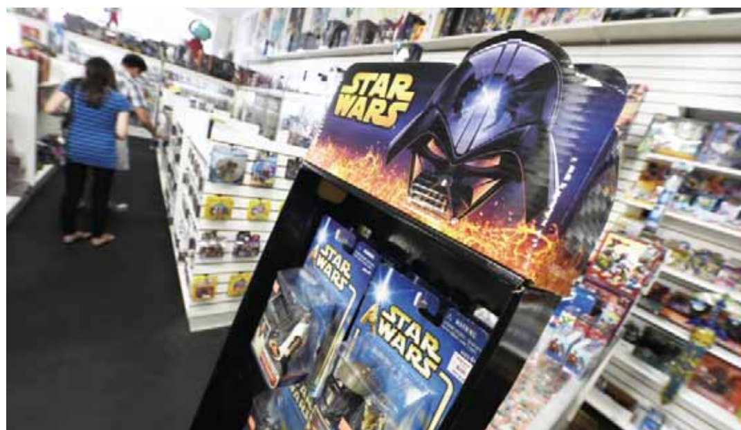
Customers shop for Star Wars collectibles at Meltdown Comics and Collectibles in Los Angeles.

"They have done it in a way that hasn't annoyed the public," said Pasierb. "Normally when there is a marketing blitz like that, the public will wear out," he explained. "But the public has not pushed back and they have been able to do it with just the right level to peak people's interest and keep it there." — AP