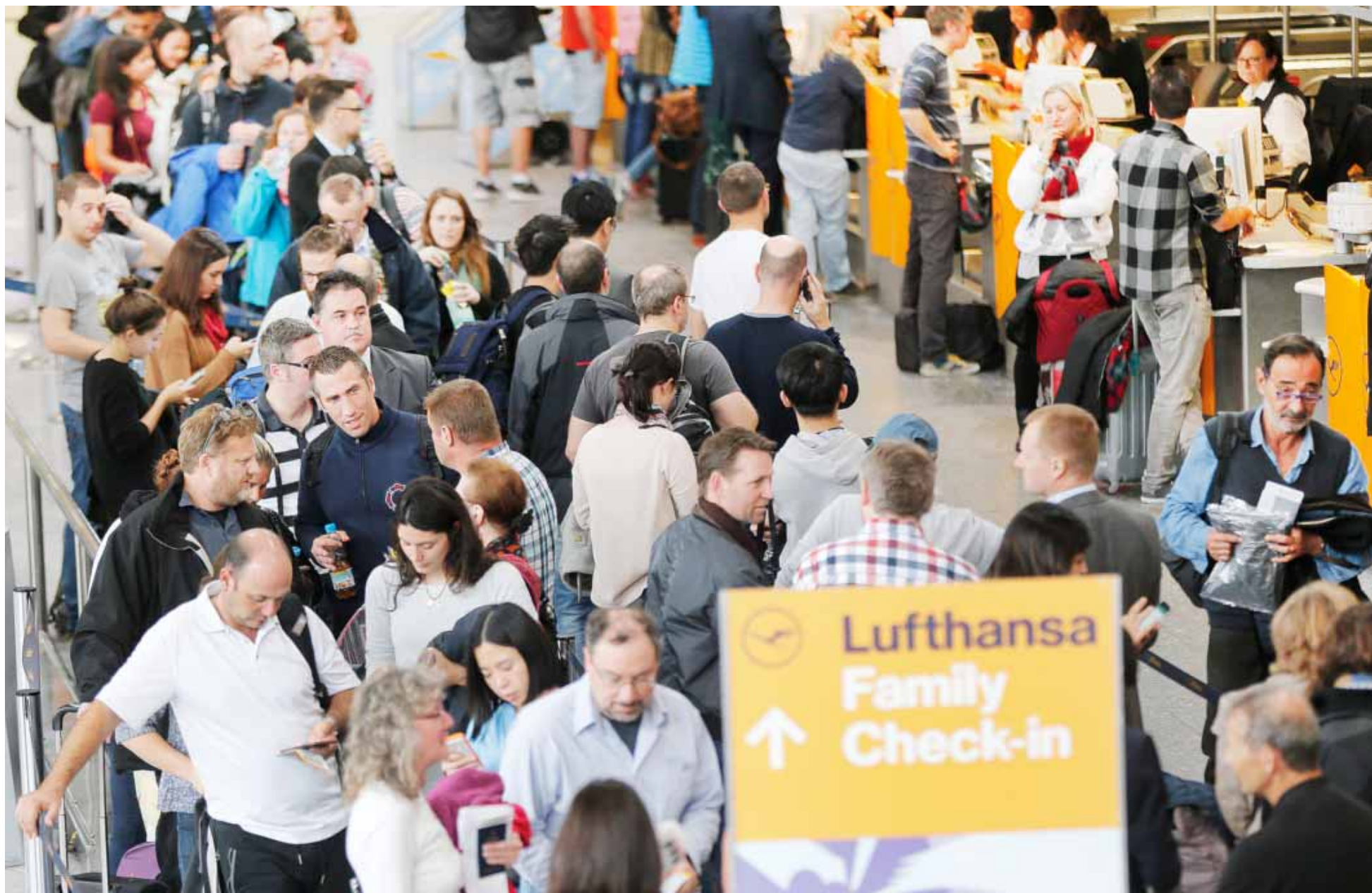
Passengers queue at Lufthansa counters at the airport in Frankfurt yesterday. Germany's flagship airline, Lufthansa, canceled 290 flights yesterday as cabin crew workers went on strike at Frankfurt and Duesseldorf airports. (See Page 19)