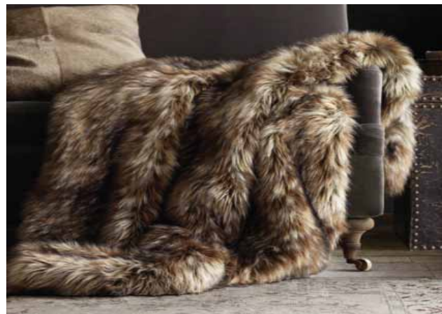
This photo shows oversized faux fur throws large enough to use on a bed, as well as exotic faux fur throws that mimic Siberian red and grey fox.