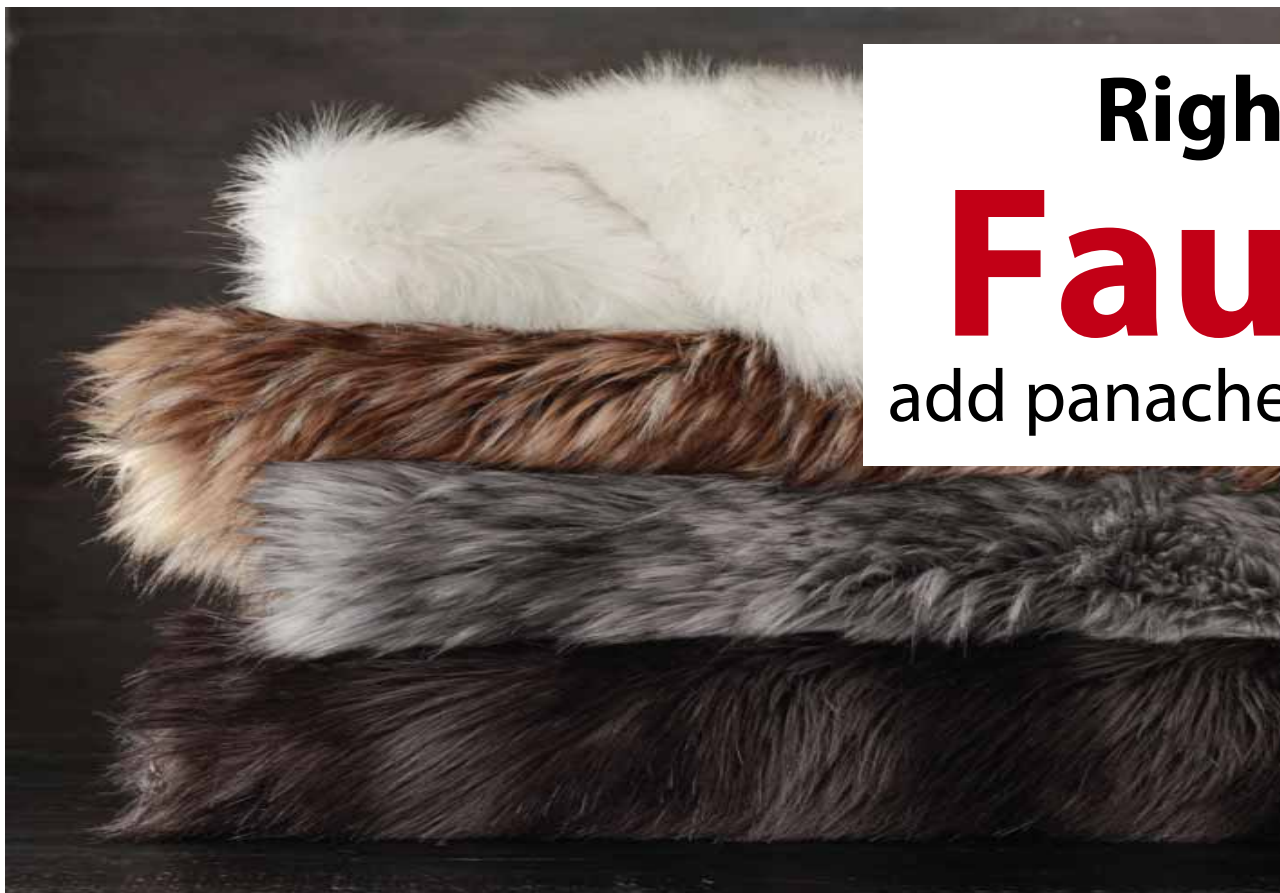
This photo provided by Restoration Hardware shows oversized faux fur throws large enough to use on a bed, as well as exotic faux fur throws that mimic Siberian red and grey fox.—AP photos