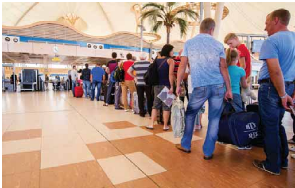
File photo shows passengers line up to depart from Sharm El-Sheikh Airport hours after a Russian aircraft carrying 224 people, including 17 children, crashed about 20 minutes after taking off from Sharm El-Sheikh, a Red Sea resort popular with Russian tourists, in south Sinai, Egypt.