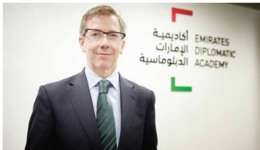
Bernardino Leon, the new Director General of the Emirates Diplomatic Academy.

As Director General, Leon will work with EDA's Board of Trustees to establish the strategic direction of the Academy as a glob-