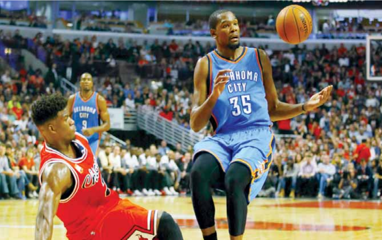
CHICAGO: Oklahoma City Thunder forward Kevin Durant, right, runs into Chicago Bulls guard Jimmy Butler, left, during the second half of an NBA basketball game in Chicago, on Thursday. The Bulls won the game 104-98.